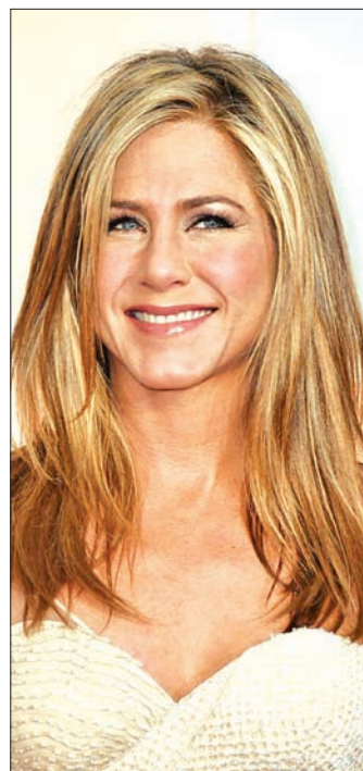
Jennifer Aniston.

LONDON — Jennifer Aniston is collaborating with Robert De Niro to make the movie veteran's longtime passion project a reality.