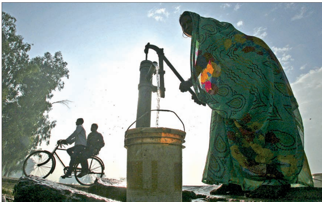
A woman uses a hand-pump to fill drinking water on the outskirts of Amritsar in the northern state of Punjab, India, on 15 November.

Prime Minister Narendra Modi has urged farmers to use water wisely, advocating a "per drop, more crop" approach that includes water-saving methods like drip