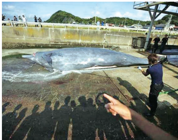
A worker sprays water on a Baird's Beaked whale before butchering it, as shadows of a crowd of grade school students and residents are cast on the ground, at Wada port in Minamiboso, southeast of Tokyo.

Japan has long maintained that most whale species are not endangered and that eating whale is part of its food culture.