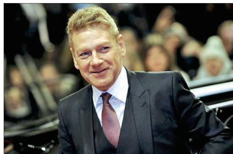
Director Kenneth Branagh arrives for the screening of the movie 'Cinderella' at the 65th Berlinale International Film Festival in Berlin, Germany.

The play, one of the Bard's later and less well-known works, tells the tale of King Leontes (Branagh) who manages to destroy his family as a result of insane jealousy only to be treated to perhaps undeserved redemption at the end.