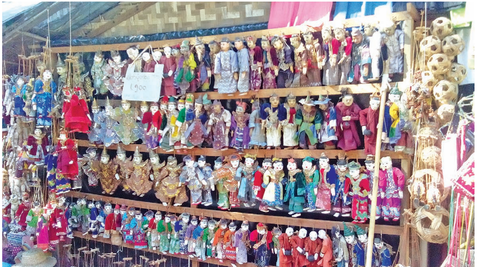
Decorative puppets are attracting tourists in Bagan.

Puppetry is the fundamental art symbol of Myanmar people and they are often used to decorate living rooms. — Kyaw Kyaw Hlaing (Mahlaing)