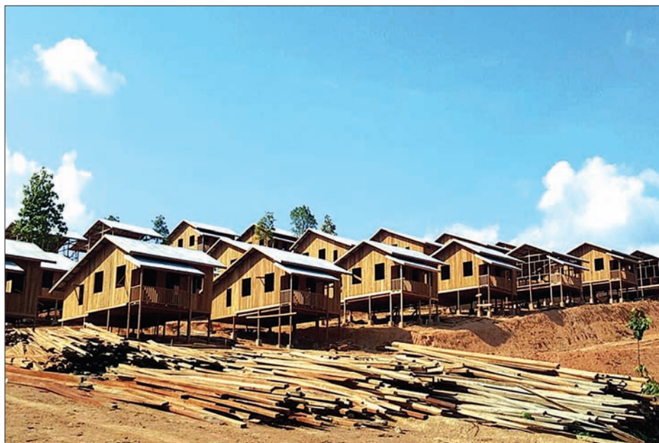
Several new homes are under construction in Hakha.