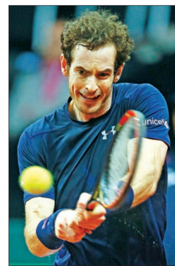
Great Britain's Andy Murray.

Defeat for Goffin would have left Belgium's dreams in tatters and the pressure seemed to freeze the 24-year-old as his game disintegrated in the face of Edmund's withering power. Edmund was in complete control for more than an hour and took the second set in 25 minutes on a Goffin double fault.