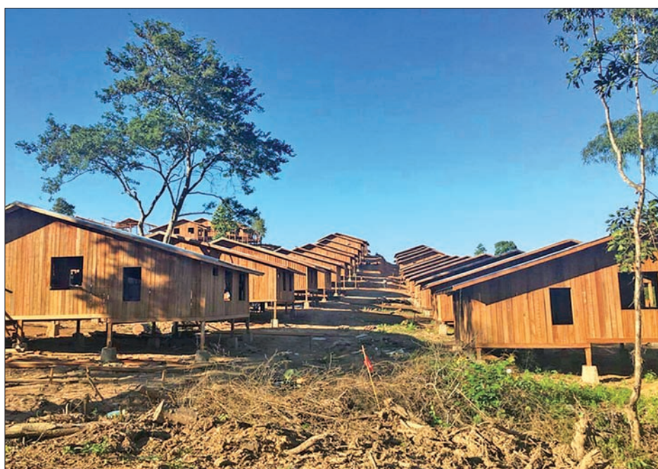
Several new homes are under construction in Hakha.