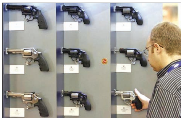
A visitor looks at a Smith & Wesson gun at MILIPOL International State Security Exhibition in Paris.

That morning, Interior Minister Bernard Cazeneuve announced a national plan to counter illegal guns, citing worsening gang violence and terrorism. "Terrorists are more easily getting the guns they need to carry out their planned attacks," he said.—Reuters