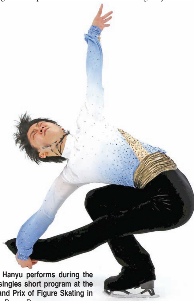
Yuzuru Hanyu performs during the men's singles short program at the ISU Grand Prix of Figure Skating in Nagano.

"My aim was to perform without making any mistakes.