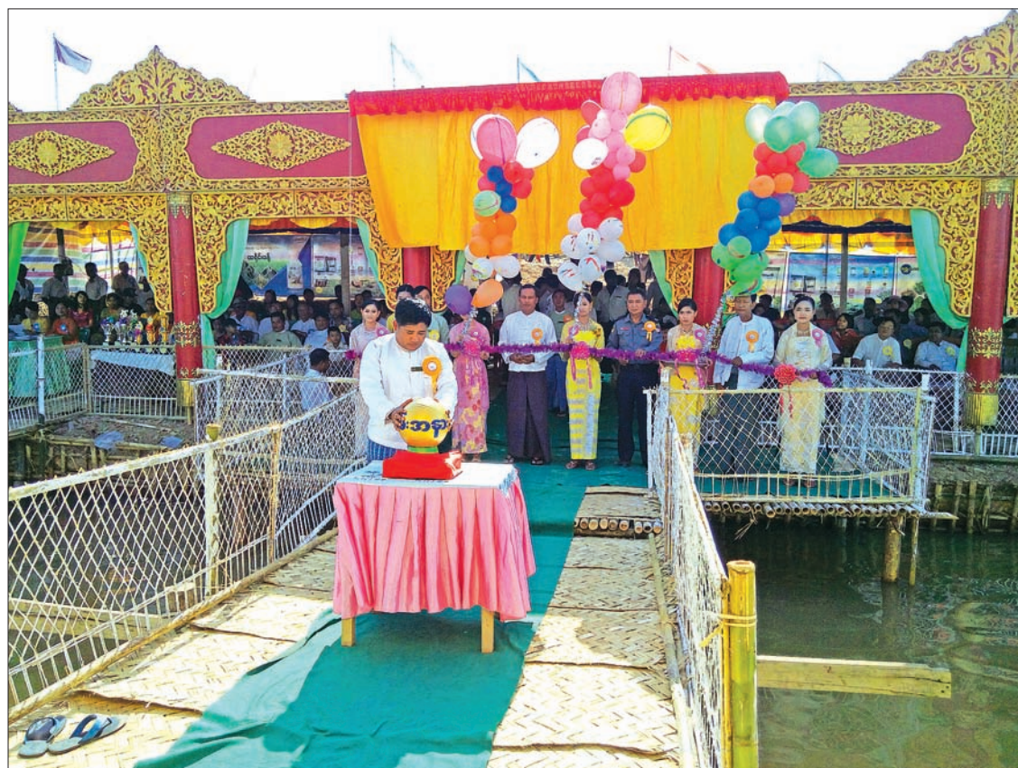
Officials formally open a ceremony to float 10,000 lamps in the Sittoung River.

A CEREMONY to set oil lamps adrift into the Sittoung River was held in Madauk town, Nyaunglebin Township, Bago Region, on Friday.