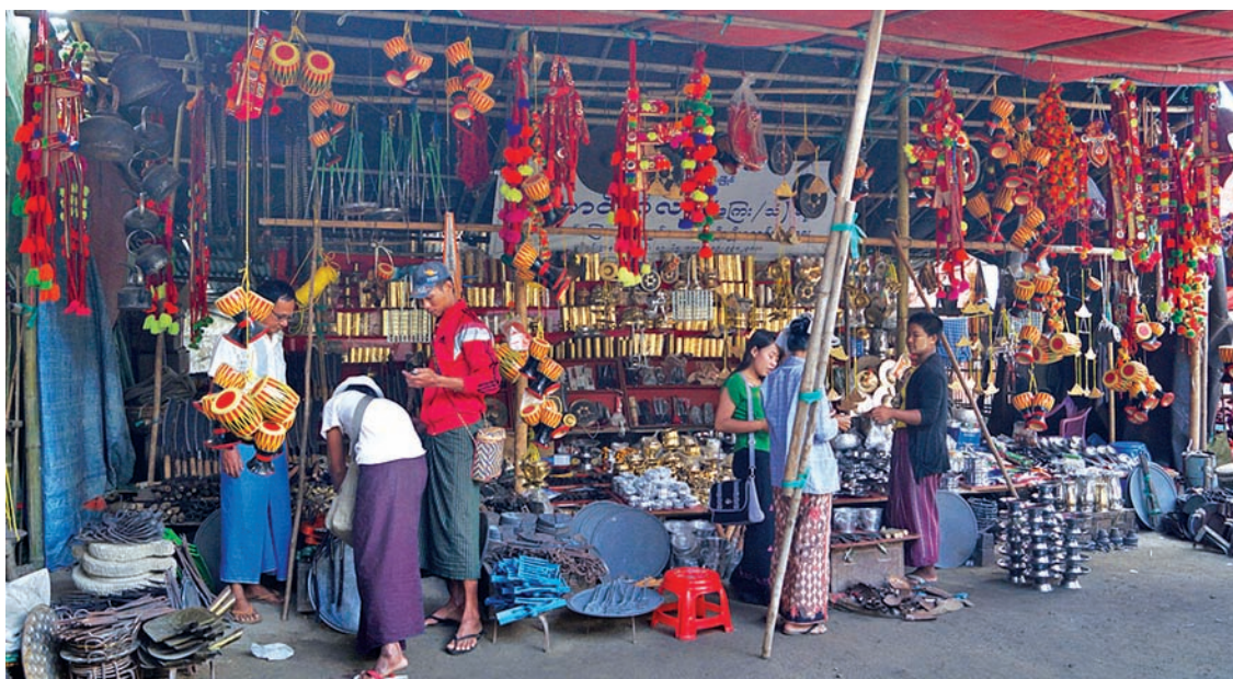
Local visitors purchase bronze utensils and iron farming tools from a shop.

Bronze scissors made in Magway Regio, daggers from TadaU Township, traditional musical instruments from Yamethin Township and household utensils from Mandalay sell best. — Tin Soe Lwin (Tatkon IPRD)