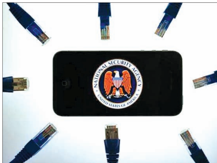
An illustration picture shows the logo of the US National Security Agency on the display of a phone in Berlin.

After that the NSA will purge all of its historic records once pending litigation is resolved.—Reuters