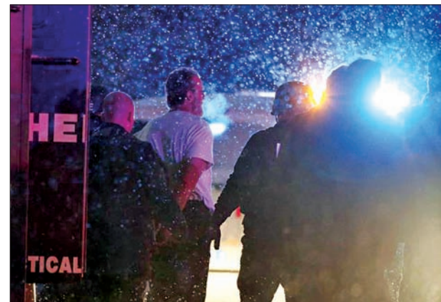
A suspect is taken into custody outside a Planned Parenthood center in Colorado Springs, Colorado.

a campus police officer for the University of Colorado at Colorado Springs who joined city police in responding to the first reports of shots fired, authorities said.