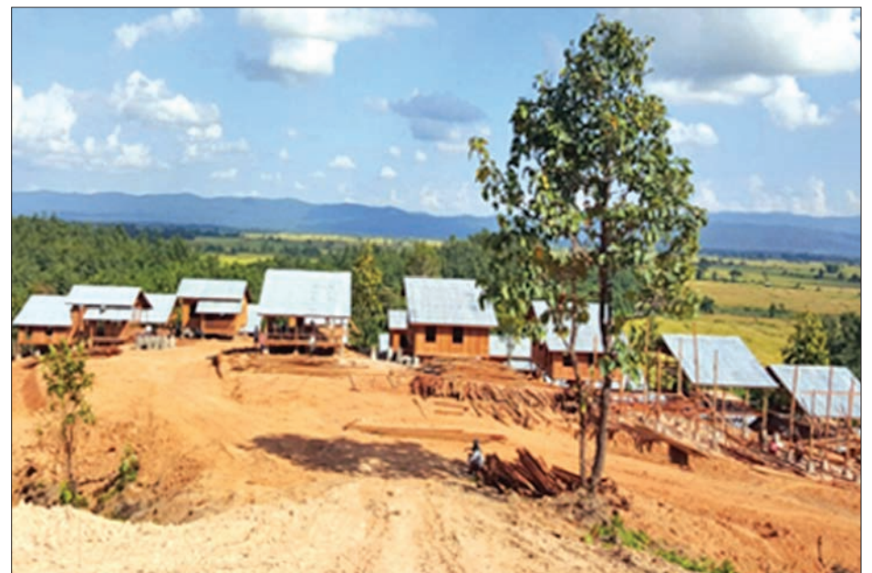
Several new homes are under construction in Tamu.