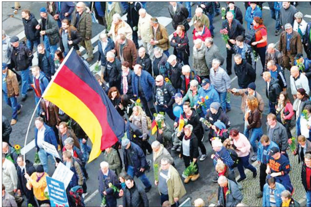
Supporters of the right-wing Alternative for Germany (AfD) demonstrate against the German government's new policy for migrants in Berlin, Germany, on 7 November 2015.

BERLIN — Europe's refugee crisis has resurrected Germany's AfD anti-immigrant party, which aims to enter three new state parliaments next year by luring conservative voters angry with Chancellor Angela Merkel's open-door asylum policy.