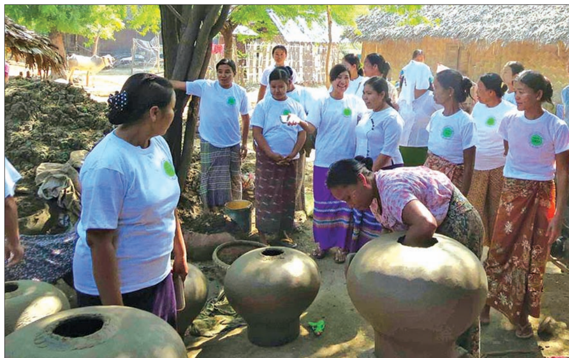
Local women in Sinkaing Township learn traditional clay pot making technique.

lages. Township RDD head Daw Khin Mar San said making clay pots as a profession for the villagers would be efficient as the raw materials are available, such as sand and specific mud, were abundant in the area.—(Tin Tin Htwe-Sinkaing )