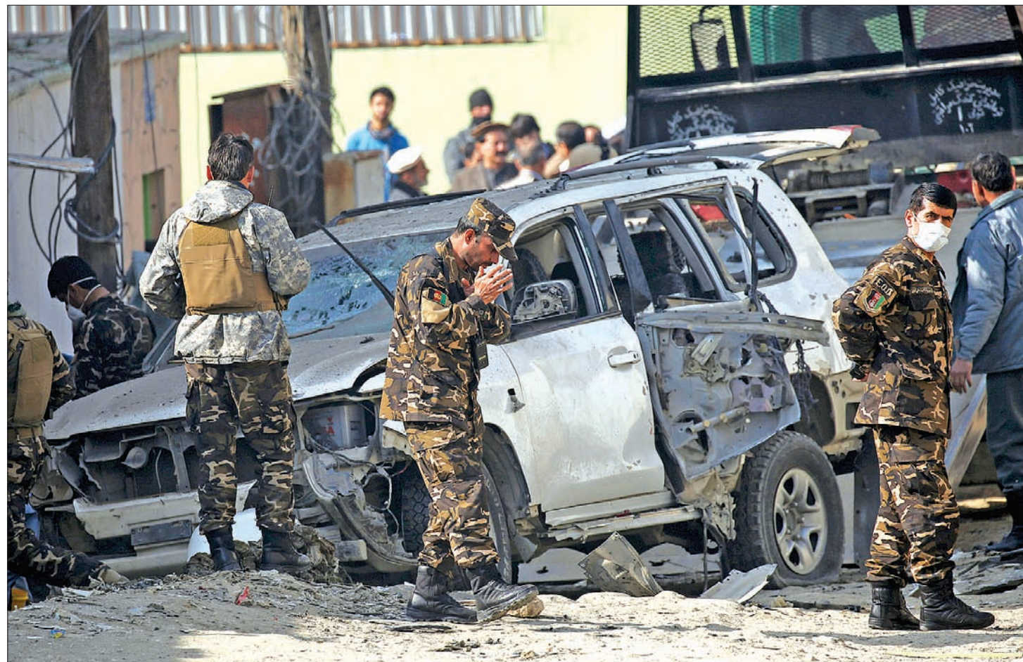
Afghan security personnel keep watch at the site of a suicide blast that targeted a senior member of Afghanistan's election commission in Kabul on 28 November.

KABUL — A suicide bomber targeted a senior member of Afghanistan's election commission during the morning rush hour in the capital Kabul yesterday, killing his driver and