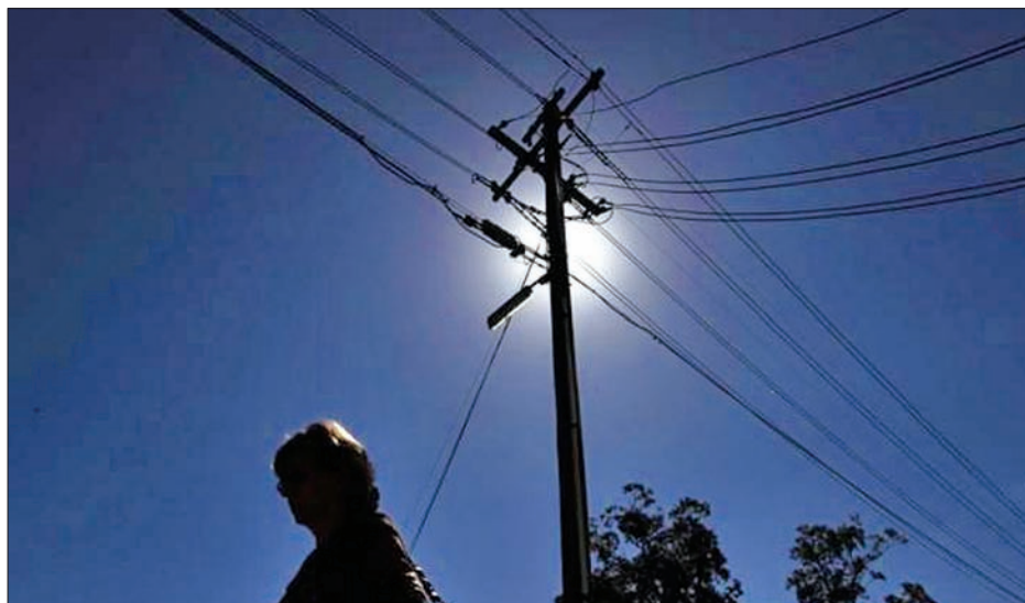
A pedestrian walks past power lines in east Sydney 12 October 2011.