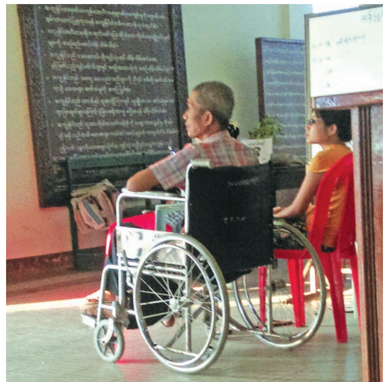
A stroke patient at Yangon's Traditional Medicine Hospital.

High blood pressure is the main risk factor for stroke. Doctors suggest people change their life styles and try and get a half hour daily dose of exercise.