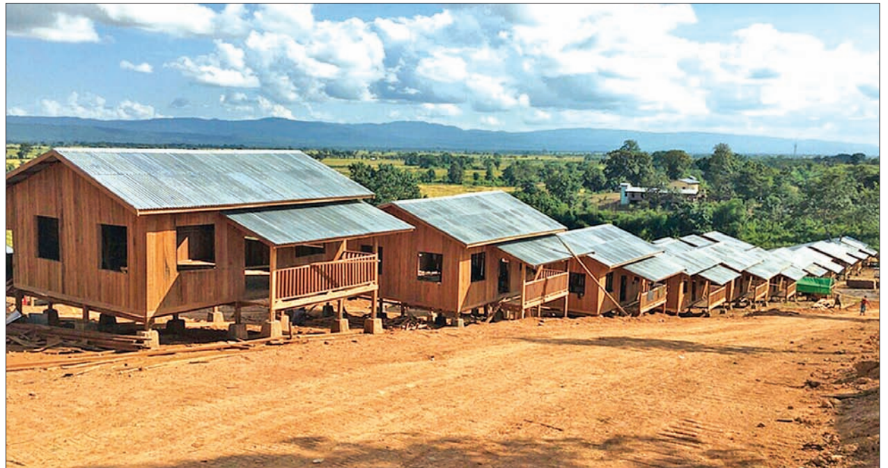
Several new homes are ready for those who lost their livelihoods during landslides in Hakha.