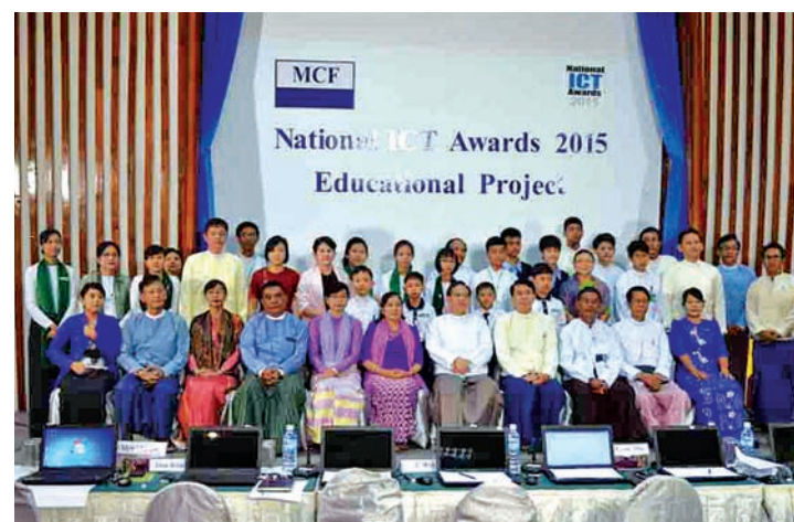
Myanmar Computer Federation (MCF) is making efforts for promoting the wider use of information and communication technology.

THE Myanmar Computer Federation (MCF) yesterday organised an education project competition for the National ICT Award 2015 at the Myanmar Information and Communication Technology Park in Yangon, aimed at promoting the wider use of ICT in the country's education sector.