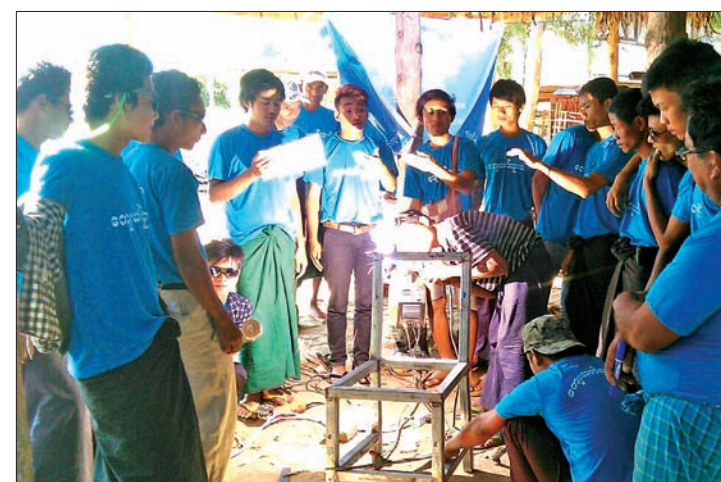
Young men receive welding skills in Otharathiri Township.