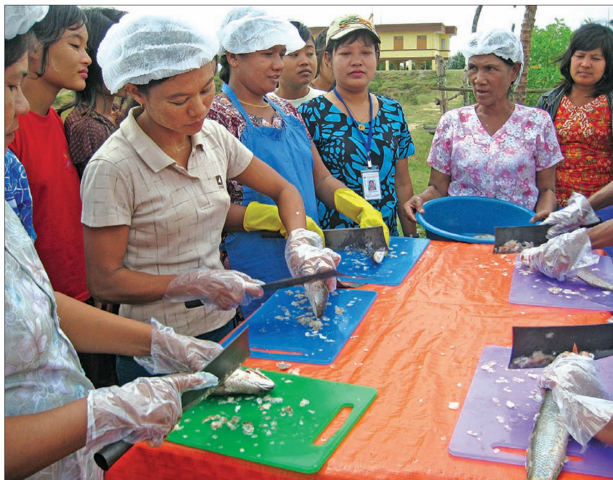
Post-harvest fisheries training.

The FAO fisheries project is a pilot and is expected to lead to a set of guidelines for fisheries