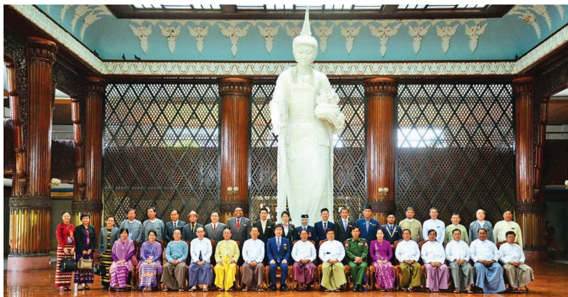
Youth leaders from Japan and ASEAN countries pose for documentary photo together with Yangon Region Government.