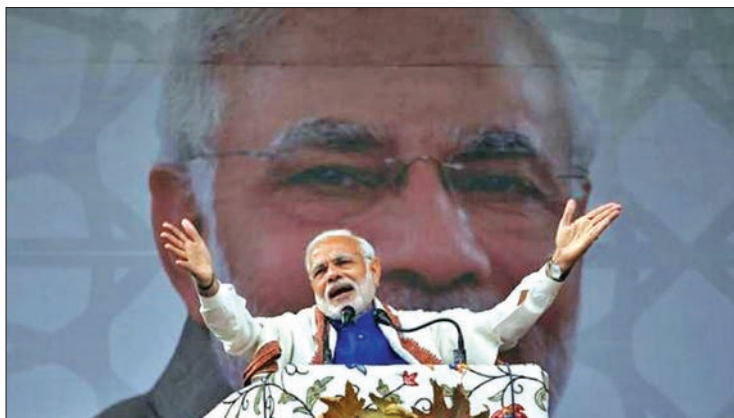
Prime Minister Narendra Modi.

Financial markets ticked higher on Friday as TV channels flashed news that Modi had for the first time reached out to Gan-