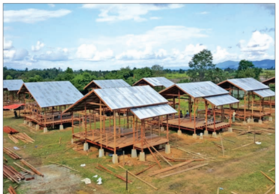
Several new homes are under construction in Tamu.