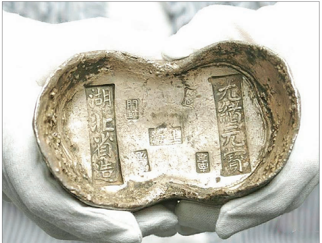
A staff holds an ancient provincial principal ingot during a press conference of the December 2015 Auction of Stack and Bowers on 25 November 2015. Stack's Bowers and Ponterio will hold Hong Kong Auction of Chinese and Asian coins and currency on 8 December through 15 December at the Mira Hong Kong.