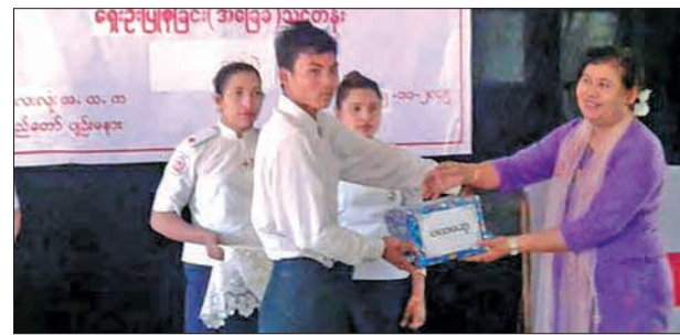
An official presents prize to outstanding trainee in first-aid course.

A FIRST-aid course, conducted by the Nay Pyi Taw Red Cross Supervisory Committee concluded at Thitlaylone Basic Education High School in Pinyinana Township on Wednesday.