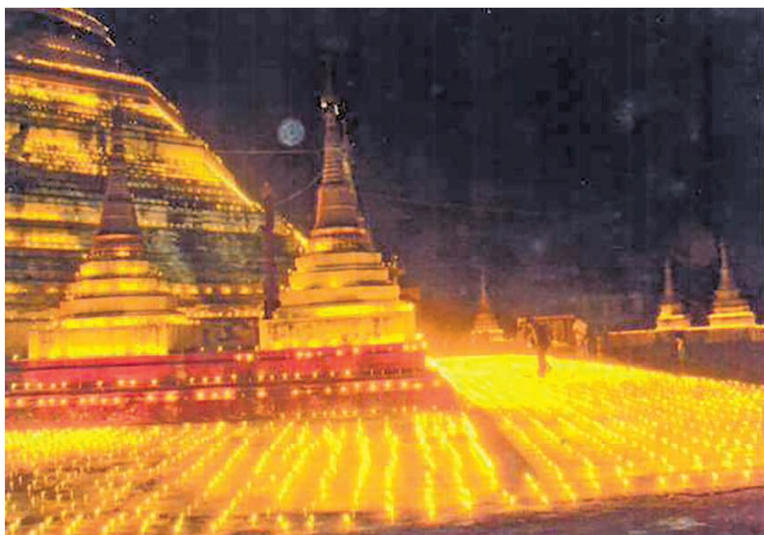
Yanaungmyin Pagoda which was called Sant Khaw Pheik Pagoda in the past was built two miles south of Mohnyin, Kachin State by King Mohnyin in early 12 Century. Local ethnics lit 10,000 candle lights on the platform of the pagoda for the fifth time on the fullmoon day of Tazaungmon, 26 November.