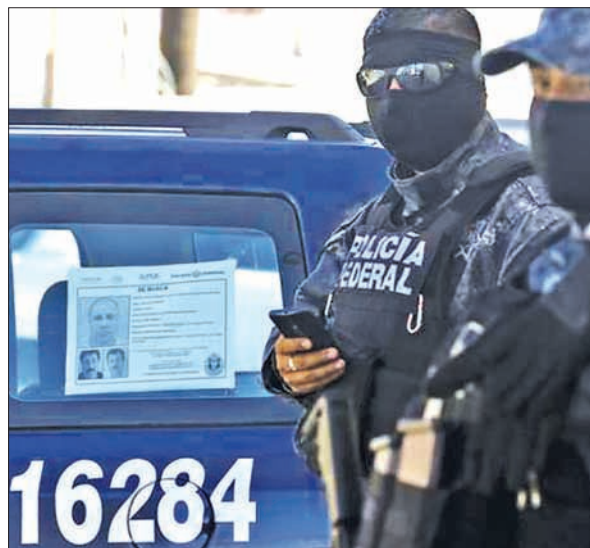
Federal police officers stand guard near a vehicle with a “Wanted” sign of fugitive kingpin Joaquin “El Chapo” Guzman.

The government said the trainee teachers were abducted by corrupt local police, then handed over to members of a violent drug gang who killed them and incinerated their remains.—Reuters