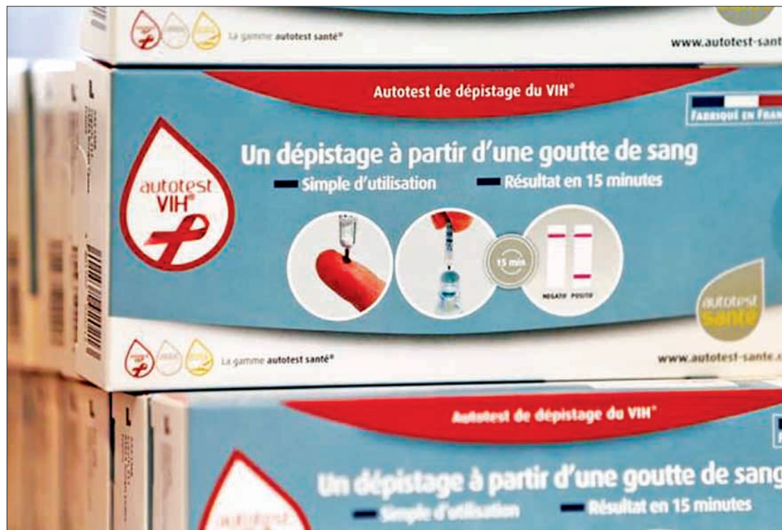
HIV self tests are displayed in a pharmacy in Bordeaux, France, on 15 September 2015.