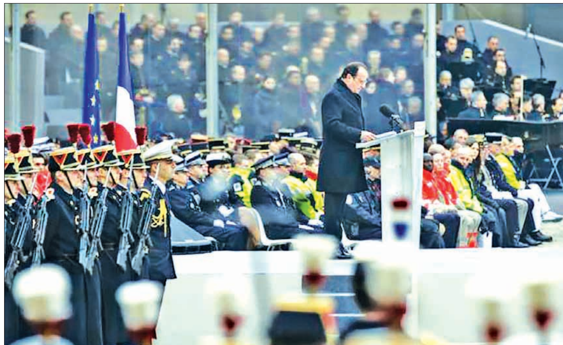
French President Francois Hollande delivers a speech during a ceremony to pay a national homage to the victims of the Paris attacks at Les Invalides monument in Paris, France on 27 November.

Hollande said the 13 November attacks were part of a chain stretching back to the 11 September 2001 attacks in the United States, and he noted that many other countries — including, this month alone, Mali and Tunisia — had been hit by militant groups.—Reuters