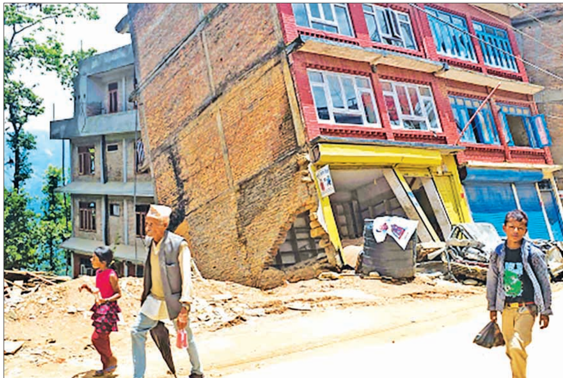
Residents walk past a building damaged during the earthquake in the city centre in Chautara, Nepal, on 8 July.