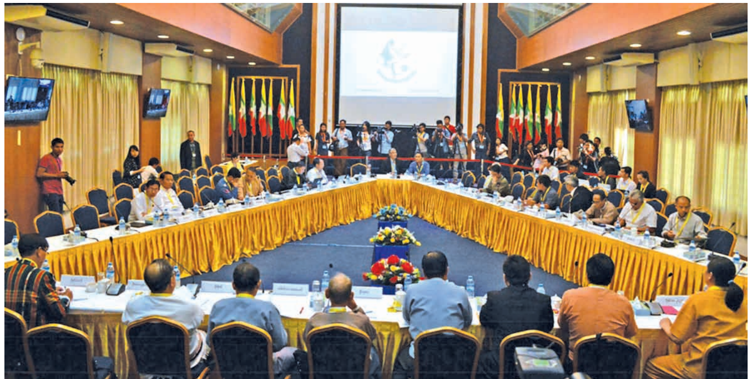
A committee comprising three groups of eight representatives from political parties, the government and ethnic ceasefire signatories held its first meeting to discuss the drafting of a framework for political dialogue at Myanmar Peace Centre yesterday.

The ethnic side proposed at the meeting that a drafting team should be formed with the membership of two each from three groups in order to complete the