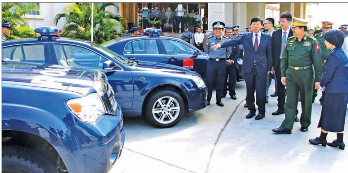
Union Minister Lt-Gen Ko Ko views police patrol cars donated by China.

During Chinese Premier Mr Li Keqiang's visit to Myanmar in 2014 he pledged to provide police patrol cars at a future date. So far China has donated over 245 pickups, 135 trucks, 120 saloon cars and five dump trucks, totaling 505 vehicles altogether worth 99 million yuan (US$ 15.483 million).— Myanmar News Agency