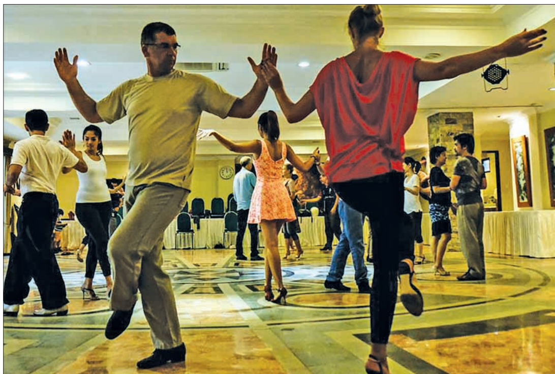
Couples practice the tango at a private lesson during the Tango in Paradise Festival 2015, at Denpasar in Bali, Indonesia, on 17 November 2015. Tango in Paradise Festival is a unique Tango festival that combines Tango with Indonesian traditional culture. This year, one of the traditional fabrics from Bali "Saput Poleng Bali" (a cloth with checkered pattern of black and white) will be the icon of the festival.