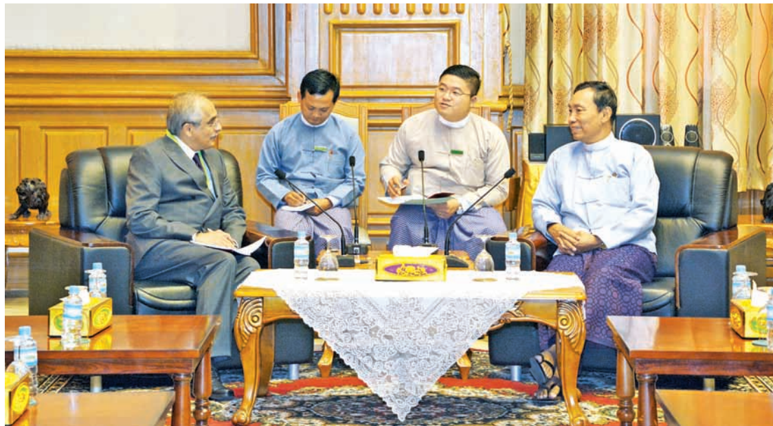
Speaker Thura U Shwe Mann holds talks with Special Adviser to UNSG on Myanmar Mr. Vijay Nambiar.

SPEAKER of the Pyithu Hluttaw Thura U Shwe Mann received Mr Vijay Nambiar, Special Adviser to the United Nations Secretary-General on Myanmar at the Pyithu Hluttaw hall in Nay Pyi Taw yesterday.