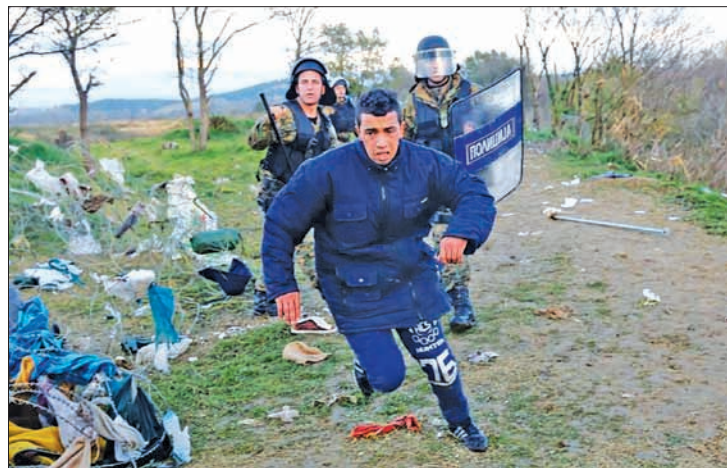
A migrant tries to escape from Macedonian police officers as he tries to cross the Greek-Macedonian border near the Greek village of Idomeni on 26 November.

IDOMENI — Hundreds of Moroccans, Algerians and Pakistanis tried to storm the border between Greece and Macedonia on Thursday, tearing down part of the barbed wire fence at the crossing and demanding to be allowed to carry on into northern Europe.