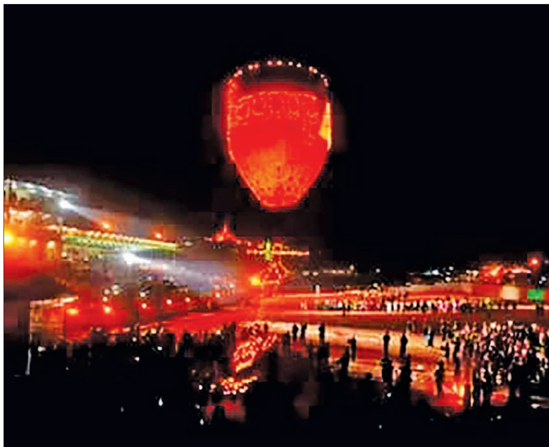
Local people enjoy releasing of hot-air balloons in Pyin Oo Lwin.

THE 11 th Tazaungdine hot-air balloon festival kicked off at Maha Arnthoo Kantha Pagoda in Pyin Oo Lwin on Monday