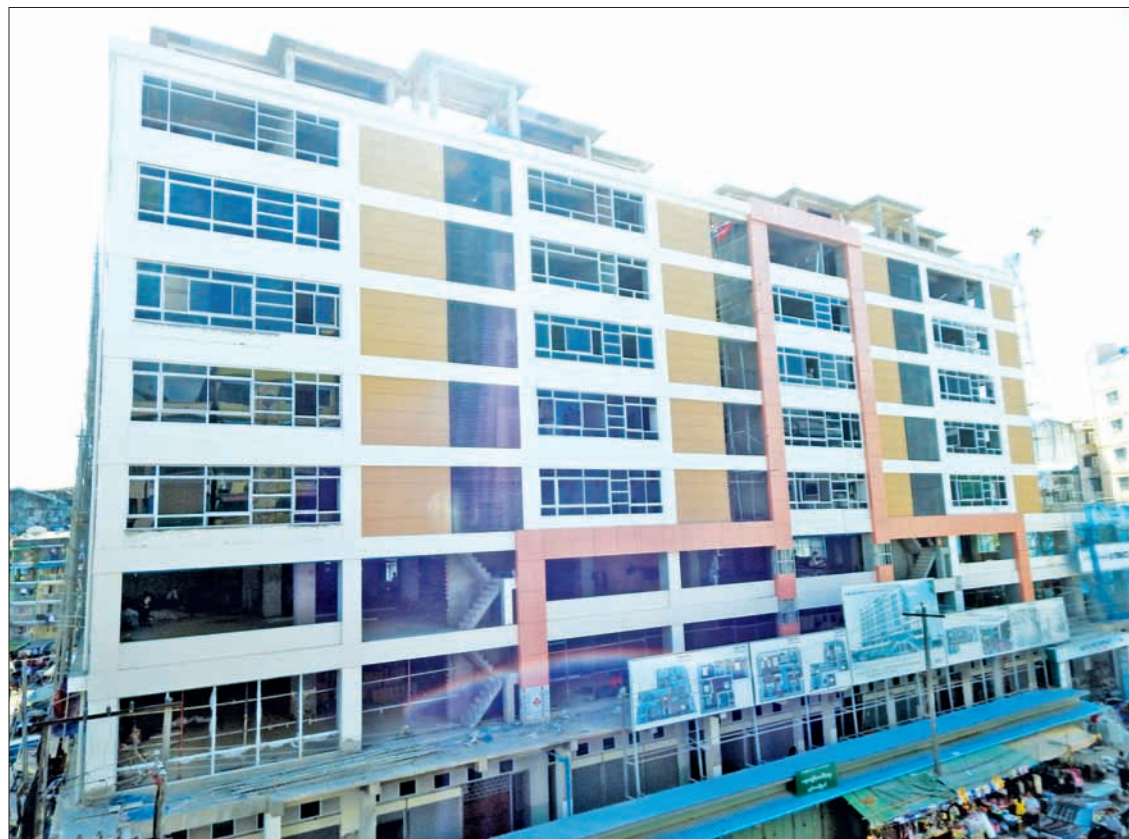
New Yekyaw market in Yekyaw Complex is almost completed in Pazundaung Township.

CONSTRUCTION of Yekyaw Market of the Modern Yekyaw Complex Project is almost completed, with shopkeeper expected to move in on 1 December at the site in Pazundaung Township.