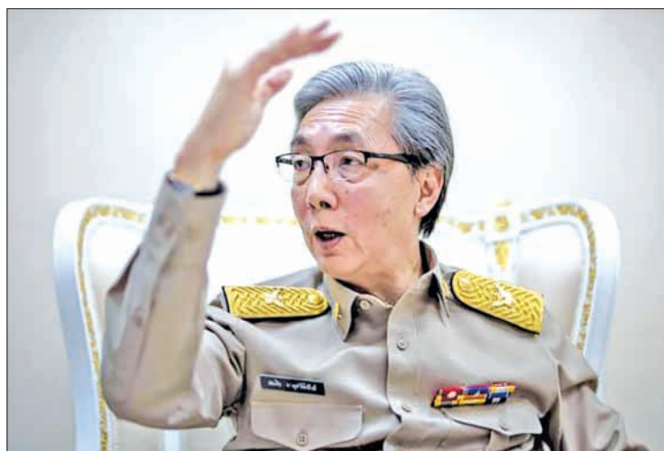
Thailand's Deputy Prime Minister Somkid Jatusripitak.

And next month Thailand faces crucial judgments by international bodies that could threaten seafood exports and shake confi-