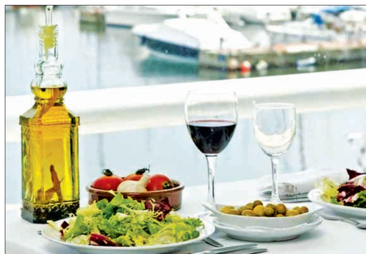
Food is seen on a table at a restaurant at the port of El Masnou, near Barcelona.