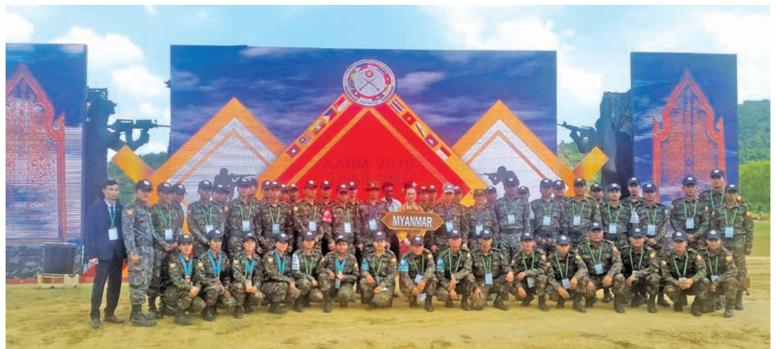
Vice-Senior General Soe Win together with ASEAN army chiefs pose for documentary photo at 25 th ASEAN Armies Rifle Meeting (AARM).

VICE-SENIOR General Soe Win, the Deputy Commander-in-Chief of Defence Services and Commander-in-Chief (Army), attended the final match between Indonesia's and Vietnam's shooting teams at the 25 th ASEAN Armies Rifle Meeting (AARM) in Hua Hin, Thailand,