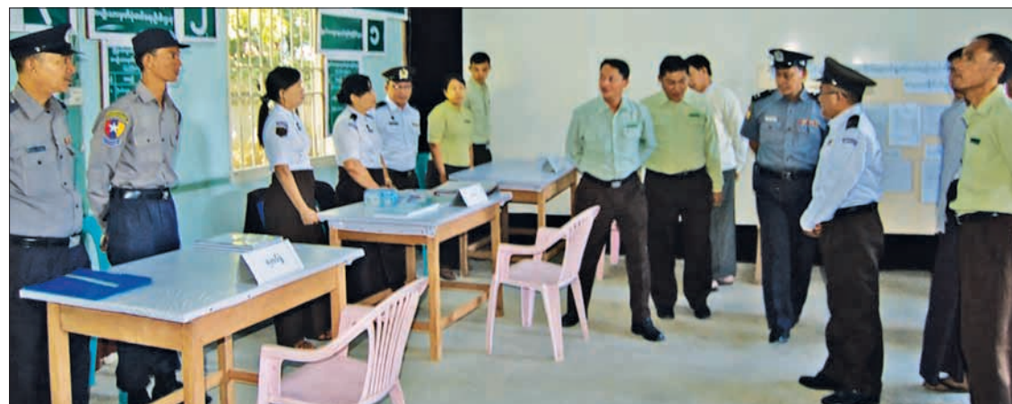
Officials inspect functions of departments at one-stop shop in Pyigyidagun Township.