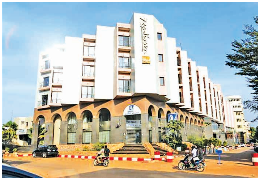
People drive motorcycles past the Radisson Blu hotel in Bamako, Mali.

The attack comes amid deteriorating security in the country just two years after a French-led military operation to scatter Islamist mili-