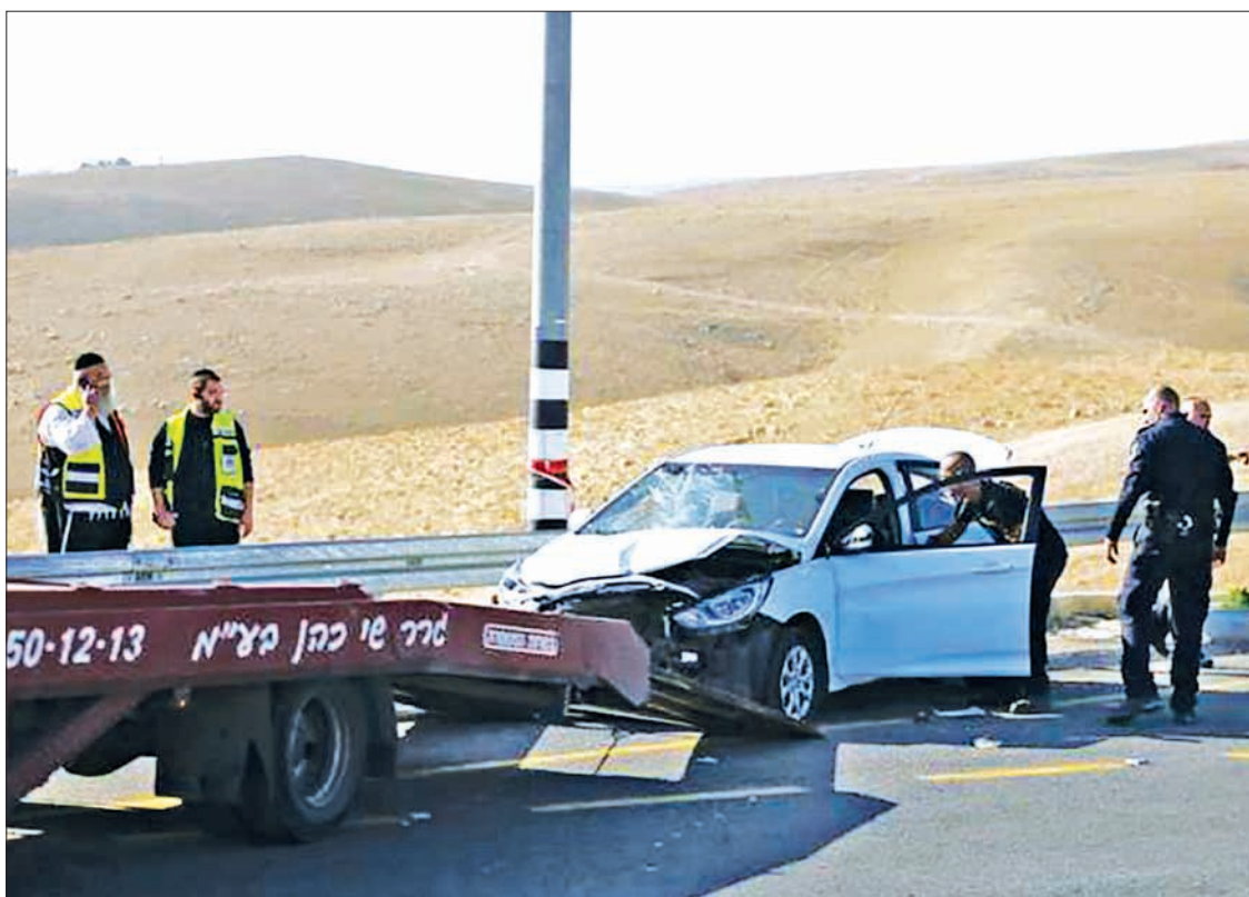
Israeli police tow the vehicle they said was used by a Palestinian to ram into two Israeli soldiers and wound them, near the Jewish settlement of Kfar Adumim in the occupied West Bank on 27 November.

The first Palestinian intifada lasted from 1987-1993 and the second from 2000-2005, although both were far more intense and deadly than the present wave of violence.—Reuters