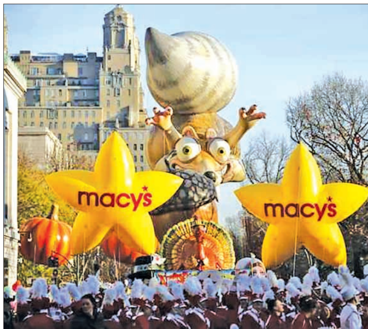
Floats gather on Central Park West prior to start of the 89 th Macy's Thanksgiving Day Parade in the Manhattan borough of New York on 26 November 2015.