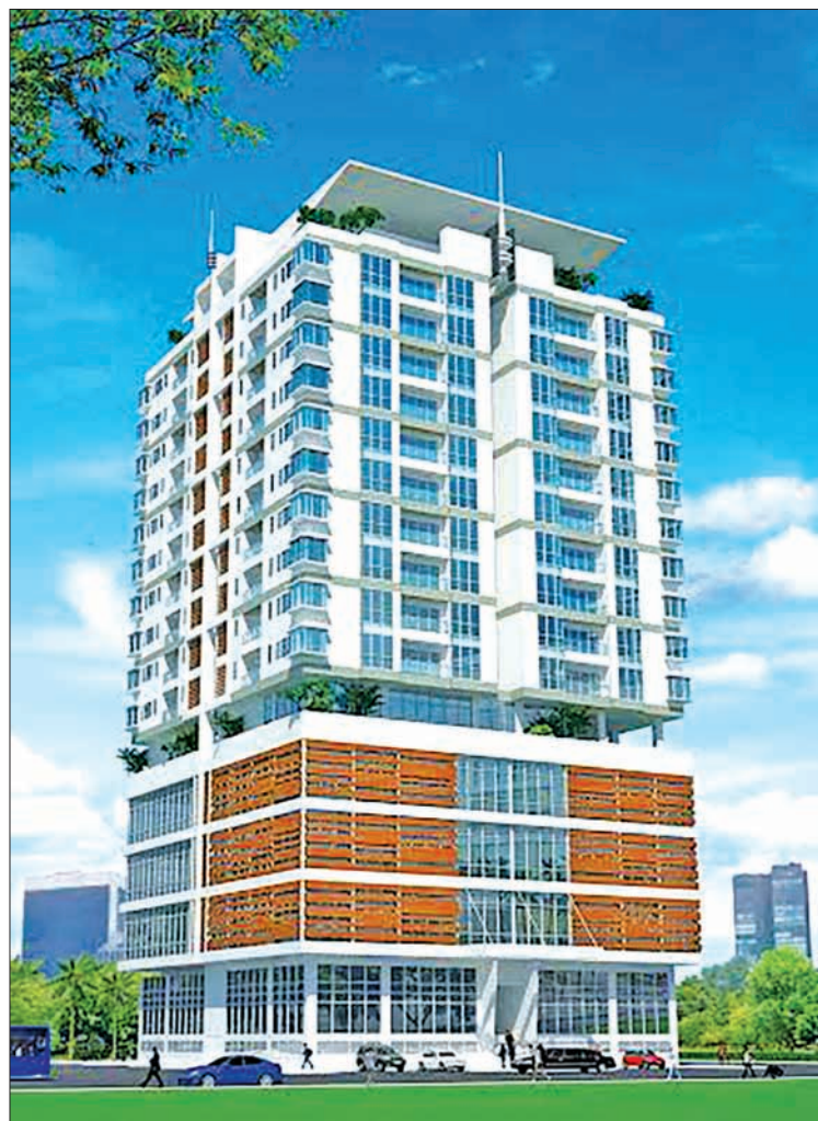
MERCHANT Luxury Condominium.