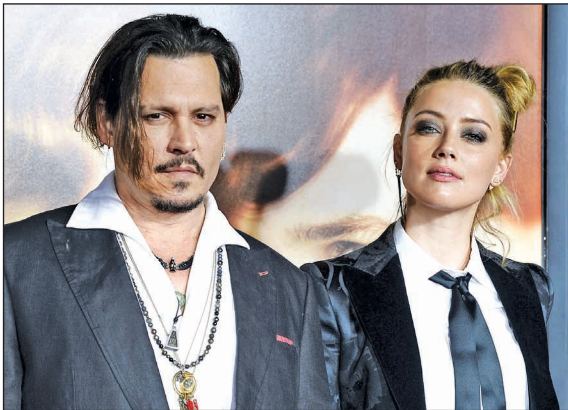
Actor Johnny Depp and his wife Amber Heard, who is a cast member of the film "The Danish Girl," pose during the premiere of the film in Los Angeles, California, on 21 November 2015.

NEW YORK — George Clooney, Johnny Depp and Zac Efron may be among the brightest stars in Hollywood, but in 2015 they also appeared in some of its biggest movie flops.