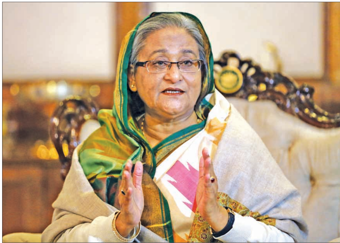
Bangladesh's Prime Minister Sheikh Hasina.

"Hasina's popularity has soared because of the overwhelming support of the people in favour of trials and execution of war criminals," said H.T. Imam, Hasina's political adviser. "The policy of the government is zero tolerance against terrorism or vi-