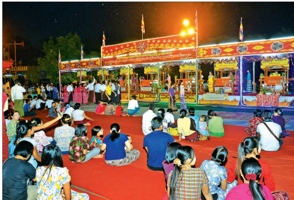
Local people attend Mathoe robe weaving contest with participation of religious associations at Kaba Aye Pagoda on 25 November.

The 31 st Mathoe robe weaving contest took place at Shwedagon Pagoda in Yangon yesterday, with participation of nine religious associations.