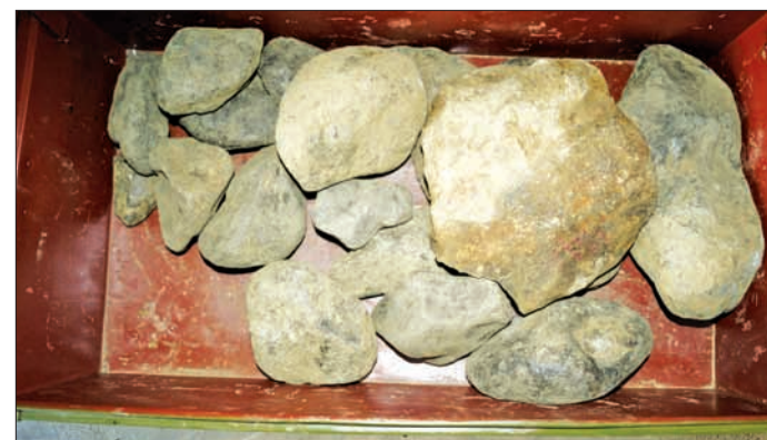
Photo shows confiscated jade stones from Muse toll gate. PHOTO: L SOE

Muse is a busy border trade town near Myanmar's border with Yunnan Province, China. — L Soe