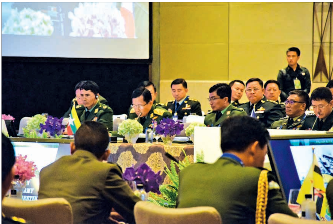
Vice-Senior General Soe Win attends 16 th ASEAN Chiefs of Army Multilateral Meeting (ACAMM-16).

The Philippines will host the 17 th ASEAN Chiefs of Army Multilateral Meeting (ACAMM-17) and 26 th ASEAN Armies Rifle Meet (26 th AARM) in 2016.— Myawady