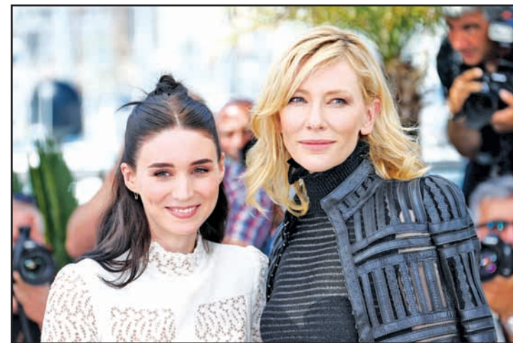
Rooney Mara and Cate Blanchett.

"Beasts of No Nation," Netflix Inc's first original film production, also landed nominations for best cinematography, best male lead for newcomer Abraham Attah and best supporting male for Idris Elba.—Reuters