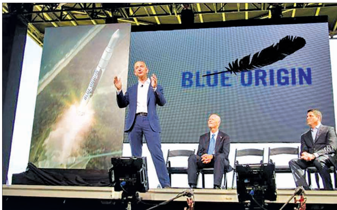
Amazon and Blue Origin founder Jeff Bezos (L) announces plans to build a rocket manufacturing plant and launch site at Cape Canaveral Air Force Station, Florida on 15 September 2015.

CAPE CANAVERAL — Amazon founder Jeff Bezos said on Tuesday his space transportation company, Blue Origin, plans about two more years of test flights before it will offer rides to passengers.