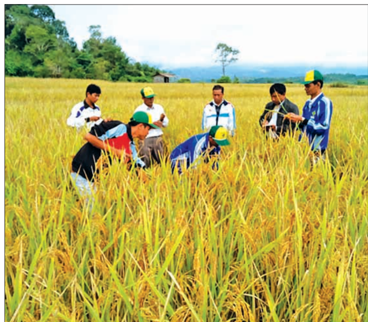
Staff of Agriculture Department measure model plot of monsoon paddy in Monglon, Shan State.

MONSOON paddy model plot No 1 in Monglon town, Shan State was harvested on Sunday. The harvesting was observed by local officials of the Agricultural Land Management and Statistics Department, the Agriculture Department, township authorities and local farmers.