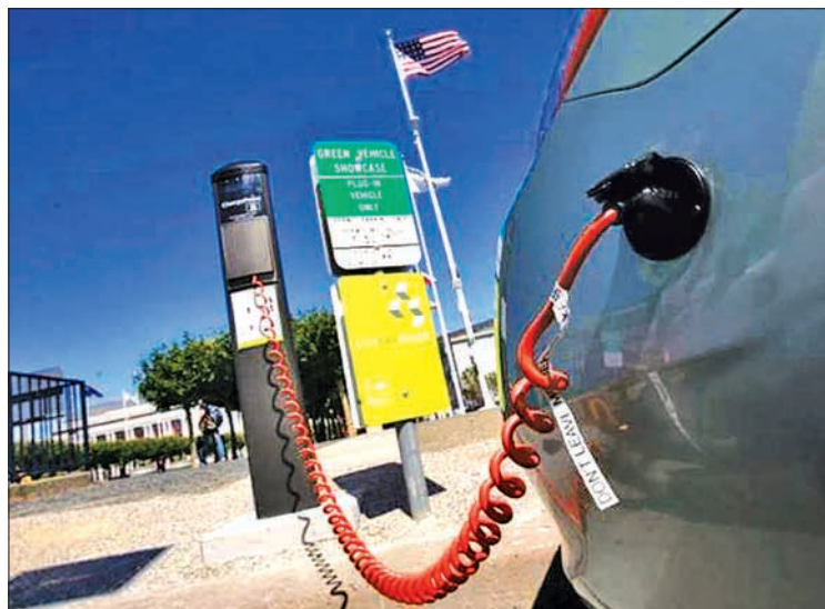
A hybrid Toyota Prius is electrically charged at a municipal charging station near City Hall in San Francisco, California.

force automakers like Tesla Motors Inc, General Motors Co, Ford Motor Co and Toyota Motor Corp to add automatic audio alerts to electric and hybrid vehicles traveling at 18 miles per hour or less.