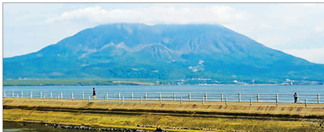
Sakurajima volcano in southwestern Japan.

FUKUOKA — Japan's weather agency on Wednesday downgraded its warning level for Mt. Sakurajima in southwestern Japan, citing diminished volcanic activity.