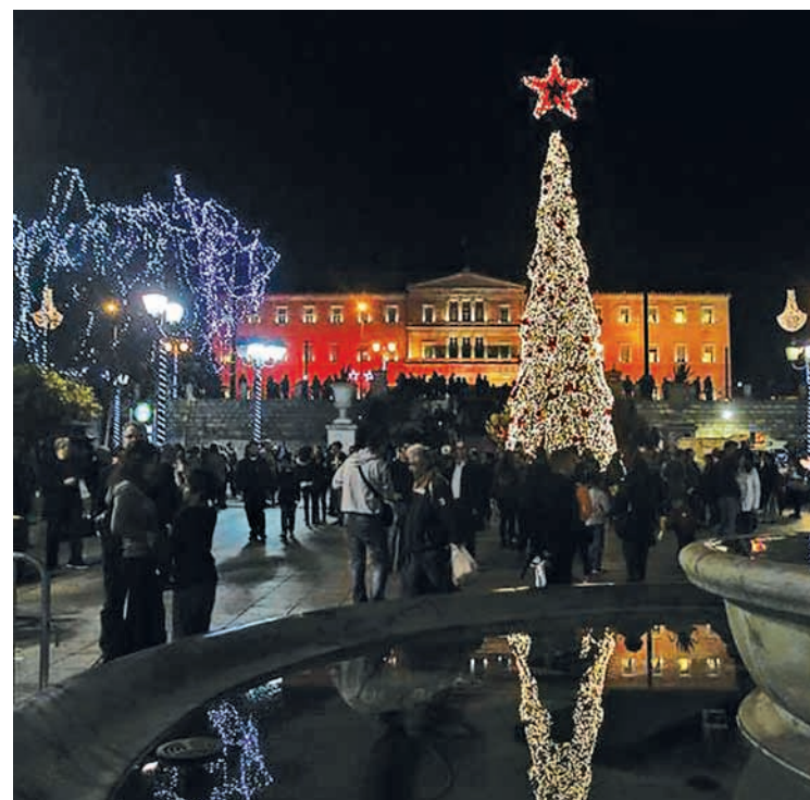
A luminous Christmas tree at the Syntagma Square official Christmas opening ceremony in Athens, Greece.

Though the official illumination of Athens city center was originally scheduled for 19 November, it was postponed due to a protest held by Greece's largest civil service umbrella union ADEDY. Amid the implementation of new austerity measures and a bleak economic outlook, Christmas spending will be reduced for Greek households, which have endured six years of economic depression, job losses, wage and pension cuts.—Xinhua