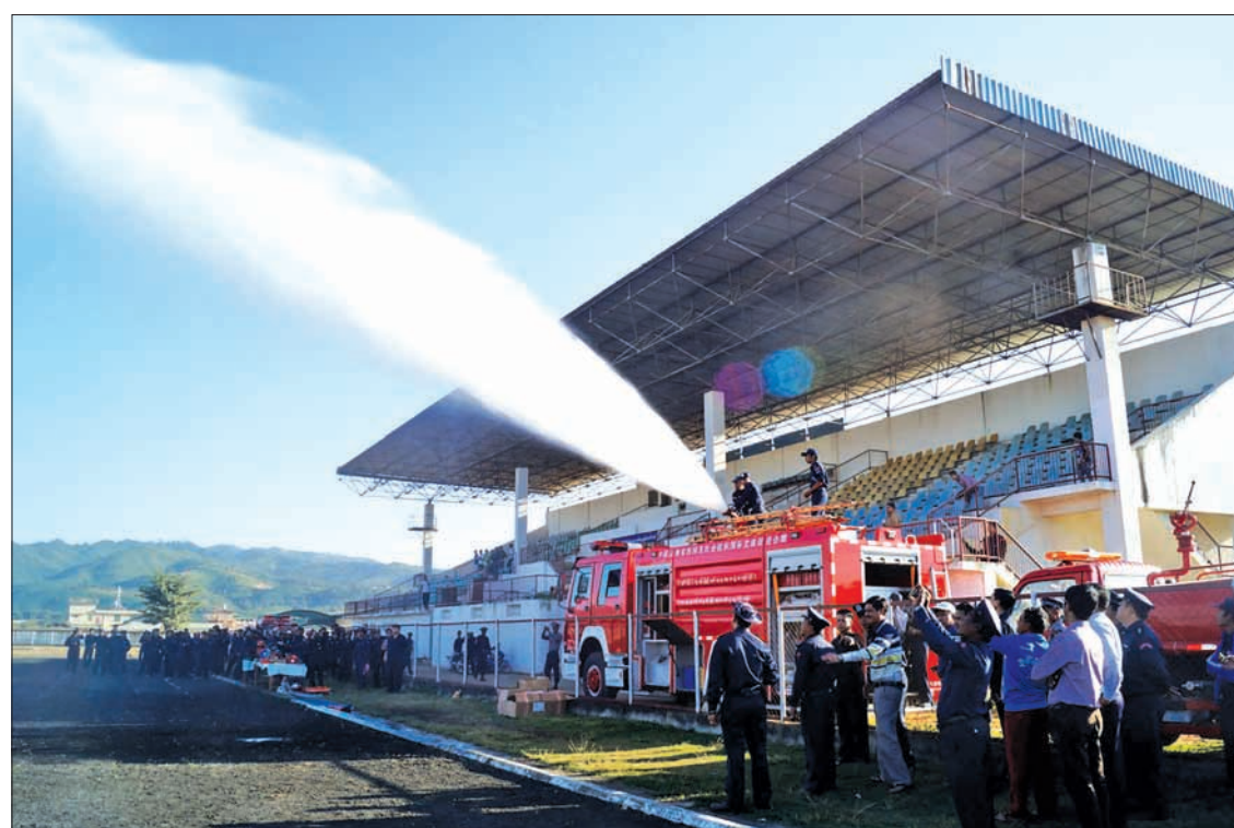
Firefighters demonstrate skills at refresher course in Muse.