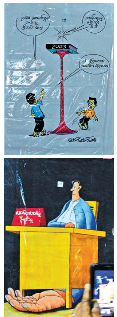
Enthusiasts enjoying excellent works of cartoonists at U Ba Gyan cartoon exhibition on 13 th street in Lanmadaw Township.