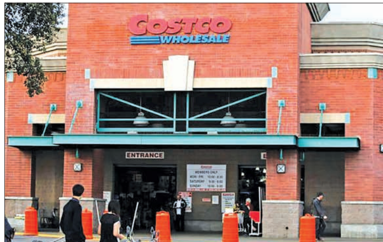
Shoppers are pictured outside a Costco Wholesale store in Los Angeles, California 6 March, 2013.

LOS ANGELES — At least 19 people in seven states may have been infected by E. coli after eating rotisserie chicken salad sold at Costco Wholesale Corp's (COST.O) stores, the US Centres