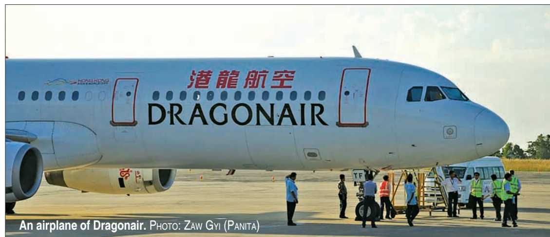
An airplane of Dragonair.

Repairs to the damage caused by the bird are underway at Yangon Airport. The status of the bird that collided with the aircraft could not be confirmed.— Zawgyi (Panita)