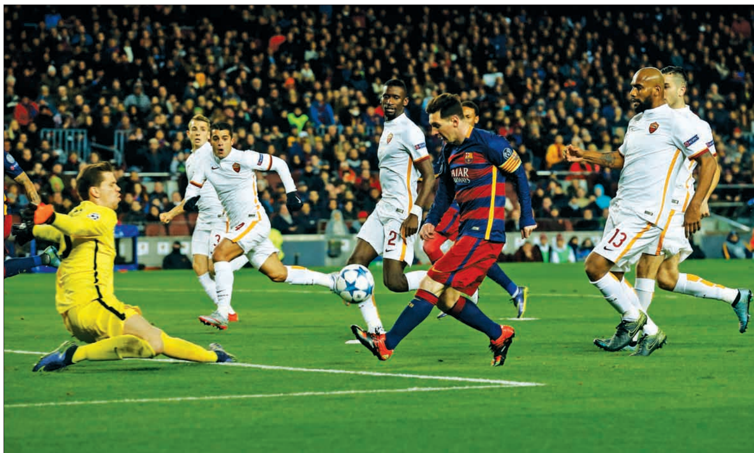
Barcelona's Lionel Messi scores the second goal against AS Roma during their UEFA Champions League Group Stage Group E at Camp Nou, Barcelona, Spain, on 24 November 2015.

second-placed Atletico Madrid in Spain's top flight after 12 matches, with Real a further two points back in third, and will be the overwhelming favourite at next month's Club World Cup in Japan.