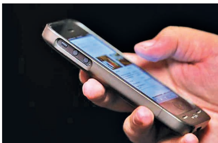
A man uses a smartphone in New York City.

Officials said it was too early to identify contributing factors. But Rosekind told reporters that officials are looking at likely