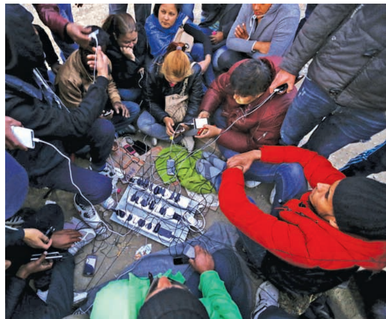
Stranded migrants charge their phones on a field with electricity provided by a generator at the Greek-Macedonian border near the Greek village of Idomeni on 24 November 2015.

BERLIN — European countries are stretched to their limits in the refugee crisis and cannot take in any more new arrivals, French Prime Minister Manuel Valls was quoted as saying in a German newspaper yesterday.