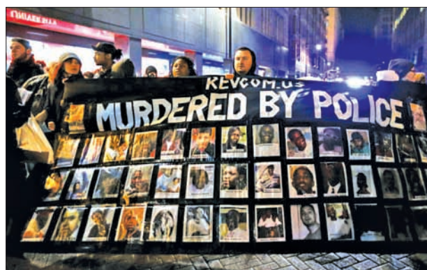
Demonstrators block the street during protests in Chicago on 24 November, 2015. PHOTO: REUTERS

Demonstrators had assembled outside a police precinct by 9 pm CST (0300 GMT), demanding the release of the two people arrested. Protesters later surrounded a police vehicle in a brief standoff. The crowd began to wane as the night wore on, and the late-autumn air grew colder, although a core group of at least 200 continued to march from block to block in what were essentially large circles enclosed by police lines. Some protesters briefly blocked an expressway entrance ramp. —Reuters