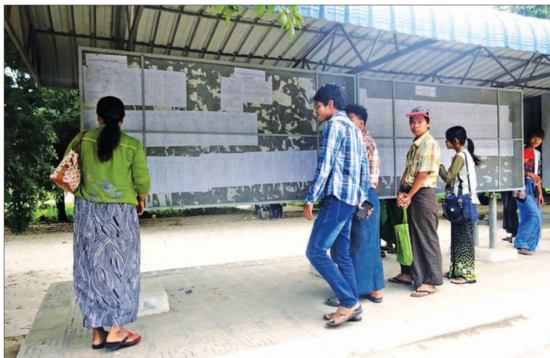
Students searching their names at examination results of Yadanabon University.

Yadanabon University has announced that first-year students can enrol from 3 December until no later than 30 December, as they must attain 75 percent attendance to be able to sit for the final examination.— Thiha Ko Ko