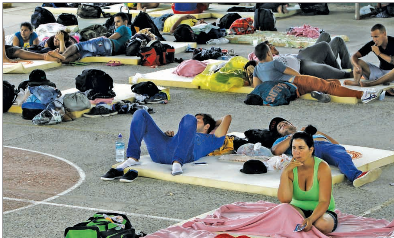
Cuban migrants rest at a temporary shelter in a school in the town of La Cruz near the border between Costa Rica and Nicaragua on 16 November.

"Nicaragua demands that the government of Costa Rica ... remove all migrants from our border areas," said Nicaraguan first lady and government