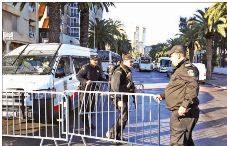
Tunisian policemen stand near a damaged presidential guard bus at the scene of a suicide bomb attack in Tunis, Tunisia, on 25 November.

India accuses Pakistan of training and arming such rebels, and infiltrating them into the part of Muslim-majority Kashmir that it controls, a claim its neighbour denies.—Reuters