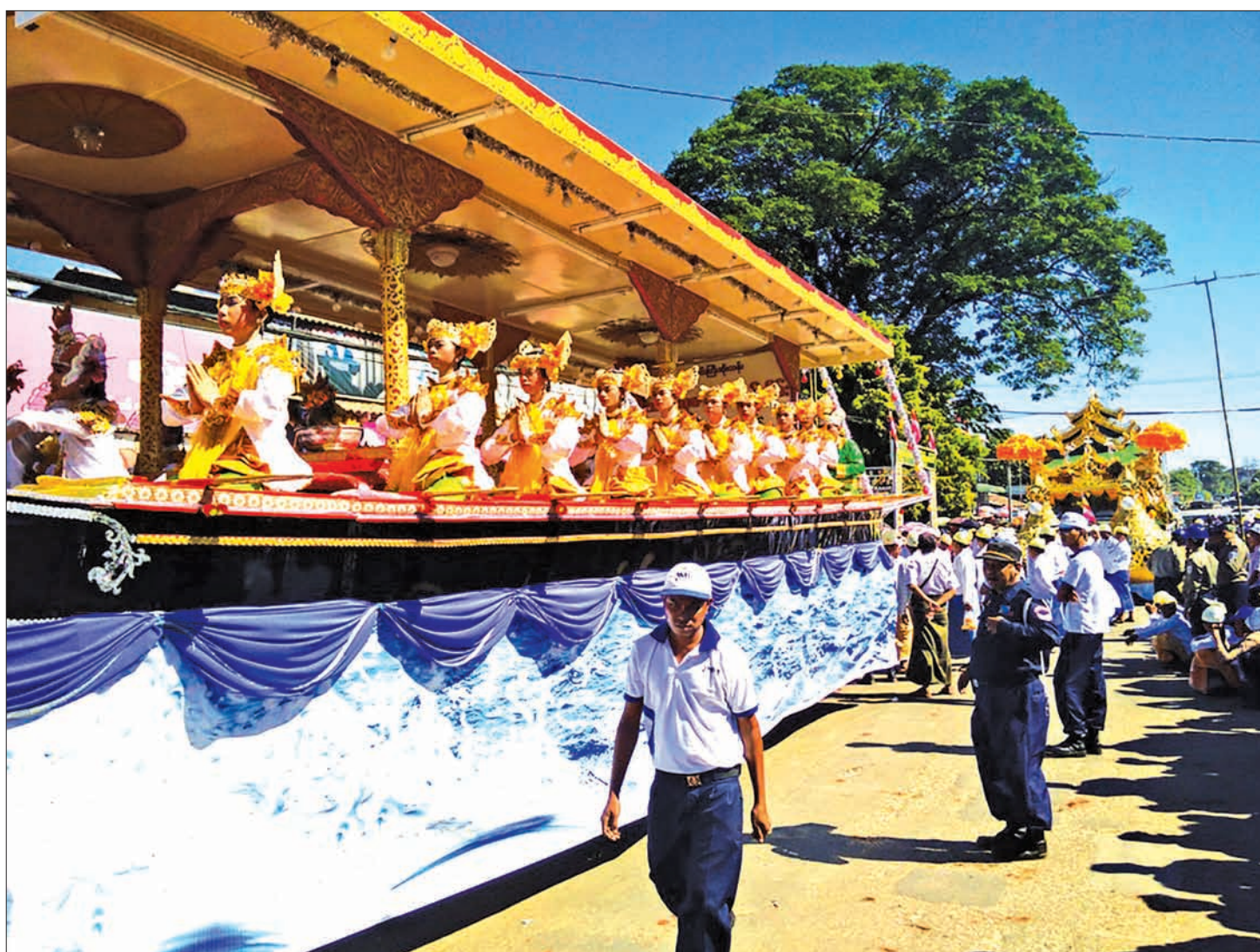
Chorus dance troupes performing dances for paying homage to a sacred tooth relic of Lord Buddha which was being conveyed for public obeisance by members of the Shwehsandaw Pagoda Board of Trustees around Pyay, Bago Region, on 24 November.

The small books are intended to offer short reading opportunities to students studying midwifery and nursing.