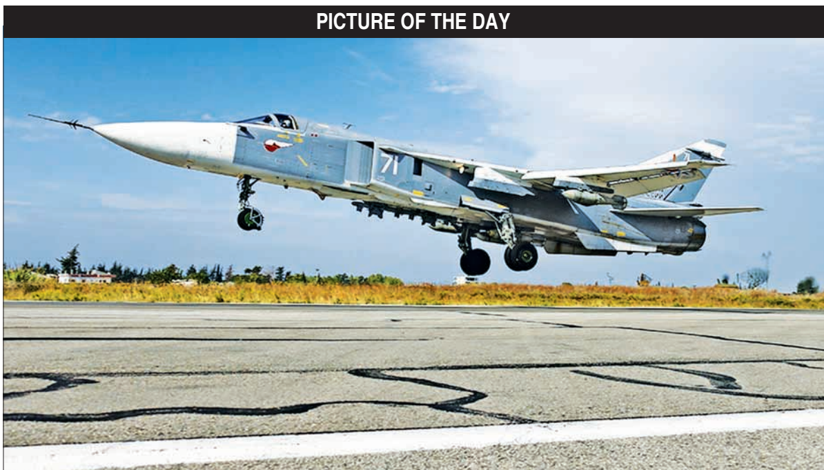
PICTURE OF THE DAY A Sukhoi Su-24 fighter jet takes off from the Hmeymim air base near Latakia, Syria, in this file handout photograph released by Russia's Defence Ministry on 22 October, 2015.

The shrine is a source of diplomatic friction between Japan and China and South Korea. The two countries see it as a symbol of Japan's past militarism as it honors convicted war criminals along with millions of war dead.—Kyodo News