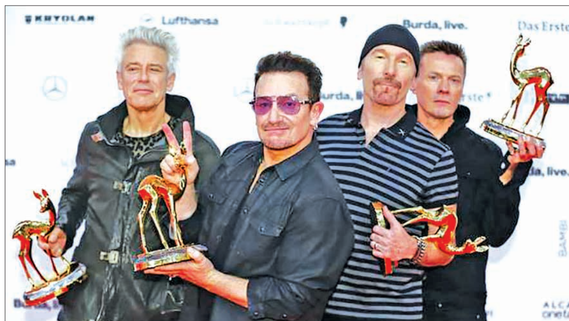
Adam Clayton, Bono, the Edge and Larry Mullen (L-R) of the band U2 pose with their Music International trophies during the Bambi 2014 media awards ceremony in Berlin.

LONDON — Irish rock band U2 set early December dates for concerts in Paris on Monday, after cancelling two earlier performances following the attacks by Islamic State militants that took 130 lives.