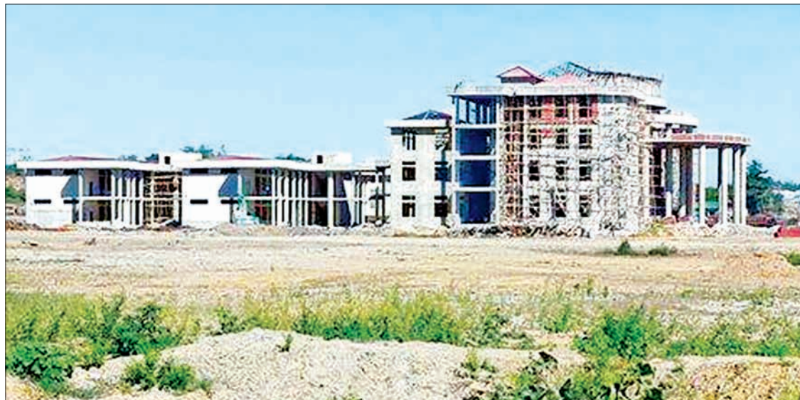
Four-storey main building of Sports University under construction.

CONSTRUCTION on a new Sports University in Nay Pyi Taw will be completed by March 2016, and it will occupy an area of 89.7 acres near the Nay Pyi