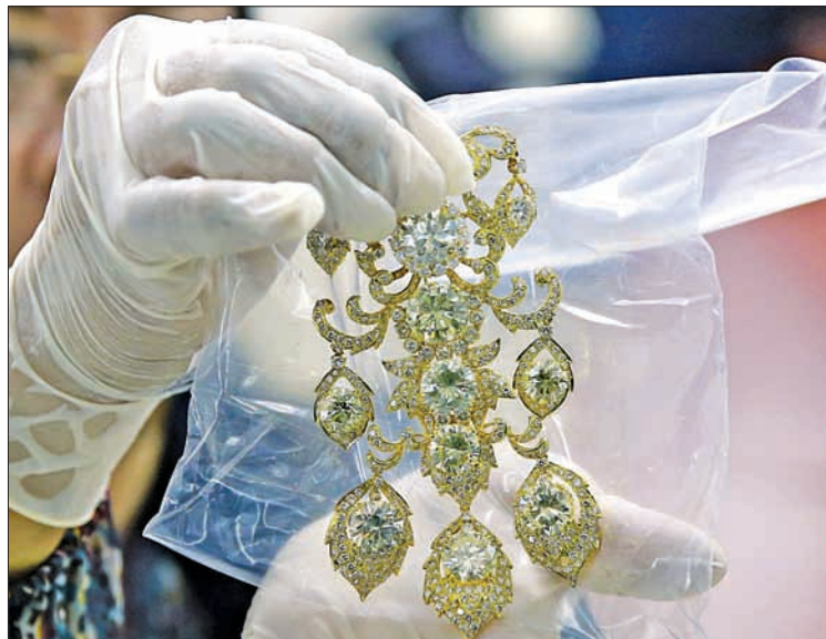
An employee from the Bureau of Customs shows items from the Marcos Jewelry Collection that will be appraised inside the Central Bank in Manila on 24 November.