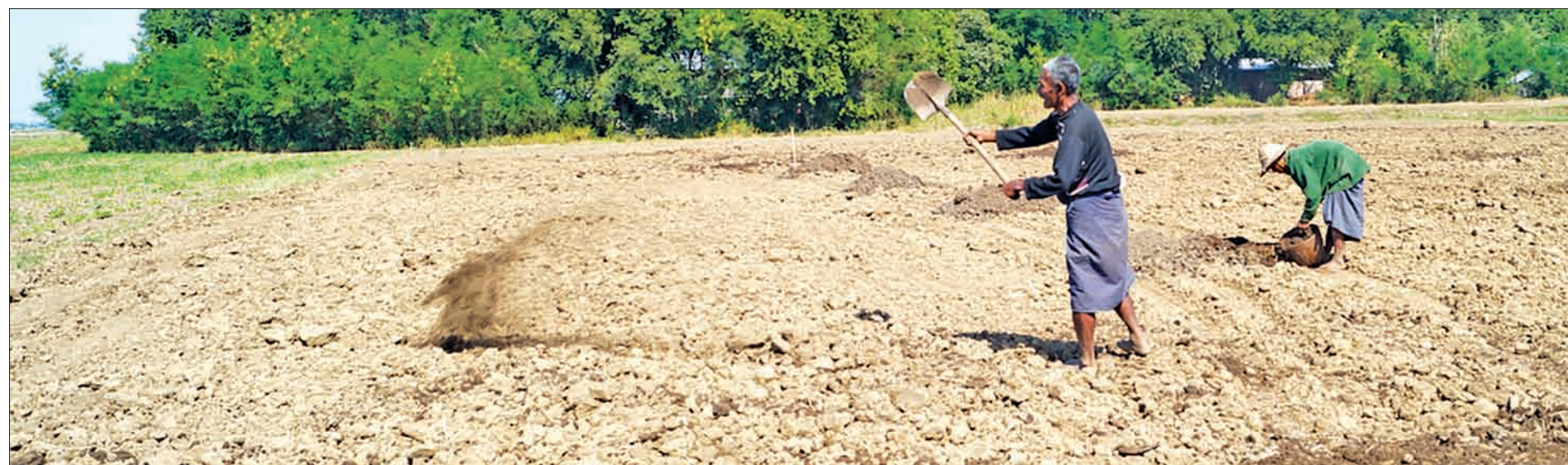
Local farmers work at soil preparation for cultivation of crops in Tatkon Township.

FARMERS in the villages of Tatkon Township, Nay Pyi Taw, are offering soil preparation jobs to rural locals in the potato fields along Sinthe Creek.