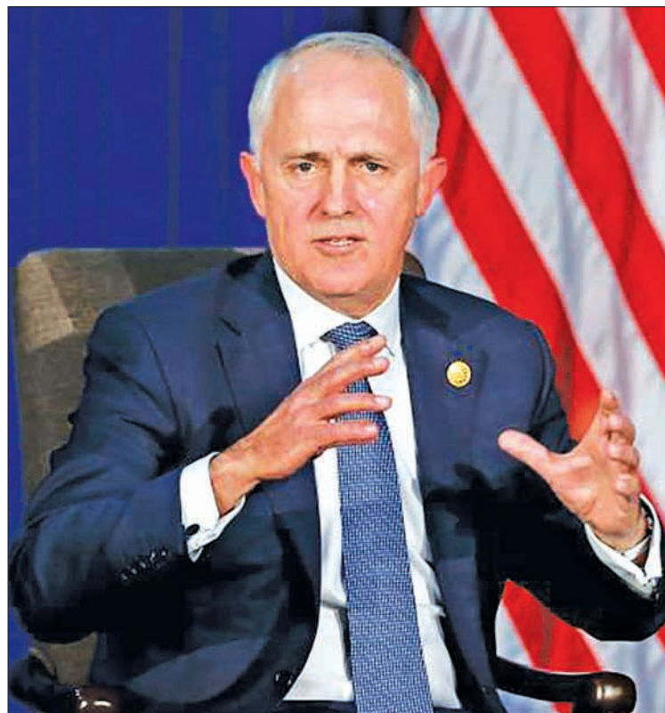
Australia's Prime Minister Malcolm Turnbull.

SYDNEY — Australian Prime Minister Malcolm Turnbull yesterday called for greater intelligence sharing in Southeast Asia to stop a Paris-style attack and ordered local law enforcement officials to test their readiness to handle a mass casualty attack.