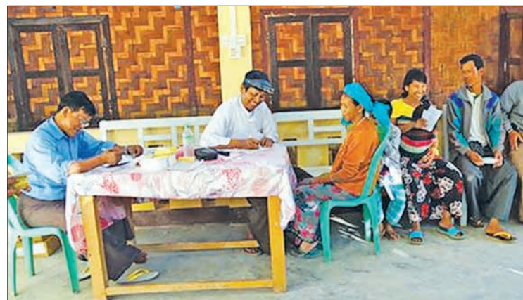
Local eye patients receive medical checkups from specialist.

A total of 1,274 eye patients registered to be seen by the medical team. Among them, 270 patients needed surgery and 70 cleft lip patients were examined at the hospital in preparation for operations. Kalay's Sitagu Arojadana