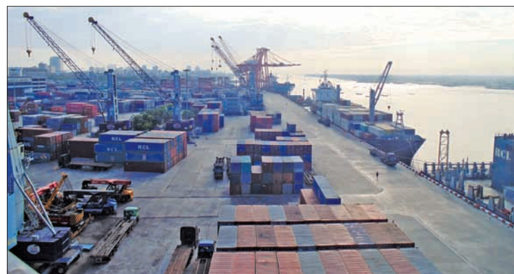
The container yard of Myanmar Industrial Port in Ahlon Township.