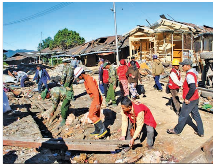
Local people carrying out sanitation at damaged places.