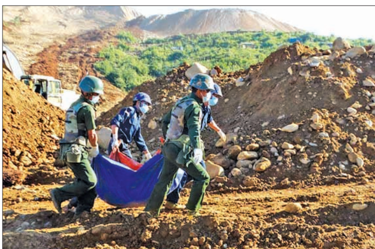
Tatmadawmen of local battalion and volunteers participate in clearing of debris and searching of bodies in landslide in Hpakant Township.

According to spokespersons at the press conference, one representative from each ethnic armed group will represent the ethnic side, while the government's side is also comprised of eight members and will be led by Union Minister U Aung Min.