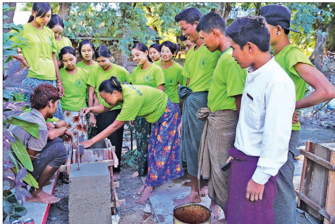
A local woman trainee practically makes concrete work.

The trainees thanked officials of the Rural Development Department for providing the course.— Tin Soe Lwin (Tatkon IPRD)