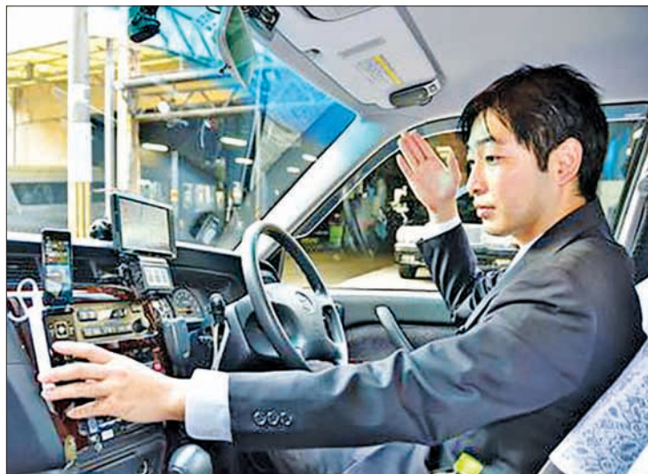
A taxi driver in Osaka, western Japan, receives assistance from a translator for a foreign passenger via smartphone and speaker-microphone attached to a sun visor on 22 October.

Sakura Taxi Group, based in Osaka’s Fukushima Ward, in September introduced a system enabling all of its 400 or so cabs to receive support around-the-clock from interpreters of Chinese and