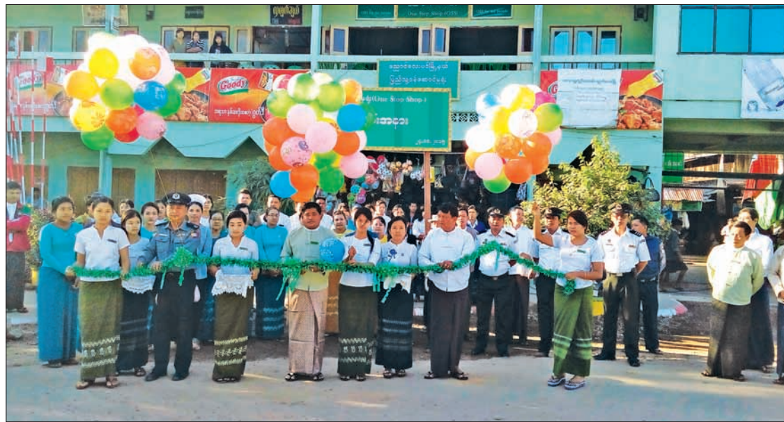
The opening ceremony of one-stop shop in progress in Nyaunglebin Township.