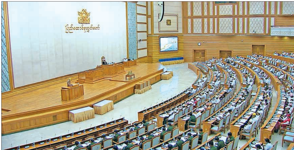
Pyidaungsu Hluttaw MPs debate more than K635 billion of additional budget.

Union Minister Dr Kan Zaw responded to questions raised by representatives about the implementation of national planning.