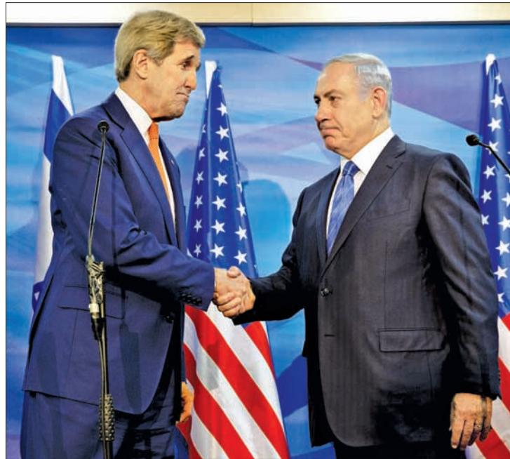
US Secretary of State John Kerry shakes hands with Israeli Prime Minister Benjamin Netanyahu before their meeting at the Prime Minister's Office in Jerusalem, on 24 November.

JERUSALEM — US Secretary of State John Kerry began a one-day visit to Israel and the Palestinian territories yesterday by describing a wave of Palestinian knife and car ramming attacks as terrorism that must be condemned.