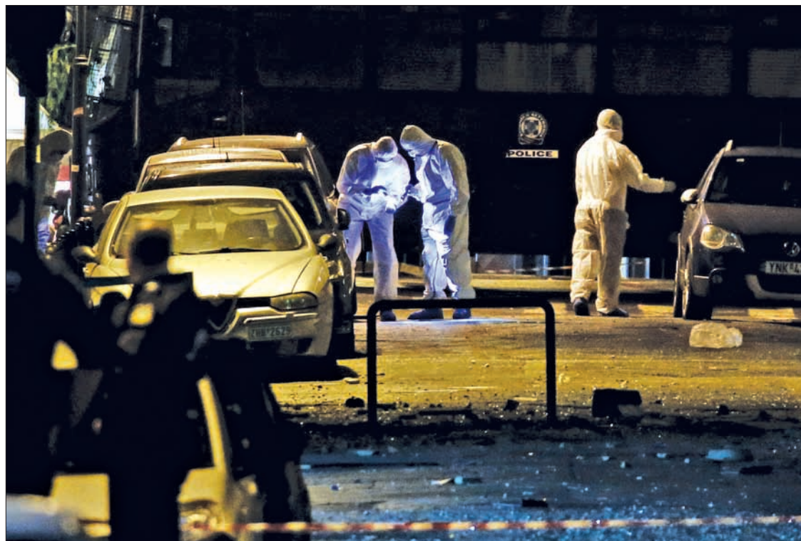
Forensic experts search for evidence on a street where a bomb exploded outside the entrance of the Hellenic Business Federation offices in Athens, Greece, on 24 November.

"We knew about it, police had warned us that there may be a bomb because they found a suspi-