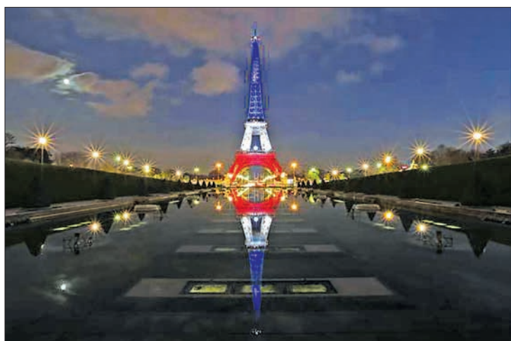
The Eiffel Tower lit with the blue, white and red colours of the French flag is reflected in the Trocadero fountains in Paris, France, on 23 November.

LONDON — More than half of Britons now want to leave the European Union, according to an opinion poll carried out after the Paris attacks for the Independent newspaper.