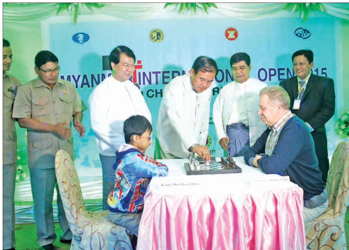
Deputy Minister for Sports U Thaug Htaik launches the chess tournament.