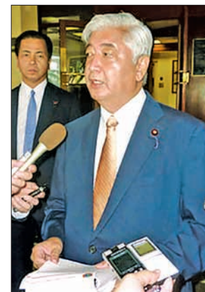
Japan's Defence Minister Gen Nakatani meets with reporters in Honolulu, Hawaii.

It said that sand and dust kicked up as the aircraft was hovering near the ground caused a stall in the left engine and resulted in a hard landing, which killed two crew members. —Kyodo News