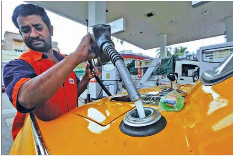
An employee fills an iconic yellow ambassador taxi with diesel at a fuel station in Kolkata.

NEW DELHI — India's crude oil imports from the Asia-Pacific region spiked last month as its refiners looked beyond their traditional suppliers for cheaper purchases amid a global supply glut.