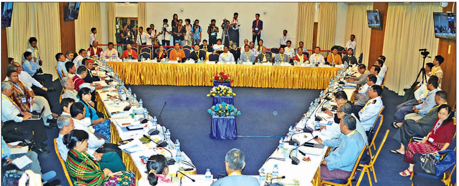
Representatives from political parties, the government and ethnic armed organisations held tripartite talks on future political dialogue at Myanmar Peace Centre in Yangon yesterday.