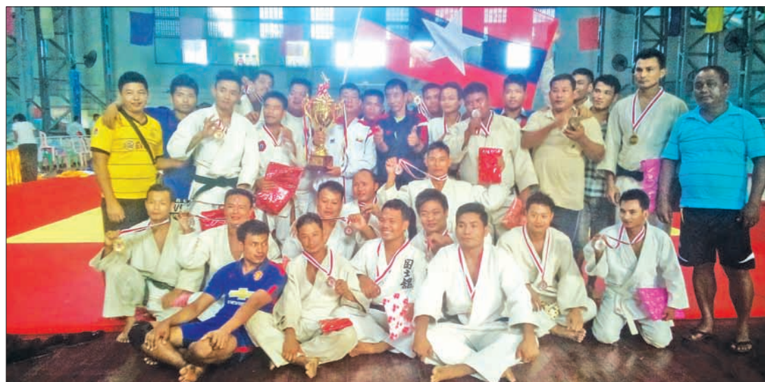
Defence (A) team celebrates victory with medals in Judo event.