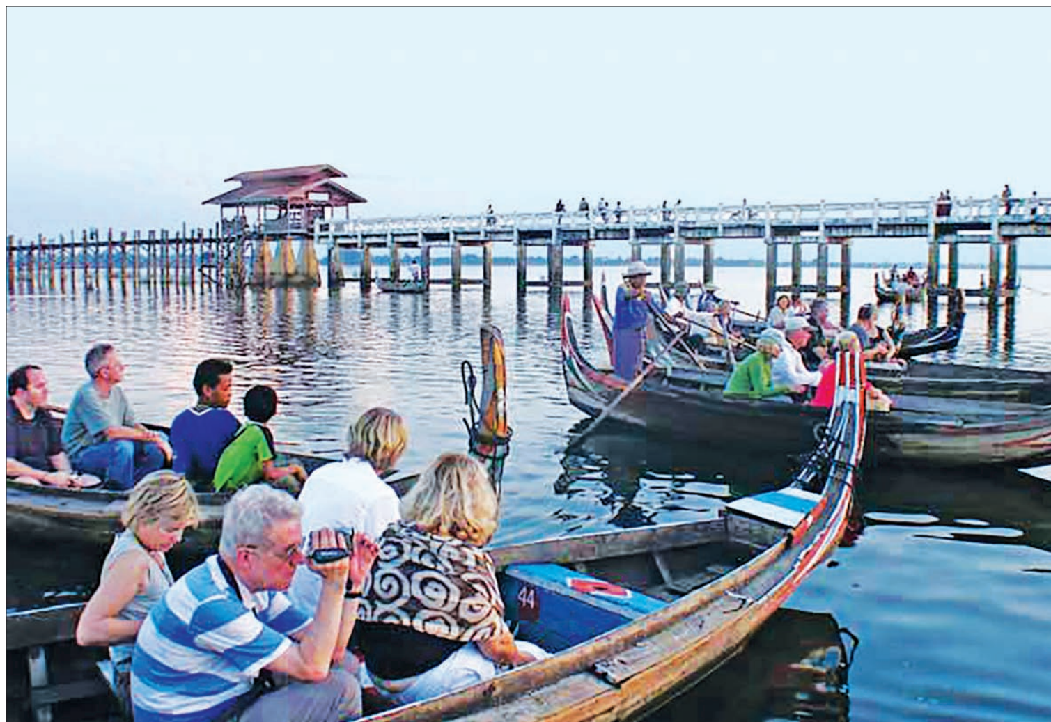
Tourists visit Taungthaman Lake by boat in Amarapura Township.