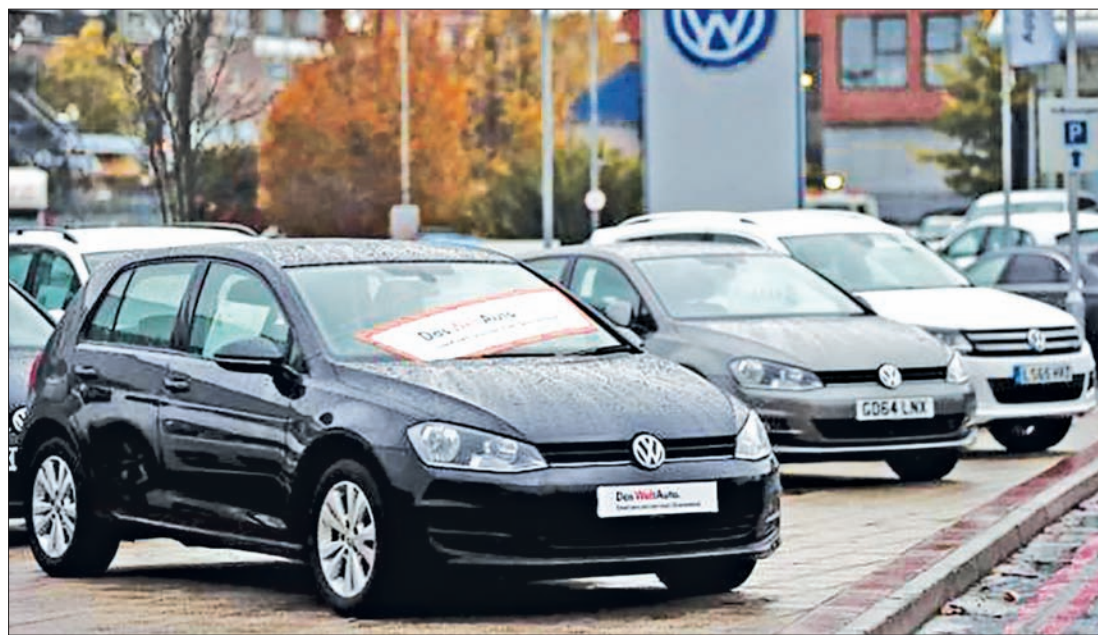
Volkswagen cars parked outside a VW dealership in London, Britain.

MILAN — Volkswagen's (VOWG_p.DE) European sales and market share slipped in October, industry data showed yesterday, as the German carmaker's emissions-cheating scandal began to take its toll at a time when the overall market continued to grow.