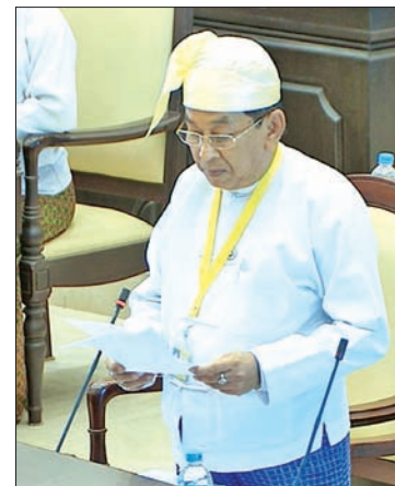
Deputy Minister U Htin Aung.