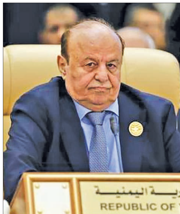
Yemen's exiled President Abd-Rabbu Mansour Hadi.

ADEN — Yemen's exiled President Abd-Rabbu Mansour Hadi returned to the southern port city of Aden yesterday to rally forces loyal to him in the country's civil war and oversee a campaign to retake the city of Taiz, a presidency official said.