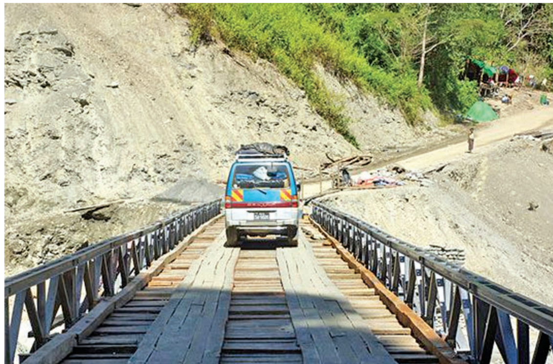
A new bailey bridge lies on Chichaung Creek in Mindat Township.

THE Chichaung bailey in Chichaung village, Mindat Township, Chin State, was damaged by heavy rains during natural disasters earlier this year.