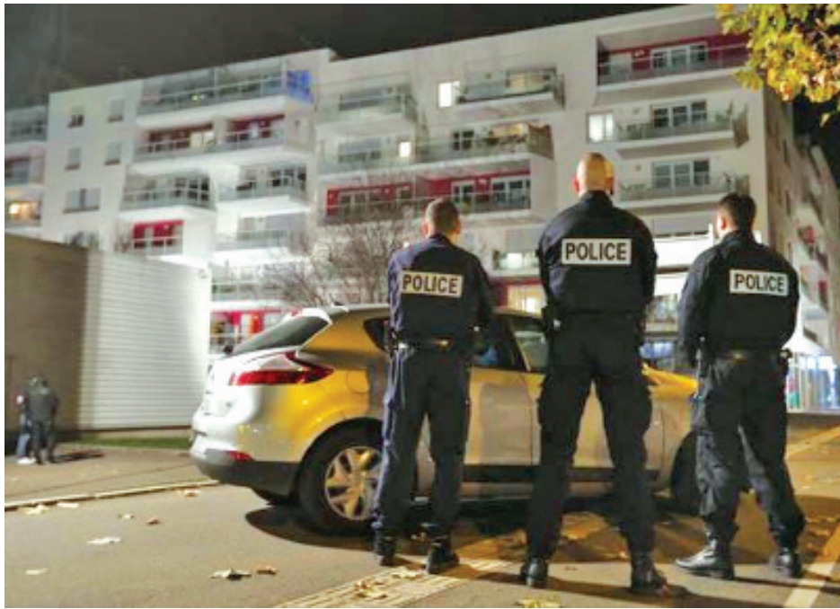
French police secure the area outside a housing complex as police conduct a door-to-door search operation in the Neudorf neighbourhood in Strasbourg, France.

PARIS — French police conducted 128 raids overnight following a wave of shootings and suicide bombings in Paris on Friday which left at least 129 people dead, Interior Minister Bernard Cazeneuve said yesterday. He told France Info radio station police were making rapid progress in their investigation into the attacks claimed by Islamic State militants but declined to give further details.