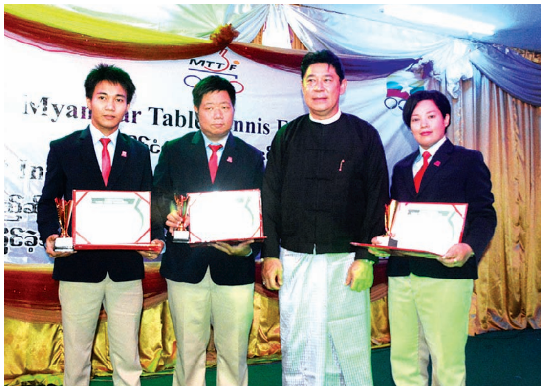
Three trainees who passed umpiring course of International Table Tennis Federation seen with certificates.

MTTF is making arrangements with ITTF for the holding of the second table tennis umpire course in 2016.