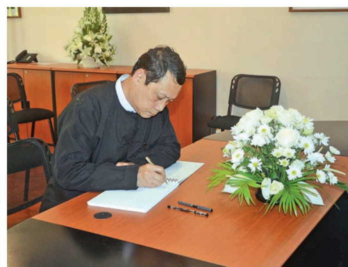
Permanent Secretary U Aung Lynn of Ministry of Foreign Affairs signs the book of condolence for the victims in attacks that occurred in France on 13 November, at the French Embassy in Yangon on 17 November.

The two sides were set to draw up a political framework within 60 days after the formal NCA signing and start a political dialogue within 90 days.— Myanmar News Agency