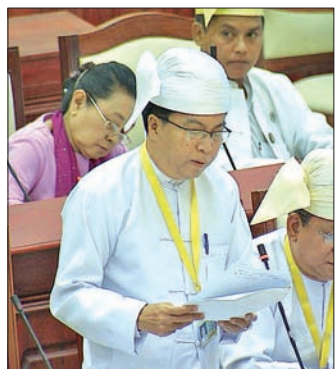
Deputy Minister Dr Zaw Min Aung.

U Tin Maung Oo of Shwepyitha Constituency asked a question on future plans for travel sectors, including aviation, waterways and railways. Deputy Minister for Transport U Han Sein replied that the Ministry of Transport upgraded 33 airports at a cost of K102.71 million (US$79.50 million) from 2010 to 2015 fiscal years. A total of 10 state-owned and privately operated airlines have been operating between 2010 to