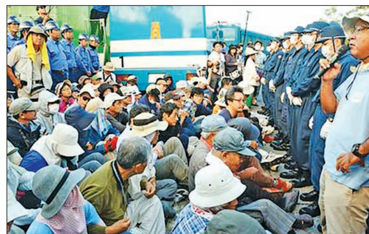
Protesters stage a sit-in in front of the US Marine Corps’ Camp Schwab in Nago in Japan’s southernmost prefecture of Okinawa on 17 November.

The Okinawa government and many residents are opposed to the base relocation plan and want the airstrip moved outside the prefecture to reduce the burden from hosting the bulk of US forces in Japan.— Kyodo News