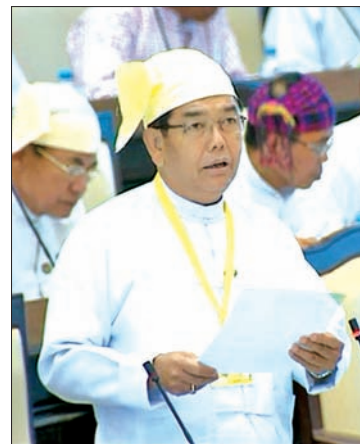
Deputy Minister U Ohn Than.