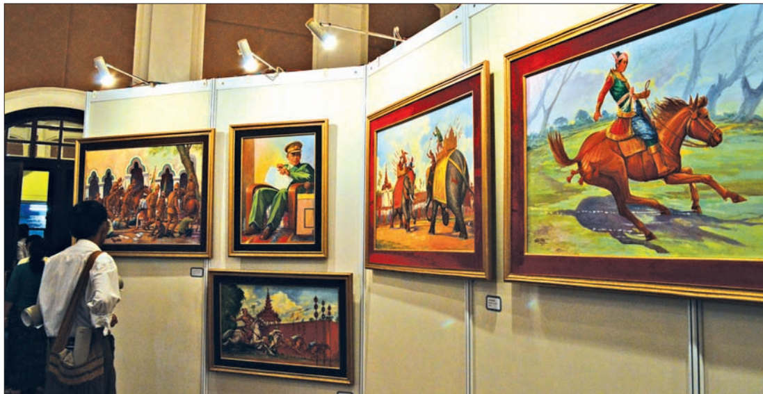
Enthusiasts view round works of artist at Solo Show of A Classical and Legendary Artist U San Hlaing.

At this time U San Hlaing has painted more than 100 water colours and 150 oil paintings.—GNLM