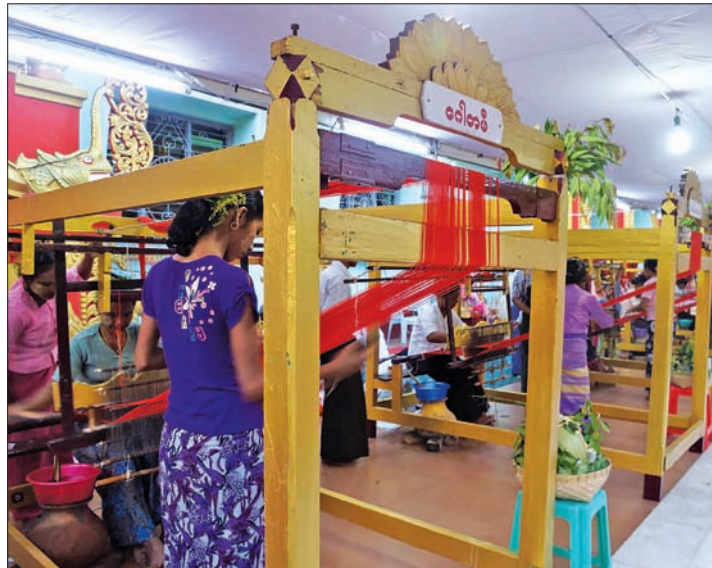
Local women prepare weaving of Mathoe Thingan (robe) before competing in the contest.

THE Nagayon Maha Bawdi Pagoda Board of Trustees are organising the 45 th Mathoe Thingan (robe weaving) contest and rice offering ceremony, which will be held at the pagoda's prayer hall in Nandawgon Ward, Meiktila, Mandalay Region, on 25 and 26 November.