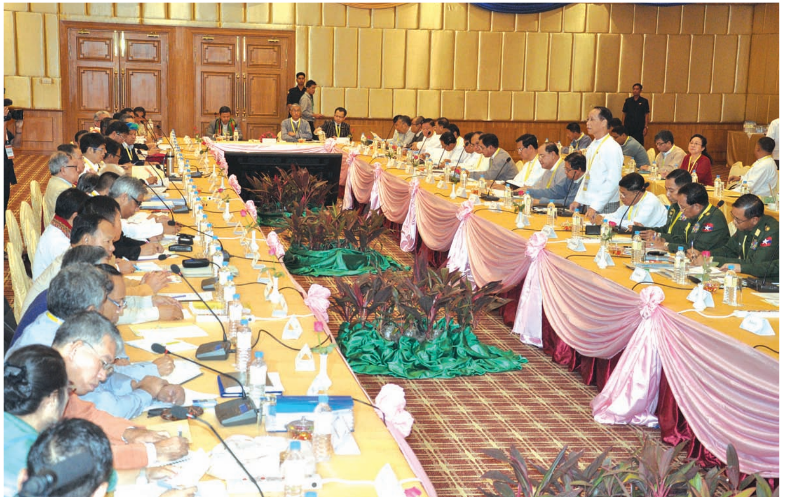
See page 3 >> Vice President Dr Sai Mauk Kham delivers speech at Joint Implementation Coordination Meeting (JICM) on Nationwide Ceasefire Agreement.

Meetings for drafting the framework for political dialogue is scheduled to start before 14 December, 2015, set according to the timeline of the ceasefire terms. Political dialogue is expected to start before 14 January, as it must begin within 90 days after the political framework is signed by the joint committee.