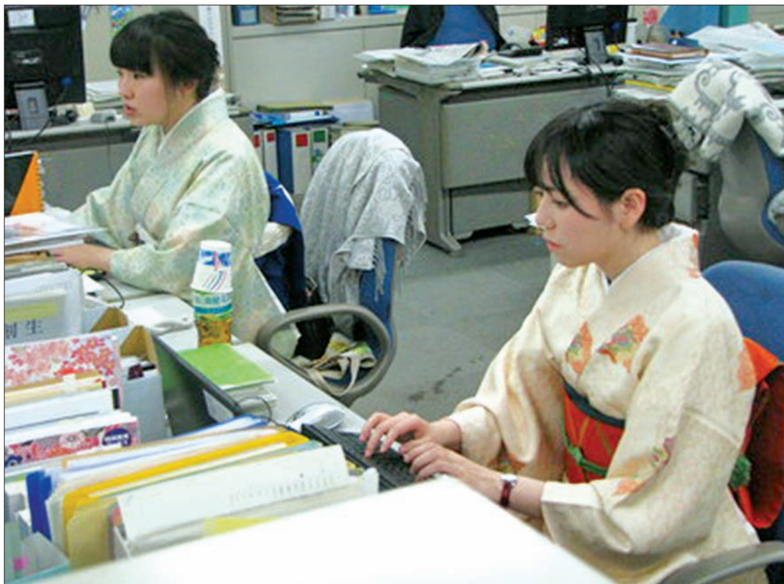
Employees work in colourful kimono on 16 November, at the industry ministry in Tokyo in an event held to promote the Japanese traditional garments.

According to Yano Research Institute, a private marketing research company, retail sales of kimono in Japan dwindled to about 285.5 billion yen ($2.3 billion) in 2014, less than one-sixth of the