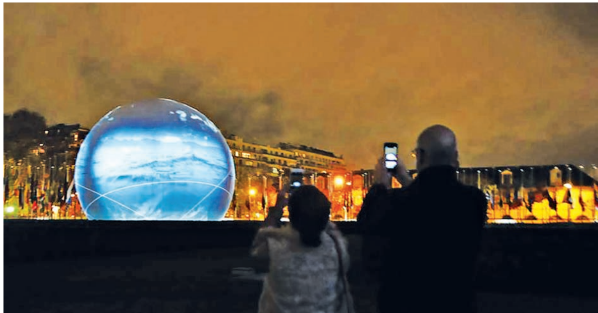
Photo taken on 16 November, 2015 shows a projection of pictures and videos on a building of the United Nations Educational, Scientific and Cultural Organisation (UNESCO) in Paris, France. UNESCO celebrated the 70 th anniversary of the adoption of its Constitution. The constitution of UNESCO was signed on 16 November 1945 to contribute to peace and security by promoting collaboration among the nations through education, science and culture.