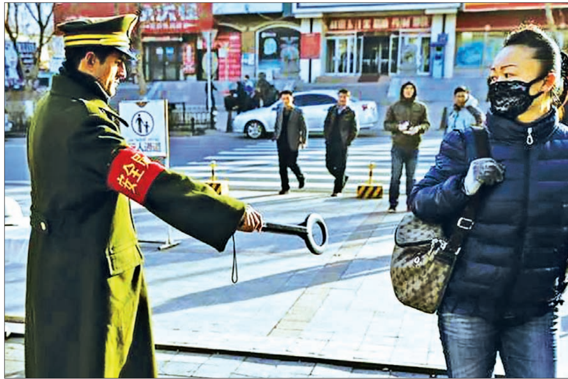
A pedestrian reacts as a security officer holds out a detector on a street in Urumqi, Xinjiang Uighur autonomous region, on 17 November, 2013.

BEIJING — China needs to deepen its fight against separatists, intensify “de-radicalisation” efforts, and increase global co-operation to defend against terrorism, the country’s domestic security chief wrote on Tuesday.