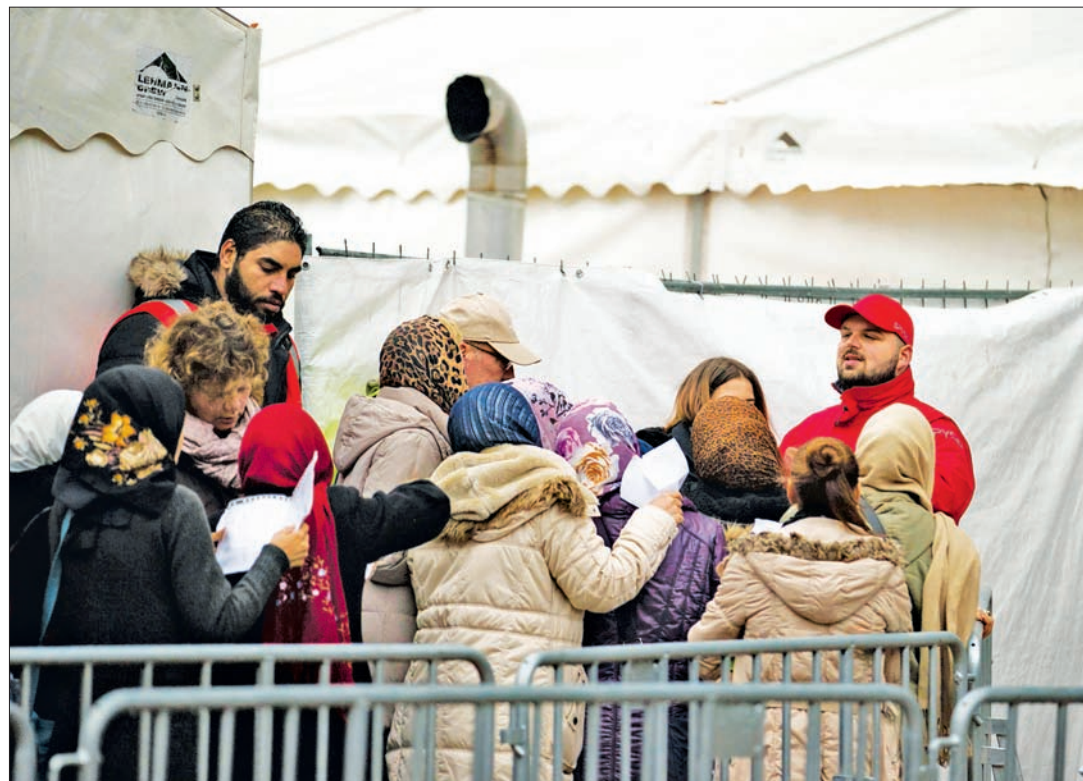
Migrants queue at the compound outside the Berlin Office of Health and Social Affairs (LAGESO) waiting to register in Berlin, Germany, on 17 November.

BERLIN — There is no sign that Islamist militants have entered Germany posing as refugees to commit an attack, the head of the police has said, responding to concerns following the attacks in Paris that an open-door refugee policy poses a security risk.