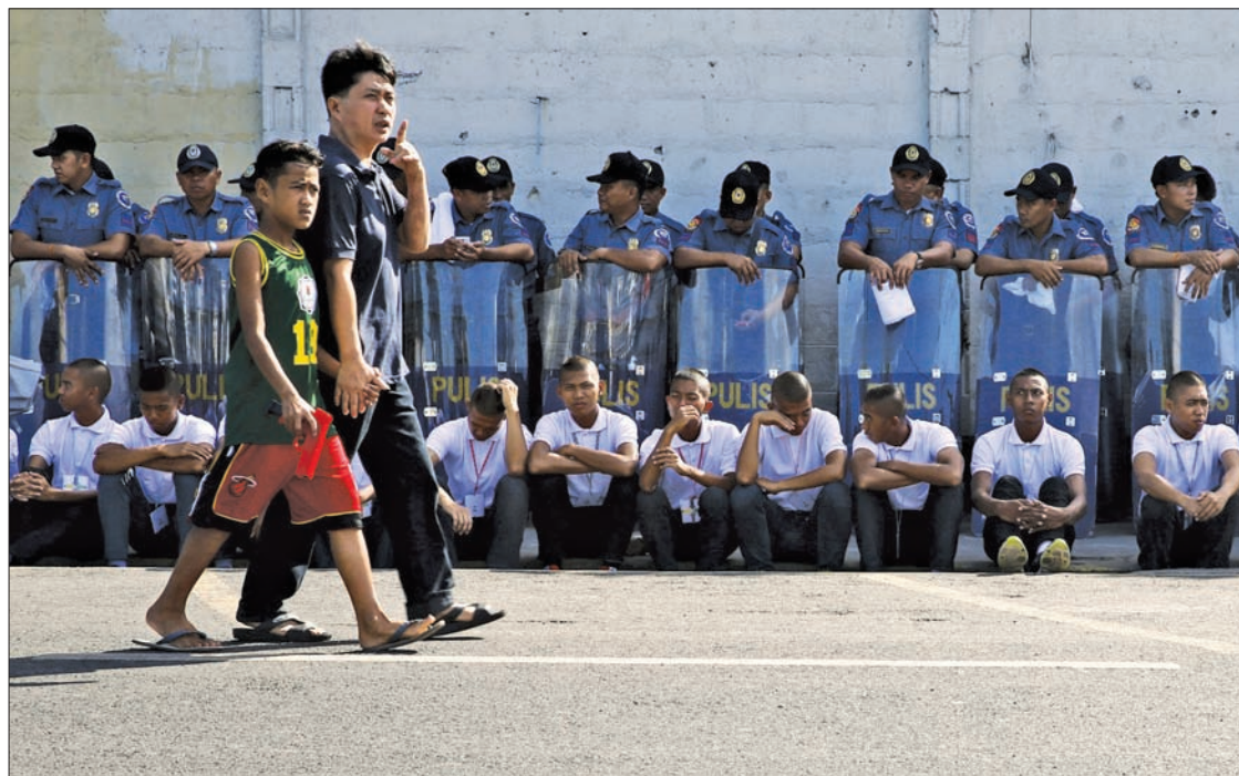
Residents walk past the Philippines Air Force (white) and police personnel standing guard near the venues of the Asia-Pacific Economic Cooperation (APEC) summit in the capital city of Manila, Philippines on 17 November.

MANILA — US President Barack Obama and other world leaders arrived in Manila yesterday for the first of two regional summits that were supposed to bolster trade and security ties but have been clouded by the Islamic State threat half a world away.