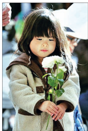
A girl offers flowers on 15 November, at the French Consulate General in Kyoto to mourn the victims of a series of terrorist attacks in Paris.

TOKYO — Memorial services for those killed in a series of terror attacks in Paris were held all over the world.