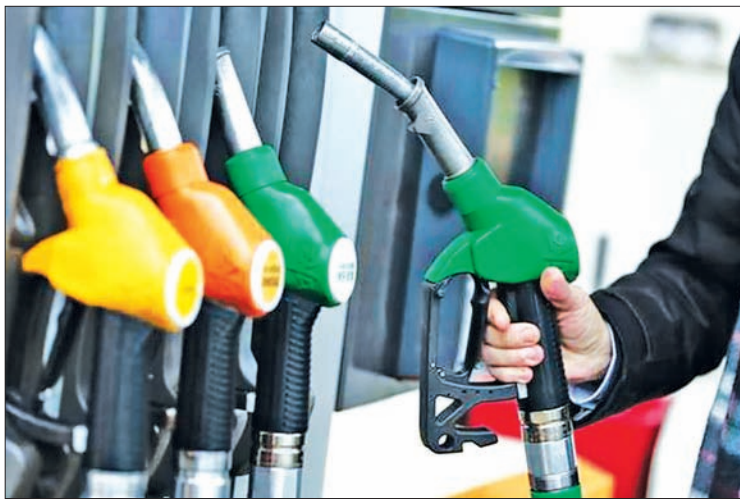
A customer prepares to fill up his tank in a gasoline station in Nice.

Internationally traded Brent crude futures rose towards $44.80 before dropping back to $44.59 a barrel.