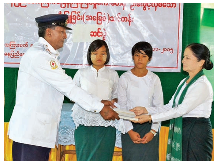
An official presents certificate to a trainee.

THE Nay Pyi Taw Red Cross Supervisory Committee and Nay Pyi Taw Education Department jointly conducted first-aid courses at schools in eight townships.