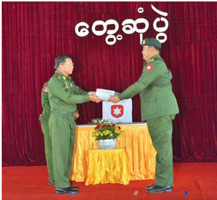
Senior General Min Aung Hlaing presents gifts to an official at Ottawin Station.

COMMANDER-in-Chief of Defence Services Senior General Min Aung Hlaing met with defence services personnel in Ottwin Station on Tuesday.