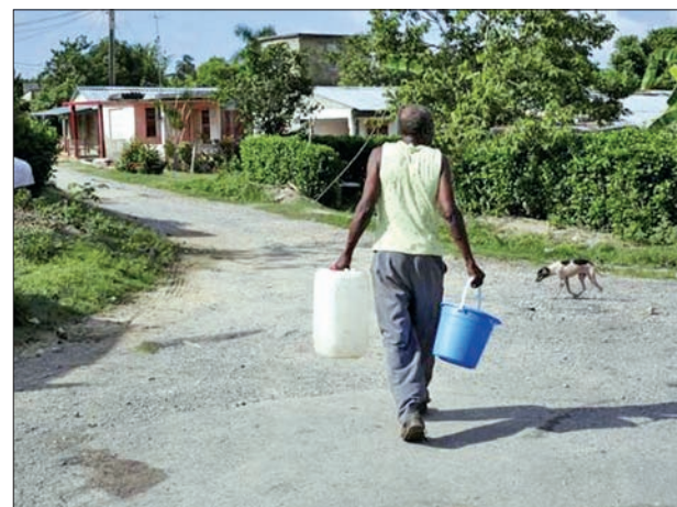
A man carries buckets of water while searching for water sources at La Chusmita neighbourhood in Consolacion del Sur, Pinar del Rio Province.

World leaders will meet in Paris starting this month in a bid to agree on ways to reduce the effects of climate change.—Reuters