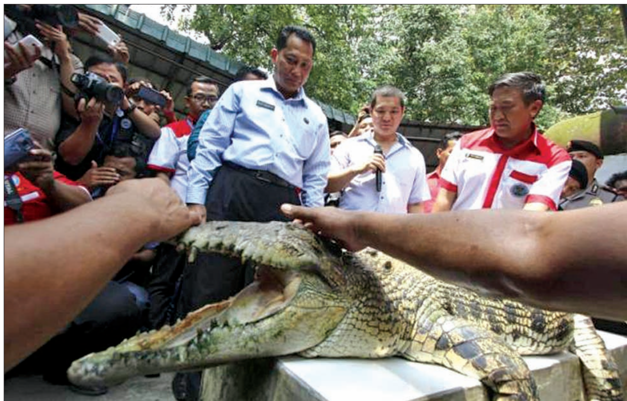
The head of the Indonesia's National Narcotics Board Budi Waseso (L) looks at a crocodile during a visit to a crocodile farm in Medan, North Sumatra, on 11 November.

Indonesian President Joko Widodo declared a war on what he has dubbed a "narcotics emergency" after taking office a year ago, basing his campaign on a study that showed at least