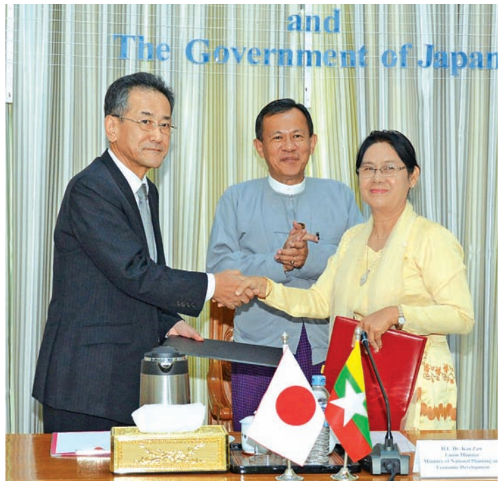
Japanese Ambassador Mr Tateshi Higuchi shakes hands with Deputy Minister Daw Lei Lei Thein after exchanging notes.

DEPUTY Minister for National Planning and Economic Development Daw Lei Lei Thein and Japanese Ambassador Mr Tateshi Higuchi signed an agreement yesterday for the government of Japan to provide 1500 million yen (US$12.22 million) to help fund the reconstruction of schools in flood-affected regions in Myanmar.