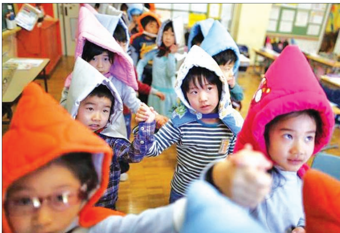
School children wearing padded hoods to protect them from falling debris prepare to evacuate during an earthquake simulation exercise at an elementary school in Tokyo.