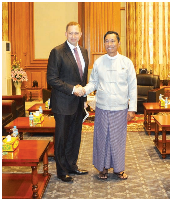
Speaker Thura U Shwe Mann shakes hands with US Ambassador Mr Derek Mitchell.

PYITHU Hluttaw Speaker Thura U Shwe Mann met with the US Ambassador to Myanmar Mr Derek Mitchell at his office yesterday.