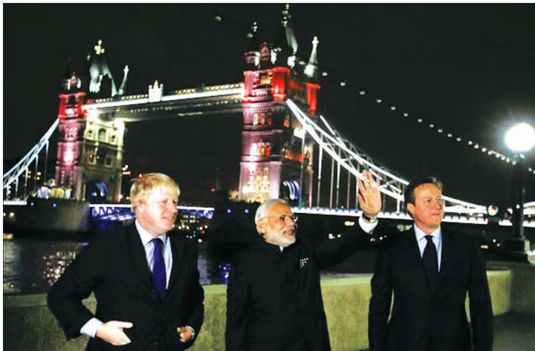
Britain's Prime Minister David Cameron, India's Prime Minister Narendra Modi and London Mayor Boris Johnson acknowledge the public in front of Tower Bridge in London, on 12 November.

LONDON — Britain and India welcomed more than 9 billion pounds in commercial deals during a visit by Indian Prime Minister Narendra Modi, but his arrival was overshadowed by protests over a perceived rise in intolerance back home.