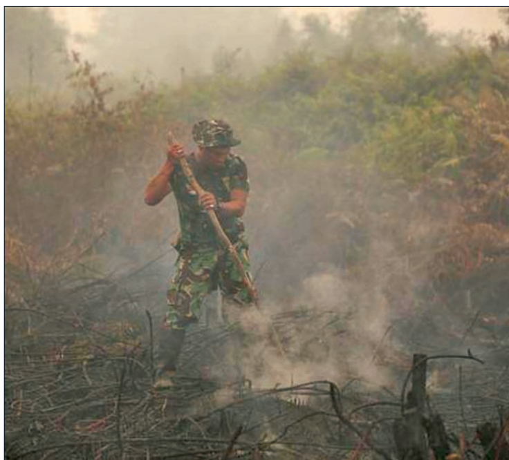
An Indonesian soldier checks on a peat land fire near Palangkaraya, central Kalimantan, Indonesia.

hand tools is the most environmentally friendly way to clear forest areas approved for development, say forestry groups, but these methods are more expensive and time-consuming than fires.