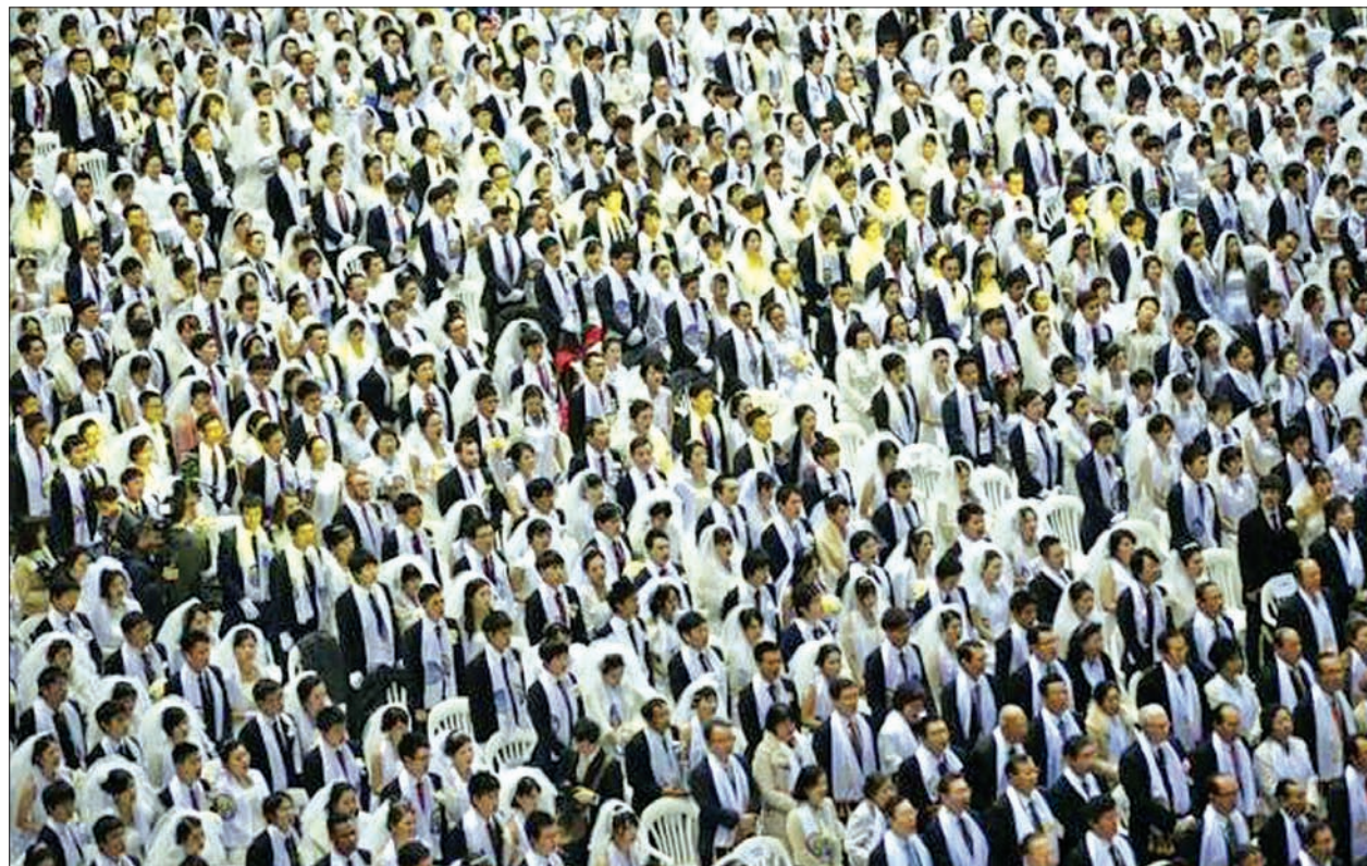
Newlyweds attend a mass wedding ceremony of the Unification Church at Cheongshim Peace World Centre in Gapyeong, on 3 March, 2015.

SEOUL — Twilight divorces after 20 years of marriage are at a record in South Korea as the stigma of divorce wears off in a conservative society and court rulings make it financially viable for older women to go it alone. For 54-year-old Kim