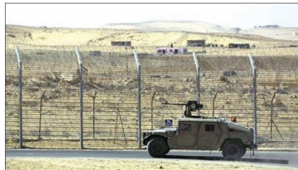
An armoured Israeli military vehicle drives along Israel's border with Egypt's Sinai peninsula, near the Nitzana.

JERUSALEM — They half-joke that they are "smoke detectors," installed in Sinai after Egypt's 1979 peace deal with Israel as insurance against any future flare-ups. More than three war-free decades on, the US-led peacekeepers are feeling the heat.