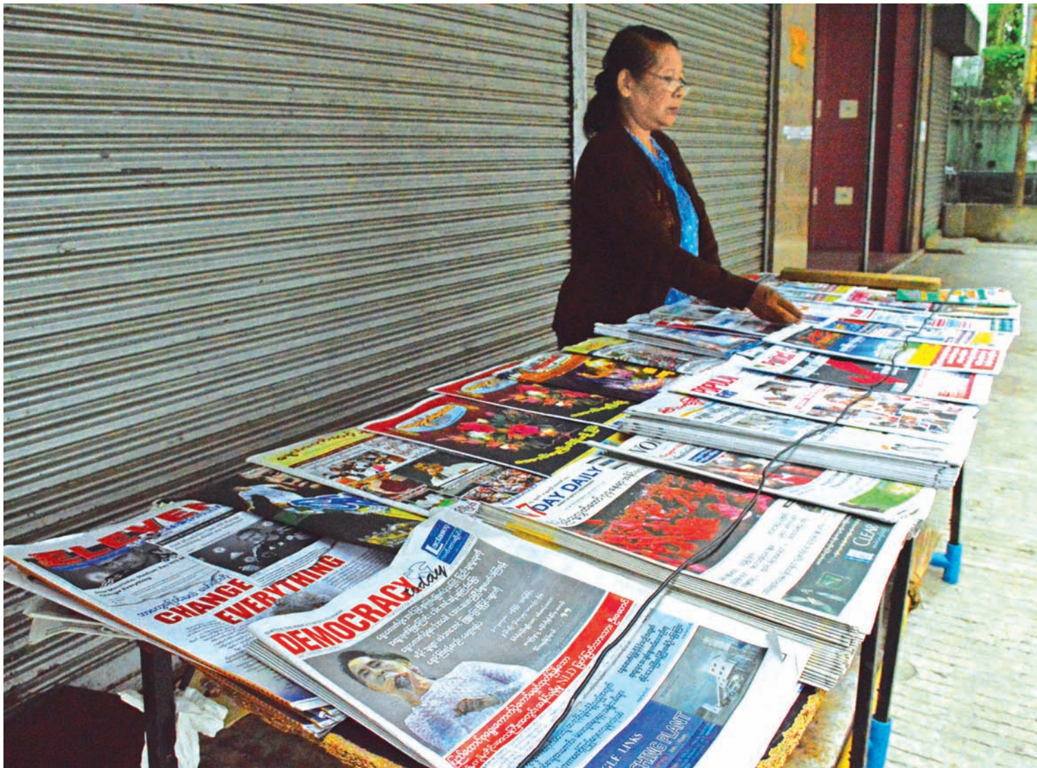
Myanmar newspapers and journals at a roadside news stand in Yangon.