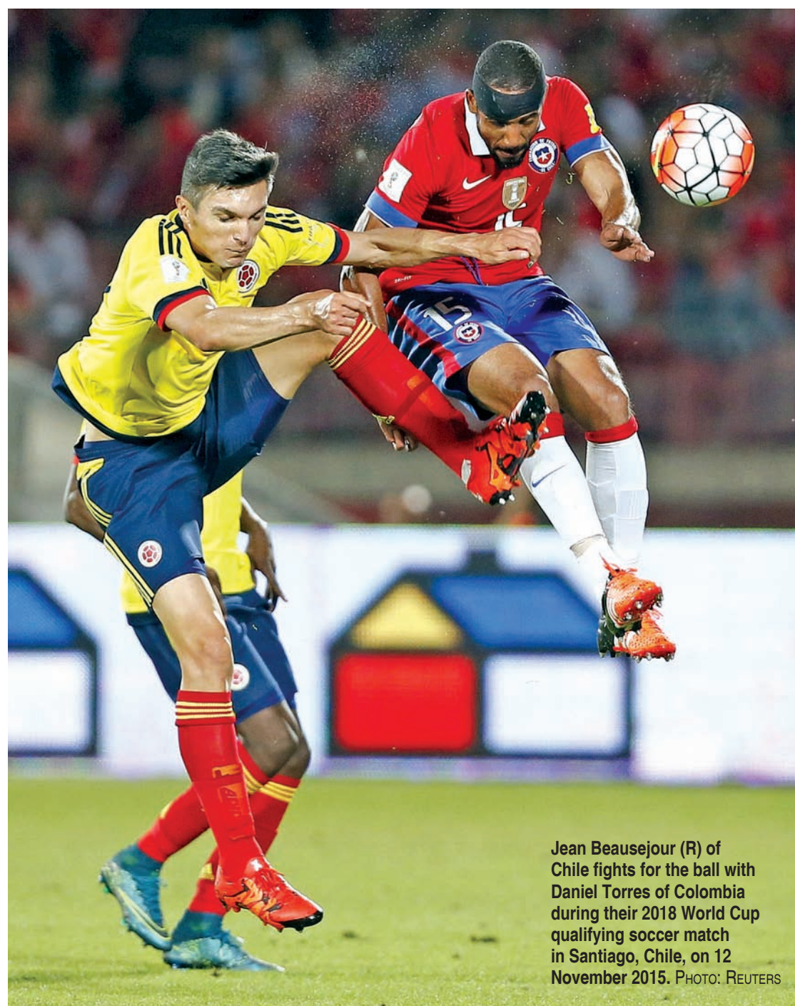
Jean Beausejour (R) of Chile fights for the ball with Daniel Torres of Colombia during their 2018 World Cup qualifying soccer match in Santiago, Chile, on 12 November 2015.

David Ferrer and Tomas Berdych will do well to reach the semis, Wawrinka could be the dark horse after reaching the last four in 2013 and last year when he lost an epic to Federer.—Reuters