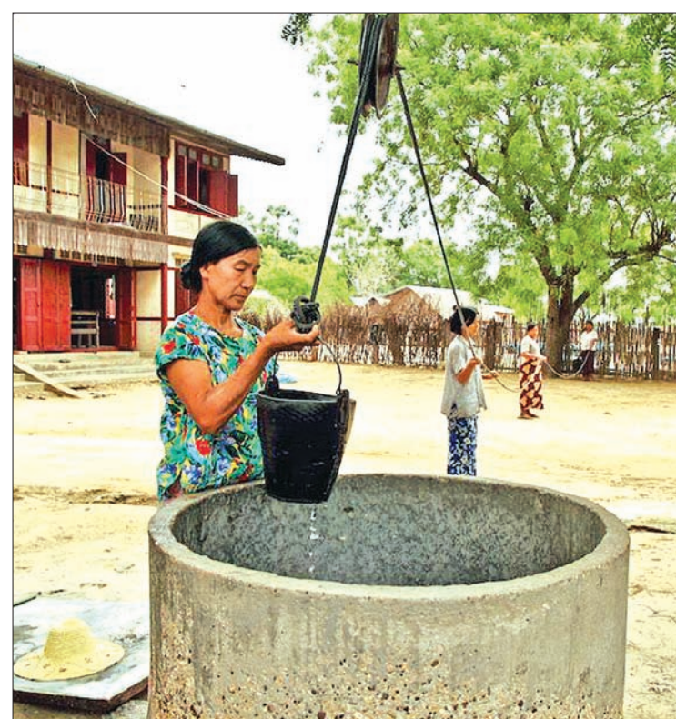
Women draw water from a tube-well in rural Myanmar. A project financed by ADB and others will result in an increase in the number of households with access to uninterrupted water supplies.

ADB's loan will be complemented by $56.8 million in co-financing, with $46 million from the French development agency Agence Française de Développement, $6.8 million from the European Union's Asian Investment Facility, and $4 million from the Urban Climate Change Resilience Trust Fund. Myanmar's government will contribute $13.1 million, said ADB.