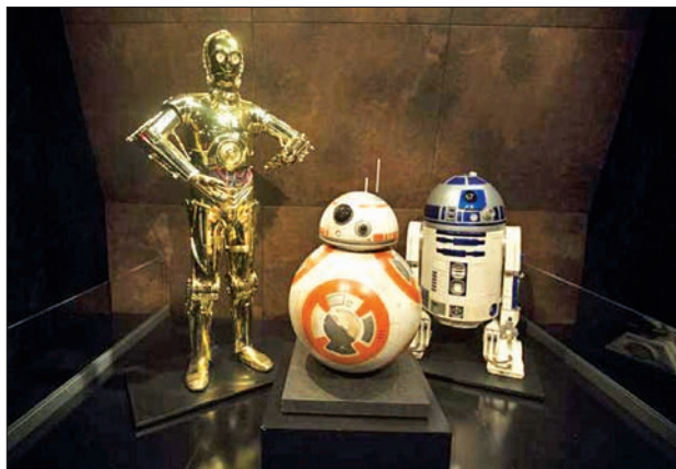
Characters C-3PO, BB-8 and R2-D2 from Star Wars are pictured at the Discovery Store Times Square in Manhattan, New York on 11 November.

NEW YORK — Costumes and props from the much-loved "Star Wars" films go on display in New York ahead of the highly-anticipated release of the franchise's next installment in December.