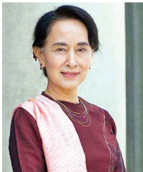
Daw Aung San Suu Kyi, Chairperson of National League for Democracy.