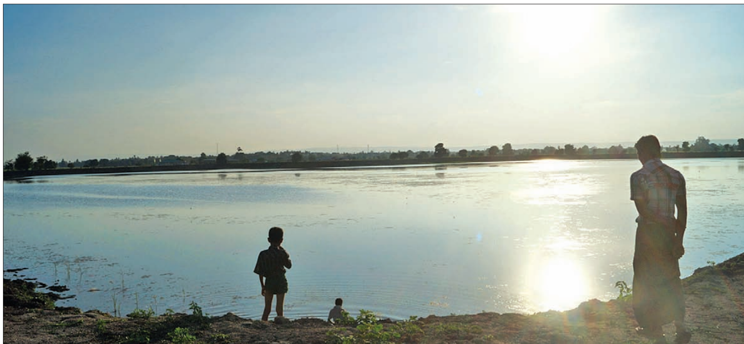
Byaing-in Lake filled with water ready to irrigate farmlands in Tatkon Township.