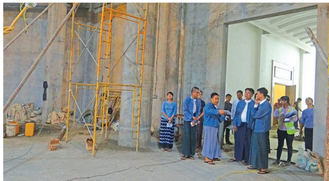
Union Culture Minister U Aye Myint Kyu inspects progress of buildings for National Museum.

UNION Culture Minister U Aye Myint Kyu visited the Myanmar National Museum in Nay Pyi Taw on 13 November to inspect the progress of construction works. The National Museum has been under construction