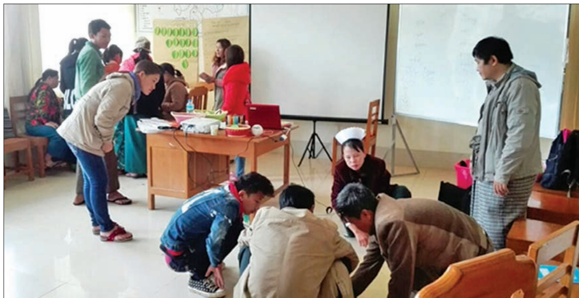
Local youth participate in health and social issues in Namhsam.

and maternal care. About 30 trainees from women's associations, social organisations and Myanmar Red Cross members attended the course.—Myint Aung