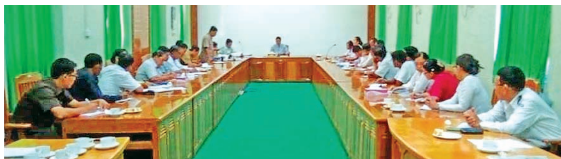
Taninthayi Region Government prepares for holding football tournament for local youths.

A COORDINATION meeting was held to discuss an upcoming inter-township U-25 football tournament in Dawei on Thursday. The meeting took place at the hall of the Taninthayi Region Government in Dawei, with speeches