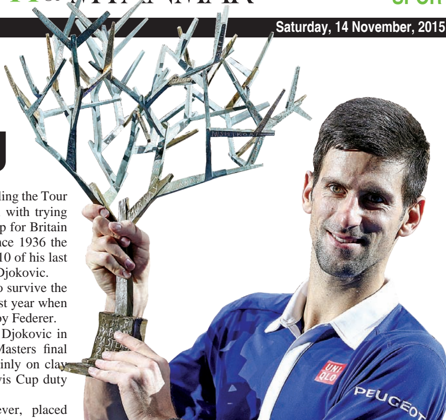
World number one Novak Djokovic of Serbia poses with the trophy after beating Britain's Andy Murray, on 8 November.

Unlike last year when several new faces qualified, this year's eight are the usual suspects, with Japan's Kei Nishikori the least