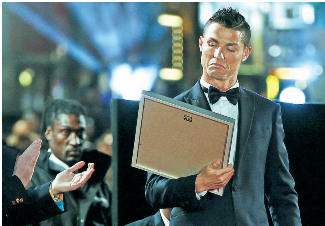
Soccer player Cristiano Ronaldo reacts as he receives a certificate on the red carpet at the world premiere of "Ronaldo" at Leicester Square in London, Britain, on 9 November.

LONDON — From soccer pitch to red carpet, FIFA World Player of the Year Cristiano Ronaldo premiered his personal portrait film "Ronaldo" in London on Monday.