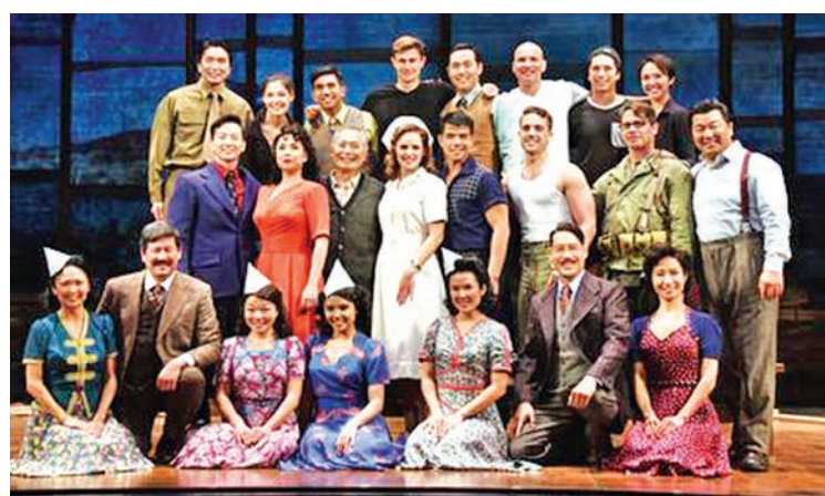
Actor George Takei (3 rd from L, 2 nd row) and other on the cast of Broadway musical "Allegiance" appear on stage at the Longacre Theater in New York, on 29 September 2015.

In its online edition, Variety praised Takei for playing the role "with enormous heart and humour." The musical tells the story of a Japanese American family forced by the US government into