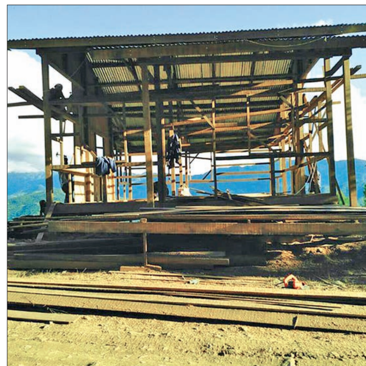
A low-cost house is being built for displaced villagers in Tiddim Township.

VILLAGERS displaced by floods in Tiddim Township, Chin State, will be relocated and provided with low-cost housing by the government. The new homes will be located in Pine Forest, near Tetlwee village junction road. The villagers have been living in shelter camps in Tiddim since floods hit the area in late July and early August.