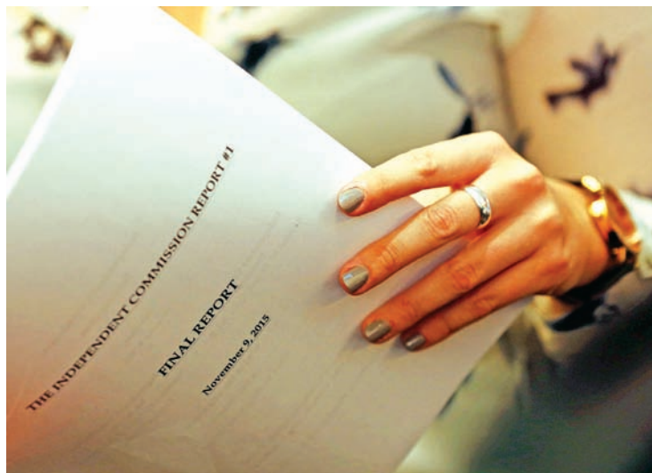
A journalist reads the final report of World Anti-Doping Agency (WADA) before a news conference on the WADA Independent Commission report on findings of investigation into allegations of widespread doping in sport in Geneva, Switzerland, on 9 November.

IAAF President Sebastian Coe said he was alarmed and surprised by the scale of the re-