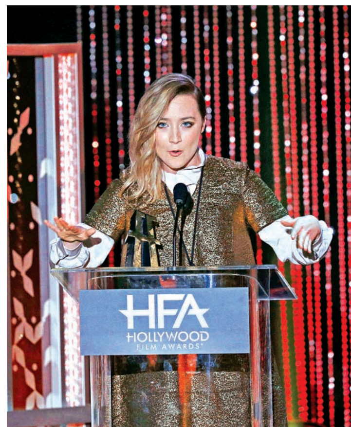
Actress Saoirse Ronan accepts the New Hollywood Award for her role in the film "Brooklyn" at the Hollywood Film Awards in Beverly Hills, California, on 1 November.

Lionsgate said "Brooklyn" opened on 87 screens in Ireland, making it the largest screen count ever for an Irish film in the republic.