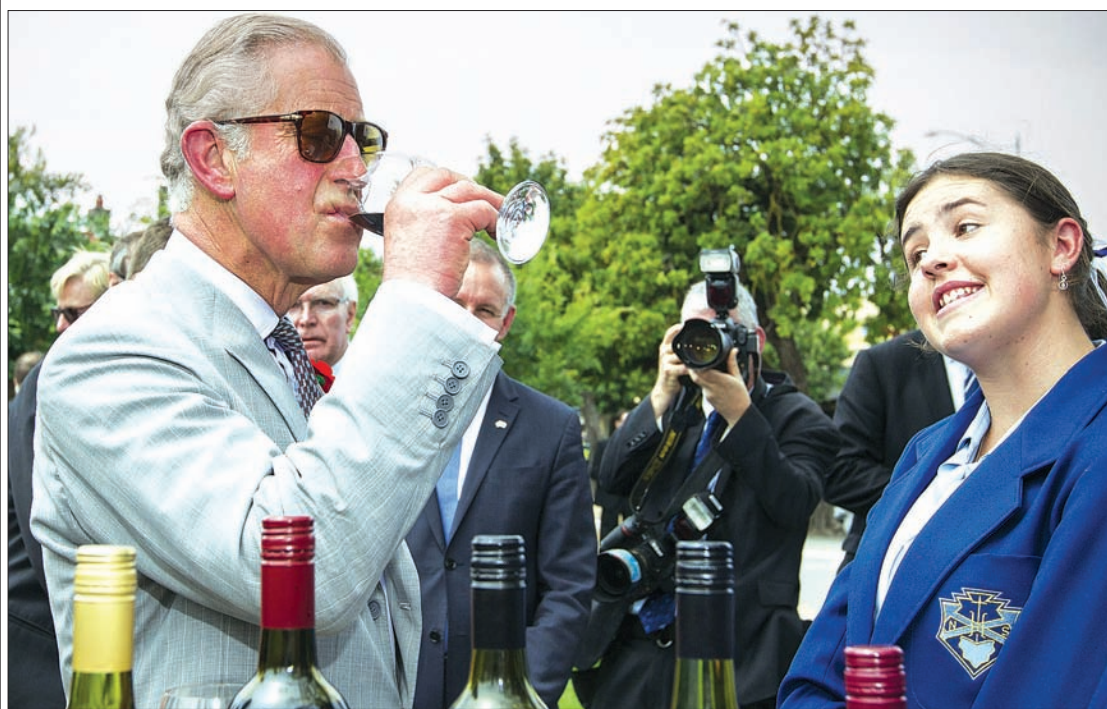
Britain's Prince Charles samples a glass of wine during his visit to the town of Tanunda in the Barossa Valley area of Australia, on 10 November, 2015.