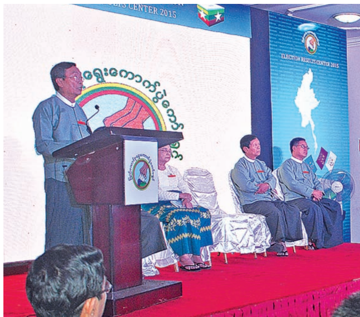
UEC member responds to question raised by journalist at press conference in Nay Pyi Taw.

Twenty-four candidates from the NLD won state/region parliament seats in two constituencies in Bago Region, 10 constituencies in Mandalay Region, and 12 constituencies in Yangon Region. Two candidates from the USDP and two candidates from the Wa Democratic Party won region/state parliament seats in two con-