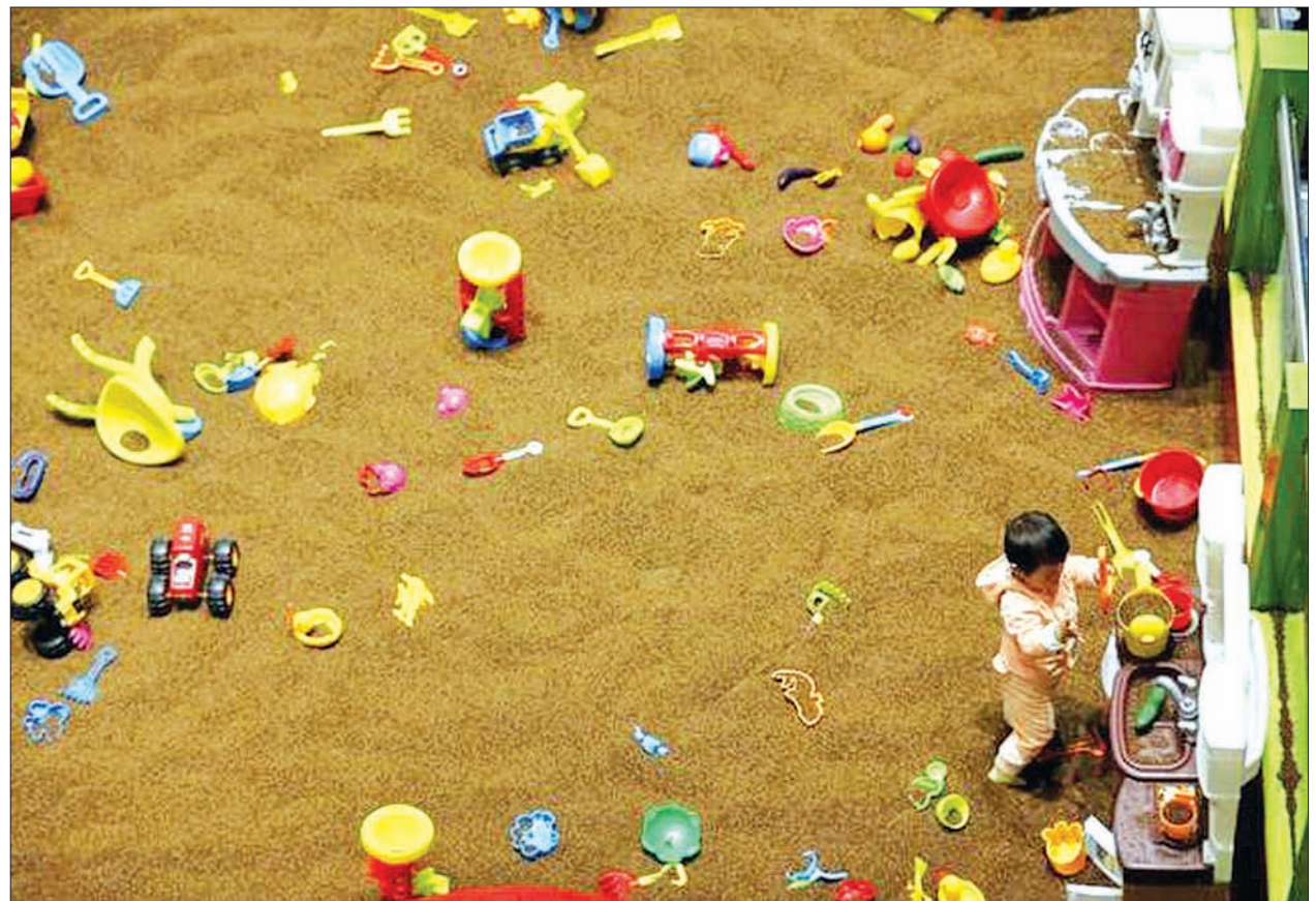
Anan, a two year old girl, plays in an indoor playground in Beijing, China on 30 October 2015.

The adoption of a two-child policy will boost consumer demand for housing, education and health and