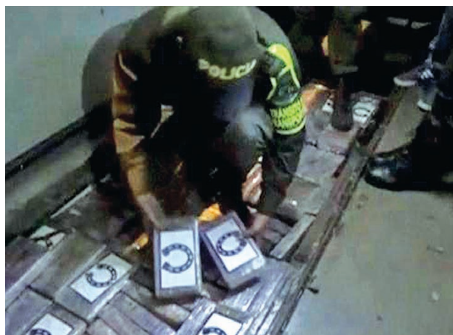
A police officer in Pasto, Colombia, seizes drugs from a bus transporting Colombia fans to a World Cup qualifying soccer match in Chile, on 8 November.

BOGOTA — Colombian police seized 575 kg (1,265 pounds) of cocaine bound for Chile on two buses carrying Colombia fans to a World Cup qualifying football match in Santiago.