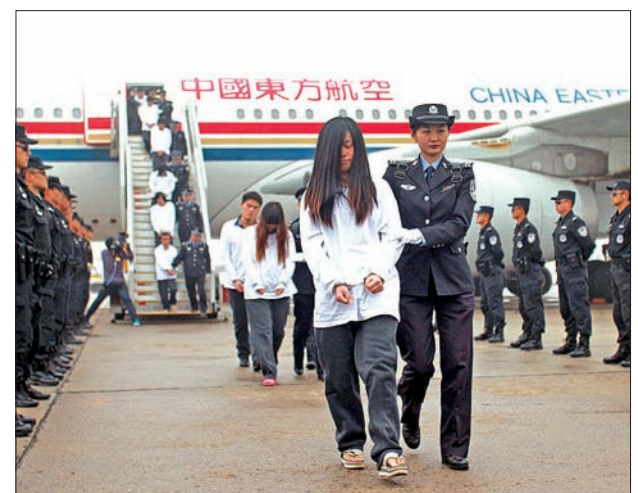
Suspects involved in telecom fraud walk off a plane after being repatriated from overseas, at an airport in Beijing, China, on 10 November 2015.