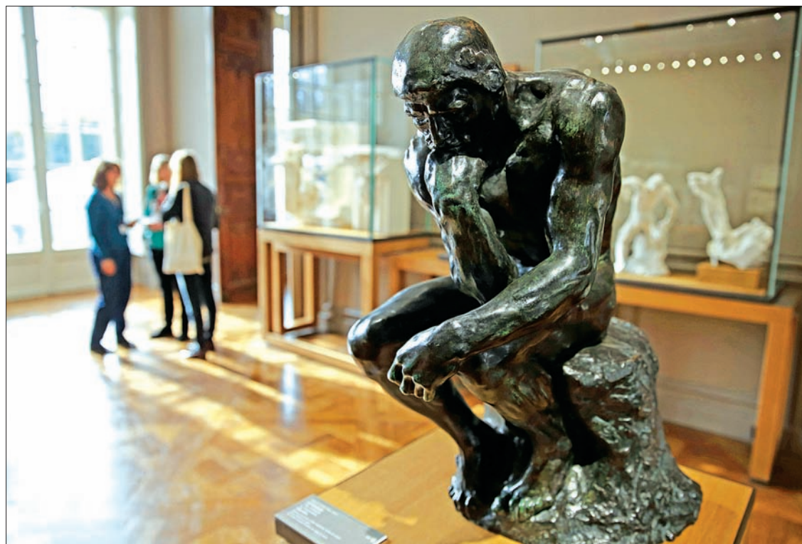
The sculpture 'Le Penseur' (The Thinker, 1881-1882 original size) by French sculptor Auguste Rodin (1840-1917) is seen during a visit at the Musee Rodin in Paris, France.

"We are rather unique among French museums, we own the rights of the artist to continue to make original bronzes." The museum reopens on 12 November, which would have been Rodin's 175th birthday.