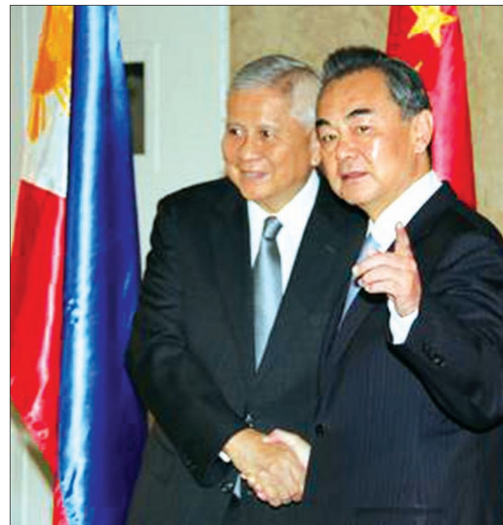
Chinese Foreign Minister Wang Yi (R) shakes hands with his Philippine counterpart Albert del Rosario ahead of their talks in Manila on 10 November, 2015.

MANILA — The foreign ministers of the Philippines and China agreed in talks yesterday not to actively take up the thorny South China Sea issue at a regional summit to be held in the Philippine capital next week.