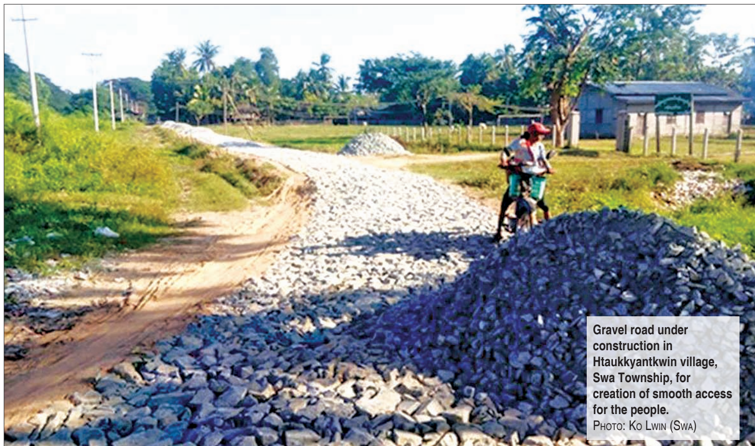
Gravel road under construction in Htautkyantkwin village, Swa Township, for creation of smooth access for the people.

The road previously connected 20 villages until it was destroyed during the monsoon season, causing a great deal of inconvenience for locals, and in particular, students who need to travel significant distances to attend school. The new road will reduce travel times within the local area.— Ko Lwin-Swa