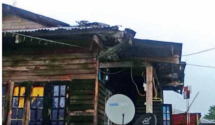
Police station damaged by attack of SSA (Wanhaing Group) in Mongnawng.

The SSA group attacked the Tatmadaw camp from residential