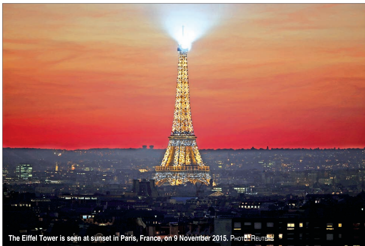
The Eiffel Tower is seen at sunset in Paris, France, on 9 November 2015.

"A lot of ministers are not happy that the text is