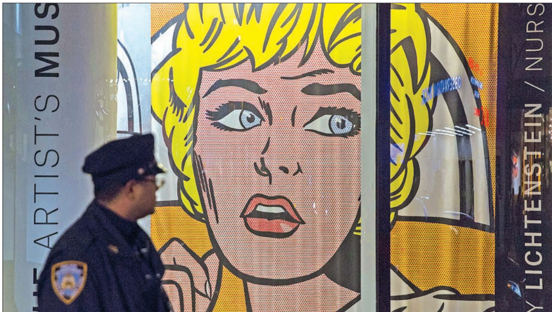
A New York police officer stands beside Christie's window featuring Roy Lichtenstein's 'Nurse' before the commencement of a curated evening auction called 'The Artist's Muse' in Manhattan, New York, on 9 November.

In a packed salesroom marked by deliberate but determined competition, bidding started at $75 million — already more than Modigliani's auction record of $70.7 million — and ticked upwards in $5 million increments before an unidentified telephone bidder prevailed at $152 million. The final price was $170,405,000 including Christie's commission of just over 12 percent. The auction house had estimated the canvas would fetch more than $100 million.