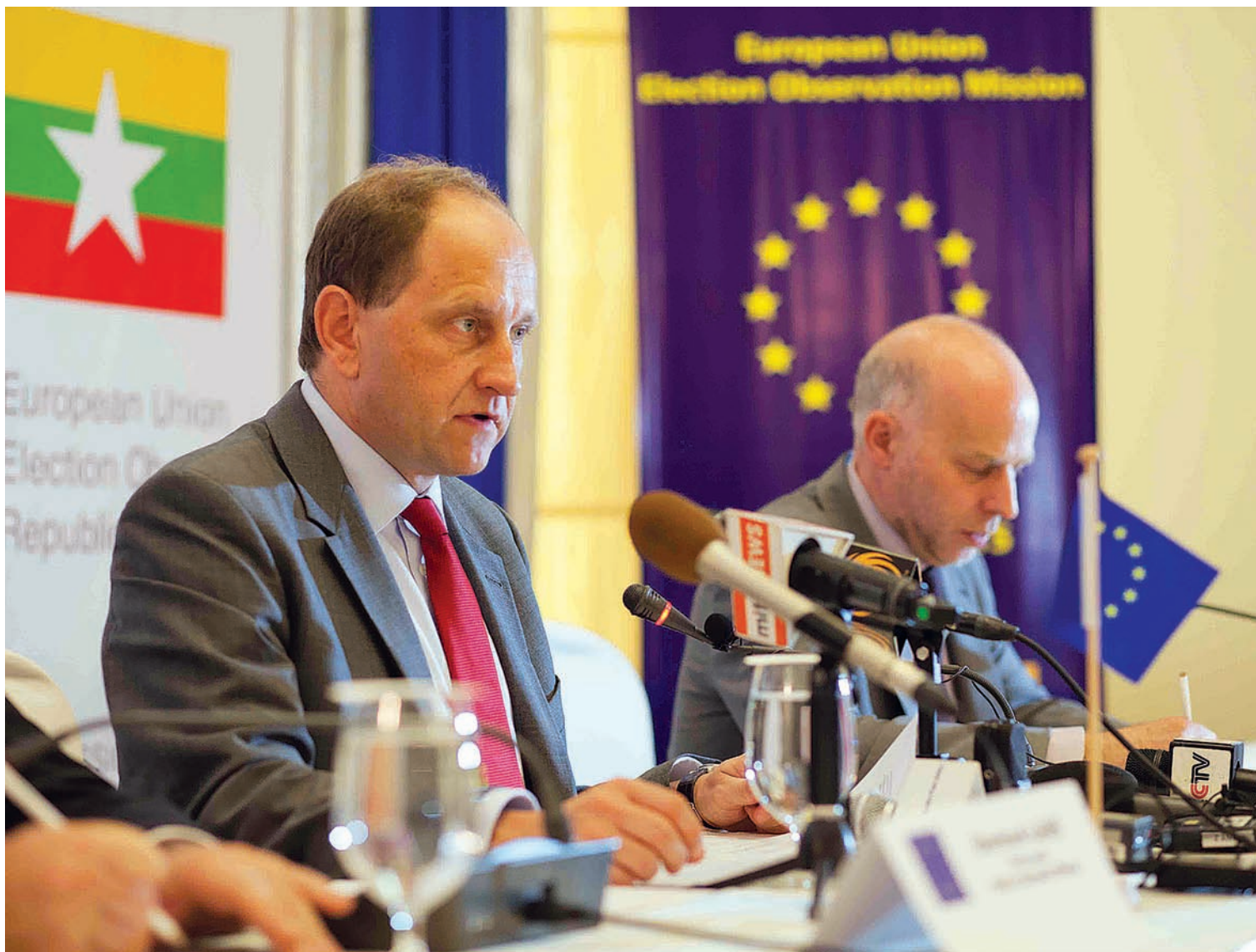
Chief Observer Alexander Graf Lambsdorff in the press conference in Yangon.