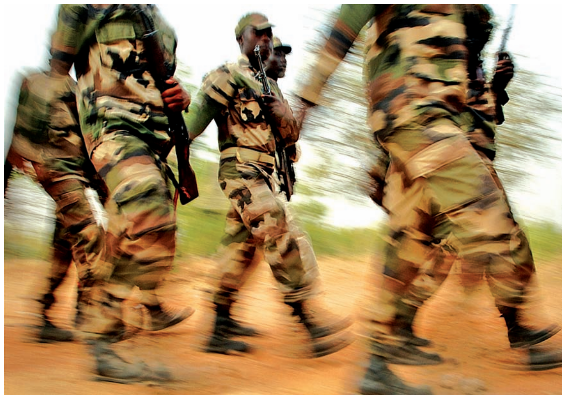
A formation of Nigerian soldiers from the 322 nd Parachute Regiment march to a training site where they will learn combat skills from US Army soldiers from 1 st Battalion, 10 th Special Forces Group (Airborne) home-based in Stuttgart, Germany, during Operation Flintlock 2007.

Hake's narrative is that his NGO links well-meaning US troops in global hotspots with the generosity of the American people. Field representatives, all ex-servicemen, work with the soldiers as "embedded venture capitalists". Their job is to understand