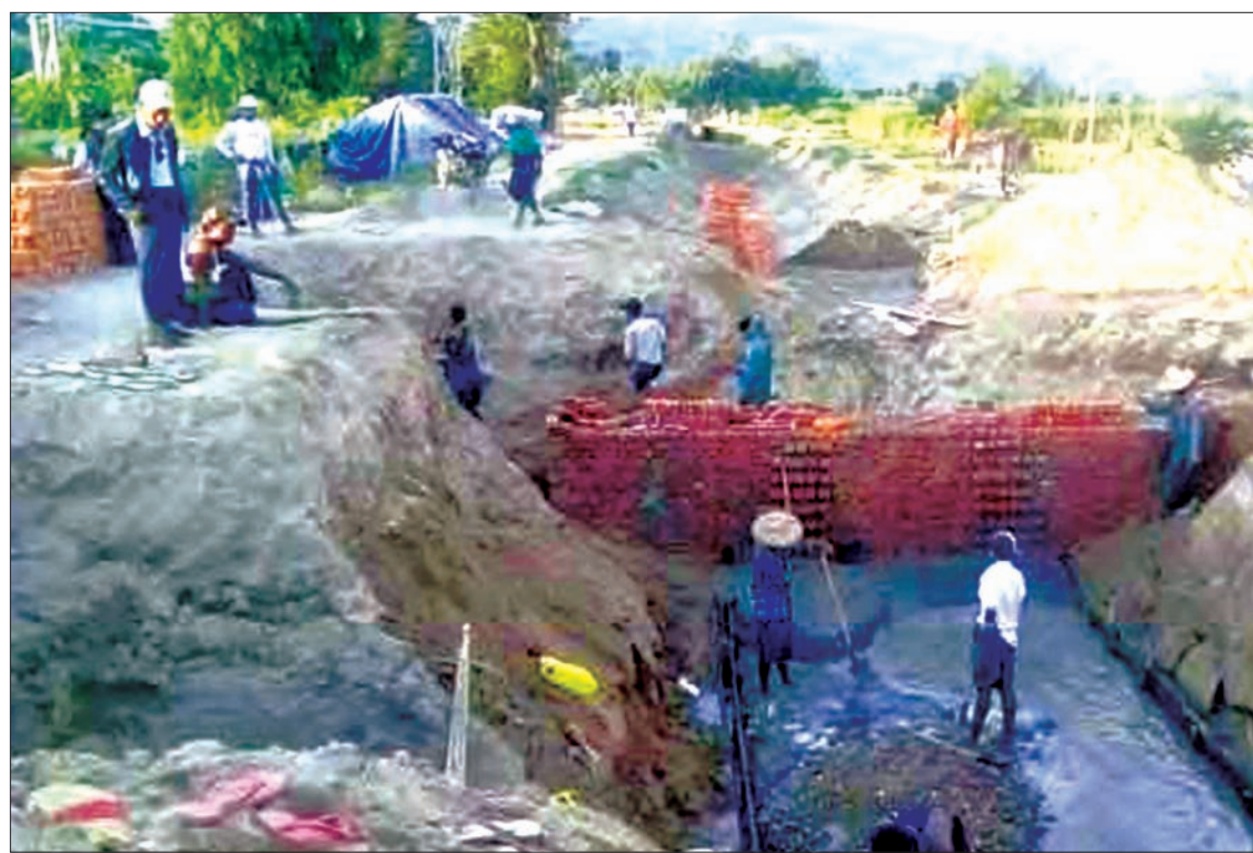
Main canal structure of Tagwin Dam in progress in Hopin Township, Kachin State.

CONSTRUCTION on the main canal of Tagwin Dam in Hopin Township, Kachin State, began on Saturday, according to Irrigation Department official U Kyi