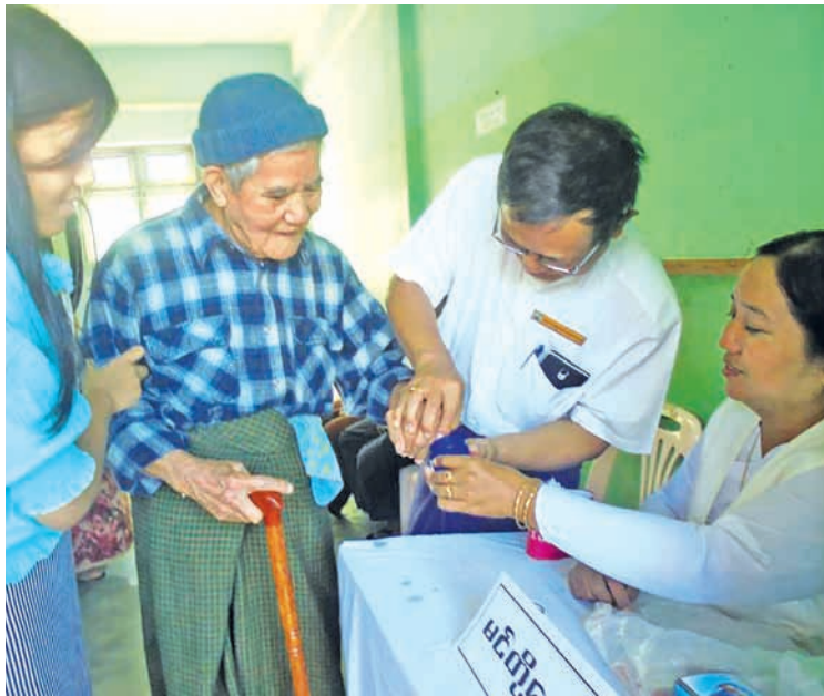
Polling officials help a senior citizen mark his left little finger after voting in Monywa.