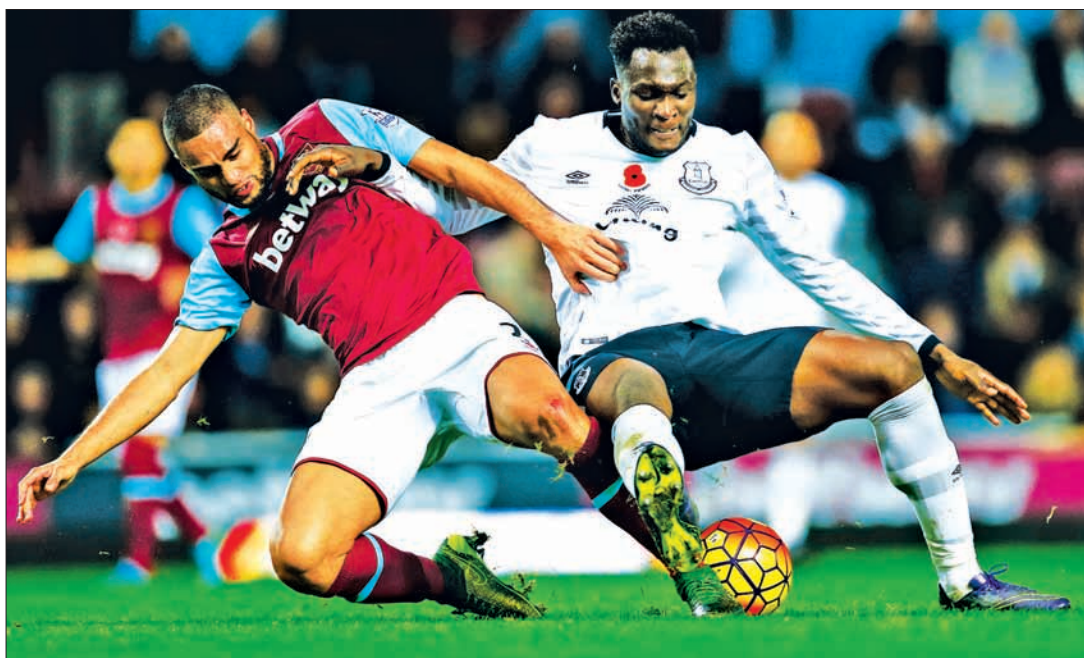
West Ham's Winston Reid in action against Everton's Romelu Lukaku during Barclays Premier League at Upton Park on 7 November 2015.

Lukaku's goal just before halftime was pure class. He ran on to a defence-splitting pass