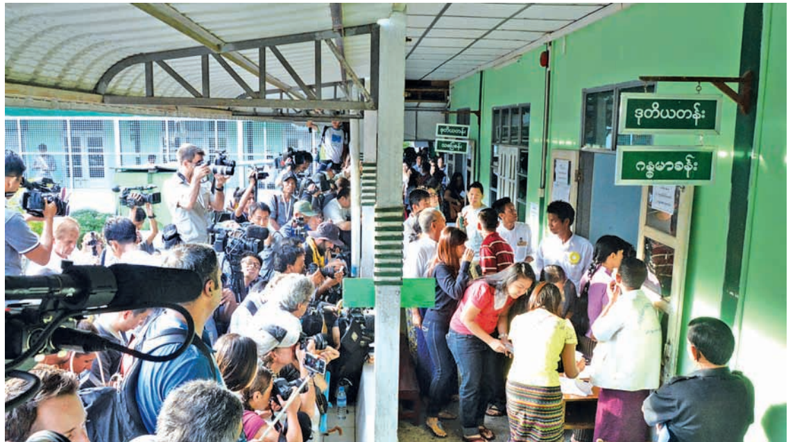
Observers and journalists cover news on voting of people at Basic Education Post-Primary School No 3 in Bahan Township.