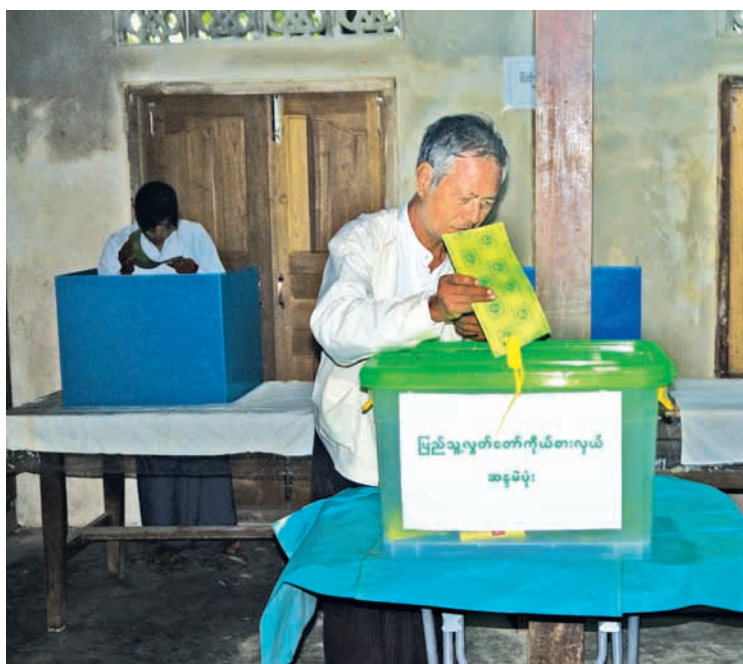
A citizen casting vote into ballot box of Pyithu Hluttaw representatives in ChaungU.