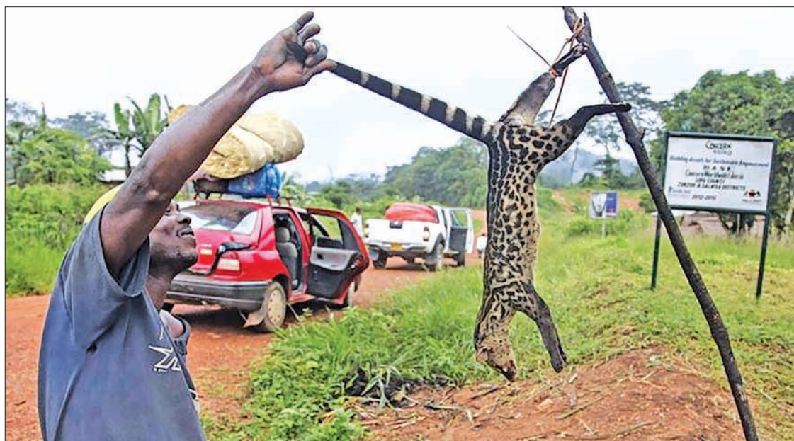
A Liberian man holds out bush meat to sell along Liberia/Sierra Leone border.

However, whether more people will get sick as a result of these shifting disease patterns is not so easy to determine, says Richard Ostfeld, also from the Cary Institute. “There is some evidence to show that as vector-borne diseases spread northwards, they’re also disappearing from really warm places that are getting too warm. There is also