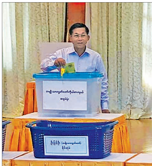
Senior General Min Aung Hlaing casting vote for Amyotha Hluttaw representative in Zeyathiri Township.

THE Commander-in-Chief of Defence Services Senior General Min Aung Hlaing told the media after casting his vote in yesterday's general election that the results will be accepted.