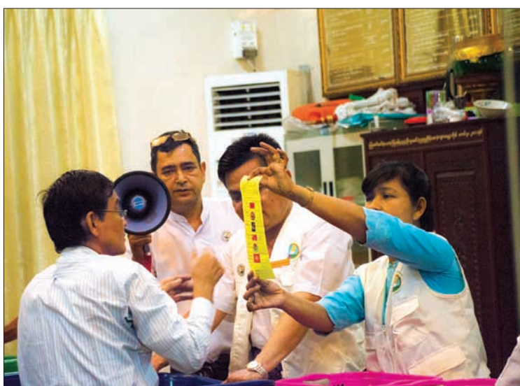
Officials count votes at a polling station in Tamway Township.

Ministry of Foreign Affairs Nay Pyi Taw 8 November 2015