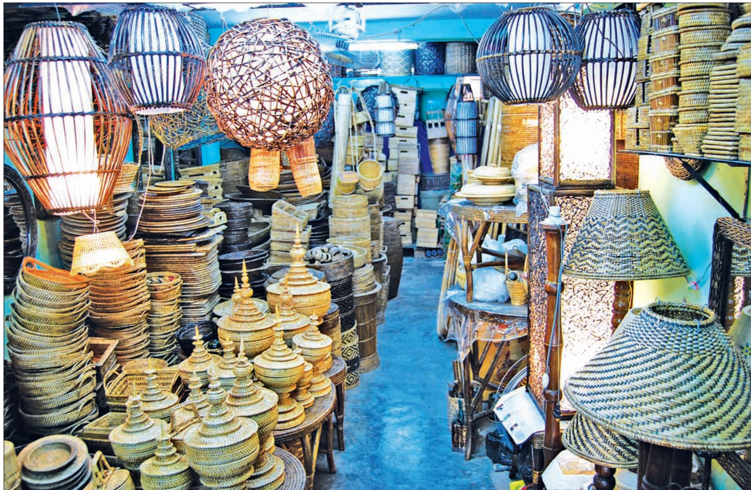
The interior of the shop.

"Most of our merchandise is produced by women from Ayeyawady. The furniture is made by men," he said.