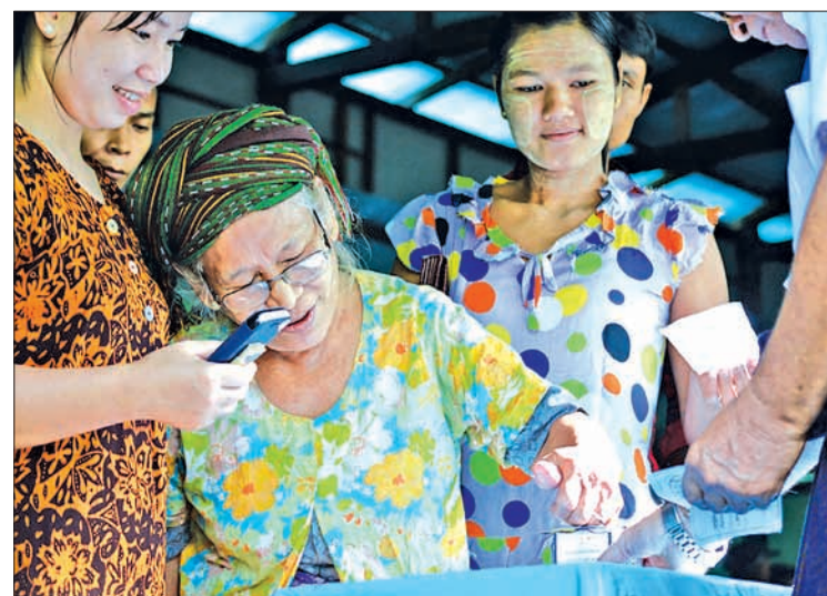
An old woman gets an ink mark on her index finger after voting in Shwepyitha Township on election day.

counting the number of voters who got to the polling booths,” one of them said. “I worried about whether crowds will die down in the late afternoon,” said one of the observers.