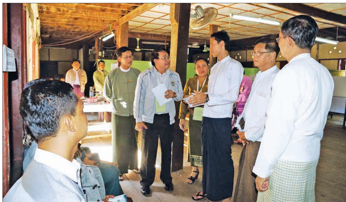
Laotian observers from ASEAN Delegation Visit meets officials of polling station in Meiktila.