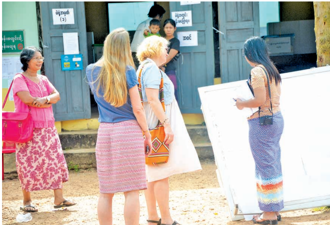
Norwegian diplomats looking at voter lists announced in front of polling station in Market Ward, Mingaladon Township.