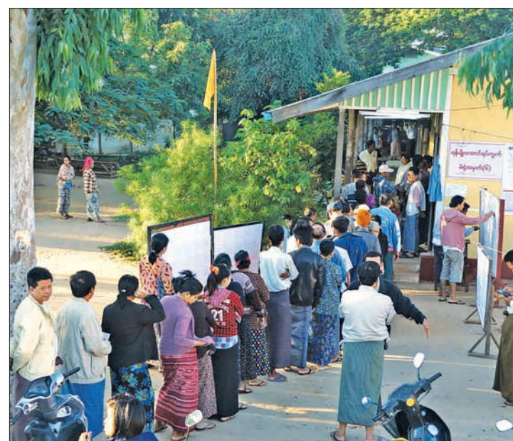
People in queue waiting for their turn to vote at polling station in Meiktila.