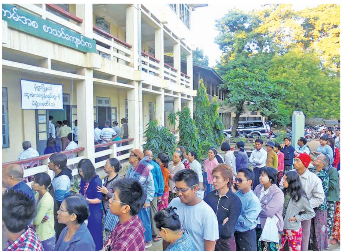
Local people waiting for voting at basic education school in Sulegon Ward, Monywa Township.