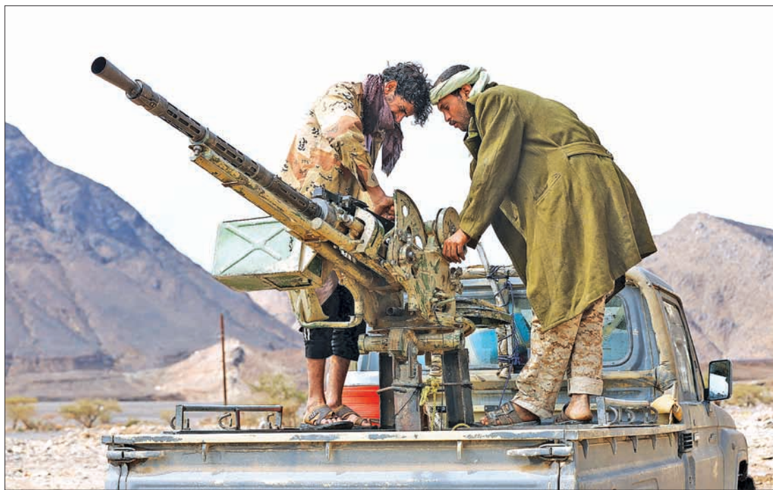
Fighters loyal to Yemen's government prepare a machine gun on a truck at the frontline of fighting against Houthi fighters in Sirwah, in Yemen's northern province of Marib, on 5 November 2015.

Other residents said without elaborating that anti-Houthi