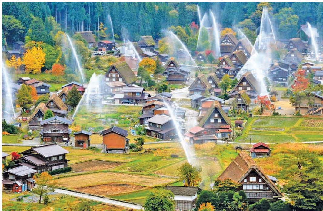
Columns of water reaching up to 30 metres high are discharged over traditional farmhouses during an annual water-discharge drill in the village of Shirakawa in the central Japanese prefecture of Gifu yesterday. The Shirakawa-go and neighbouring Gokayama regions were declared a UNESCO World Cultural Heritage site in 1995 for their farmhouses' steep thatched roofs, designed to withstand heavy snow in winter.