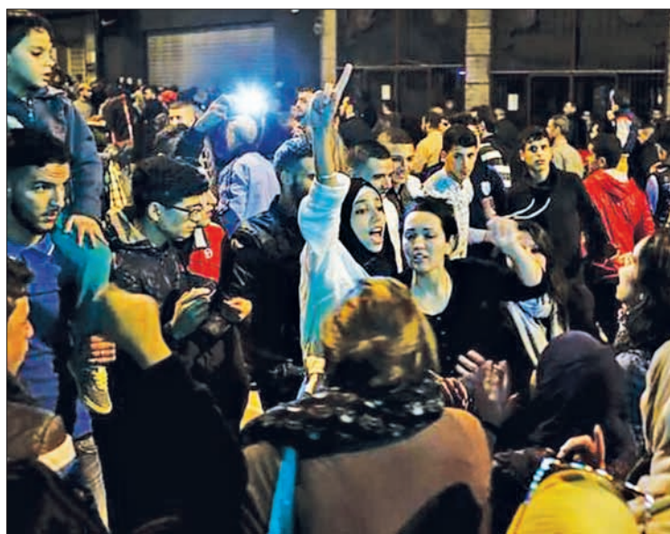
Protesters shout slogans during a demonstration against the power utility company Amendis, for what demonstrators say are the company's high electricity bills, in Tangier on 7 November.

Water, wastewater and electricity businesses in the cities of