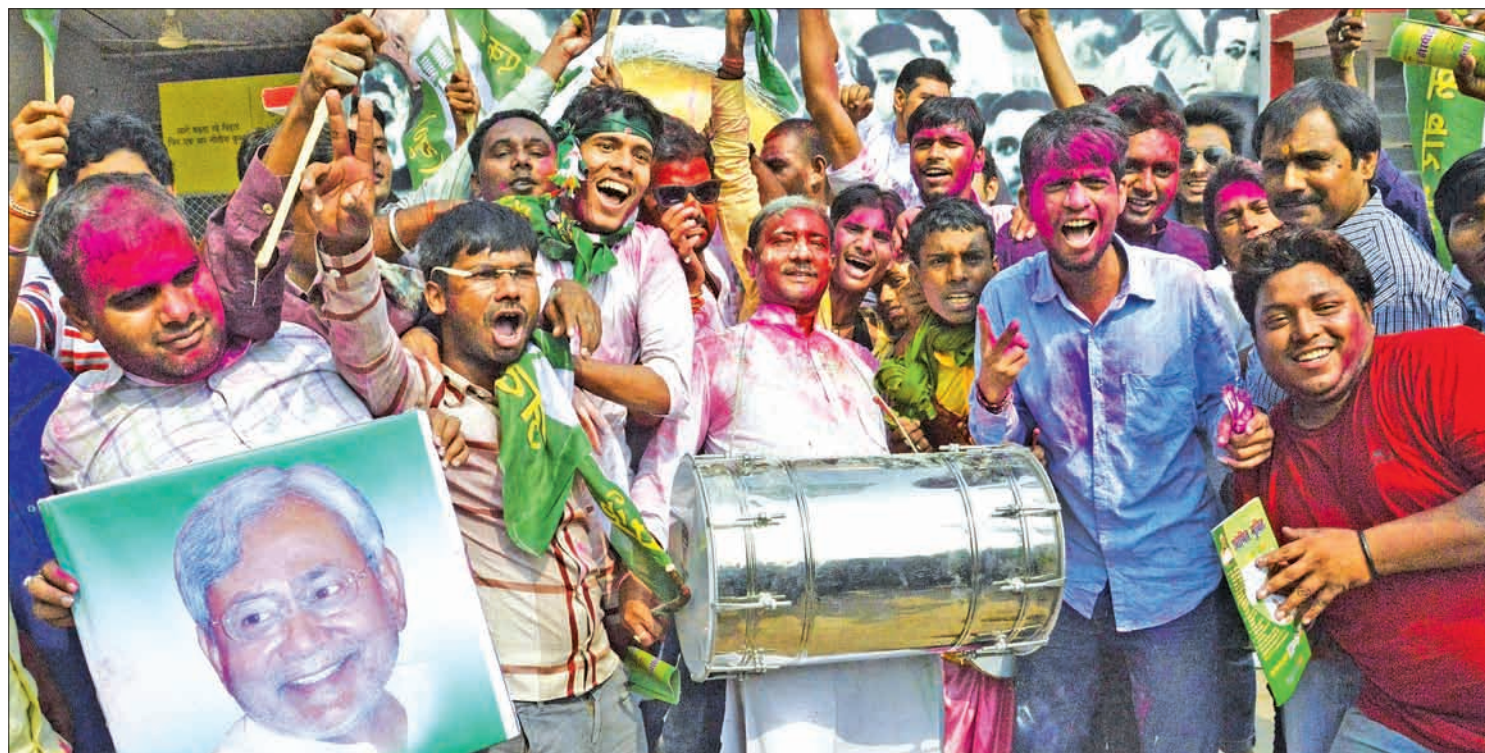
Supporters of the Janata Dal (United) party celebrate after learning of the initial election results at their party office in Patna, India.

NEW DELHI — Prime Minister Narendra Modi was heading for defeat yesterday in a key election in India's big state of Bihar, signalling the waning power of a leader who until recently had an unrivalled reputation as a vote winner.