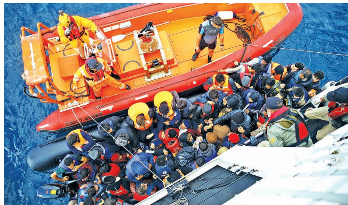
Refugees and migrants embark to Turkish Coast Guard Search and Rescue ship Umut-703 off the shores of Canakkale, Turkey, after a failed attempt to cross to the Greek island of Lesbos, on 7 November 2015.

Tusk is due to dine with Merkel on Sunday in Berlin ahead of an EU-Africa summit in Malta on Wednesday and EU leaders meeting on refugees on Thursday.—Reuters