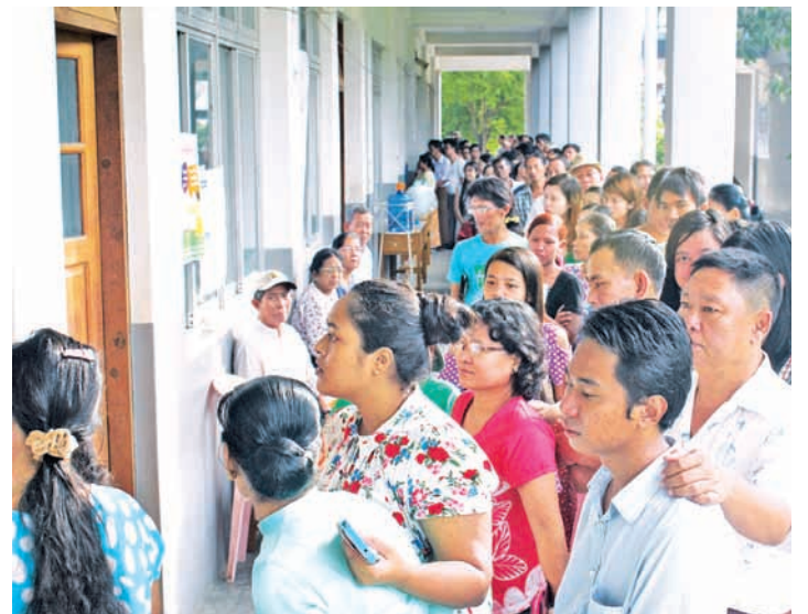
Local people in queue waiting for voting at polling station in Mayangon Township.