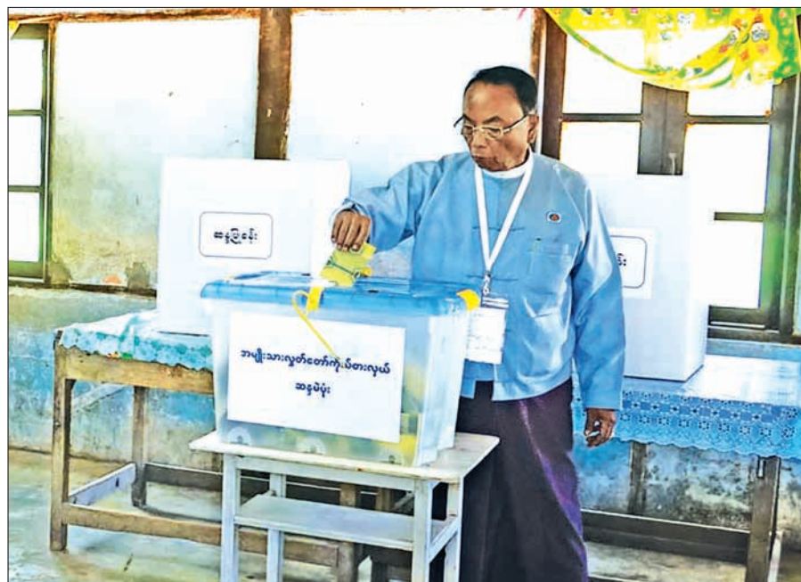
Speaker of Amyotha Hluttaw U Khin Aung Myint casts vote in general elections in Pyidawtha Ward in Pyawbwe Township.