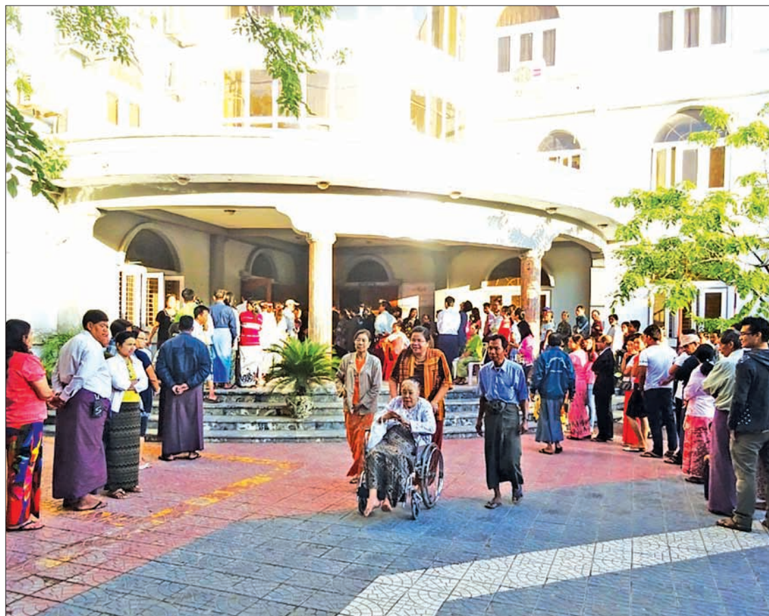
A voter with disability by wheelchair comes back from polling station after voting in Mandalay District on election day. PHOTO: THIHA KO KO

Media personnel were granted access to polling stations at the Central Command Headquarters in Nanmyo (Royal City) and Pyin Oo Lwin Station.— Thiha Ko Ko