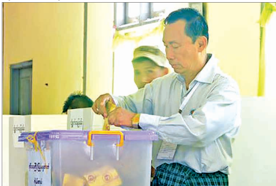
Speaker Thura U Shwe Mann casts vote for Hluttaw representative in Kanyutkwin of Pyu Township.