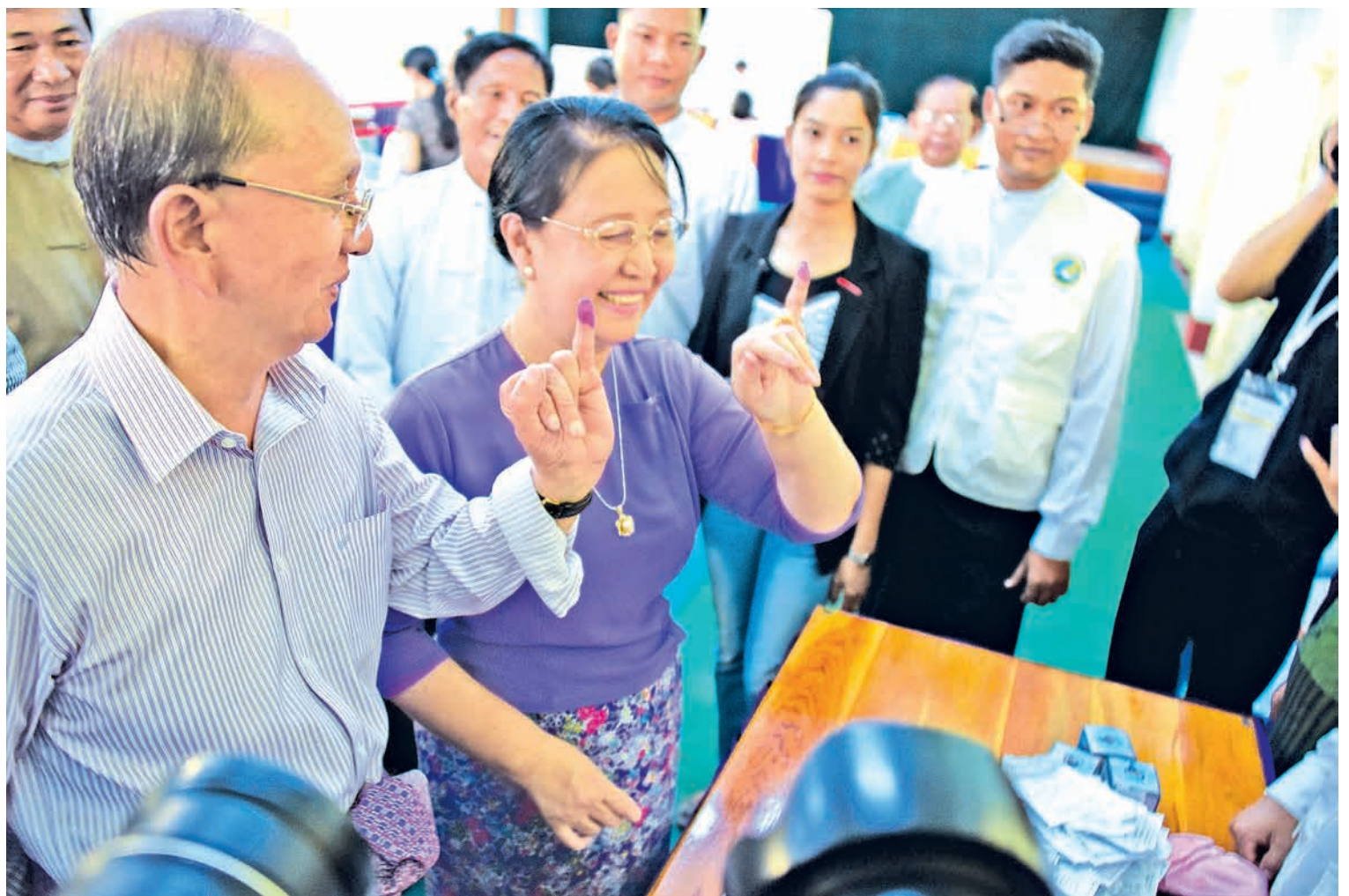
See page 3 >> President U Thein Sein and his wife Daw Khin Khin Win smile after casting their votes in Nay Pyi Taw.

Local and foreign election observers, along with diplomats and journalists, were present to observe voting at polling stations across the country.