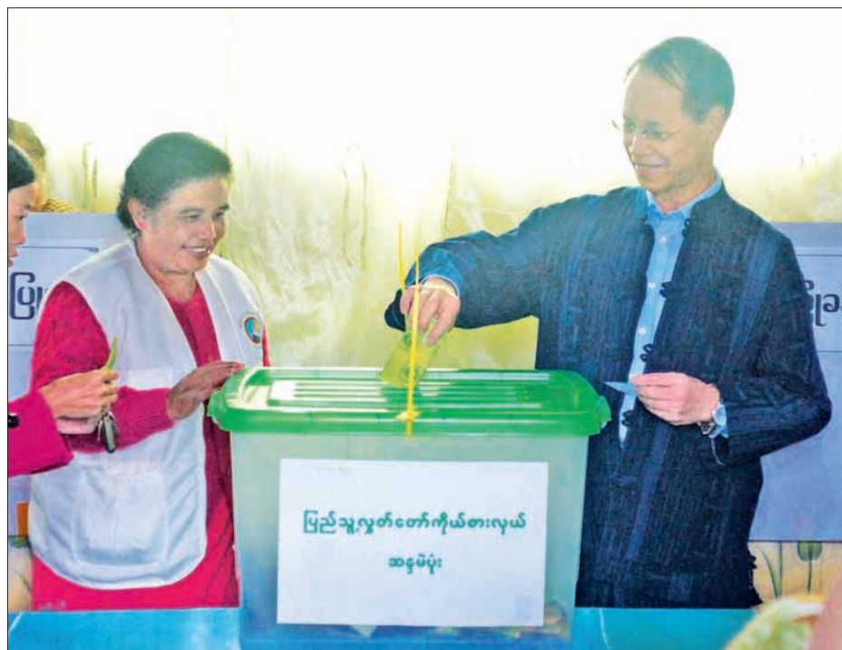
Vice President Dr Sai Mauk Kham casting vote into ballot box of Pyithu Hluttaw representatives in Lashio.

Speaker of Pyithu Hluttaw (Lower House) Thura U Shwe Mann and his wife cast votes in Kanyutkwin, Pyu Township, while the Speaker of Amyotha Hluttaw (Upper House) U Khin Aung Myint cast their votes at a polling station in Pyidawtha Ward, Pyawbwe Township.