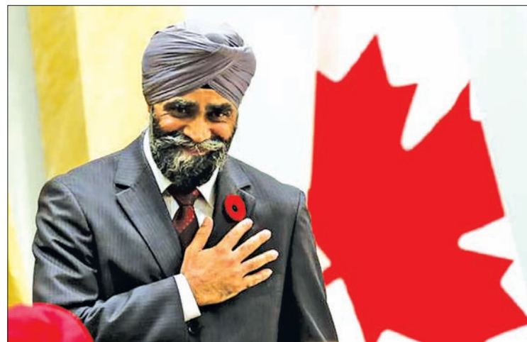
Canada's new National Defence Minister Harjit Sajjan gestures after being sworn-in during a ceremony at Rideau Hall in Ottawa, Canada, on 4 November 2015.

ficer in Vancouver for 11 years, which included working as a detective in the gang crime unit. He won the riding of Vancouver