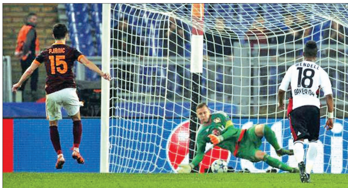
AS Roma's Miralem Pjanic (L) shoots and scores a penalty kick past Leverkusen's goalkeeper Bernd Leno during their Champions League Group E soccer match at Olympic stadium in Rome, Italy on 4 November 2015.

ROME — AS Roma squandered a two-goal lead but recovered to beat Bayer Leverkusen 3-2 following a late Miralem Pjanic penalty on Wednesday to move into second place in Champions League Group E. The Italian side moved on to five points, five behind leaders Barcelona and one ahead of third-placed Leverkusen following their first win of the group stage. Roma exposed the visitors' defensive frailties with goals from Mohamed Salah and Edin Dzeko inside the first half hour, but Leverkusen levelled six minutes into the second period after a quickfire double from Admir Mehmedi and Javier Hernandez.