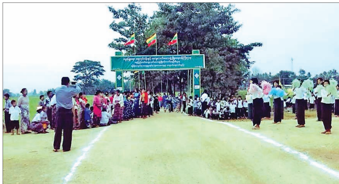
The opening ceremony of entrance road in progress in Yondaw village of Lewe Township.