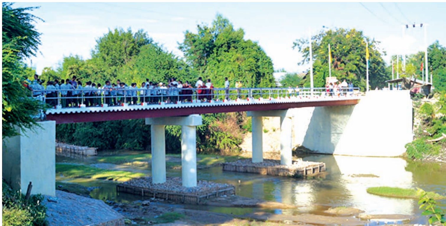
Local people strolling along new bridge crossing Nawin Creek in Tatkon Township.

The bridge has a capacity of 10 tonnes. The bridge is 38 metres long and 4 metres wide and traverses the Nawin Creek.— Tin Soe Lwin (IPRD)