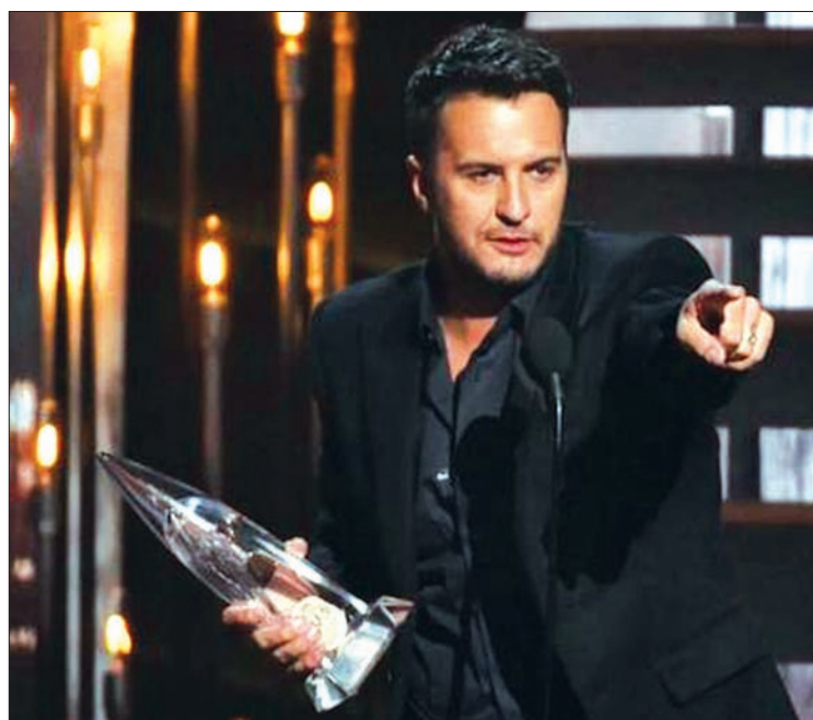
Luke Bryan accepts the award for Entertainer of the Year at the 49th Annual Country Music Association Awards in Nashville, Tennessee, on 4 November 2015.

The top award at the three-hour, performance-heavy ceremony broadcast live on ABC televi-