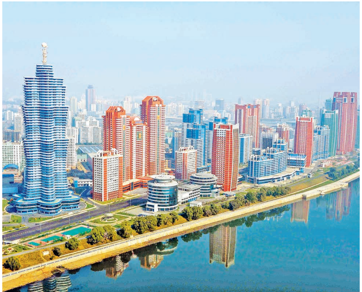
A view of the completed Mirae Scientists Street, in this undated photo released by North Korea’s Korean Central News Agency (KCNA) in Pyongyang on 21 October 2015.

“The plan to use Air Koryo helicopters and