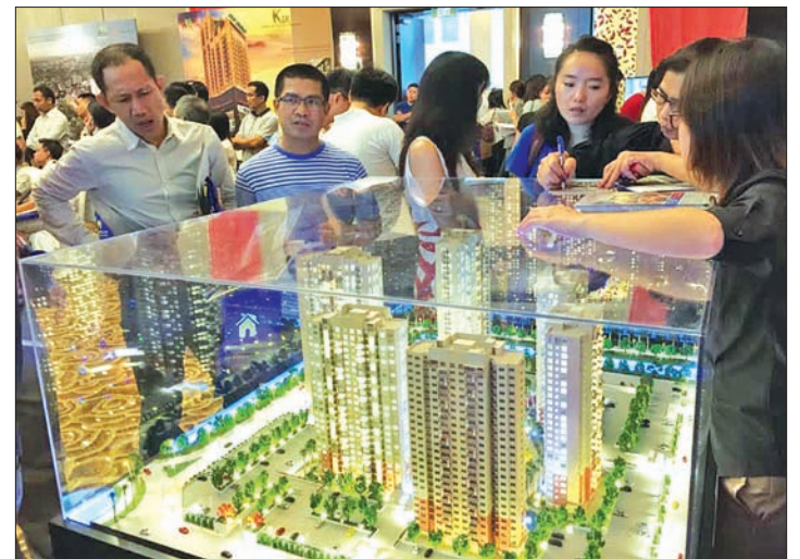
Visitors view scale model of housings at real estate expo.

Twelve Myanmar construction companies exhibited properties at discounted prices at the expo, which was attended by more than 5,000 people.— Khaing