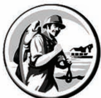
FISHERMAN and cod circle device

in respect of – "Medicinal and pharmaceutical preparations and substances, particularly a unit of medication for oral administration comprising multiples of specialty coated globules each containing an increment of a medicament and providing for the gradual release of the medicament over an extended period of time"