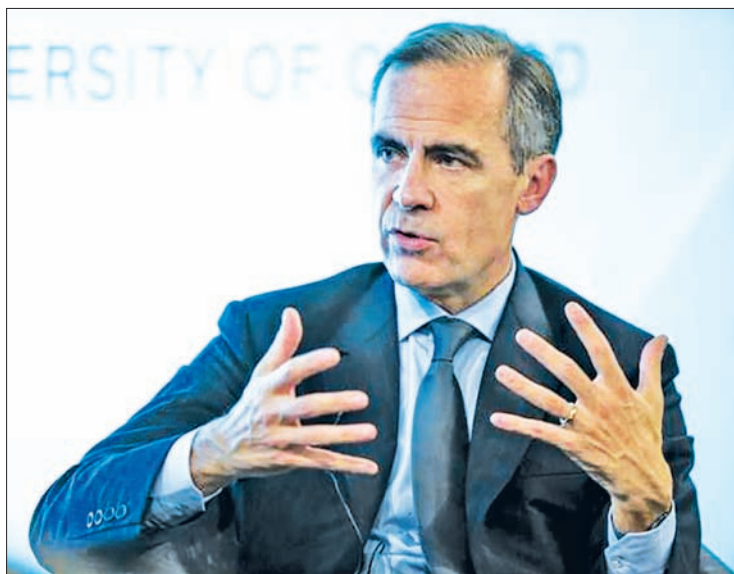
Bank of England Governor Mark Carney.

on when to raise rates would come into "sharper relief" around the turn of the year, but in his most recent media interview the phrase did not appear.