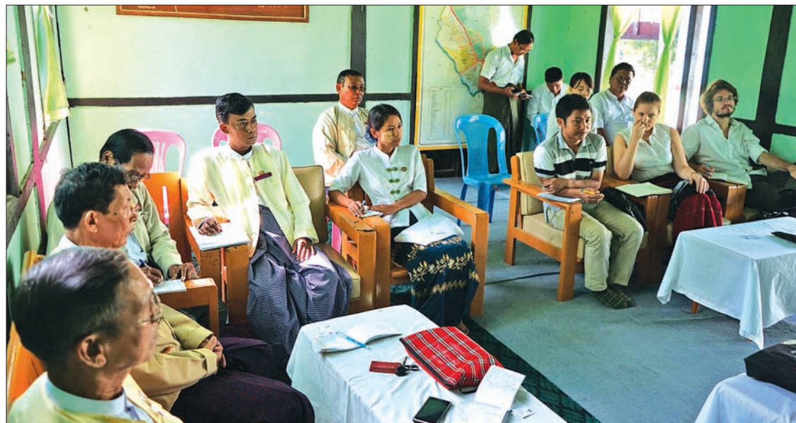
EU's election observers visit Pyawbwe Township Election Sub-commission.