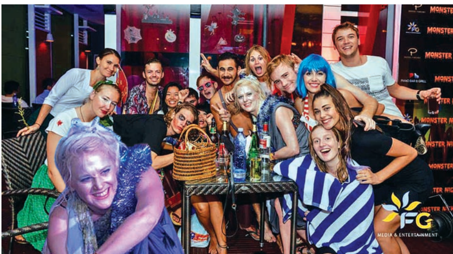
Yangon's finest expats.

Myanmar pop star Ah Moon has come a long way since singing in her dad's church as a child.