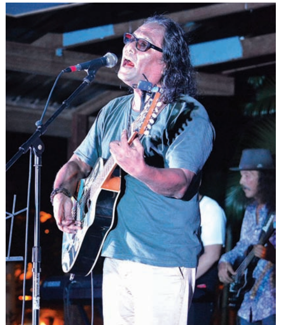
Echo from Raga Music Band

Mya Chemical Free and Bamboo Lovers sold organic food and green furniture in the garden, while street artists improvised on the big stage. A conference featuring the NGOs Green Lotus and Canopée was held in the Rendezvous restaurant. The Institut also screened short films in partnership with Yangon Film School and Tagu Films. The day concluded with a live concert by Raga Music Band.