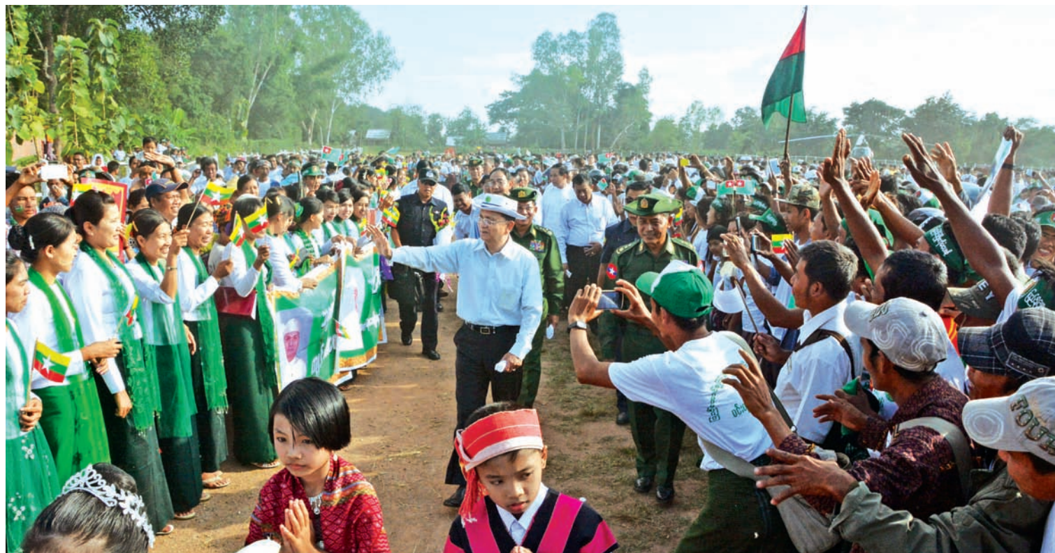
Local people warmly welcomes President U Thein Sein in Mindon.

In Mindon and Kanma, the president visited pagodas and monasteries and donated some