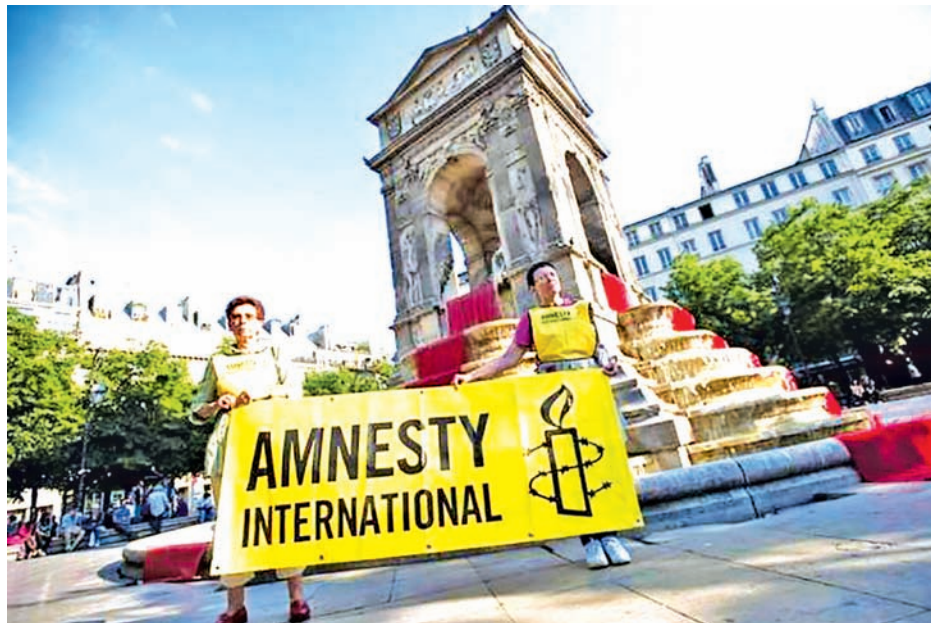
Activists of Amnesty International demonstrate to show their support for the Syrian people at the Fontaine des Innocentes in Paris.

Syria’s uprising started in 2011 with protests against