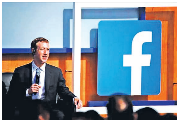
Facebook CEO Mark Zuckerberg.

And Facebook's website and Instagram photo-sharing app, which opened up its platform to all advertisers in the