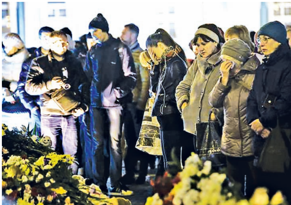
People mourn as they arrive at Dvortsovaya Square to commemorate victims of the air crash in Egypt in St Petersburg, Russia, on 3 November 2015.

The ministry said the second black box, which contains the cockpit voice recorder, was partially damaged and much work was required to extract data