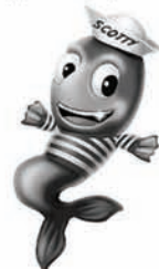
SCOTTY FISH device (2013 version)

in respect of – Class 5: "Pharmaceutical preparations and substances; vitamins, minerals and food supplements; dietetic foods and drinks adapted for medical use"