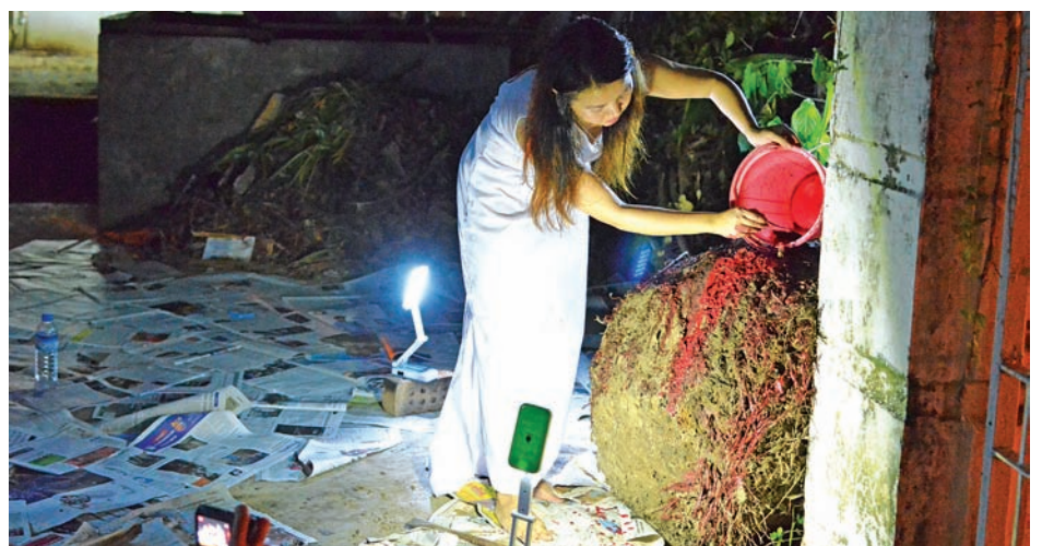
Performance artist Yadanar Win, famous for subverting gender roles.