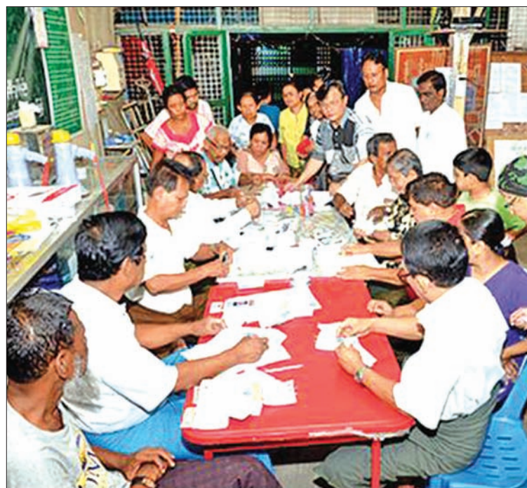
Officials of ward election sub-commission issue tickets to local voters.

IN order to save voters' time while casting votes on election day, cards that guarantee the right to vote have been issued in 20 wards in Mingala Taungnyunt Township, Yangon Region, since 2 November from 8am to 6pm daily.