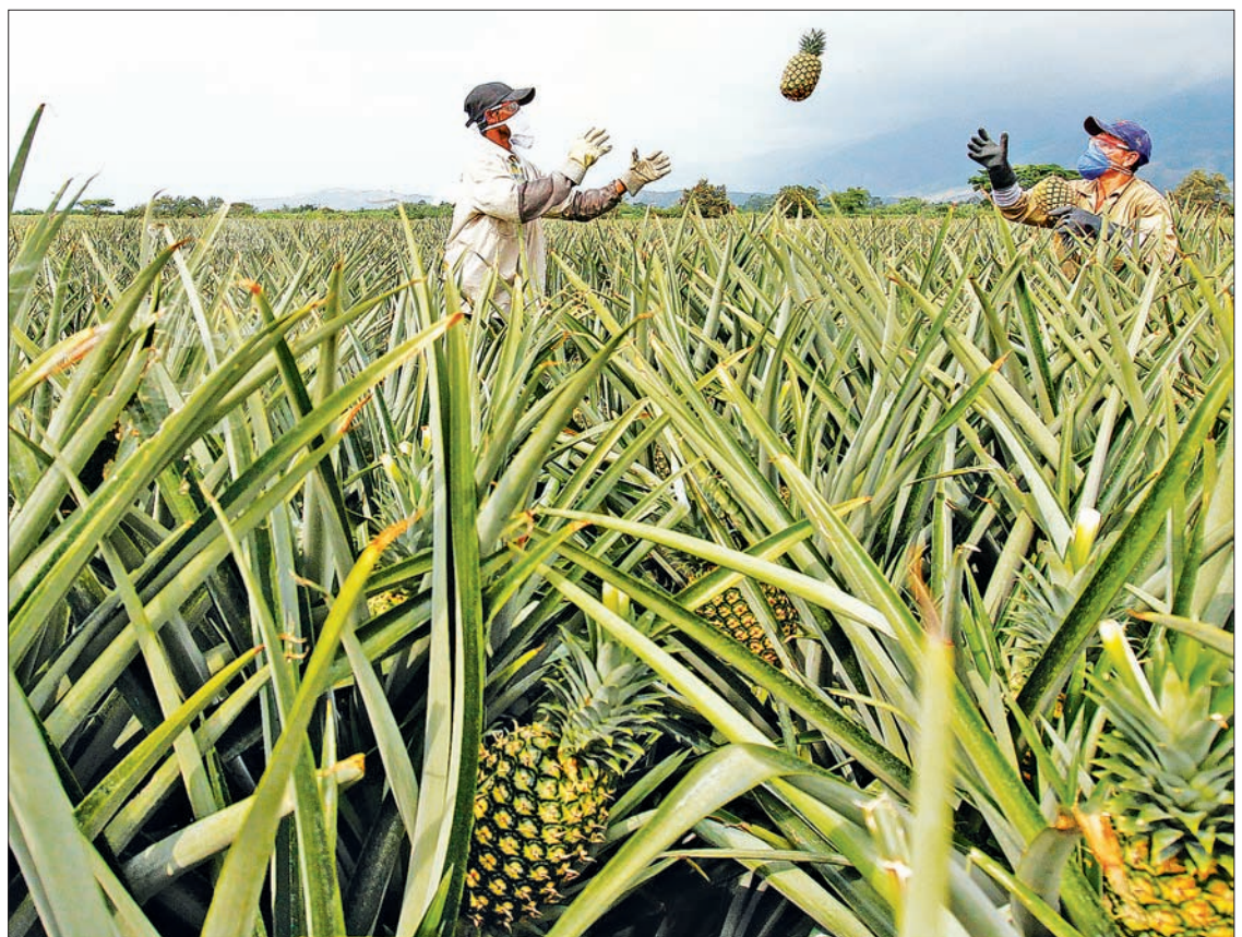
Men work on a crop of pineapples in Pradera.

"As such, CAM photosynthesis applications could hold major significance for the entire food industry," added plant mo-