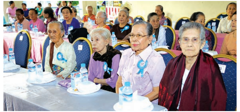
Senior residents of FMI City.