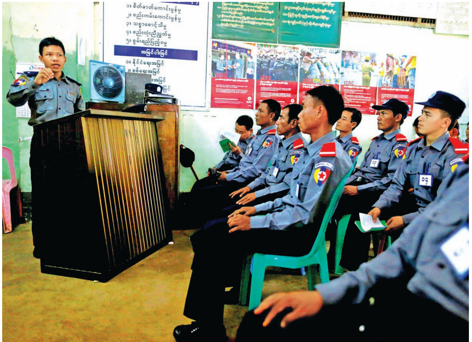
Special police officers, who have been temporarily recruited for the upcoming general elections, attend a training session at Botahtaung police station at Yangon October 26, 2015.

The Ministry of Home Affairs has ordered the police force to be on full alert from the beginning to the middle of November across the country.