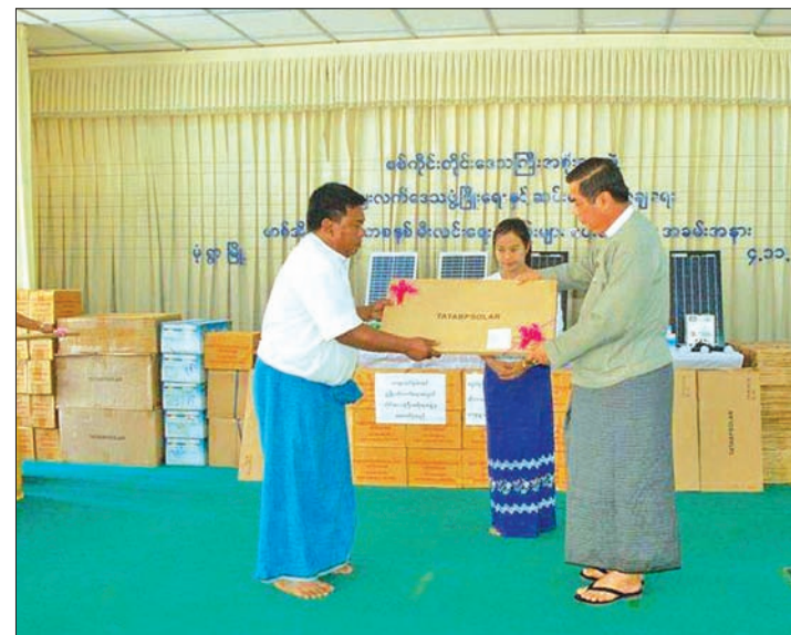
Chief Minister of Sagaing Region U Tha Aye presents solar panels to local people.

THE Sagaing Region government presented over 5,000 solar panels to 112 villages in 10 townships, including Monywa, Budalin, Wuntho and Khin-U on 4 November.