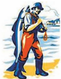
FISHERMAN and cod device (2013 version) (in color) (blue/orange)