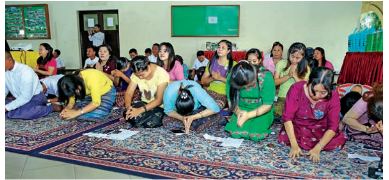
Audience paying respect to the seniors.