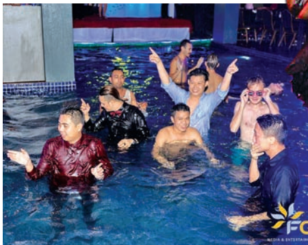
Some people left their costumes in the pool.