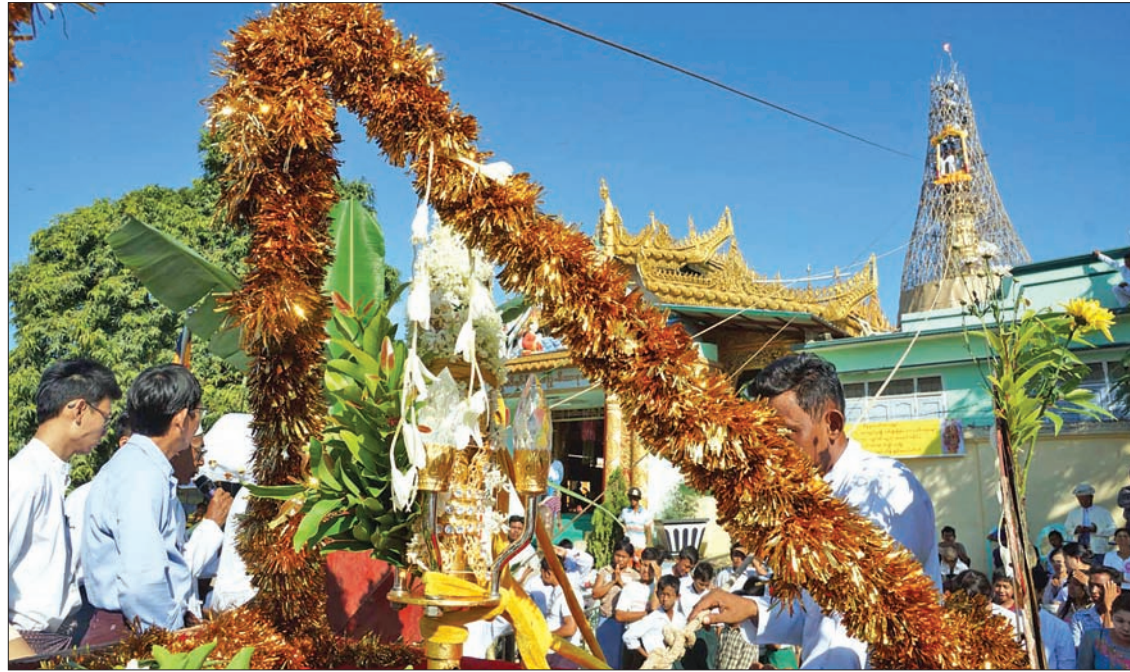
Officials and well-wisher fix diamond orb atop Shwemyinmi Pagoda in Meiktila.

AN offering of gold foils was held at Maha Thakkyamuni Shwemyinmi Pagoda in Thiri Mingala Ward, Meiktila, Mandalay Region, yesterday.