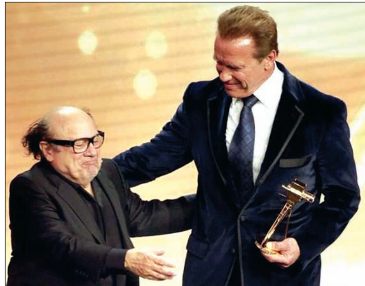
Actor Danny DeVito hands over the award for life's work to Arnold Schwarzenegger at the 'Die Goldene Kamera' (Golden Camera) awards ceremony in Hamburg, on 27 February 2015.

He told The New York Times this year that he felt "very passionate" about the project.—Reuters