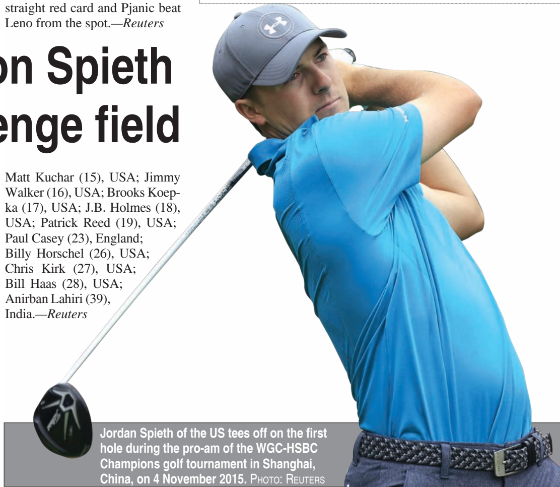
Jordan Spieth of the US tees off on the first hole during the pro-am of the WGC-HSBC Champions golf tournament in Shanghai, China, on 4 November 2015.

Matt Kuchar (15), USA; Jimmy Walker (16), USA; Brooks Koepka (17), USA; J.B. Holmes (18), USA; Patrick Reed (19), USA; Paul Casey (23), England; Billy Horschel (26), USA; Chris Kirk (27), USA; Bill Haas (28), USA; Anirban Lahiri (39), India.—Reuters