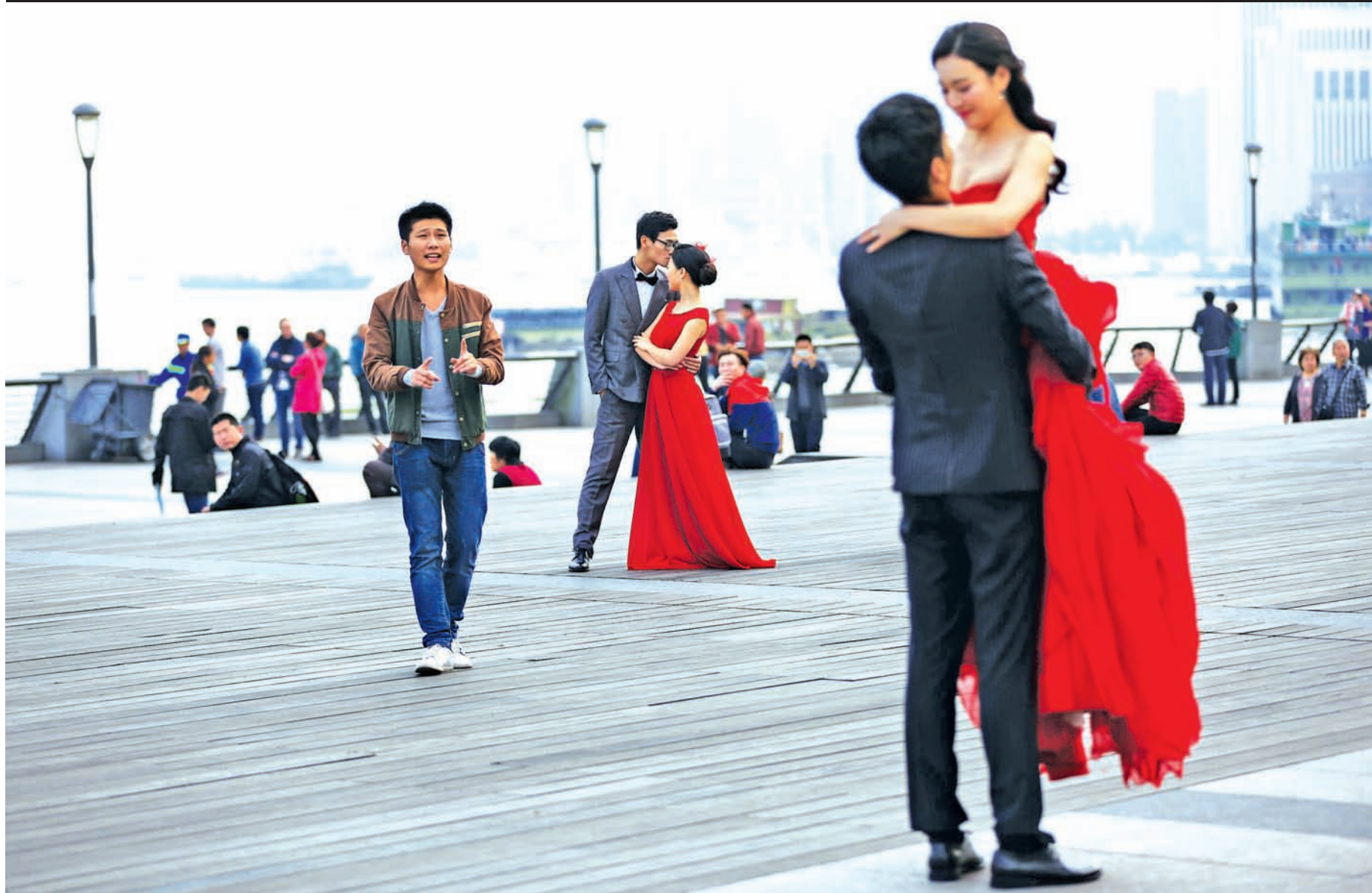
Couples prepare to have their photo taken on the Bund in Shanghai, China, on 3 November 2015.