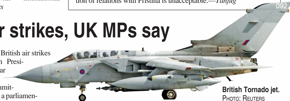
British Tornado jet.

Djuric stated that Belgrade is against Kosovo's UNESCO bid, adding that addressing the issue of cultural and historical heritage and the Serbian Orthodox Church outside the dialogue on normalization of relations with Pristina is unacceptable.—Tanjug