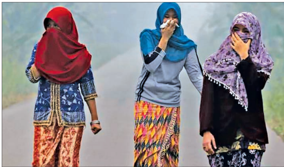
Villagers walk on a street as the haze shrouds Pulau Mentaro village in Muaro Jambi, on the Indonesian island of Sumatra.

More than 650 million people around the world live without access to clean water and 1.2 billion live in areas of water scarcity, WaterAid said, citing United Nations' figures. They will become even more vulnerable as their already scarce resources are further exposed to climate-related threats, WaterAid said.—Reuters