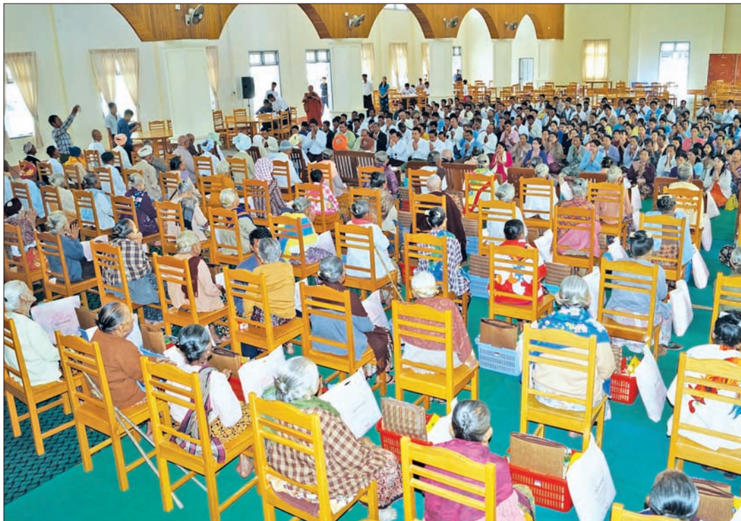
Local people pay respect to older persons in Tatkon.