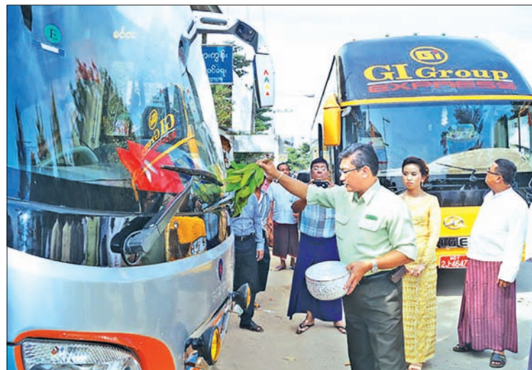
Deputy Commissioner U Lwin Ko Oo sprinkles scented water on express bus of GI group before its maiden trip.

World Diabetes Day is the primary global awareness campaign for diabetes around the world. It is held on November 14 each year and was first introduced in 1991.— Thiha Ko Ko