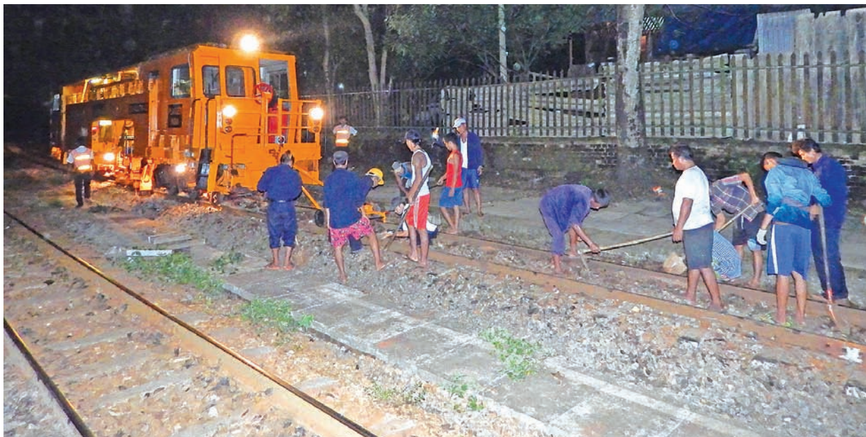
Engineers and workers of Myanma Railways upgrade railroad section on Yangon-Mandalay rail line.