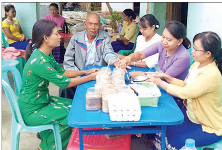
Health staff provide healthcare services to local people in Ottarathiri Township.

Medical teams from the capital's traditional hospital routinely visit communities to offer their services, said a hospital staff.— Shwe Ye Yint