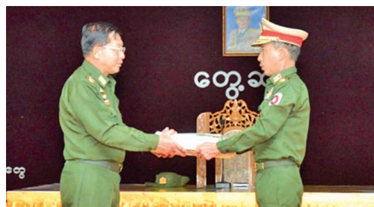
Senior General Min Aung Hlaing presents books to a senior military officer.

The commander-in-chief of defence services urged the Tatmadawmen to elect Hluttaw representatives who can join hands with the Tatmadaw in achieving regional development goals. He said that in Rakhine State, MPs should feel