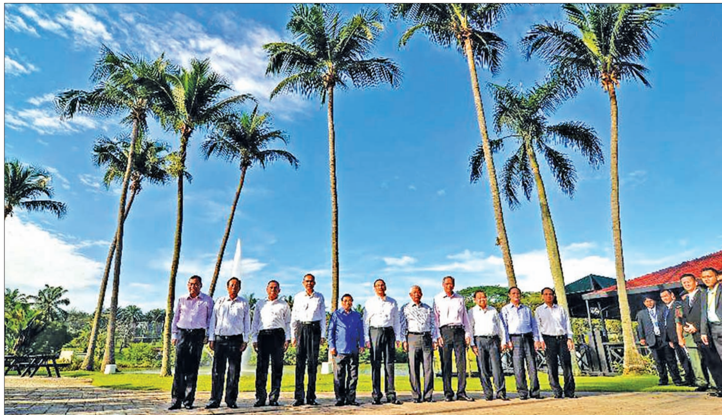
Delegates pose for a group photo before the opening of the ASEAN (the Association of Southeast Asian Nations) Defence Ministers' Meeting (ADMM) Retreat in Subang, Malaysia, on 3 November 2015.

SUBANG — The ASEAN (the Association of Southeast Asian Nations) Defence Ministers' Meeting (ADMM) Retreat and the Third ADMM-Plus will kick off here from 2 to 5 November, with the attendance of delegates from 10 ASEAN member states, the ASEAN Secretariat and ASEAN Dialogue Partner countries.