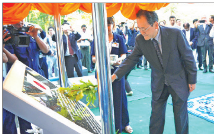
Japanese Ambassador Mr. Tateshi HIGUCHI sprinkles scented water on plaque for handover of non revenue water reduction project in Mayangon Township.

THE Japanese Government, under its Grant Assistance for Grassroots Human Security Projects (GGP) Scheme, has granted US$610,317 for a humanitarian assistance programme "The Project for NRW (Non Revenue Water) Reduction in Mayangon Township, Yangon Region".