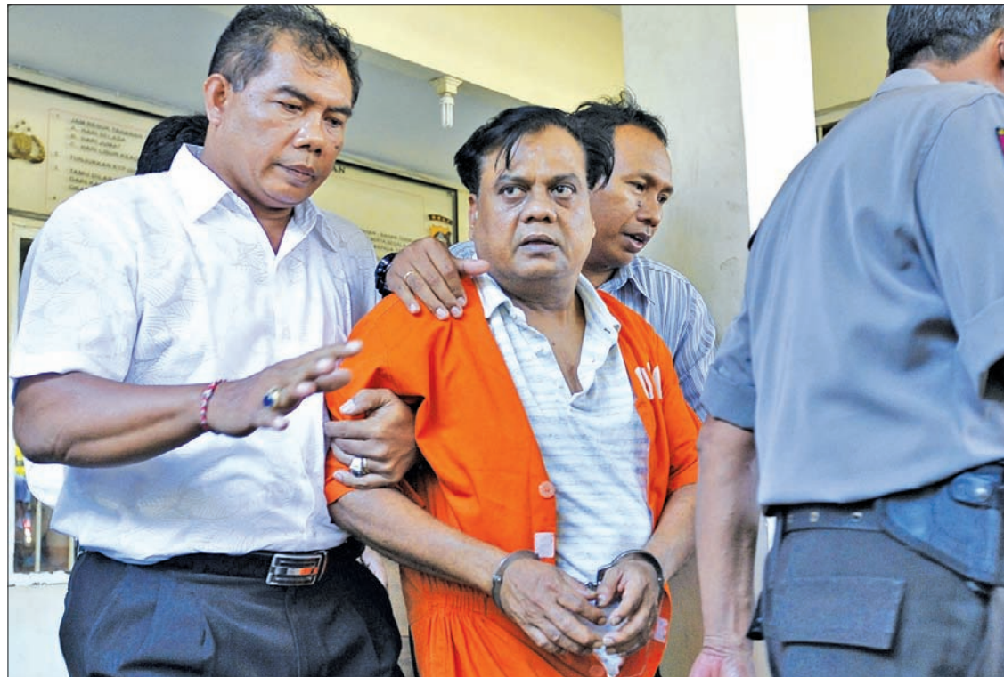
Police escort Indian gangster Rajendra Nikalje, widely known as Chhota Rajan, at police headquarters in Denpasar, Bali, on 2 November, 2015.

JAKARTA — Indonesia will deport one of India's most wanted men on Tuesday to face charges in more than two dozen murder cases at home.