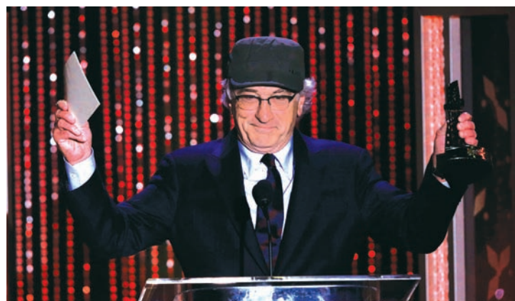
Actor Robert De Niro accepts the Hollywood Career Achievement Award at the Hollywood Film Awards.

BEVERLY HILLS — The movie awards season kicked off on Sunday with the 19 th annual Hollywood Film Awards, honoring performances from released as well as upcoming films.