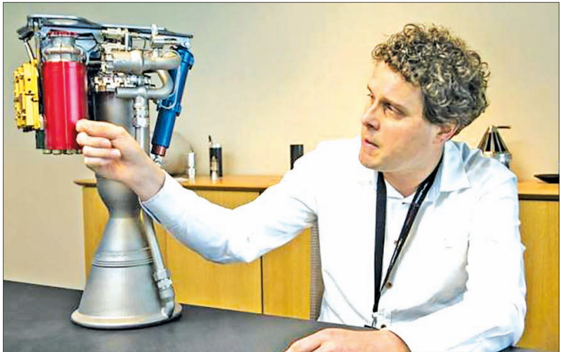
Rocket Lab CEO Peter Beck speaks alongside a Rutherford rocket engine in Auckland, New Zealand, on 20 October 2015.

"We're not about building a rocket; we're about enabling the small satellite revolution," said Rocket Lab's Beck.