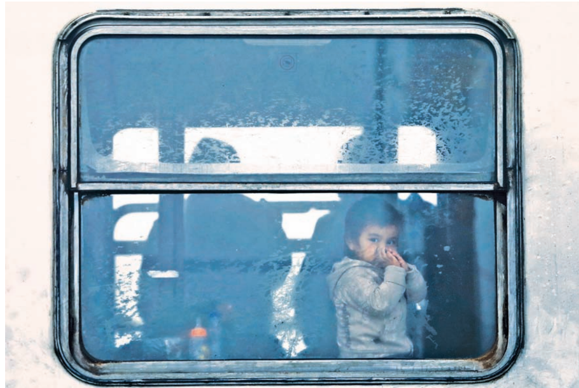
A migrant child looks through a train window at a new winter refugee camp in Slavonski Brod, Croatia, on 3 November 2015.

VIENNA — Austria's cabinet proposed a bill on Tuesday to deter Afghan migrants from coming to the country located along a major migration route across Europe and facing record numbers of asylum requests this year.