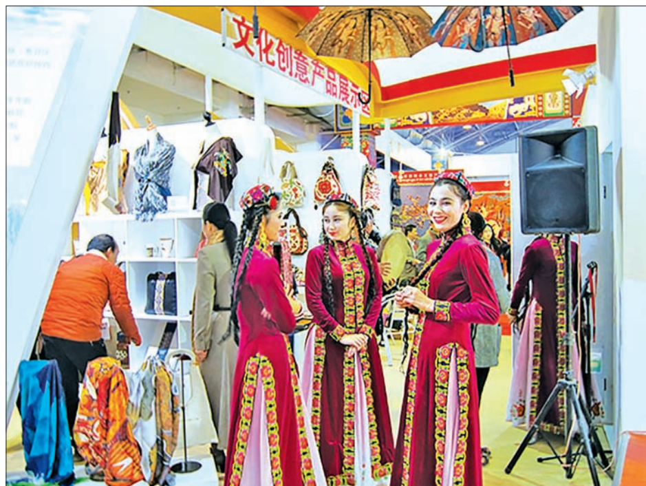
Performers from the Xinjiang Uygur autonomous region at their pavilion at the expo.

BEIJING — A wide range of displays, from cultural to cutting edge, marks this year's exhibition. Sun Ye looks up the stalls that celebrate art forms of dozens of countries and China's many provinces.