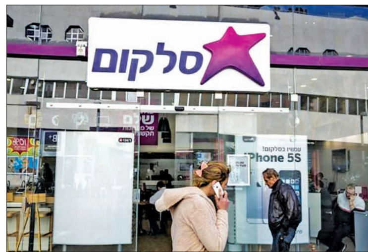
A woman walks past a branch of Cellcom, Israel's No. 1 mobile phone operator, in Tel Aviv, Israel.

The government is now considering allowing consolidation in the market that would enable prices to rise and permit companies to make more profit to plough back into infrastructure.