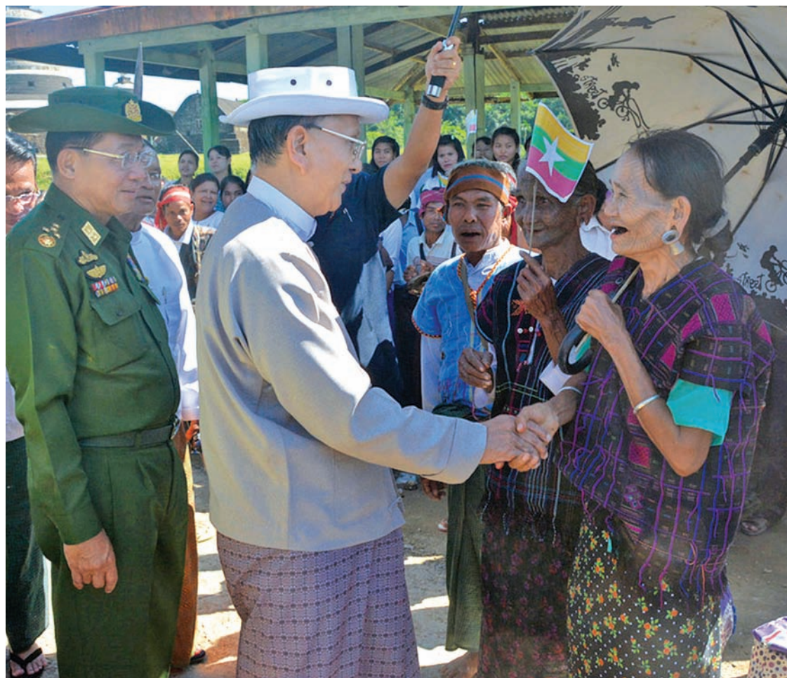
President U Thein Sein cordially greets local ethnic women in Mrauk-U.

The president met with Hluttaw representatives, members of the township management committee, the township development supporting committee, the township development affairs committee, departmental officials and town elders at the meeting hall of Mrauk-U District General Administration Department. At the meeting the president said that he had visited Mrauk-U on 6 August to deliver relief aids to flood victims. The president pointed out that one-third of the country was hit by various natural disasters at the end