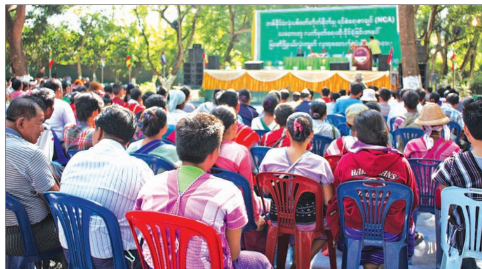
Local ethnics attend mass rally to support signing of NCA in Myawady.