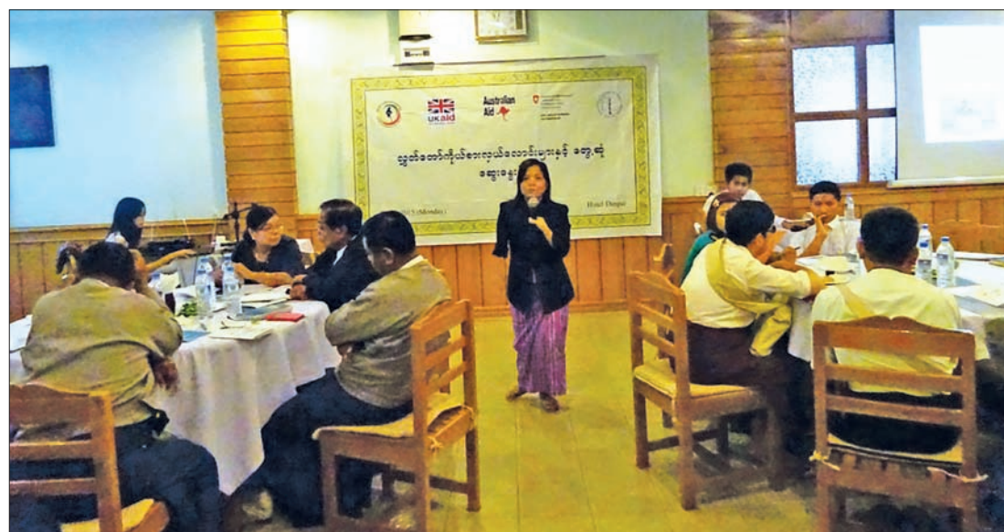
A speaker discusses voting process for voters with disabilities.

MYANMAR Independent Living Initiatives held a workshop on 1 November to explain the voting process to people with disabilities. The workshop was held at the Dinga Hotel in Mahaaungmye Township, Mandalay. The workshop was attended by officials of the Social Welfare Department, parliament members, civic organisa-