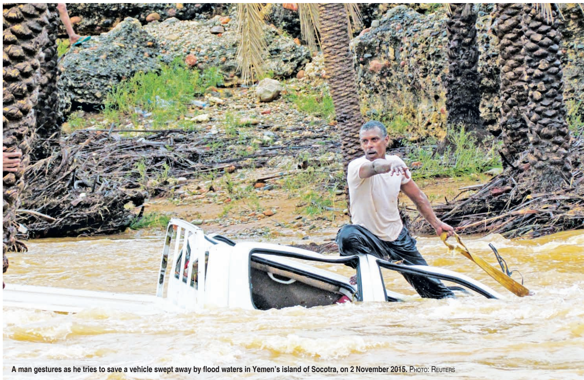
A man gestures as he tries to save a vehicle swept away by flood waters in Yemen's island of Socotra, on 2 November 2015.

CAIRO — A cyclone with hurricane-force winds made landfall on Yemen's Arabian Sea coast on Tuesday, flooding the country's fifth-largest city Mukalla and sending thousands of people fleeing for shelter.