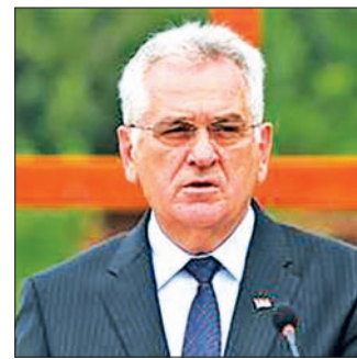
Serbian President Tomislav Nikolic.

BELGRADE — Serbian President Tomislav Nikolic urged all friends of Serbia to join the campaign against Kosovo becoming a UNE-SCO member and share the film on the destruction of Serbian cultural heritage in