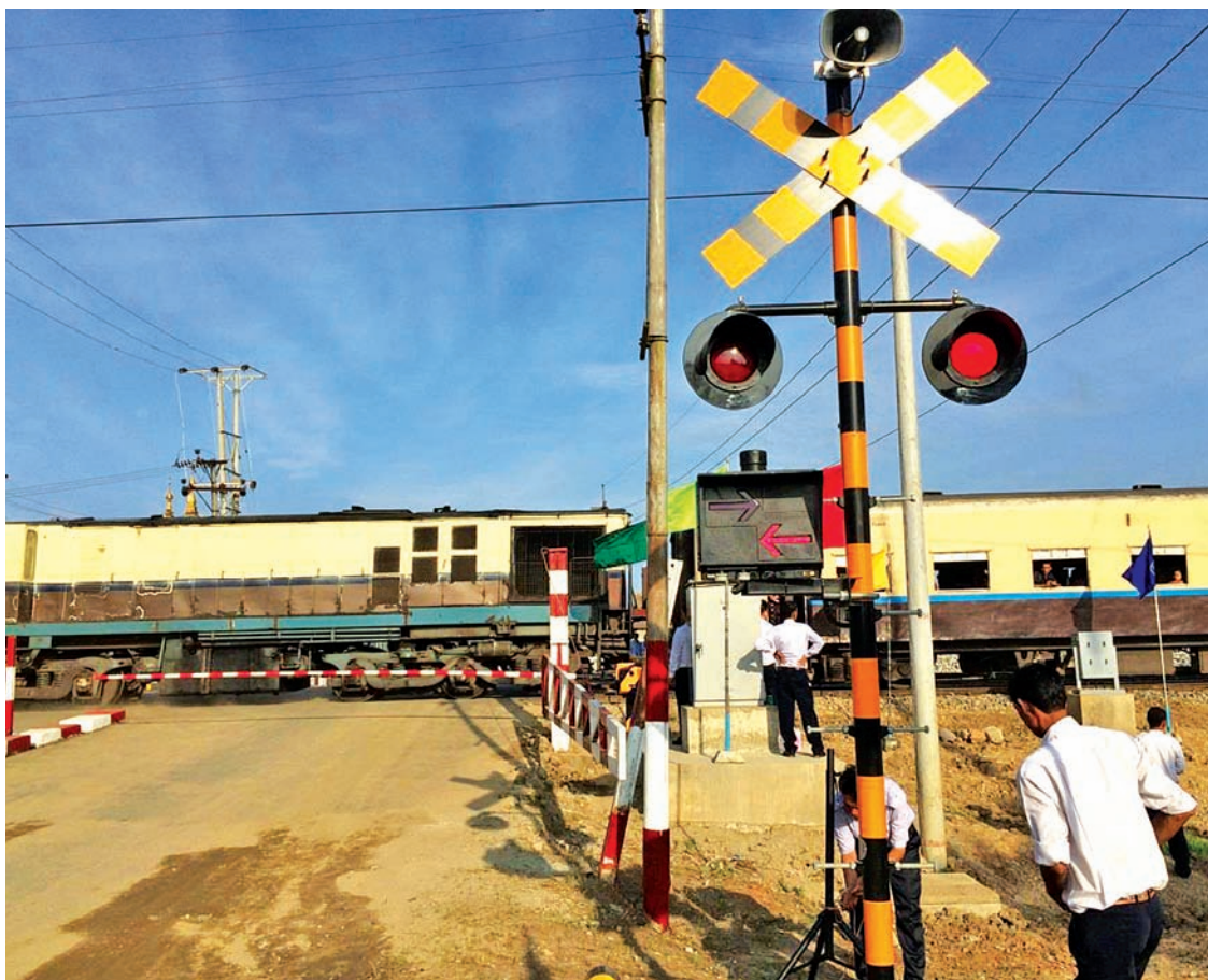
The newly installed level crossing device at Kyansitthar Junction.

This Grant Aid Project aims to improve operation management and safety of Myanmar Railways, promote socioeconomic development and ensure safe and smooth travel and transport of the people of Myanmar. In this context, the project plays an important role in JICA's multi-scheme assistance to Myanmar Railways in modernizing Myanmar's railway development, particularly for Yangon Circular Line and Yangon-Mandalay Railway Line. The works for the remaining components of the Project are ongoing and expected to be completed in June 2017.—JICA