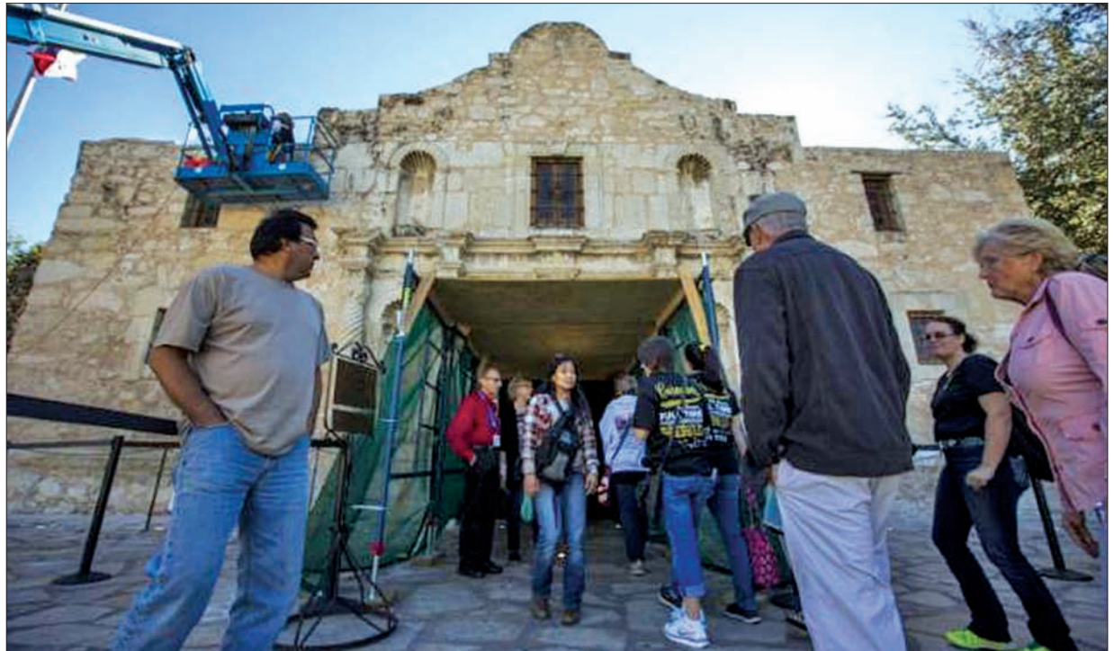
Visitors stand near the entrance as men use a lift to repair and restore stonework along the curved facade of the Alamo in San Antonio, Texas, on 26 October 2015.

SAN ANTONIO — The man who long-headed San Antonio's Chamber of Commerce has grown tired of the reaction he receives from the visitors he takes to the Alamo, the highly recognisable monument to Texas independence and the state's most-visited tourist site.