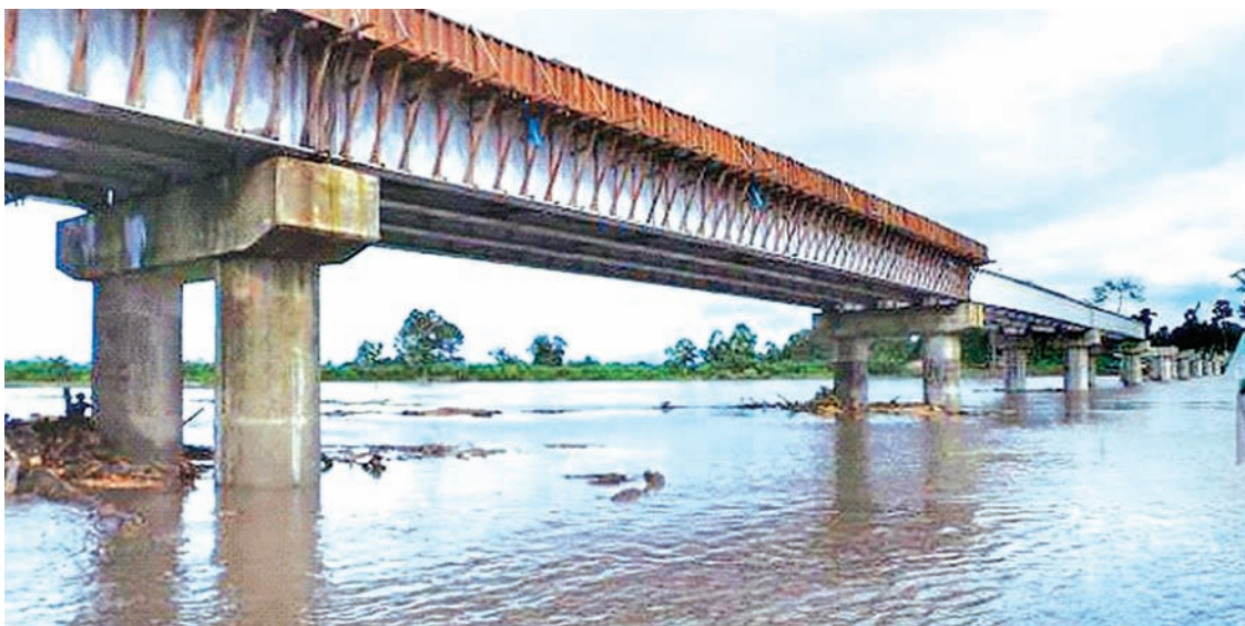
Tawam Bridge under construction on Myitkyina-Namti-Tanai-Shinbweyan-Pansawng road.

For the 2015-16 fiscal year Kachin State intends to build 23 bridges that are 50 feet long or longer. So far eight bridges have been completed and 15 are under construction.— Min Yazar (Myitkyina)