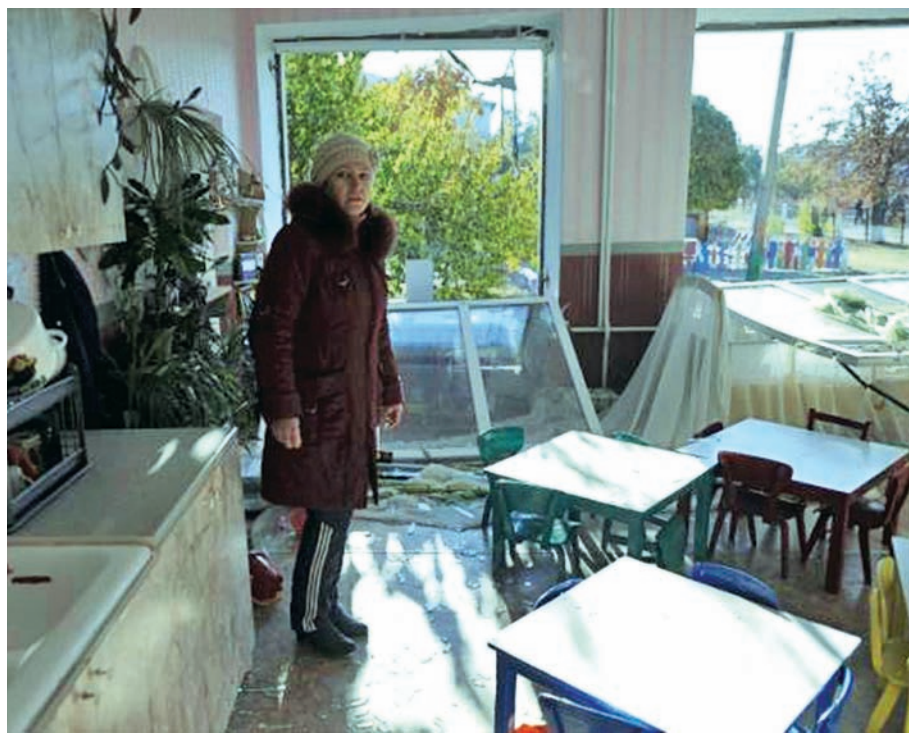
A woman looks on at a local kindergarten, which was damaged by explosions at a military depot in Svatove in Luhansk region, Ukraine, on 30 October 2015.