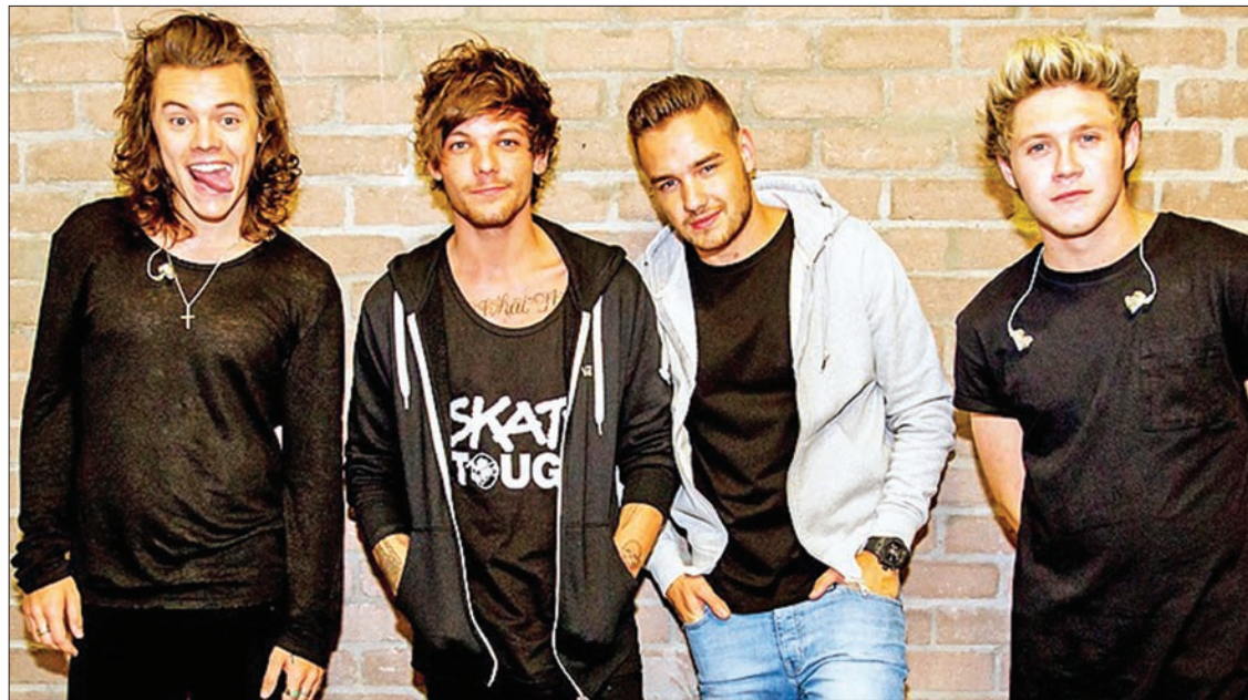
Boy band One Direction.

LOS ANGELES — Boy band One Direction will perform at the 2015 American Music Awards, which will take place on 22 November at Los Angeles’ Microsoft Theater.