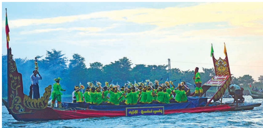
Performance of group dance on the boat in the Shwegyin River.

"The river with all the floating lamps is very nice at night but darkness increases the risk of accident for boats on the river," a local man said.