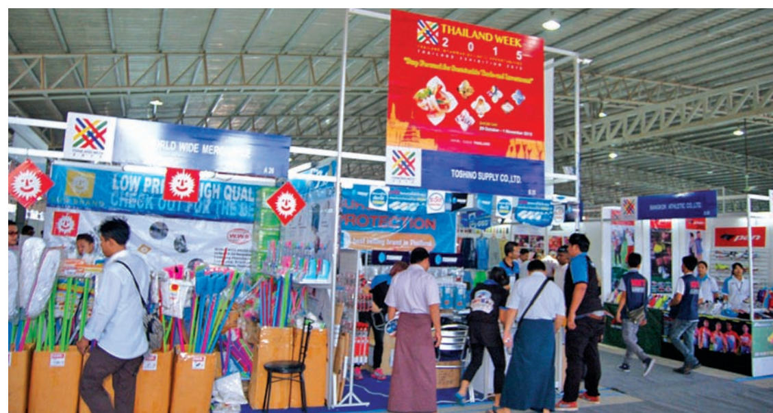
People visit booths at Thailand Week 2015.

The Township Rural Development Department is running the vocational course on figurine making to locals from villages in the western part of Kyaukse Township.— Tun Tun Naing (Kyaukse)