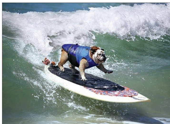
Surfer Dog Tillman rides a wave at the Surf City surf dog contest in Huntington Beach, California on 28 September 2014.

Even so, it took hundreds of hours of training for him to master it, Davis said. —Reuters