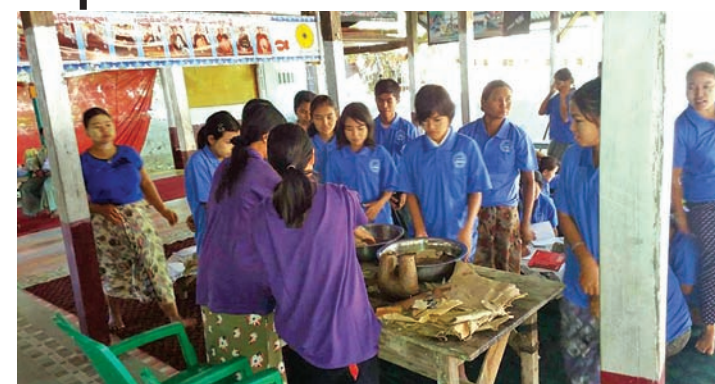
Local women under training of making elephant figurines.