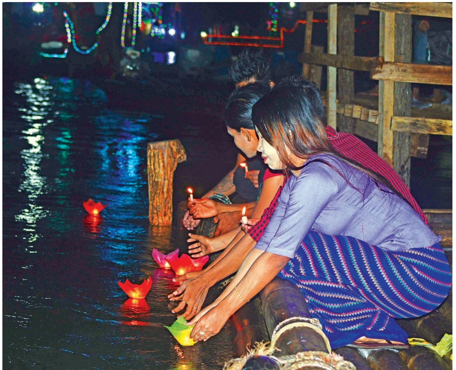
Locals float lamps in the Shwegyin River to mark the end of Buddhist Rains Retreat.