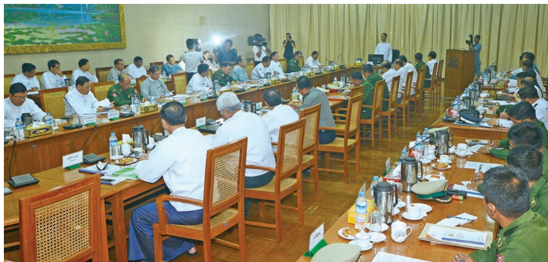
Vice President Dr Sai Mauk Kham addresses the meeting to organize 68 th Anniversary of Independence Day.

The secretary of the central committee explained the agenda of the ceremony and the formation of seven subcommittees before chairmen of the subcommittees reported to the central committee the arrangements for the ceremony. The meeting ended with concluding remarks by the vice president.— Myanmar News Agency