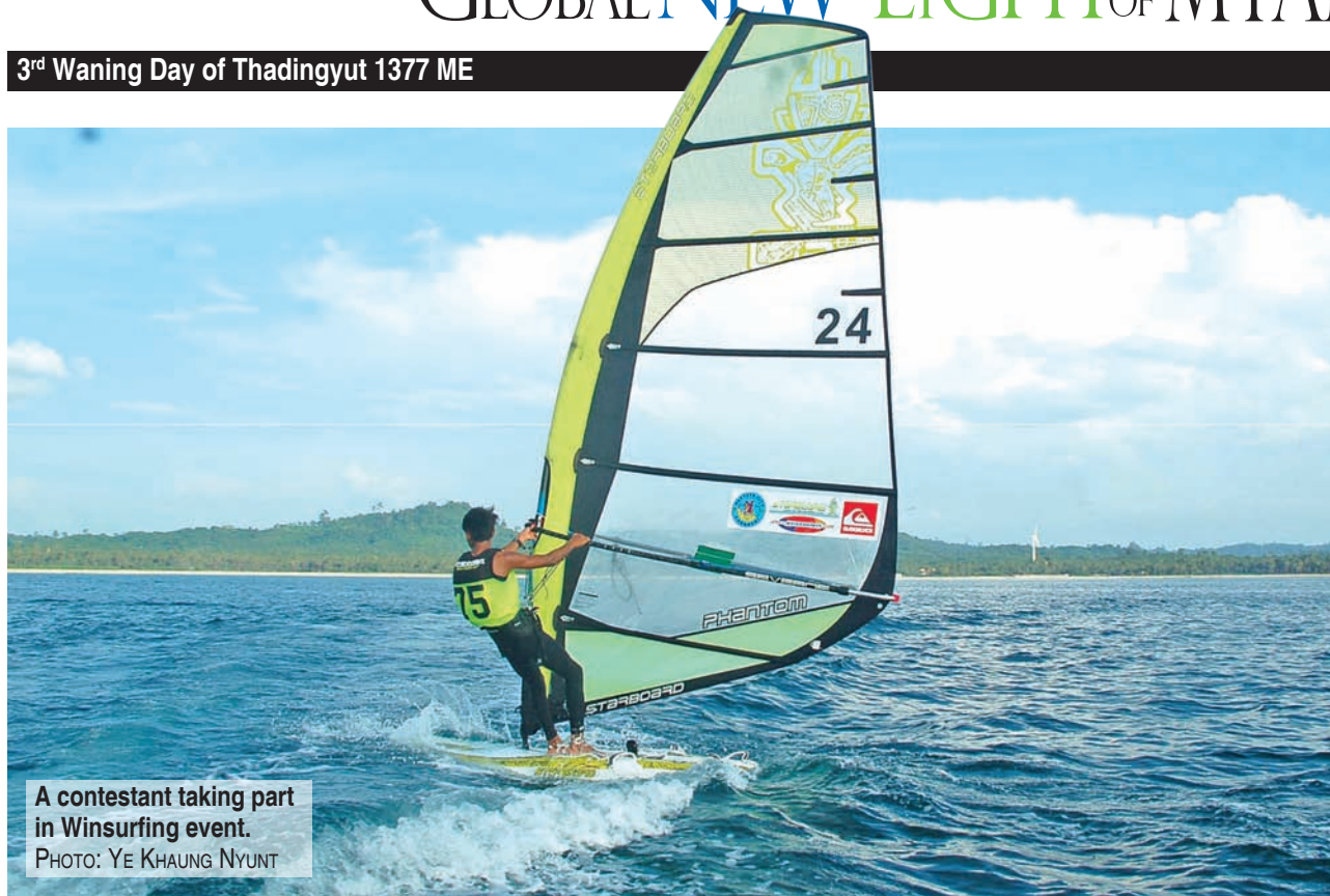
A contestant taking part in Windsurfing event.