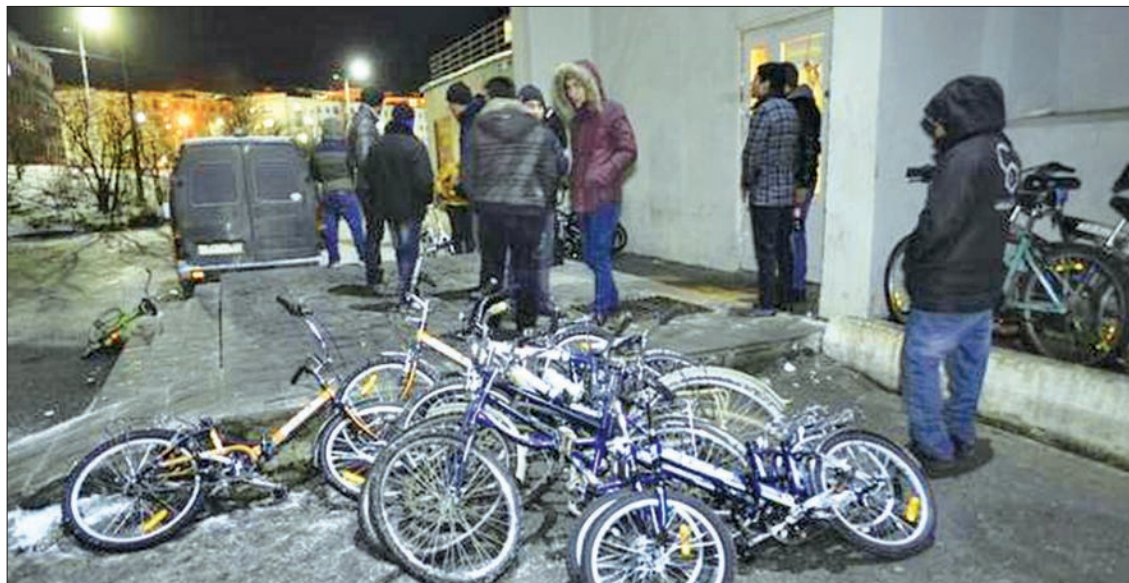
Refugees and migrants gather outside a local hotel in Nickel settlement next to bicycles often used to reach the Norwegian border, in Murmansk region, Russia, on 29 October, 2015.

“The local shops are empty of bicycles. No bus or taxi would take the Syrians to Norway because they do not have valid visas and the drivers would be fined by