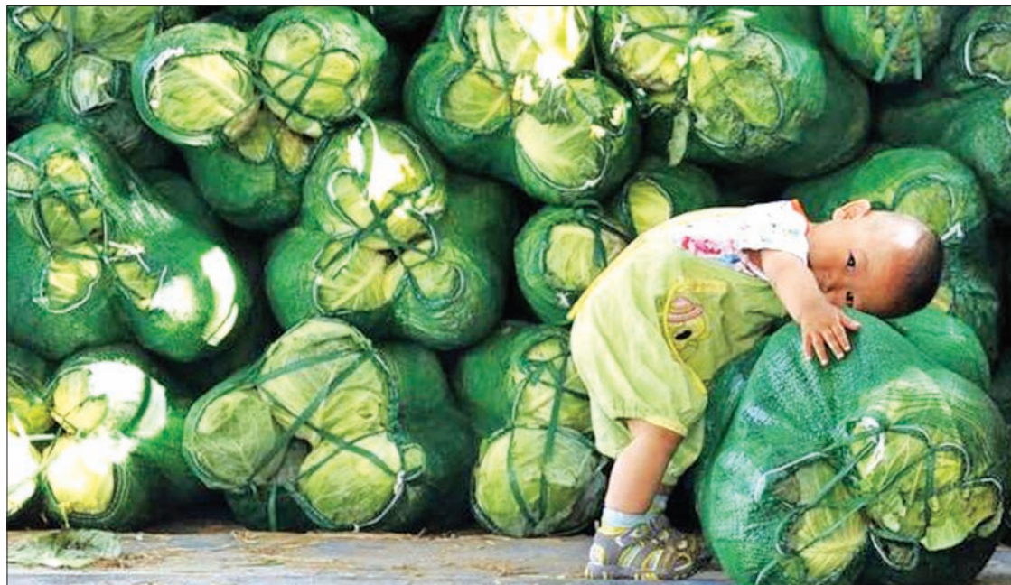
A boy leans on a sack of cabbages at a vegetable wholesale market in Jinan, Shandong Province.

But no baby boom is not expected to be forthcoming soon as small families are an engrained part of Chinese culture and adding more children is too expensive for many. Analysts note that an easing of policy in late 2013, allowing couples to have a second child in