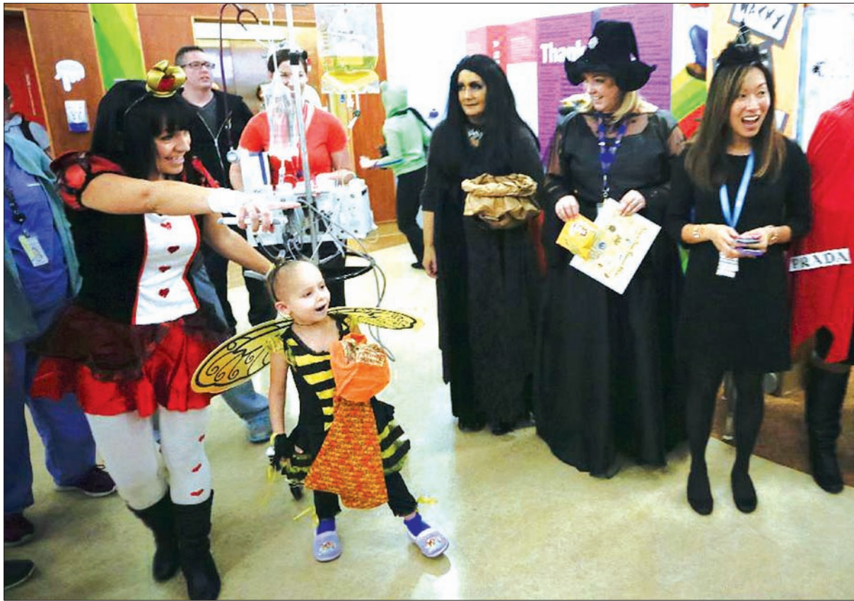
A young patient enjoys her "Trick or Treat" fun at the BC Children's hospital in Vancouver, Canada, on 29 October 2015. About 100 young patients in BC Children's hospital participated in a "Trick or Treat Treasure Hunt" event. Health care staffs dressed up to cheer up the sick children in order to ease their pain under the joyful atmosphere of Halloween.