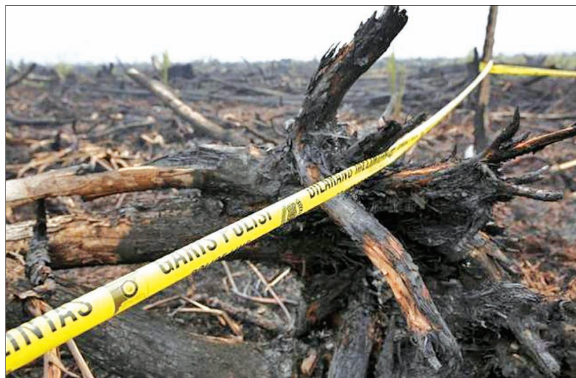
Police tape is seen on land recently burned and newly-planted with palm trees and now under police investigation west of Palangkaraya, Central Kalimantan, Indonesia on 30 October 2015.

The haze has caused pollution levels across the region to spike to unhealthy levels, and forced school closures and flight cancellations. Warships are on standby to evacuate infants and other vulnerable residents of haze-hit areas, while other countries have been asked for help to tackle the fires.— Reuters