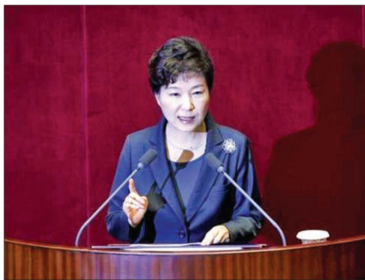
South Korean President Park Geun-hye.

TOKYO — South Korean President Park Geun-hye said the emotional issue of "comfort women", who were forced into prostitution at Japanese wartime brothels, would be central at this weekend's bilateral summit and key to stable ties with Japan.