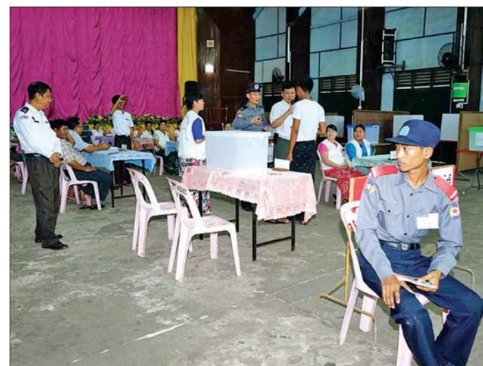
Polling station staff and police participate in demonstration of electoral procedures in Ahlon Township.