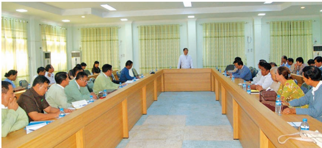
Mandalay Region's coordination meeting on participation of artist troupe in performing arts competitions.

Experts of the performing arts and officials of both universities and basic education departments discussed the participation of students at different levels in the competition.— Tin Maung (Mandalay)