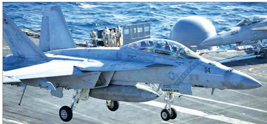
A US Navy F/A-18 Super Hornet fighter lands onto the deck of the USS Ronald Reagan, a Nimitz-class nuclear-powered super carrier, in the West Sea, South Korea on 29 October 2015.

WASHINGTON — The USS Ronald Reagan aircraft carrier scrambled four fighter jets to intercept approaching Russian warplanes as it carried out a military exercise on Tuesday in the Sea of Japan, US military officials said on Thursday.