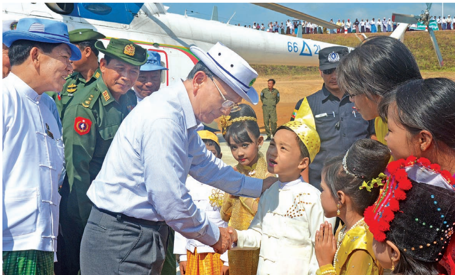
President U Thein Sein cordially greets children and local people at Mazin reservoir in Bago Township.