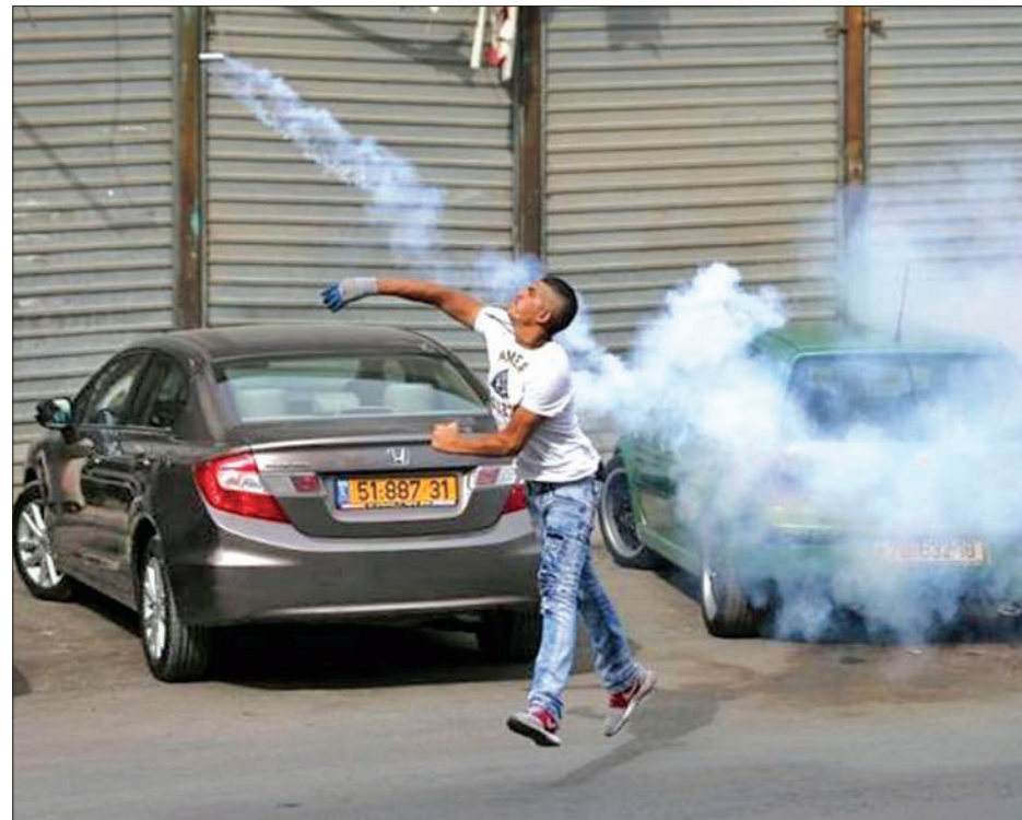
A Palestinian protester hurls back a tear gas canister fired by Israeli troops during clashes in the West Bank town of Al-Ram, near Jerusalem on 22 October 2015.

and protect civilians, including publicly urging restraint in their own communities."—Reuters