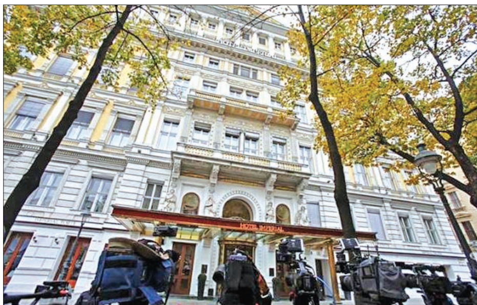
Television cameras are set up in front of Imperial hotel, the site of international talks on Syria, in Vienna, Austria on 30 October 2015.

"Iran does not insist on keeping Assad in power forever," Iranian Deputy Foreign Minister Amir Abdollahian, a member of