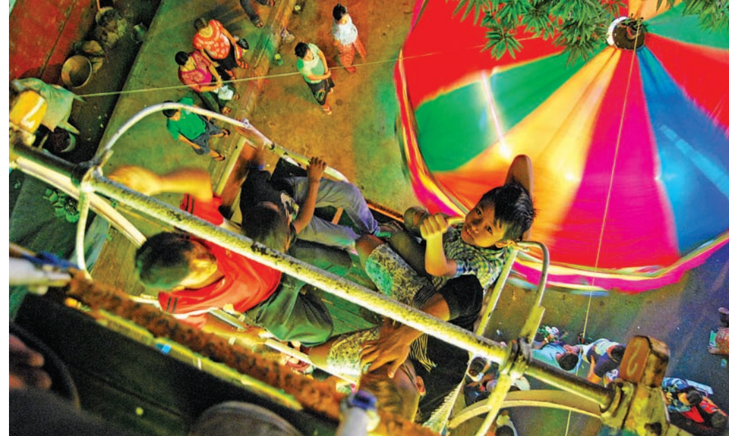
Folks from all walks of life gathered in downtown Yangon this week to celebrate Thadingyut, the Myanmar Lighting Festival, which marks the end of Buddhist Lent. The festival is a great opportunity for Snapchat users to share videos of Myanmar youths practicing proper fire safety procedures.