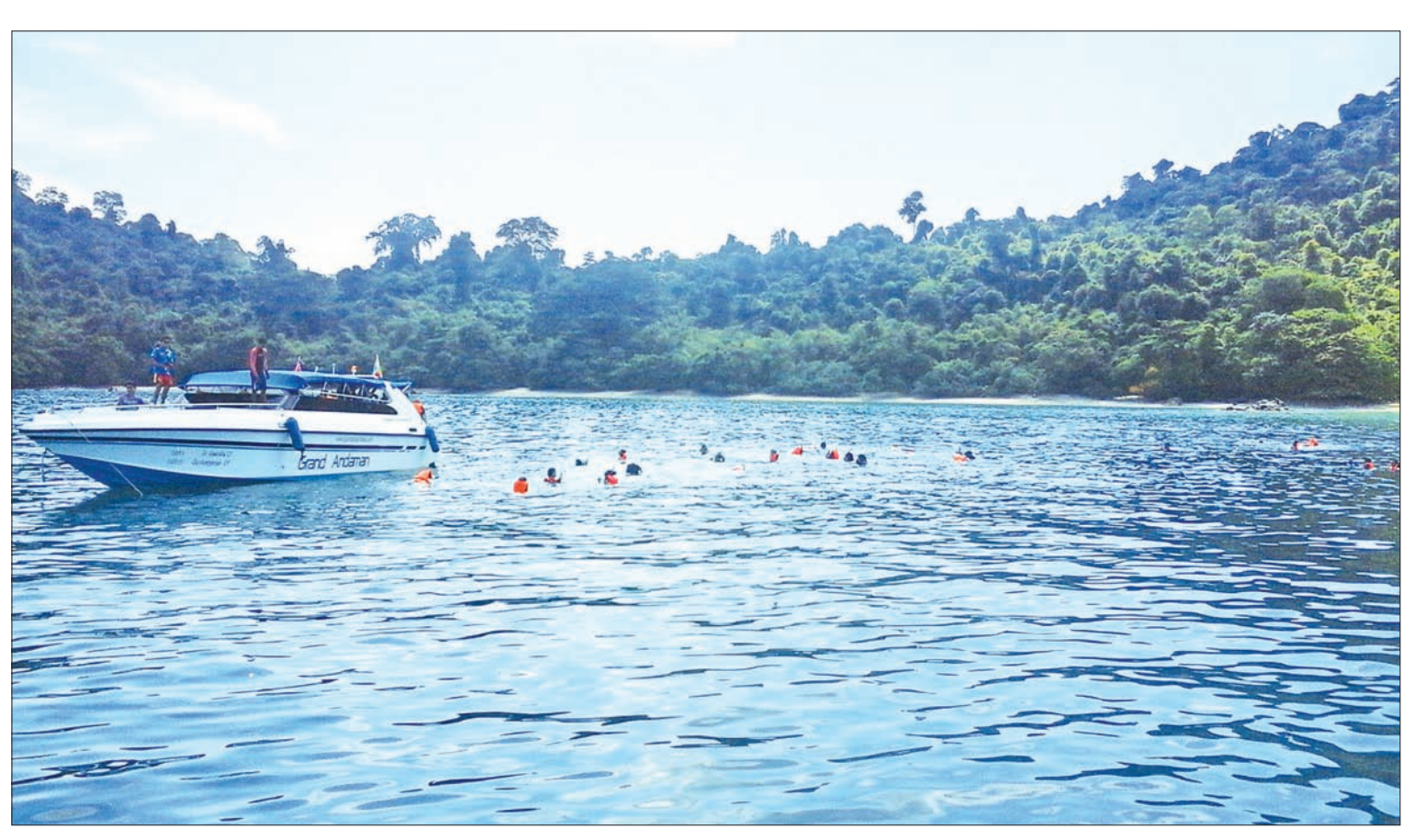
Visitors enjoying scenic beauty of islands in Kawthoung District.

In October alone, many Thai nationals went on day trips to the region to snorkel and scuba dive near Sayton Island, 30 nautical miles away from Kawthaung .-Myanmar News Agency