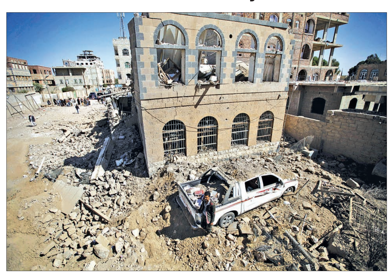
A man stands at the site of Saudi-led air strikes in Yemen's capital Sanaa, on 28 October 2015.

DUBAI — Warplanes from a Saudi-led coalition bombed the Iran-allied Houthi movement across Yemen on Wednesday and dropped weapons to Islamist militias battling the group, a day after being accused of bombing the hospital of an international medical aid charity.