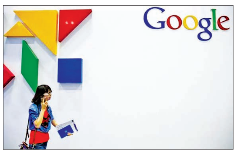
A woman walks past a logo of Google at the Global Mobile Internet Conference (GMIC) 2015 in Beijing, China.

The firm said it aimed to keep fourth-quarter mobile profits at a similar level, although the outlook beyond that was unclear as it expected the global smartphone market to slow in 2016. —Reuters