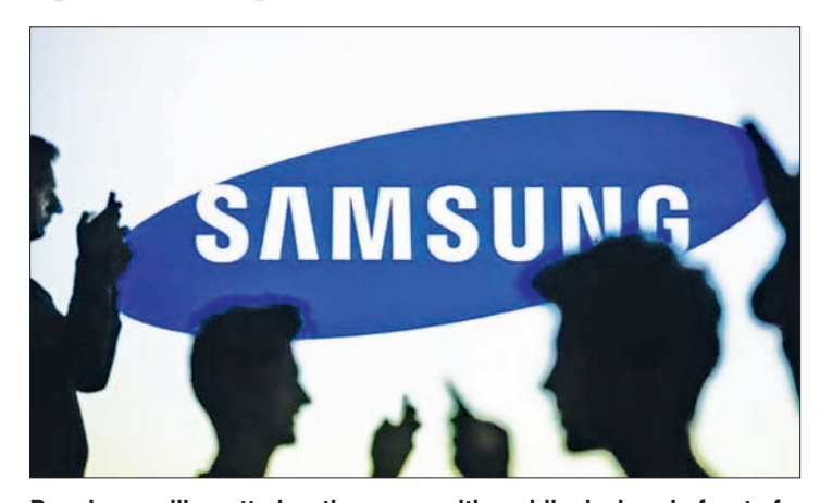
People are silhouetted as they pose with mobile devices in front of a screen projected with a Samsung logo.

SEOUL— Tech giant Samsung Electronics Co Ltd (005930. KS) on Thursday unveiled a 11.3 trillion won ($9.9 billion) share buyback after reporting its first on-year profit growth in two years thanks to strong component sales, pushing its shares sharply higher.