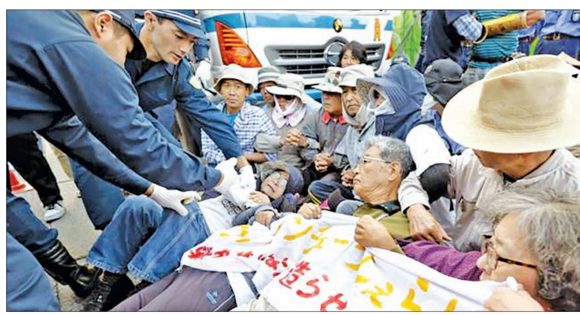
Protesters lie on the ground as they try to block work on a contentious US air base in front of the gate of the US Marine Corps Camp Schwab in Nago on the southern Japanese island of Okinawa on 29 October 2015.

TOKYO — Police dragged away elderly protesters trying to block work on a contentious US airbase in Okinawa on Thursday as Japan's government resumed building even though the Okinawa governor had revoked a work permit for the site. ment could dent support ratings for Prime Minister Shinzo Abe ahead of an election next year. Two weeks ago, anti-base governor Takeshi Onaga, who has accused Abe of looking down on Okinawa, revoked the permit issued by his predecessor for key landfill work