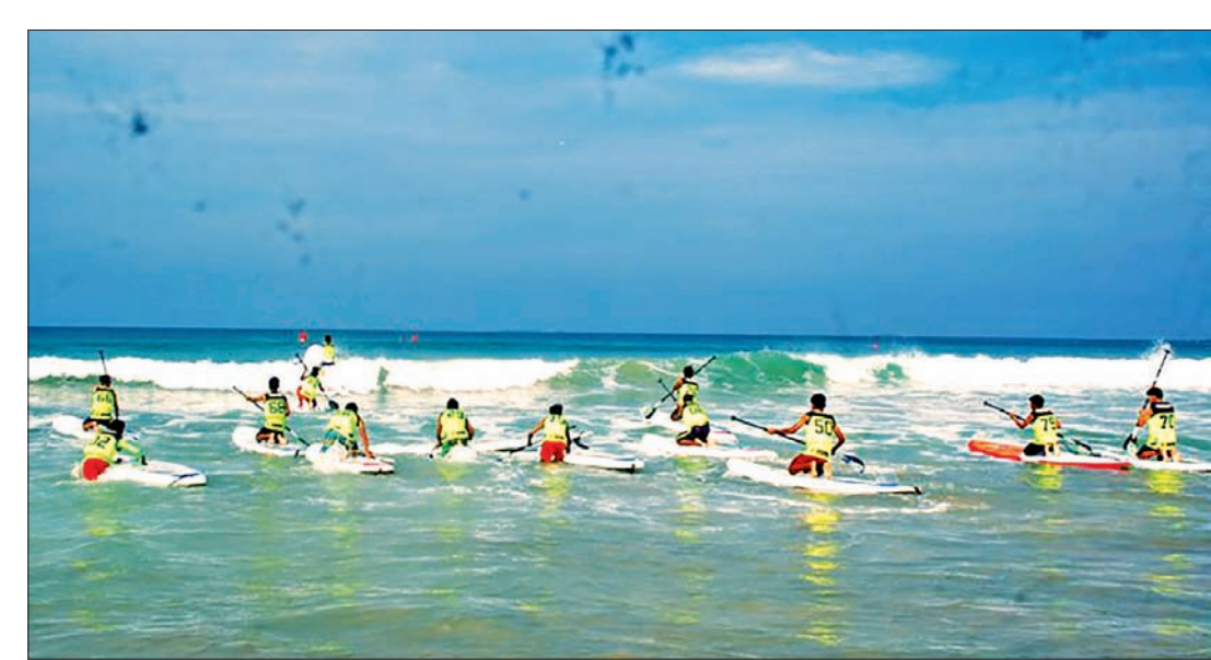
Participants taking part in men's junior stand-up paddle boarding contest.

The contests will continue until 31 October.—Myanmar News Agency