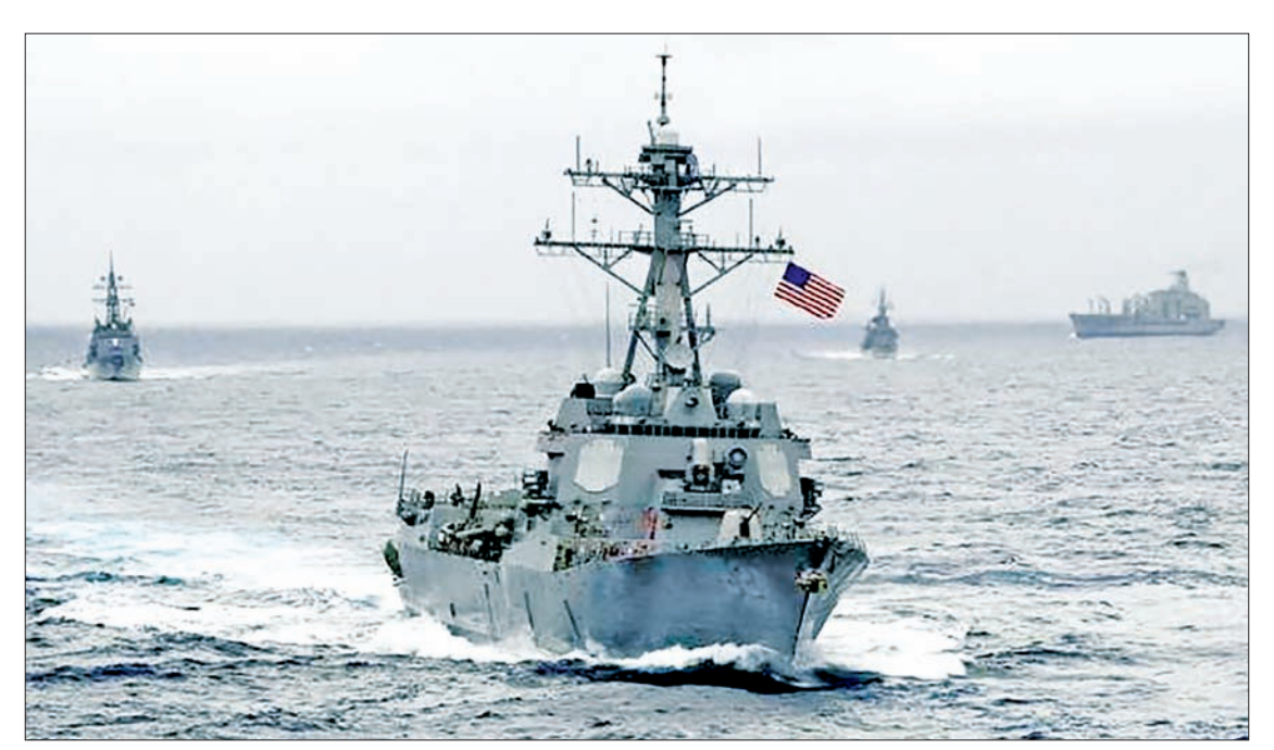
The US Navy guided-missile destroyer USS Lassen sails in the Pacific Ocean in a November 2009 photo provided by the US Navy. Photo: Reuters

Australian media said it would include live-fire drills. Canberra, a key US ally in the region, expressed its strong support for freedom of navigation this week, while stopping short of welcoming the USS Lassen's patrol. China claims most of the South China Sea, through which more than $5 trillion of world trade passes every year. Vietnam, Malaysia, Brunei, the Philippines and Taiwan have rival claims.— Reuters