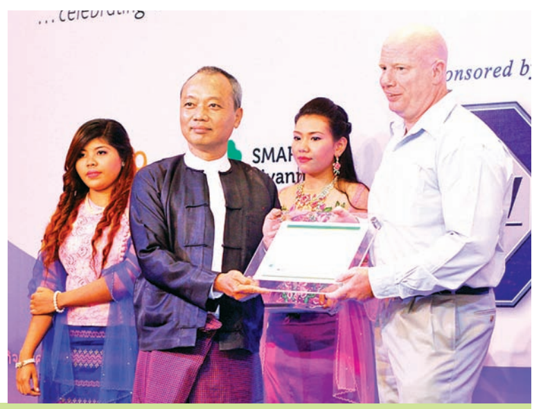
The Myanmar Garment Manufacturers Association (MGMA) hosted its 2<sup>nd</sup> Annual Factory Awards Dinner on 24 October at the Summit Parkview Hotel. One factory was honoured with a SMART Award for excellence in social compliance improvements. A runner-up factory was awarded an honourable mention for excellent practices in employee contracts and workplace conditions. Some members of the association threatened to close their factories rather than pay their workers a minimum wage of US$2.80 per day earlier this year.