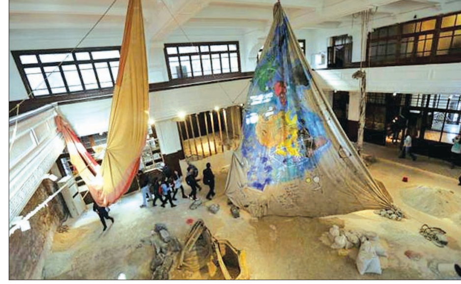
Visitors look at Anna Boghiguian's work 'The Salt Traders' at the 14th Istanbul Biennial at Galata Greek Primary School in Istanbul, Turkey, on 28 October 2015.

The Istanbul Biennial, now in its 14th edition, opened in September against a backdrop of violence. Fighting between the Turkish army and the outlawed Kurdistan Workers Party that erupted suddenly in July wrecked a tenuous peace process. A suicide bombing blamed on Islamic State killed 102 people in the capital this month ahead of an election on 1 November. War in Syria has sparked an influx of 2 million refugees, tens of thousands of whom have made the treacherous voyage to Europe. The upheaval has not frightened off art crowds that reached a record 450,000 this week.