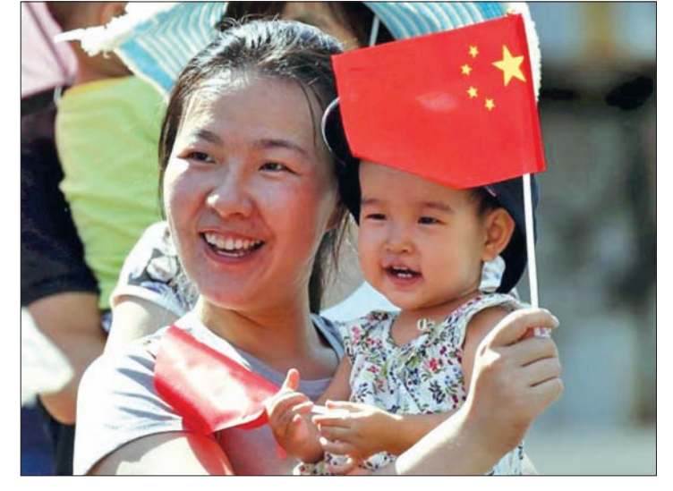
A woman and her baby wait on the street for a military parade marking the 70th anniversary of the end of World War II, in Beijing, China, in this September 3, 2015 file photo.

The announcement was made at the close of a key Party meeting focussed on financial reforms and maintaining growth between 2016 and 2020 amid concerns