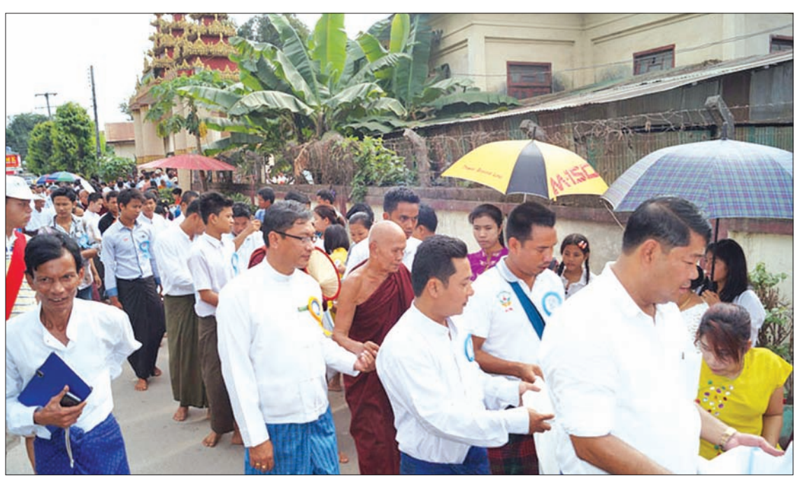
Well-wishers donate offertories to members of the Sangha.