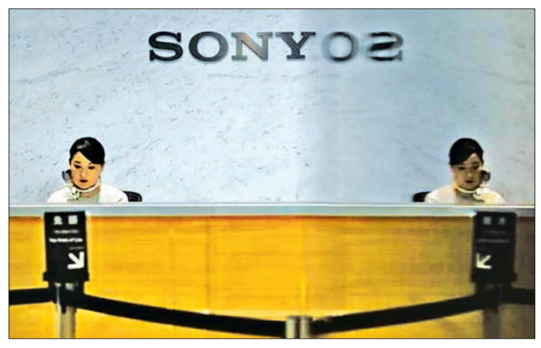
A reception staff works under a logo of Sony Corp at its headquarters in Tokyo, Japan.

Camera sensors have also played a key role in the company's recovery of the past year. The devices division, which includes image sensors, reported an