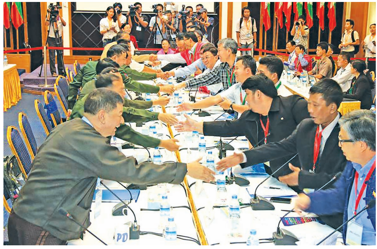
Attendees shake hands at a Joint Monitoring Committee meeting between the government and eight ethnic signatories to the ceasefire agreement at the Myanmar Peace Centre in Yangon yesterday.

The ethnic armed groups proposed that a Union-level committee should be formed