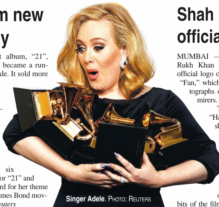
Singer Adele.

Adele won six Grammy awards for "21" and an Academy Award for her theme song for the last James Bond movie, "Skyfall".—Reuters