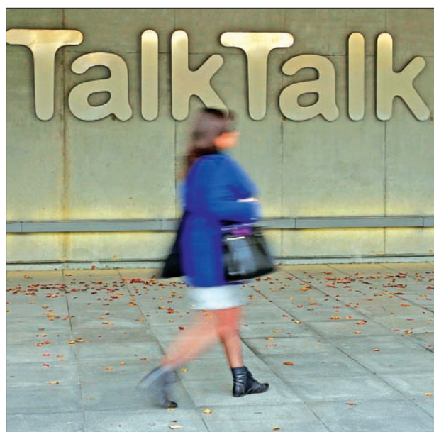
A woman walks past a company logo outside a TalkTalk building in London, Britain on 23 October 2015.