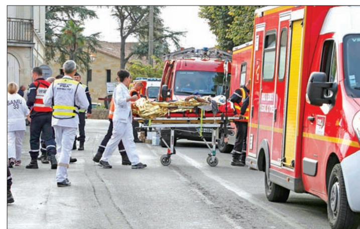
Rescue workers carry an injured person on a stretcher during rescue operations near the site where a coach carrying members of an elderly people's club collided with a truck outside Puisseguin near Bordeaux, western France, on 23 October 2015.

The 42 victims were members of elderly people's club, all apparently from the region, who were on a day trip, Interior Ministry spokesman Pierre-Henry Brandet said on BFM TV.—Reuters