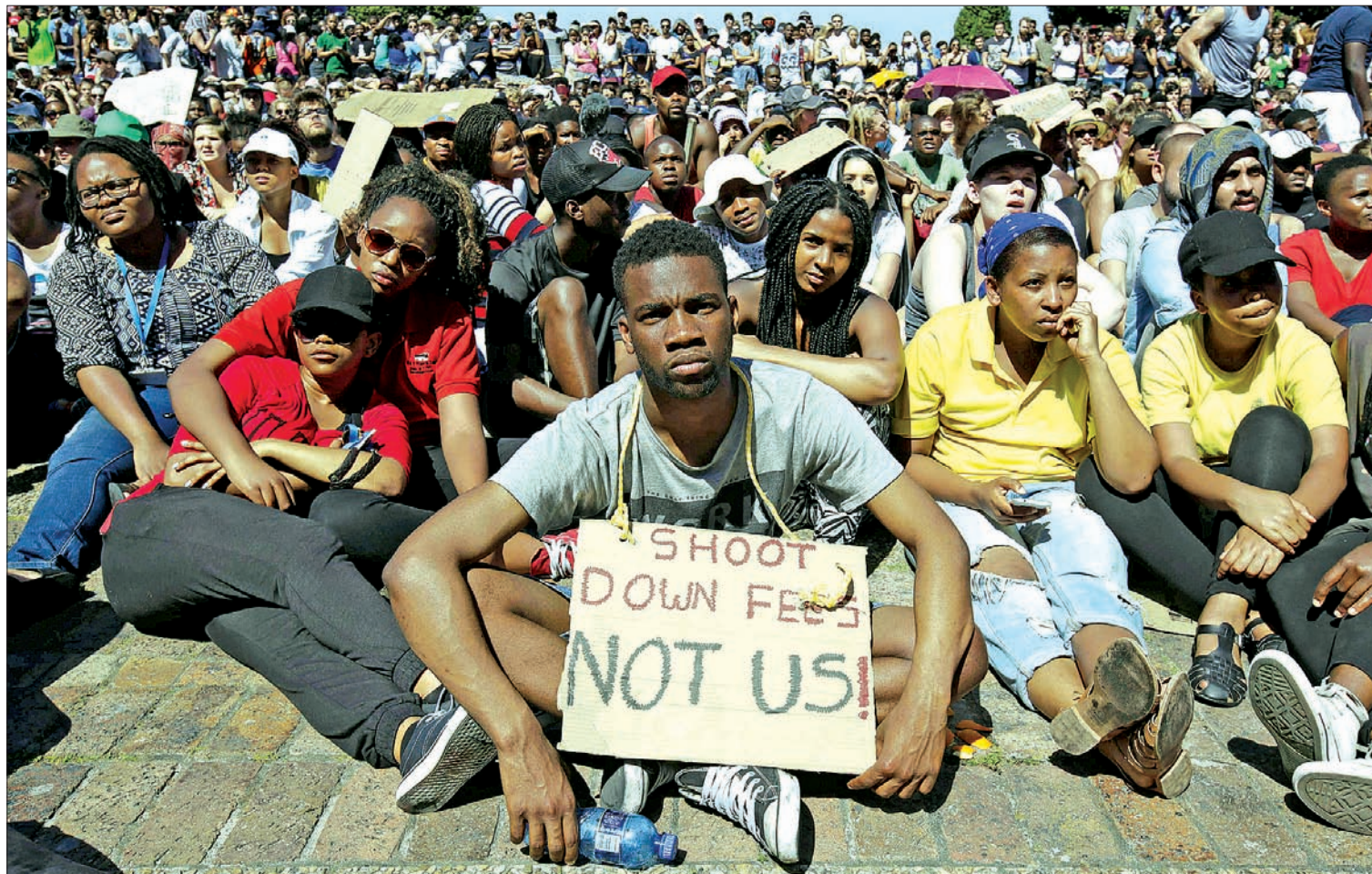
Students sit in protest during a mass demonstration on the steps of Jameson Hall at the University of Cape Town, on 22 October 2015.

PRETORIA — Thousands of South African students demanding lower university fees gathered on Friday for a march on the historic seat of government in Pretoria, a sign of the post-apartheid 'Born