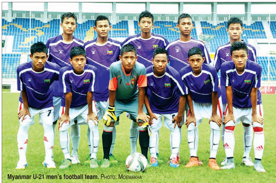
Myanmar U-21 men's football team.