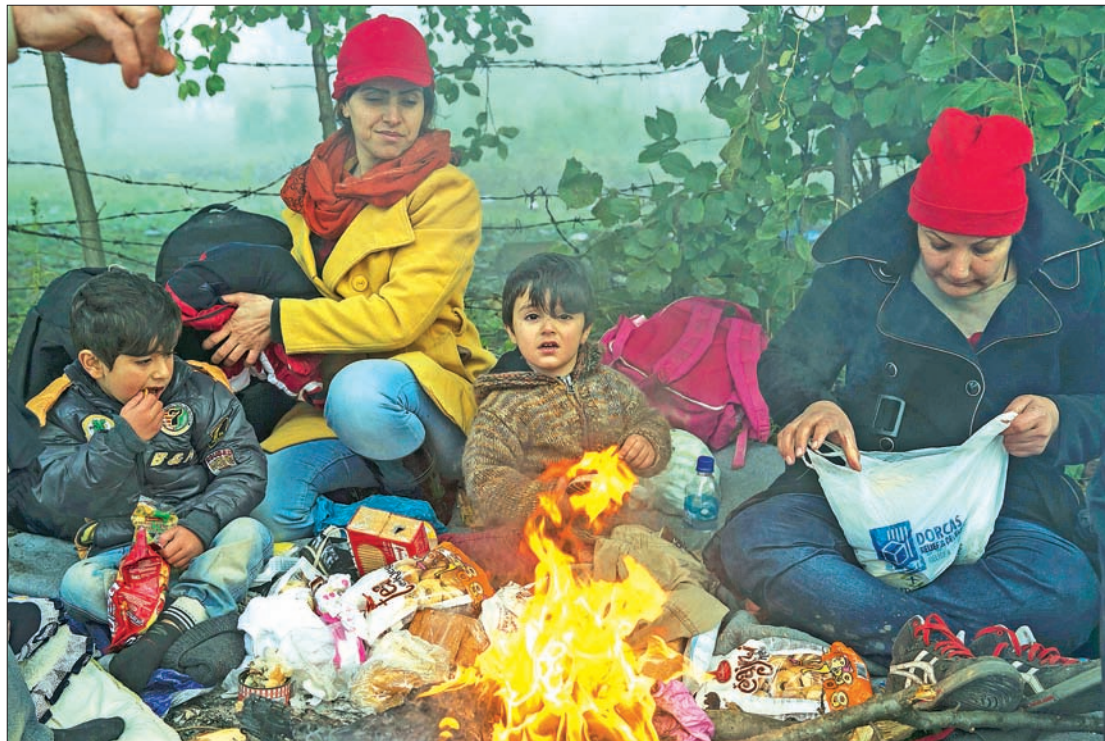
Migrants sit around a bonfire as they wait to cross the border with Croatia near the village of Berkasovo, Serbia on 23 October, 2015.

"We want to get better and faster this year at the deportation of rejected applicants who have no claim to remain here," added Altmaier, who Merkel appointed earlier this month to oversee her government's handling of the refugee crisis. Support for Merkel's conservatives has fallen due to concern over the refugee crisis. Many Germans feel the country cannot cope with the record influx. A poll