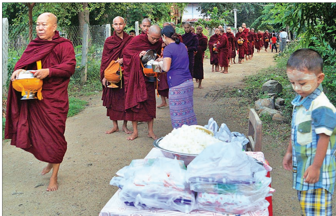
Buddhist monks receive alms from people in Tatkon during the 16th annual alms event in Tatkon.

RESIDENTS of Tatkon in Nay Pyi Taw Council Area have completed the offering of alms to 484 local Buddhist monks who live in