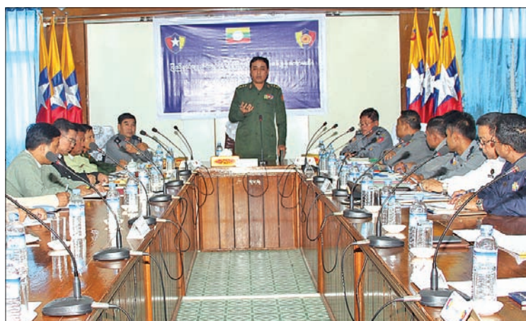
Shan State authorities have taken steps to improve security for the November-8 election.

SECURITY measures are to be taken with the set standard in co-operation with local people, said Shan State Security and Border Affairs Minister Colonel Soe Moe Aung at the meeting of Shan State Election Security Committee on 22 October. The meeting focused on election and security measures taken in the respective townships in the state.— Zaw Myo Naing