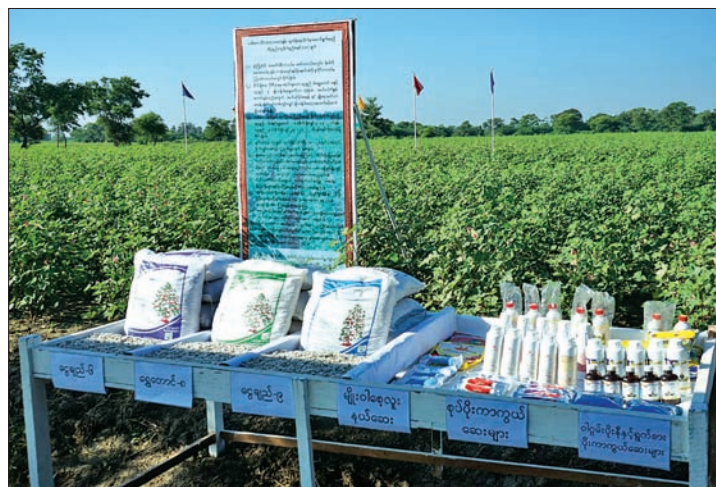
Farmers learn cotton farming from governmental agricultural experts.

methods, the use of fertilizer as well as guidelines on achieving commercial scale production. A good harvest for an acre of cotton can yield over 1000 viss (1,600 kilos) bringing welcome income to local farmers, said an officer from the department. — Min Min Htwe (Pyawbwe)