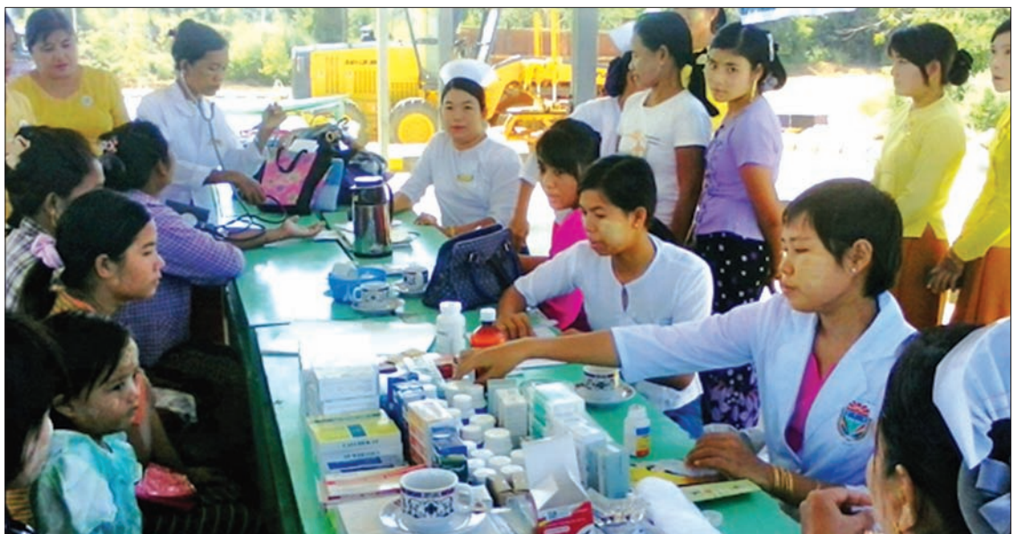
Local people receives health care services provided by Ottarathiri Maternal and Child Welfare Association.

ternal and reproductive healthcare to workers. Sixty workers, including eight pregnant women, received medical treatment from staff.— Shwe Ye Yint