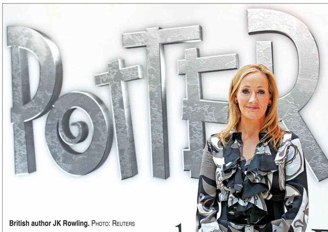
British author JK Rowling.

"As past and present fuse ominously, both father and son learn the uncomfortable truth: sometimes, darkness comes from unex-