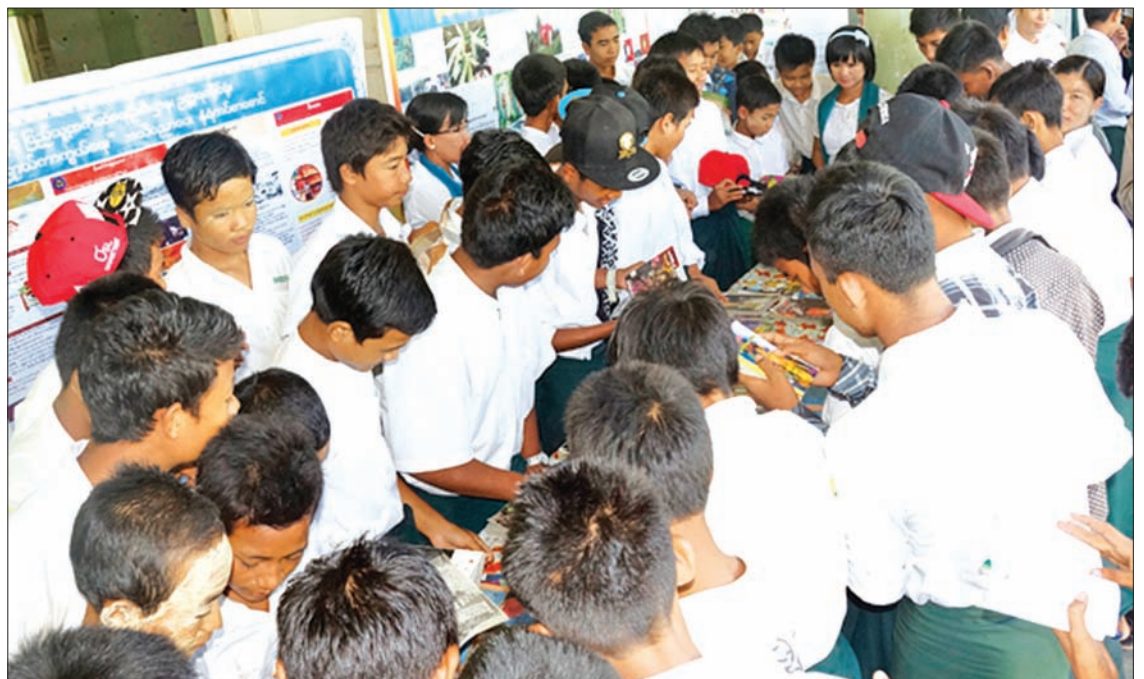
School children rely on libraries for reading in Ottara Thiri Township.

STAFF at the Information and Public Relations Department, which lies under the Ministry of Information, are giving talks, hanging posters and provid-