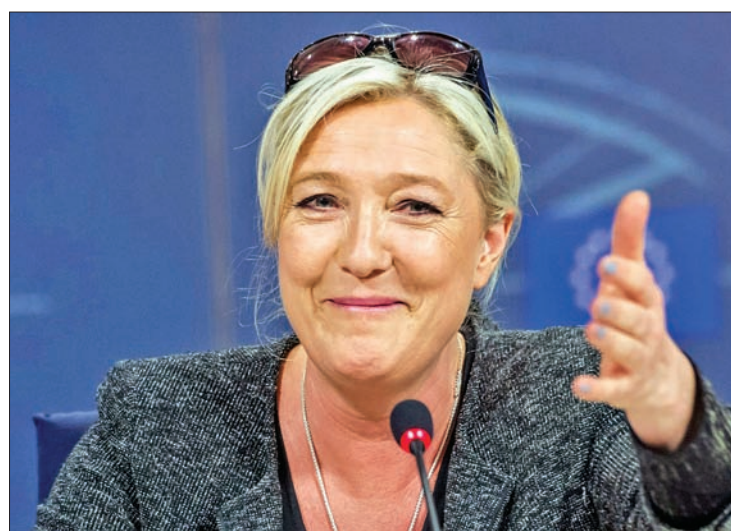
Far-right leader Marine Le Pen.

pal powers are in the domain of local planning, transport and upper-secondary schooling.