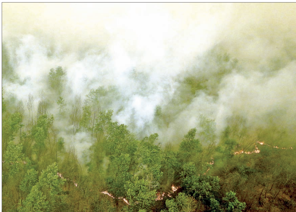
Thick smoke rises as a fire burns in a forest at Ogan Komering Ilir Regency, Indonesia's South Sumatra Province on 20 October 2015.

Garuda said the haze had cost the state airline about $8 million in lost sales and other expenses, with 120,000 passengers cancelling flights last month alone.—Reuters