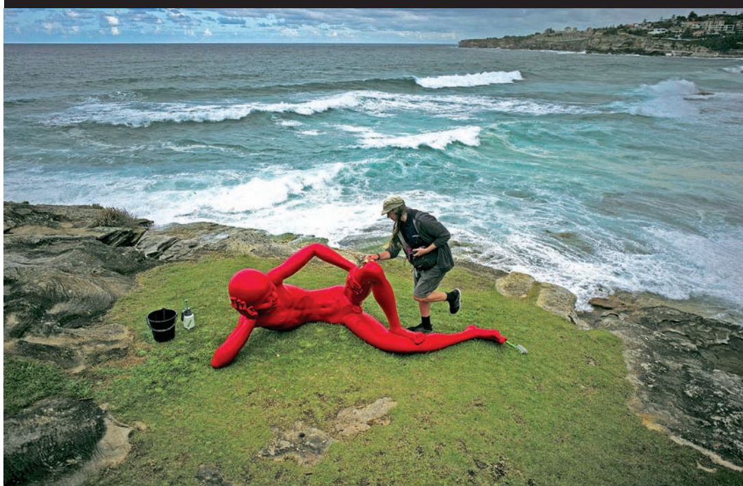
A volunteer wipes sea spray off the painted bronze sculpture entitled 'Harbour' by Chinese artist Chen Wenling during the 19 th annual Sculptures by the Sea exhibition in Sydney, on 23 October 2015. Sydney's coastal walk between Bondi and Tamarama has been transformed into a temporary sculpture park featuring over 100 sculptures from Australian and international artists, billed as the largest free sculpture exhibition in the world.