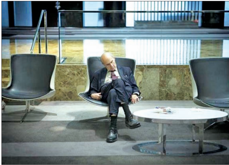
A businessman takes a mid-day nap in the lobby of a midtown hotel in the Manhattan borough of New York.

NEW YORK — People who get less than six hours of sleep a night may be more likely to have risk factors that increase their odds of diabetes, heart disease and strokes, a Korean study suggests.