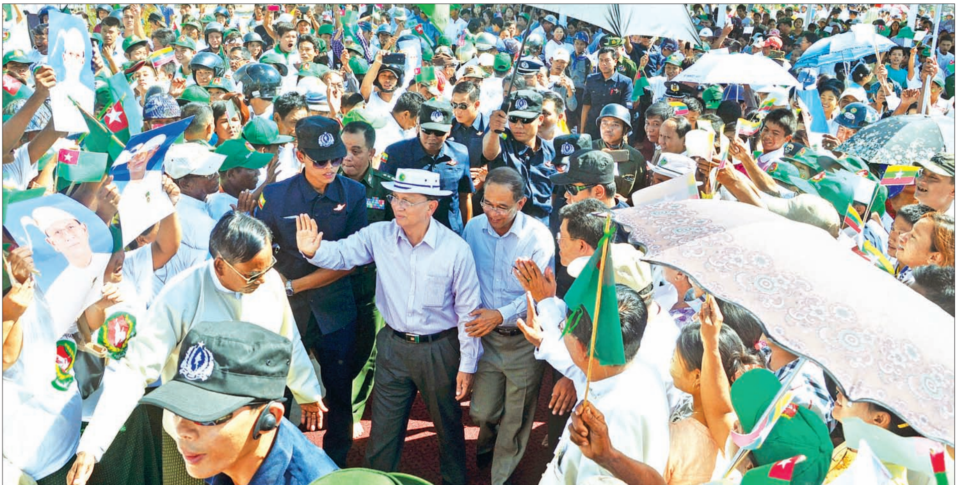
President U Thein Sein receives a warm welcome from locals in Meiktila.

PRESIDENT U Thein Sein, together with the Commander-in-Chief of Defence Services and union ministers left Pyin Oo Lwin for the Myogyi Multipurpose Dam Project in Ywangan