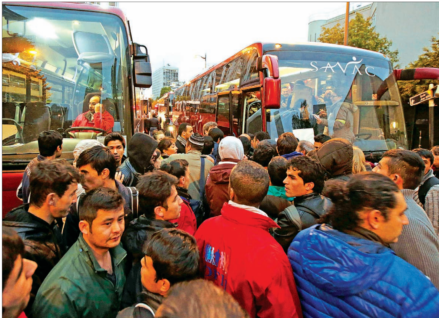
Migrants board buses after their evacuation from the Lycee Jean Quarre, an empty secondary school occupied by hundred of migrants and asylum seekers in the 19th district in Paris, France, on 23 October 2015.

PARIS — Police started moving hundreds of refugees and migrants out of a decommissioned secondary school in Paris early on Friday, ending a four-month stand-off over their use of the building.