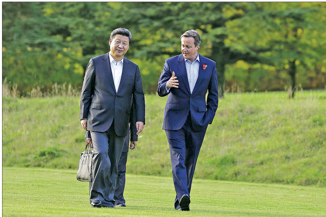
Britain's Prime Minister David Cameron walks in the gardens as he welcomes Chinese President Xi Jinping, with an interpreter (obscured), to his official residence at Chequers, England.

ous Europe and a united EU, and hopes Britain, as an important member of the EU, can play an even more positive and constructive role in promoting the deepening development of China-EU ties," it paraphrased Xi as saying.