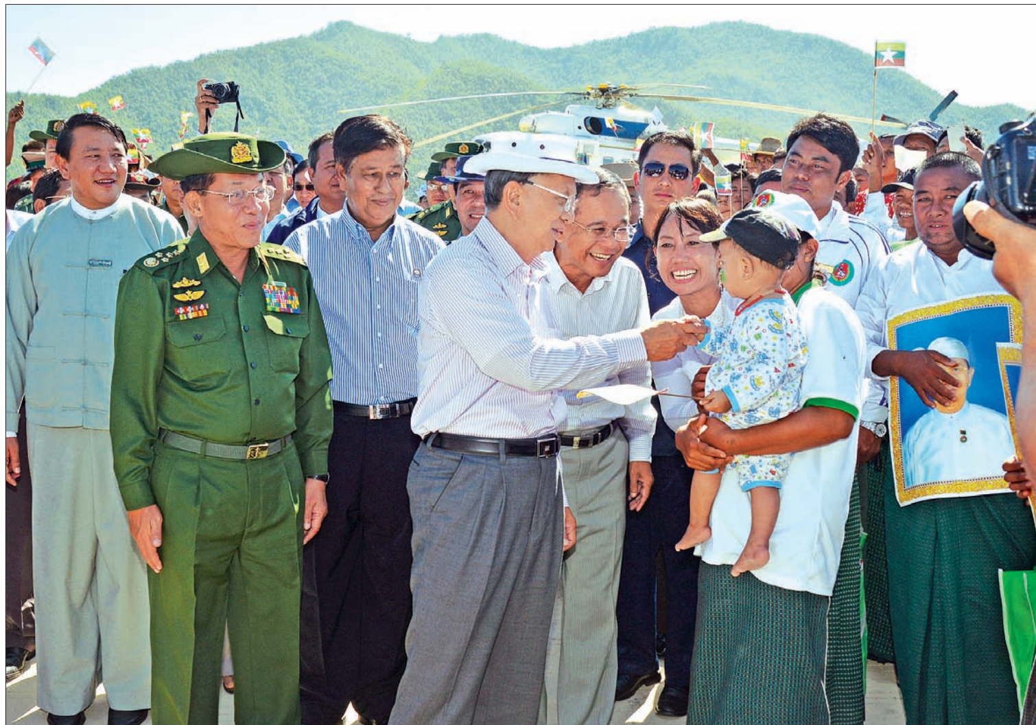
President U Thein Sein talks to a local mother and a child during his tour of Myogyi Dam.

Myogyi Multipurpose Dam Project, together with other dams and reservoirs, will contribute to the greening of the entire Meiktila Plain and aid agricultural development, the president said. As the project will generate 30 megawatts of electricity it will be capable of distributing power to Ywangan in the Danu Self-Administered Zone, via existing electricity supply networks. Locals require electricity not only for household use but for industry. The state government and the self-administered zone governing body are responsible for the development of small and medium enterprises (SMEs). It is also necessary to supply electricity to