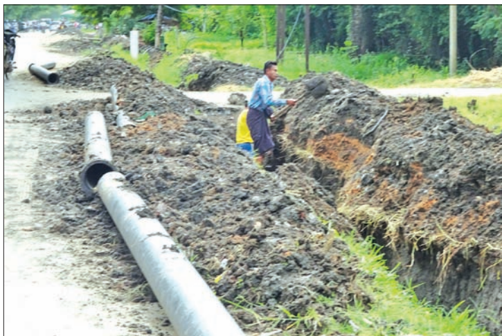
Workers lay a pipeline for water supply service in Mandalay.

RESIDENTS in Pyigyitagun Township, Mandalay Region, are currently receiving just five percent of their water needs. To improve the water supplies, a grant was provided in July and the project is being implemented by TEC International Co., Ltd with the assis-