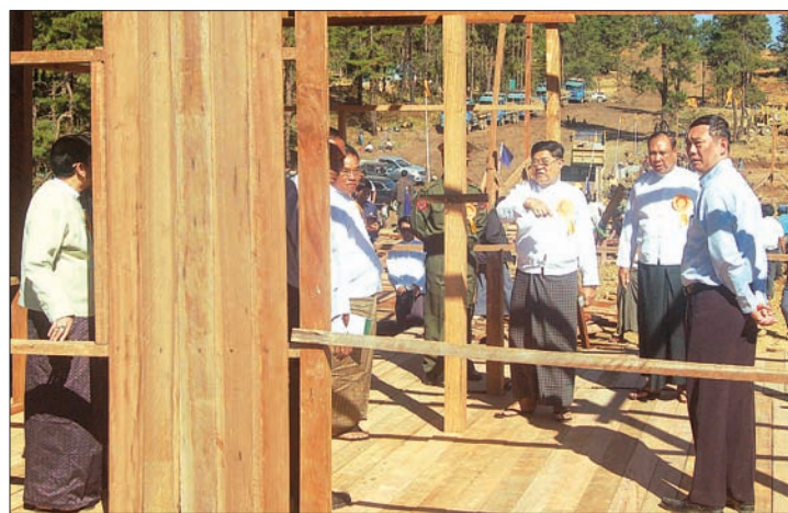
Union ministers U Soe Thane and U Win Tun assist in building resettlement site for flood victims in Hakha.

UNION ministers U Soe Thane and U Win Tun inspected the reclamation of land plots in Hakha, Chin State yesterday as part of resettlement plans for flood and landslide victims.