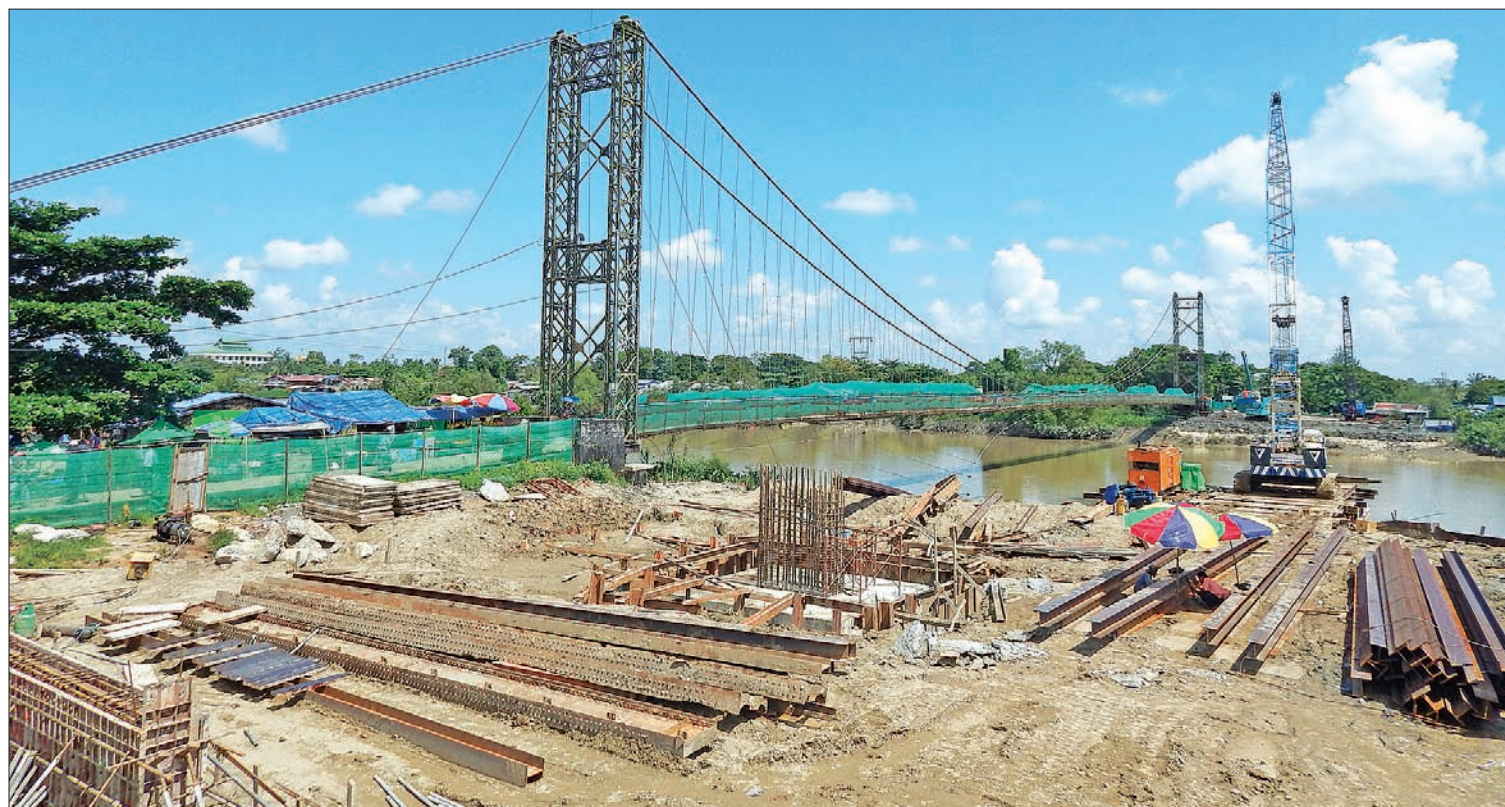
Ngamoeyeik Bridge is being constructed near the suspension bridge which link North Okkalapa with North Dagon.

THE Ngamoeyeik Bridge, which will link North Okkalapa with North Dagon, is now one-third completed. Work on the bridge began in mid-August and it is scheduled to be completed by March next year. The two-lane bridge is being constructed at a cost of K6 billion (US$ 4.7 million) and can withstand a load of 75 tonnes.