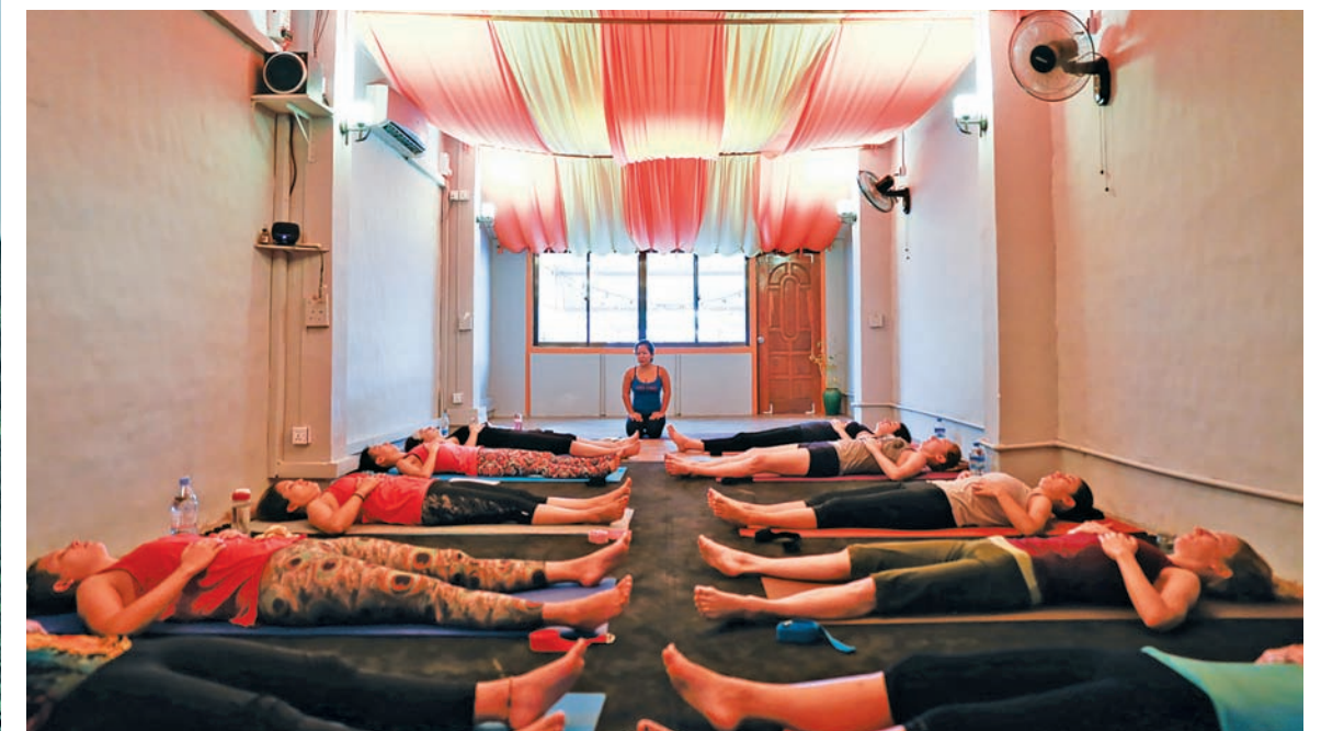
Yoga students at Yangon Yoga House in Yankin Township.