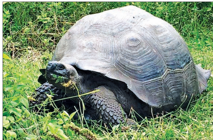
An Eastern Santa Cruz tortoise, Chelonoidis donfaustoi , is pictured on Santa Cruz Island in the Galapagos Islands in this undated handout photo obtained by Reuters 21 October 2015.

"Its closest relative is not the species on the same island but a species from the neighbouring is-