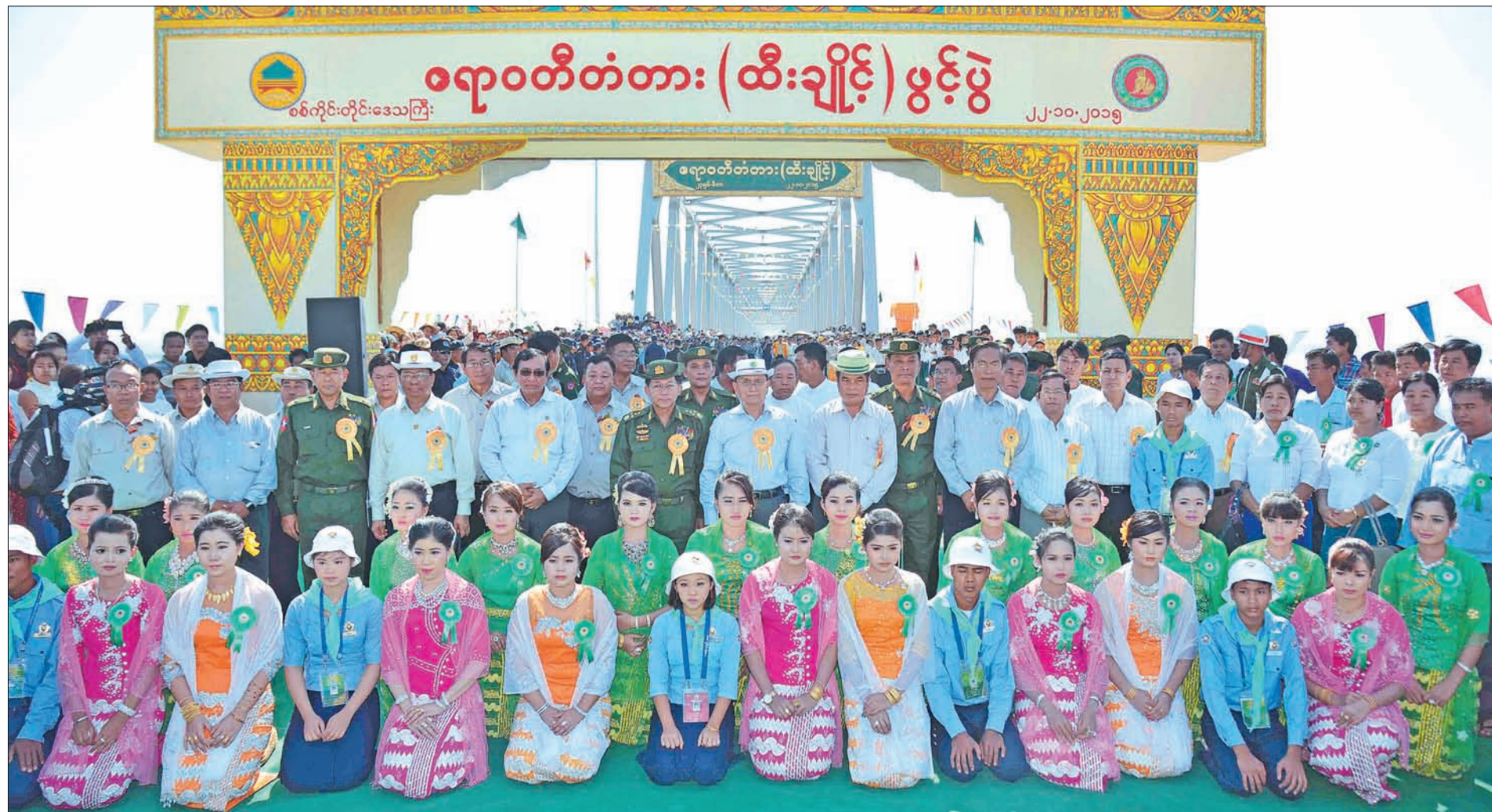
President U Thein Sein poses for documentary photo together with dignitaries and local people at opening of Ayeyawady Bridge (Htigyaing).

AYEYAWADY Bridge (Htigyaing) was officially opened by President U Thein Sein on Thursday.