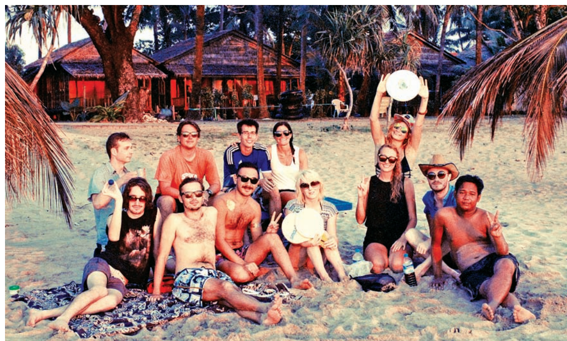
Yangon Ultimate Frisbee members pride themselves on their above-average intelligence and physical beauty.

More than 20 members of the Yangon Ultimate Frisbee club held a series of friendly matches at Shwe Hin Tha Resort at Nwe Saung Beach on 17 and 18 October to celebrate life in general. Once a secret well-kept by North American teachers, Yangon's finest frisbee club gradually opened its doors to journalists, entrepreneurs and humanitarians over the previous fiscal year. The group meets at the practice fields opposite Thuwanna National Stadium every Tuesday at 4:45 pm. Newcomers of all skill levels and vocations are welcome.