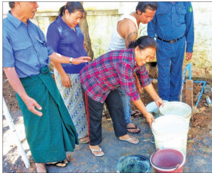
Villagers and officials start to use water supply facility under the Yen Loan Projects for Local Infrastructure Development in Taunggyi, Shan State.

The Government of Japan is willing to further contribute to the poverty reduction and improvement of livelihoods of the Myanmar people both in urban and rural areas. Japan believes such cooperation will help Myanmar to fulfill its vast potential, thus realize inclusive growth and balanced economy in this country. —JICA