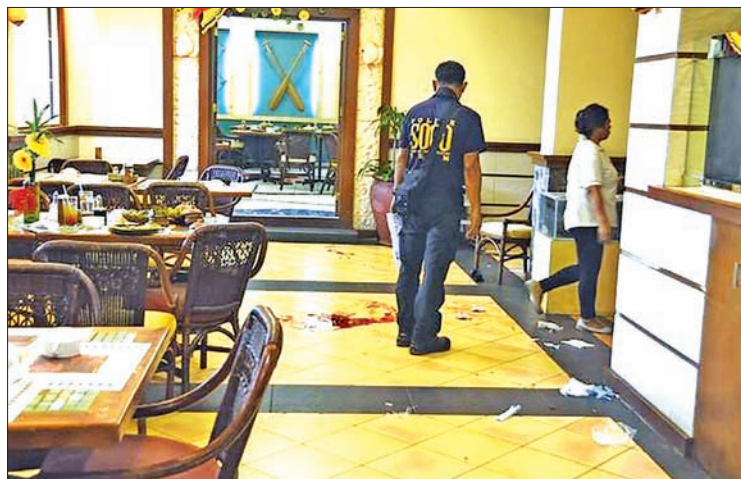
A police investigator surveys the blood-stained floor at the Lighthouse restaurant, where three Chinese diplomats were shot, in Cebu city, central Philippines on 21 October 2015.

“Upon the request of the Chinese embassy, they are being held by Philippine authorities in Cebu,” he said. “As soon as their security team from Beijing arrives here we will turn over the custody to the Chinese side.”