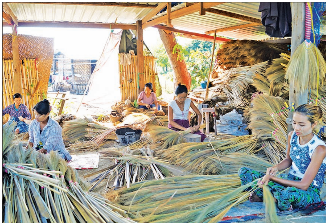
Villagers have earned a good income from broom business in Thayetpin Village, Pobbathiri Township.