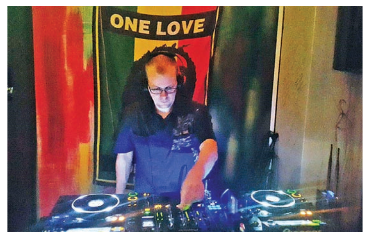
DJ? Czech.

7 th Joint Bar & Grill, downtown Yangon's famed reggae-themed party palace, threw a special bash called Fusion — a "Ragga Jungle & DNB Music Mix", featuring guest DJs from Prague, last Saturday night. 7 th Joint also hosts open mic nights on Tuesdays, Burmese music sets on Wednesdays and other live bands on Fridays. Be sure to check them out.