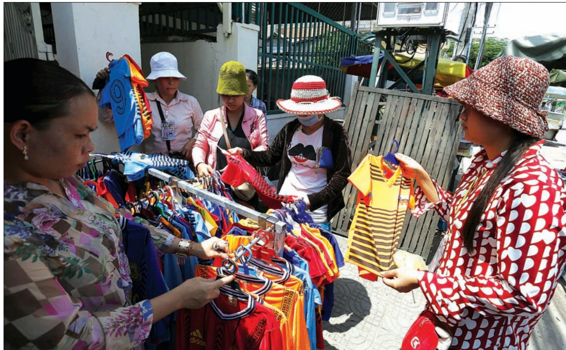
Garment workers look at shirts at a clothing stall after their lunch time in Phnom Penh.

Dennis Barbian Renewable energy market development adviser