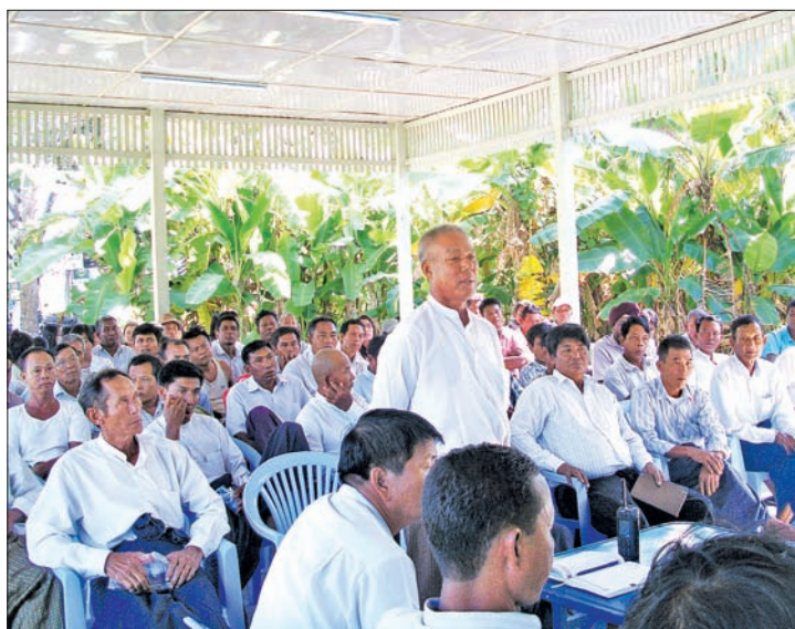
Farmers asked assistance from officials of the Agricultural Department to grow winter crops as they are threatened by climate change.