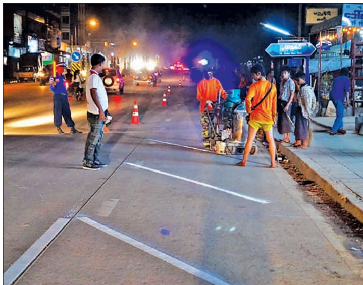
Workers painted lines on a road to mark car parking area in Myawady. PHOTO: HTEIN LIN AUNG (IPRD).

Myawady is home to Myanmar's second largest border trading facility, leading to rapid urbanisation and traffic congestion. The township is located on the border with Thailand.— Htein Lin Aung (IPRD)