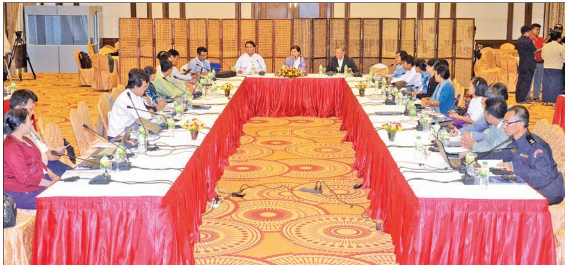
About 40 officials discussed the present climate change in Myanmar at Fifteenth Monsoon Forum.