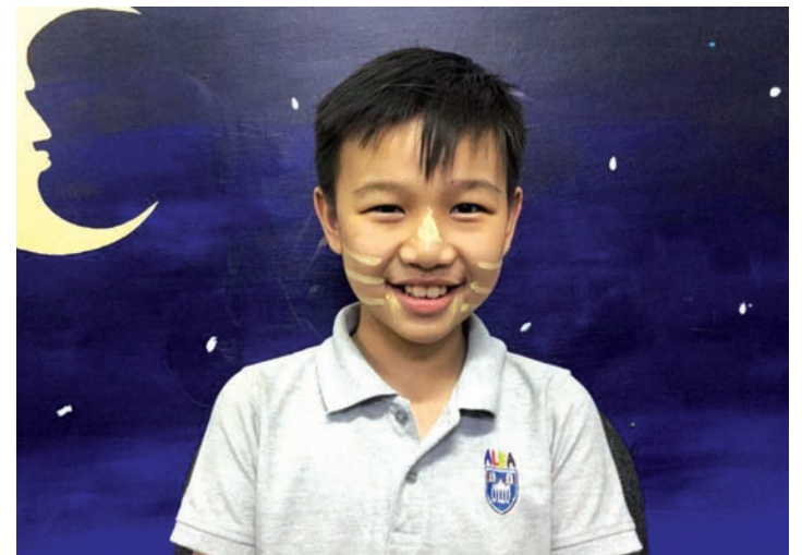
Can you compete with these beautiful faces?