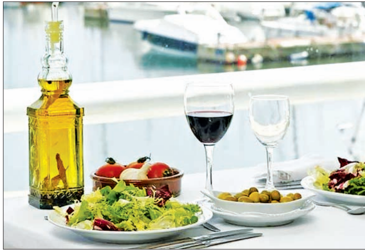
Food is seen on a table at a restaurant at the port of El Masnou, near Barcelona, on 16 May, 2008.

NEW YORK — Following a Mediterranean diet rich in fruits, vegetables, legumes, whole grains, fish and healthy fats may preserve a more youthful brain in old age, a US study suggests.