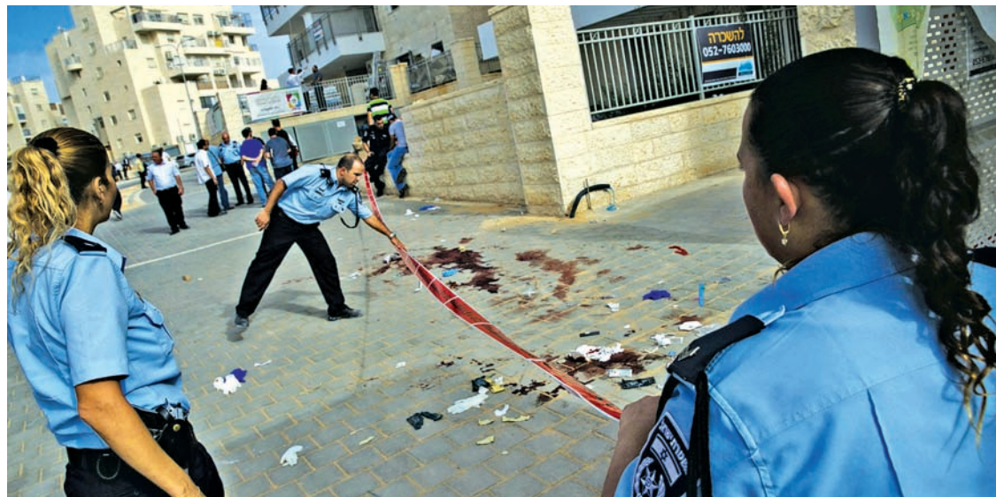
Israeli police cordon off the area of a stabbing, west of Jerusalem, in the town of Beit Shemesh, Israel, on 22 October 2015.

On Wednesday, UN Secretary General Ban Ki-moon held talks with Palestinian President Mahmoud Abbas. But after two days of discussions in the region, there was no sign Ban had made progress towards bringing both sides back from what he described as a "dangerous abyss".—Reuters