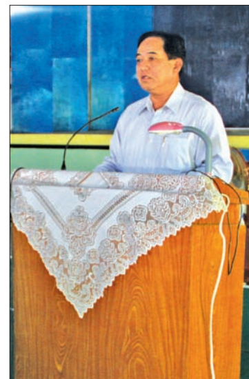
Union Minister for Energy U Zeyar Aung.

Vote for the candidate who displays a great ability to lead the country, he said. U Zeyar Aung is also the minister of communications and information technology.— Ministry of Energy