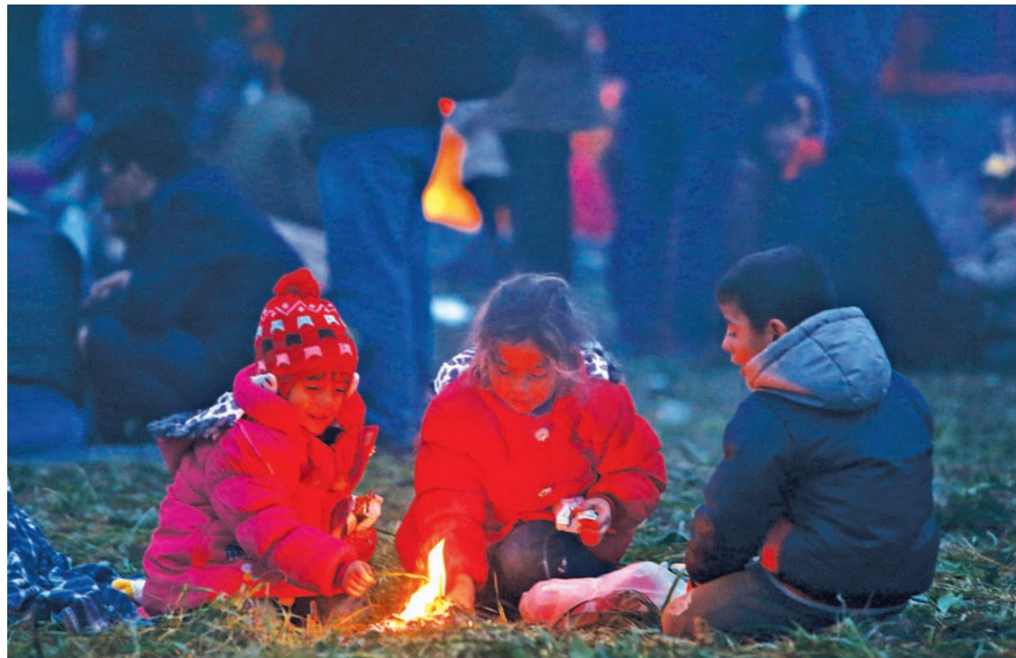
Migrants' children keep themselves warm around a fire after crossing the border from Croatia in Rigonce, Slovenia, on 22 October 2015.

BUDAPEST — Hungarian Prime Minister Viktor Orban urged European leaders late on Wednesday to change their immigration policies and involve voters in a debate about the continent's future, saying they would otherwise face a political crisis and a threat to the democratic order.