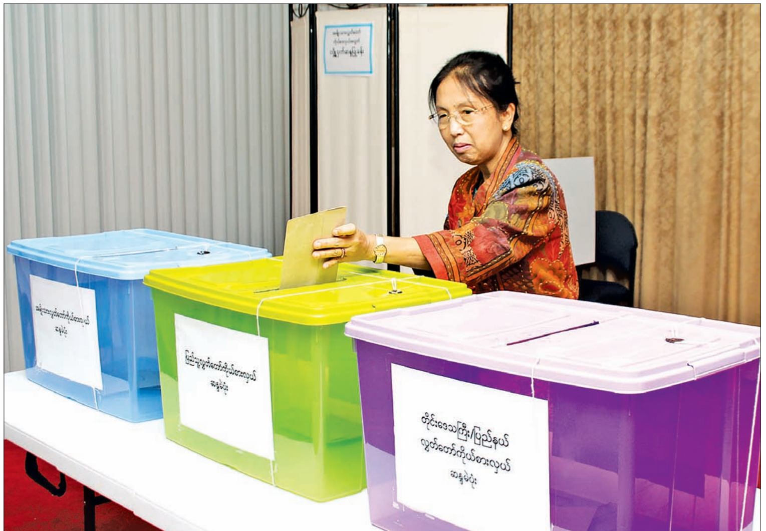
A woman cast advance vote at Myanmar embassy in Canberra, Australia.

About 790 overseas citizens cast advance votes on Wednesday.