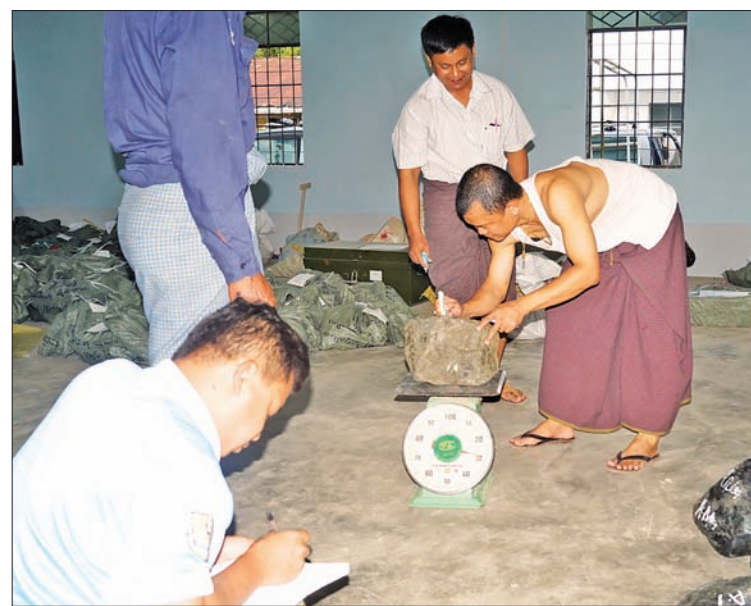
Authorities registered seized jade stones.

A TEAM of officials from various departments in Muse, northern Shan State, seized a cache of unauthorised jade on 18 October. The stones were seized at the Asia World Toll Gate, where they were found in an unregistered vehicle. The jades have an estimated worth of K196 million (US$154,000), and the vehicle was valued at K5 million ($3,920). The jade and car were handed over to the Myanmar Gems Brokerage and the Customs Department, respectively.—Muse(IPRD)