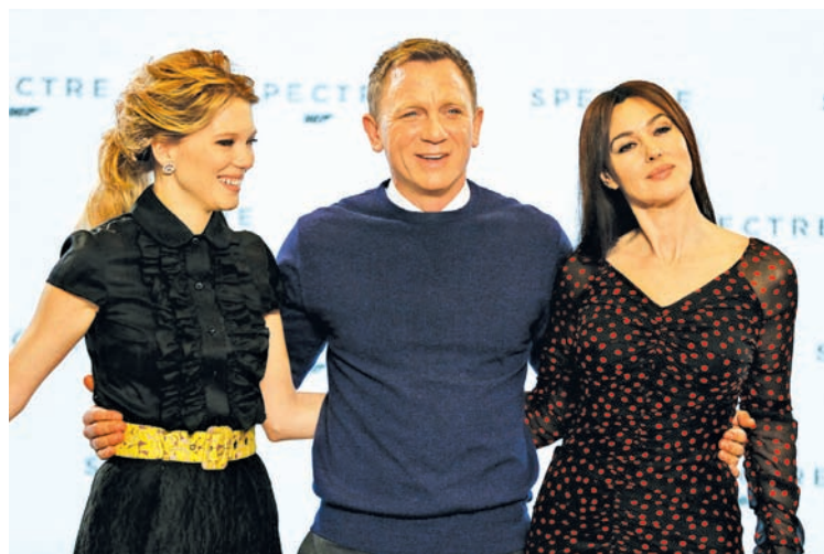
Lea Seydoux, Daniel Craig and Monica Bellucci.

LONDON — It may be no coincidence that Agent 007's latest love interest, played by French actress Lea Seydoux in the new James Bond movie "Spectre," is called Madeleine Swann, because the film seems like a swan song for some of the participants.