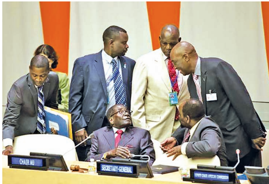
Zimbabwe's President Robert Mugabe greets other attendees before the sixth high-level meeting of the Regional Oversight Mechanism of the Peace, Security and Cooperation Framework for the Democratic Republic of the Congo and the Region, during the United Nations General Assembly at the United Nations Headquarters in Manhattan, New York on 29 September, 2015.

The government is forecasting growth of 1.5 percent this year but many analysts say Zimbabwe is