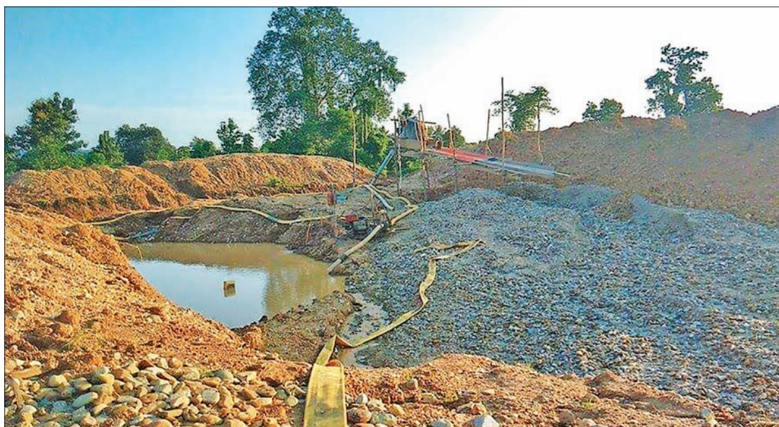
Illegal gold mine in Bhamauk Township is causing pollution of the rivers.