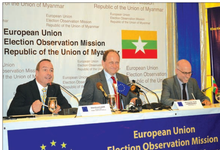
Alexander Graf Lambsdorff, chief observer of the EU's election observation mission speaks at a press conference marking the conclusion of his five-day visit to Myanmar in Yangon yesterday.

USDP and NLD, and representatives from civil society groups. He also observed political candidates' campaigning in Yangon and Mandalay regions.