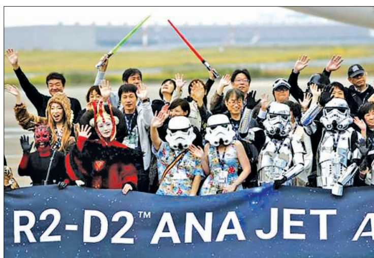
Cosplayers, dressed up as characters from ‘Star Wars’, wave in front of an All Nippon Airways (ANA) Boeing 787-9 Dreamliner JA873A named the ‘R2-D2 ANA JET’ during a fan flight event at Haneda airport.

Kylo Ren is shown alongside the charred mask of Darth Vader, saying “Nothing will stand in our way. I will finish what you started.” Fans have until now only seen two teasers: November’s 88-second trailer and April’s 2-minute trailer, in which Han Solo and Chewbacca made their first appearance.