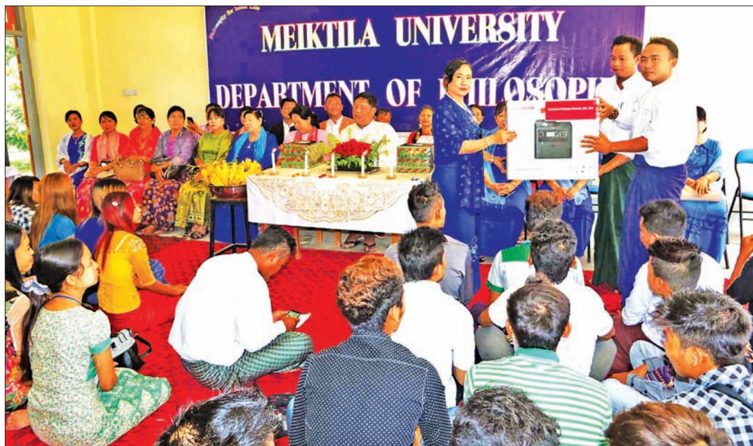
Myanmar philosophers gathering at Meiktila University to pay respect to their teachers.

STUDENTS from the Philosophy Department in Meiktila Distance Education Branch of Mandalay Distance