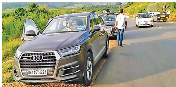
A caravan of tourists taking Muse-Lashoi-Pyin Oo Lwin-Mandalay-Gantaw-Kalay road to reach Tamu.

The ministry announced earlier this month that Myanmar is on track to receive the targeted figure of 4.5 international arrivals in the 2015-16 financial year.—Ministry of Hotels and Tourism