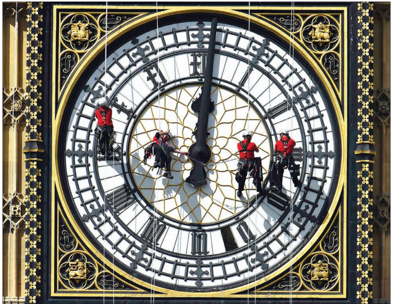
Cleaners abseil down one of the faces of Big Ben, to clean and polish the clock face, above the Houses of Parliament, in central London.

Big Ben's woes match those of the Houses of Parliament, which adjoin the tower and are themselves in need of restoration work that could cost as much as 5.7 billion pounds and take 32 years, according to a report published in June. —Reuters