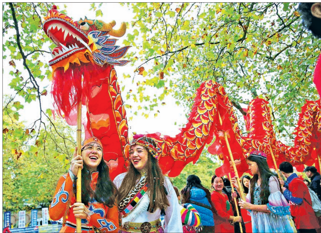
Supporters of China's President Xi Jinping wait on the Mall for him to pass during his ceremonial welcome, in London, on 20 October 2015.

"We don't know exactly what the content of the conversation will be this afternoon," the source said.— Reuters