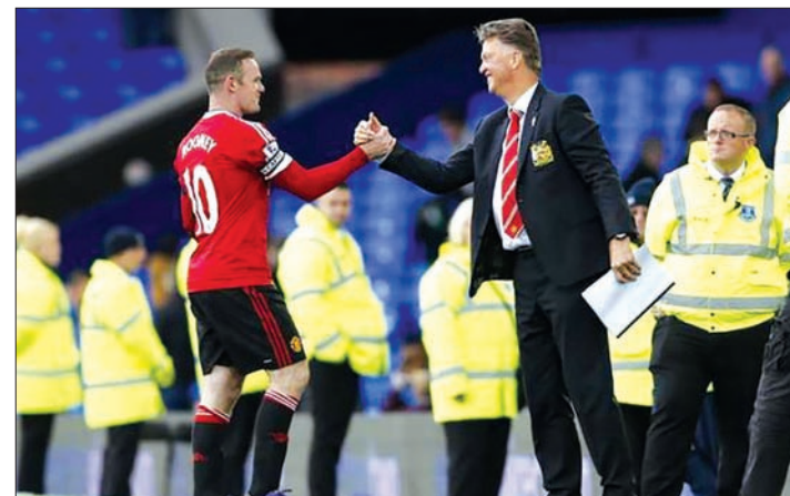
Manchester United manager Louis van Gaal shakes hands with Wayne Rooney at full time against Everton as they celebrate.

MOSCOW — Manchester United return to the scene of their 2008 Champions League triumph looking for a second away win over CSKA Moscow in exactly six years on Wednesday.