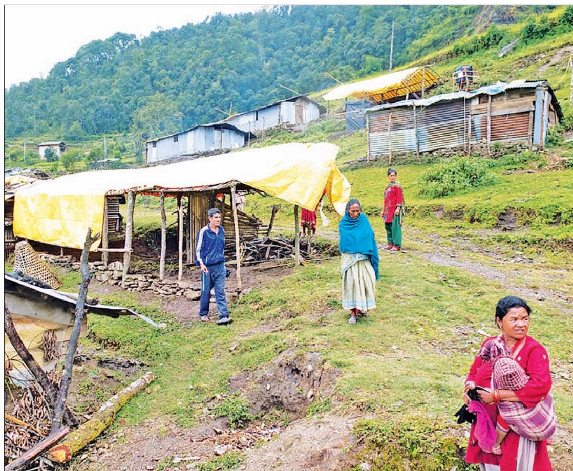
Displaced people living in a temporary camp in October 2015 in Nepal’s Dolakha district, which was at the epicentre of an earthquake on 25 April 2015.

under construction, rural Nepal is a multicoloured patchwork of supposedly temporary tarpaulins. The district of Dolakha, which was at the epicentre of the 25 April quake, is no exception. Residents interviewed last week told IRIN they had received no government assistance apart from a one-time payout of 15,000 rupees ($150) and 100kg of rice.