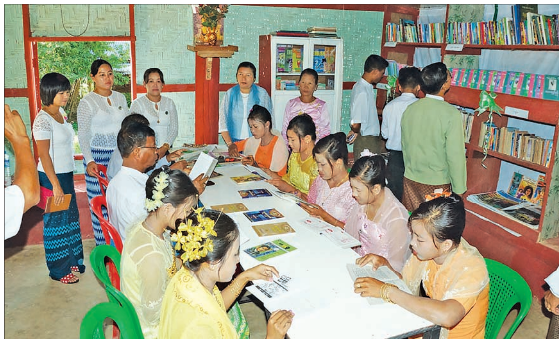
Villagers are reading at a library opened Monday in Pobbathiri Township.