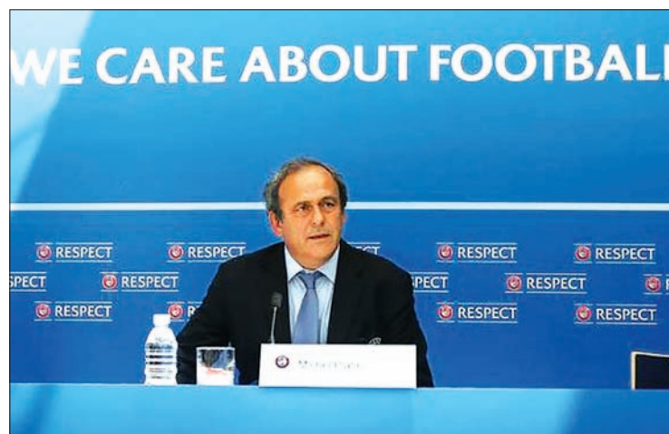
UEFA President Michel Platini.

PARIS — Michel Platini said the two million Swiss francs ($2.1 million) he received from FIFA, a payment which has cast a cloud over his bid to become president of the world football body, was legitimate reward for genuine work.