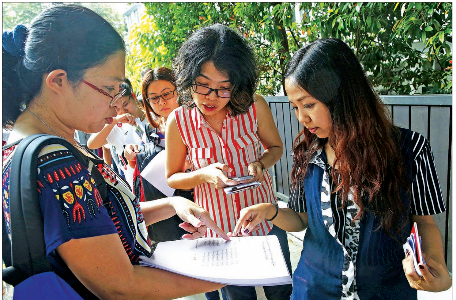
Myanmar nationals check their names with an officer before casting their votes outside the embassy in Singapore.

A contributing factor was the UEC's confusion over incomplete addresses being given, as well as when voters living over-