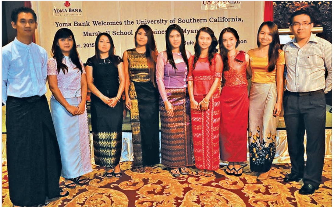
The Yoma Bank Team.