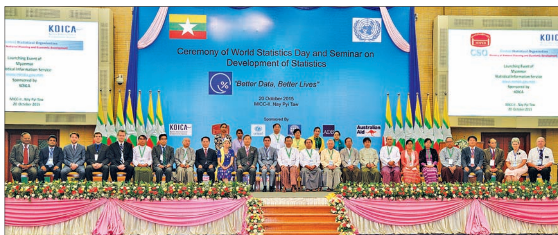
Dignitaries have documentary photo taken at ceremony to mark World Statistics Day.

The union minister said that it wasn't until recently that the importance of statistics in developing policies were duly recognised, along with their link to achieving sustainable develop-