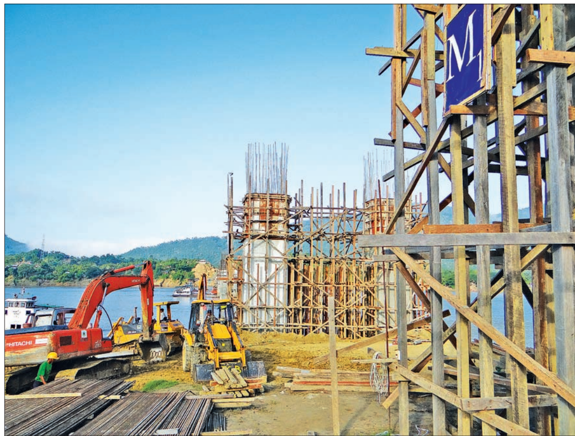
A new bridge is under construction in a new town for the people worstly affected by landslides in Haka.