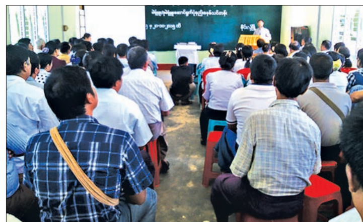
Ballot officials attending training course for elections in Monglon.

Data from the 2014 census — the first to take place in Myanmar for 30 years — was also distributed to relevant departments on both days.— U Myint Aung