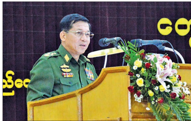
Commander-in-Chief Senior General Min Aung Hlaing delivers address at the National Defence College.