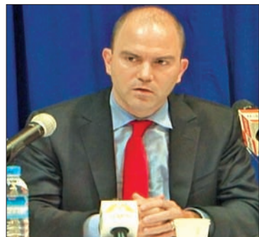
Mr Ben Rhodes, Deputy National Security Advisor to the US President.

MR Ben Rhodes, Deputy National Security Advisor to the US President, held a press conference on his visit to Myanmar at the American Centre in Yangon on Tuesday.