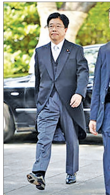
Katsunobu Kato, Cabinet Minister.

this year. The number of visitors dropped this fall from a year earlier as most lawmakers are apparently not in Tokyo as the Diet is now in recess.— Kyodo News