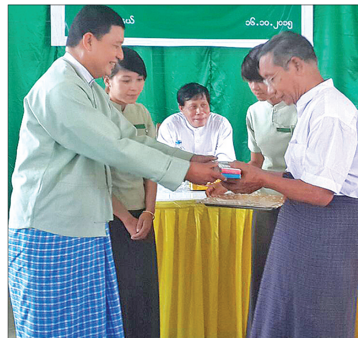
A farmer receives compensation from local authority.

COMPENSATIONS for 10.4 acres of land to 31 farmers were presented on 16 October at Dekkinathiri Township General Administration Office. The mount totaled K