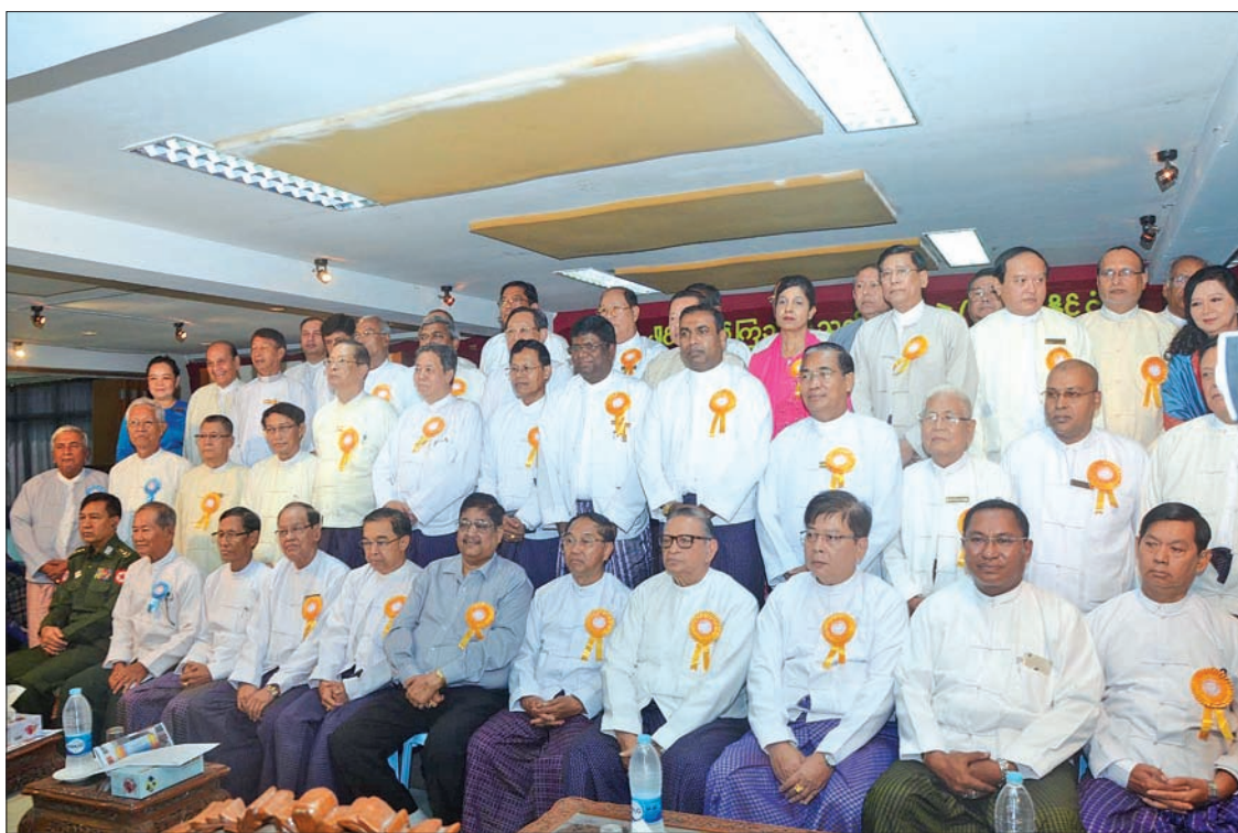
Yangon Region Chief Minister U Myint Swe and members of Interfaith Dialogue Group pose for photo.

The upper Myanmar branch of the association had held a similar meeting on 25 July.— Soe Win