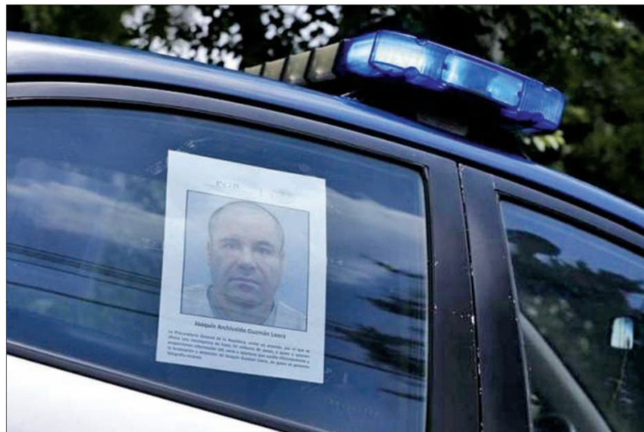
A police vehicle is seen a poster with a photo of drug lord Joaquin "El Chapo" Guzman offering a reward of 60 million Mexican pesos for information along a street in Mexico City.