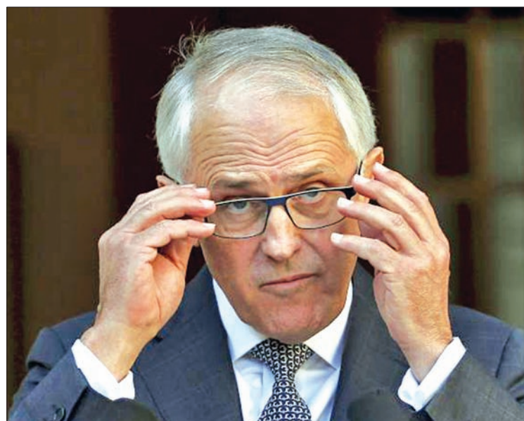
Australian Prime Minister Malcolm Turnbull.

CANBERRA — Australia's Prime Minister Malcolm Turnbull on Saturday sought to soothe friction with Wellington over the plight of hundreds of New Zealanders held in Australian detention centres or facing deportation under tough immigration laws.