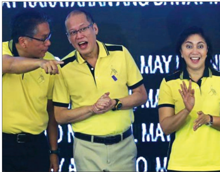
Philippines President Benigno Aquino listens to Liberal Party (LP) presidential candidate Manuel Roxas (L) while vice-presidential candidate Leni Robredo (R) waves to her supporters during a LP gathering of friends at Club Filipino in San Juan, metro Manila on 5 October 2015.

MANILA — A record 130 Filipinos registered as candidates to succeed Benigno Aquino as Philippine president in next year's general election by Friday's deadline, the elections agency said. A man who registered his name as Lucifer, a