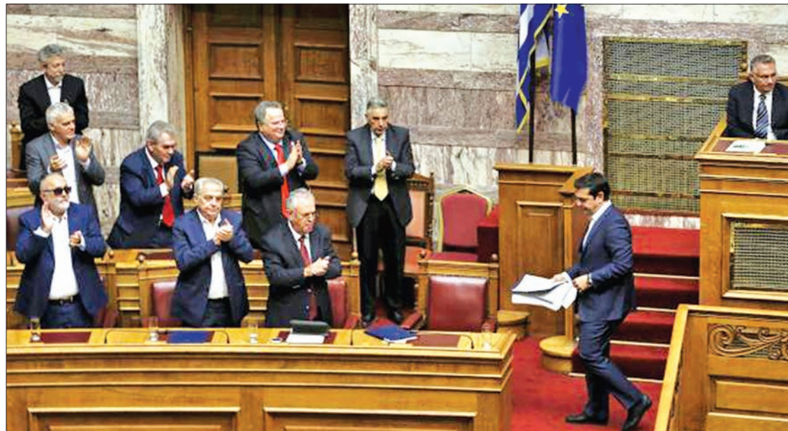
Greek Prime Minister Alexis Tsipras acknowledges applause from ministers of his government following his speech during a parliamentary session before a vote of confidence at the parliament building in Athens, Greece on 8 October 2015.