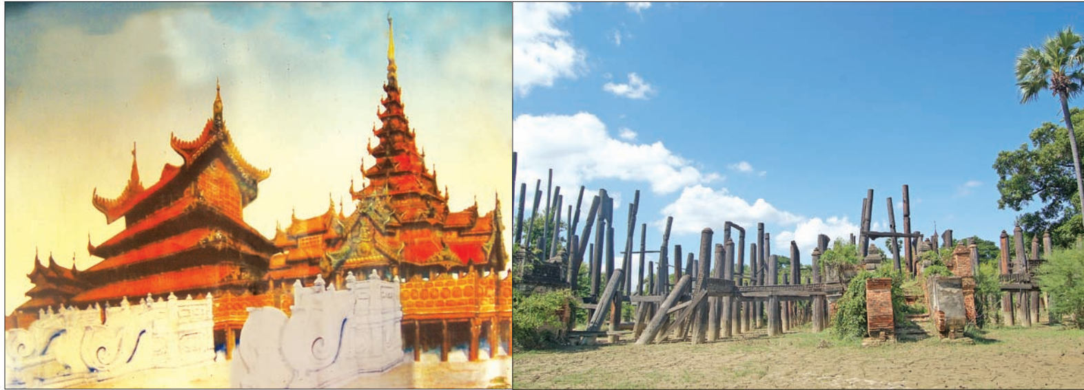
The original Pakhan Nge monastery (left) and the ruins seen today.

AN ANCIENT monastery-built over 150 years ago during the Konbaung era in Pakhan Nge village, is deteriorating and in desperate need of conservation, according to local residents.