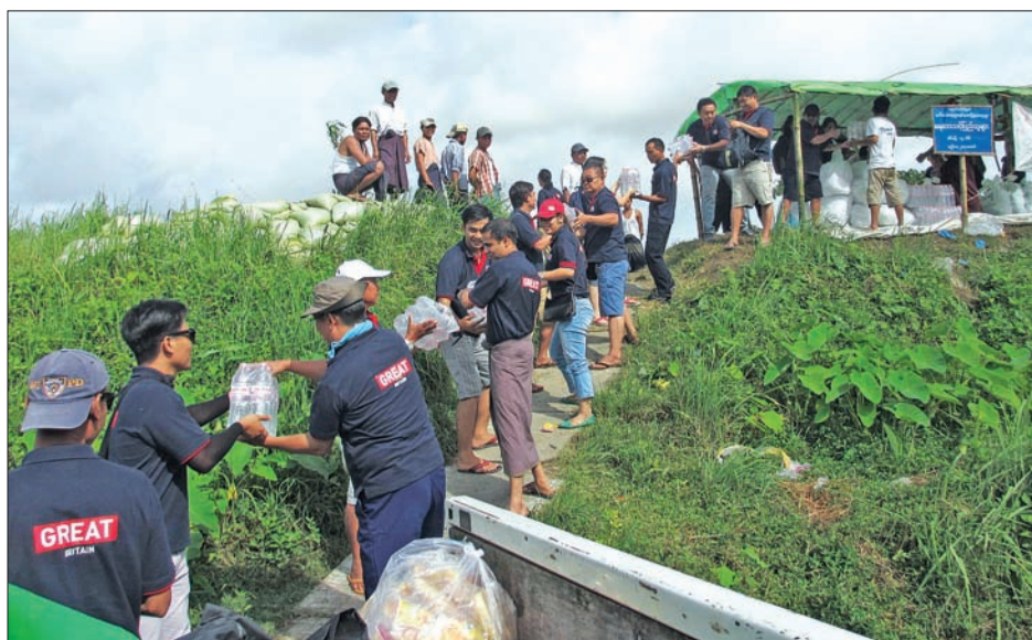
Members of the British Embassy provide flood relief supplies in Ayeyarwaddy Region in August.