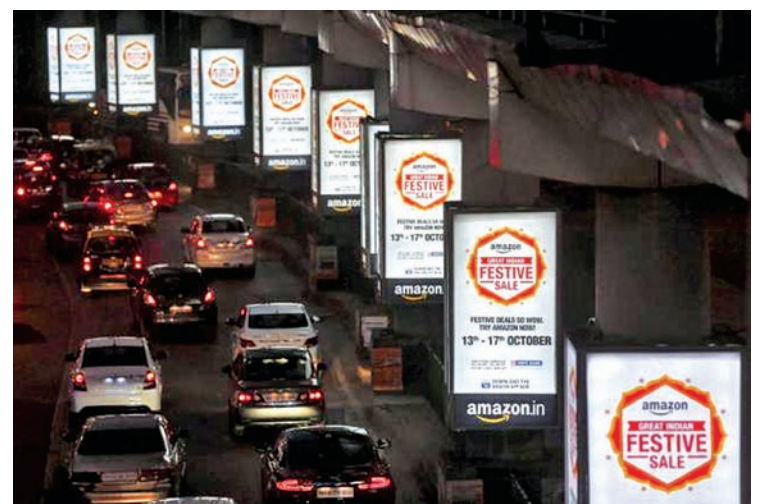
Traffic moves on a road past advertisements of Indian online marketplace Amazon, in Mumbai, India, on 15 October 2015.

According to website analytics firm Alexa, Amazon's India website was now ranked the 6 th most visited website locally and the 83 rd most visited site globally