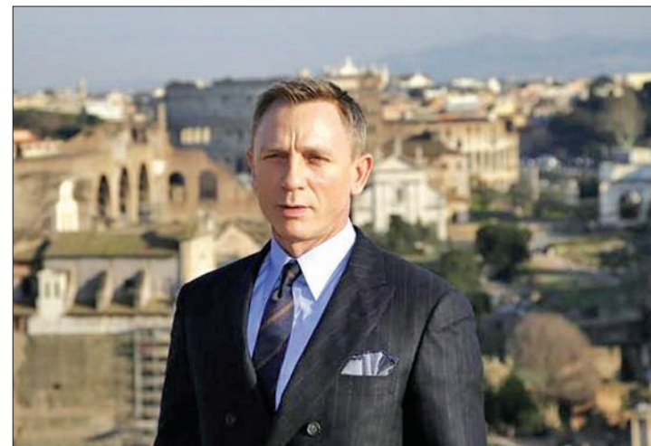
Actor Daniel Craig poses during a photo call for the new James Bond film “Spectre” in downtown Rome.

LONDON — From Sean Connery to Daniel Craig, London wax museum Madame Tussauds is putting on display figures of the six James Bond actors before the release of the latest 007 film, “Spectre”.