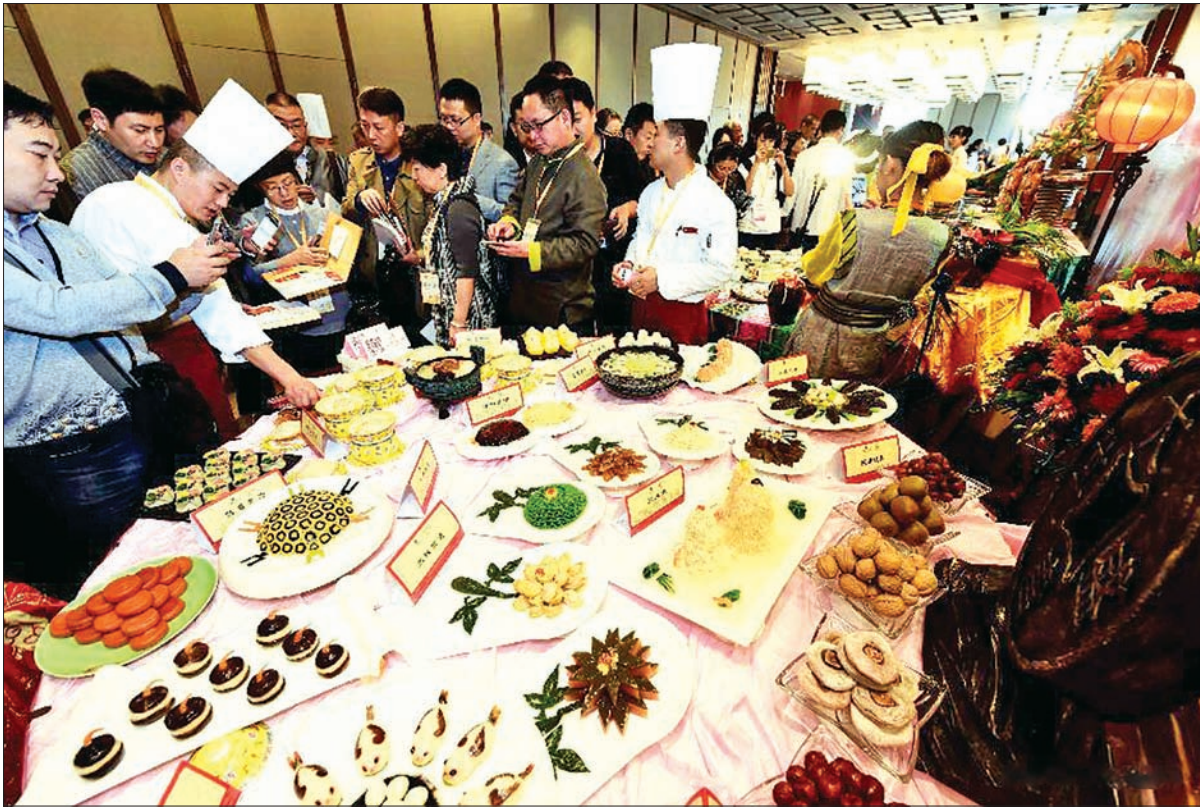
Guests view the gourmet food during the Asian Food Study Conference in Qufu City, east China's Shandong Province, on 17 October 2015.