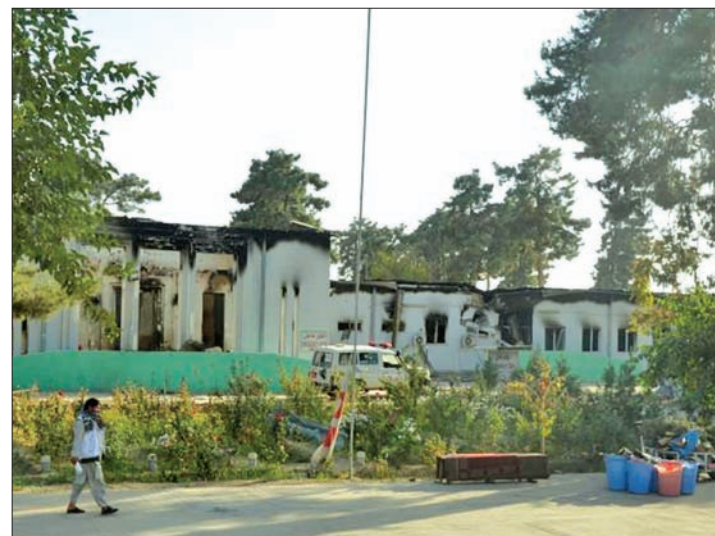
An Afghan man walks in front of the Medecins Sans Frontieres (MSF) hospital in Kunduz Afghanistan on 14 October 2015.

KABUL — Medical aid group Medecins Sans Frontieres said on Friday that a US tank entered the grounds of its hospital in the northern Afghan city of Kunduz without permission, damaging the compound that was hit in a US air strike earlier this month.