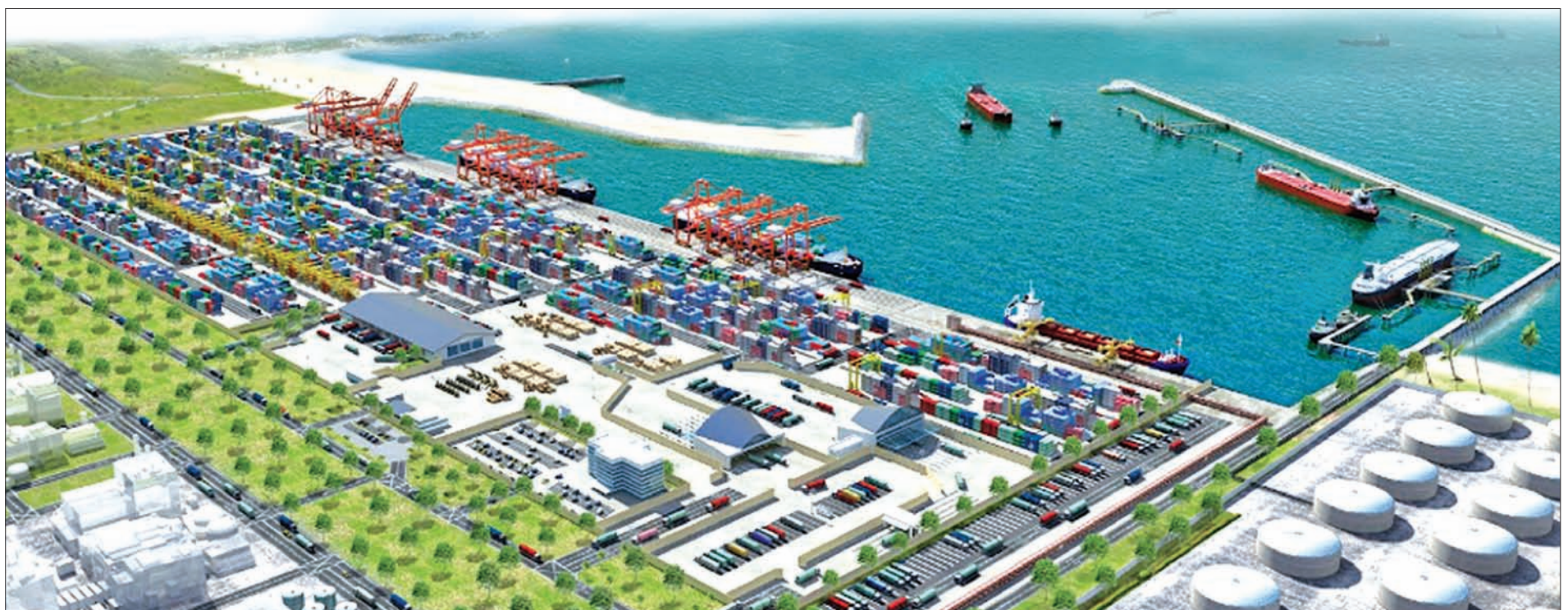
An artist's impression of the Kyauk Phyu deep sea port project that will unlock the potential of the hinterland and fulfill the country's potential as a trade corridor for Africa, the Middle East and China.

Kyauk Phyu SEZ awarded international flag of investment attractiveness