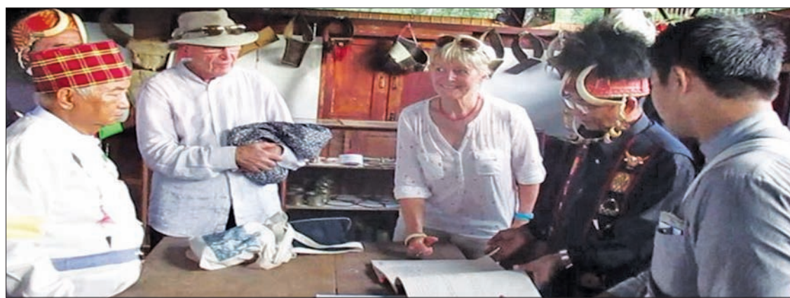
Tourists visits local area along Chindwin River and meet locals.

WITH the cooperation of Ministry of Hotel and Tourism and travel tour companies, river cruises have been provided by national private river ships to interested foreign tourists. Road tours for cyclists have also been arranged.