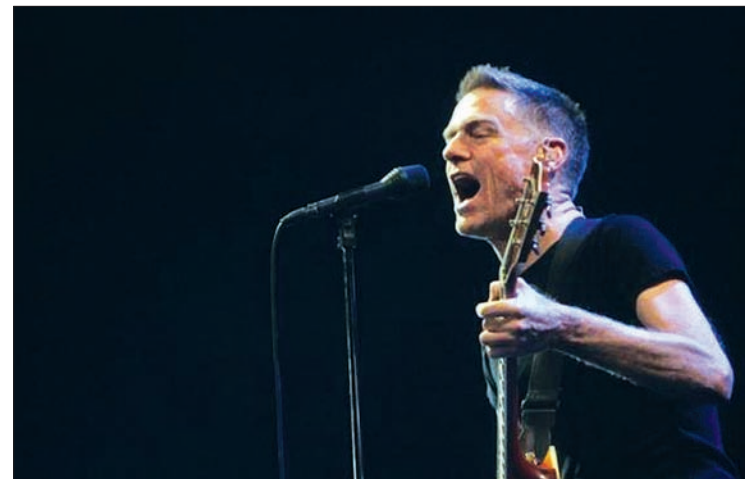
Canadian singer Bryan Adams performs onstage in Riga.

have a new perspective for music,” he said, adding: “Music is always the top of the heap. I'm not going to quit my day job.”—Reuters