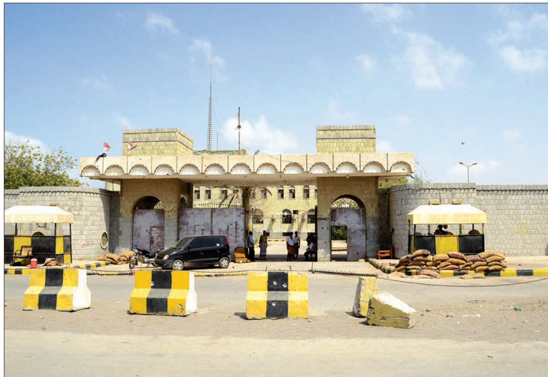
Guards stand at the south gate of an intelligence building in Yemen's western city of Hodaida on 16 October 2015.

SANAA — An apparent suicide bombing and gun attack claimed by Al Qaeda killed 10 soldiers guarding an intelligence building in the western Yemeni city of Hodaida on Friday, security sources said.