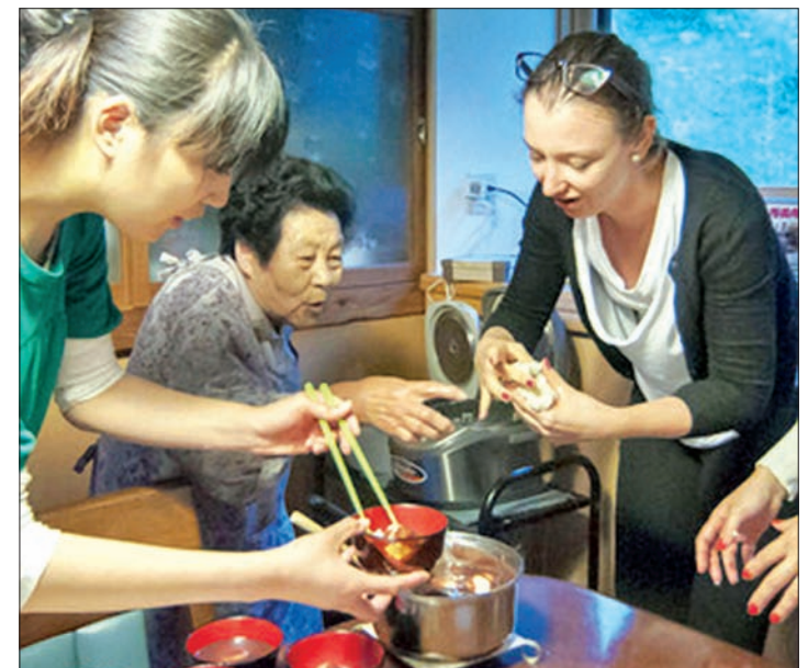
Tourists staying at the private residence of a woman (C) in Hiraizumi, Iwate Prefecture, registered on the Tomarina website run by Tomareru Inc., a subsidiary of Hyakusenrenma Inc.

He said that the service is intended to help rural areas compensate for a lack of accommodations during festivals and sports events. For example, Aomori in northern Japan, where popular Nebuta and Neputa festivals take place in August, and Tokushima in western Japan to which more than 1 million tourists flock during the summer Awa Odori festival, suffer from a shortage of hotel rooms at such times. Kamiyama believes that if more accommodations are available, visitor numbers will increase as will spending on food and other purchases, giving a boost to local economies.—Kyodo News