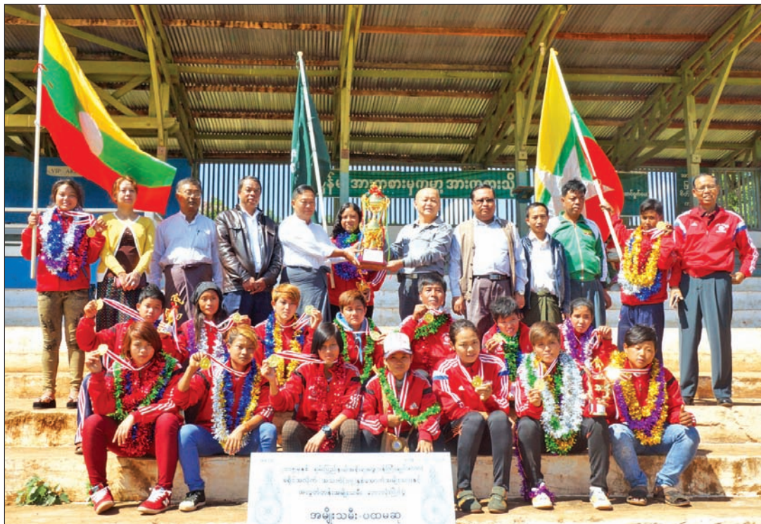
Kyaukmae District Women Football Team win 2015 Shan State Chief Minister's Trophy held in Taunggyi.

They took pictures with the town-elders.