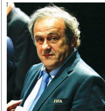
UEFA President Michel Platini.

LONDON — The English Football Association has suspended support for Michel Platini's bid to become FIFA president, after learning "more information relating to the issues from Mr Platini's lawyers", the FA said in a statement.