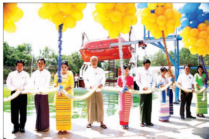
Deputy Minister for Transport U Han Sein opens maritime simulation room and Proficiency in Survival Craft and Rescue Boats course-PSC&RB at Myanmar Maritime University in Thanlyin.

The PSC&RB course was jointly organized by MMU and Brilliance Maritime Training Centre. The MMU has links foreign shipping companies and is helping students find jobs.— MNA