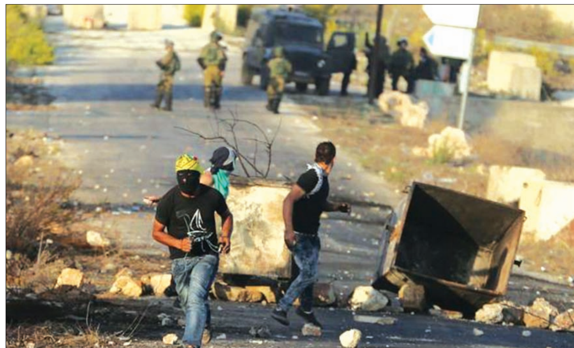
A Palestinian protester runs during clashes with the Israeli troops near the Jewish settlement of Beit El, near the West Bank city of Ramallah on 15 October 2015.

The United States has stepped up efforts to try to restore calm to the region. Secretary of State John Kerry spoke by phone with both Israeli Prime Minister Benjamin Netanyahu and Abbas to discuss ways to end the violence.—Reuters