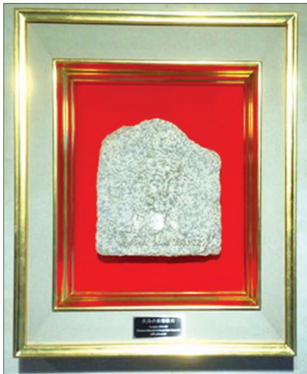
A peace stone from Hiroshima is installed at the Museum of Fine Arts of Baku in Azerbaijan on 16 October 2015.