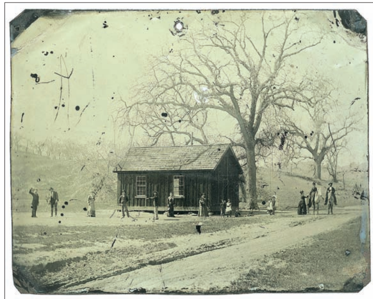
A newly discovered 4-by-5-inch tintype photograph featuring legendary Wild West gunslinger Billy the Kid (4 th L) playing croquet with accomplices from his New Mexico gang known as the Regulators, as seen in this image provided by www.kagins.com.