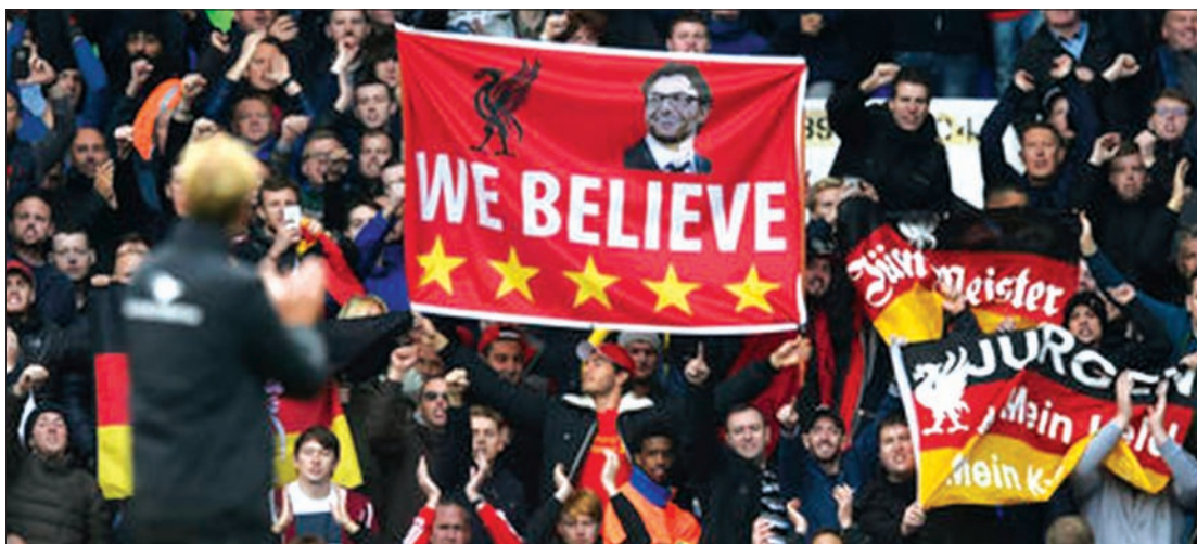
Liverpool manager Juergen Klopp appaluds fans after the game.

While the hosts never found an opening, they at least ended Liverpool's run of five successive league wins over them which included victories of 5-0 and 3-0 at White Hart Lane in the last two seasons.— Reuters