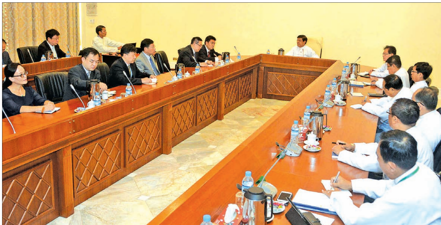
Vice President U Nyan Tun discusses flood prevention with Chinese experts.