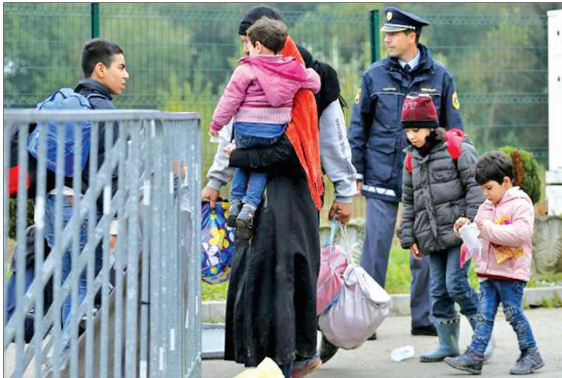
A migrant family walks to a registration center at a Croatia-Slovenia border crossing in Lendava, Slovenia on 17 October 2015.