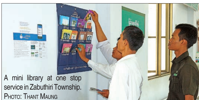
A mini library at one stop service in Zabuthiri Township.

Moreover, a mobile library of Ottara District Information and Public Relations Department made a tour to Ottarathiri Agriculture Department, on the same day. The library makes weekly tours to schools, offices, town wards and villages borrowing new books every week.