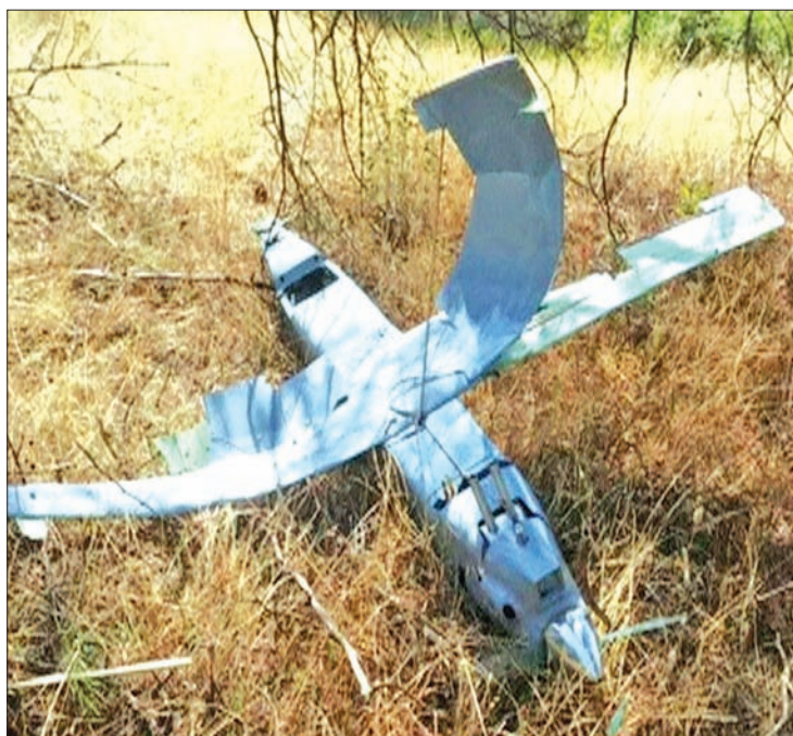
A still photograph used in a video shows a downed drone in Deliosman Village, Turkey on 16 October 2015.

The ministry also said it had agreed the technical details for an agreement with the United States on flight safety over Syria and a final memorandum would be signed soon.—Reuters