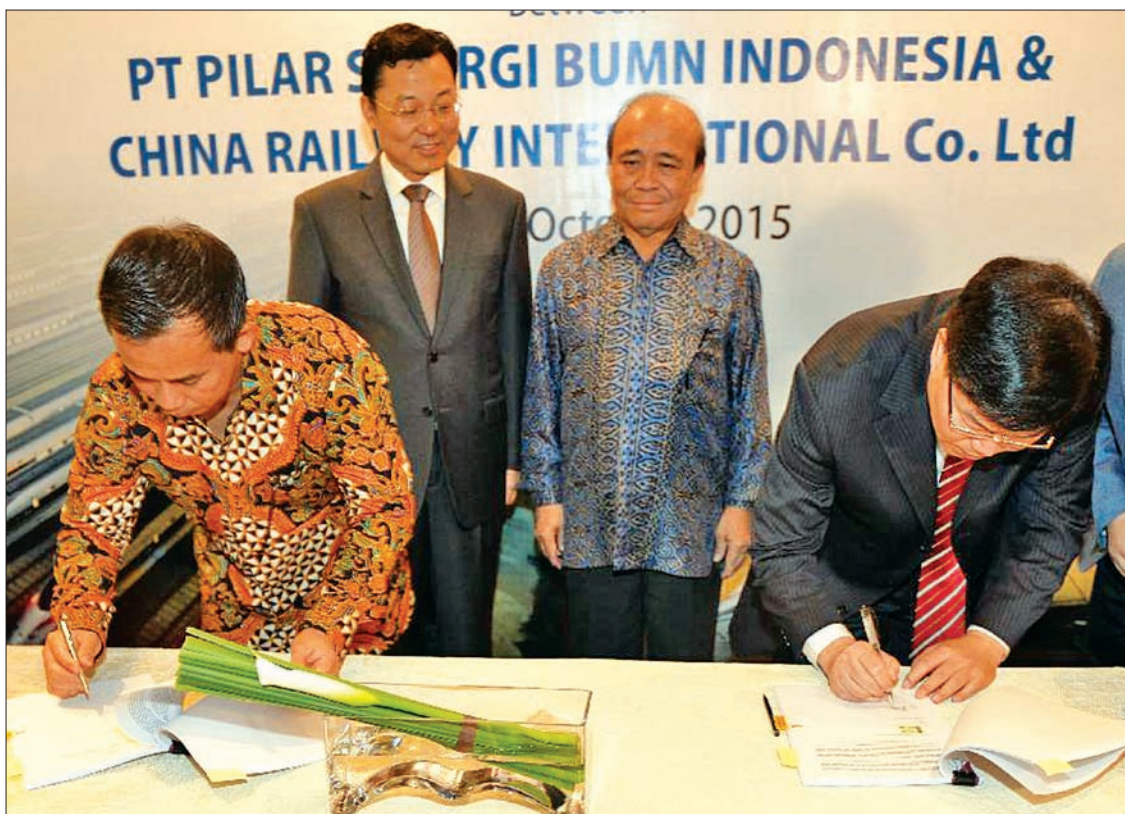
Delegates attend the Joint Venture Agreement signing ceremony in Jakarta, Indonesia, on 16 October 2015.

was joined by four state-run firms comprised of PT Wijaya Karya, PT Jasa Marga, PT Kereta Api Indonesia and PT Perkebunan Nusantara VIII.