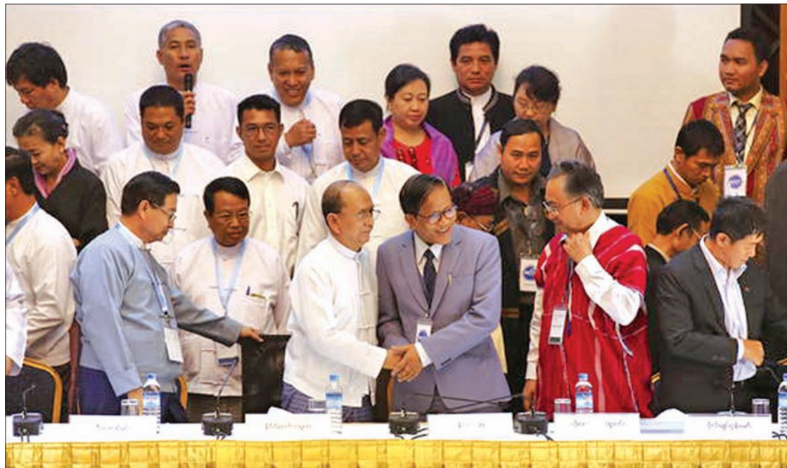
Myanmar President U Thein Sein and Naing Han Tha, a leader of the Nationwide Ceasefire Coordinating Team, shake hands after signing of an earlier draft ceasefire agreement at the Myanmar Peace Centre in Yangon on March 31.

First, the NCA will establish concrete mechanisms to transform the existing preliminary cease-fires into comprehensive arrangements so that there is not just a reduction of hostilities, but a cessation of hostilities between armed groups. The provisions protecting the civilians, the initiation of a code of conduct for all armed elements and the establishment of a Joint Monitoring Committee are just some of the tools anchored in the NCA