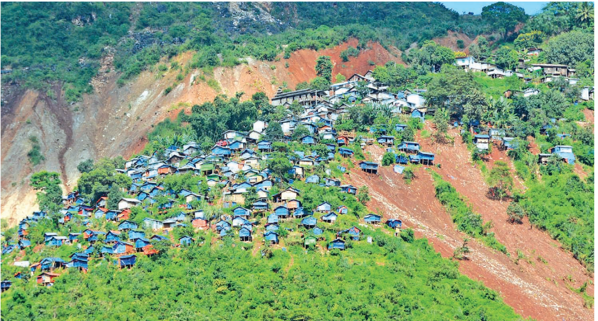
Aid from the government and donors has reached landslide-hit Mawchi.

President pledges to assist in reconstruction of landslide-hit Mawchi