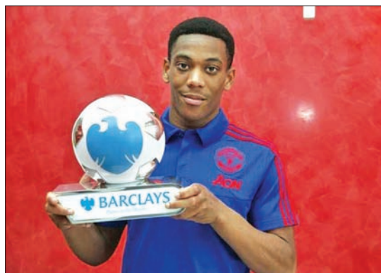
Anthony Martial with the Barclays Player of the Month Award.