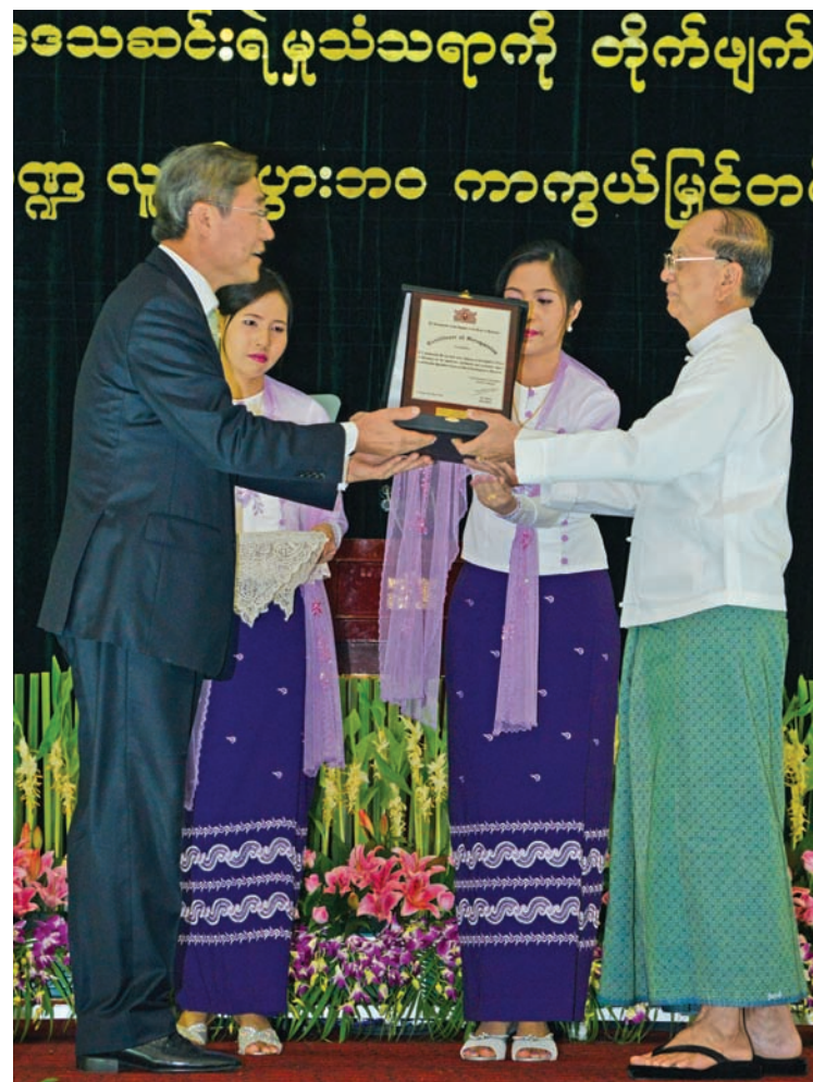
President U Thein Sein presents certificate of honour to representative from KOICA.

Then, the president presented certificates of honour to countries and organisations that have contributed to agricultural development in Myanmar and posed for documentary photos with diplomats and representatives.— Myanmar News Agency