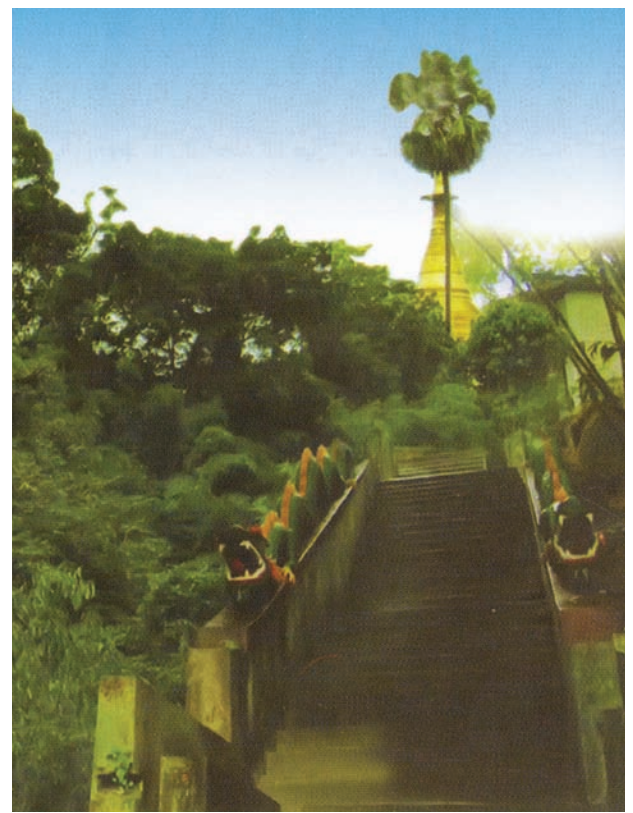
Dei-Sun-Pa Pagoda seen from a far.

Here we should take note of two points regarding Dei-Sun-Pa pagoda. The first is its renown for treasure troves [သိုလ်]. Many legends shroud it. Treasures of kings, wealthy men and war refugees were hidden at and around the pagoda. Treasure hunters [သိုလ်တူးဆရာ] come to find them but they failed and fled due to the protections of guardian spirits of treasure troves. These