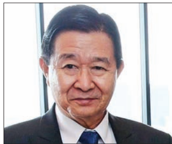
U Aung Min, Union minister of the President's Office, is the Myanmar government's chief negotiator in the peace process.

It is the implementation of the NCA that will determine whether the peace process is successful.