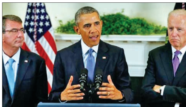
US President Barack Obama announces plans to slow the withdrawal of US troops from Afghanistan, while delivering a statement in the Roosevelt Room at the White House in Washington on 15 October 2015.

Obama had previously aimed to withdraw all but a small US-embassy based force in the capital, Kabul, before he leaves office in January 2017. Under the new plan, troops will be drawn down to 5,500 starting sometime in 2017 and will be based at four locations — Kabul, Bagram, Jalalabad and Kandahar.