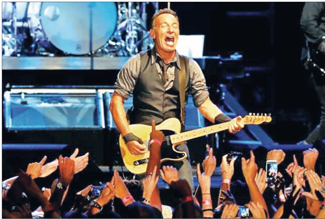
Singer Bruce Springsteen performs with the E Street Band during his concert in Cape Town.

LOS ANGELES — Bruce Springsteen will release a new box set in December highlighting his 1980 album "The River," with several never-before heard tracks, unseen video footage as well as a new documentary, his publicist said.