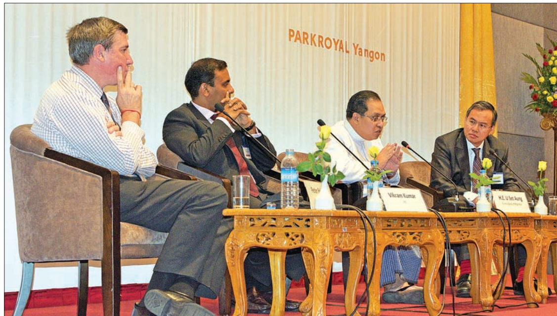
Keynote speakers address the audience during the investment conference held in Yangon this week.