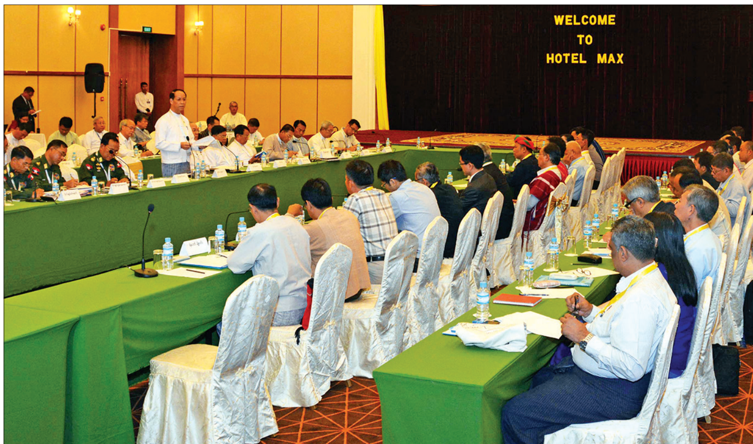
Vice President Dr Sai Mauk Kham makes speech at Joint Implementation Coordination Meeting

Participants discussed duties and responsibilities and future tasks of JICM and formation of JMC and UPDJC.— Myanmar News Agency