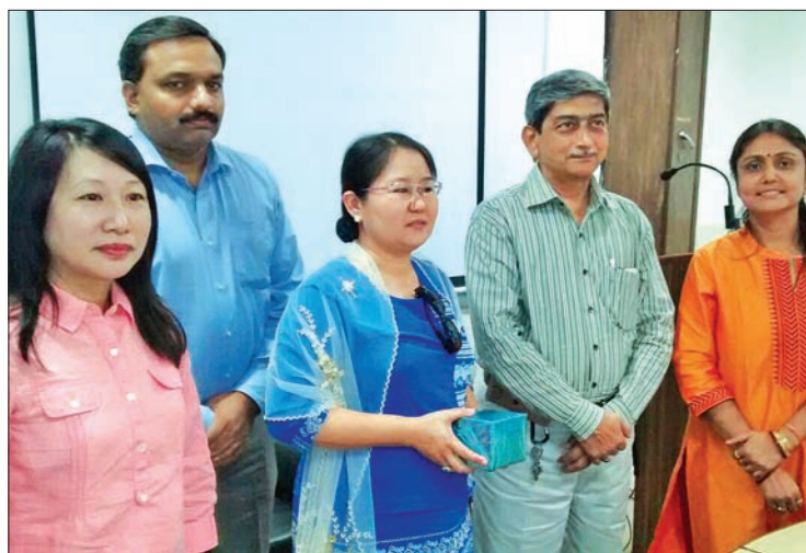
Mandalay University students in India.