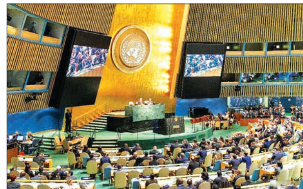
United Nations General Assembly announces the election result of five non-permanent members of the Security Council at the UN headquarters in New York, the United States.

The UN Security Council consists of five permanent members and 10 non-permanent members elected by the UNGA. Five non-permanent members are elected every year to join the five permanent and veto-wielding members of Britain, China, France, Russia and the United States.