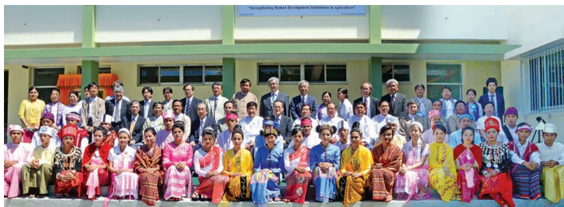
Union Minister U Myint Hlaing, Japanese Ambassador Mr Tateshi Higuchi and party seen together with students and faculty members of Yezin Agricultural University.

port prospects. The senior general answered questions on matters related to military cooperation between the two countries, the constitution, the election and the signing of the nationwide ceasefire agreement.— Myawady