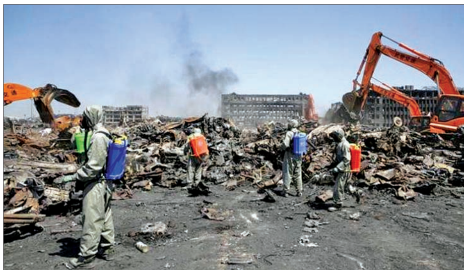
People's Liberation Army (PLA) soldiers of the anti-chemical warfare corps in protection suits work next to excavators cleaning up the debris at the site of last week's blasts in Binhai new district of Tianjin, China.

In a terse statement, the Central Commission for Discipline Inspection said that Yang, in his capacity as a member of the ruling Communist Party's powerful central committee, had "lost his ideals and convictions" and "seriously vio-