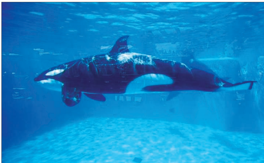
An Orca killer whale is seen underwater at the animal theme park SeaWorld in San Diego, California.

approval from the commission to build bigger tanks for the orcas in a move some said was in response to ongoing criticism over how the theme park treats animals in captivity.