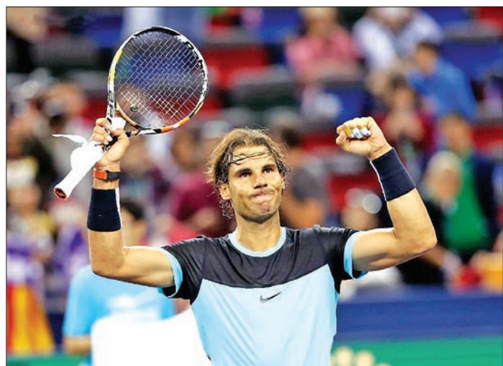
Rafael Nadal of Spain celebrates victory against Stan Wawrinka of Switzerland during their men's singles quarter-final match at the Shanghai Masters tennis tournament in Shanghai, east China, on 16 October 2015. Rafael Nadal won 2-0.

As he looks to reach his sixth ATP World Tour final of the season, the Spaniard will face Frenchman Jo-Wilfried Tsonga, whom he has beaten in eight of their past 11 meetings.—Xinhua