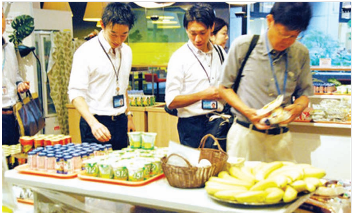
Employees of Itochu Corp. selecting breakfast items at the company cafeteria in its head office in central Tokyo, a part of its early-work programme.

Its charismatic chairman and president Tadashi Yanai stressed that "work without overtime" was indispensable for working together with efficiency-oriented business partners overseas.