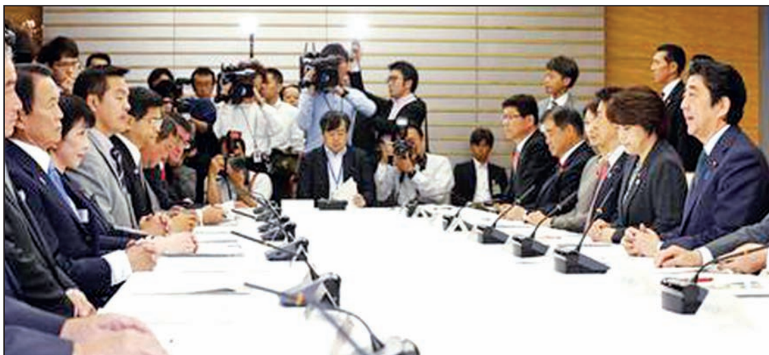
Japanese Prime Minister Shinzo Abe (far R) attends a meeting on 16 October, 2015, in Tokyo, at which the premier showed the government’s willingness to play a leading role in compiling international rules over resource exploitation and other issues concerning the Arctic Ocean.

It emphasized the need to avoid international tension or conflict over the sea route or resource development in the Arctic Sea. In the basic ocean policy approved by the Cabinet in April 2013, the government sought to drive efforts “comprehensively and strategically” in transportation and international cooperation in the Arctic Sea.— Kyodo News