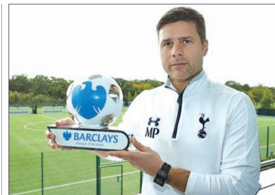
Mauricio Pochettino with the Barclays Manager of the Month Award.

LONDON — Manchester United forward Anthony Martial and Tottenham Hotspur manager Mauricio Pochettino have bagged the Premier League player and manager of the month awards for September.