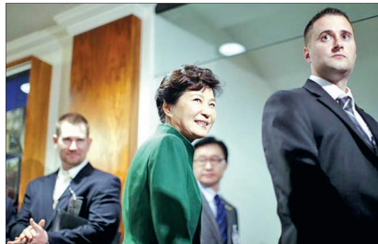
South Korea's President Park Geun-hye leaves after a bilateral meeting with US Secretary of Defence Ash Carter at the Pentagon in Washington on 15 October 2015.