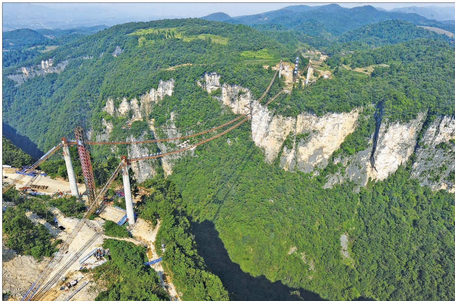
An aerial view shows a glass bridge under construction as it is suspended over a canyon in Zhangjiajie National Park, Hunan province, China.