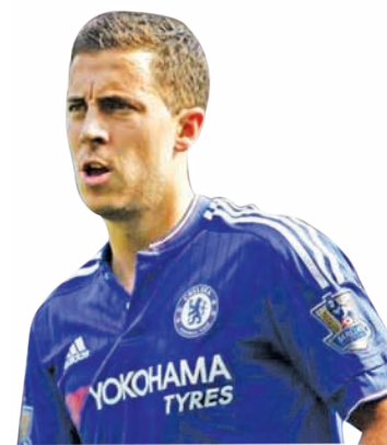
Chelsea's Eden Hazard

LONDON — Chelsea's Eden Hazard cannot explain why he is struggling for his club this season and said manager Jose Mourinho has been right to drop him from the starting line-up as he is in the "worst form of his life".