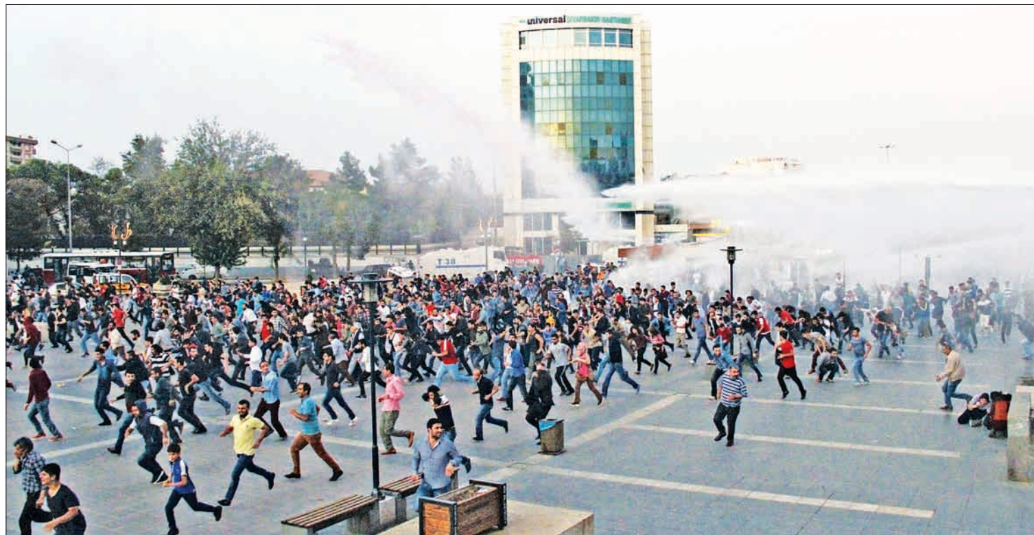
Police in Diyarbakir, Turkey, on 11 October 2015 use tear gas and water cannon to disperse people marching to protest the double suicide bombing in Ankara that killed up to 128 people.

The pro-Kurdish Peoples' Democratic Party (HDP), which said it was the target of the attack, has put the death toll at 128 and said it had identified all but eight of those bodies. Davutoglu's office has said 97 people were killed.—Reuters