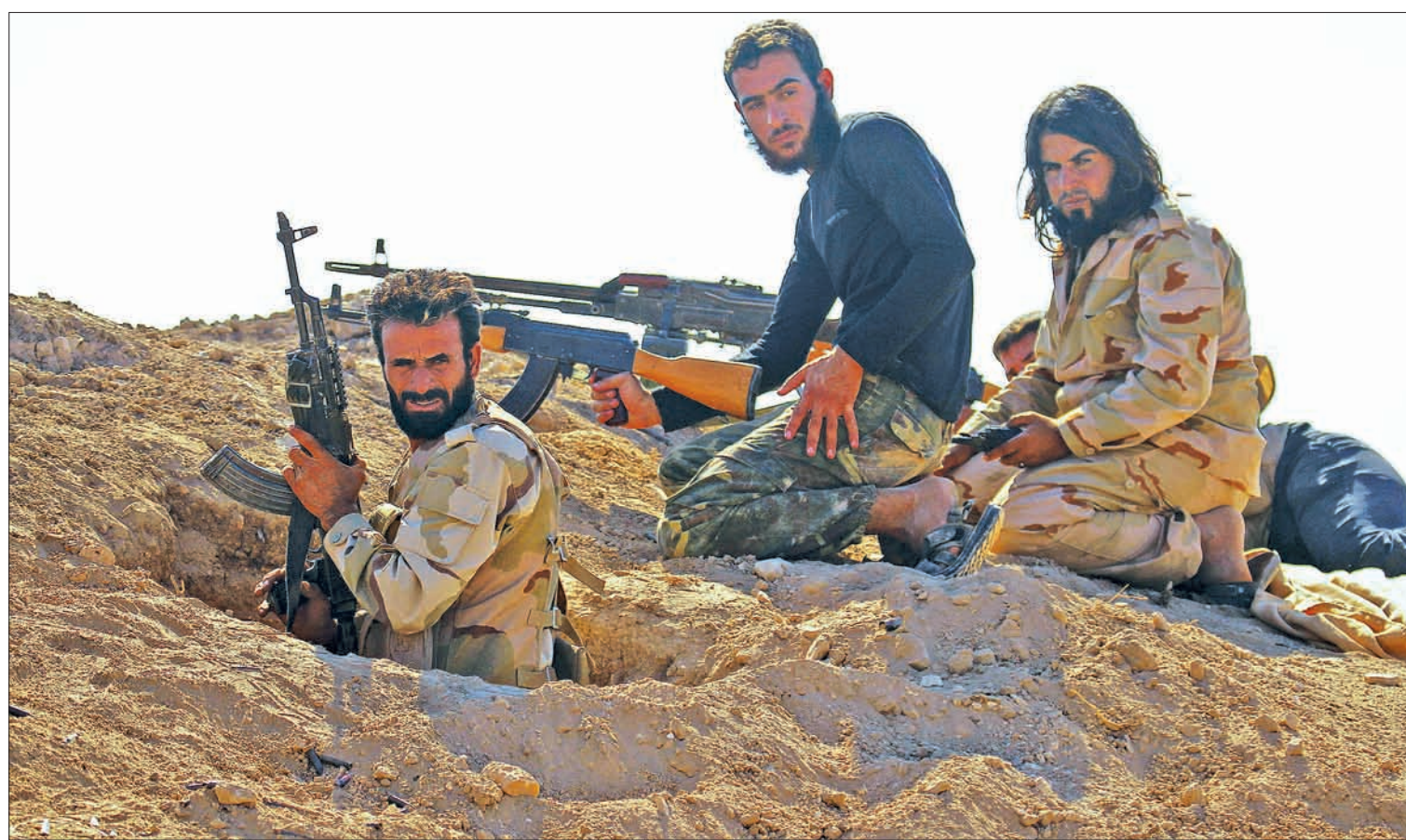
Rebel fighters carry their weapons as they take positions in the town of Kafr Nabudah, in Hama Province, Syria, on which forces loyal to Syria's President Bashar al-Assad are carrying out offensives to take control of the town, on 11 October 2015.

The fighting, shelling and air strikes killed and wounded dozens of insurgents, he said.