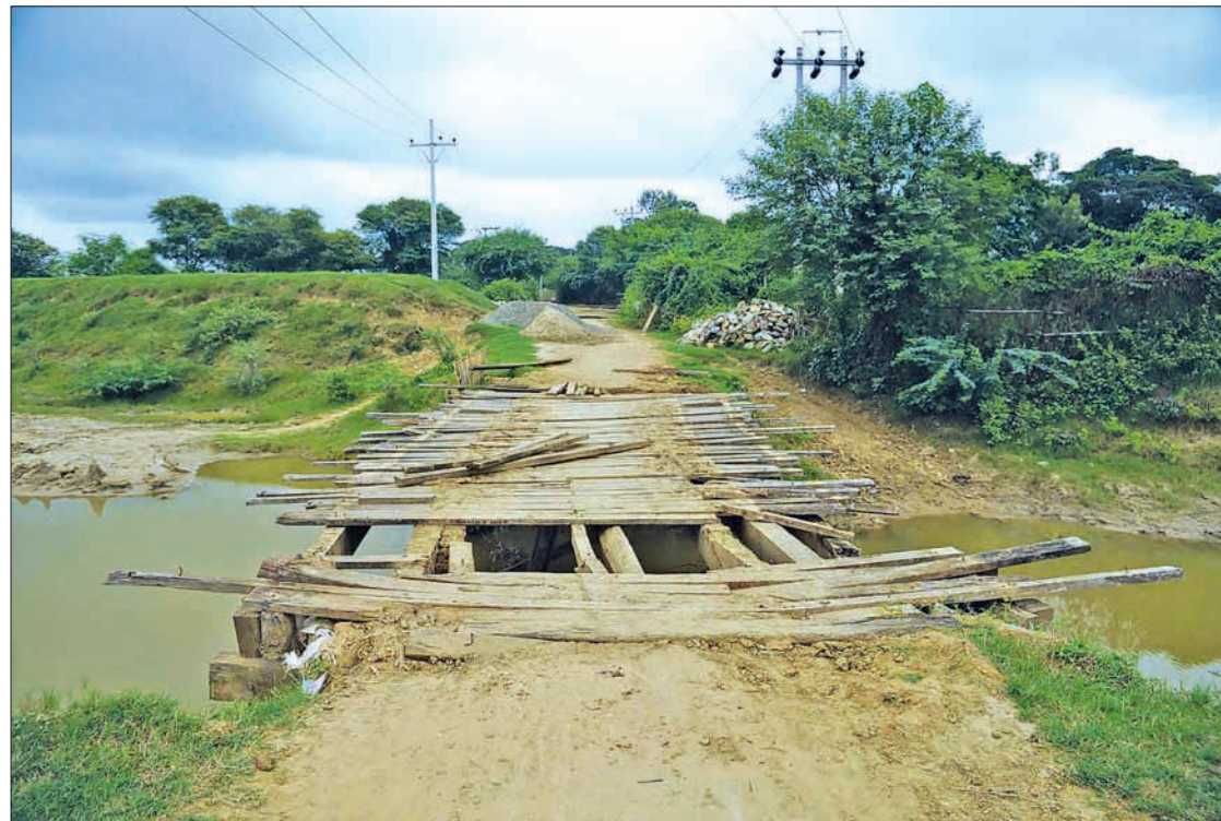
A new bridge will replace this ramshackle one in Meiktila Township.