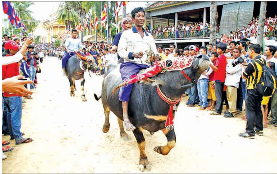
Cambodian men ride buffaloes during an annual water buffalo race at Vihear Sour pagoda in Kandal province, Cambodia, on 12 October 2015.