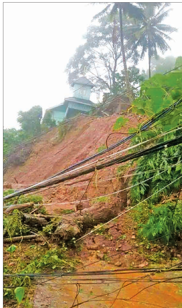
Two-day torrential rain caused landslide in Hpa-saung Township, Kayah State.

TORRENTIAL rain caused a landslide on Sunday in a village in Hpa-saung Township, Kayah State, killing 17, according to a news report from the Myanmar News Agency on Monday. Others are feared dead.