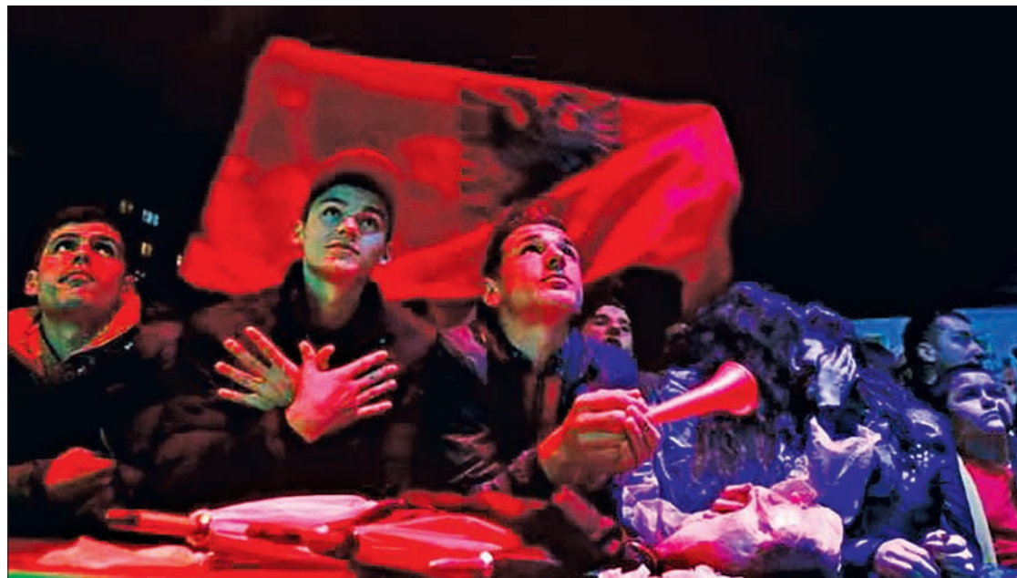
A young man makes the eagle symbol of the Albanian flag with his hands while watching on a screen the Euro 2016 qualifying soccer match between Albania and Serbia, in Kosovo's capital Pristina, on 8 October 2015. Serbia won 2-0.

LONDON — World champions Germany and perennial also-rans Albania do not share much in common in soccer but both were united in joy on Sunday when they qualified for Euro 2016 in France along with Romania and Poland.