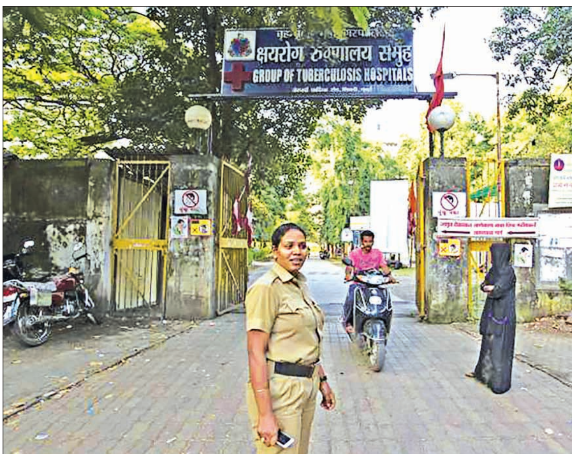
A security woman stands guard outside the Group of TB Hospitals in Mumbai, India.

A lot of staff continue to work at the hospital long after being infected.—Reuters