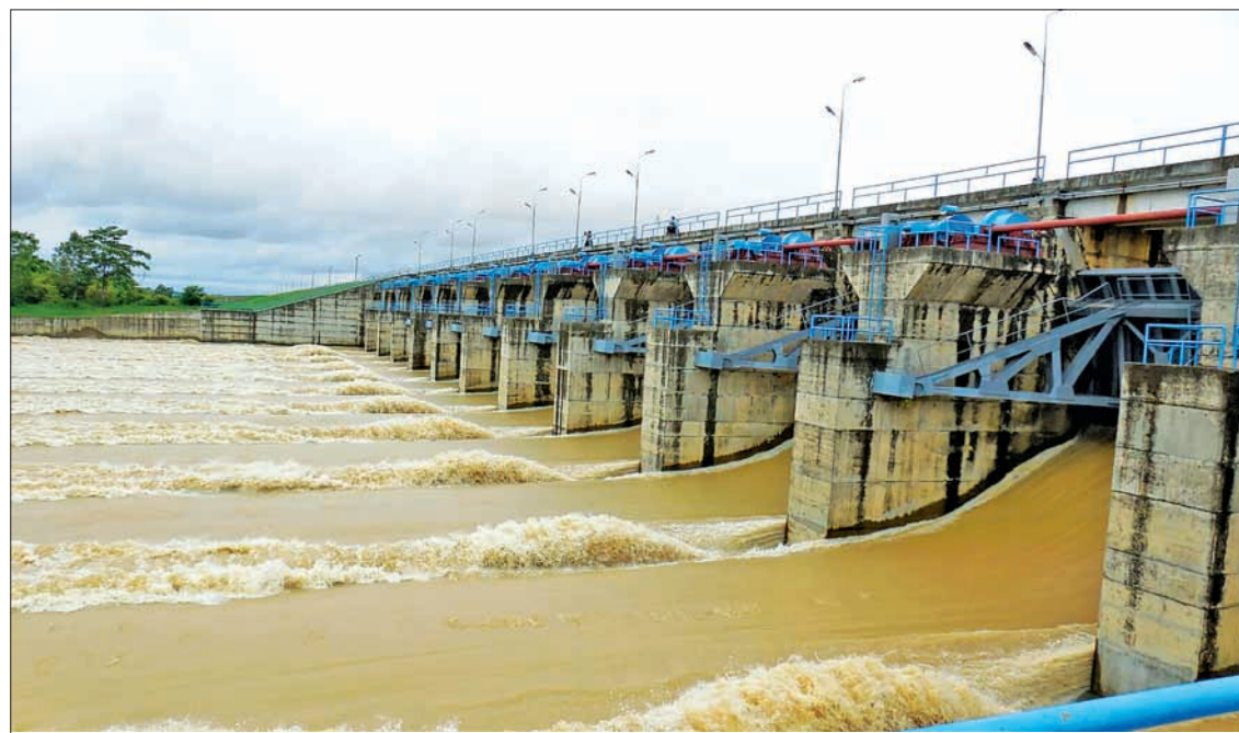
Water flows past spillways of Thaphanseik Dam on 12 October.

People living near Thaphanseik Dam have been told not to worry about flooding, as the Irrigation Department is monitoring the situation closely, according to source close to the Ministry of Agriculture and Irrigation.