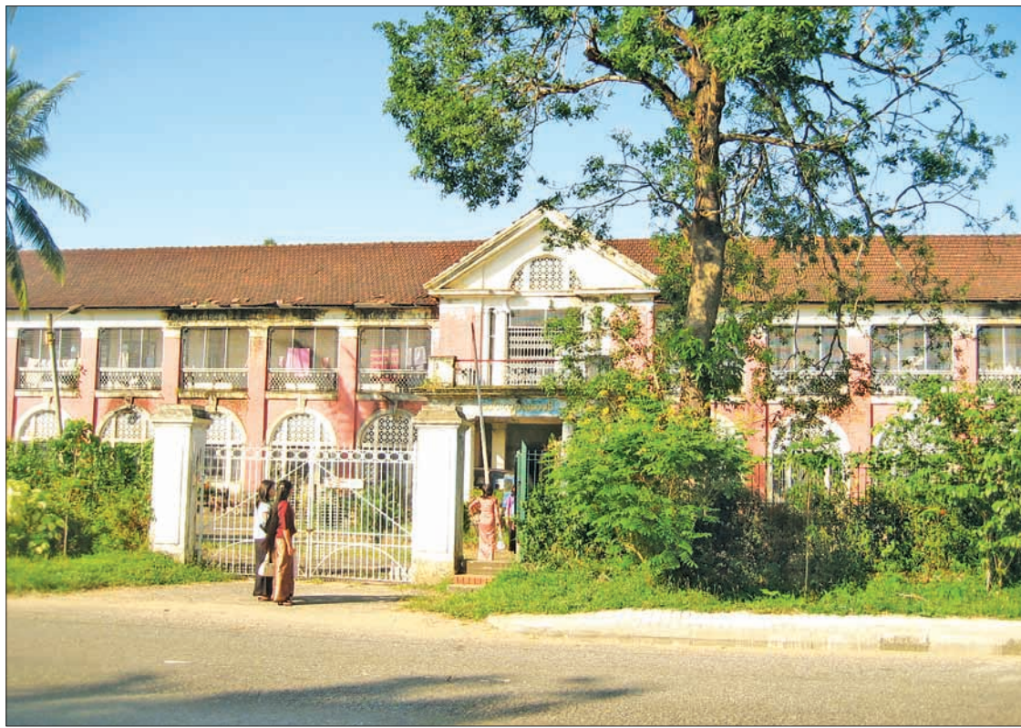
Inlyar Hostel.

The fact that the Yangon University is situated on a very large plot of land and closeness to the beautiful Inya Lake made it more unique. Though I had seen the later day famous modern universities in Thailand and Singapore, I dare say that there is none comparable to the Yangon University campus. Also the level of the academic achievements at this university was recognized as the best in South East Asia since its establishment until the nineteen sixties. In those days there were some foreign students, including Russians, Chinese, Japanese and even Nigerians, who studied here. One of the most well known of those foreign students is U Shwe Ba, a Japanese journalist who used to work for the NHK broadcasting station at the Myanmar language section. I had unexpectedly met him in 1986 in Tokyo, while I was attending a telecommunication seminar. He came and introduced himself, speaking in fluent Myanmar language, while he was covering the seminar for the NHK. During our conversation, he reminisced passionately about the happy days at the Yangon University, in the nineteen sixties, as an exchange student. He explained to me how he came to be known as Shwe Ba, the same as that of the popular action movie star of that period. According to him another