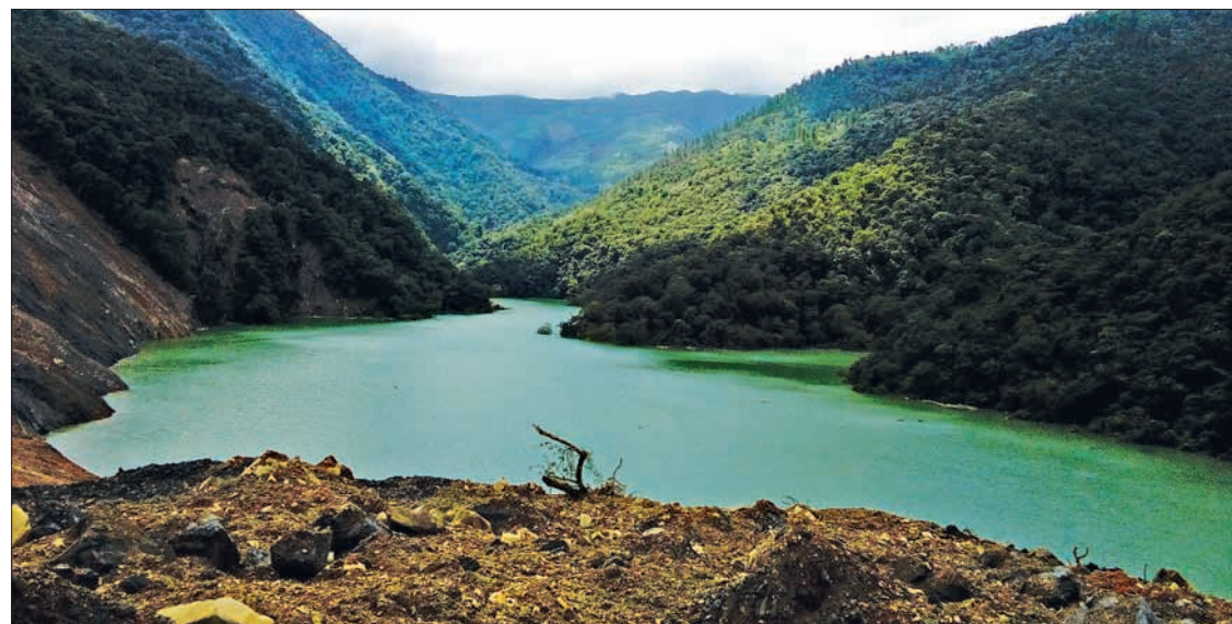
A landslide dam in Chin State.

Nonetheless, the Ministry of Environmental Conservation and Forestry taking measures to prevent the collapse of the landslide dams.— Su Hnin Lei