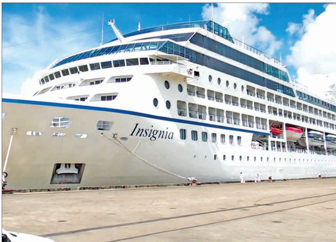
MV Oceania seen at Thilawa International Terminal.

Tourists visit Myanmar via sea, air and roads from bordering countries. People also travel Myanmar's rivers, such as the Ayeyawady and Chindwin, on national cruise ships.—MoHT