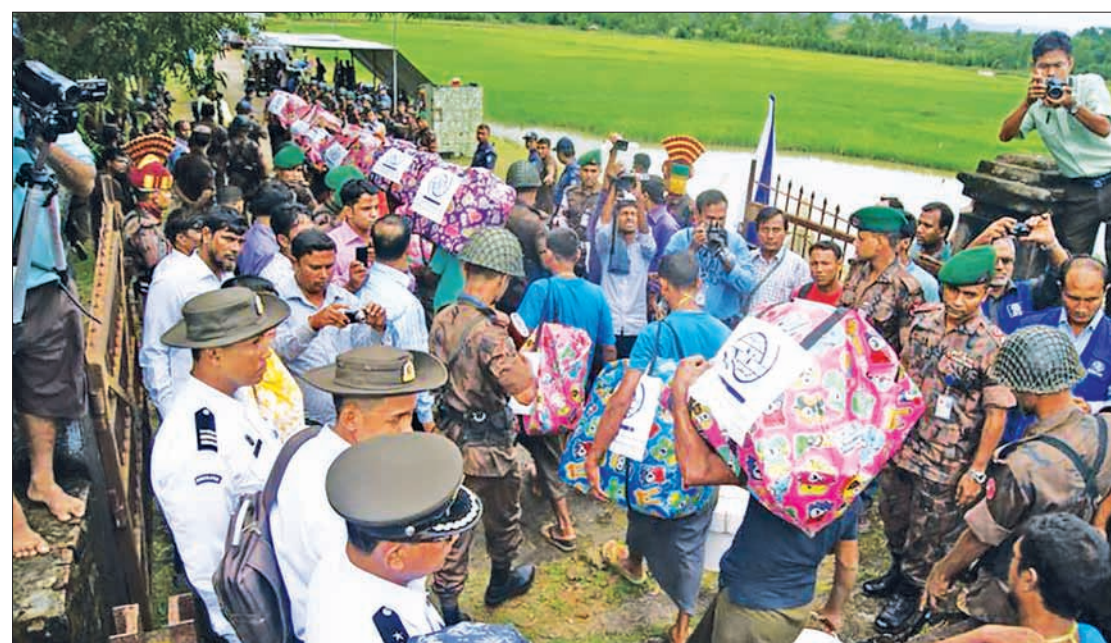
Myanmar authority handed over 103 boat people to Bangladesh authority on Monday.

Myanmar has repatriated a total of 729 verified Bangladeshi nationals on six occasions. The remaining boat people will be repatriated to their countries of origin upon the completion of the verification process, according to a press release of the Ministry of Foreign Affairs of Myanmar.— MNA