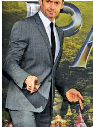
Actor Hugh Jackman arrives for the world premiere of "Pan" at Leicester Square in London, Britain.

With "Pan" finishing in third place, the top five was rounded