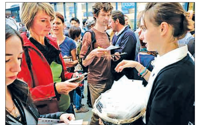
A student (R) of the University of Milan hands out dried peaches from Japan's Fukushima Prefecture to visitors to the Japan Pavilion at the world expo in the Italian city, on 11 October 2015.

Vihear Sour pagoda is located some 40 km southeast of capital Phnom Penh.—Xinhua