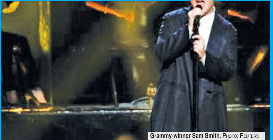
Grammy-winner Sam Smith.

"I'm trying my best. There's different challenges. The blessing for me is that I didn't have a boyfriend before I got well known so I didn't know any different. If I'd been in a relationship before I got well known I think I'd be a bit more upset," Smith said.—PTI