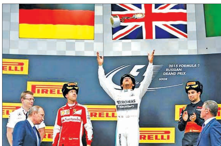
Mercedes Formula One driver Lewis Hamilton of Britain throws his trophy in the air in celebration after winning the Russian F1 Grand Prix in Sochi, Russia, on 11 October 2015.

The Briton now has a lead of 66 points over Ferrari's second-placed Sebastian Vettel and, if results go his way, can secure his own second successive crown in Austin, Texas, in two weeks' time. Mercedes team bosses had left the circuit long before the constructors' title was confirmed, however, with the outcome depending on a stewards' enquiry that eventually demoted Ferrari's Kimi Raikkonen from fifth to eighth. "We found out (about the title) upstairs. It just feels special to be a part of it and to have