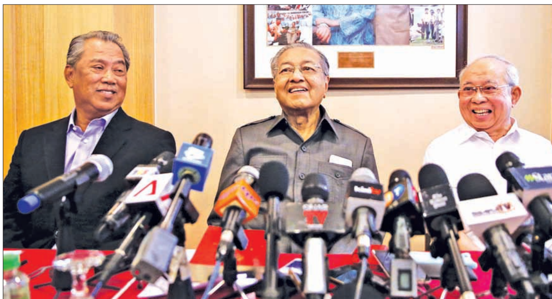
(Seated from L to R) UMNO's Deputy President Muhyiddin Yassin, former prime minister Mahathir Mohamad and member of parliament Razaleigh Hamzah give a news conference in Putrajaya, Malaysia, on 12 October 2015.