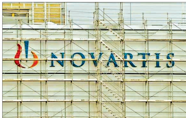
Swiss drugmaker Novartis' logo is seen behind scaffolding at the company's plant in the northern Swiss town of Stein January 27, 2015.

JERUSALEM — Swiss drugmaker Novartis will invest up to an extra $15 million in Gamida Cell, an Israeli developer of stem cell therapies, Gamida said on Sunday.