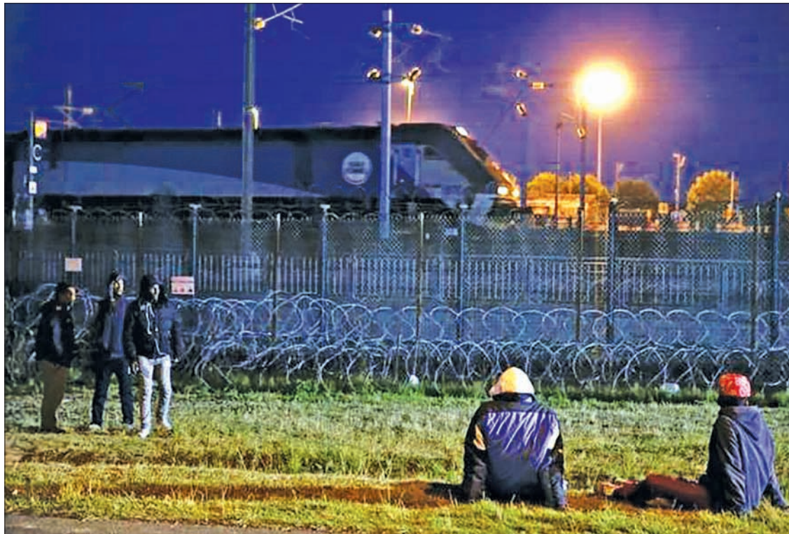
Migrants wait near a fence with razor barbs as an Eurotunnel freight shuttle goes to England by Channel Tunnel in Calais.

LONDON — Some of Britain's most senior former judicial figures criticised Prime Minister David Cameron's government on Monday for its response to the EU migrant crisis, saying it was inadequate and was pushing people into the arms of smugglers.