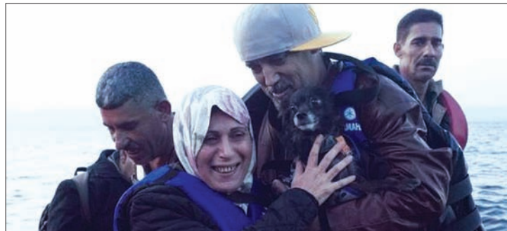
Syrian refugees hold a dog as they arrive on an overcrowded dinghy on the Greek island of Lesbos, after crossing a part of the Aegean Sea from the Turkish coast on 8 October 2015.

GENEVA — The rate of refugee arrivals on Greece's islands has leapt to 7,000 a day from about 4,500 at the end of September, probably because of fears that the weather will worsen soon, the International Organization for Migration (IOM) said on Friday.