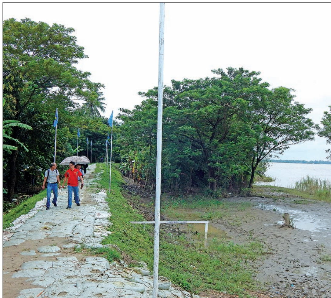
Aphyauke embankment to be repaired with the assistance of China.

AN agreement has been signed that will see China provide Myanmar with US$ 38.4 million to repair Aphyauke embankment in Yangon Region in the cool season.