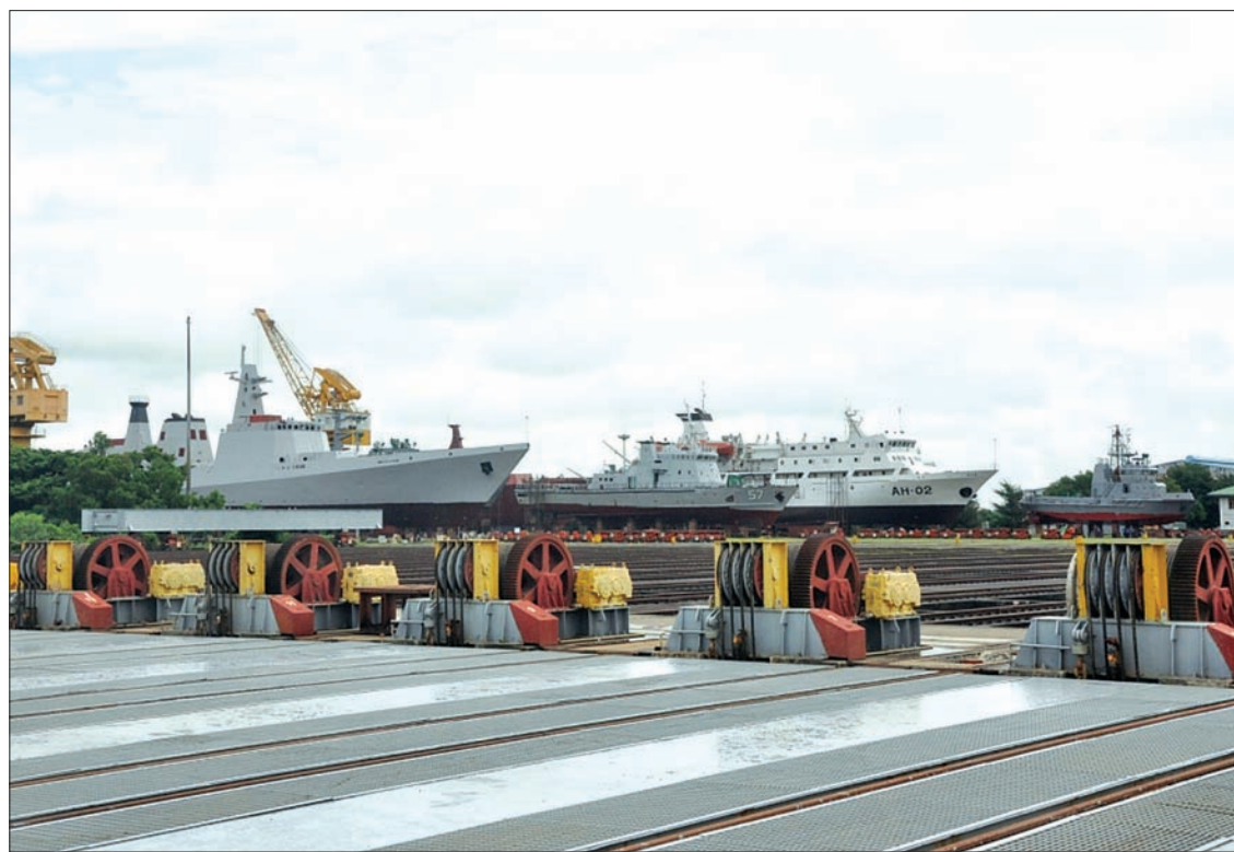
Warships being built and repaired at military shipyard in Thanlyin.

THE defence forces are committed to nation building tasks and serving the public good as well as fulfilling their immediate duties of national defence, Senior General Min Aung Hlaing said yesterday during a meeting with senior military officers at a naval base in Thanlyin, Yangon Region.