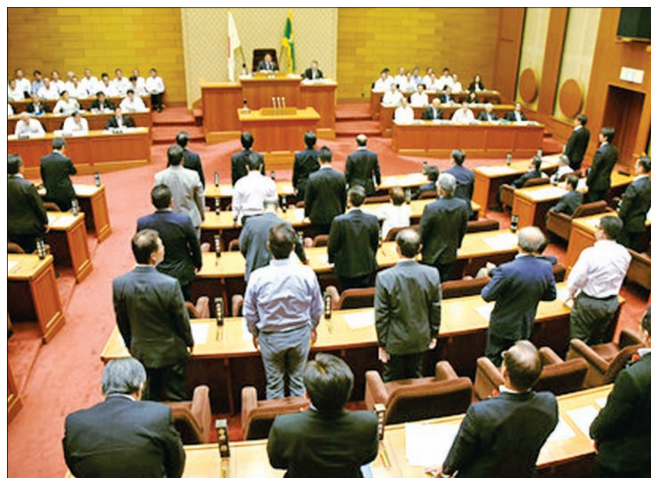
The assembly of the western Japan prefecture of Ehime giving its consent to a plan to restart a nuclear power plant despite safety concerns in the wake of the 2011 Fukushima meltdowns.

Kyushu Electric is also set to reactivate the plant's No 2 reactor as early as next week.—Kyodo News