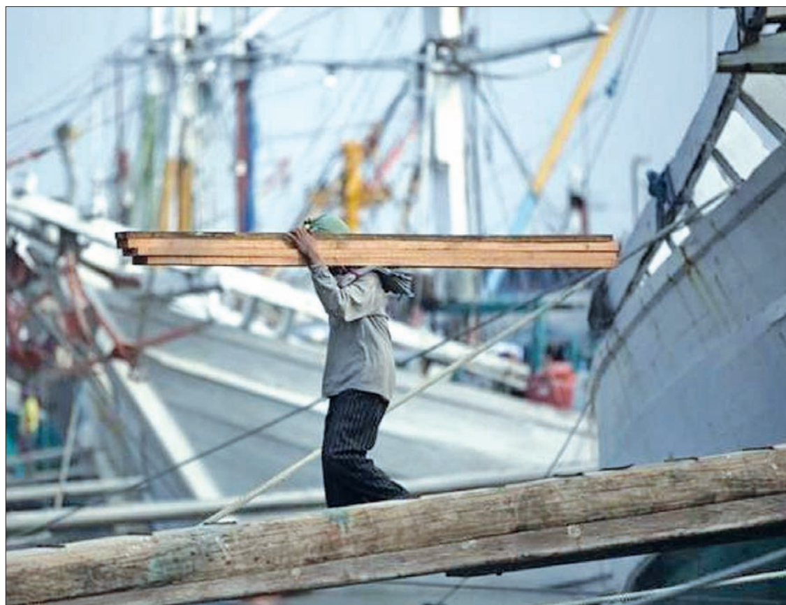
A labourer unloads timber from Kalimantan Province from, a traditional Indonesian ship.

If no action was taken within 12 months it could hand its findings to its corruption investigations arm, he added.—Reuters