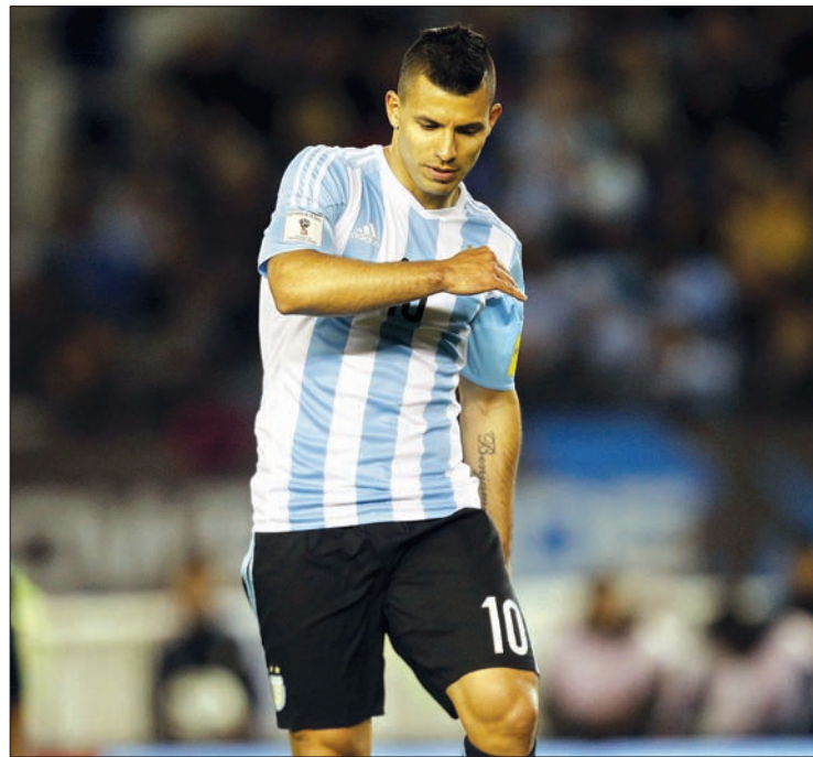
Argentina's Sergio Aguero.

LONDON — Manchester City striker Sergio Aguero will miss Argentina's World Cup qualifier against Paraguay next week after aggravating a leg injury in his team's shock 2-0 defeat by Ecuador.