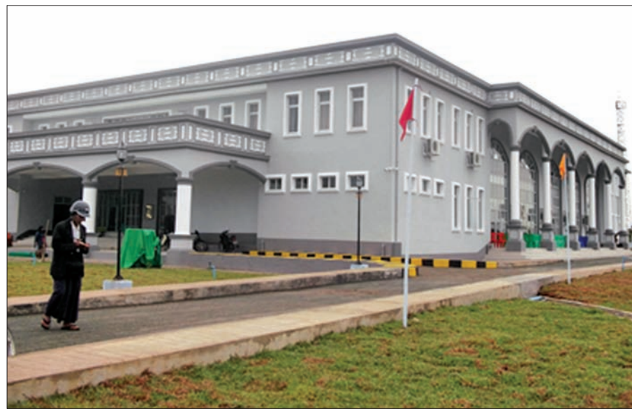
The new town hall in Monyin can accommodate about 1000 people.

THE Kachin State government has spent K100 million (US$77,000) on the construction of a town hall in Monyin, with the grand opening held on