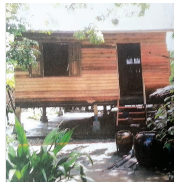
Khit Kabar Company is building affordable housing in villages in Thongwa Township, Yangon Region, with funding provided by the Rural Area Development Department.