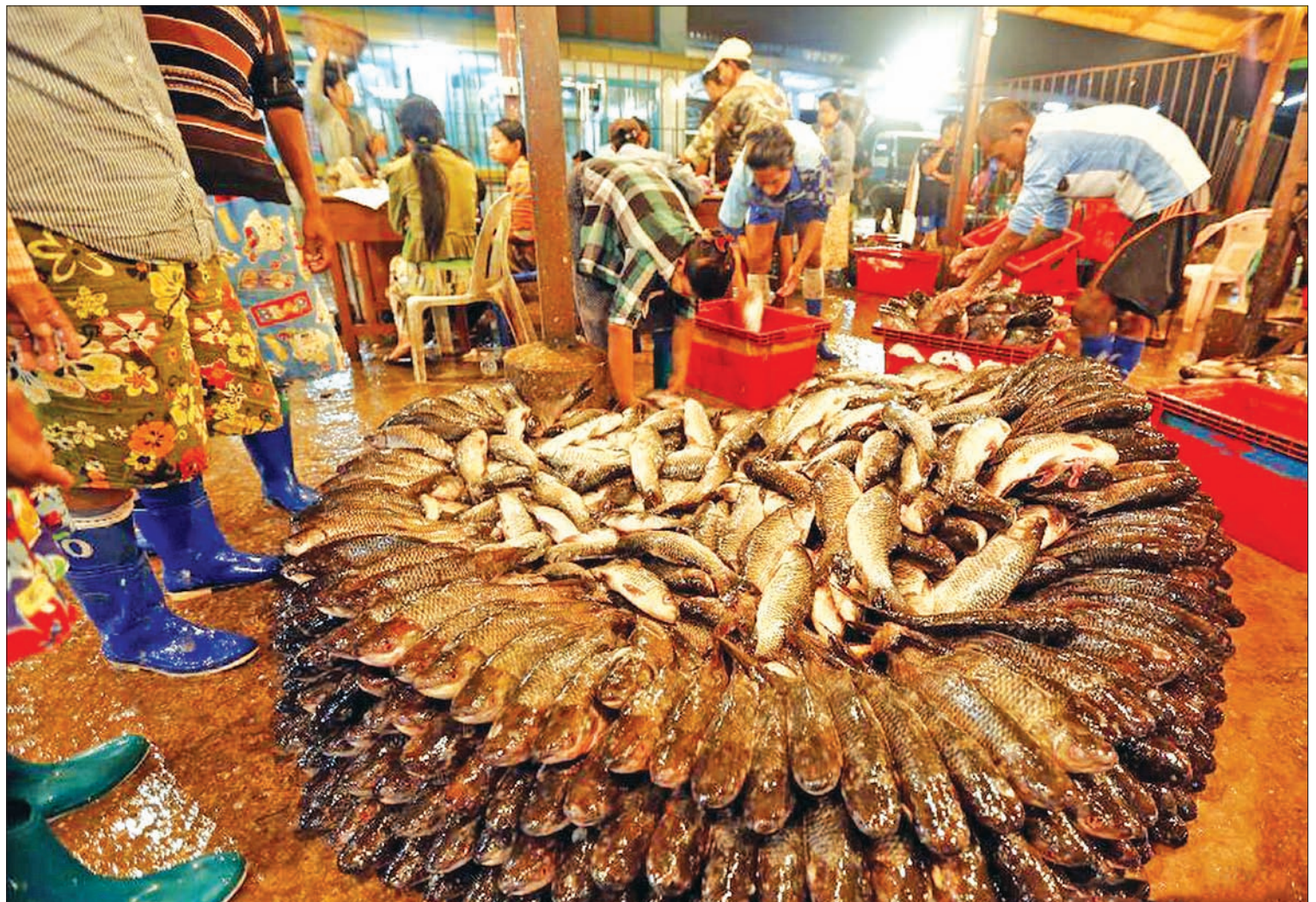
Fishmongers work at the Kyimyindine Central Sanpya Fish Market in Yangon.

Consumers will benefit from the knowledge acquired during the training, as it will lead to better safety and hygiene standards in the production phase of the country's fishery sector. The