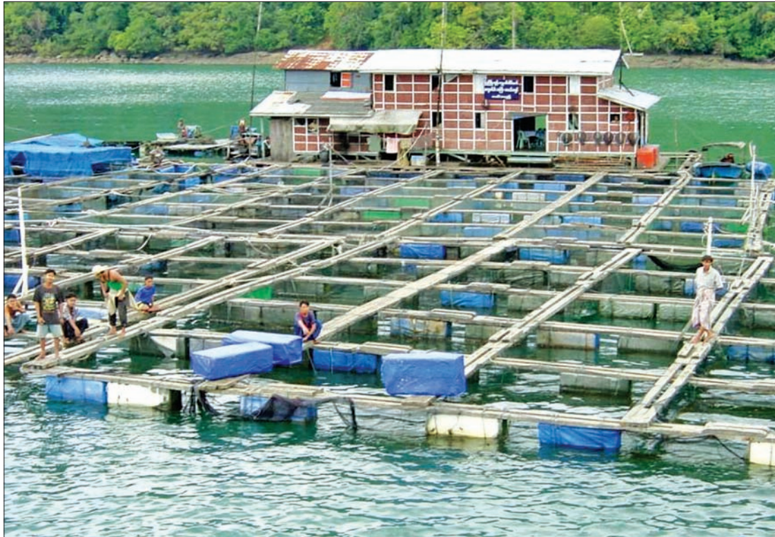
An artificial pond is used for fish farming in Ayeyawady Region, which will benefit from assistance from the EU in 2016.

metric tonnes. The sector currently employs around 130,000 people, according to official data.