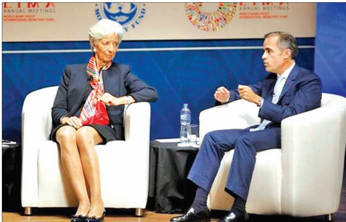
International Monetary Fund (IMF) Managing Director Christine Lagarde and Bank of England's Governor Mark Carney.

For both the Fed and the Bank of England, inflation targets are far out of reach, although both central banks insist they are ready to hike rates. The Fed's chair, Ja-