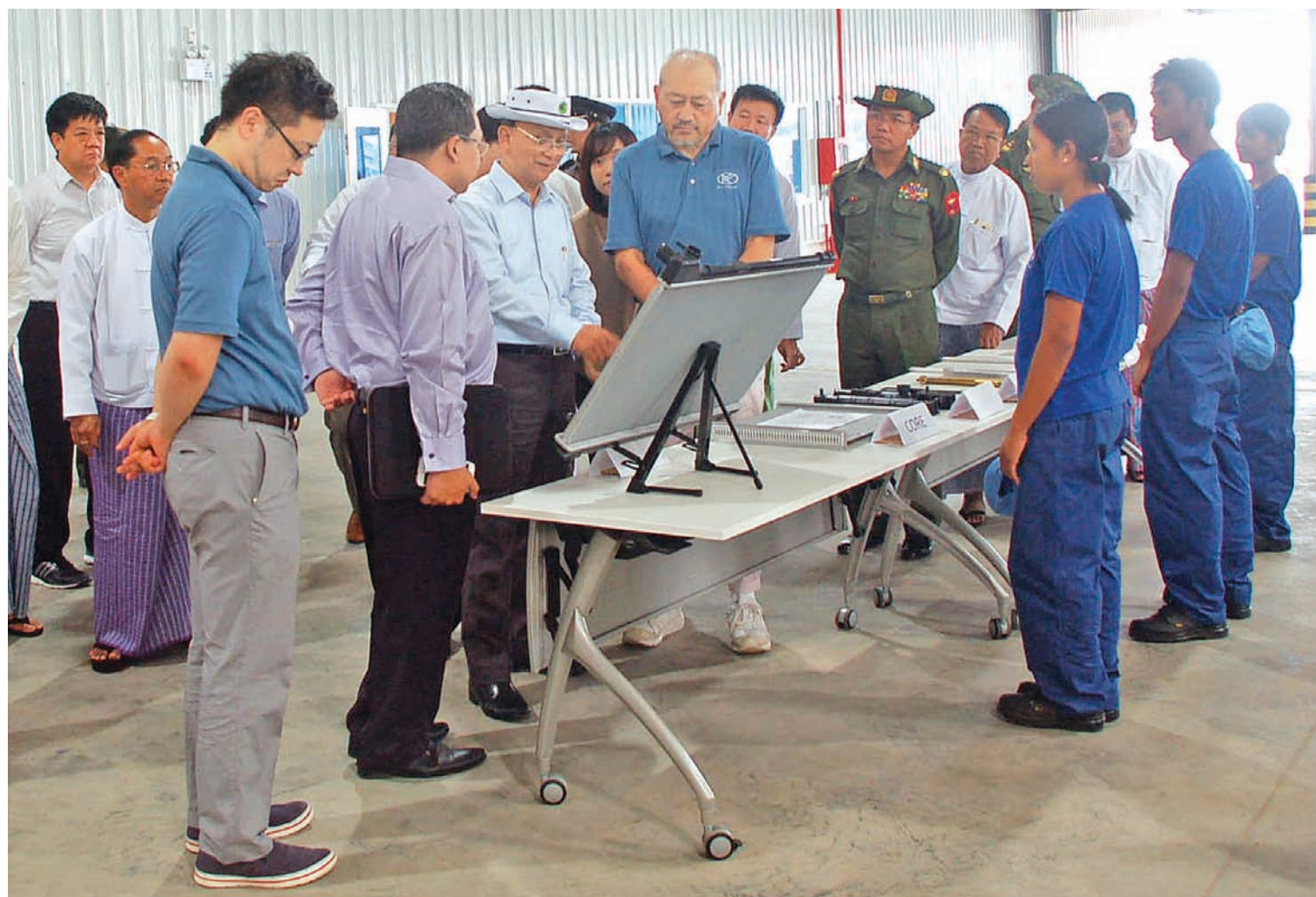
President U Thein Sein inspects factory in Thilawa Special Economic Zone near Yangon.

The president said that urban development requires a city to expand vertically due to a lack of space, and called on authorities to prioritise high-rise building projects to ensure adequate accommodation supplies for the city's growing population. He