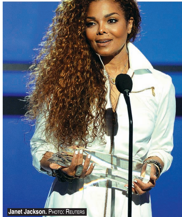
Janet Jackson.

The Hall of Fame will announce those who are chosen in December, with an induction ceremony in New York scheduled for 8 April.—Reuters