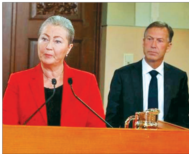
Kaci Kullmann Five, the new head of the Norwegian Nobel Peace Prize Committee, announces the winner of the 2015 Nobel Peace Prize during a news conference in Oslo, Norway, on 9 October 2015.

"This is extraordinary, incredible, unexpected... It brings support from the world to Tunisia for its democratic process," LTDH member Chocri Dhouibi told Norwegian broadcaster NRK.—Reuters