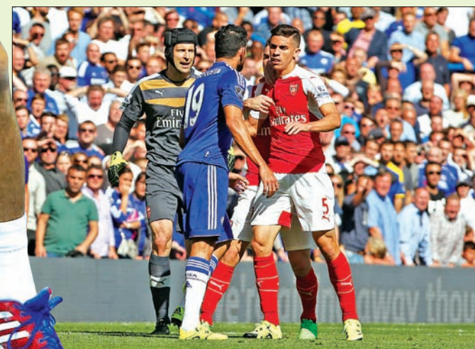
Chelsea's Diego Costa clashes with Arsenal's Gabriel Paulista.

Costa was handed a three-match ban after the match which Chelsea won 2-0. Chelsea, meanwhile, announced on Thursday that former Italy and AC Milan goalkeeper Marco Amelia had joined them on a free transfer.—Reuters