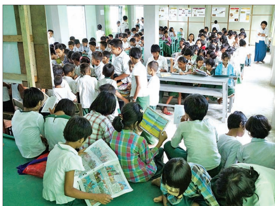
Children gather at the mobile library set up by Information and Public Relations Department.

DEKKINA District Information and Public Relations Department (IPRD) brought a mobile library to a local high school on Thursday. The library was received enthusiastically by students, who IPRD staff hope will use the opportunity to gain knowledge and develop regular reading habits. IPRD staff also brought posters depicting anti-drug messages and safety measures that can be taken in the event of a natural disaster.— District IPRD