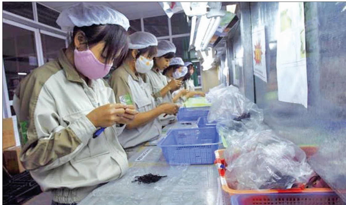
Women work at a plastic factory in Que Vo District, outside Hanoi.

Continued growth in appetite in a country of 1.3 billion people is