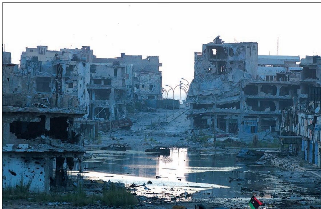
Damaged homes are seen after clashes between members of the Libyan pro-government forces, backed by the locals, and Shura Council of Libyan Revolutionaries, an alliance of former anti-Gaddafi rebels who have joined forces with Islamist group Ansar al-Sharia, in Benghazi.

Delegates from Tripoli's GNC parliament already balked