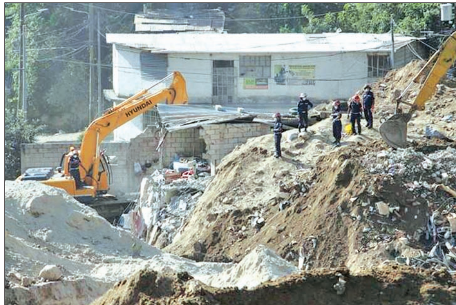
Rescue team members look for bodies at an area affected by a mudslide, in Santa Catarina Pinula, on the outskirts of Guatemala City on 7 October 2015.

GUATEMALA CITY — At least 220 bodies have been recovered after a massive landslide buried part of a town in Guatemala last week while about 350