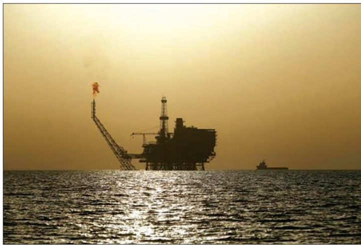
An offshore oil platform is seen at Bouri Oil Field off the coast of Libya.

PIRA price forecast are driving prices today," said Tamas Varga, oil analyst at London brokerage PVM Oil Associates.