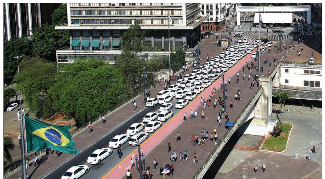
Taxis are seen parked on the street during a protest against online car-sharing service Uber, in front of the city hall of Sao Paulo Brazil on 8 October 2015.

Last month the mayor of Rio de Janeiro said he would ban Uber in the city, but left the door open to possible regulation of the service in the future.—Reuters