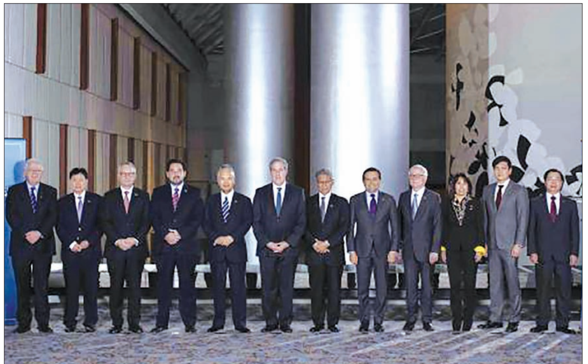
Trade ministers from a dozen Pacific nations in Trans-Pacific Partnership Ministers meeting post in TPP Ministers "Family Photo" in Atlanta Georgia on 1 October 2015.

Republican Senator Orrin Hatch, who heads the Senate Finance Committee, was wary. "I am afraid this deal appears to fall woefully short," said Hatch, who had urged the administration to hold the line on intellectual property protections, including for drugs.