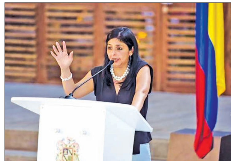
Venezuela's Foreign Minister Delcy Rodriguez.

Venezuela and the United States have had difficult relations since late president Hugo Chavez was elected in 1998. They came to a nadir in 2006 when Chavez described his then