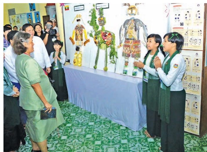
Thai Princess Maha Chakri Sirindhon welcomed by school children in Yangon.

THAI Princess Maha Chakri Sirindhon left for Bangkok on Tuesday following a four day visit of Myanmar. Before leaving the country, the prin-