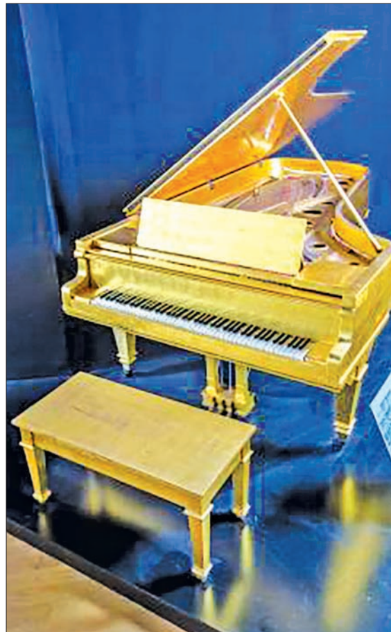
The Elvis Presley 24K Gold Lead Grand Piano which was played by Elvis Presley while in the music room of his Graceland home in Memphis, Tennessee, is seen in an undated handout picture courtesy of Julien's Auctions.

A spokeswoman said the drum skin, which bears The Beatles signature logo with a dropped "T," was so unique that it was difficult to put a price on it. Only the skin is up for auction, not the entire drum.