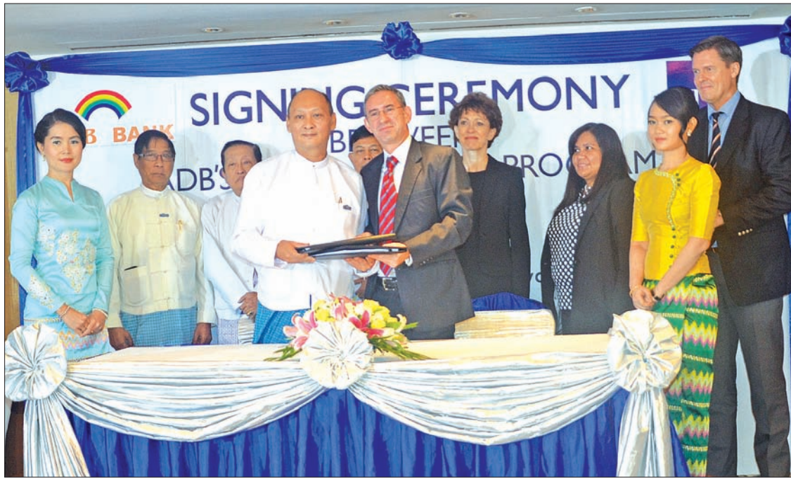
Officials of ADB's trade finance program and CB Bank exchange document after signing agreement on assistance for trade finance capacity.

THE Asian Development Bank's (ADB) Trade Finance Program (TFP) and Cooperative Bank (CB Bank) on Tuesday signed an agreement in Yangon that enables the TFP to provide guarantees of up to $12 million per annum in support of the trade finance operations of CB Bank.