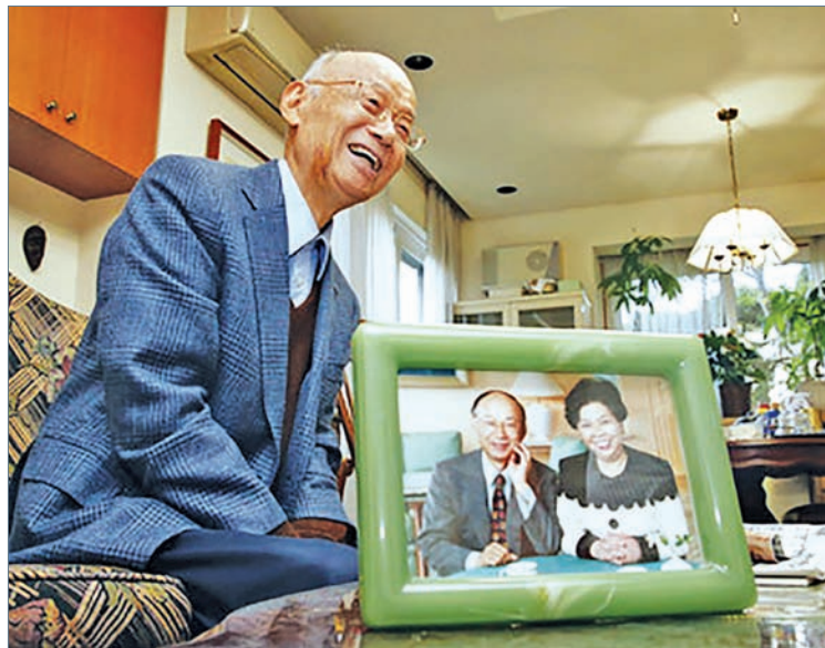
Japanese biologist Satoshi Omura meets with reporters at his home in Tokyo on 6 October 2015.

TOKYO — Patience and a resolve to “do good for others” have guided Satoshi Omura in his microbe research, leading him to make discoveries that led to the treatment of devastating parasitic diseases and a share of this year’s Nobel Prize in medicine.