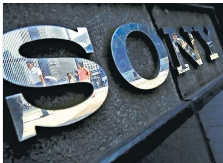
Pedestrians are reflected in a logo of Sony Corp outside its showroom in Tokyo.

The company is hoping to expand its sensors into automobile-related products, as vehicles adopt more sensor-enabled safety features.—Reuters