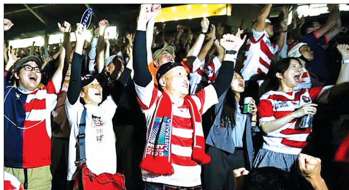
Japan rugby fans celebrate their team's second try as they watch Japan's IRB Rugby World Cup 2015 Pool B match against Samoa in Milton Keynes, England, at a public viewing event in Tokyo, Japan 3 October, 2015.

And the performances have been reflected in Japan where a world-record national audience tuned in to watch the Brave Blossoms defeat Samoa in Pool B on Saturday. Twenty-five million people watched the 26-5 victory in Milton Keynes, eclipsing the previous record of 20.7 million held by France, when national broadcaster TF1 televised the first semifinal of Rugby World Cup 2007 between France and England in Paris.— Kyodo News