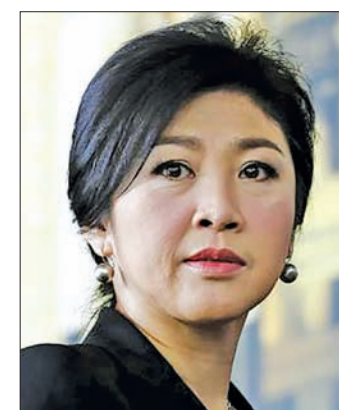
Ousted former Thai Prime Minister Yingluck Shinawatra.

BANGKOK — A Thai court on Tuesday threw out a case against the attorney general filed by deposed prime minister Yingluck Shinawatra, saying it found no evidence of any abuse by prosecutors.