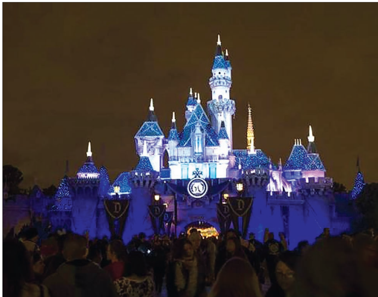
Sleeping Beauty's Castle is pictured during Disneyland's Diamond Celebration in Anaheim California. PHOTO: REUTERS

250 percent since the adjacent California Adventure theme park opened in 2001.—Reuters