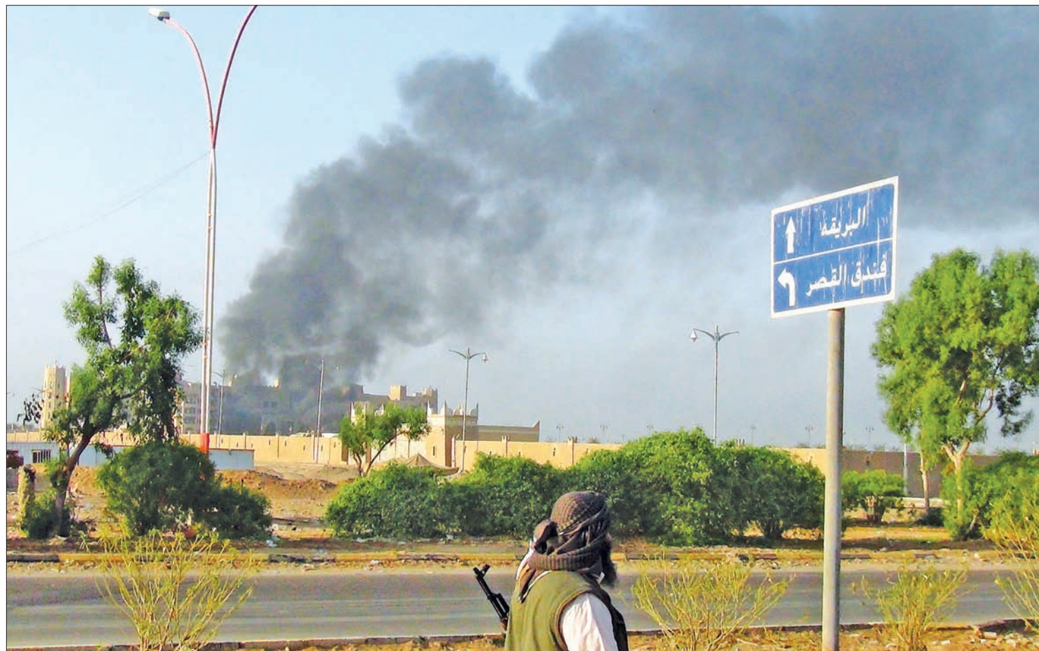
A militant loyal to Yemen's government looks as smoke billows from al-Qasr hotel after it was hit by a explosions in the western suburbs of Yemen's southern port city of Aden 6 October 2015.

ADEN — Unidentified assailants fired missiles at a hotel in Aden used by Yemeni government officials and at a compound housing troops of the government's Gulf Arab allies on Tuesday, residents