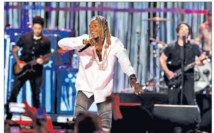
Fetty Wap performs with Fall Out Boy during the second night of the 2015 iHeartRadio Music Festival at the MGM Grand Garden Arena in Las Vegas, Nevada.

Other new albums in the top ten included Scottish synth-pop group Chvrches' "Every Open Eye" at No 8, British house band Disclosure's "Caracal" at No 9 and rocker supergroup Dead Weather's "Dodge and Burn" at 10 November.—Reuters