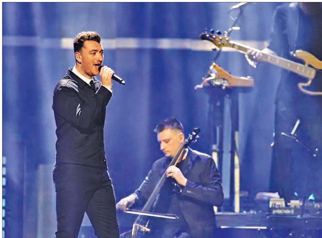
British singer Sam Smith performs during the 2015 iHeartRadio Music Festival at the MGM Grand Garden Arena in Las Vegas Nevada 18 September 2015.

LONDON — Grammy Award winner Sam Smith released the video for his theme song for the new James Bond film "Spectre" on Monday, days after the ballad became the first 007 title track to top the British pop charts.