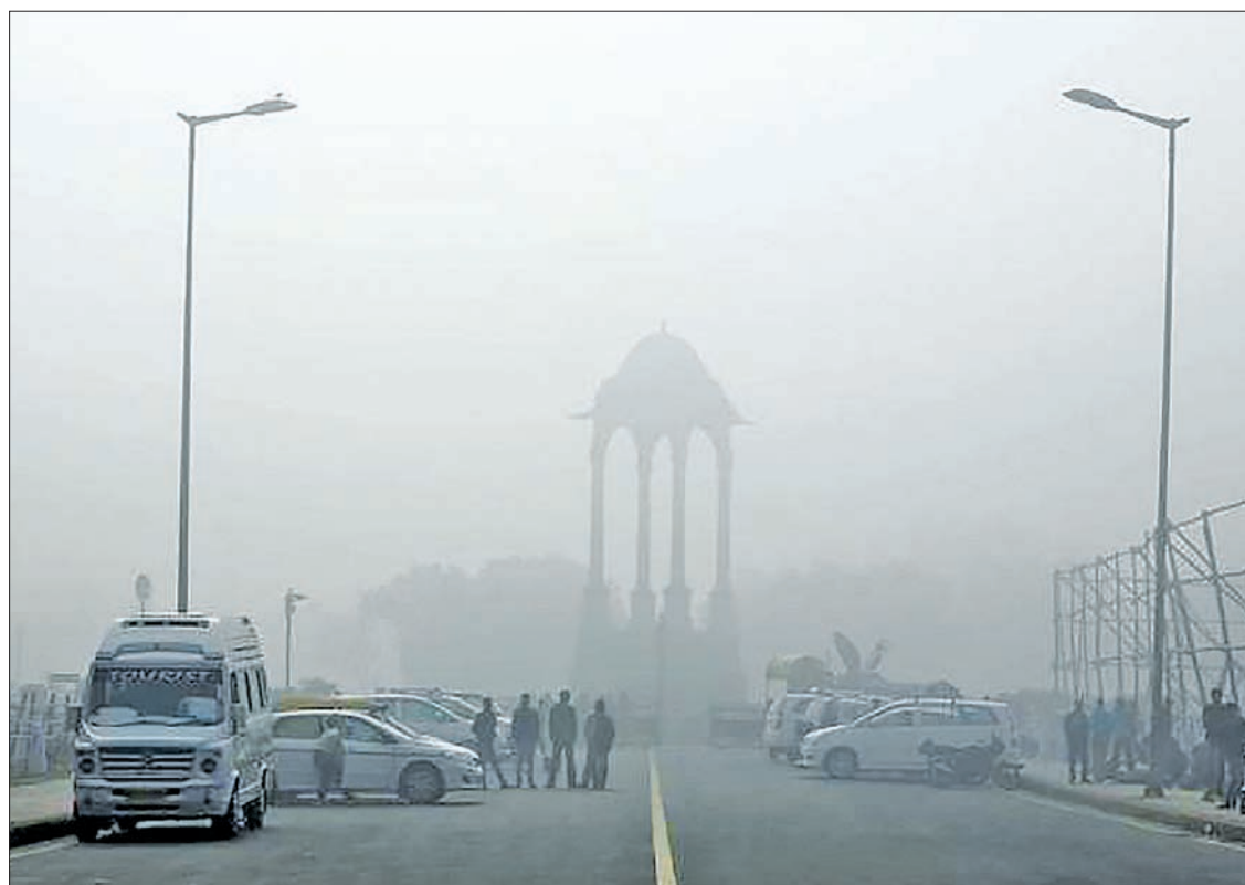
Vendors selling drinks stand beside vehicles near the India Gate war memorial on a smoggy day in New Delhi. PHOTO: REUTERS

The WHO last year said New Delhi had the worst air quality of 1,600 cities surveyed worldwide.— Reuters