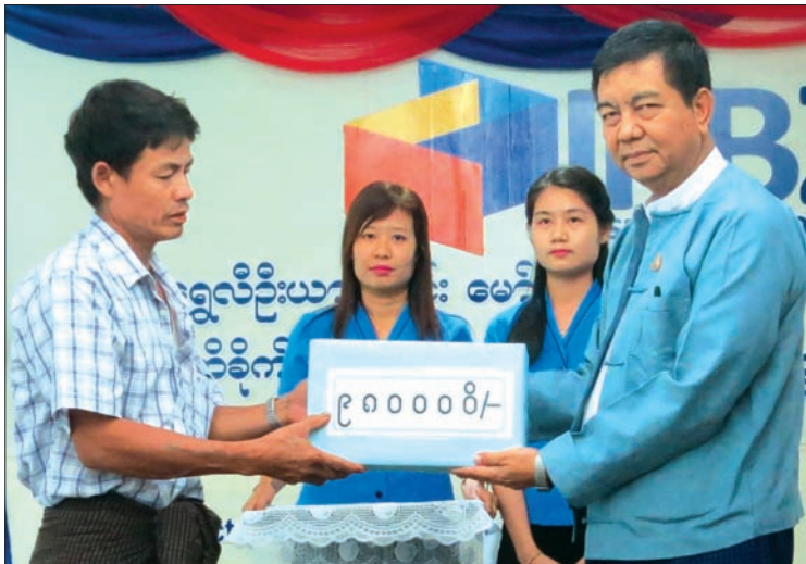
An official from IKBZ hands over compensation to injured passenger.

INTERNATIONAL Kanbawza Insurance Company (IKBZ Insurance) paid K38.59 million (US$30,000) on 5 October as a