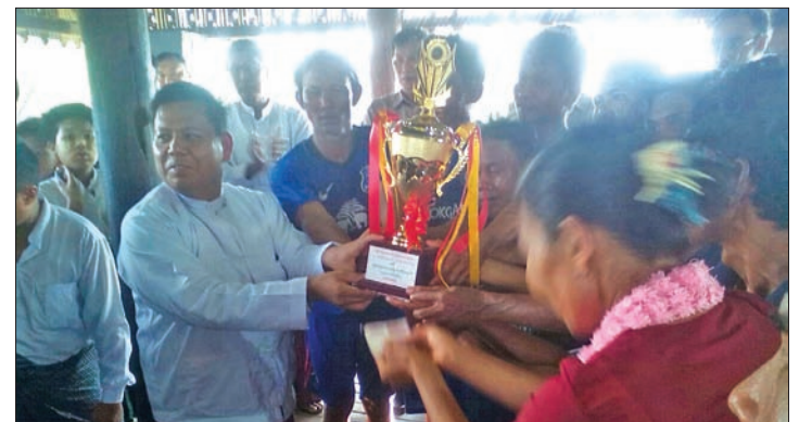
Prize presented to winning team of traditional rowing team.

A Myanmar traditional rowing competition's award presentation ceremony was held in Mandalay on Sunday.