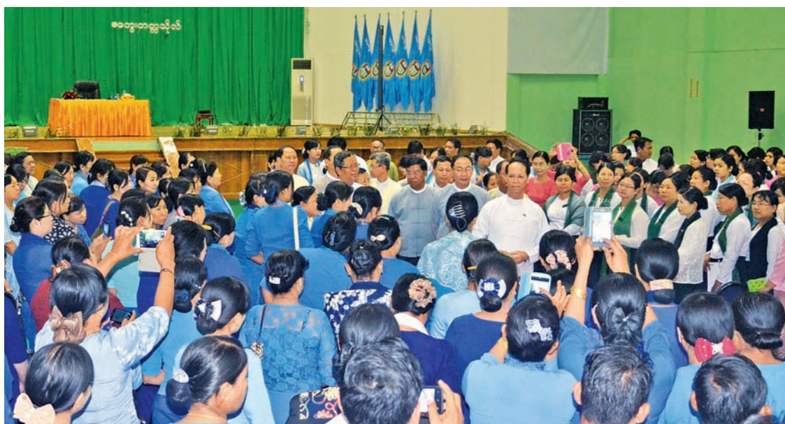
Vice President Dr Sai Mauk Kham greets faculty members from Magway.

He said he attaches great importance to the quality of graduates because although Myanmar is endowed with natural resources, these can only be managed responsibly by having a pool of talented human resources. He therefore urged teachers to produce the highest calibre graduates. — MNA