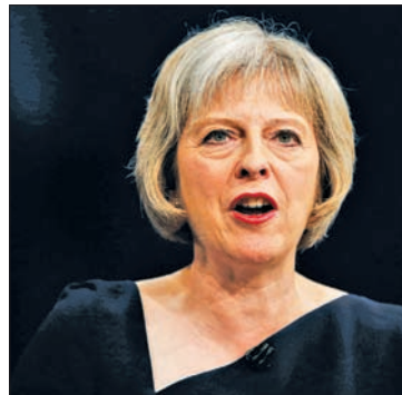
Britain's Home Secretary Theresa May.

MANCHESTER — Mass immigration is damaging British society, interior minister Theresa May will say on Tuesday in a speech designed to ease some voters' concerns that the government is failing to control the country's borders. May will tell the ruling Conservative Party's annual conference that levels of immigration seen over the last 10 years were not in the national interest.