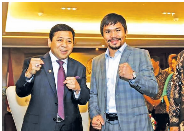
Filipino boxing superstar Manny Pacquiao poses with the head of Indonesia's House of Representatives (DPR) Setya Novanto during a courtesy call in Jakarta Indonesia.

MANILA — Philippine boxing world champion and congressman Manny Pacquiao has announced he will take up a new challenge by running for a Senate seat in national elections next