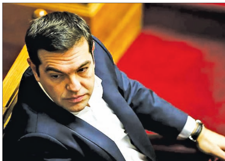
Greek Prime Minister Alexis Tsipras. PHOTO: REUTERS

"The implementation of the bailout is necessary but it is not enough on its own. We need a web of parallel actions ... in the next 20 crucial months to achieve our target of restoring liquidity and regaining market access," Tsipras said.—Reuters