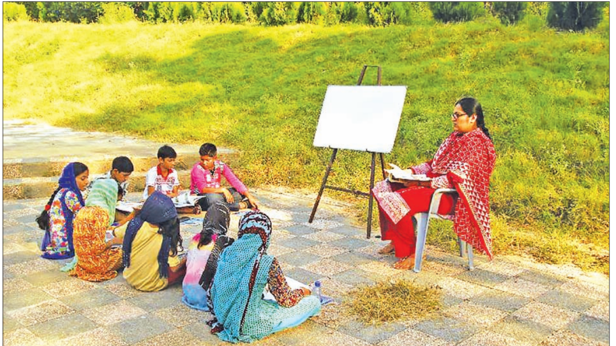
Teacher and students on World Teachers Day in Islamabad, of Pakistan, on 5 October 2015.