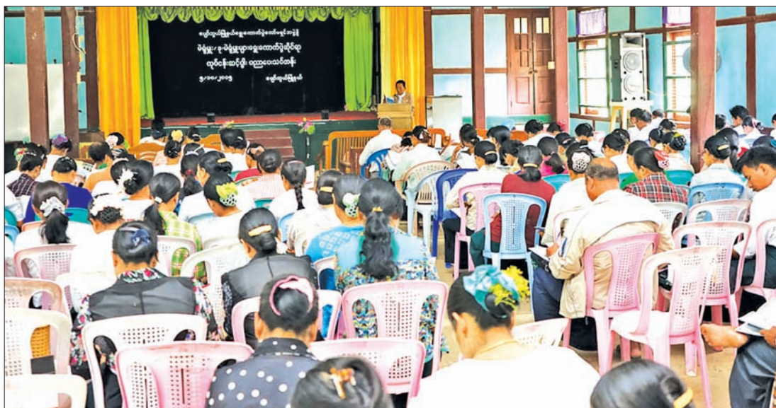
As election is drawing near, poll officers are taking training across the country.

procedures and shown demonstrations of secret voting in ballot booths. Pyawbwe Township, Mandalay Region, has 291 ballot stations in its two constituencies.—Min Min Htwe- Pyawbwe