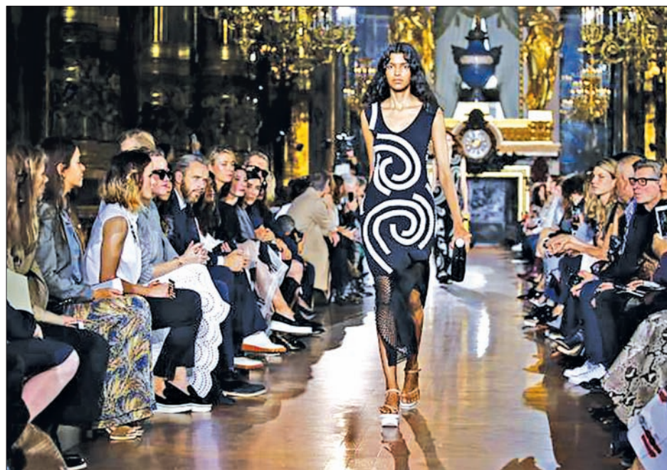
A model presents a creation by British designer Stella McCartney as part of her Spring/Summer 2016 women's ready-to-wear fashion show in Paris, France on 5 October 2015.

PARIS — Known for mixing luxury and sport, designer Stella McCartney showed off bright summer dresses with polo shirt collars in a colorful offering for women's wardrobes next spring.