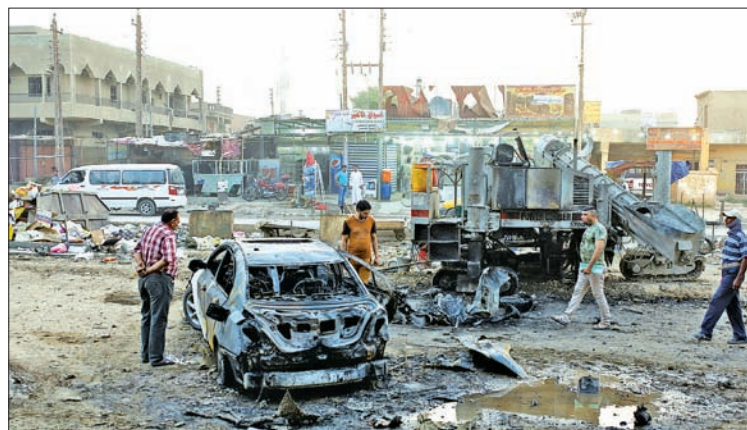
People gather at the site of car bomb attack in Baghdad on 6 October 2015.

Islamic State has previously claimed responsibility for car and suicide bombings.—Reuters