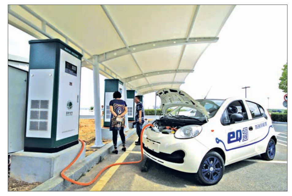
A Chery electric car is being charged at a charging station in Dalian, Liaoning Province, China on 1 September 2015.

The government has also offered tax cuts for green vehicles and proposed extending subsidies, mostly for domestic producers, to help automakers meet these targets.—Reuters