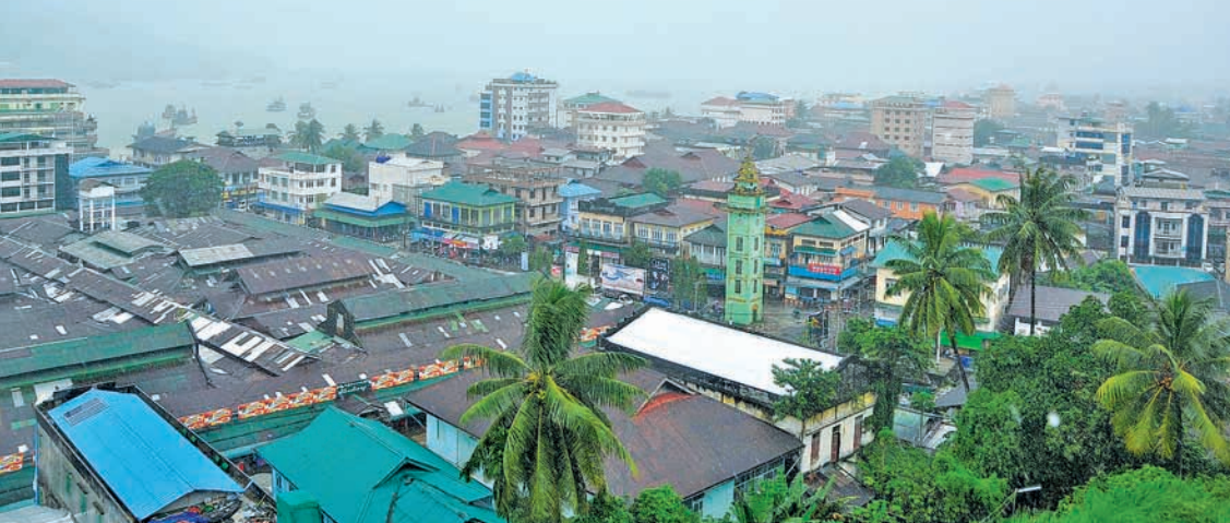
Thai Princess Maha Chakri Sirindhorn enjoys scenic beauty of Myeik, Taninthayi Region.

THAI Princess Maha Chakri Sirindhorn pagoda and visit religious buildings. While