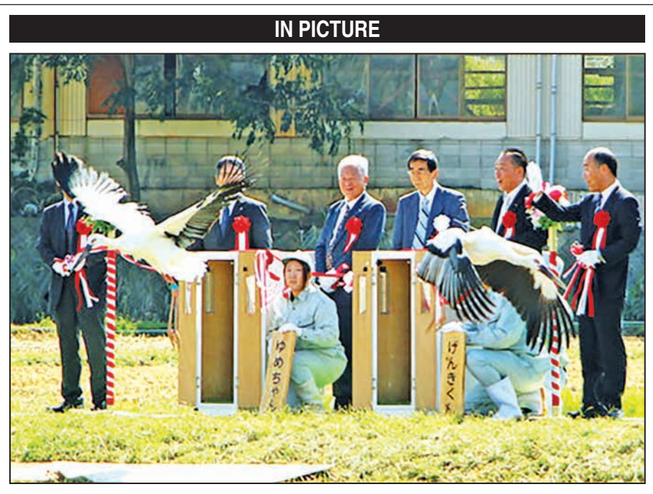
Two storks are released into the wild in the central Japan city of Echizen on 3 October 2015. In a bid to breed the special national treasure, local farmers there cultivate rice without using pesticides to keep insects and fish alive for storks to feed on.