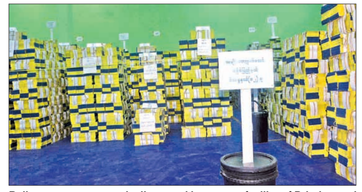
Ballot papers systematically stored in storage facility of Printing and Publishing Enterprise (Nay Pyi Taw).

Printing ballot papers for Myanmar's franchised population of 32 million is no easy task, but PPE's general manager expressed confidence that the mission will be accomplished.—Myint Maung Soe