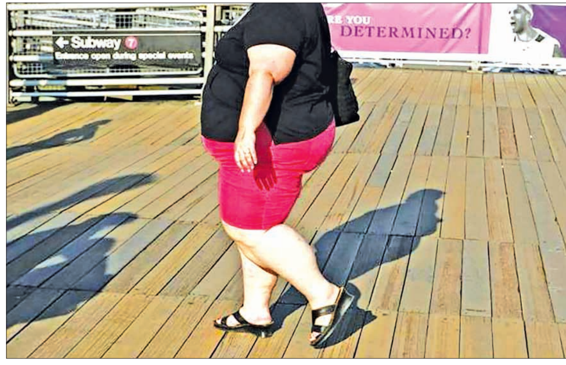
A woman walks along the boardwalk while leaving the US Open tennis tournament in New York.

The public are urged to carry out regular inspections to make sure their homes are clean and dry, especially after the heavy rain brought by Typhoon Dujuan last week. Dengue is a mosquito-borne, potentially fatal disease that mainly affects people in tropical and subtropical regions, causing fever, nausea and muscle and joint aches.—Xinhua