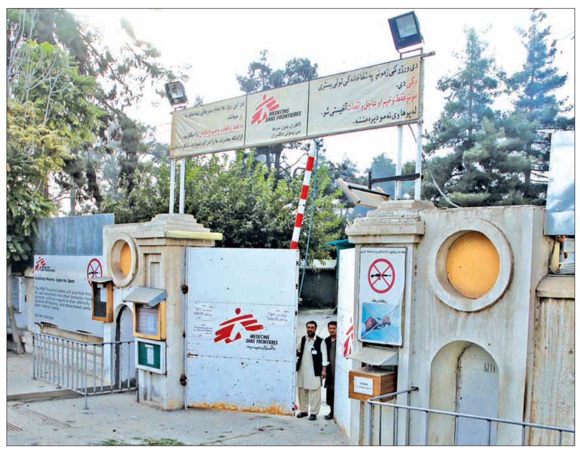
Afghan guards stand at the gate of Medecins Sans Frontieres (MSF) hospital after an air strike in the city of Kunduz, Afghanistan on 3 October 2015.

tient or a caretaker was inside the hospital when the bombing happened," Medecins Sans Frontieres said in a statement on Sunday.—Reuters