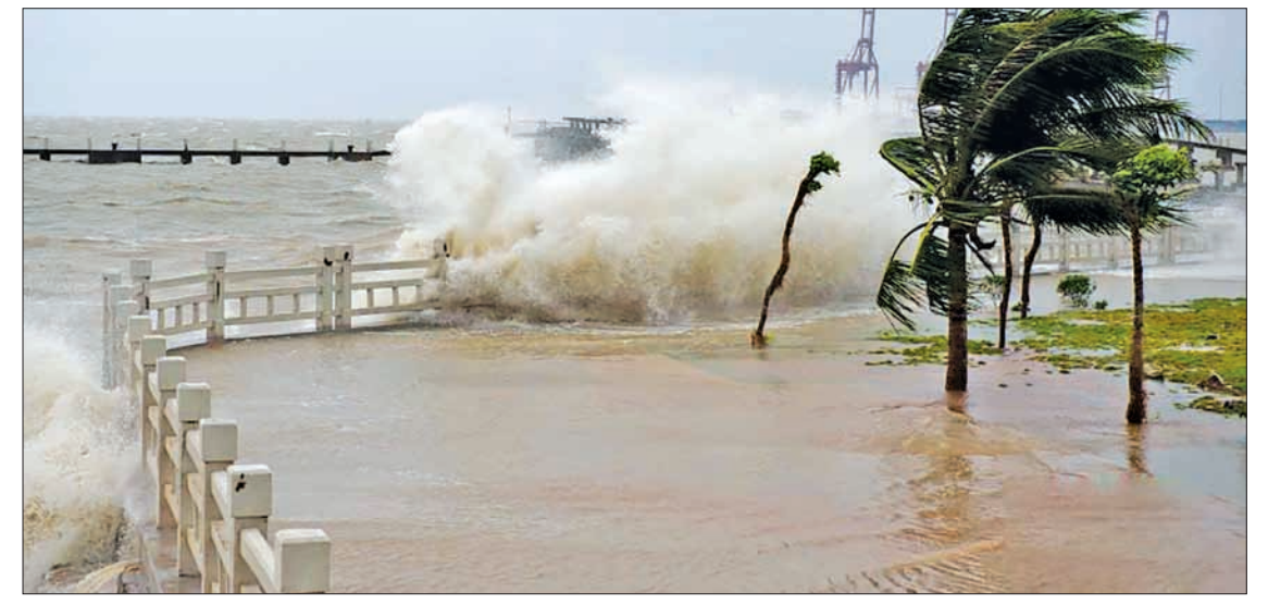
Typhoon Mujigae, the 22<sup>nd</sup> typhoon this year, landed on South China's Guangdong Province on Sunday, the provincial meteorological observatory said.