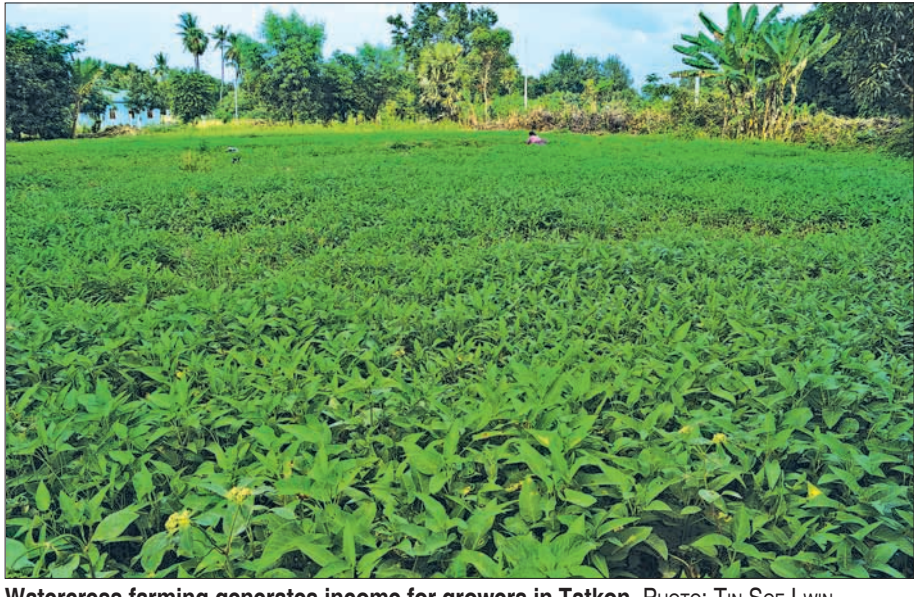
Watercress farming generates income for growers in Tatkon.

from Peintaw said that watercress takes is ready to sell at the market just a month after planting t, and said that his family earns K17,000 every day from his half-acre watercress patch. Watercress is a common ingredient in Myanmar dishes and is known to be highly nutritious.—Tin Soe Lwin IPRD