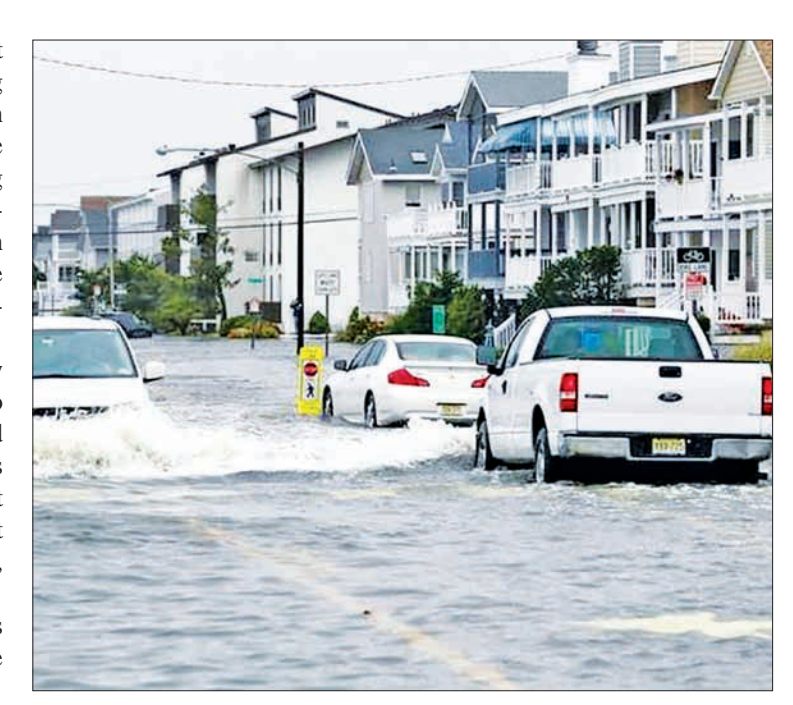
"Because we found a life Vehicles drive along a flooded West Avenue as a nor-easter comes on shore in Ocean City, New Jersey on 2 October 2015. Hurricane Joaquin was not expected to be a major threat to the US East Coast, the US National Hurricane Center (NHC) said.

"When we commence searching tomorrow morning at sunrise, hopefully we'll be able to find something else. Every little bit helps," he added. At 8 pm ET (0000 GMT), Joaquin, which strengthened significantly early Saturday,