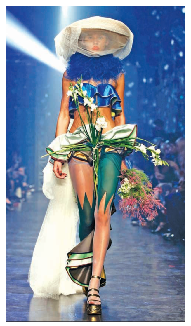
A model presents a creation by British designer Vivienne Westwood as part of her Spring/Summer 2016 women's ready-to-wear fashion collection in Paris France on 3 October 2015.

PARIS — Bold prints and floating jackets prevailed at Vivienne Westwood's Gold Label catwalk show at Paris Fashion Week on Saturday. Westwood, known for her environmental activism, said she picked an underlying theme of saving the Italian city of Venice