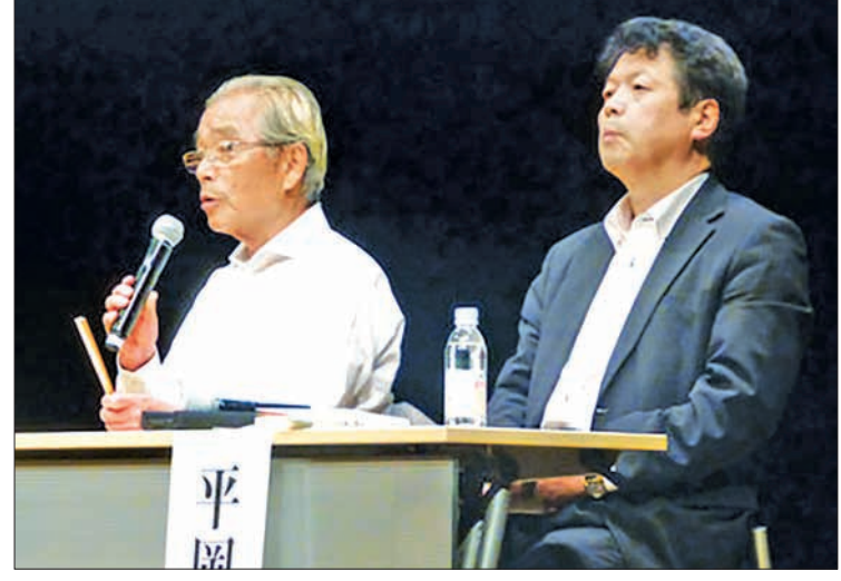
Seiken Sugiura (L) and Hideo Hiraoka, both of whom previously served as justice minister, attend an anti-death penalty rally in Tokyo on 3 October 2015, to appeal for the abolition of capital punishment.

"I examined documents of some death row inmates to ask myself if I could issue orders to hang them, and I found I could not go ahead," he said. While a justice minister is authorised to issue the order, "It is the top leader of the country who can clear way for debate on the death penalty system,"