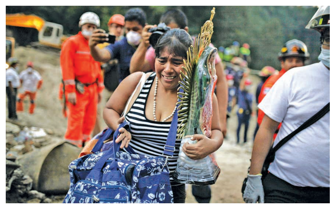
One digger unearthed the A woman carries a religious statue and belongings while evacuating from an area affected by mudslide in body of a little girl with scratch Santa Catarina Pinula, on the outskirts of Guatemala Cityo n 3 October 2015.

Hundreds of people are believed to have died, and many of the bodies were never