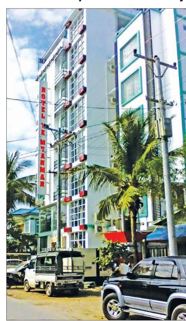
Hotel Ye Myanmar in Mandalay ready to serve visitors.

HOTEL Ye Myanmar, located in Maha Aung Myae Township in Mandaceremony on 3 October. The event was attended by Mandalay Mayor U Aung Maung and Mandalay Region Social Welfare Minister Dr Win Hline.