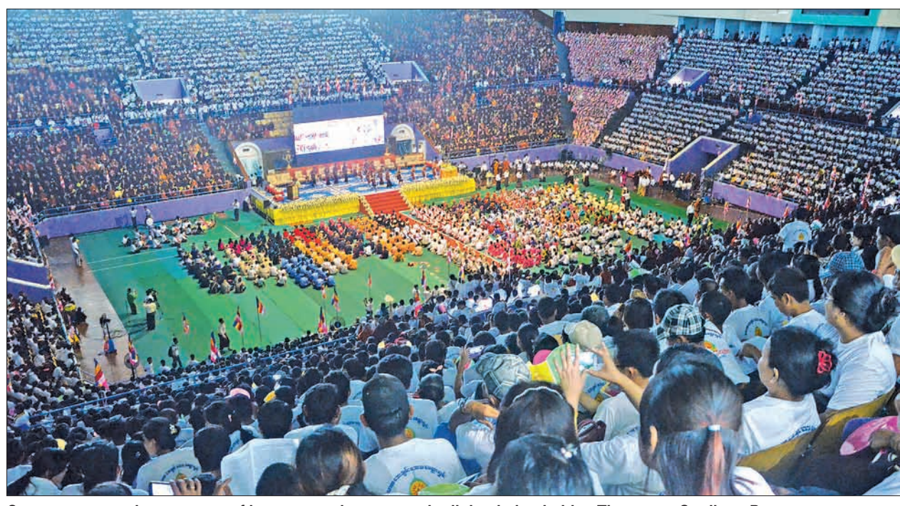
Ceremony to mark enactment of laws protecting race and religion being held at Thuwunna Stadium.

Presiding monks of the organization responded to questions raised by participants. Among about 100,000 participants were diplomats and officials of political parties and civil society organizations.-Zawgyi (Panita)