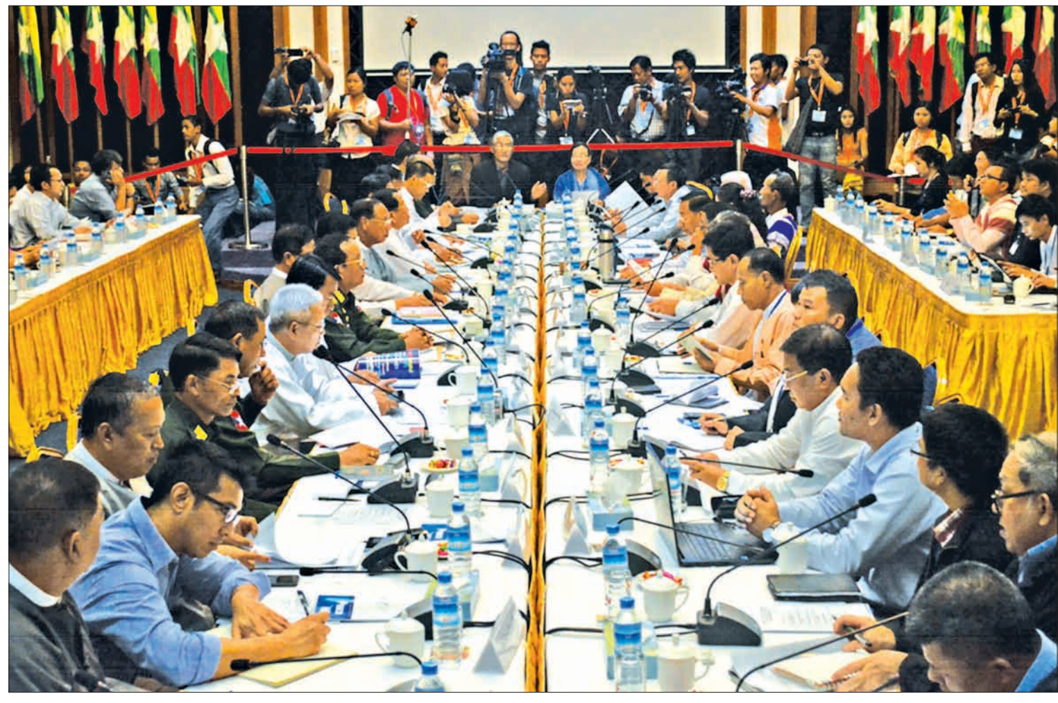
The government's ceasefire talks committee and representatives from eight ethnic armed groups at a meeting to discuss the date of the signing of the nationwide ceasefire accord on Sunday.

The meeting to decide the signing date for NCA was attended by eight ethnic armed groups, including the Karen National Un-