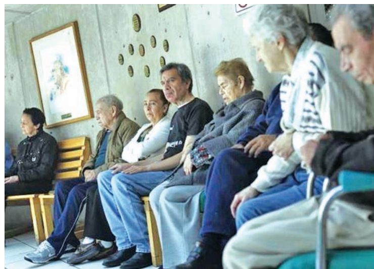
Patients with Alzheimer's and dementia are sit inside the Alzheimer foundation in Mexico City.