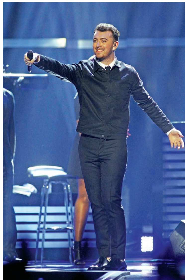
British singer Sam Smith performs during the 2015 iHeartRadio Music Festival at the MGM Grand Garden Arena in Las Vegas, Nevada on 18 September 2015.

Veteran British band New Order recorded their highest album position in 22 years, debuting in second with "Music Complete", with last week's number one "Rattle That Lock" by Pink Floyd's David Gilmour in third. —Reuters