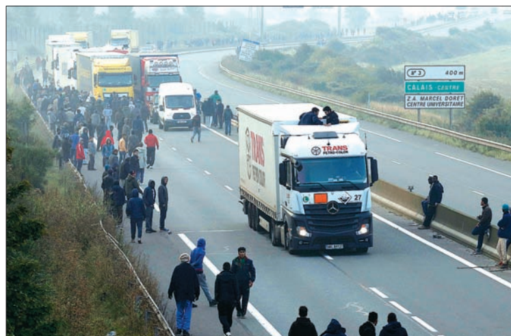
Migrants gather on the road as others board lorries that queue on the access road to reach the ferry terminal in Calais, France on 3 October 2015.

France and Britain have pledged to step up security at the tunnel after incidents this summer caused tensions between the two EU member states.—Reuters