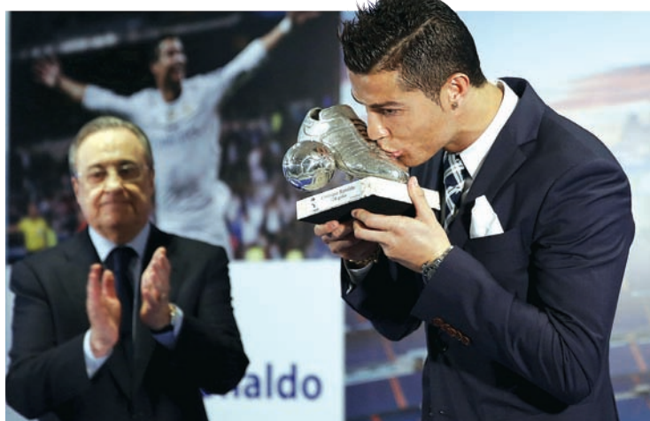
Real Madrid's Cristiano Ronaldo kisses a trophy as club's president Florentino Perez applauds during a ceremony at Santiago Bernabeu stadium in Madrid, Spain on 2 October 2015.

He needed a mere 308 matches across seven seasons to equal Raul's tally of 323, amassed in 741 games over 16 years.— Reuters