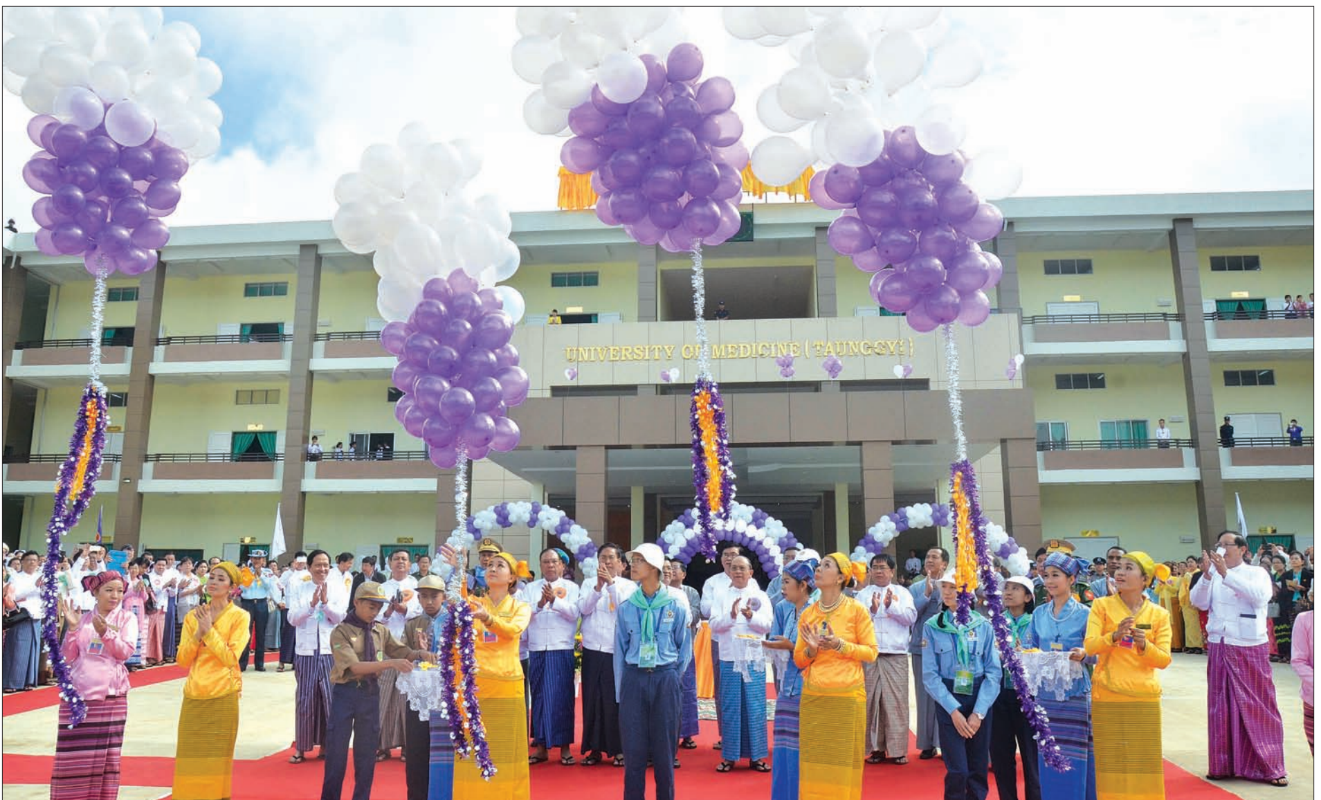
University of Medicine (Taunggyi) is formally opened in Taunggyi in the presence of President U Thein Sein.

A FIRST university of medicine is opened in Taunggyi, Shan State, in the presence of President U Thein Sein Saturday.