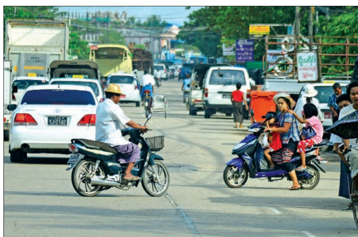
Authorities seized more than 1,600 illegal motorbikes up to date.

"Despite rumours that Yangon's motorbike law may change amid the Myanmar government's reform fervour, those who wish to see the ban lifted ought not hold their breath."