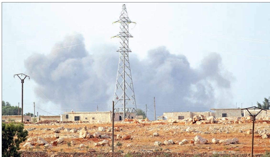
Smoke rises after what activists said were Russian airstrikes in the southern countryside of Idlib, Syria on 2 October 2015.

“Mr. Putin had to go into Syria not out of strength, but out of weakness because his client Mr. Assad was crumbling and it was