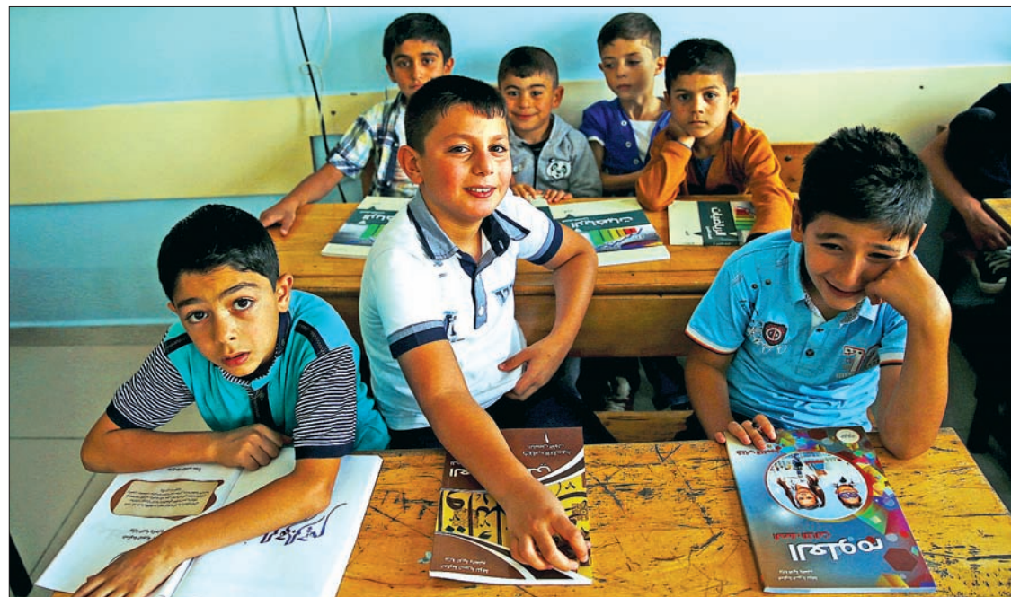
Syrian refugee children sit in their classroom at Fatih Sultan Mehmet School in Karapurcek district of Ankara, Turkey.

"The government gives us nothing. Everything is for Syrians... Coal, food and UNICEF, and nothing for us."—Reuters