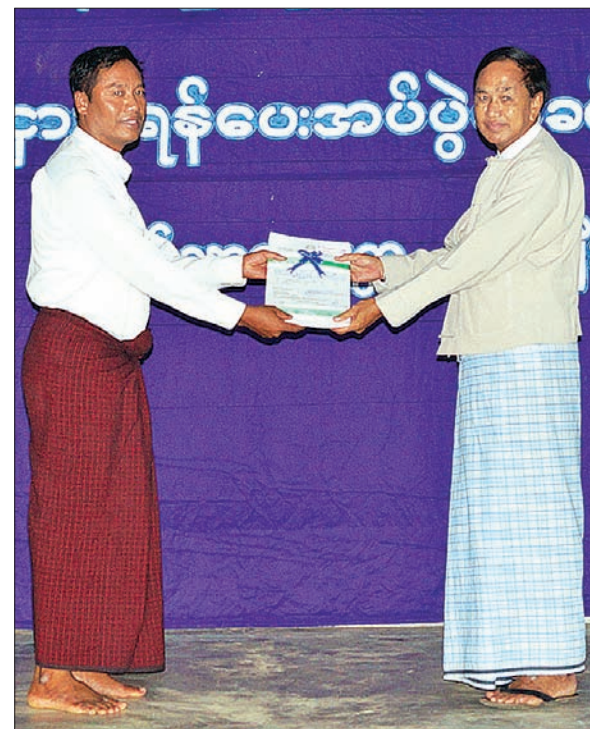
Thirty-eight families in Kyoatpintha Village in Tatkon Township receive land leases from the government.

The traditional boat races were participated by 12 teams. Some decorated boats were also on the show.— (Thiha KoKo-Mandalay)