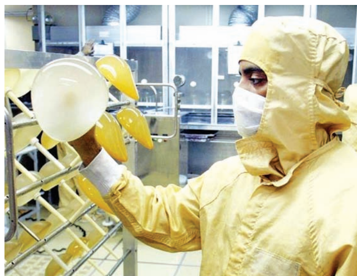
A laboratory worker of Silimed factory checks silicone implants at a factory in Rio de Janeiro.

RIO DE JANEIRO — Brazil's health regulator Anvisa said on Friday it had suspended the production, sale and use of products made by Brazilian breast-implant maker Silimed after an inspection found the company failed production standards.