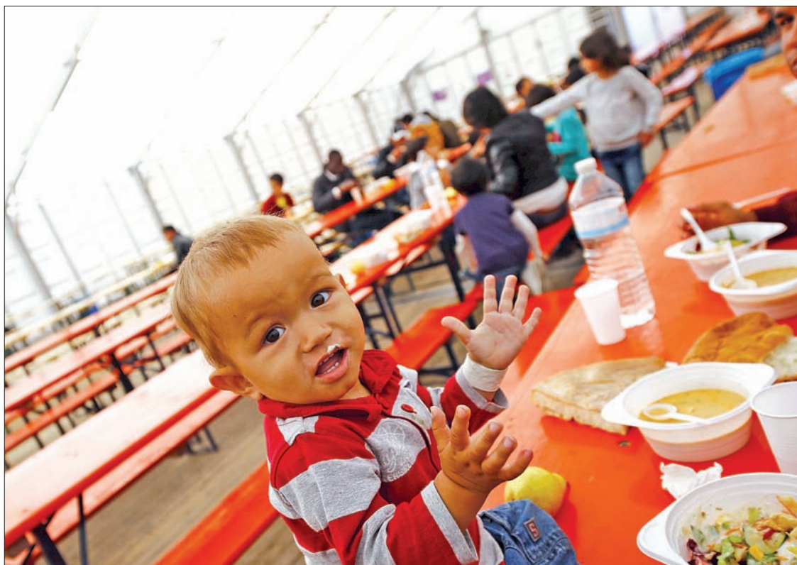
Migrants have lunch at a temporary shelter in a sports hall in Hanau, Germany on 1 October 2015.

Interior Minister Thomas de Maiziere has also warned about violence in asylum-seeker centres. Speaking on broadcaster ZDF on Thursday, he said that