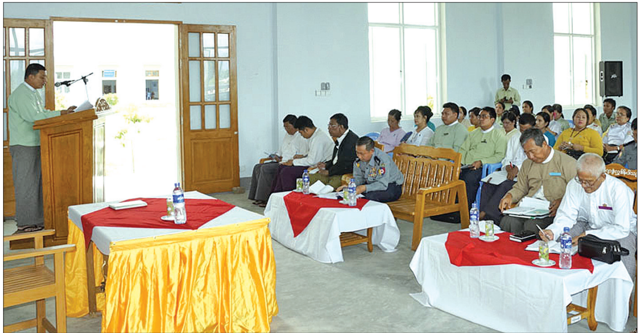
Authorities discussed preparations for providing security to polling stations. PHOTO: SHWE KOKKO

The meeting was attended by township administrators of the district's four townships of Nay Pyi Taw Council Area, local officials, district and townships election committee members, Red Cross members and civic groups.— Shwe Kokko