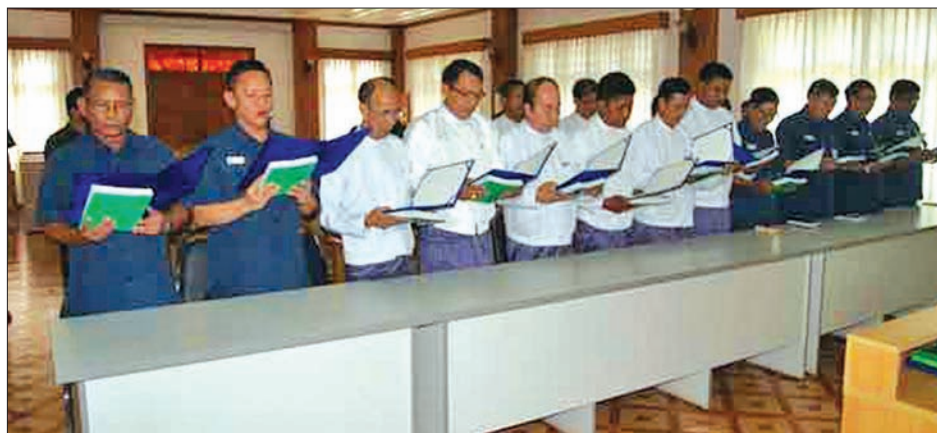
Elected members Mandalay City Development Committee take oaths before Mandalay Region Chief Minister.

work for a more pleasant, clean and developed Mandalay city. He also encouraged the new members and officials who attended the occasion, to make utmost efforts within the laws for the well being of public.— Maung Pyi Thu