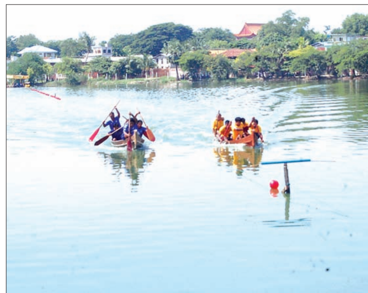
Boat racing in Mandalay.

The first-ever boat race event took place 26 years ago for the same reason.—Tin Maung (Mandalay)