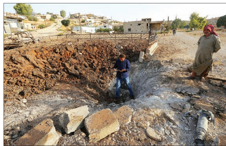
Men stand along a crater caused by what activists said was a Russian air strike in Latamneh city on Wednesday, in the northern countryside of Hama, Syria on 2 October 2015.

"We can't leave it to French, Australian and American aircraft to keep our own British streets safe," he said. Putin's decision to launch strikes in Syria marks a dramatic escalation of foreign involvement in a civil war more than four years old, where every major country in the region has a stake. —Reuters