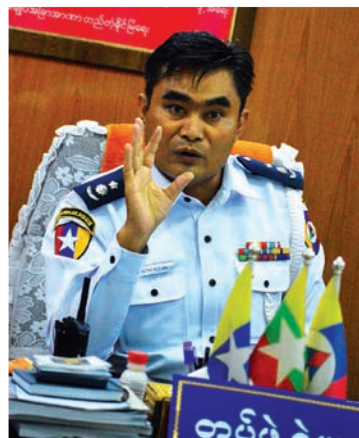
Traffic Police Colonel Aung Ko Oo.