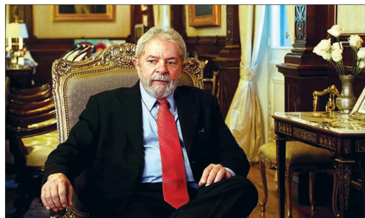
Brazil's former President Luiz Inacio Lula Da Silva.

RIO DE JANEIRO — Brazil's Supreme Court authorised the questioning by police of ex-President Luiz Inácio Lula da Silva in a broadening corruption case focussed on state-run oil company Petrobras (PETR4.SA), a representative for the court said on Friday.