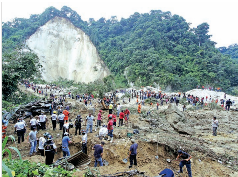
Rescue team members and volunteers search for mudslide victims in Santa Catarina Pinula, on the outskirts of Guatemala City on 2 October 2015.

Thirty-six people had been pulled out from the mud and debris and rushed to hospital.—Xinhua