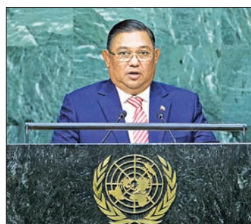
Myanmar's Foreign Minister U Wunna Maung Lwin addresses attendees during the 70th session of the United Nations General Assembly at the UN Headquarters 2 October 2015.

Over the past four and a half years, we have been able to enhance peace, stability and rule of law and socio-economic development in the country. One may not be content with the pace of our reform process. However, it is undeniable that we have been able to create better political and