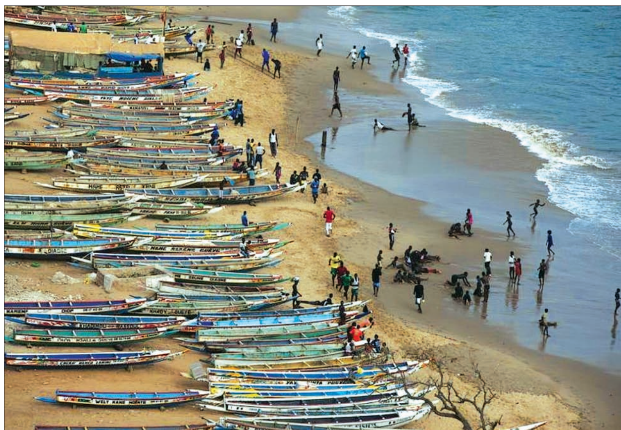
People are pictured on a beach next to fishing canoes in Dakar, Senegal on 21 June 2013.

LAC ROSE — Approaching Senegal's sand dune-flanked Lac Rose, overcast skies hid the sun and, at first, obscured the vibrant pink hue that gives the expansive lake its name.