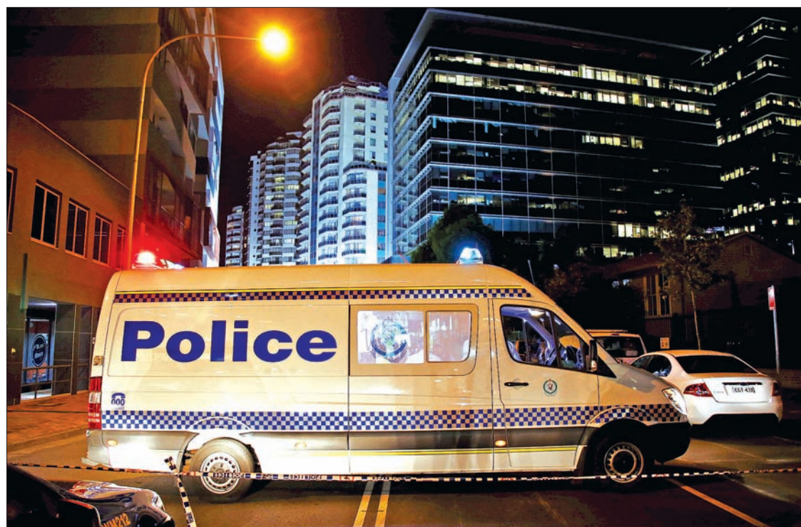
A police van blocks a street outside the New South Wales (NSW) state police headquarters located in the Sydney suburb of Parramatta, Australia on 2 October 2015.

SYDNEY — Australian police said on Saturday they believed the shooting of a police worker by a 15-year-old boy in Sydney the previous day was "linked to terrorism", the latest in a series of attacks blamed on radicalised youth.