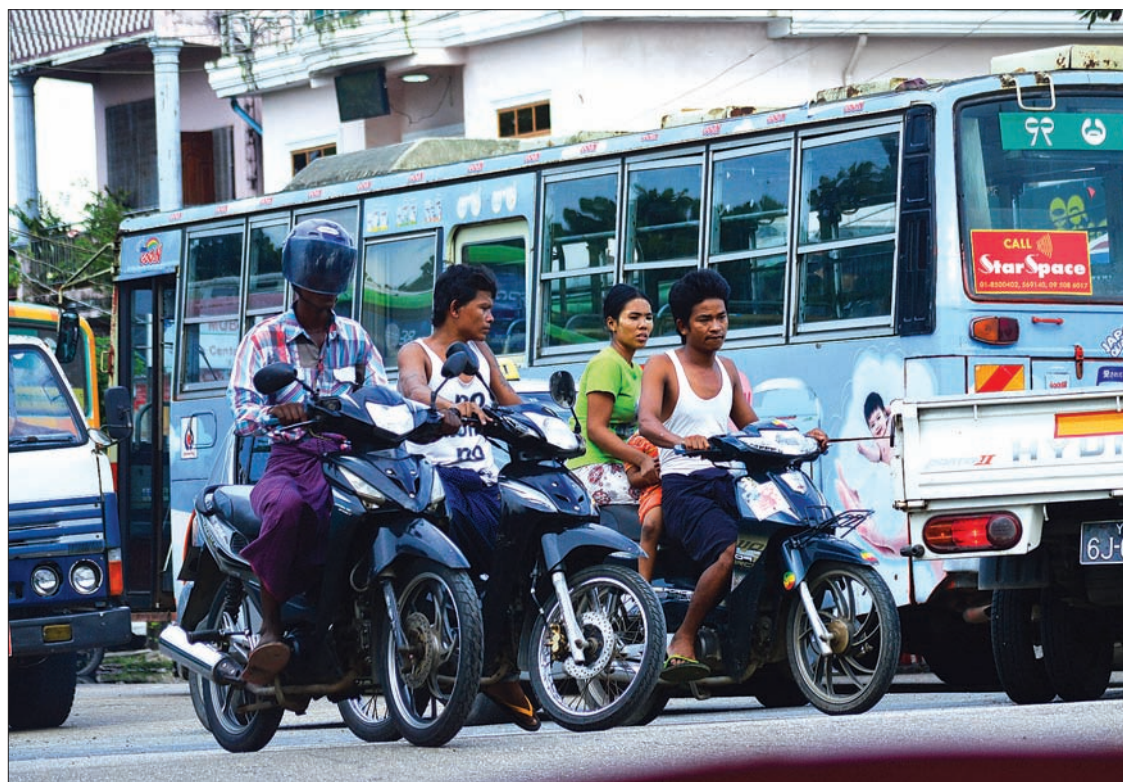
Yangon Region Government announced recently an order banning motorbikes in Yangon region.

The inconsistency with which Yangon's anti-motorbike law is enforced is just one reason to doubt its stated purpose. Many have called attention to the fact that motorbikes are permitted in every other state and region of Myanmar.