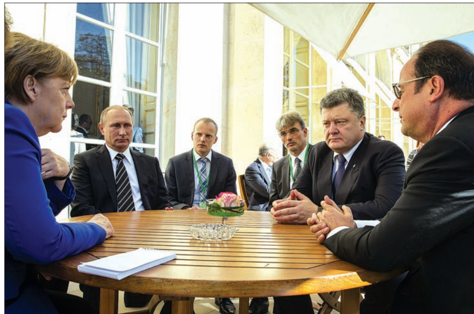
French President Francois Hollande, German Chancellor Angela Merkel, Russian President Vladimir Putin and Ukrainian President Petro Poroshenko attend a meeting in Paris France on 2 October 2015.

PARIS — It will take time to organise elections in Ukraine that respect international standards and as a result, the so-called Minsk peace process will run into next year, French President Francois Hollande said on Friday.