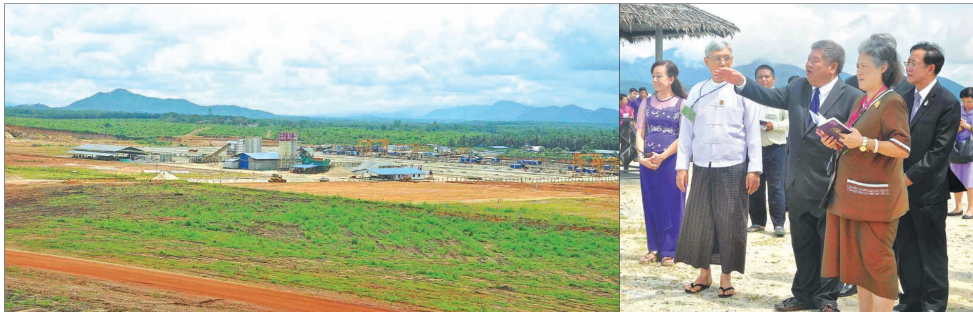
Thai Princess Maha Chakri Sirindhorn visits the site for Dawei Special Economic Zone project.

AT the request of Vice President Dr Sai Mauk Kham, Thai Princess Maha Chakri Sirindhorn visited Dawei of Taninthayi Region yesterday to observe the development of Myanmar-Thailand-Japan's Daiwei Special Economic