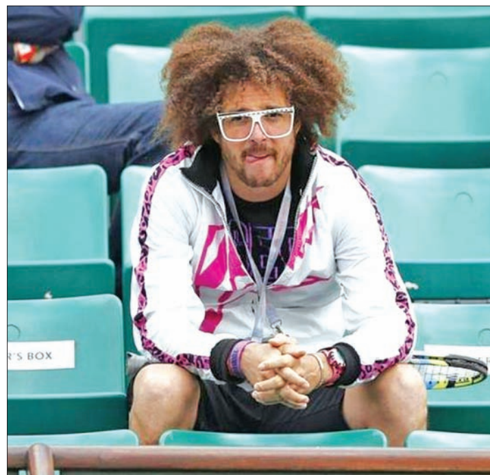
Redfoo, also known as Stefan Gordy of the band LMFAO.

A MUSIC concert will be held at the Shwe Htut Tin Ground in Tamwe Township on 24 October, according to Polyphonic Music & Entertainment, who is organising the event.