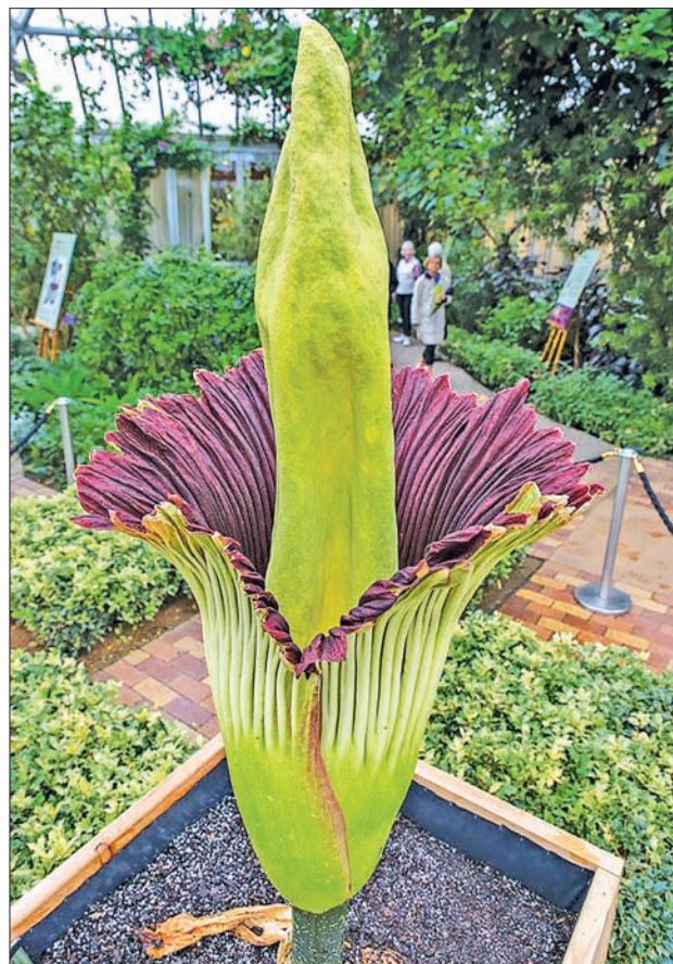
The Amorphophallus titanum plant, also called the corpse flower at the Chicago Botanic Garden is pictured in bloom on 29 September, 2015.

GLENCOE — Thousands of curiosity seekers lined up in the blustery, dark Chicago Botanic Garden on Tuesday night to catch a rare glimpse of a 4-1/2-foot (1.4-metre) tall corpse flower in full bloom, but not in full stench.