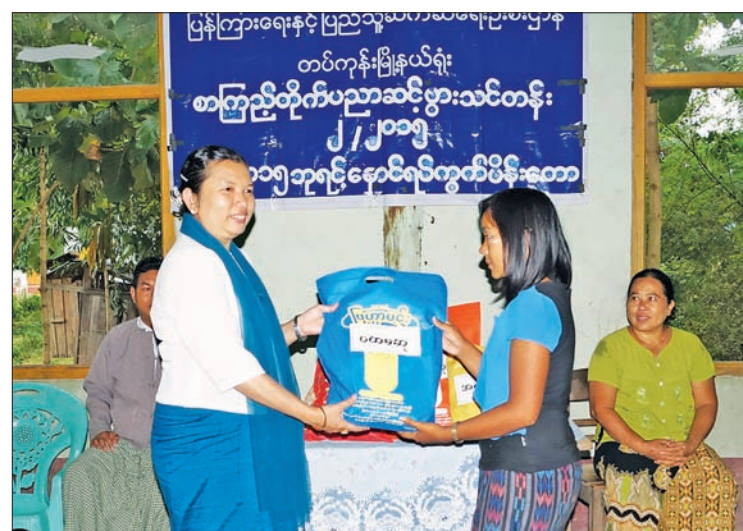
An official presents award to a trainee.

A COURSE on library science concluded in Tatkon Township, Nay Pyi Taw Council Area, on 28 September.