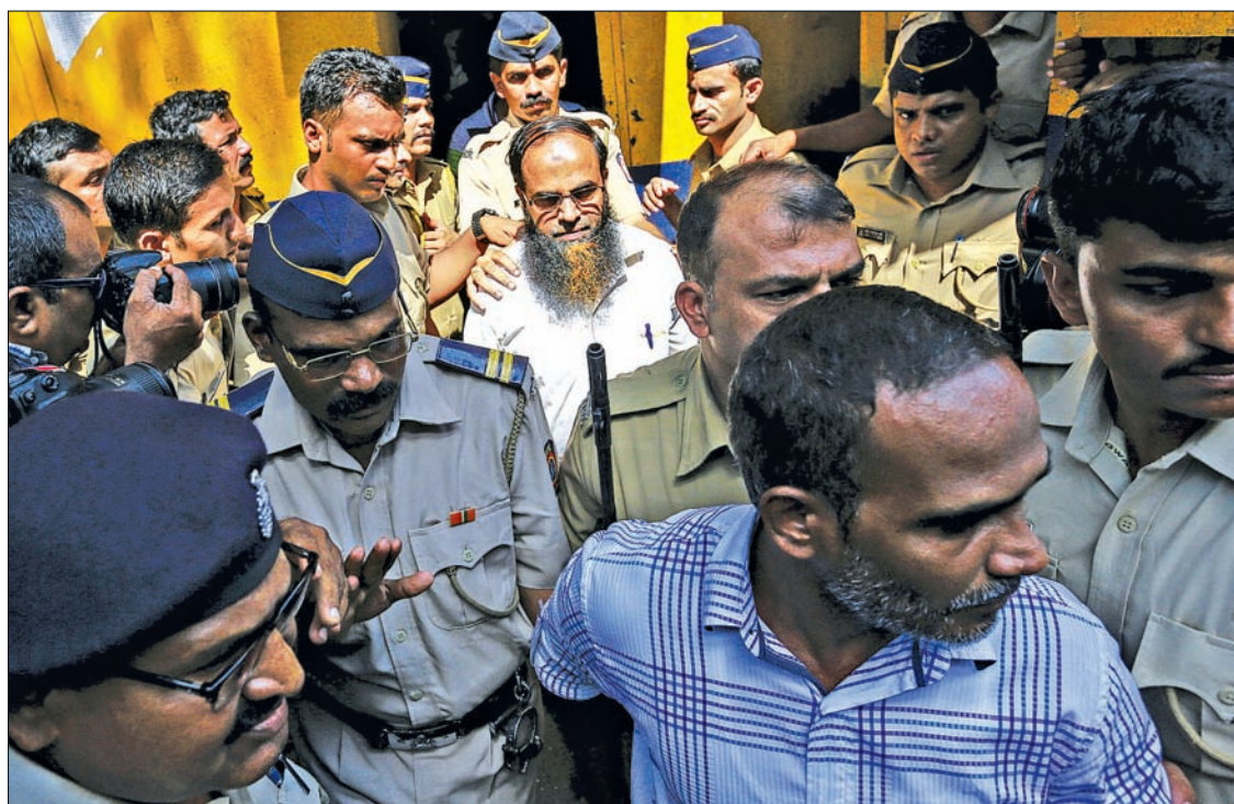
Two of the 12 men are escorted by police to a court in Mumbai, India, 30 September 2015.

“The whole process could take a year,” terrorism and security expert Sameer Patel told AFP. The Supreme Court has said that capital punishment should only be carried out in “the rarest of rare” cases in India, among a dwindling group of nations that still have the death penalty on their statute books.— AFP