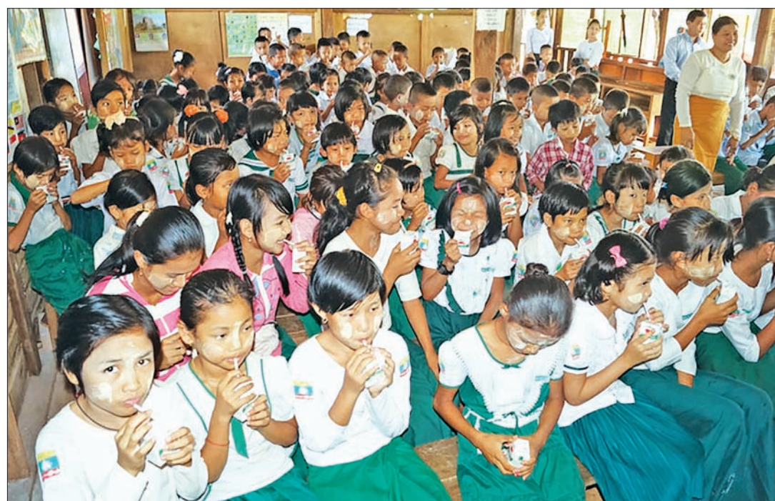
School children enjoy milk at Myaenigone basic education primary school in Myawady.