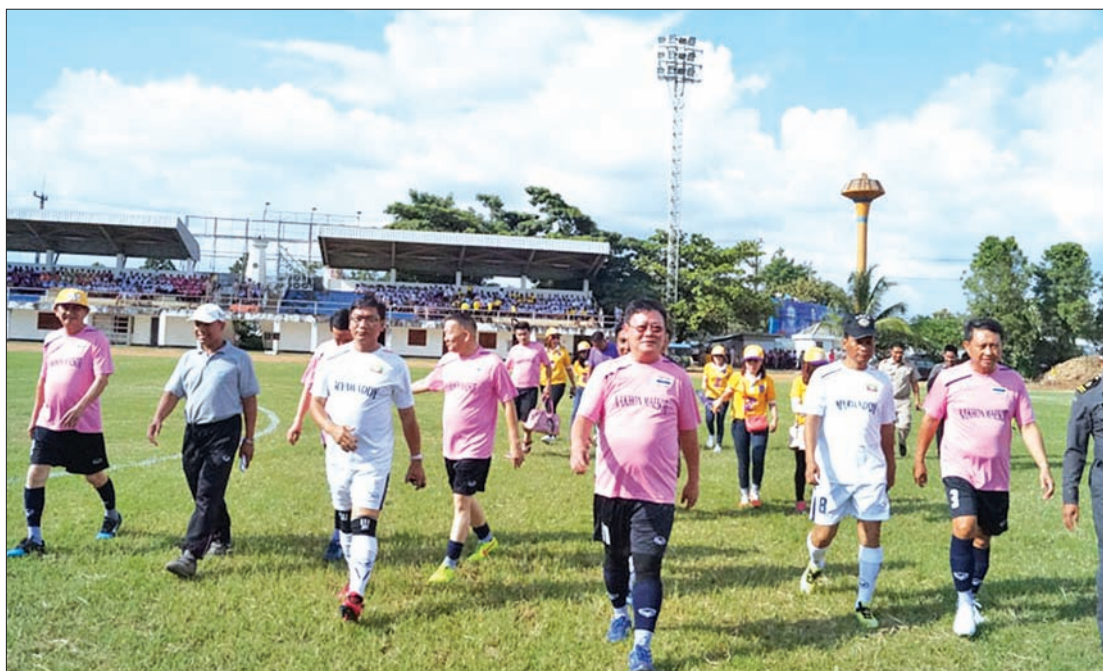
Government officials from Myanmar and Thailand enter into pitch to take part in friendly football match in Maesot. PHOTO: HTEIN LIN AUNG (IPRD)

The matches were held to promote friendly relations between the two countries, which is expected to boost tourism and trade between them.— Htein Lin Aung (IPRD)