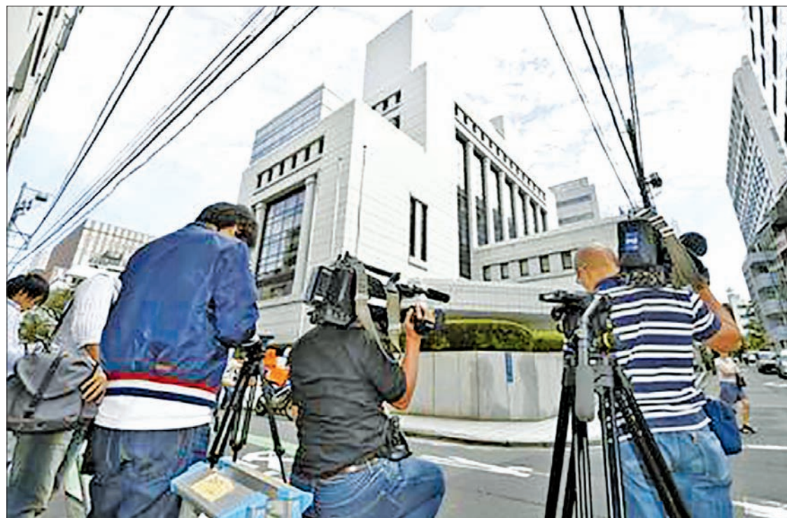
Reporters gather in front of the building housing the Japan Dental Federation in Tokyo on 30 September, 2015. Tokyo prosecutors arrested three former leaders of the organisation the same day for their alleged false political funds report over donations to a ruling Liberal Democratic Party lawmaker.

Prosecutors raided the federation's office over the allegation in April.—Kyodo News