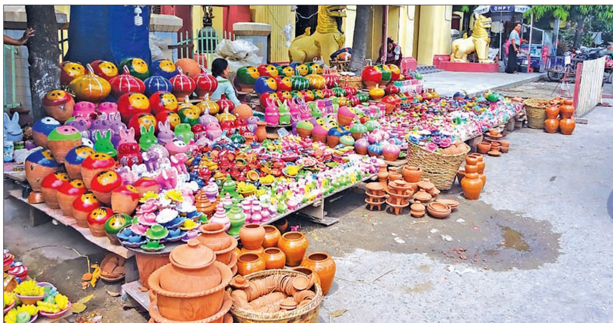
Clay toys attract Myanmar children at Phayathonsu Pagoda festival in Mandalay.

The pagoda festival will formally begin on 23 October, but vendors are also able to make sales during the pre-festival period. A clay toy festival in Mandalay's Aungmyaethasan Township was held on 22 August.— Thiha Ko Ko