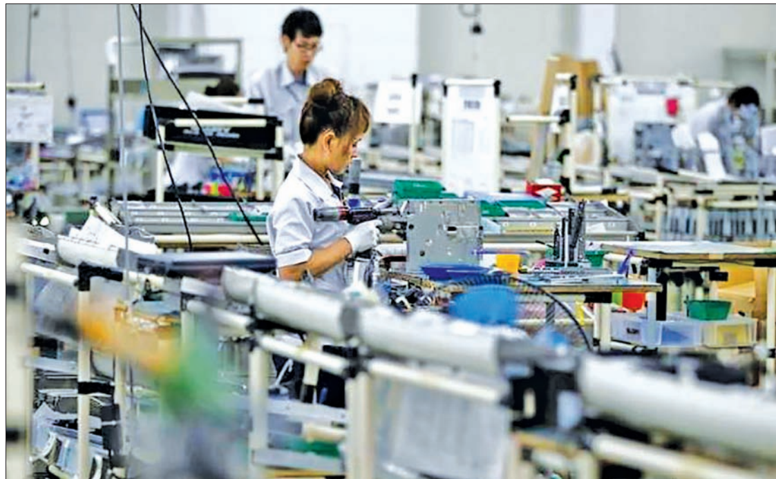
Employees work an assembly line at a factory of Glory Ltd, a manufacturer of automatic change dispensers, in Kazo, north of Tokyo, Japan.

TOKYO — Japan's factory output unexpectedly fell for the second straight month in August, fuelling worries the economy is slipping back into recession and raising more doubts about whether the government can reignite growth and end decades of deflation.