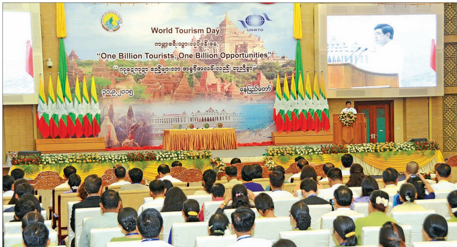
Vice President U Nyan Tun gives an address during a ceremony to mark World Tourism Day in Nay Pyi Taw on Wednesday.

The government has initiated long-term plans for recovery measures in which tourism plays a critical role, the vice president