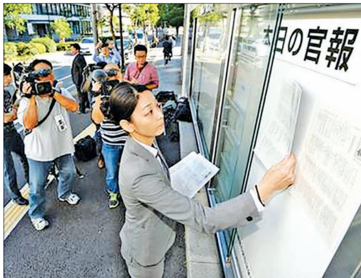
An employee of the National Printing Bureau in Tokyo.

TOKYO — The Japanese government Wednesday promulgated two new security laws enacted earlier this month to expand overseas operations of the Self-Defence Forces.