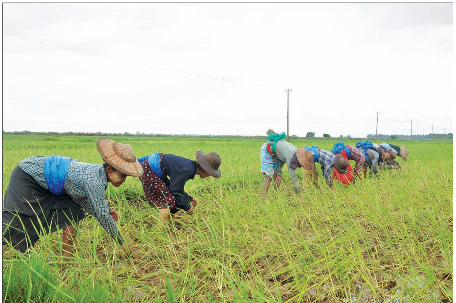
Farmers plant rice seedlings in field in Ingapu, Ayeyawady Region, as flood waters recede.

In the evening, the president made tour of inspection to Kanyin Dam and its