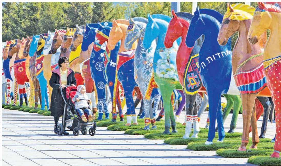
A woman with a pram walks past a street art installation in Astana, Kazakhstan, 30 September, 2015.