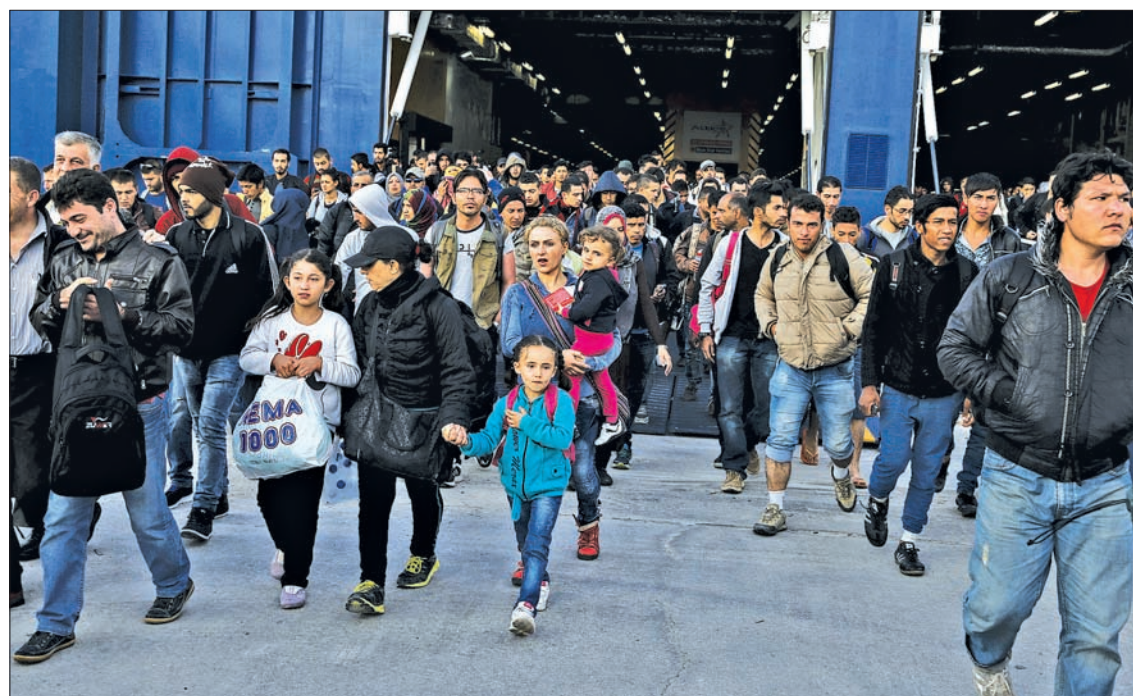
Refugees and migrants disembark from the Blue Star Patmos passenger ship at the port of Piraeus, near Athens, Greece on 30 September 2015.

More than 130,000 migrants have arrived in Italy by boat so far this year, making it a front-line country along with Greece for Europe's biggest immigration crisis since World War Two. France refuses to let them cross the border because, according to EU law, the migrants are Italy's responsibility.—Reuters