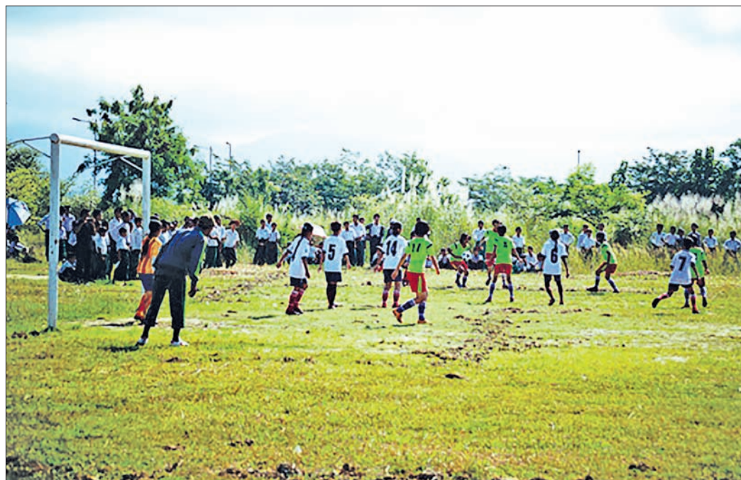
Zayathiri’s team beat Pobbathiri 3-2 in Under-13 girls football match at Pobbathiri Township’s No 20 Basic Education High School sports ground.

UNDER-13 girls football matches kicked off at Pobbathiri Township’s No 20 Basic Education High School sports ground on Wednesday. The matches are held to nurture promising football players.