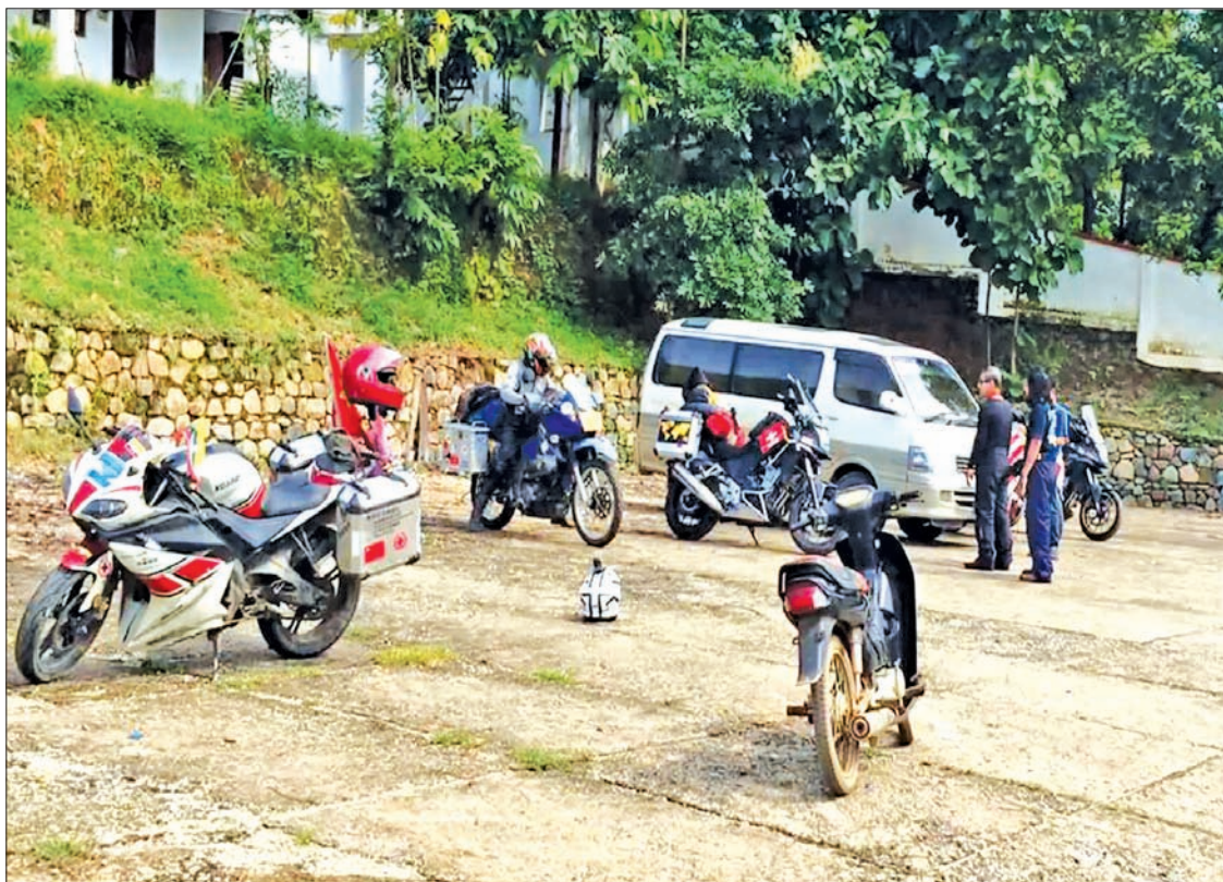
Malaysian Motorcyclists stopped over in Myanmar after entering the country through Myawady.