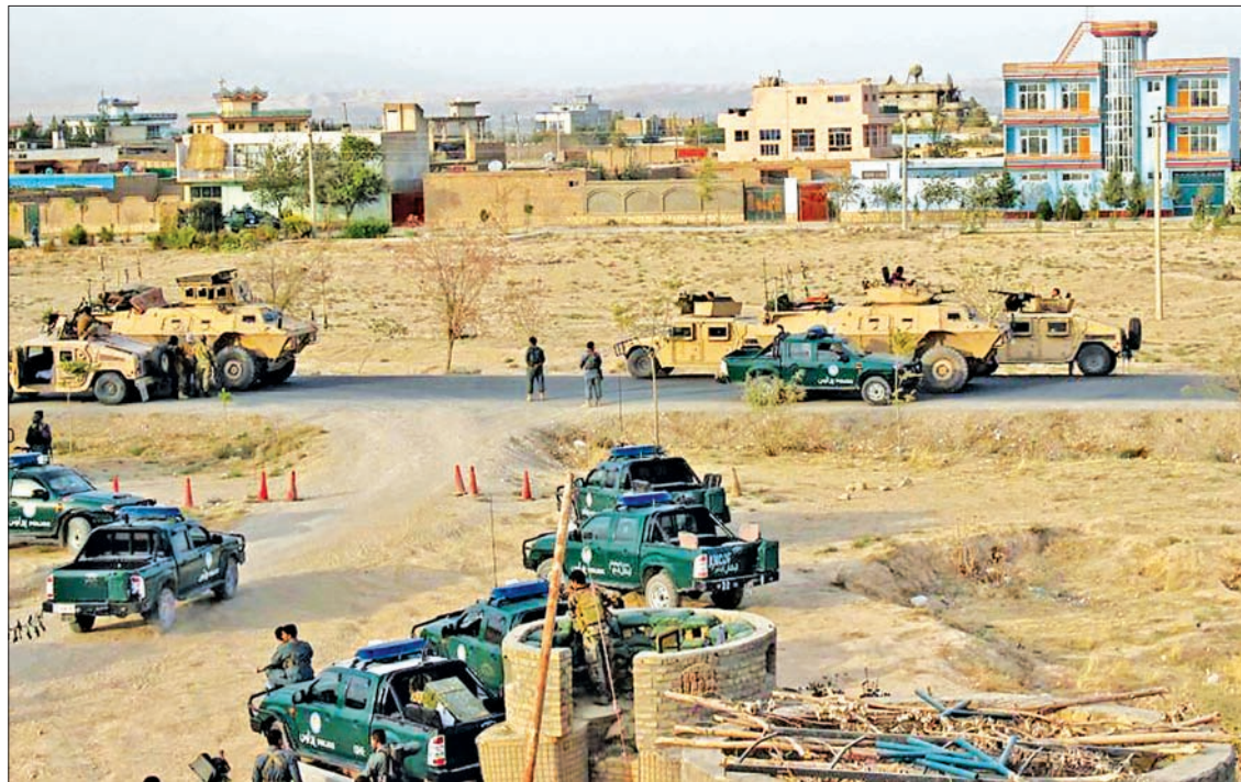
Afghan security forces take their positions during a gun battle in Kunduz city, northern Afghanistan on 29 September 2015.

KABUL — NATO special forces have reached Kunduz to support Afghan troops after the Taliban seized the strategic northern city, the military coalition said Wednesday.