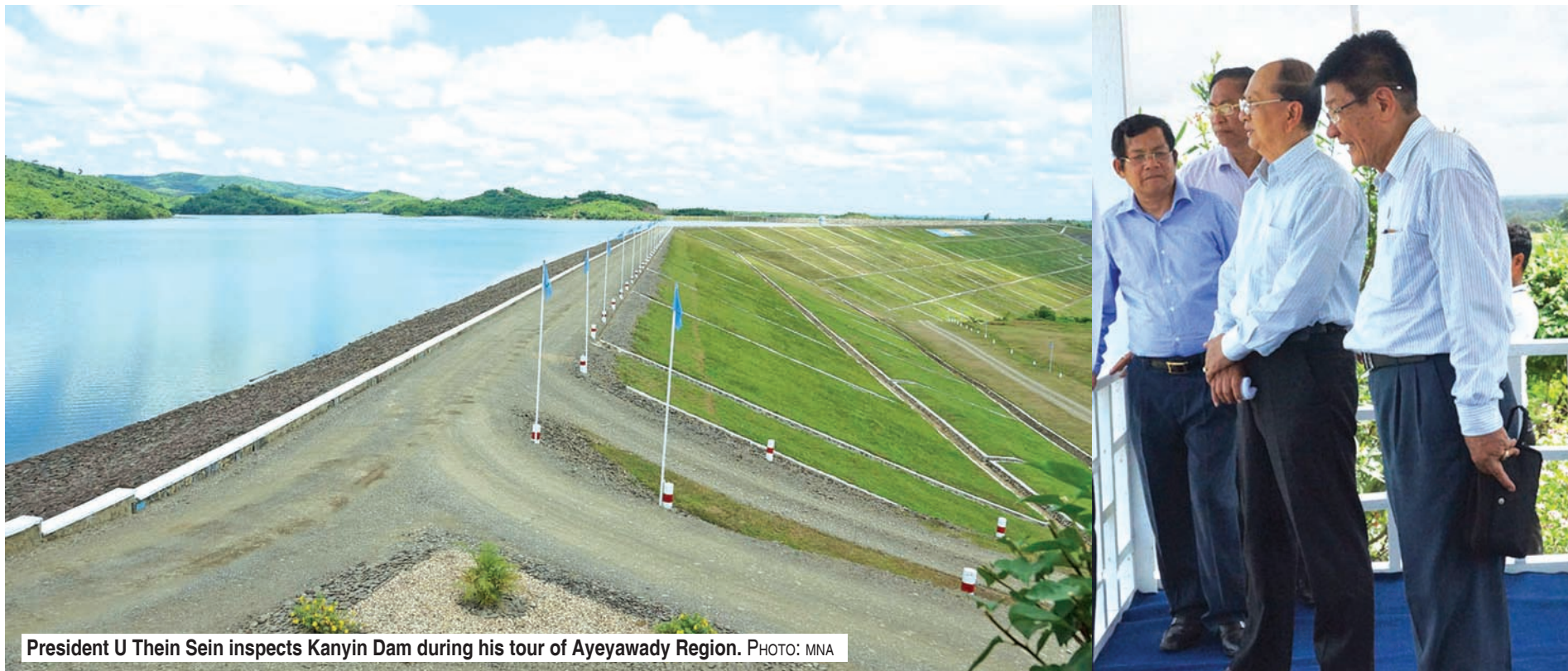
President U Thein Sein inspects Kanyin Dam during his tour of Ayeyawady Region.