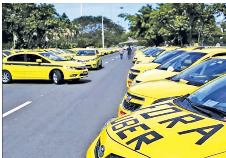
Taxis parked on the street, one with words which reads "Out Uber", are pictured during a protest against the online car-sharing service Uber in Rio de Janeiro, Brazil.

by an overwhelming majority in the city council.