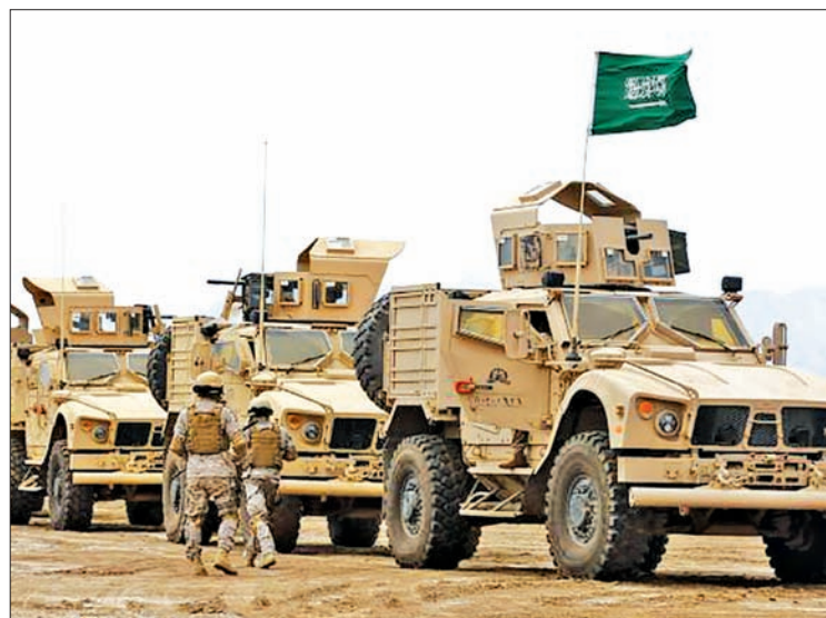
Saudi troops walk past armoured personnel carriers at their base in Yemen’s southern port city of Aden.

SANAA — Tribal fighters backed by a Saudi-coalition won control of a strategic dam in central Yemen from Houthi forces on Tuesday but lost ground in the south near the port of Aden, where President Abd-Rabbu Mansour Hadi’s government is based, residents and officials said.