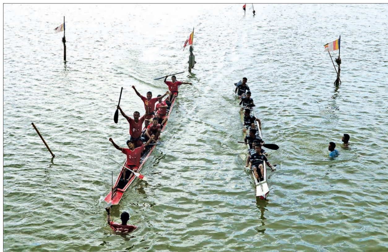
Zartithway's crew winning the race at the traditional boat racing held in Meiktila Lake.

TRADITIONAL BOAT races being held at Meiktila's Phaungtaw Oo Pagoda Festival concluded on 28 September, with Zartith-