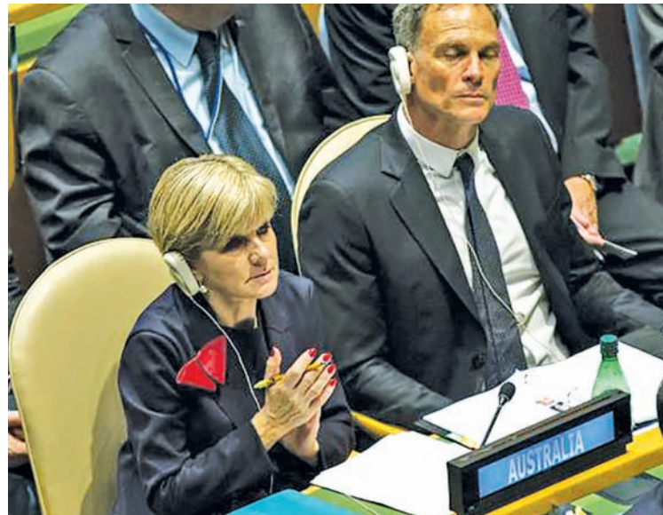
Australian Minister for Foreign Affairs Julie Bishop.

SYDNEY — Australia has launched a new bid to be elected to the United Nations Security Council, with Foreign Minister Julie Bishop saying the nation hoped to maintain its focus on international security.