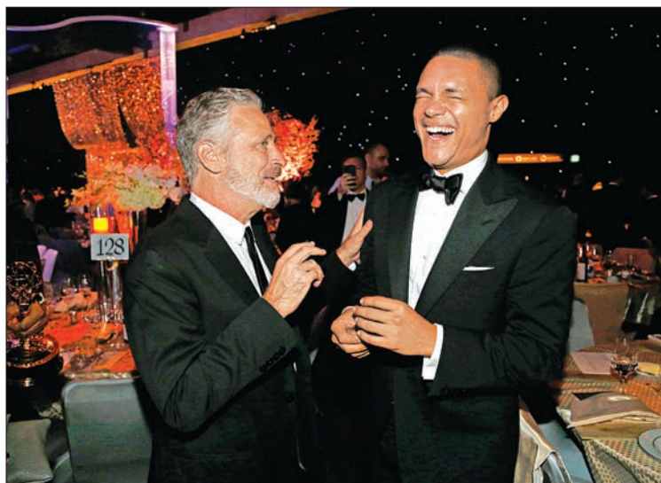
Television personality Jon Stewart (L) talks with actor Trevor Noah at the 67th Annual Primetime Emmy Awards Governors Ball in Los Angeles, California on 20 September, 2015.

NEW YORK — Trevor Noah got a lukewarm welcome as new host of “The Daily Show” in a debut that featured jokes about himself, immigrants and Pope Francis, and was watched by some 3.5 million Americans.