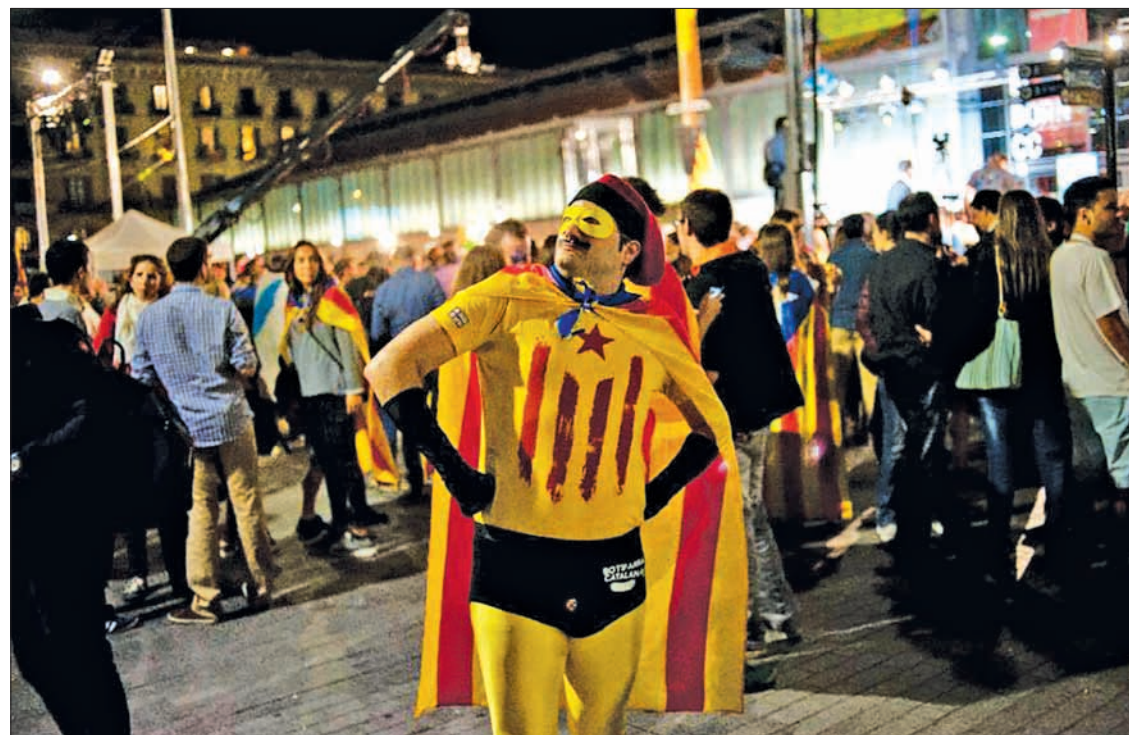
A man dressed as a super hero sporting the Catalan independence standard and a mask celebrates after the partial results of the regional election in Barcelona, on Spain, 27 September, 2015.

BARCELONA — Separatists pushing to make Catalonia independent from Spain were on track to win an absolute majority of parliamentary seats in a regional election on Sunday, an exit poll showed.