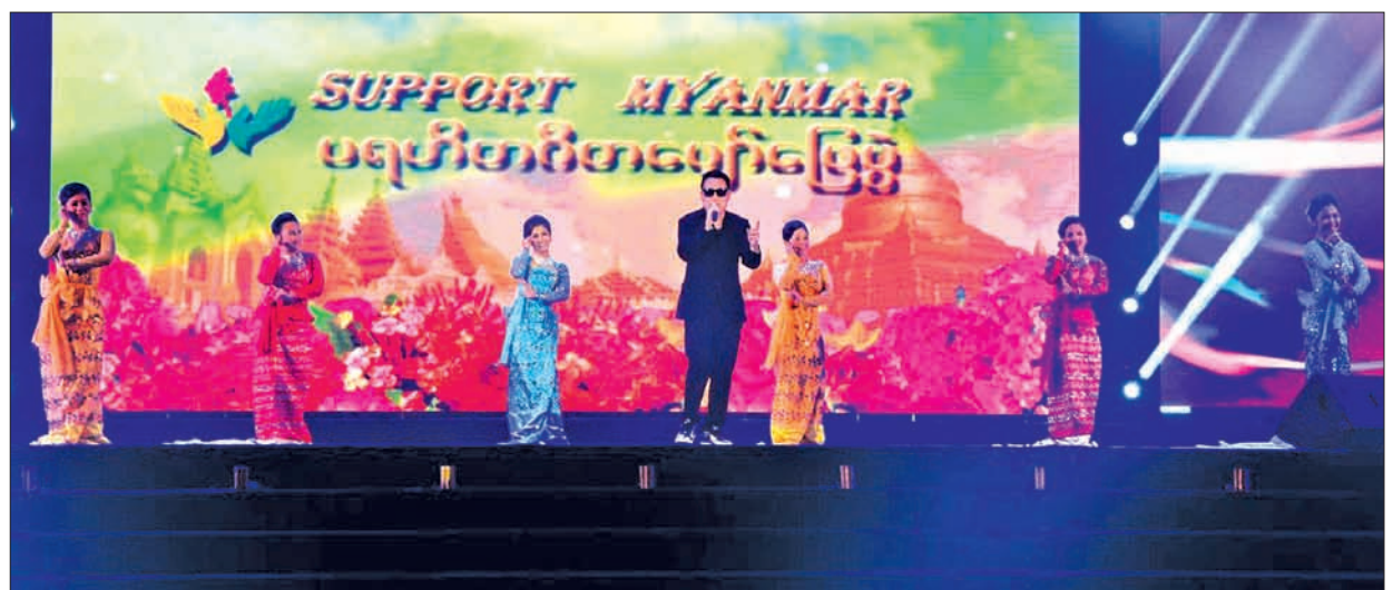
The funds generated by the event would be donated to flood victims.

Artists from both Myanmar and China performed dances and songs, and there was also a presentation on the effects of the floods that hit Myanmar in recent months.—MNA