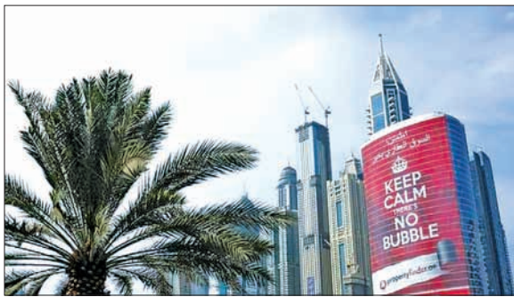
An advertising sign for a real estate company reading "Keep Calm There's no Bubble" is seen on a building in the Marina district of Dubai.

DUBAI — While Dubai continues to pump out sumptuous new apartment blocks, for a rising number of expatriates the city no longer offers the luxury lifestyle that lured many foreigners to the Gulf.