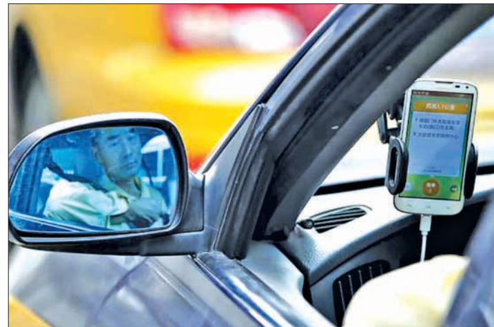
A taxi driver is reflected in a side mirror as he uses the Didi Chuxing car-hailing application in Beijing, China.

Uber and its biggest rival Didi are locked in a subsidy-intensive fight for market share in China, one that is costing them each hundreds of millions of dollars.—Reuters