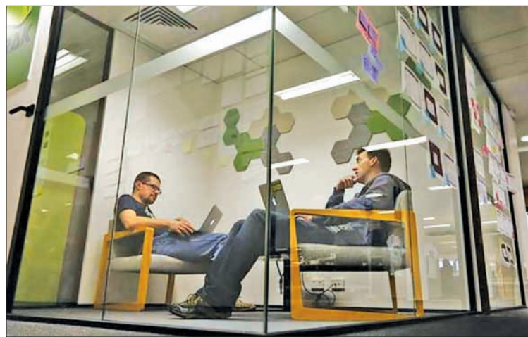
Employees of software firm Atlassian are seen inside a meeting room at the company's office in central Sydney.

SYDNEY — A decision by Australia's biggest tech company, Atlassian, to pursue a $3 billion listing in the United States is a blow to Australia's ambitions to make technology a driver of the economy, a tech executive said on Monday.