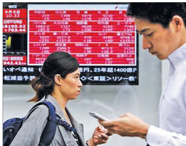
Pedestrians holding mobile phones walk past an electronic board showing the various stock prices outside a brokerage in Tokyo, Japan.

"The recoveries we've seen over the past couple of months, have been pretty short-lived," said strategist Daniel Hynes of ANZ in Sydney.