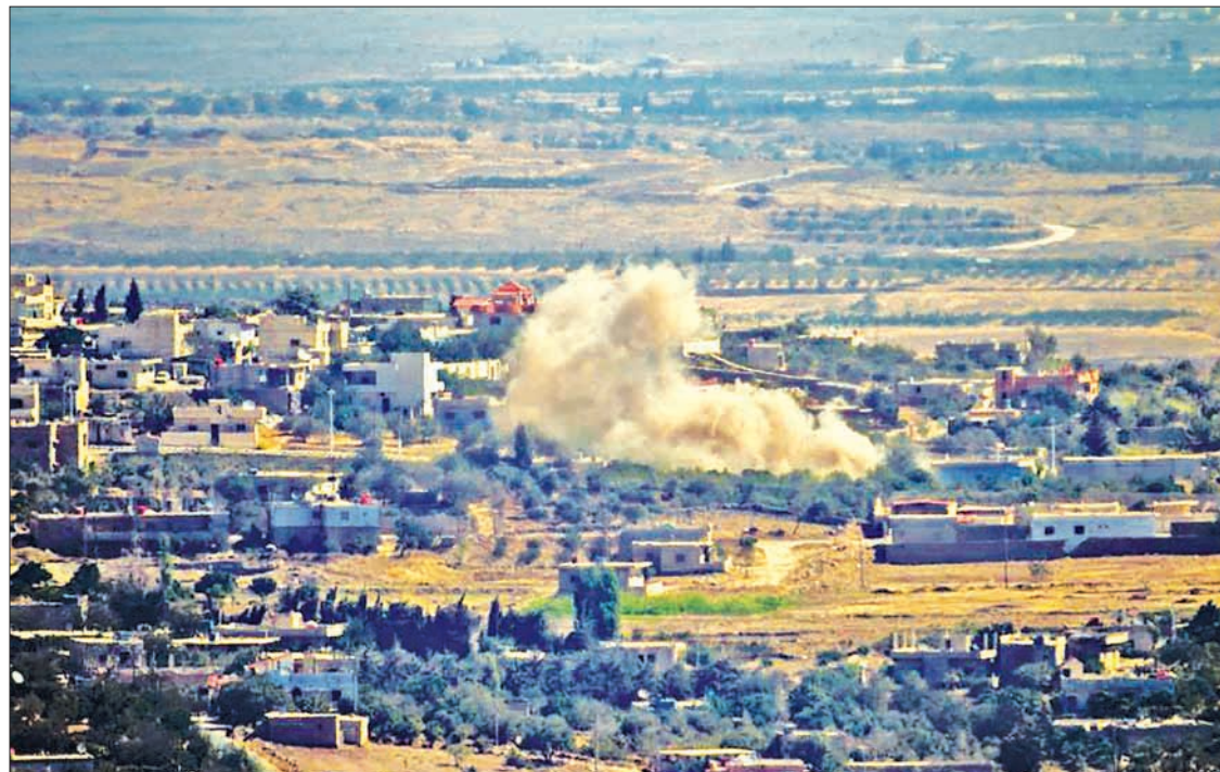
Seen from the hill village of Buqaata in the Israeli-annexed Golan Heights, smoke ascends from alleged shelling by Syrian government forces in the Syrian village of Jubata al-Khashab, on 27 September, 2015.