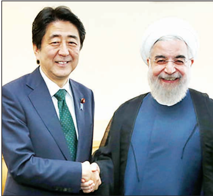
Japanese Prime Minister Shinzo Abe and Iranian President Hassan Rouhani.

NEW YORK — The leaders of Japan and Iran met Sunday on the sidelines of UN meetings in New York, with Tokyo proposing increased investment as an inducement for Tehran implementing a nuclear deal with six major powers.