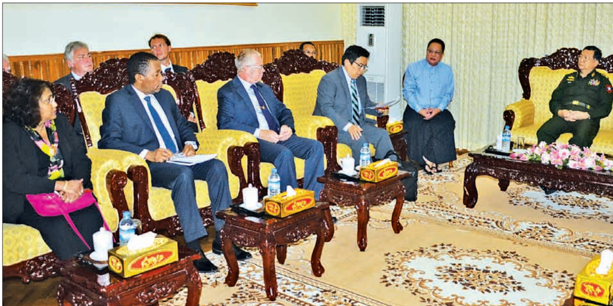
Union Minister of Home Affairs Lt Gen Ko Ko discusses national money laundering and terrorist financing risk assessment with IMF Resident Representative Mr. Yasuhisa Ojima.

sons from Myanmar Police Force and Bureau of Special Investigation were also present at the call.—MNA