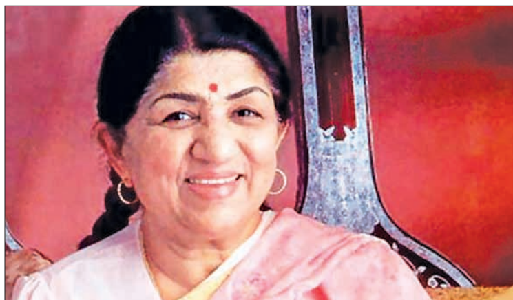
Lata Mangeshkar.

NEW DELHI — The story of Lata Mangeshkar, Bollywood's biggest musical star is now set to come out in the form of a book in January 2016, publishers announced today on the singer's 85 th birthday.