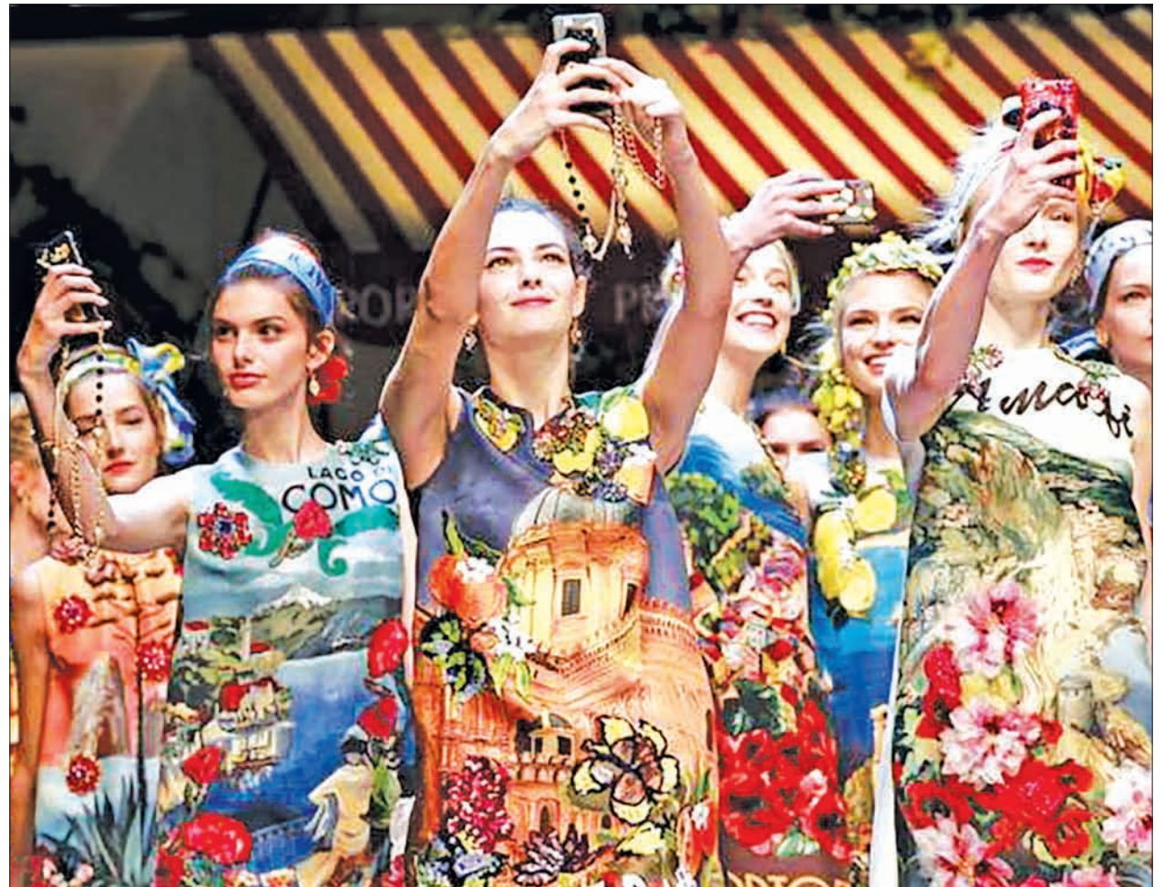
Models take selfies with mobile phones during the parade at the end of the Dolce & Gabbana Spring/Summer 2016 collection during Milan Fashion Week in Italy, September 27, 2015.

MILAN — Against a backdrop showing a typical Italian village, Dolce & Gabbana took fashionistas on holiday on Sunday with a spring collection that paid tribute the designer duo's home country.