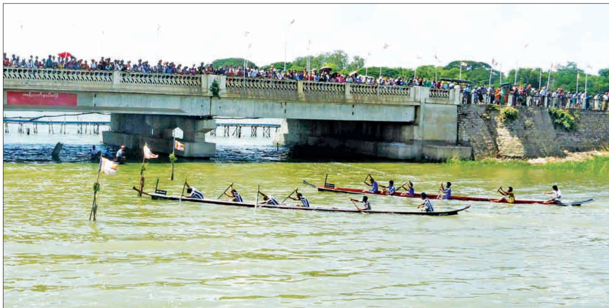
Boat racing attracts local people as well as tourists in Meiktila.

There was also a donation ceremony for 138 monks at the pagoda on 28 September.— Chan Tha (Meikhtila)