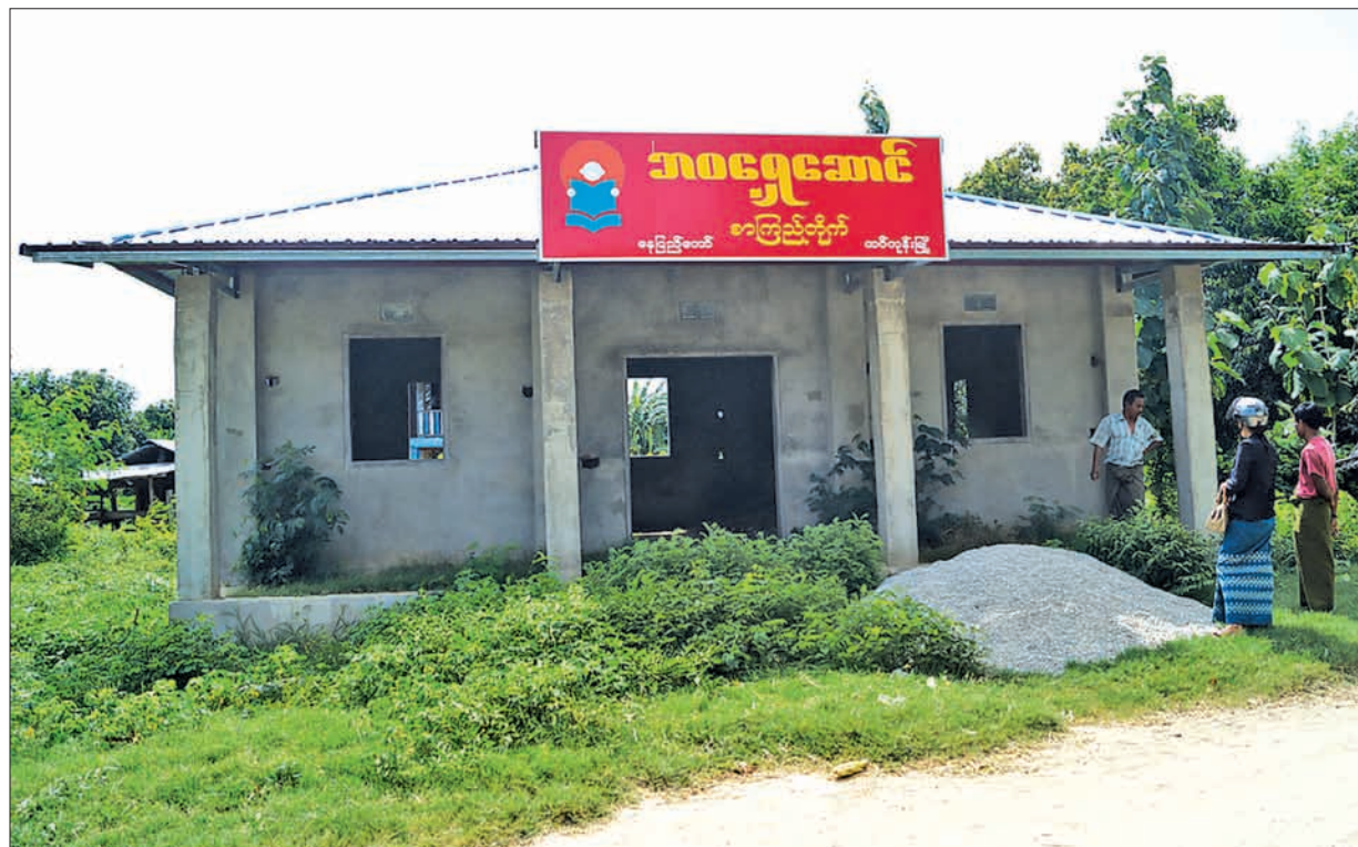
A library in Tatkon needs donation as it has not been completed yet.

A COURSE for librarians on book logging, storage and lending began in Tatkon Township on Sunday at Bawa Shaysaung Library in Bayintnaung Ward.