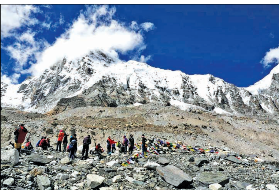
Trekkers rest at Everest Base Camp, Nepal, 27 September, 2015.