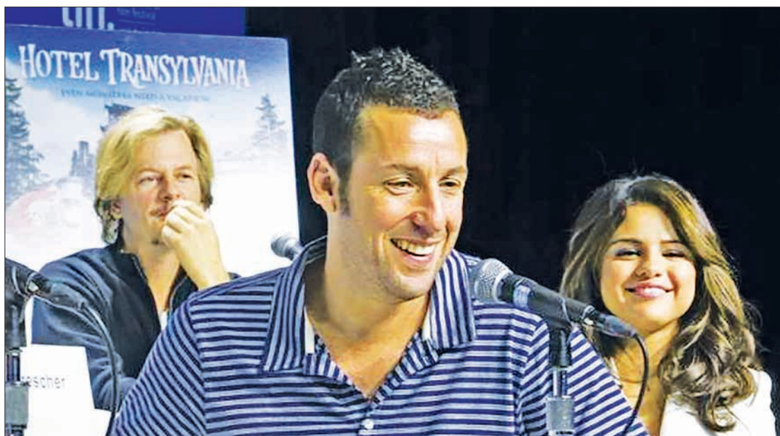
Actors Adam Sandler (C) David Spade (back) and Selena Gomez attend a news conference to promote the film 'Hotel Transylvania' during the 37 th Toronto International Film Festival.

LOS ANGELES — "Hotel Transylvania 2" easily topped the weekend box office, sinking its teeth into an impressive $47.5 million, and providing a big win for star Adam Sandler and Sony Pictures, the studio behind the animated franchise.