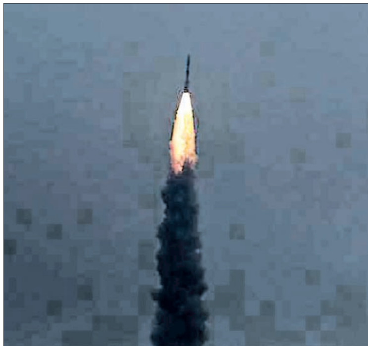
India's Polar Satellite Launch Vehicle (PSLV-C30) carrying ASTROSAT, India's first observatory satellite, lifts off from the Satish Dhawan Space Centre in Sriharikota, India on 28 September, 2015.

Despite the recent successes, the growth of India's space programme has been stymied by lack of heavier launchers and slow execution of missions - during 2007-2012, only about half of the planned 60 missions were accomplished. In Decem-