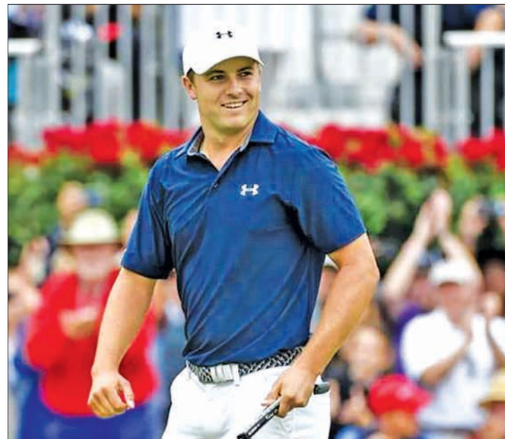
Jordan Spieth reacts after winning the final round of the Tour Championship by Coca-Cola at East Lake Golf Club at Atlanta, USA on 27 September, 2015.