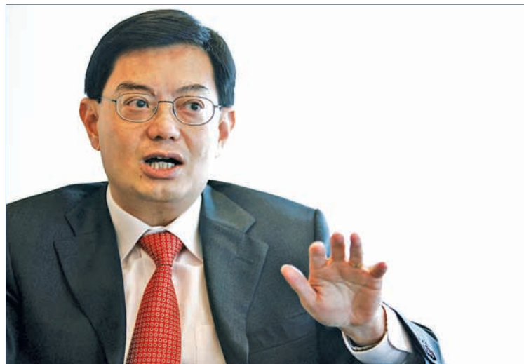
Heng Swee Keat.

SINGAPORE — Singapore's new finance minister will be Heng Swee Keat, replacing Tharman Shanmugaratnam who will remain deputy prime minister in a new cabinet, the prime minister announced on Monday, just over two weeks after winning a general election. Heng is currently education minister and was a former managing director of Singapore's central bank.