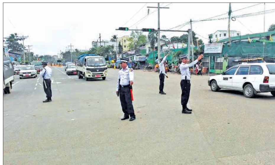
The use of tasers by law enforcement officers has sparked controversy around the world.

Tasers for male police officers measure nearly 1.5 feet long, while for female officers, they measure between eight and ten inches.— Ohmar Thant