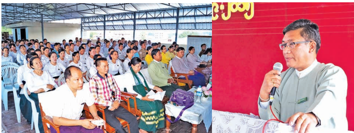
Myawady Township launched healthy schools campaign on 27 September focusing on disease prevention, nutrition, hazardous foods.

prevention, nutrition, hazardous foods, oral health and strategies to schools free of tobacco and mosquitoes.—Htein Lin Aung (IPRD)