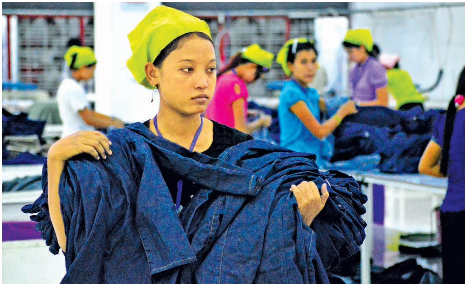
A worker at a garment factory in Hlaingthaya Industrial Zone, Yangon.

During the conference, Assistant General Secretary of CTUM