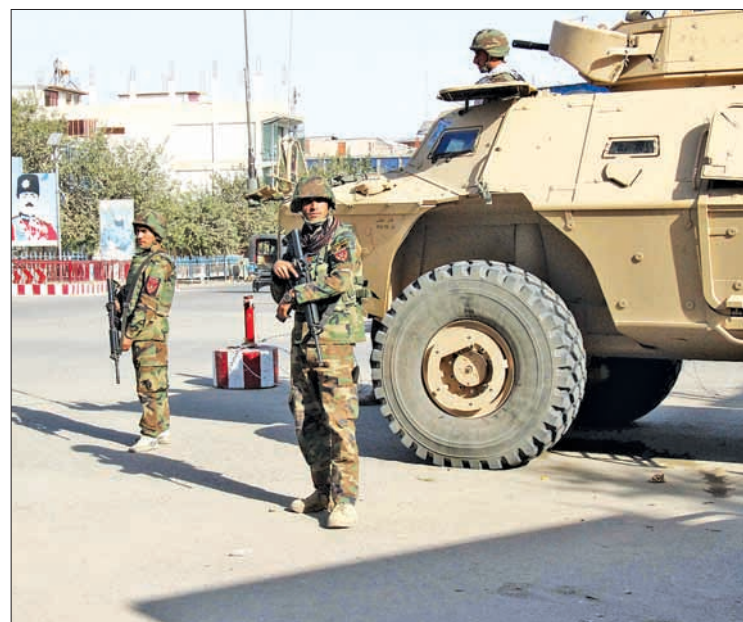
Afghan soldiers keep watch during a battle with the Taliban in Kunduz Province, Afghanistan, on 28 September 2015.

A scaled-down NATO mission now mostly trains and advises Afghan forces, although U.S. drones still target militant leaders and a U.S. counter-terrorist force also operates in the country.—Reuters