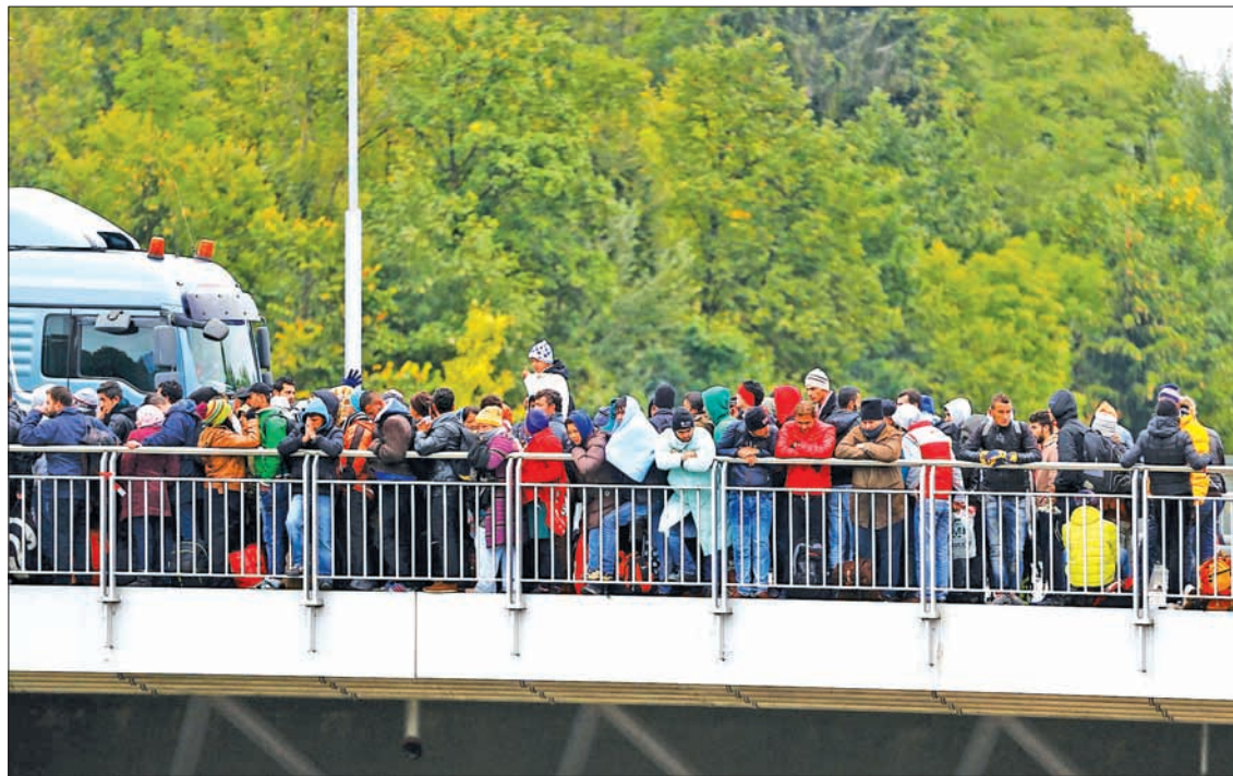
Migrants line up to cross the border to Germany from Salzburg, Austria, on 28 September, 2015.

BERLIN — Germany’s president has warned that there are limits to how many refugees his country can absorb as it prepares for as many as 800,000 arrivals this year.