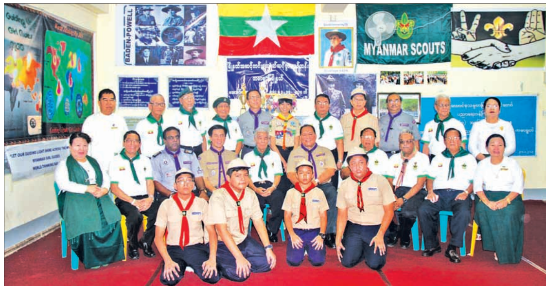
Officials of Asia-Pacific Chapter of World Organization of Scout Movement seen with members of Myanmar Scout Federation.

THE Myanmar Scout Federation and the Asia-Pacific chapter of the World Organisation of the Scout Movement held a joint coordination meeting on Saturday in Yangon.