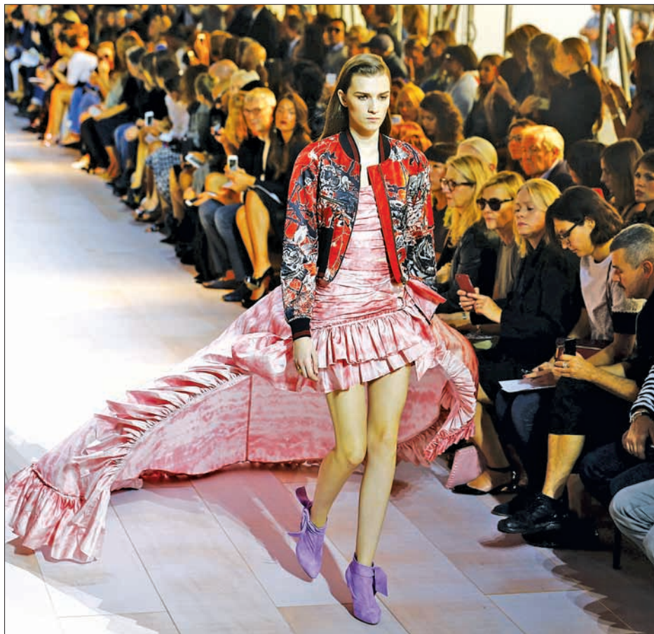
A model presents a creation from the Roberto Cavalli Spring/Summer 2016 collection during Milan Fashion Week in Italy, 26 September, 2015.

Roberto Cavalli himself was not at the show.—Reuters