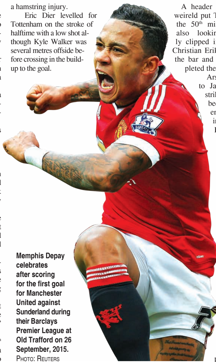
Memphis Depay celebrates after scoring for the first goal for Manchester United against Sunderland during their Barclays Premier League at Old Trafford on 26 September, 2015.

Eric Dier levelled for Tottenham on the stroke of halftime with a low shot although Kyle Walker was several metres offside before crossing in the build-up to the goal.