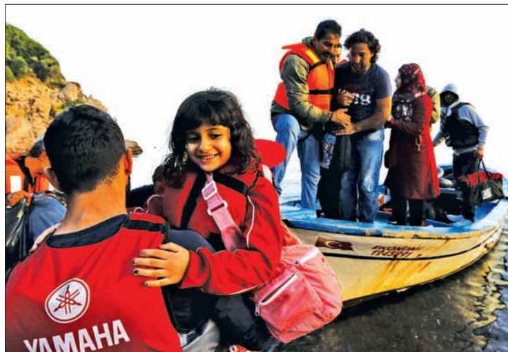
Syrian refugees disembark from a fishing boat at a beach on the Greek island of Lesbos after crossing a part of the Aegean Sea from the Turkish coast to Lesbos on 27 September, 2015.

Jurrien ten Brinke in the Dutch city of Apeldoorn aims to fill gaps in public housing and is linking up with non-governmental organisations to train volunteers to help refugees. More than 24,000 people have signed up to help and 6,000 of them are offering to house refugees if and when the authorities acknowledge they are stretched.—Reuters