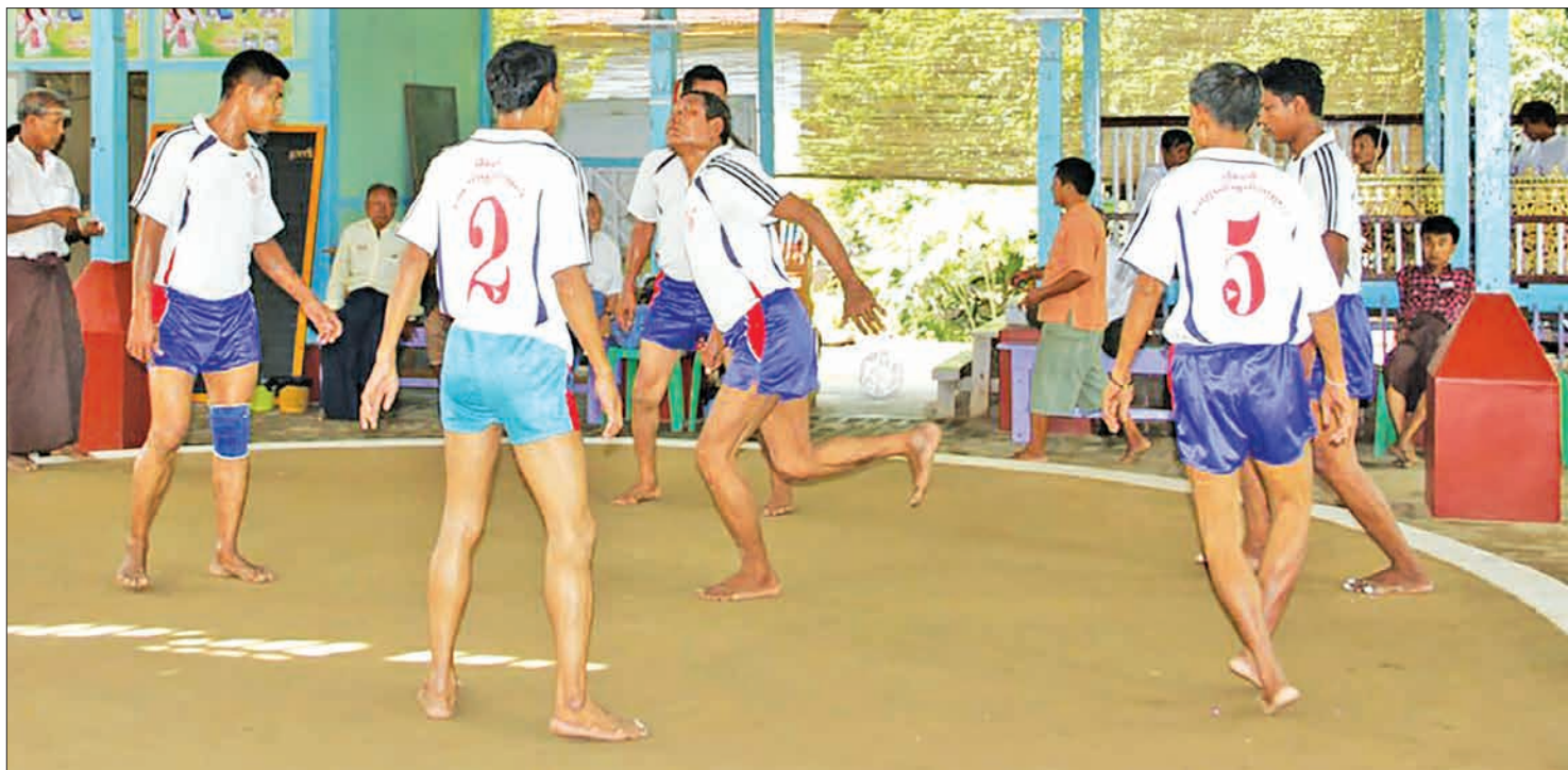
Chinlone players show their skill at Eindawya pagod festival.

Chinlone is a popular sport among Mandalay residents as well as a major tourist attraction in the city. It sometimes called 'cane ball.' A total of 895 teams from around the country will take part in the demonstrations, with 30 teams performing every day during the festival for 30 minutes each.— Tin Maung