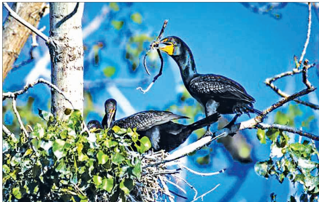
Double-crested cormorants nest at Tommy Thompson Park in Toronto.