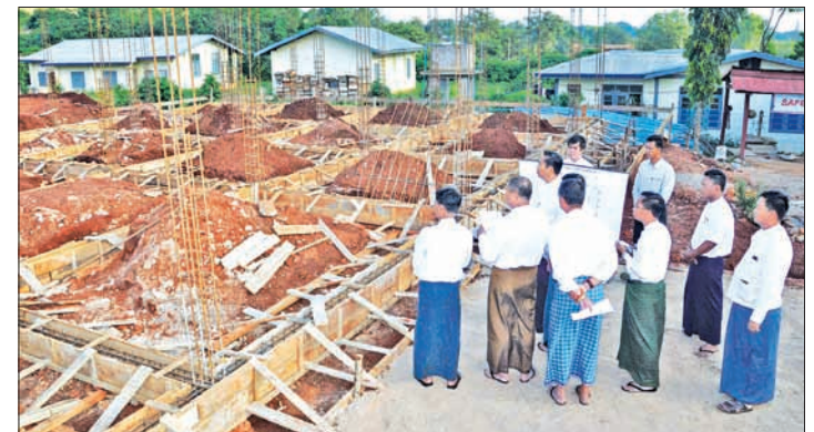
Union Minister U Ohn Myint and party inspect construction of training facility for rural development.

The team also inspected the Emerald Green Rural Development Project's managerial course at the Lashio District Rural Development Department. The minister urged trainees to master the project's implementation manual and pass their knowledge on to fellow community members and to devise effective bookkeeping systems.—MNA