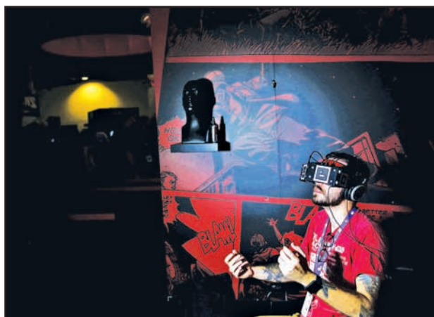
A man wears a headset while playing ‘The Walking Dead’ video game at TwitchCon 2015 in San Francisco, California on 25 September, 2015.