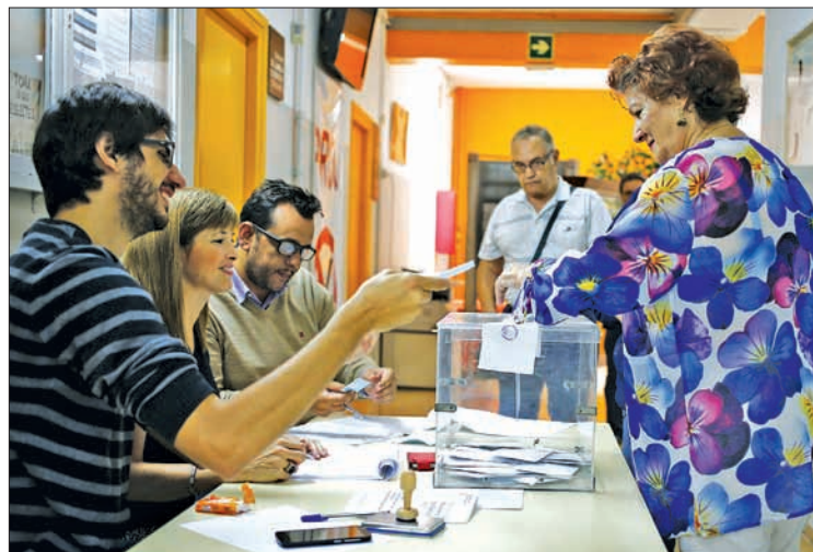
A woman casts her ballot during a regional parliamentary election in Barcelona, Spain on 27 September, 2015.

Spain's central government brands secession illegal and has called for the country to stay united as the eurozone's fourth-big-