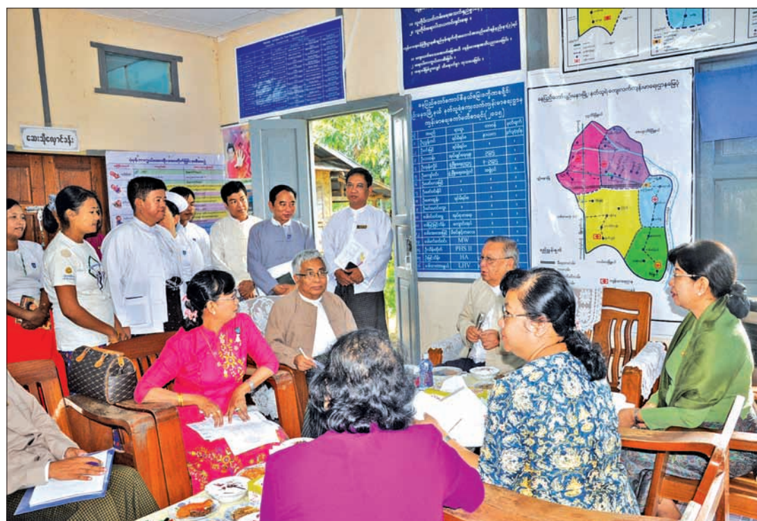
Deputy Minister for Health Dr Thein Thein Htay discuss health matters with officials at the rural health office in Nathuye village, Nay Pyi Taw Council Area.

Following their training courses, senior health officer trainees from various regions and states will conduct their own training courses for their respective township health personnel.—MNA