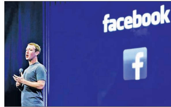
Facebook CEO Mark Zuckerberg speaks during his keynote address at Facebook F8 in San Francisco, California.

UNITED NATIONS — Facebook founder Mark Zuckerberg and a host of celebrities kicked off a campaign on Saturday to make Internet access universal, saying this was critical to fulfilling the United Nations’ newly adopted agenda to combat global ills.