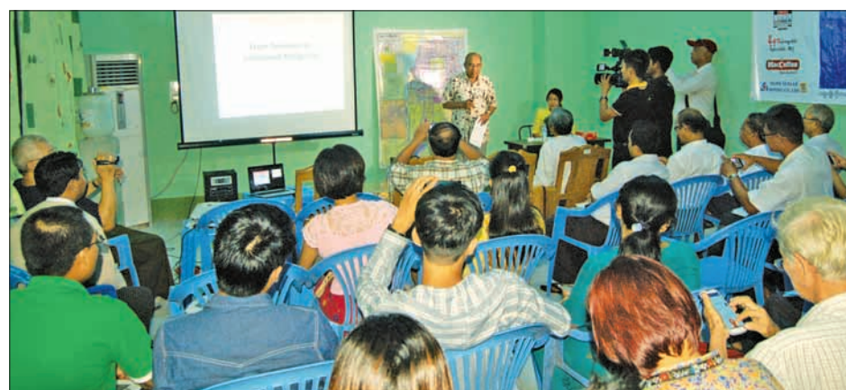
Geologists in Mandalay and Indonesian earthquake expert discuss Seismology.