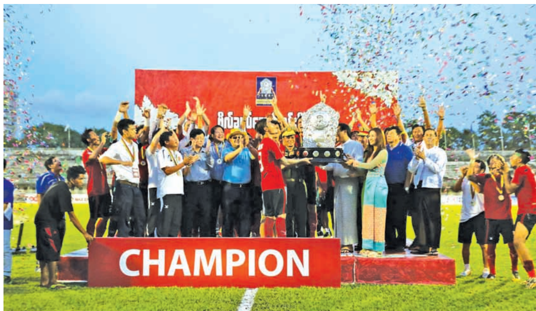
Ayeyawady FC emerge champion in the final match of the General Aung San Shield 2015 on Sunday. They beat their rivals Yadanbon 2-1 in the tough match. The champions win K 30 million cash award while the Yadanabon, K 15 million.