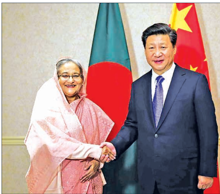
Chinese President Xi Jinping (R) meets with Bangladeshi Prime Minister Sheikh Hasina in New York, the United States, 26 September, 2015.

Noting that the Chinese people are endeavoring to realise the Chinese Dream of national rejuvenation and have launched the Silk Road Economic Belt and 21 st -Century Maritime Silk Road Initiative, Xi said China hopes to share the development opportunities with its neighbours and friends, including Bangladesh.