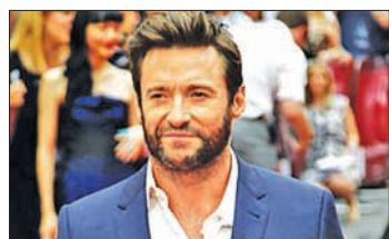
Hugh Jackman.

I've still got one more (film) to do. I'm sure they're already talking about it, and there's some