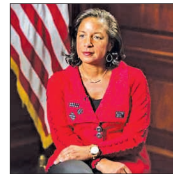
National Security Advisor Susan Rice.

By 2017, Rice said, PEPFAR also aims to “provide 13 million male circumcisions for HIV prevention, and reduce HIV incidence by 40 percent among adolescent girls and young women within the highest burdened areas of 10 sub-Saharan African countries.” The countries at the focus of the programme are: Kenya, Lesotho, Malawi, Mozambique, South Africa, Swaziland, Tanzania, Uganda, Zambia and Zimbabwe. —Reuters