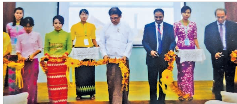
Links have been forged between Myanmar Institute of Information Technology (MIIT) and the Indian graduate school of International Institute of Information Technology, Bangalore.