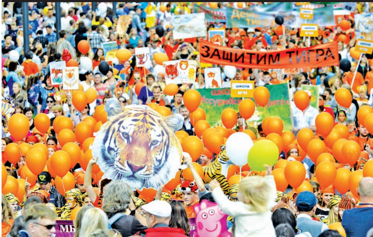
People take part in a procession during a festival to mark the Tiger Day in the far eastern city of Vladivostok, Russia, September 27, 2015. The festival is dedicated to the protection of the Amur tiger, an endangered species.