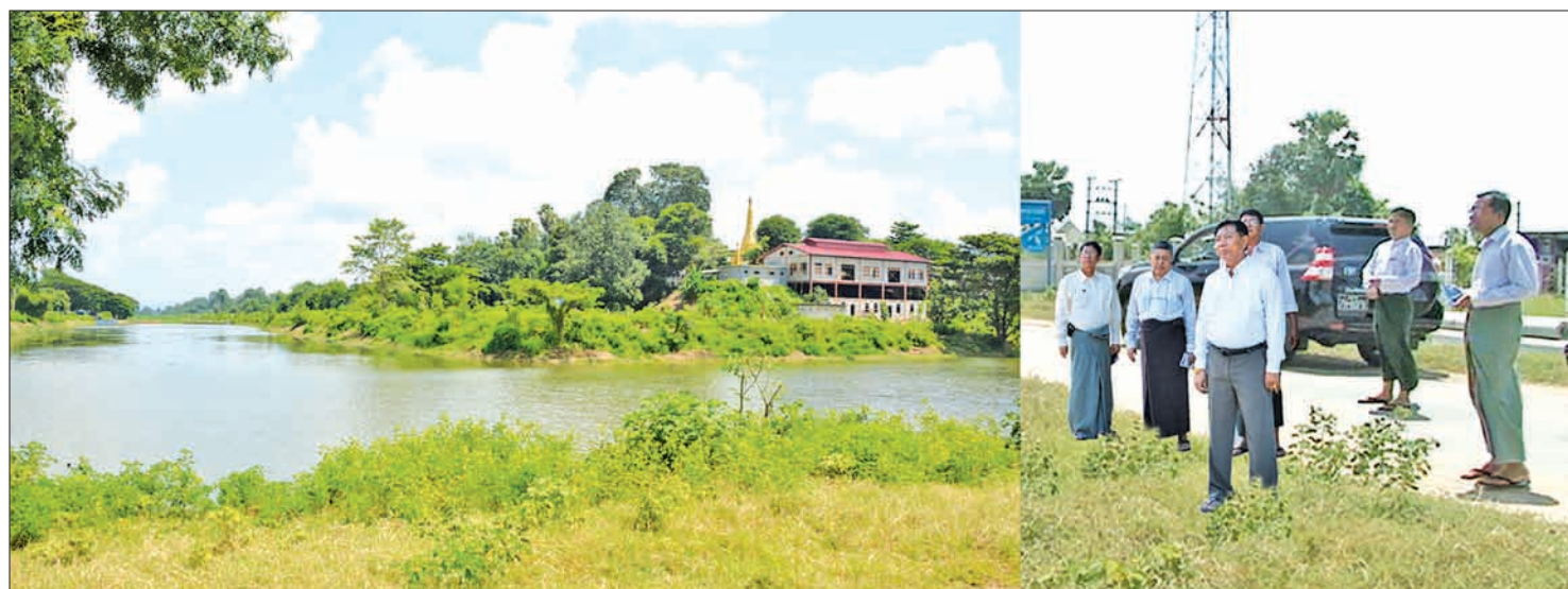
Minister for Culture U Aye Myint Kyu inspects old moat in Toungoo.

ON Friday, Union Minister of Culture U Aye Myint Kyu visited the site of the ancient capital city of Toungoo in Bago Region.