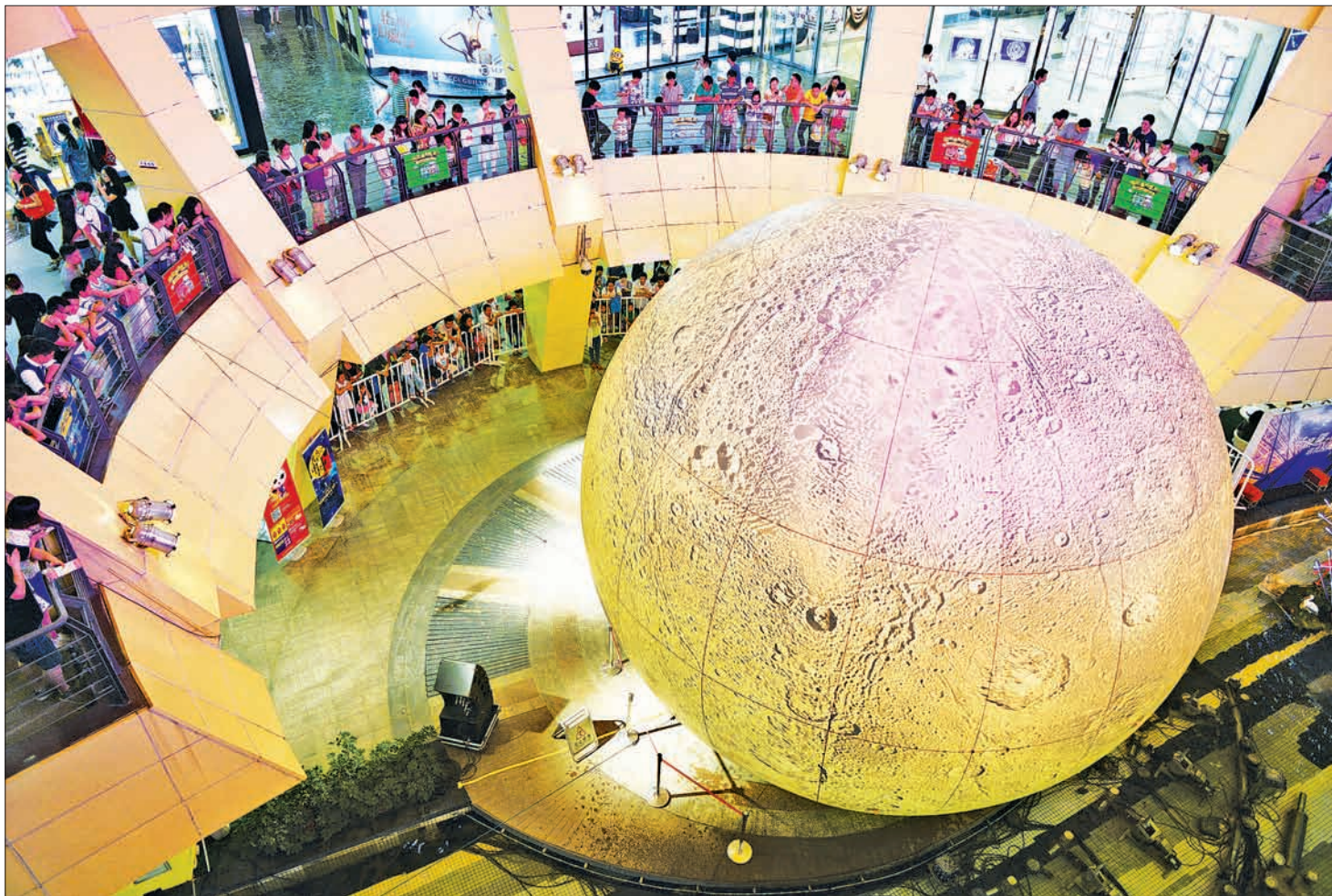
Customers look at a 10-metre-tall installation in the shape of the moon, to celebrate the Mid-Autumn Festival, at a department store in Nanjing, Jiangsu province, China, 26 September, 2015. The Mid-Autumn Festival is celebrated on the 15 th day of the eighth month in the lunar calendar during a full moon, which falls on 27 September this year.