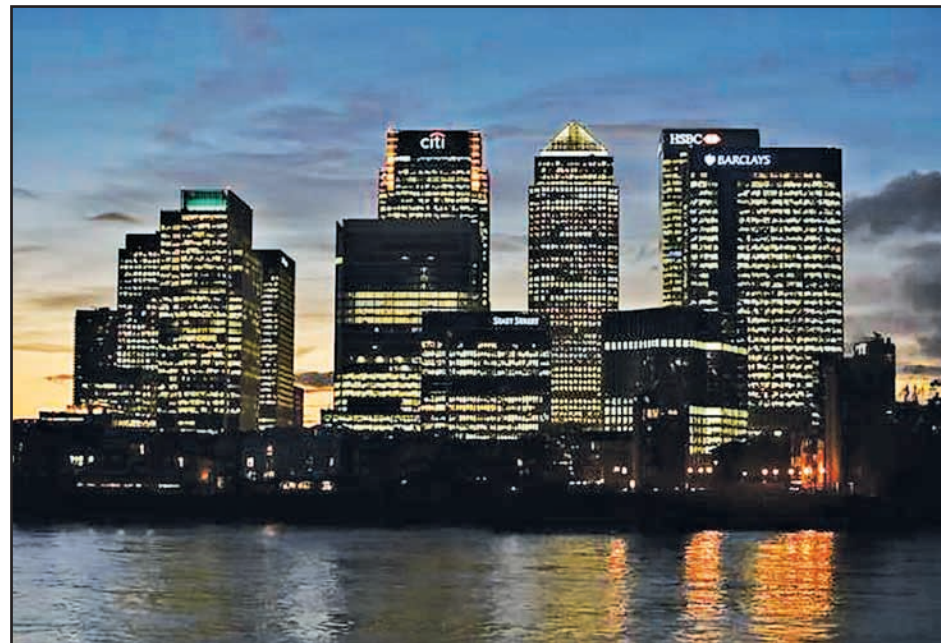
The Canary Wharf financial district is seen at dusk in east London.

Signing on to the connectivity campaign were U2 star Bono, co-founder of One, a group that fights extreme poverty; actress Charlize Theron, founder of Africa Outreach Project; philanthropists Bill and Melinda Gates; British entrepreneur Richard Branson; Huffington Post editor Arianna Huffington; Colombian singer Shakira, actor and activist George Takei and Wikipedia co-founder Jimmy Wales.—Reuters