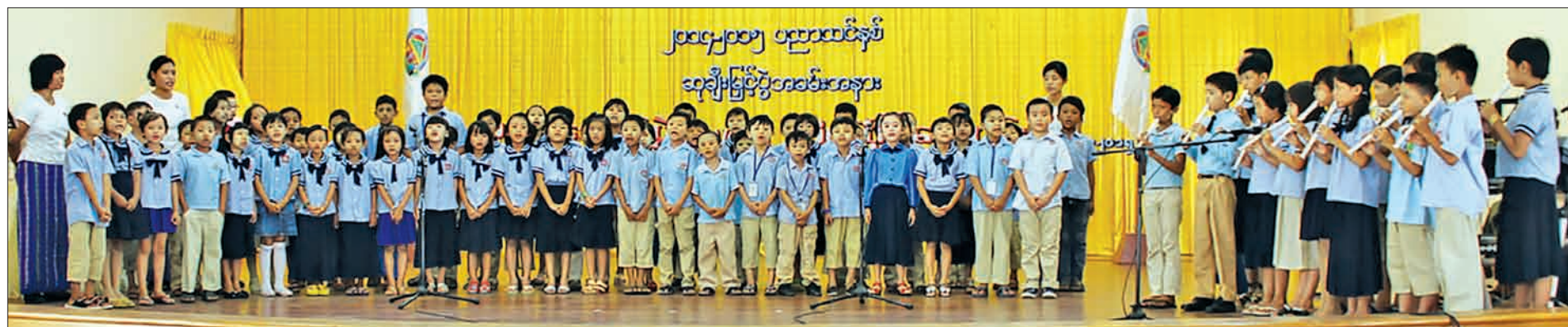
Win of Wisdom's children show their skill at the awarding ceremony.