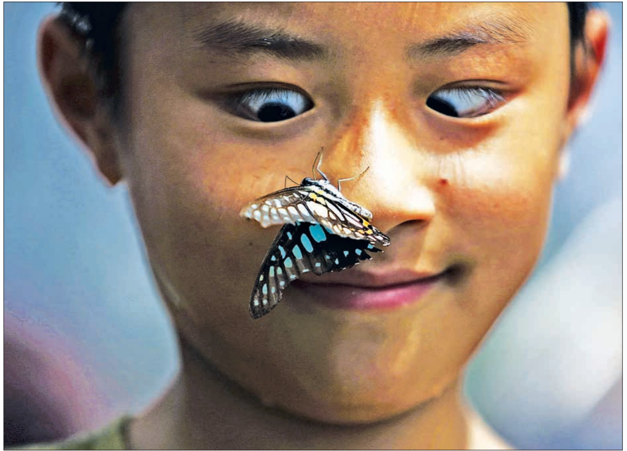
A boy reacts as a butterfly stops on his nose during a butterfly exhibition at a park in Kunming, Yunnan province, China on 26 September, 2015.