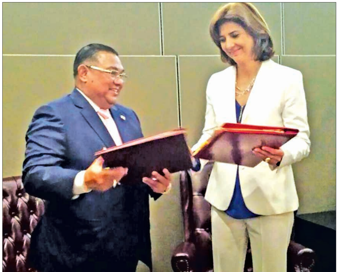
Two Foreign Ministers exchanging MoU on the Technical Cooperation between Myanmar and Colombia.