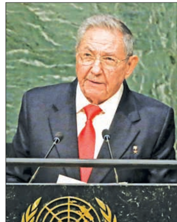
Cuba's President Raul Castro.

Cuba estimates the embargo has caused $121 billion in damage to its economy. It has launched a campaign for the General Assem-