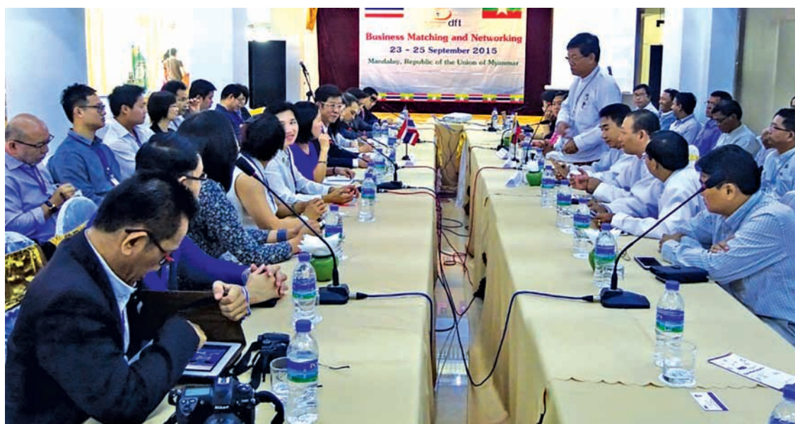
Myanmar and Thai businessmen eye cooperation.

Maung Maung explained the region's investment opportunities, with the two sides discussing a number of potential areas for trade, including the food industry, interior design and home decoration, spare motorcycle parts, high-end construction and manufacturing construction tools. The event also included a business matching session.— Thiha Ko Ko