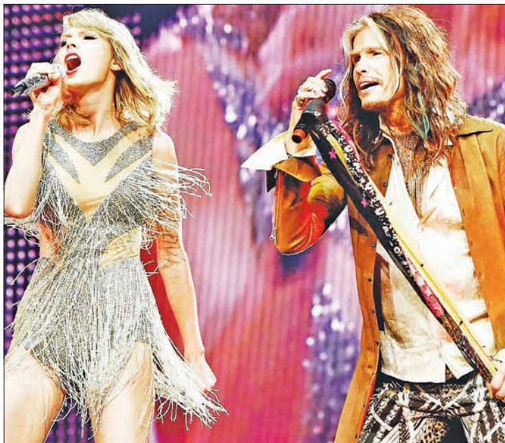
Pop star Taylor Swift & Aerosmith's Steven Tyler.

Earlier this month, the US band's singer joined a Russian busker for an impromptu performance in front of a few passers-by.—PTI