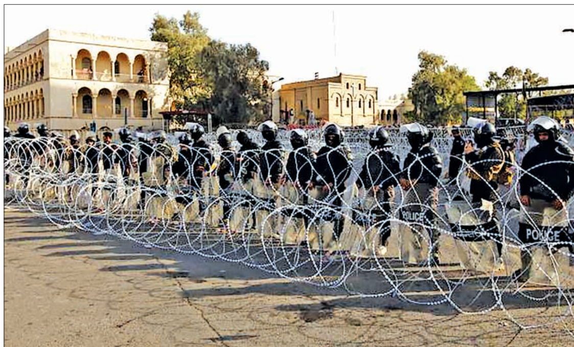
Riot policemen stand in front of protesters during demonstration against the poor quality of basic services, power outages and calling for trial of corrupt politicians in Baghdad, Iraq, 4 September, 2015.

By raising the stakes in Syria's four-year-old civil war, Russia has prompted its Cold War foe to expand