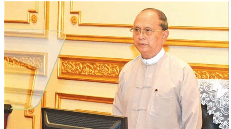
President U Thein Sein addresses Leading Committee for National Reform's meeting.

The number of mobile phone users has soared to 52 per cent in 2015, up from less than five per cent in 2011, with the president adding that the number of tourists