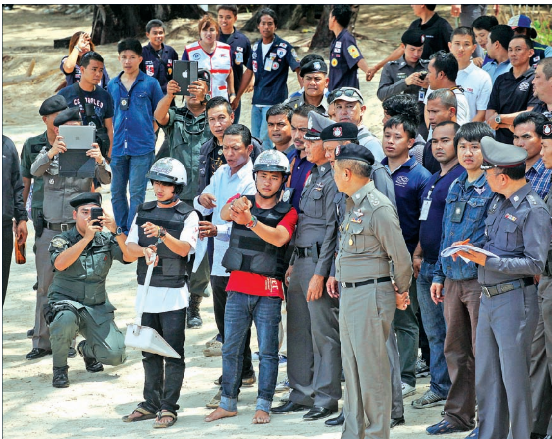
Two workers from Myanmar (wearing helmets and handcuffs), suspected of killing two British tourists on the island of Koh Tao last month, stand near Thai police officers during a re-enactment of the alleged crime, where the bodies of the tourists were found on the island October 3, 2014.

The estimated 2.5 million Myanmar workers in Thailand provide vital remittances. Many complain they suffer maltreatment, including extortion, from Thai police.—Reuters