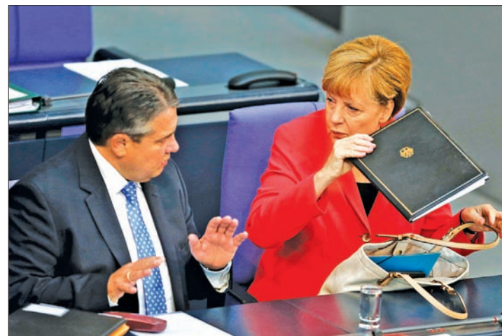
German Minister of Economic Affairs Sigmar Gabriel (L) and German Chancellor Angela Merkel.

BERLIN — The European Union needs the support of the United States, Russia and the countries in the Middle East to help fight the causes of the influx of refugees seeking to enter the bloc, German Chancellor Angela Merkel said on Thursday.