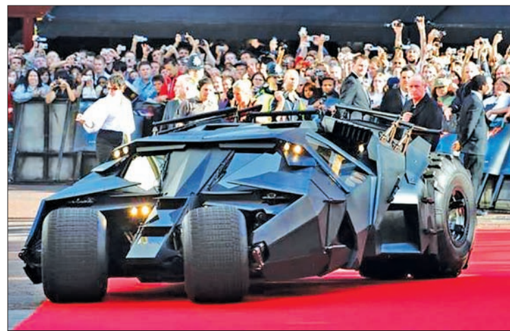
The Batmobile.

Towle runs a business called Gotham Garage, where he sells