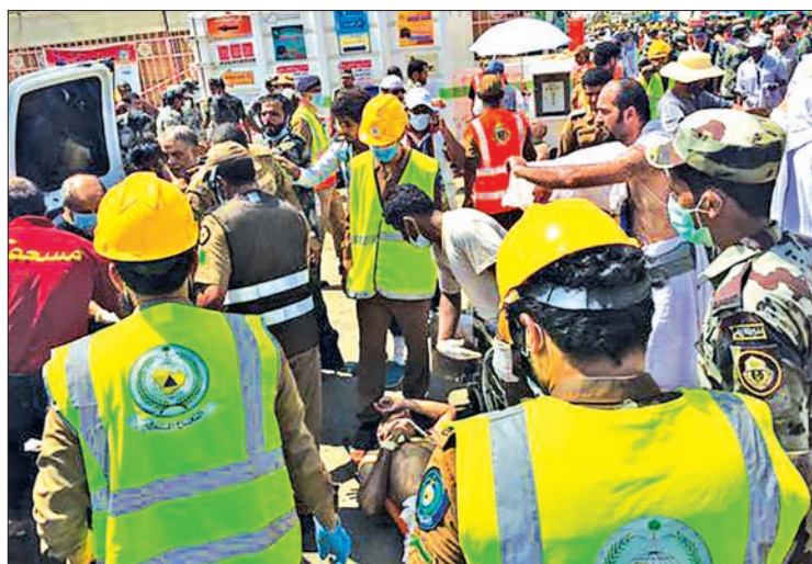
Members of Saudi civil defence try to rescue pilgrims following a crush caused by large numbers of people pushing at Mina, outside the Muslim holy city of Mecca in this handout picture published on the Twitter account of the Directorate of the Saudi Civil Defence, 24 September, 2015.

Safety during haj is a politically sensitive issue for the kingdom’s ruling Al Saud dynasty, which presents itself internation-