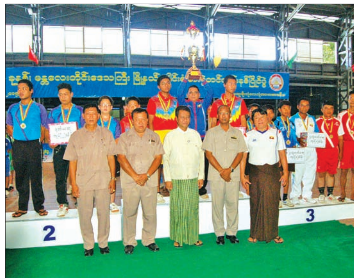
Pyi Oo Lwin tennis team with the trophy.

MANDALAY — Pyin Oo Lwin Township clinched the Mandalay Region inter-township tennis tournament on Wednesday, which began on 19 September. The tournament attracted 125 players from 25 townships in various categories. A trophy and cash prize of K300,000 was given to the winning team.