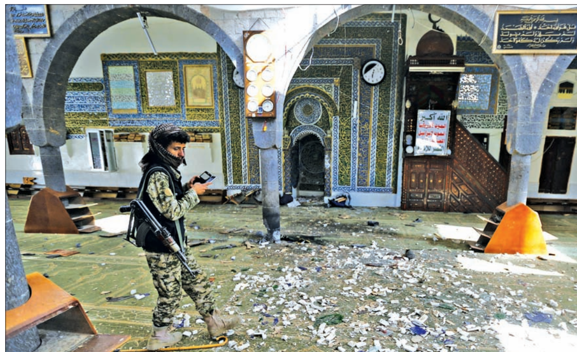
A Houthi militant walks inside the al-Balili mosque after two bombings hit the mosque in Yemen’s capital Sanaa, 24 September, 2015.

In March, Islamic State suicide bombers killed at least 137 worshippers and wounded hundreds more in coordinated attacks at two mosques during Friday prayers in Sanaa.—Reuters