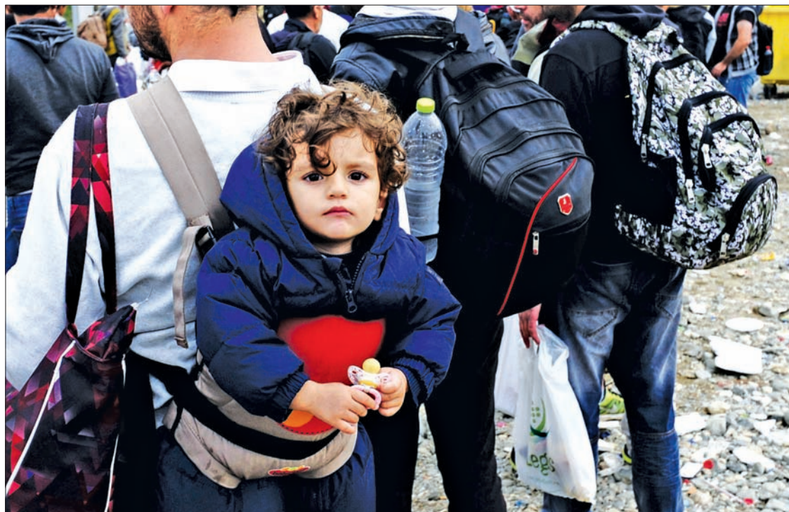
Migrants wait for transport at a transit camp in Gevgelija, Macedonia, after entering the country by crossing the border with Greece, 24 September, 2015.

Zagreb had banned all trucks but those carrying perishable goods from entering the country