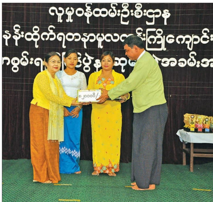
Children of the Nantaik Yadana nursery will get beds.