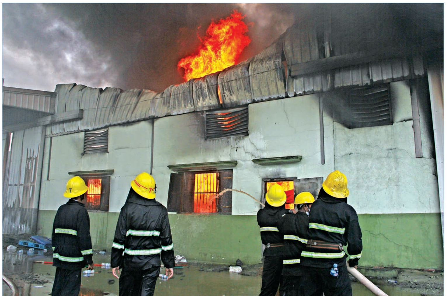
Fire-fighters battle the flames engulfing a warehouse storing plastic pellets used to make Coca-Cola bottles in Myanmar.

"The fire fighters also used cranes and towers, finally getting