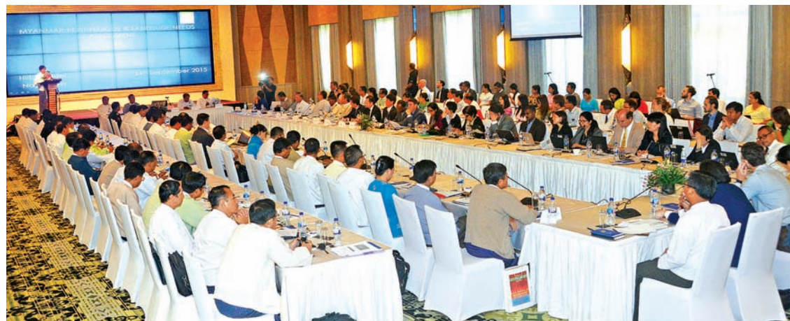
National Disaster Management Committee and officials discuss post floods and landslide needs assessment framework.

NAY PYI TAW — A needs assessment workshop on post floods and landslide needs assessment framework in Myanmar took place in Yangon on Thursday.