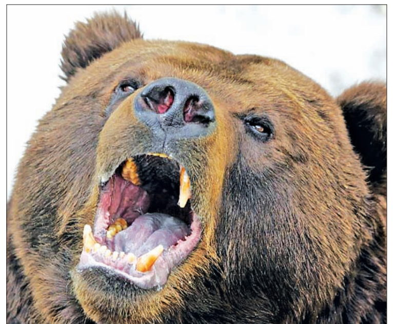
There are an estimated 13,000 wild bears in the Irkutsk region of Siberia.

Authorities have sought to reassure local residents and remind them of safety guidelines in case