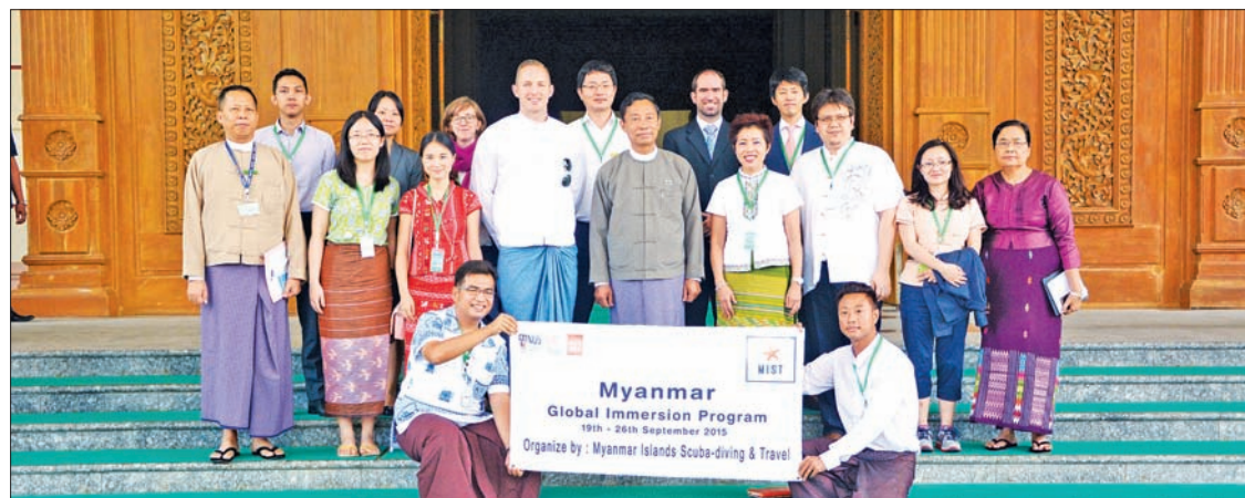
MBA students from National University of Singapore have photo taken together with Thura U Shwe Man, the Speaker of Pyithu Hluttaw.