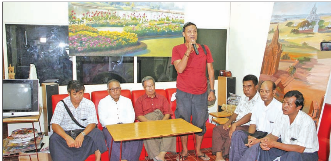
Artists explain holding of 14 th anniversary of Mandalay Hill Art Gallery.

MANDALAY — Mandalay Hill Art Gallery will commemorate its 14 th anniversary with an exhibition featuring 45 works by 19 artists.