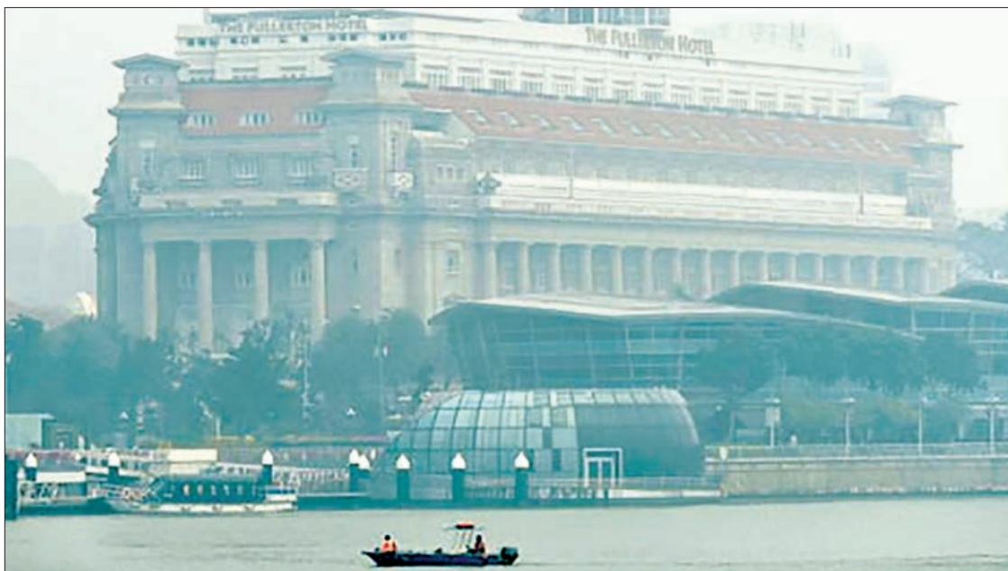
The Fullerton Hotel is blanketed with thick smog in Singapore on 24 September, 2015.

Housewife Asnah Mohamad, 62, said she and her friend used their headscarves to cover their face as they travelled to a mosque to celebrate the Muslim holiday of Eid al-Adha. "My husband cannot