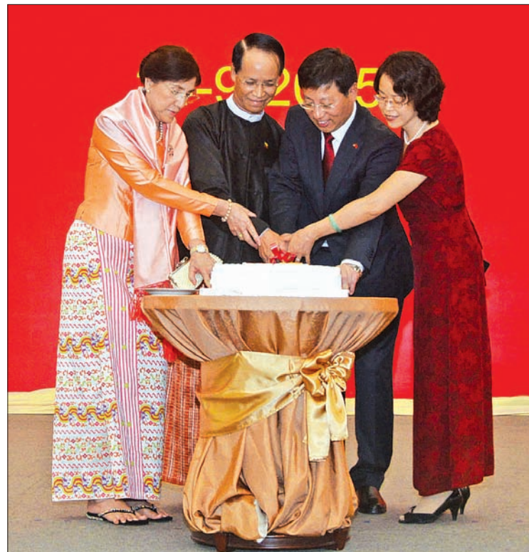
Vice President Dr Sai Mauk Kham and wife Daw Nan Shwe Hmon celebrate 66 th anniversary of the founding of the People's Republic of China together with Ambassador Mr Hong Liang and wife.

After the speeches, the vice president's wife Daw Nan Shwe Hmon and Ambassador Hong Liang's wife cut a cake in honour of the anniversary.—MNA