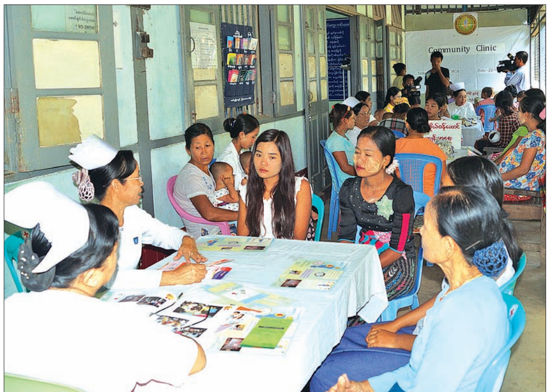
Health staff attend to the needs of their clients in Tatkon.

TATKON — The Tatkon Township Maternal and Child Health Centre in Nay Pyi Taw Council Area opened a health clinic on Tuesday. A medical team led by Township Health