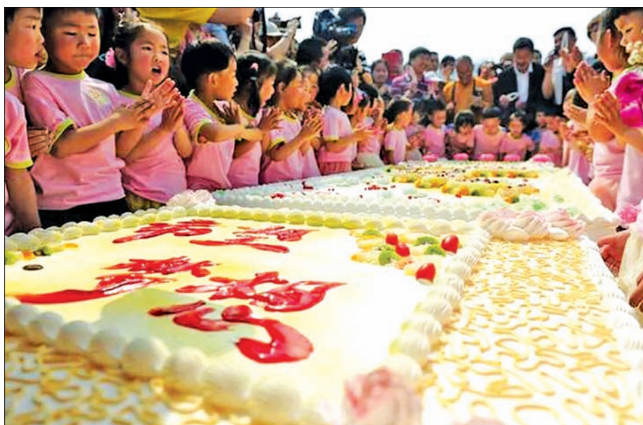
Children clap around cakes on a table as they celebrate their "birthday" at a temple in Shifang, Sichuan province.

People who sing Happy Birthday in their homes or at private gatherings have typically never been at risk of a lawsuit. But when the song has been used for commercial purposes, such as in films, Warner has enforced its rights, and takes in an estimated $2 million in royalties for such uses each year.—Reuters