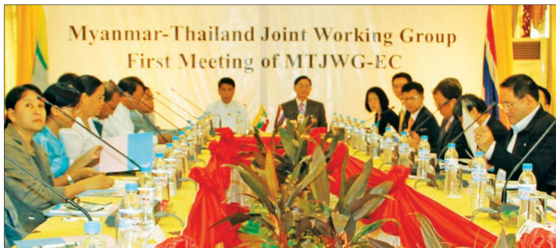
Myanmar and Thailand agree to set up a technical vocational school. PHOTO: ENERGY