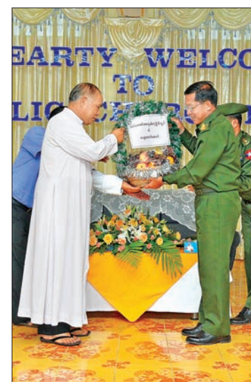
Senior General Min Aung Hlaing presents a gift to a Christian priest in Loikaw.