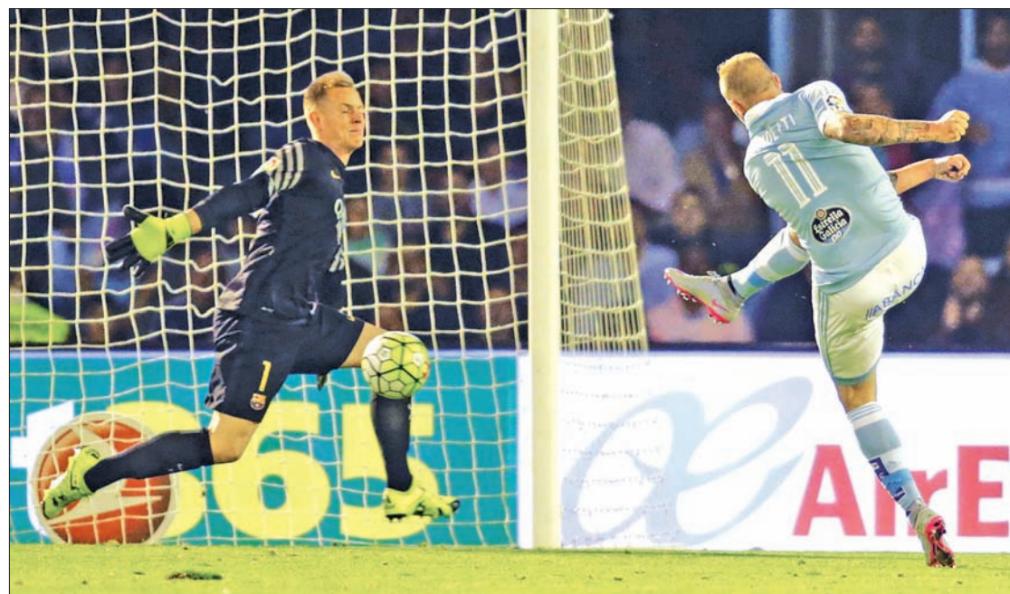
Celta Vigo's John Guidetti scores a goal against Barcelona's goalkeeper Ter Stegen during their Spanish first division soccer match at Balaidos stadium in Vigo, Spain 23 September, 2015.

Messi set up Neymar for a consolation while Guidetti was then given space in the area and cracked the ball home.—Reuters