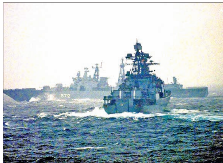
Russian Navy vessels head for joint exercises with the Japan’s Maritime Self-Defence Forces (MSDF) in the Sea of Japan.

Russia, which has supported the Syrian regime throughout the four-and-half year conflict that has claimed some 250,000 lives, says any support is in line with existing military contracts and that personnel have been sent to train the Syrian forces.