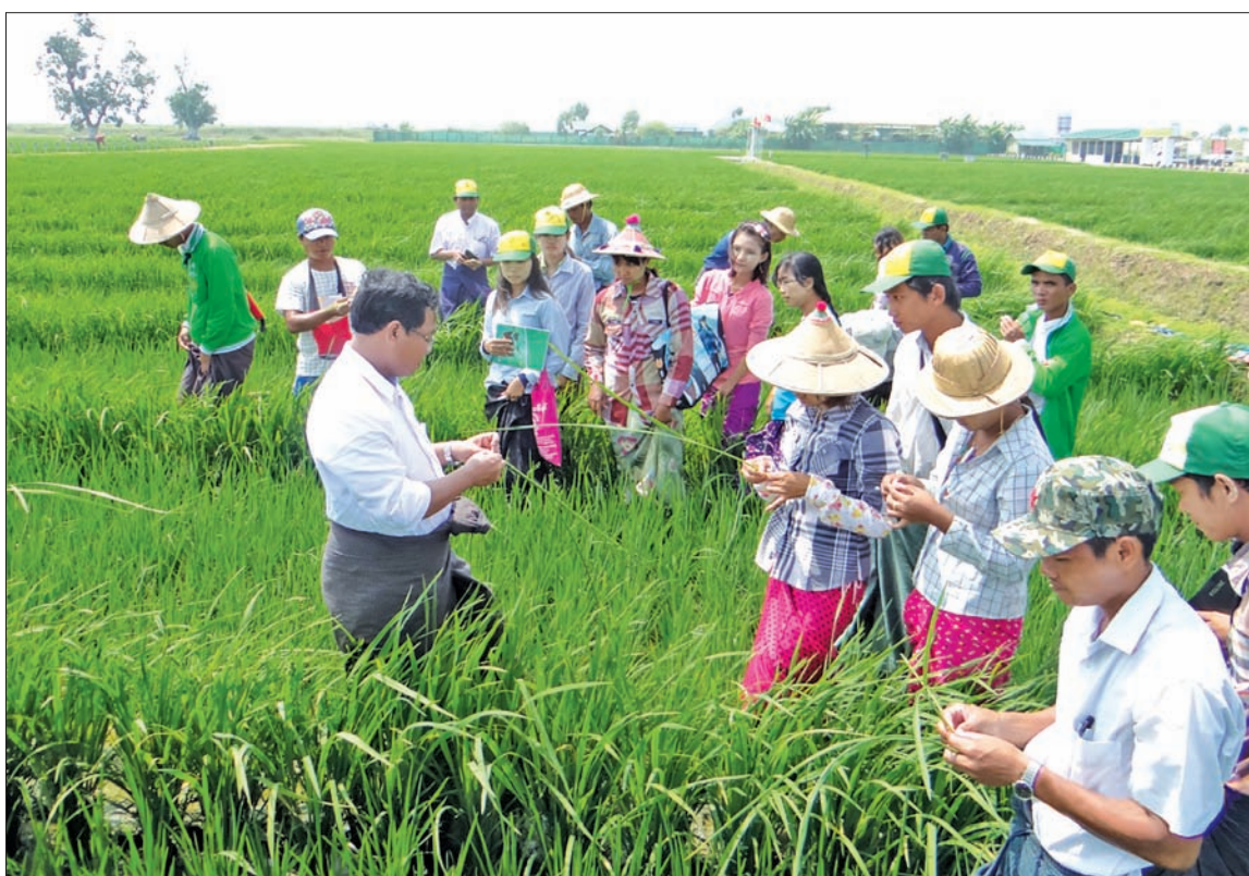
In Toungoo District, 528,908 acres were set aside for a paddy plantation.

In Toungoo District, 528,908 acres were set aside for a paddy plantation and the entire crop was successfully cultivated.— Ko Pauk