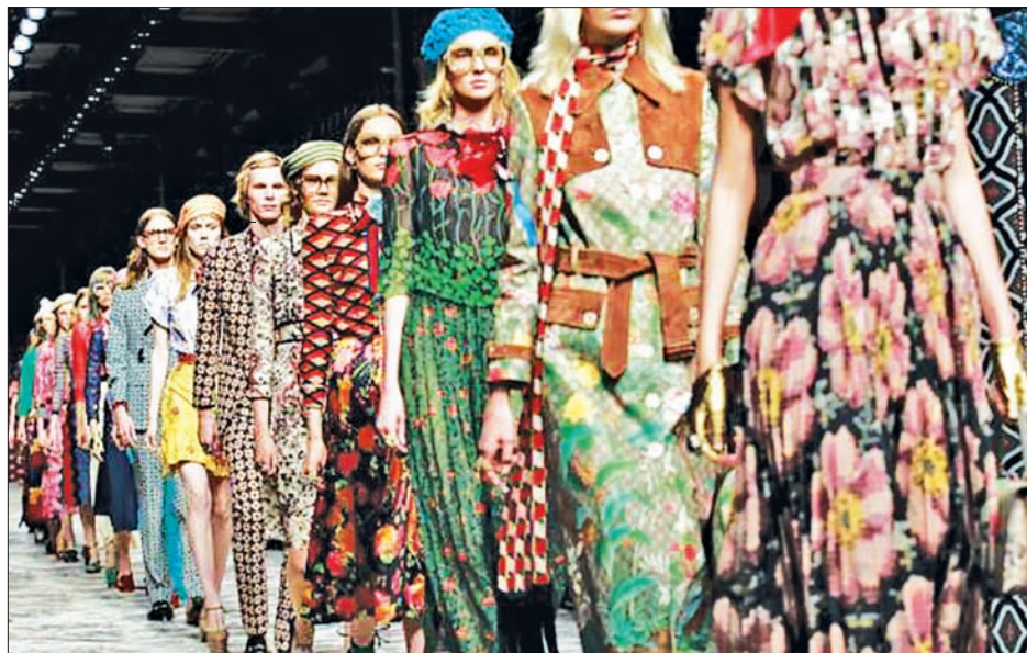
Models parade at the end of Gucci's presentation.