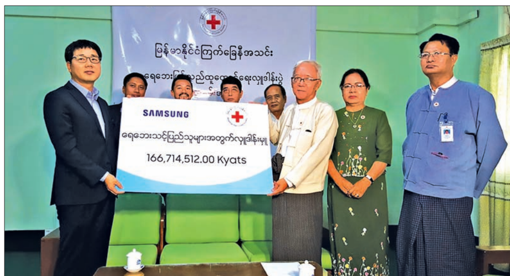
Samsung is working with Myanmar Red Cross Society (MRCS) to provide over USD100k in cash and USD30k worth of Samsung TVs to support the schools and public areas from flood affected regions.

May the earth be green and pleasant with trees for eternity!