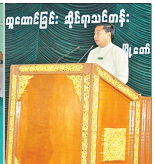
Muse being located close to the border with China, Myanmar citizens are being trafficked into the other country at alarming rate.