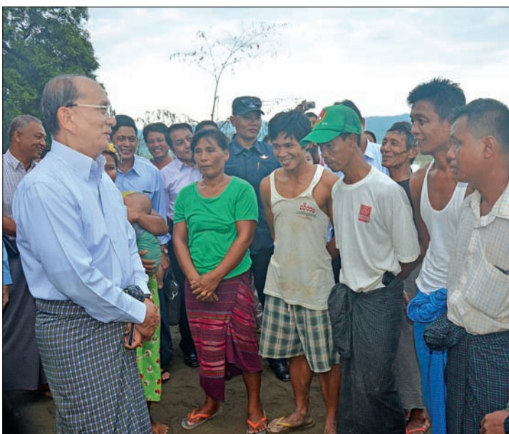
President U Thein Sein meets with local people at Pyntha Village, Kalay Township.