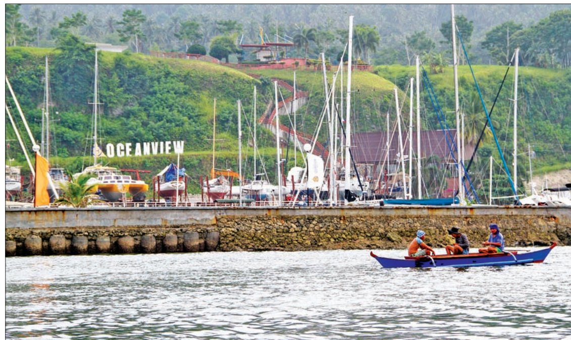
Fishermen on a small boat drive past the Oceanview resort on Samal island, Davao city, southern Philippines.