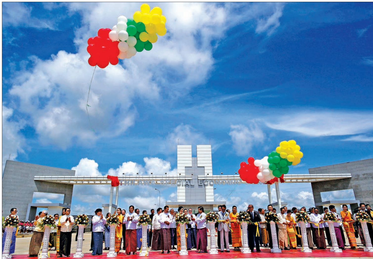
The opening ceremony of the Thilawa Special Economic Zone at Thanlyin township outside Yangon September 23, 2015. Thilawa SEZ, one of the major economic projects started by president U Thein Sein with the help of Japanese funding, is a $1.5 billion manufacturing complex designed to lure investment and help the country compete in the global marketplace.

Myanmar Japan Thilawa Development (MJTD), a joint venture between Japan and Myanmar, is managing the economic zone and has been recruiting companies to set up businesses in a 189-hectare section that