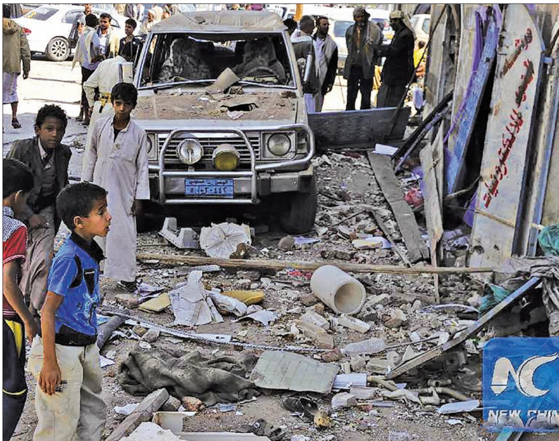
Saudi-led airstrikes destroy four civilian houses in Sanaa, killing 20 and wounding dozens on 22 September.

Yemeni Prime Minister Khaled Bahah and several ministers have returned to Aden to resume work, the temporary capital as they announced early after Hadi fled house arrest by the Houthi in March.—Xinhua