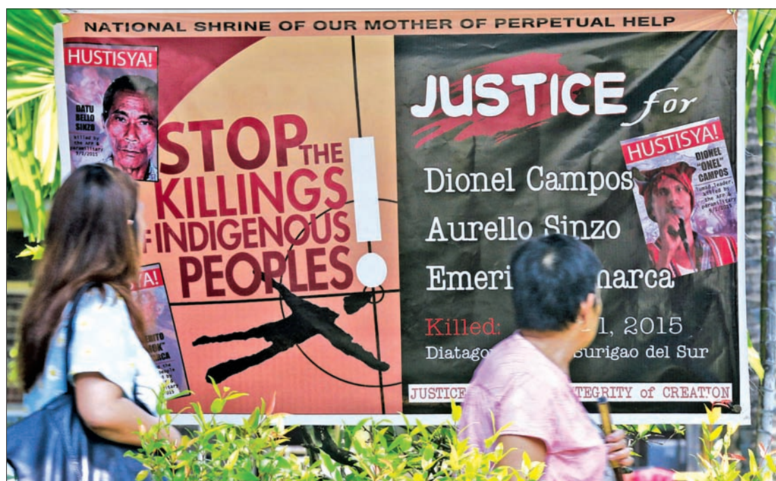
Passersby glance at a streamer bearing the names of three human rights activists during a protest in Manila September 23, 2015.

MANILA — The United Nations on Tuesday called on the Philippine government to investigate immediately the killings of three human rights activists on a southern island affected by long-running armed conflict.