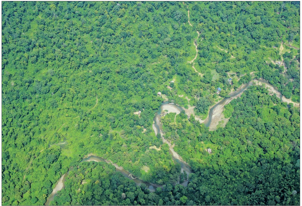
Myanmar has over 3,000 wild elephants and about 5,000 elephants in captivity working in the forestry sector.