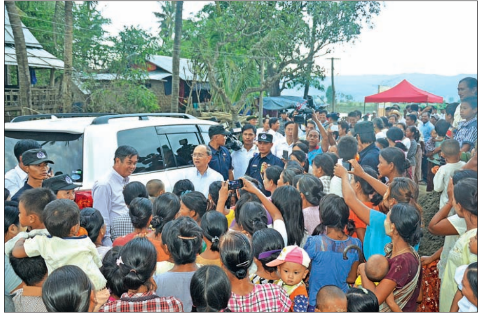
Local people in Pyntha Village, Kalay Township, welcome President U Thein Sein.