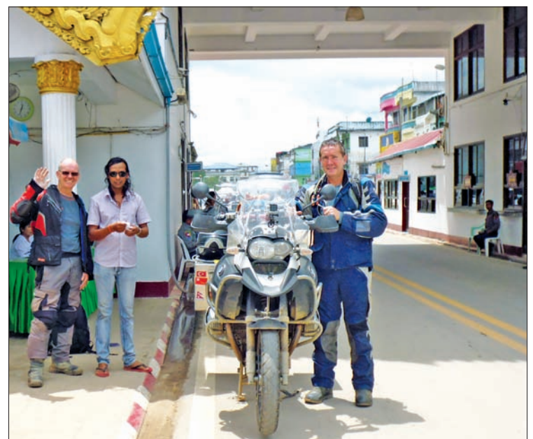
Tourists of motorcycle convoy seen at Myawady border gate.

From 8 to 17 September, Cy Nam Kong Travels and Tour Co Ltd arranged a 16-member tour group from Malaysia in 15 cars. They entered Myanmar from Mae Sot, Thailand, and then travelled along the Myawaddy-Yangon-Bagan-Mandalay-Inle-Mongpyin-Kyaintong route before returning to Thailand via Tachileik. The peak tourist season begins after the rainy season ends in October and the volume of tourists is expected to continue to rise steadily in 2016.— MoHT