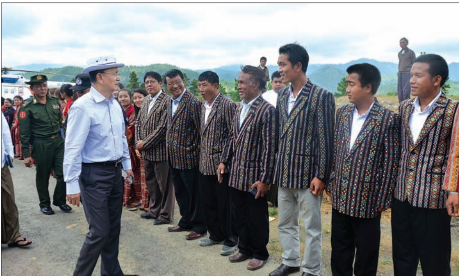
President U Thein Sein being welcomed by local people in Haka, Chin State.