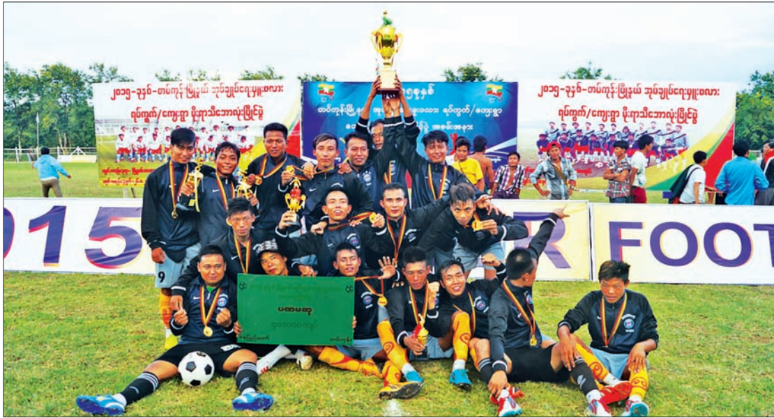
Bayintnaung celebrate their victory after winning the trophy.