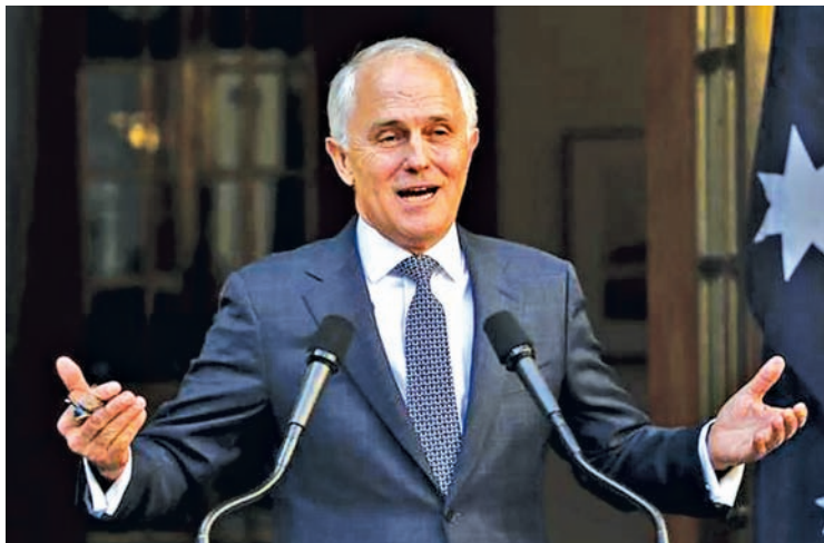
Australian Prime Minister Malcolm Turnbull announces his new federal cabinet during a media conference at Parliament House in Canberra, Australia.

Turnbull, a wealthy former investment banker considered politically progressive, ousted conservative Tony Abbott as leader of their Liberal Party last week after months of dismal poll numbers and a string of perceived policy missteps. Asylum seekers have long been a lightning-rod political issue in Australia, although it has never received anywhere near the number of refugees currently flooding into Europe as they try to flee instability in the Middle East and North Africa. Australia has vowed to stop asylum seekers reaching its shores, turning boats back to Indonesia when it can and sending those it cannot for detention in camps on Manus island in impoverished Papua New Guinea and on Nauru in the South Pacific. The United Nations and human rights groups have criticized Australia over the harsh conditions at the camps and its tough asylum-seeker policies, which Abbott defended as necessary to stop deaths at sea and often described as one of his government’s biggest achievements. Turnbull, who criticized Abbott for making major policy decisions without consulting his ministers,