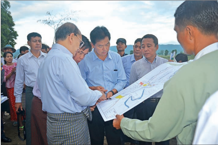
President U Thein Sein discusses expansion of the Myittha River near Pyntha Village.