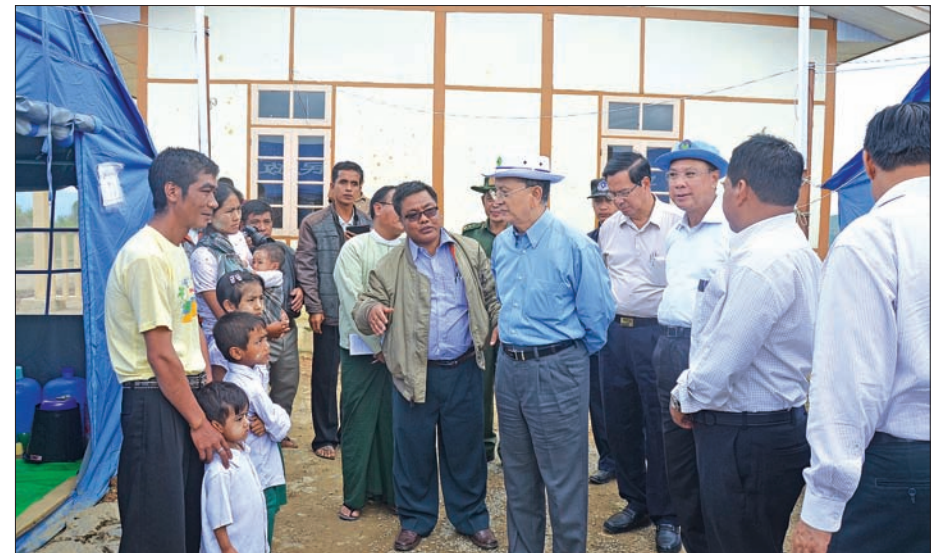
President U Thein Sein comforts the people sheltering at a relief camp in Tiddim.