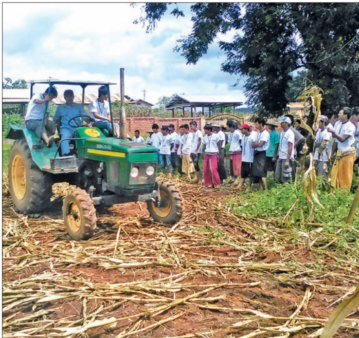
Kyaukme's farmers learn how to use agricultural machinery.

The course's 30 participants will learn how to drive tractors, among other skills.— U Myint Aung