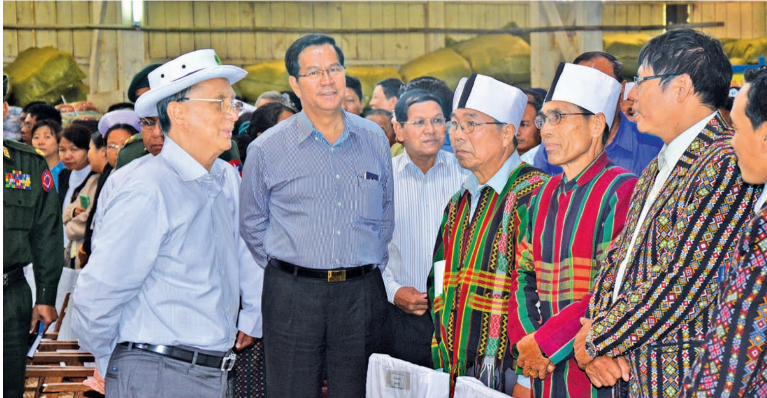
President U Thein Sein converses with local Chin nationals at the ceremony to donate provisions to flood victims.

NAY PYI TAW — Resettlement plans for communities affected by recent landslides in Chin State will feature improved town planning to ensure higher living standards, President U Thein Sein told locals in Tidim Township on Wednesday.