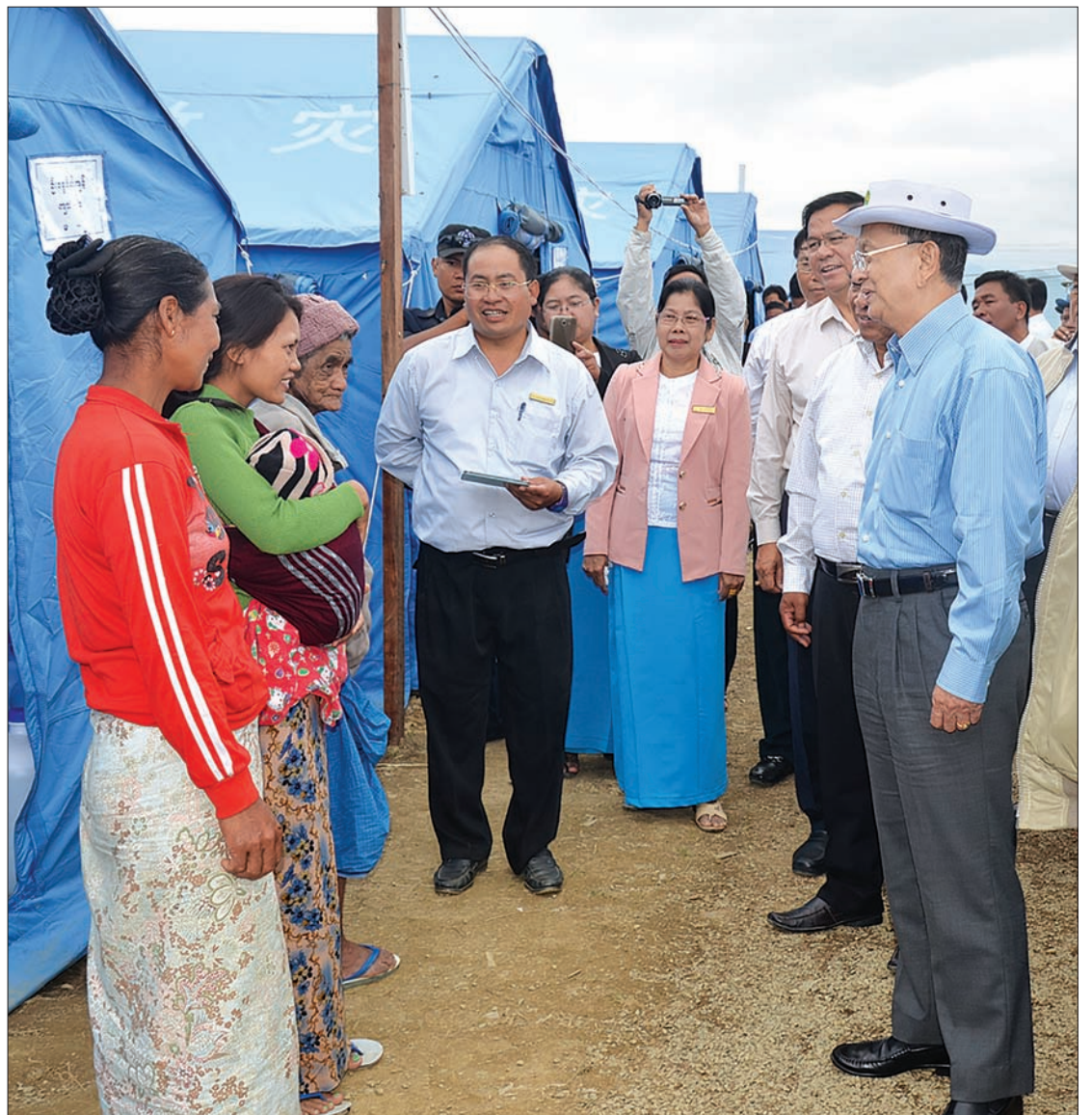
President U Thein Sein comforts the people sheltering at a relief camp in Tiddim.