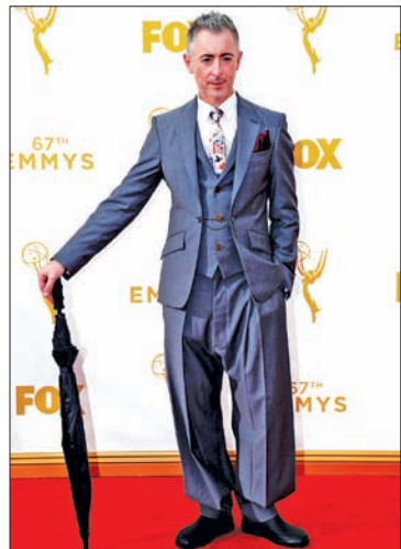
Actor Alan Cumming arrives at the 67th Primetime Emmy Awards in Los Angeles, California.