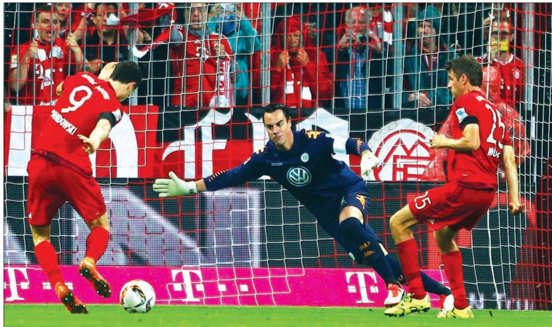
Bayern Munich's Robert Lewandowski (L) scores a goal past Wolfsburg's goalkeeper Diego Benaglio during their German first division Bundesliga soccer match in Munich.

Neuer. Wolfsburg almost scored again when Neuer charged out of the box to clear a ball but chested it into the path of Josuha Guilavogui who tried his luck from 40 metres with the ball hitting the post and rolling wide.—Reuters