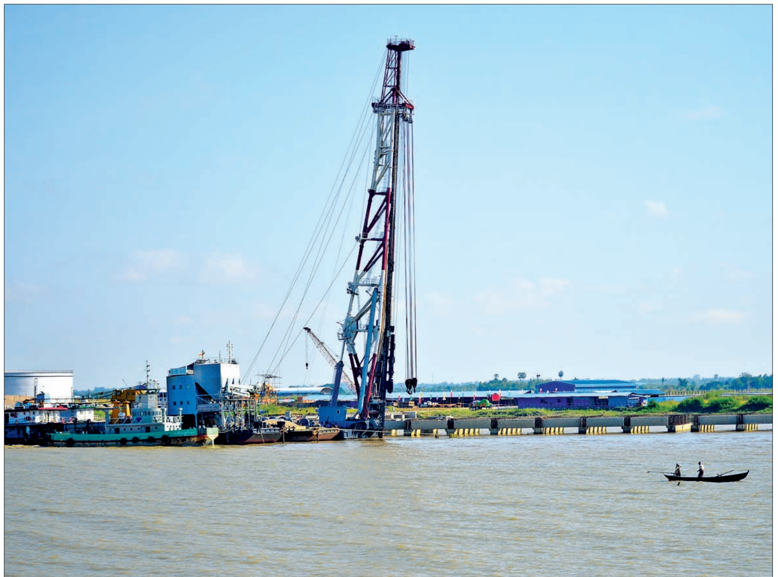
See page 2 >> A pier leading to Thilawa Special Economic Zone, which became Myanmar's first operational SEZ on 23 September.

"The special economic zone is a paradigm shift in the investment sector, bringing sustainable development to the country's industrial sector without damaging the environment," he said.