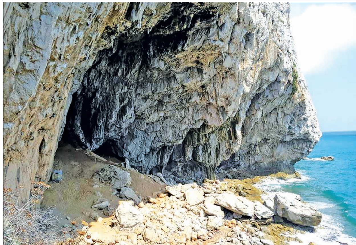
A view of the Gorham's Cave in Gibraltar.

MADRID — The oldest signs of heavy metal pollution caused by human activity, dating from the early Stone Age, have been found in caves in Spain and Gibraltar, officials said Monday.