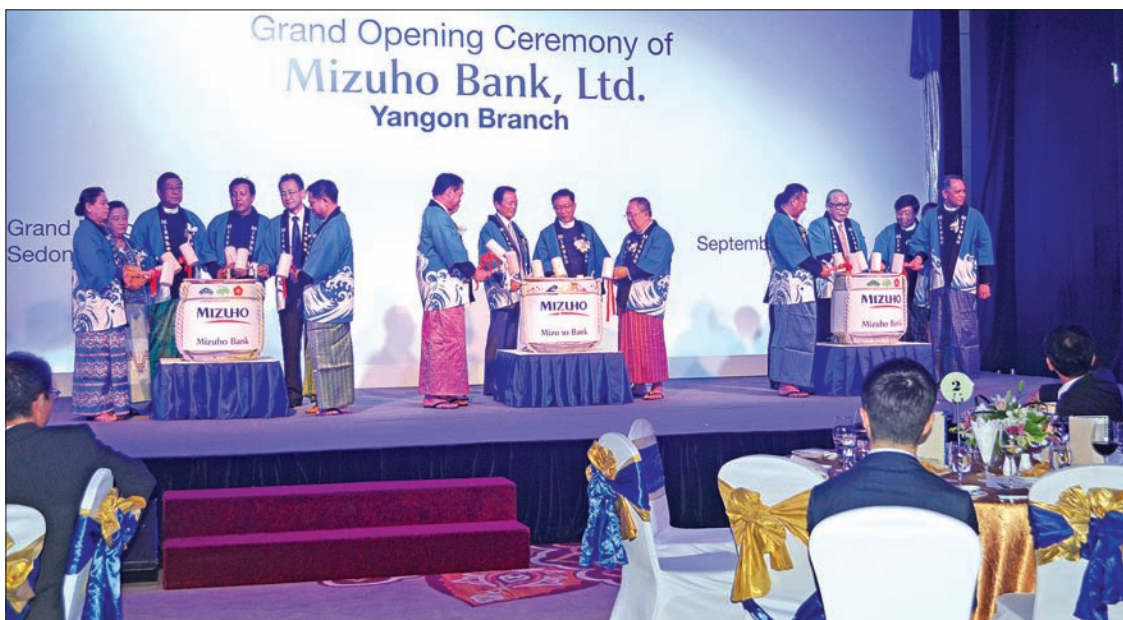
Officials hit Japanese traditional drums at a ceremony to open Mizuho Bank in Yangon.

Mizuho Bank representatives said it would contribute to developing Myanmar's human resources.—MNA