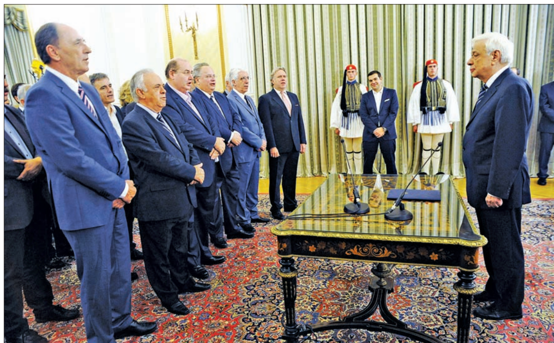
Greek Prime Minister Alexis Tsipras (C in background) looks on as Greek President Prokopis Pavlopoulos (R) leads a swearing-in ceremony under political oath of newly appointed members of the government at the Presidential Palace in Athens, Greece, September 23, 2015.

"We hope that the second Syriza-Independent Greeks government overcomes the inadequacy of the first one," it said in a statement.— Reuters