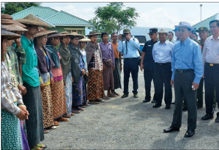
President U Thein Sein greets workers at Yazagyo Dam in Kalay.