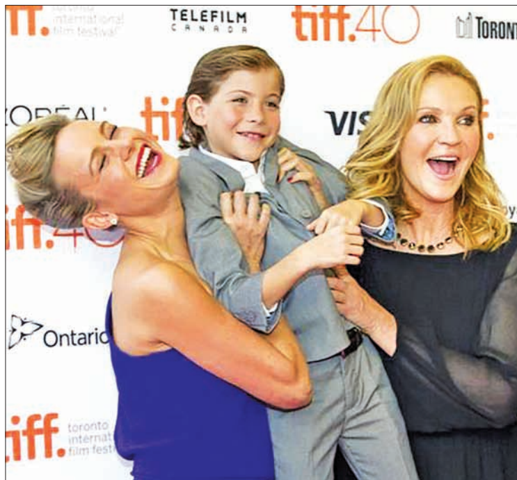
Actor Brie Larson, Jacob Trembley and Joan Allen arrive for the premiere of the movie 'Room' during the 40th Toronto International Film Festival.

TORONTO — "Room", an adaptation of the Man Booker Prize-nominated novel about a mother and child held captive for years, won top prize at the Toronto International Film Festival on Sunday.