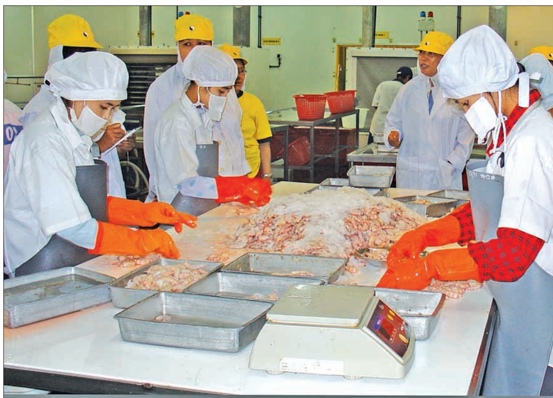
Workers sort out prawns at a factory.

when the new Government period just started 2013-2014 fiscal year and DOF has released (mentioned below) for export, objective of the more effectiveness for trade facilitation. At the present, transportation is more convenient through mountain range areas and rural areas strengthen the local distribution and increasing the local consumption become one of the root causes for decreasing of export quantity. In accordance with the official information from Hotel and Tourism Department, 2014-2015 fiscal year, 3.8 million of tourists came to Myanmar. Therefore, sea food consumption at local hotels and restaurants are also increased due to increase of tourism industry. In conclusion, DoF is supervision and encouraging the Sea Food Processors and 113 numbers of processing factories from total 116 factories are running as a whole and it means 97% of sea food processing factories are running as ordinarily.