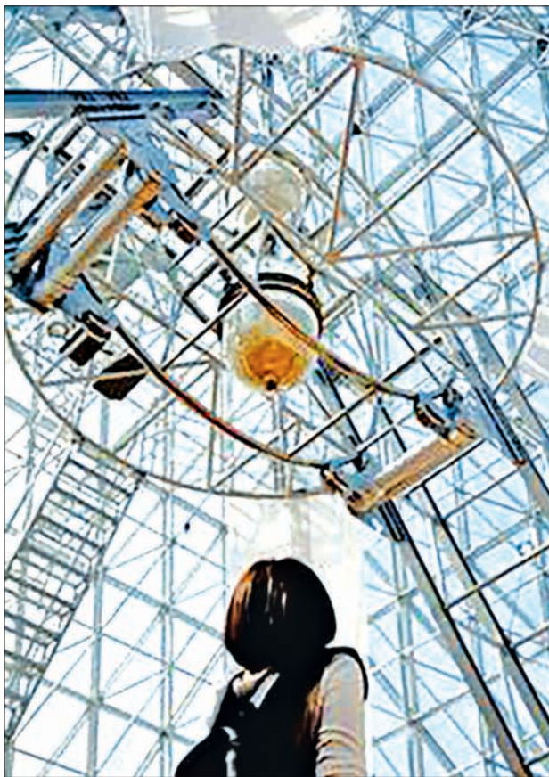
The sand clock in the city of Oda was recognised by the Guinness Book of World Records as the world's largest.

MATSUE — An hourglass at a museum in Shimane Prefecture in western Japan that measures the duration of a year has been recognized by Guinness World Records as the world's largest, the museum said Sunday.