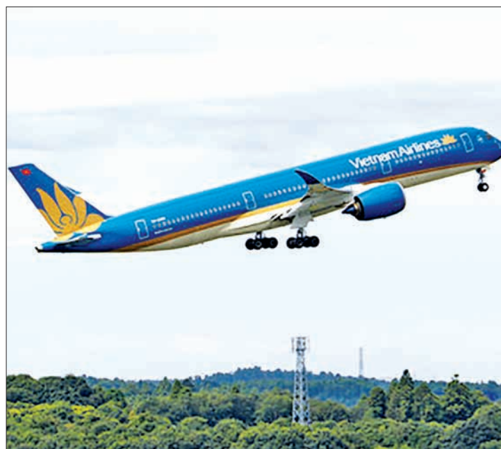
Vietnam Airlines Co's new A350 aircraft.

CHIBA — Vietnam Airlines Co flew its new A350 aircraft between Ho Chi Minh City and Narita near Tokyo on Sunday, becoming the first carrier to operate the new Airbus on a commercial service to or from Japan.