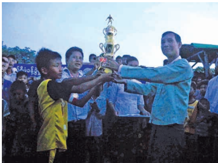
Young footballer of Soe Paing FC accepts the winning trophy for U-13 football final in Taungtha, Mandalay Region.

Football matches in Mandalay Region were held from September 7 to 20.— Kyaw Myo Naing