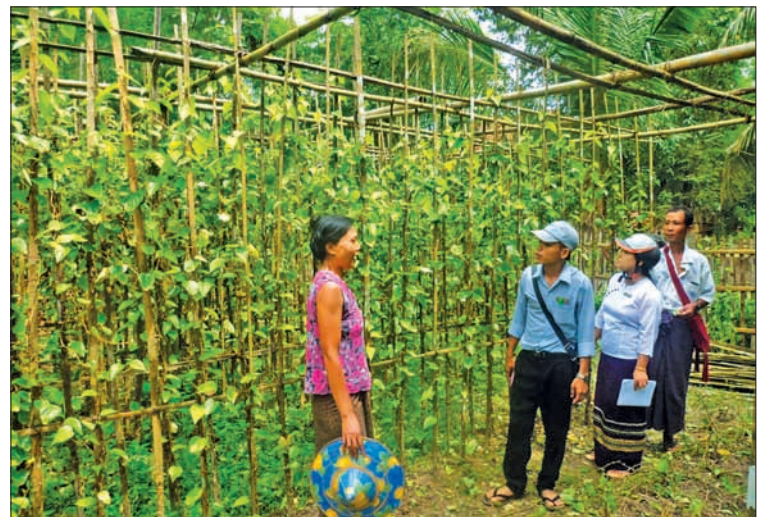
76 farmers, 20 livestock breeders and six villagers get loans in Kyangin Township, Ayeyawady Region.

Kyangin village, located in Ayeyawady Region, has a population of 423 people.—Township Rural Development Office