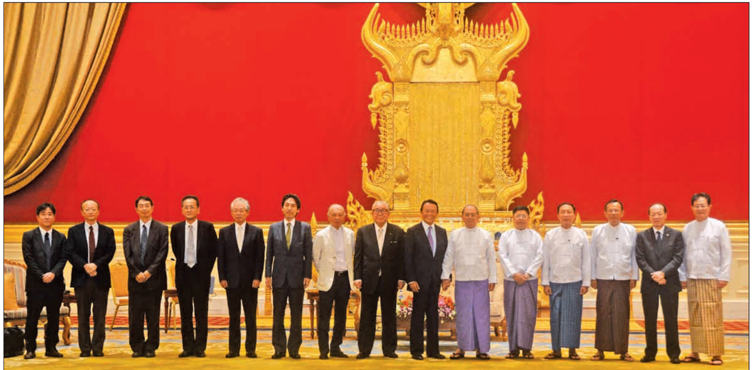
President U Thein Sein poses for documentary photo together with Japanese delegation led by Deputy Prime Minister and Minister of Finance Mr Taro Aso.

Views were also exchanged on further collaboration in the banking and financial sectors, Myanmar's nationwide ceasefire agreement and holding a free and fair general election in November.—MNA