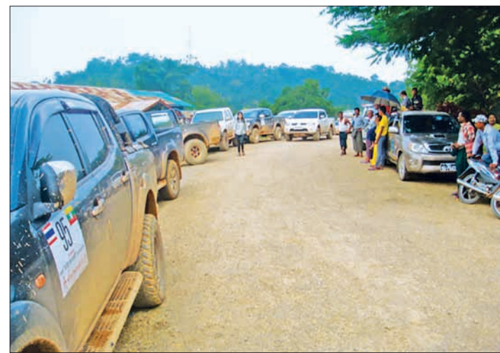
Participants of car rally taking a rest along the Myanmar-Thai border.