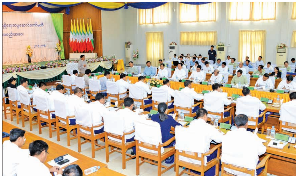
Vice President U Nyan Tun addresses meeting of National Electrification Executive Committee.