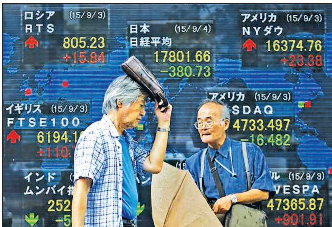
A pedestrian taking shelter from rain walks past an electronic board showing the stock market indices of various countries outside a brokerage in Tokyo, Japan, 4 September, 2015.

US and European debt yields also tumbled on Friday, with the policy-sensitive two-year yield US2YT=RR falling to 0.678 after hitting a four-and-a-half year