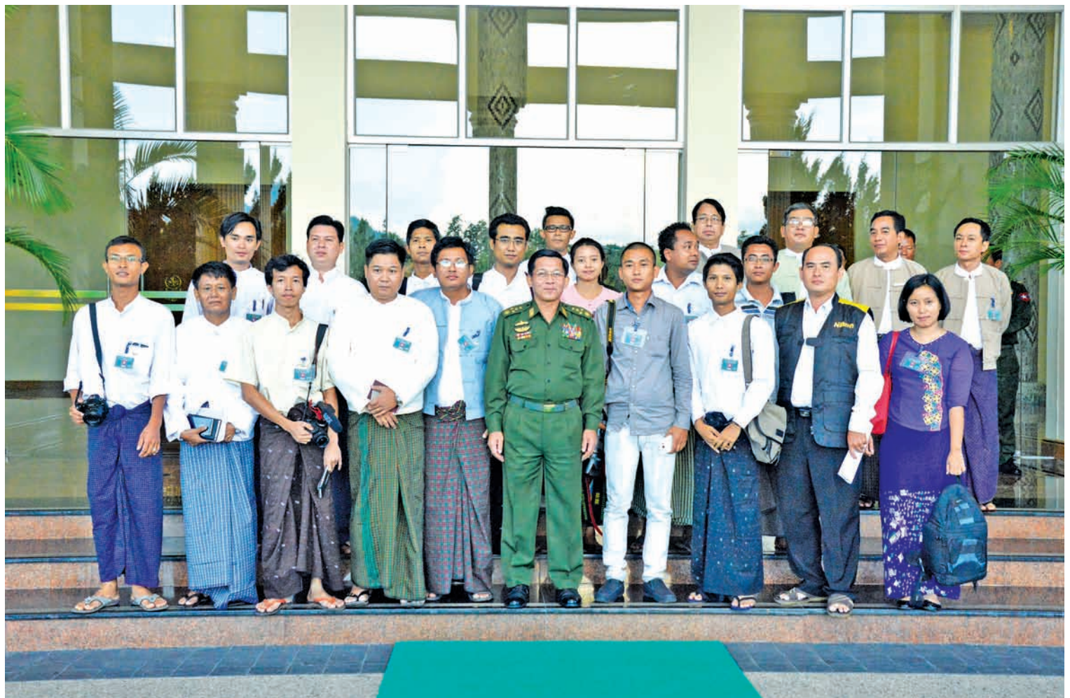
Senior-General Min Aung Hlaing and journalists have photos taken together outside Bayintnaung Hall of the military command.

to buy and build naval vessels as part of the effort to boost the capacity of Myanmar's navy, the senior-general said.