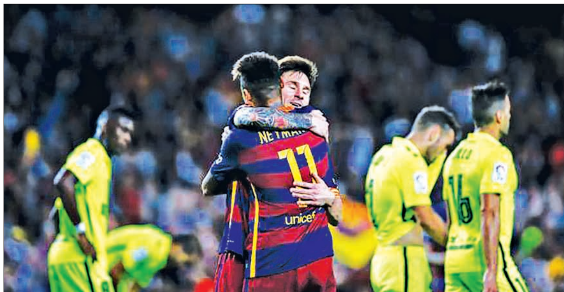
Barcelona's Lionel Messi celebrates with teammate Neymar after scoring against Levante during their Spanish first division soccer match at Camp Nou stadium in Barcelona, Spain, on 20 September, 2015.

"Now I am thinking of the present and the coach (Rafa Benitez) believes in me. I have had the chance to stay and I will give my best. I am very grateful to the Real fans for their support which is not easy to earn." — Reuters