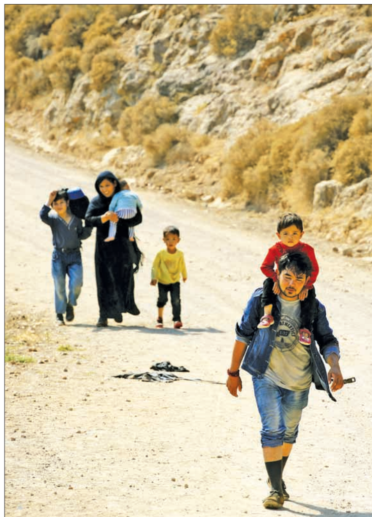
An Afghan family walks towards a registration camp after arriving by dinghy on the Greek island of Lesbos, on 20 September, 2015.

The 28-member bloc has struggled to find a unified response to the crisis, which has tested many of its newer members in the East