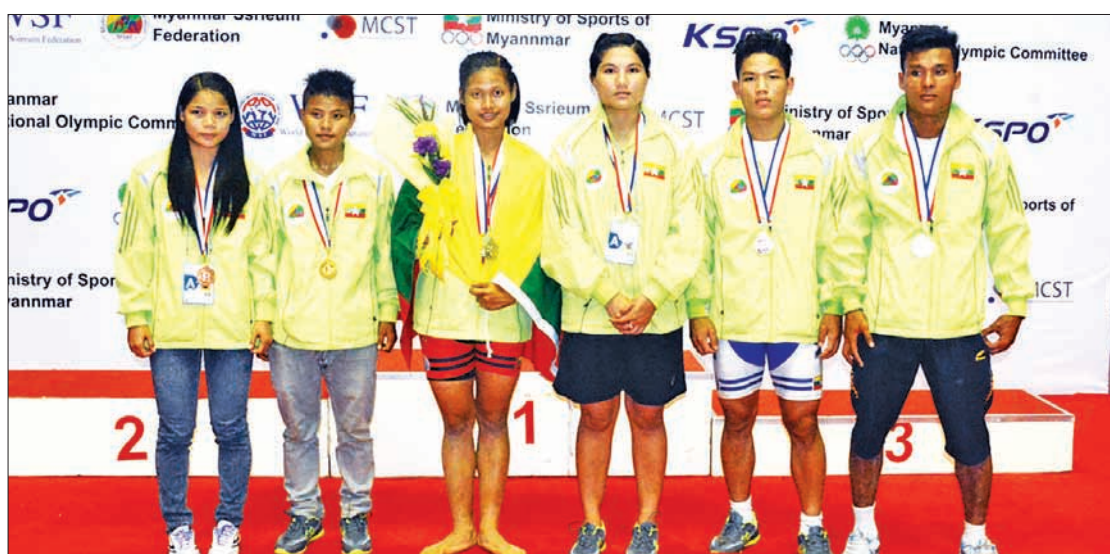
Myanmar medalists at the Asian Ssireum Championship and the 5 th World Ssireum.

YANGON — Myanmar won awards at the Asian Ssireum Championship and the 5 th World Ssireum, which was held at the National Indoor Stadium in Thunna, Yangon.