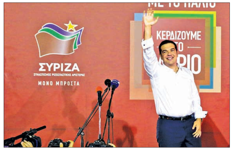
Former Greek prime minister and leader of leftist Syriza party Alexis Tsipras waves to supporters after winning the general election September 20, 2015.

Tsipras will also need to grapple with Greece's central role in Europe's refugee crisis, as the main entry point for tens of thousands of migrants who arrive by sea and trek up the Balkan peninsula to richer EU countries further north. He meets EU colleagues at an emergency summit over the