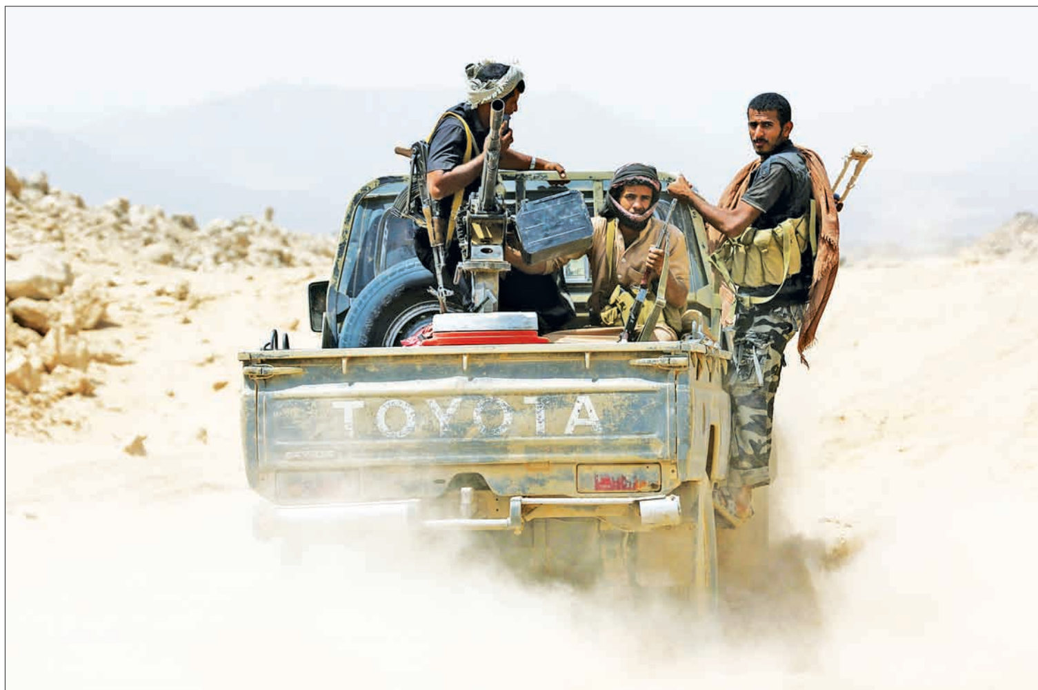
Tribesmen loyal to Yemen's government ride on a pick-up truck in the frontline province of Marib, September 20, 2015.

DUBAI — Two US citizens, one British national and three Saudis held for months by Yemen's Houthi group were freed on Sunday and have arrived in Oman, US, British and Omani officials and Houthi sources said.