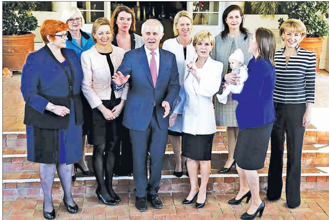
Australian Prime Minister Malcolm Turnbull with the female members of his cabinet, (front row L-R) Defence Minister Marise Payne, Minister for Health Sussan Ley, Turnbull, Foreign Minister Julie Bishop, Minister for Small Business Kelly O'Dwyer (holding baby), Minister for Employment Michaelia Cash and other officials after a swearing in ceremony at Government House in Canberra.

Payne joins a small number of woman defence ministers around the world and becomes the first to fill the role in an English speaking nation. Germany, Norway and the Netherlands all have female defence ministers.—Reuters