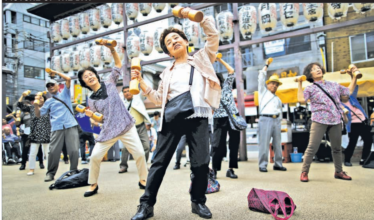
Elderly and middle-age people exercise with wooden dumbbells during a health promotion event to mark Japan's "Respect for the Aged Day" at a temple in Tokyo's Sugamo district, an area popular among the Japanese elderly, on 21 September, 2015.