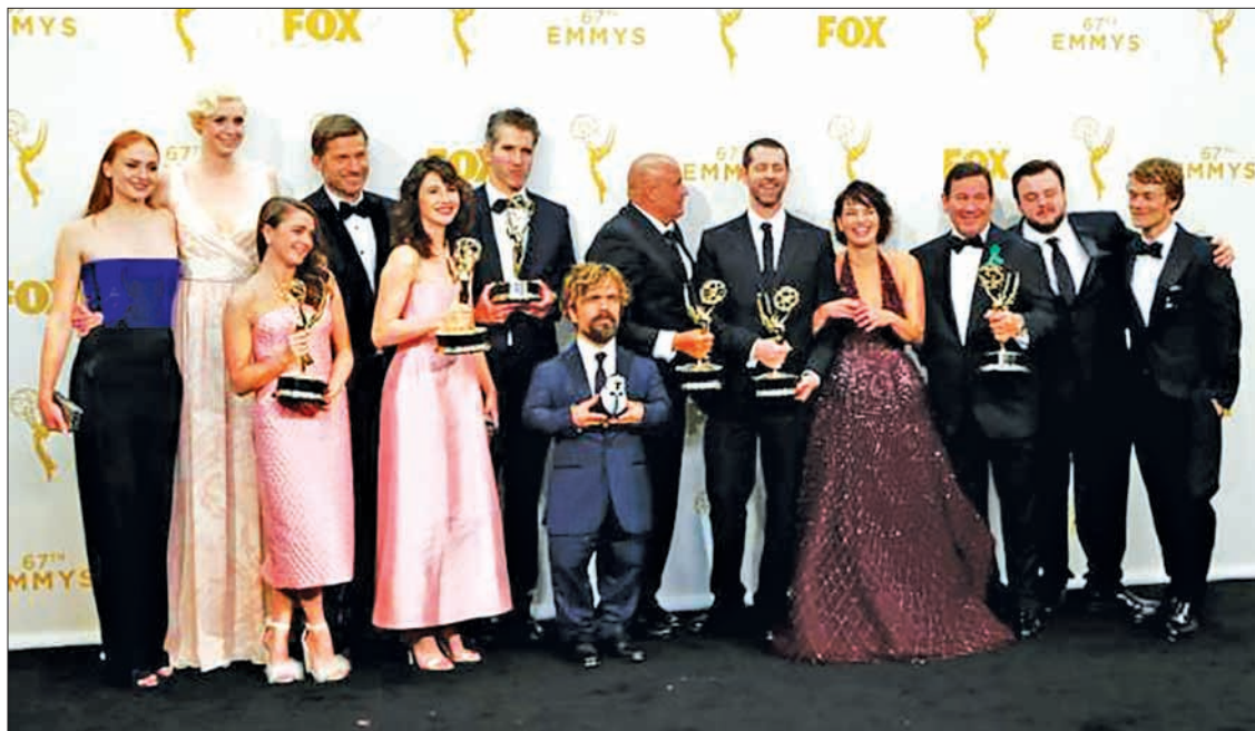
The cast of HBO's 'Game of Thrones' poses backstage with their award for Outstanding Drama Series during the 67th Primetime Emmy Awards in Los Angeles, California 20 September, 2015.

LOS ANGELES — HBO shows "Game of Thrones" and "Veep" won the top prizes at the Emmy Awards for the first time on Sunday, bringing a breath of fresh air to television's biggest night on an evening that also made history for black actresses.