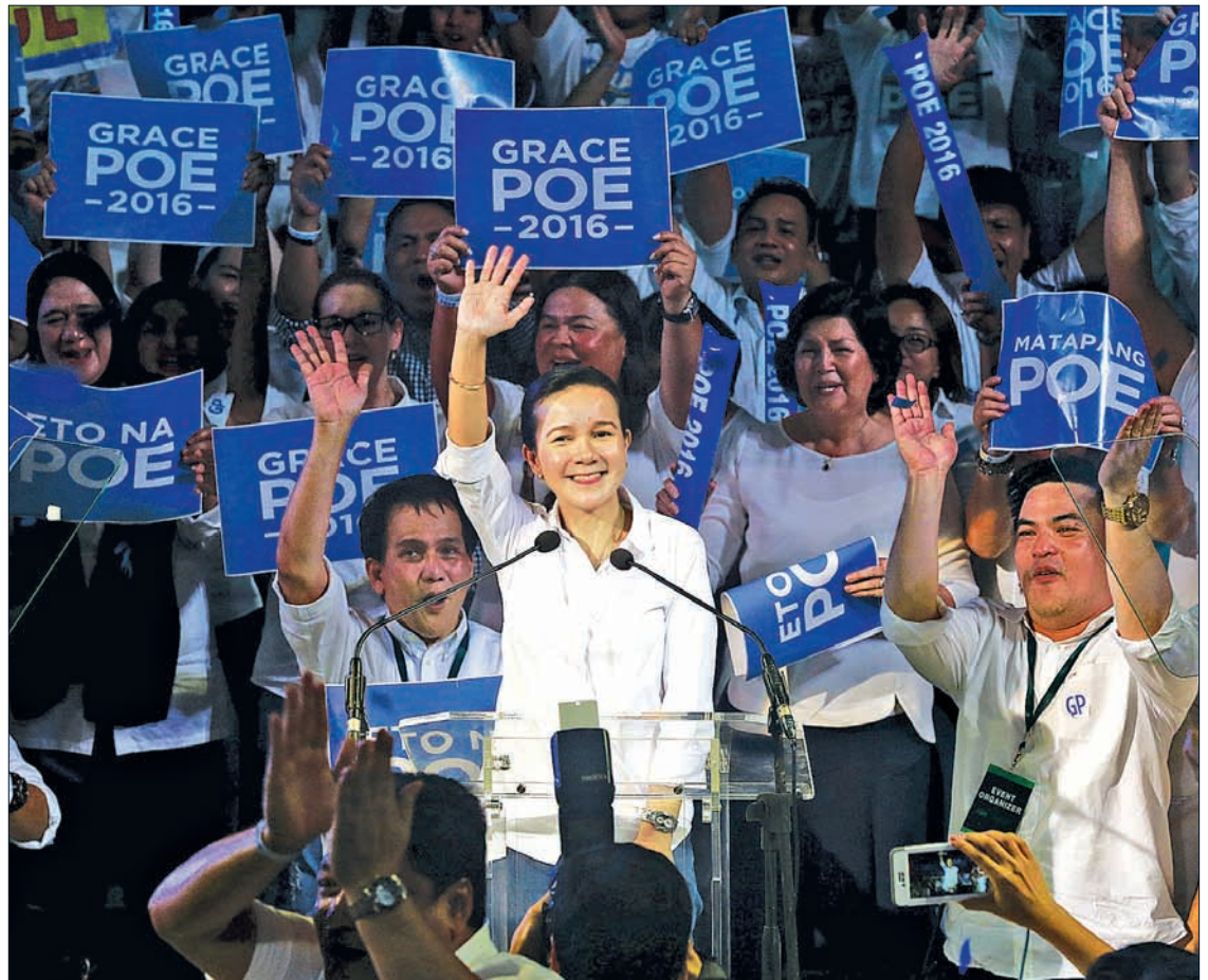
Philippine Senator Grace Poe, daughter of late local movie actor Fernando Poe Jr, waves to her supporters during her proclamation rally at the University of the Philippines in Manila.

asked in early September — before Poe declared her candidacy — to make their top three choices to replace Aquino.