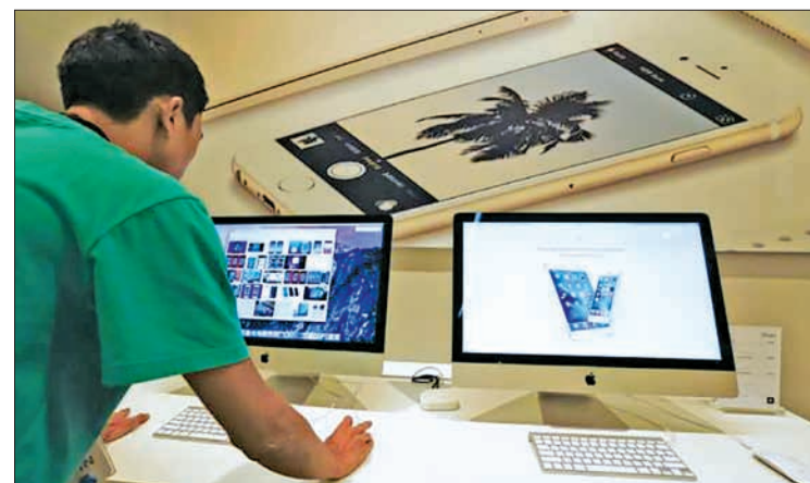
A sales assistant shows features of iOS 9 on an Apple iMac at an Apple reseller shop in Bangkok.

Tencent said on its official WeChat blog that the security flaw affects WeChat 6.2.5, an old version of its popular chatting app, and that newer versions were unaffected. A preliminary investigation showed there had been no data theft or leakage of user information, the company said. Apple declined to say how many apps it had uncovered.—Reuters