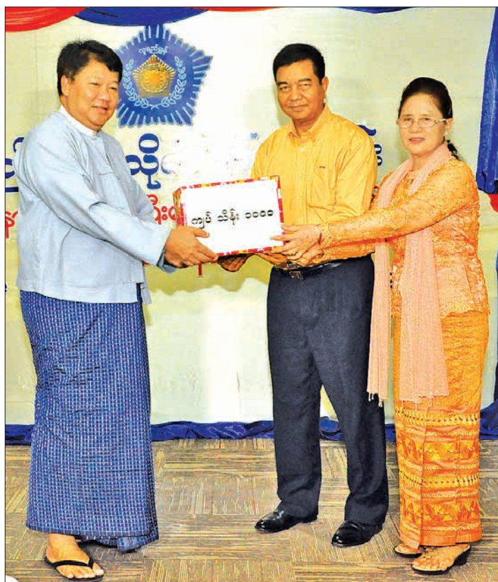
Donations for Luyichuan (“outstanding student”) Free Clinic in New Hlaingthaya Township, Yangon.

The Kanbawza Brighter Future Myanmar Foundation is a social welfare foundation within the KBZ Group.—GNLM