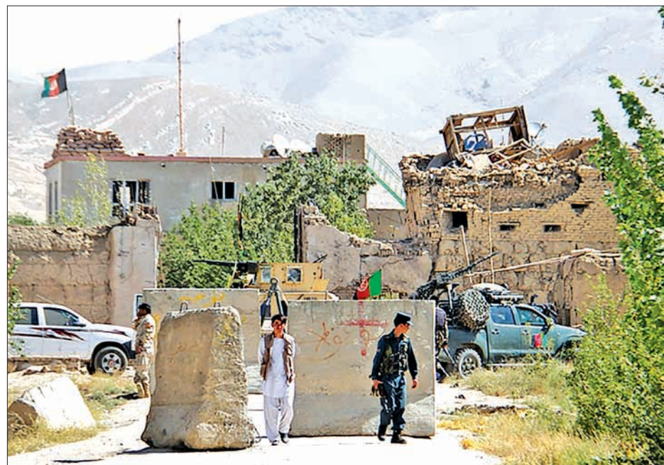
An Afghan policeman (R) walks outside a prison building after an attack in Ghazni province, Afghanistan September 14, 2015.—REUTERS

Security at the prisons is often poor, with untrained, poorly equipped police guarding crumbling facilities.—Reuters