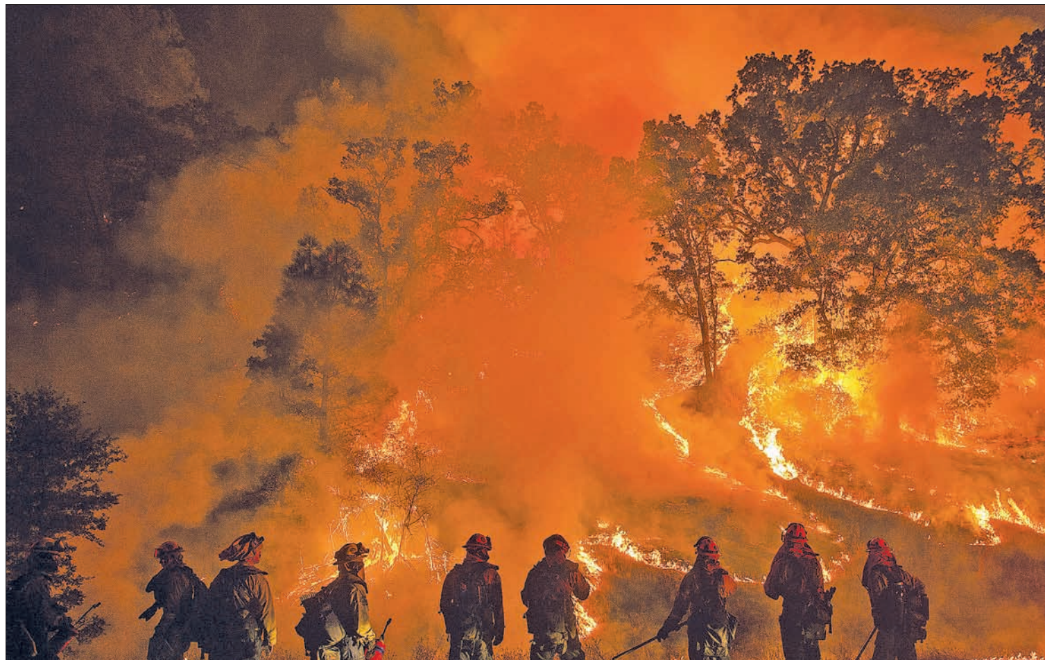
Flames from the Valley Fire cover a hillside along Highway 29 in Lower Lake, California September 13, 2015.

MIDDLETOWN — A swiftly spreading wildfire destroyed hundreds of homes and forced thousands of residents to flee as it roared unchecked through the northern California village of Middletown and nearby communities, fire officials said on Sunday.