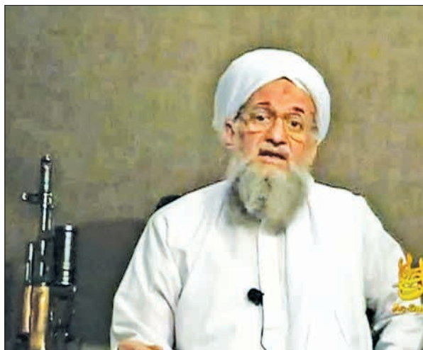
Al Qaeda's Ayman al-Zawahri speaks from an unknown location, in this still image taken from video uploaded on a social media website June 8, 2011.

CAIRO — Al Qaeda leader Ayman al-Zawahri called on young Muslim men in the United States and other Western countries to carry out attacks inside there and urged greater unity between militants.