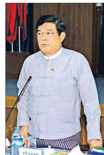
Vice President U Nyan Tun addresses coordination meeting of National Disaster Management Committee.

He also said that efforts are underway to prevent human trafficking among vulnerable populations, as over a million have been displaced by floods and