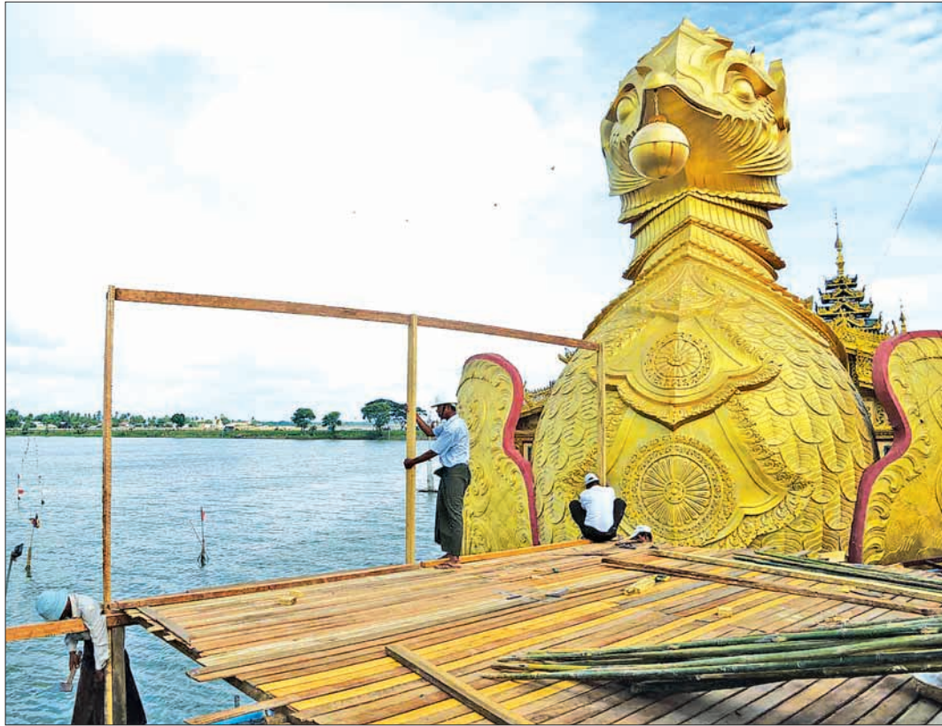
Stalls for shopkeepers at Buddha Pujaniya Festival at Phaungdaw-Oo Pagoda in Meiktila under construction.

The ancient pagoda in Mandalay Region sits at the bank of Meiktila Lake, which will feature traditional boat races during the festival. The prize ceremony stage is currently under construction.