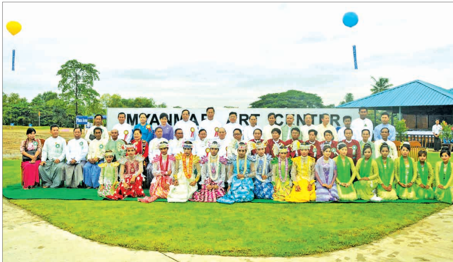
President U Thein Sein stands with a group of artists and dancers at the project site.

Union Minister U Soe Thane, Yangon Region Chief Minister U Myint Swe, Myanmar Motion Pictures Organisation chairman