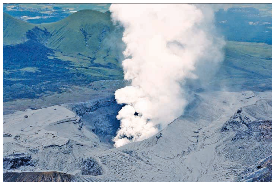
An aerial view shows an eruption of Mount Aso in Aso, Kumamoto prefecture, southwestern Japan, in this photo taken by Kyodo September 14, 2015.—KYODO NEWS

meters of the No. 1 crater of the mountain was declared off-limits by local authorities, which said there are restaurants and a museum but no houses in the area.