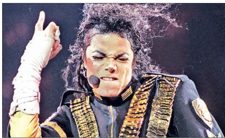
King of Pop Michael Jackson.

LONDON — The Jackson brothers paid tribute to their brother, King of Pop Michael Jackson at Bestival.