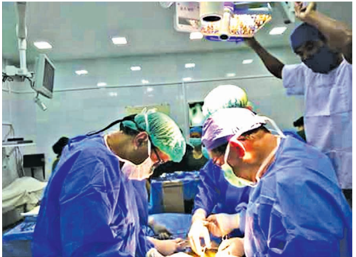
Specialists perform kidney transplant operation at Mandalay General Hospital.

Medical officers led by specialists of Mandalay General Hospital are providing daily health care services to the both patients.