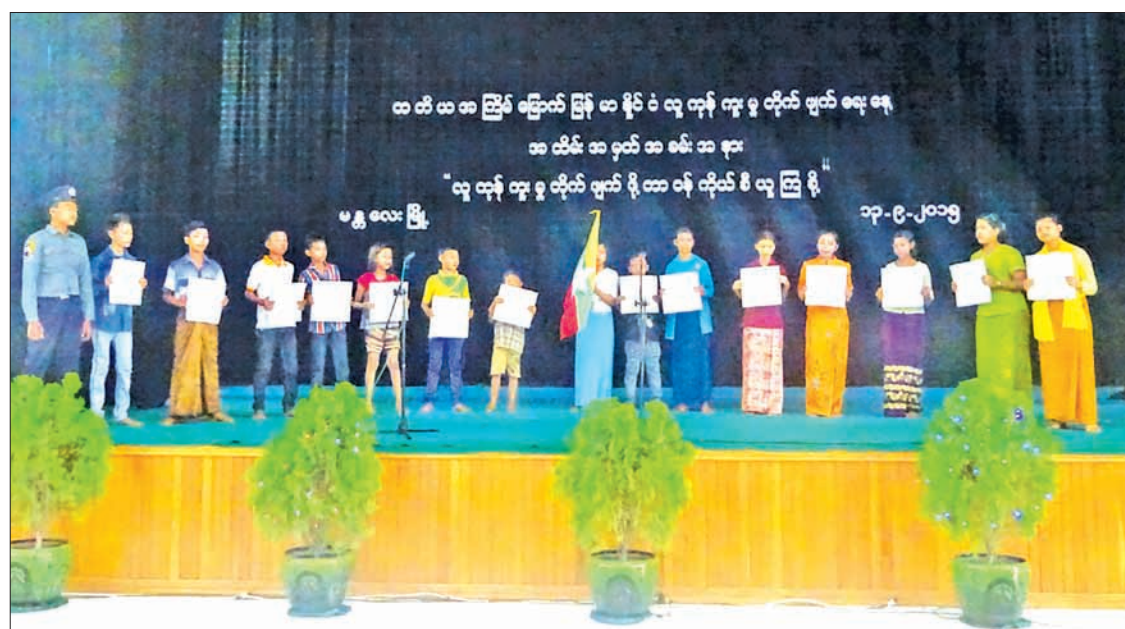
Youths participate in demonstration marking Anti-Trafficking in Persons Day in Mandalay.