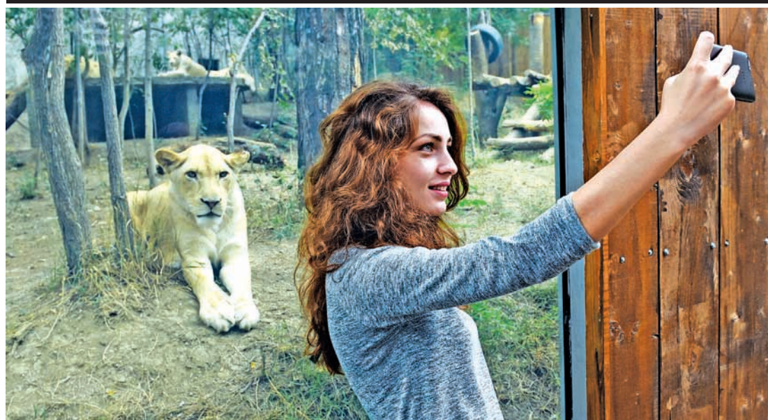
A woman takes a selfie in front of an open-air lion cage at the Tbilisi Zoo on September 13, 2015. The zoo reopened today after being destroyed by floods last June.