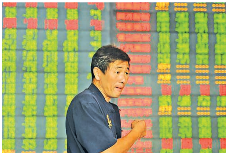
An investor speaks in front of an electronic board showing stock information at a brokerage house in Fuyang, Anhui province, China, September 14, 2015.

"Given the size of the looming risk event this week, barring some epic black swan event, it's going to be very difficult to nudge markets out of this very well-worn groove until we've heard what the Fed has to say on the future of monetary policy," he said.