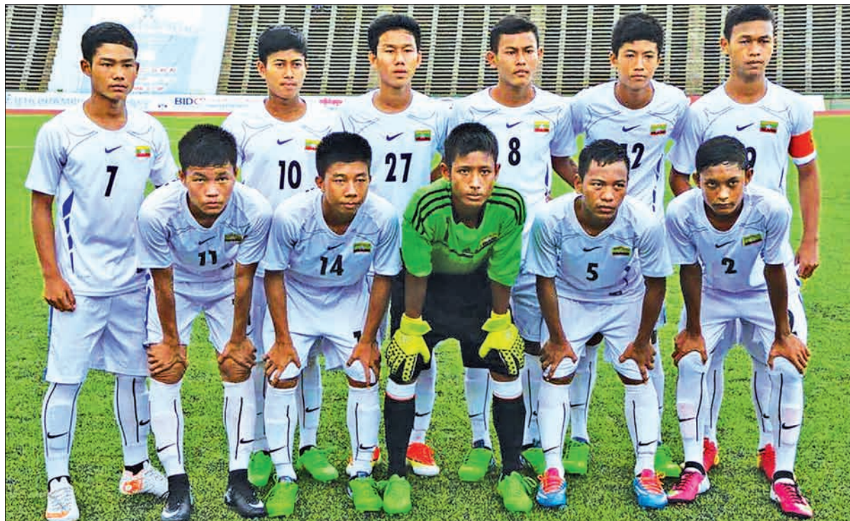
Myanmar's U-16 football team.—MIN HTET

YANGON — Myanmar's Under-16 football team is travelling to Vietnam to take part in the 2016 Asian Football Confederation U-16 Championship qualifying round, which runs from 16 to 20 September.