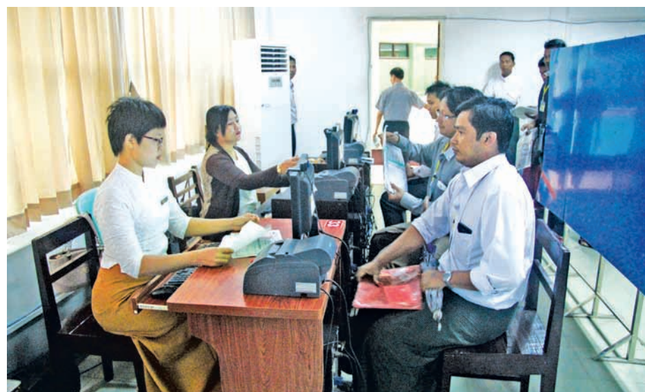
Staff members of Yangon Region’s Road Transport Administration Department giving services to customers for road transport.—TRANSPORT

RTAD staff briefed the union minister on developments within the department, including the expansion of drivers’ licence branches, vehicle registration services and road safety activities, according to Yangon Region RTAD officer U Kyaw Aye Lwin.—GNLM