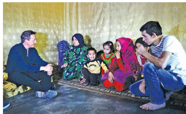
Prime Minister David Cameron meets a Syrian refugee family in a settlement camp in the Bekaa Valley in Lebanon, September 14, 2015.

Britain has said it will take in 20,000 Syrian refugees over the next five years.—Reuters