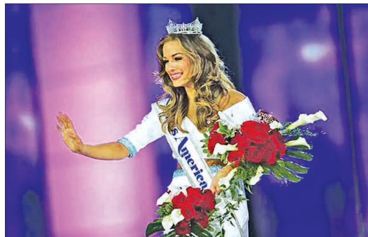
Miss Georgia Betty Cantrell reacts after being crowned Miss America 2016 at Boardwalk Hall in Atlantic City, New Jersey, September 13, 2015.

Sunday’s pageant came as it struggles to maintain its relevance after it was dropped by ABC in 2004 following a steep ratings de-