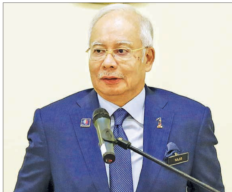
Malaysia’s Prime Minister Najib Razak announces measures to strengthen the economy at a news conference in Putrajaya, Malaysia, September 14, 2015.— REUTERS

He said on Monday that the rationalisation plan for 1MDB is on track. He also reiterated that there were no plans to introduce capital controls, adding that the government was on track to achieve fiscal consolidation target for 2015.— Reuters