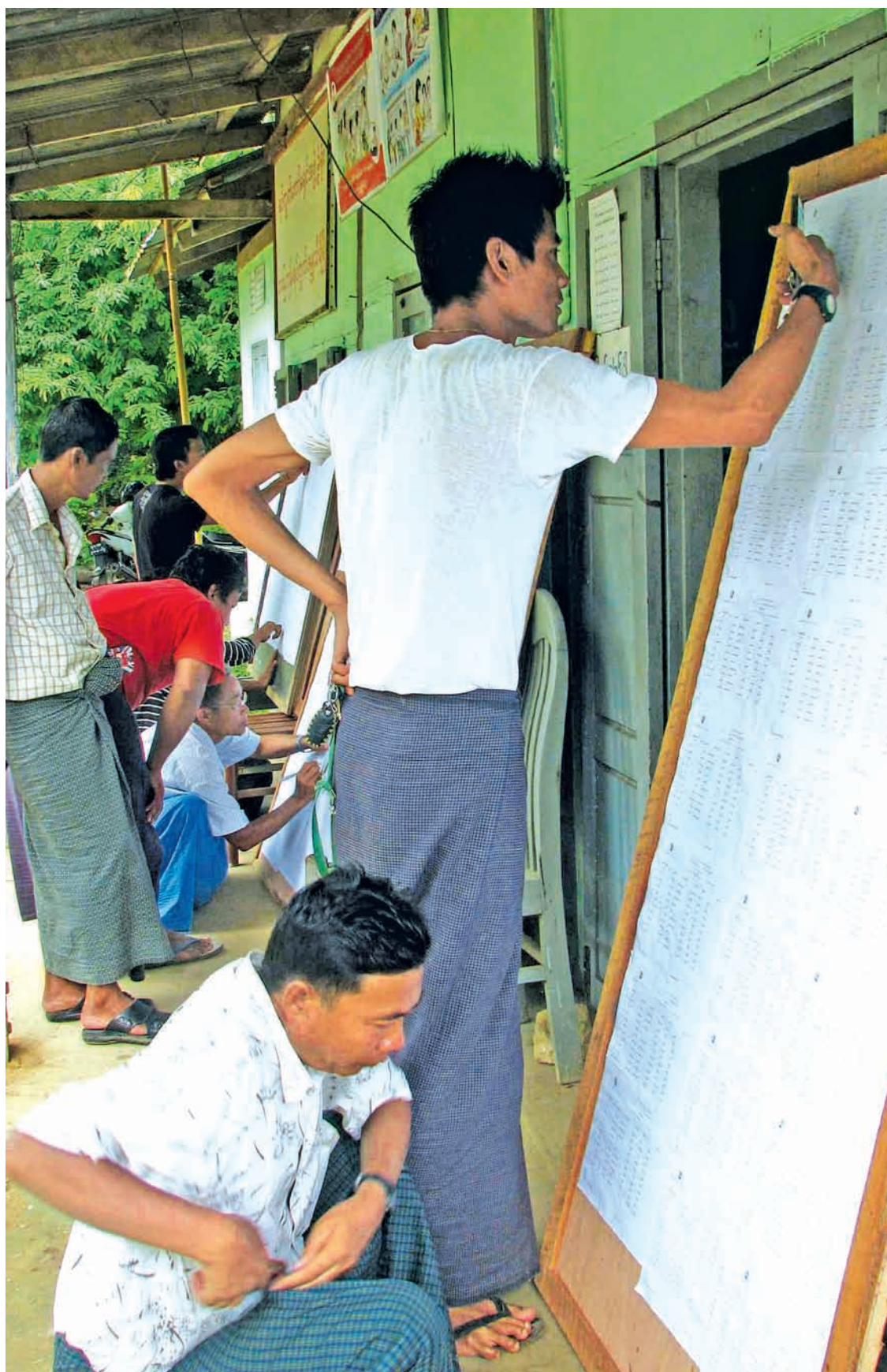
People from Tha Pyay Gone Ward in Nay Pyi Taw check the voters' list.—THANT ZIN WIN