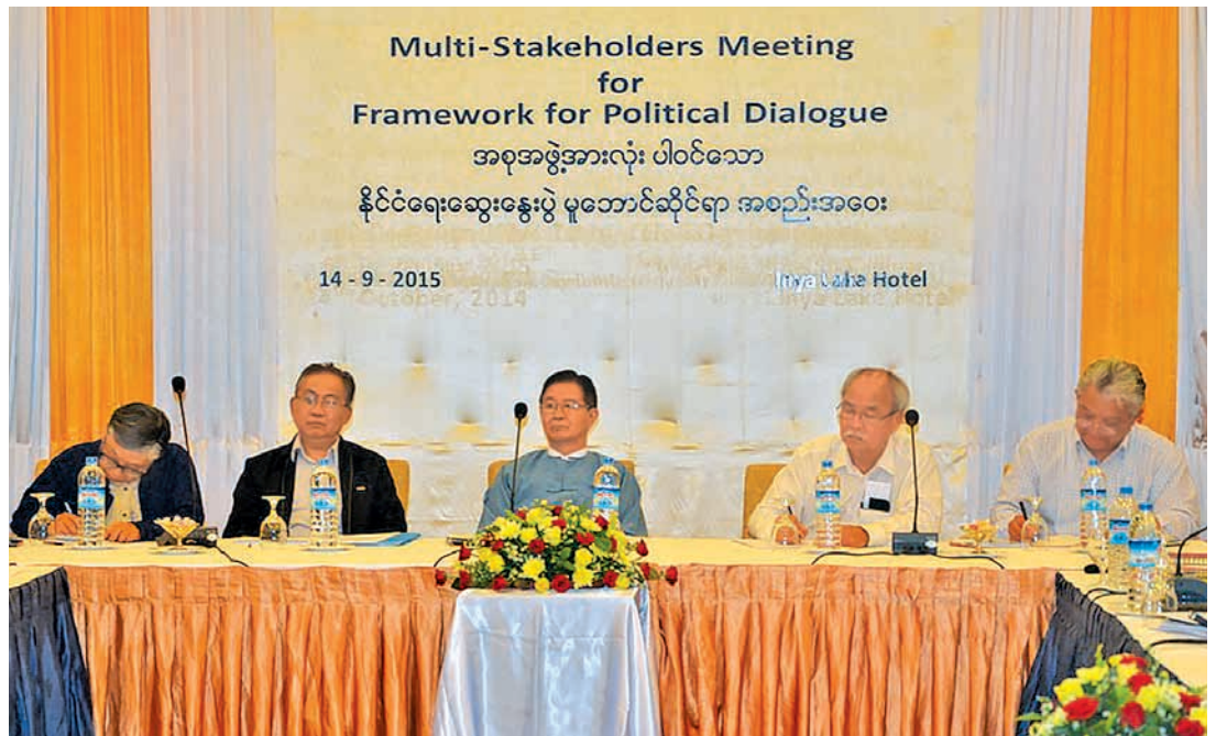
Union Minister U Aung Min and officials of Myanmar Peace Center seen at multi-stakeholders meeting for framework for political dialogue.