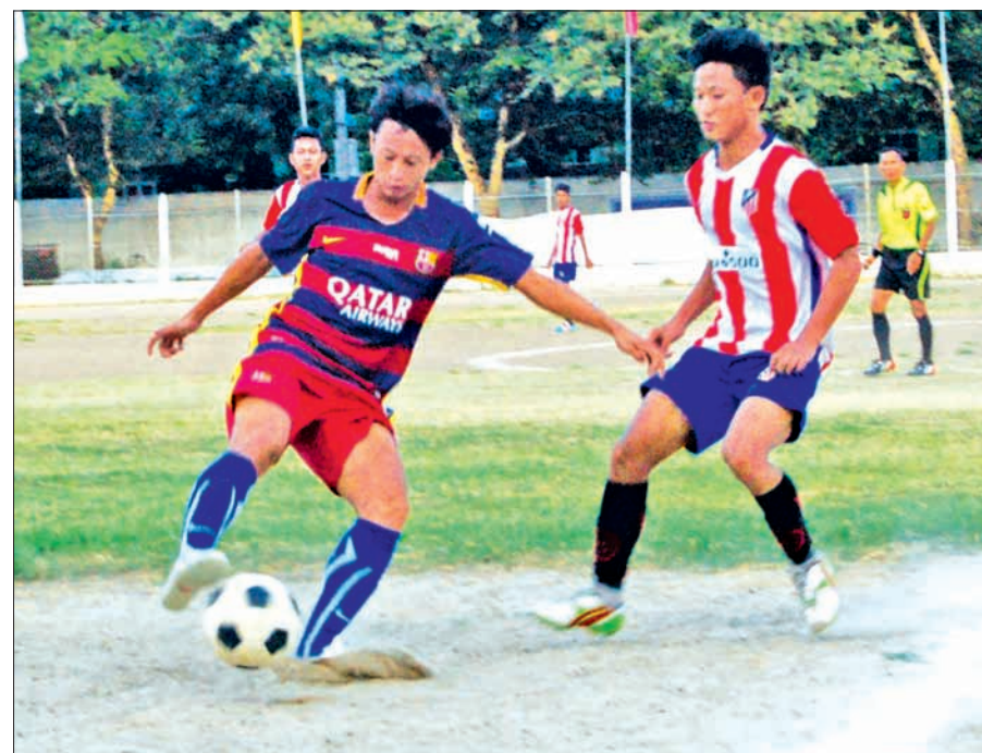
Footballers of Amarapura (A) FC and Mandalay FC fighting the ball.

(US$420) in addition to the championship trophy.