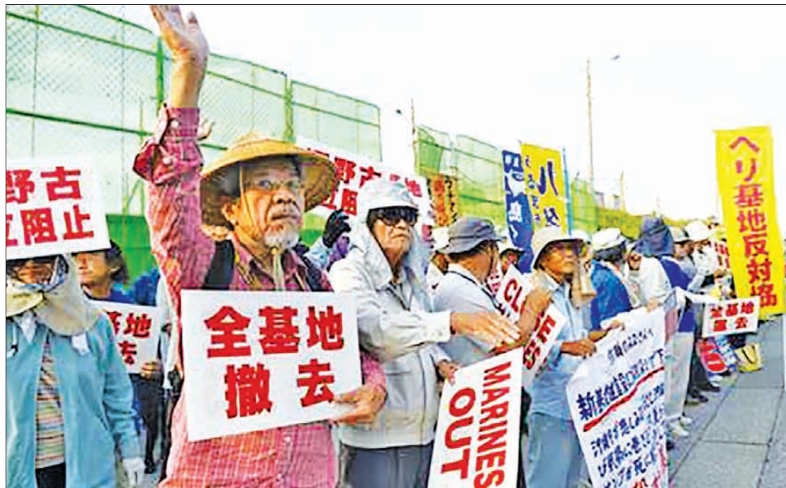
People demonstrate outside the US Marine Corps’ Camp Schwab in Nago, Okinawa Prefecture, on Sept. 14, 2015, to express opposition to the planned relocation of a key US military base to the area.

Onaga received a report this July from an advisory panel he had set up stating that the approval has legal defects.— Kyodo News