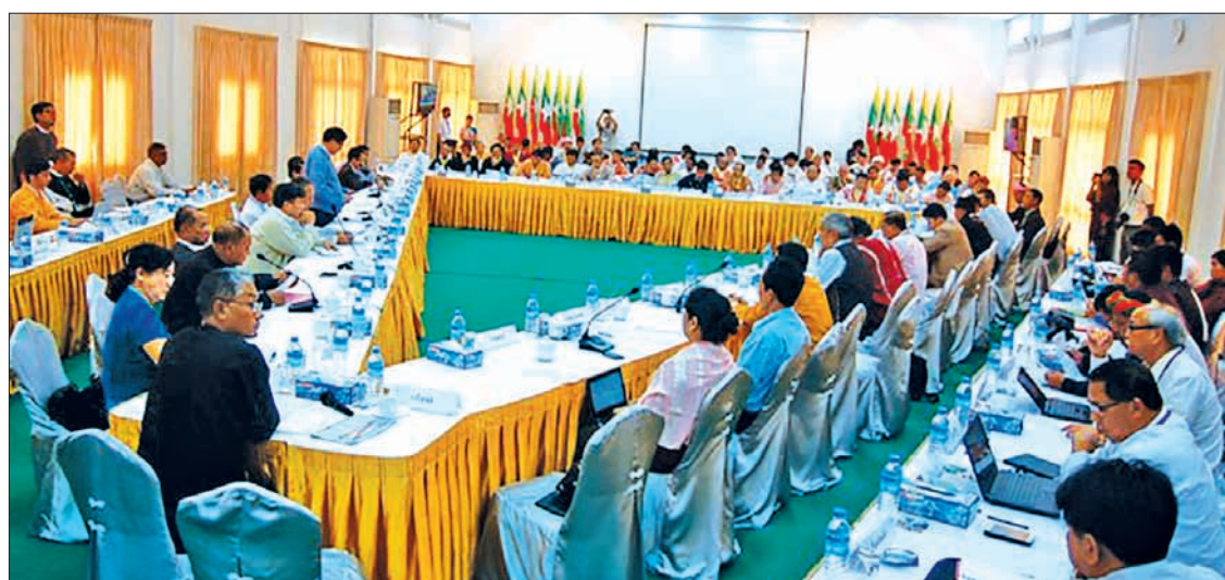
File photo of trilateral peace-talks at Myanmar Peace Centre in the last week of September, 2014.

YANGON — A meeting will be held on 14 September to discuss developing a common framework for political dialogue after the signing of the Nationwide Ceasefire Agreement, which is expected to occur in early October.