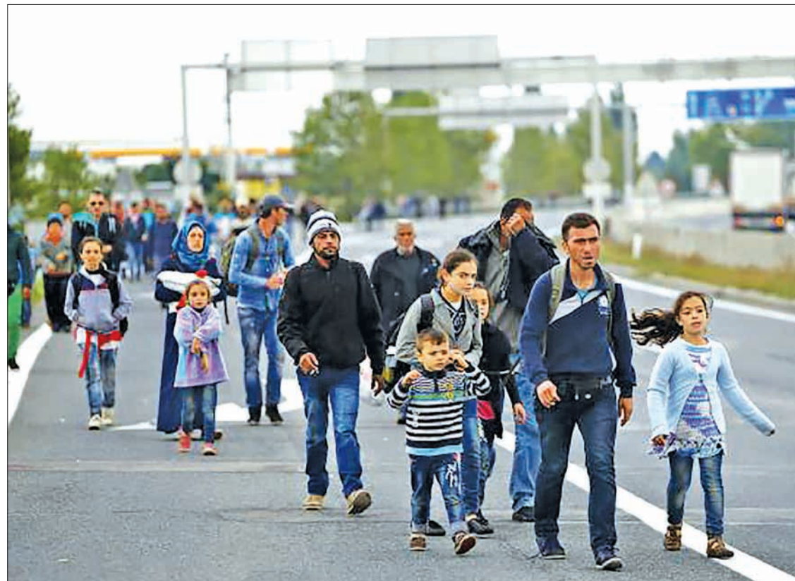
Migrants walk on a highway towards Vienna, near Nickelsdorf, Austria September 11, 2015.

The police chief for Austria's Burgenland province, which borders Hungary, told ORF radio on Saturday a lull in arrivals had let the authorities clear backlogs and clean reception centers, but he expected more arrivals soon. Hungary plans to seal its southern frontier with a fence by Sept 15. Its police said 4,330 migrants were detained on Saturday, most of them near Roszke, on the border with Serbia.—Reuters