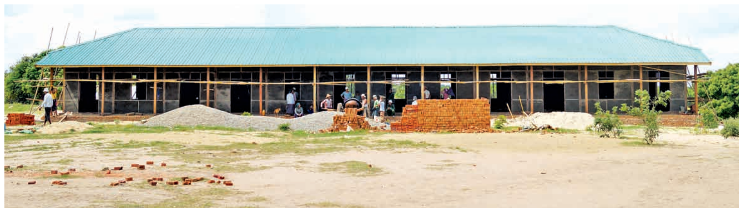
A school building under construction in Tatkon Township with K40 million fund of Rural Development Department.