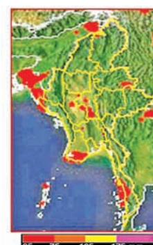
Areas received heavy fall.

Water levels at some rivers are likely to reach below danger levels in the next couple of days, said the country's prominent weather expert.—GNLM