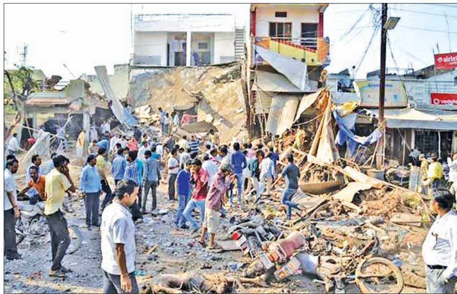
People stand near the site of an explosion in Jhabua district at Madhya Pradesh, India, September 12, 2015.—REUTERS

Local media have said residents previously complained about the location of the explosives but authorities failed to act. The state government said a full probe into the explosions would be carried out, while officials from New Delhi have been dispatched to help with the investigation.—Reuters