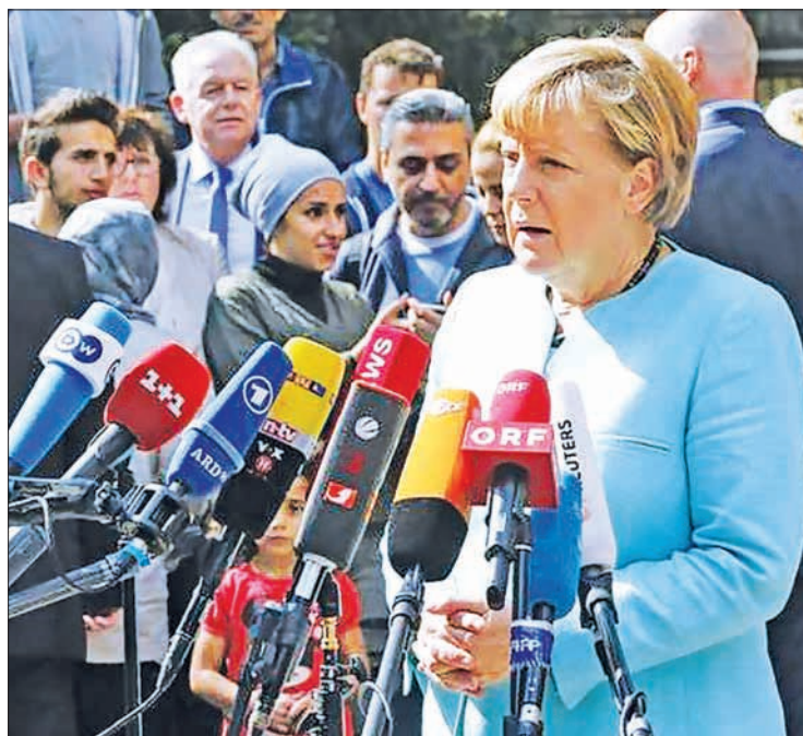
German Chancellor Angela Merkel gives a statement after her visit to a refugee camp near the Federal Office for Migration and Refugees at Berlin's Spandau district, Germany, September 10, 2015.

for the New York Times, Steinmeier said the nuclear deal struck between Iran and six world powers had created an opportunity to tackle Syria's troubles, but he was concerned that the chance to make progress was fading.