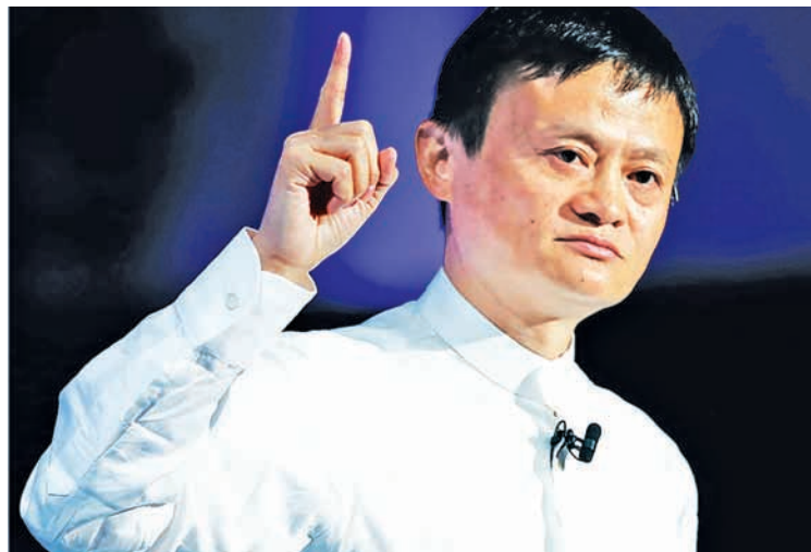
Jack Ma, founder of Alibaba Group Holding Ltd.

BEIJING — Forbes' list of the 100 Richest People in the tech industry includes 20 from the Chinese mainland.