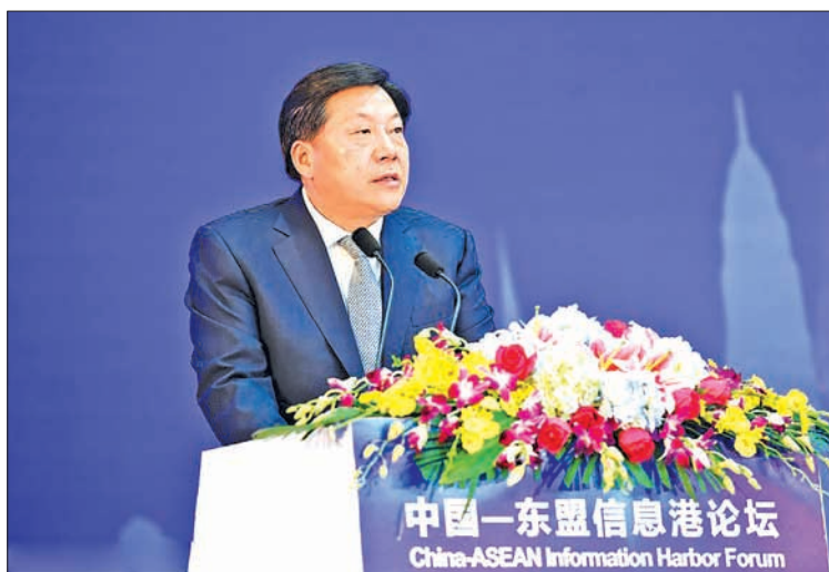
Lu Wei, minister of the Cyberspace Administration of China speaks at the China-ASEAN Information Harbor Forum opening ceremony in Nanning, Guangxi Zhuang autonomous region on September 13, 2015.

NANNING — China will set up a special fund for Internet and telecommunications infrastructure to link China and ASEAN members, said Lu Wei, minister of the State Council's Cyberspace Administration of China (CAC).