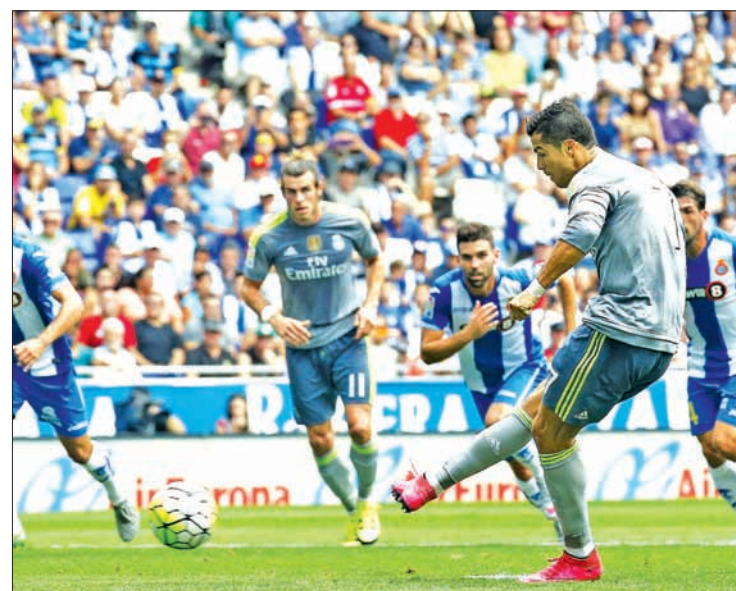
Real Madrid’s Cristiano Ronaldo scores a penalty against Espanyol during their Spanish first division soccer match in Cornellà de Llobregat, near Barcelona, Spain, September 12, 2015.

Ronaldo, who hit five against Granada in La Liga last season, raced clear and finished calmly to set Real on their way before