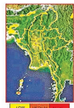
Low flood potential.