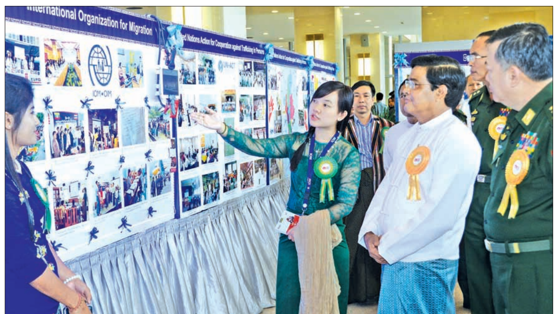
Vice President U Nyan Tun views photos and prize winning works at Anti-Human Trafficking Day ceremony.

An anti-human trafficking police unit was set up in 2013 and the country laid down its first five-year plan for action to combat human traf-