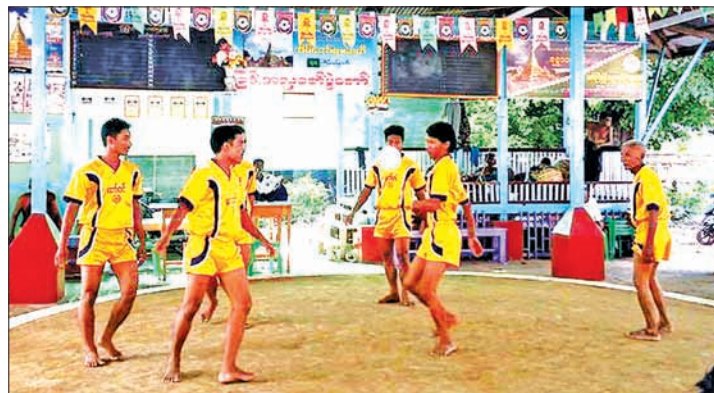
Players perform a chinlone skills demonstration during last year’s competition in Mandalay.