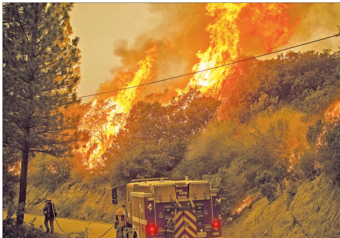
Flames from a backfire tower over a fire engine battling the Butte fire near San Andreas, California September 12, 2015.

SAN ANDREAS — Four firefighters were injured on Saturday in a fast-moving wildfire in Northern California that forced the evacuation of thousands of people, officials said.