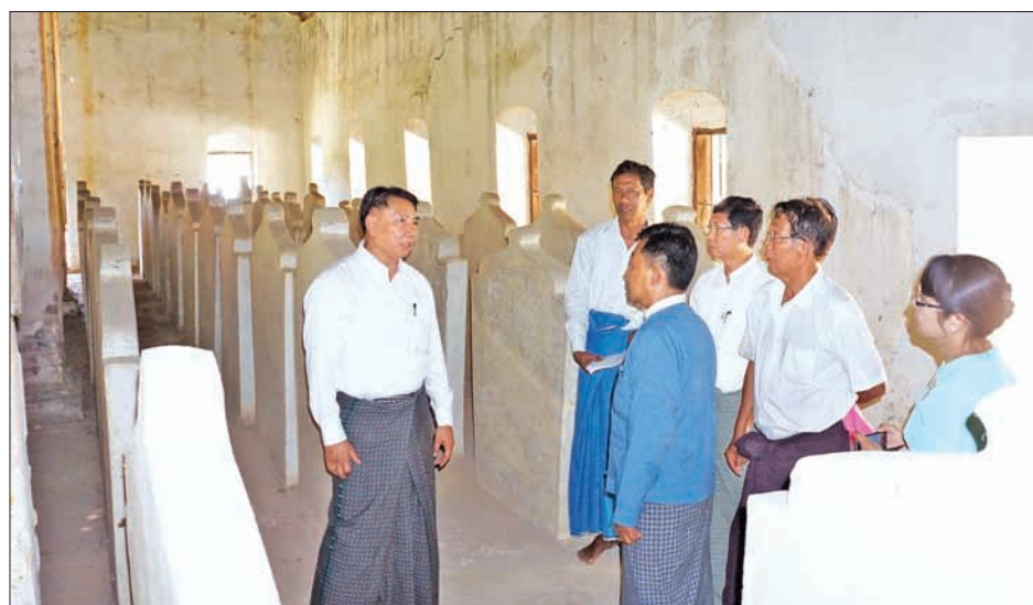
513 stone inscriptions on Buddha's teachings – known as Tri-Pitakat – are being preserved in Nyaungyan village, Thazi Township.—MNA

NAY PYI TAW — Union Minister for Culture U Aye Myint Kyu toured archaeological sites in Myohla village, Yamethin Township, on 12 September.