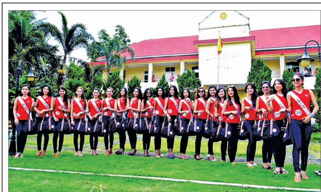
Shortlists of Myanmar’s beauties. The beauties will compete in 3 rd Miss Universe contest. Enthusiasts may vote for them through Facebook, Website and mobile as of 15 September.—By MIN KHIT; PHOTO: MIN HTET

A total of 21 films were screened in competition for the main prizes at the Venice Film Festival, which opened on Sept. 2 with the premiere of the 3D mountain disaster film “Everest”, shown out of competition.—Reuters