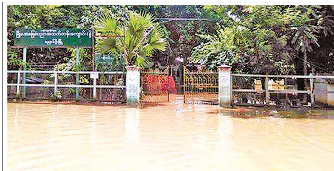
Myoma Basic Education High School (Branch) inundated in Nyaung-U Township.

Township level officials presented prizes to winners in the high and middle school level essay and poem contests. The ceremony was attended by departmental personnel, social organization members, teachers and students totalling about 150.