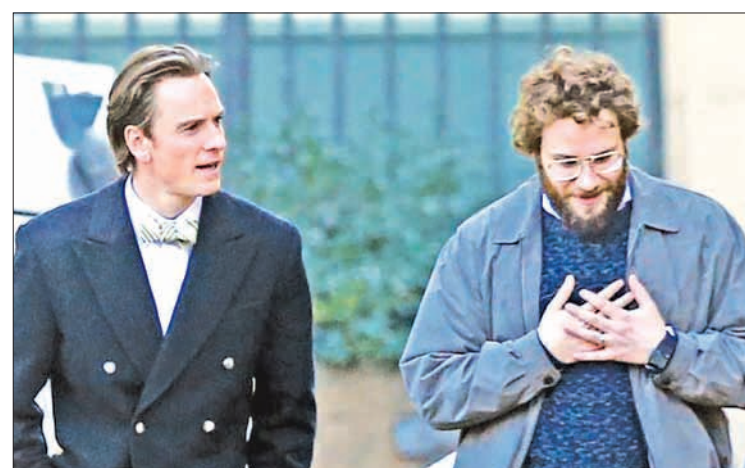
Filmmaker Danny Boyle’s biopic, “Steve Jobs”, based on the late Apple co-founder, will release in New York and Los Angeles theatres on October 9.

“Steve Jobs” premiered at the Telluride Film Festival on September 5 and will play at the New York Film Festival on October 3.