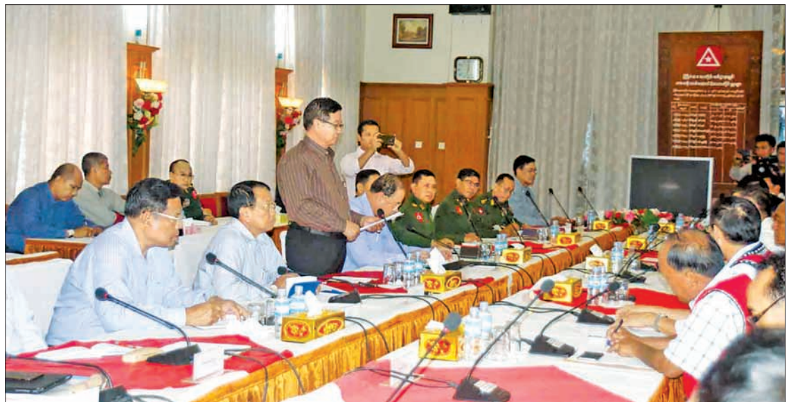
Wa Special Region 2 and Mongla Special Region 4 welcome the nationwide ceasefire agreement.

The peace delegation held out the olive branch to Wa Spe-