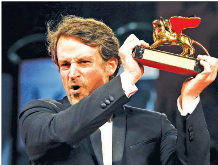
Director Lorenzo Vigas holds the Golden Lion prize for his movie ‘Desde Alla’ (From Afar) during the award ceremony at the 72 nd Venice Film Festival, northern Italy September 12, 2015.

Best director award went to Argentina’s Pablo Trapero for “El Clan” (The Clan), about the real-life Puccio family of kidnapers who operated in Buenos Aires during the 1980s. The runner-up Grand Jury prize went to American director Charlie Kauf-