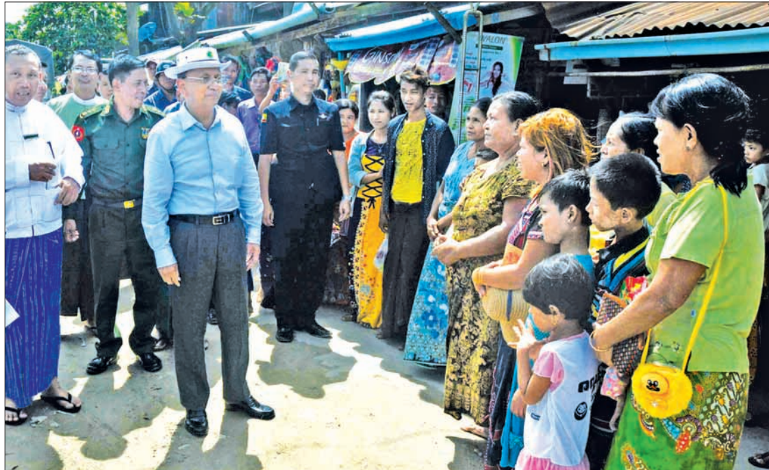
President U Thein Sein cordially meets local residents near Hinthada embankment in Zalun.

NAY PYI TAW — President U Thein Sein inspected flood prevention measures in the town of Aphyauk in Taikkyi Township, Yangon Region, on Sunday.