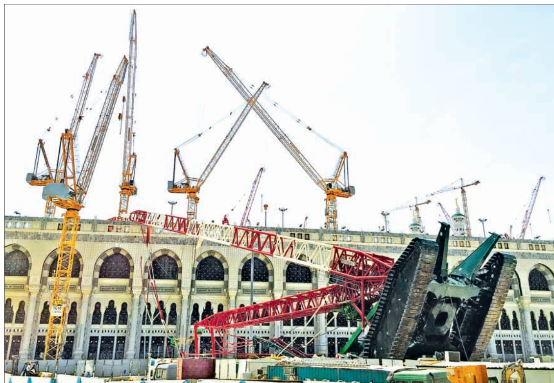
A construction crane which crashed in the Grand Mosque is pictured in the Muslim holy city of Mecca, Saudi Arabia September 12, 2015.

DUBAI — Saudi Arabia said on Saturday that stormy winds knocked over the crane which collapsed onto one of Islam's holiest shrines in Mecca and killed 107 people on Friday.