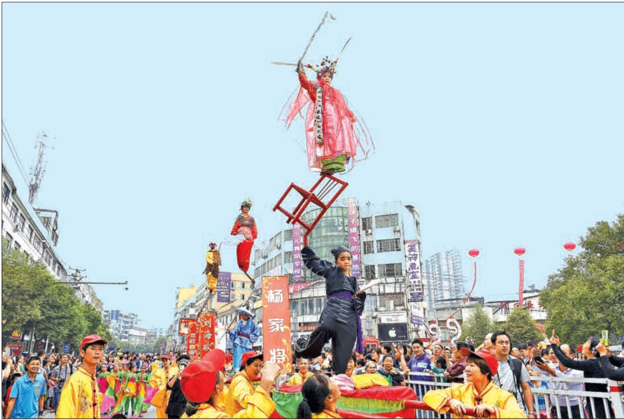
Children in traditional costumes are elevated as they participate in a folk performance during a non-material cultural heritage festival in Longhui county, Hunan province, China, September 13, 2015.