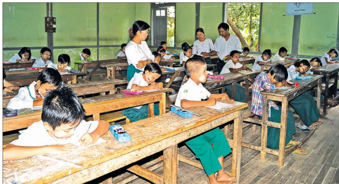
Fourth and fifth grade students in Tatkon Township sit for essay exam organized by Pyinnayasaung Magazine.—TIN SOE LWIN-TATKON IPRD

The magazine conducted the essay contest with the aim of enhancing skills of basic education students.—Tin Soe Lwin-Tatkon IPRD