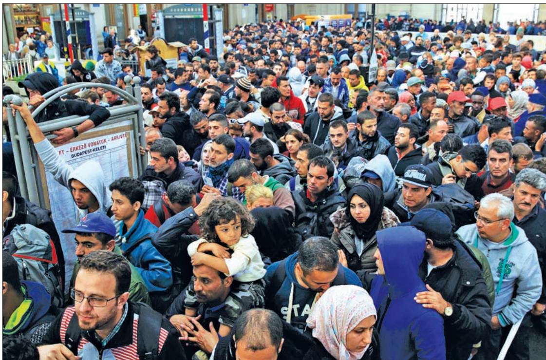
Migrants wait for trains at Keleti station in Budapest, Hungary.

All accommodation in the area of Nickelsdorf, a border town with a reception centre for migrants, was being used and he said he could not predict how many more people would arrive during the day.—Reuters