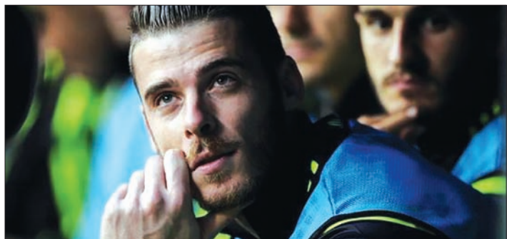
Spain’s goalkeeper David De Gea.

Arsenal, whose fans have vented their frustrations since the close of the transfer window after boss Arsene Wenger made no outfield signings, host Stoke City (1400) who have claimed just two points from their first four games.—Reuters