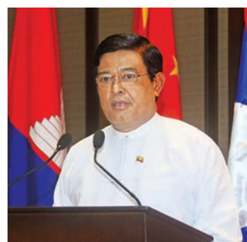
Vice President U Nyan Tun.

Forty local and foreign companies have been permitted to invest in the SEZ, with Japan topping the list, followed by Thailand. Companies from Japan, Chi-