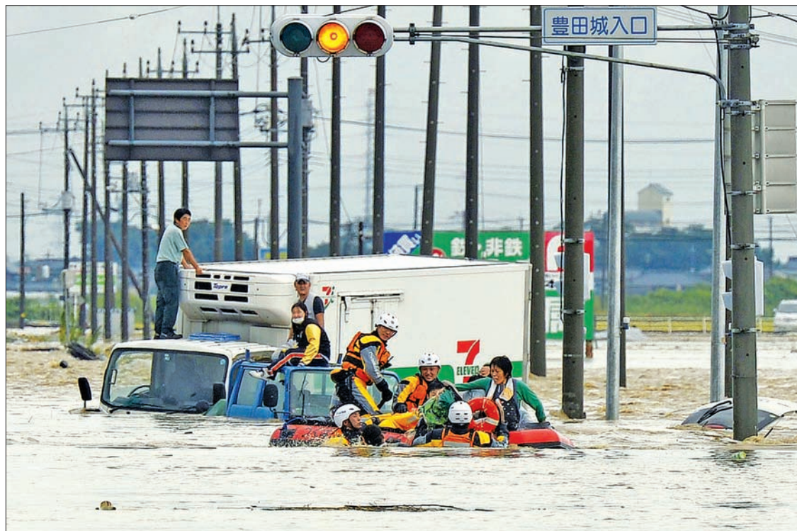
People are rescued from vehicles by firefighters at an area flooded by the Kinugawa river, caused by typhoon Etau, in Joso, Ibaraki prefecture, Japan.—KYODO NEWS

Part of a hotel in the town of Nikko, famed for its shrines and temples, had collapsed, the Kyodo news agency said, but there were no reports of injuries.—Reuters