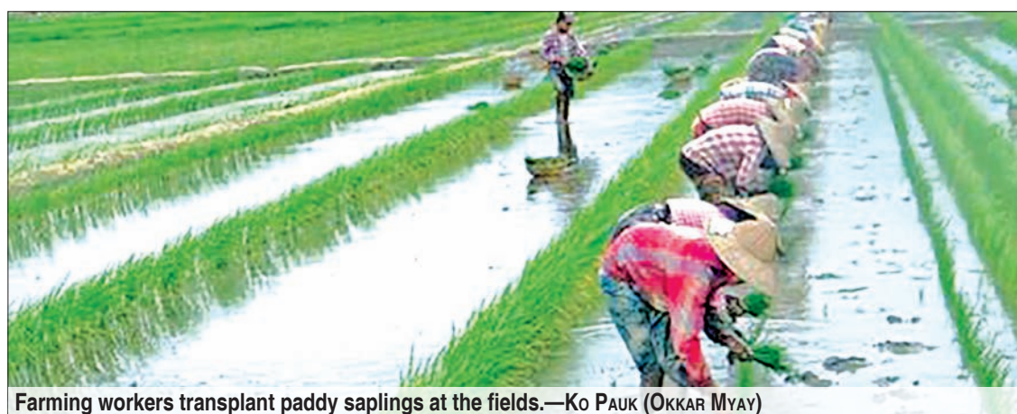
Farming workers transplant paddy saplings at the fields.—Ko PAUK (OKKAR MYAY)

NAY PYI TAW — The Department of Agriculture began cultivating rice paddies on a 3,000-acre field in Dekkhinathiri Township on 9 September. The paddies will produce Paletwe hybrid rice seeds.