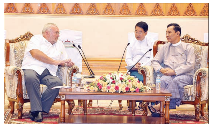
Speaker Thura U Shwe Mann receives delegates of Club de Madrid.

NAY PYI TAW — Pyithu Hluttaw Speaker Thura U Shwe Mann received a delegation of the Club de Madrid comprising former prime minister of Bhutan Jigme Yoser Thinley and the former