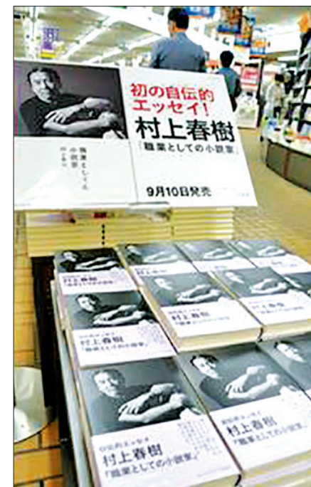
Copies of the new essay "Shokugyo toshiteno Shosetsuka" (Novelist as a Profession) by novelist Haruki Murakami.

"That's such a huge thing that my little modest film is not competing with any of those aspects," he said.