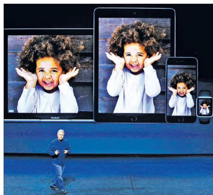
Phil Schiller, Senior Vice President of Worldwide Marketing at Apple Inc, speaks about the live photo capability for new iPhone 6s and iPhone 6s Plus during an Apple media event.

"We've been working really hard, and really long," on TV, Cook said, emphasizing the word 'long' in a nod to the time it has taken the company to produce an ambitious TV product.