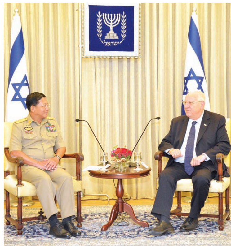
Senior General Min Aung Hlaing holds talks with Israeli President Reuven Rivlin.

After his meeting with the president, the Myanmar delegation toured Jerusalem's Old City in a motorcade.—Myawady