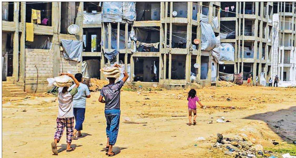
Displaced Syrian families gather to collect relief aid from humanitarian organisations at the battered district of Hamadaniyeh, Aleppo, northern Syria.

BEIRUT — Dozens of Syrian government troops and Islamic State fighters have been killed in fighting around a government-held air base in eastern Syria in a region that is a stronghold for the jihadists, a monitoring group said on Thursday.