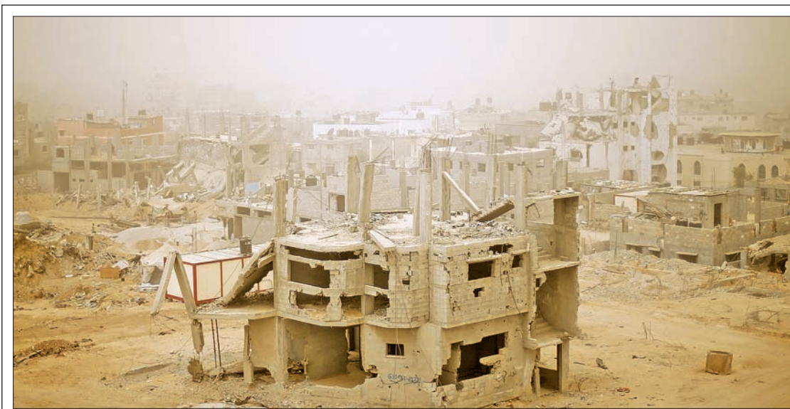
A general view shows ruins of houses that witnesses said were destroyed by Israeli shelling during a 50-day war in the 2014 summer, during a sandstorm in Gaza September 9, 2015. The heavy sandstorm swept across parts of the Middle East on Tuesday, killing two people and hospitalising hundreds in Lebanon and disrupting fighting and air strikes in neighbouring Syria. Clouds of dust also engulfed Israel, Jordan and Cyprus where aircraft were diverted to Paphos from Larnaca airport as visibility fell to 500 metres.—REUTERS

Last week, after Obama secured enough Democratic senators' votes to block a Republican initiative to foil the deal, Netanyahu charged that the majority of the US public objects to the agreement.—Xinhua