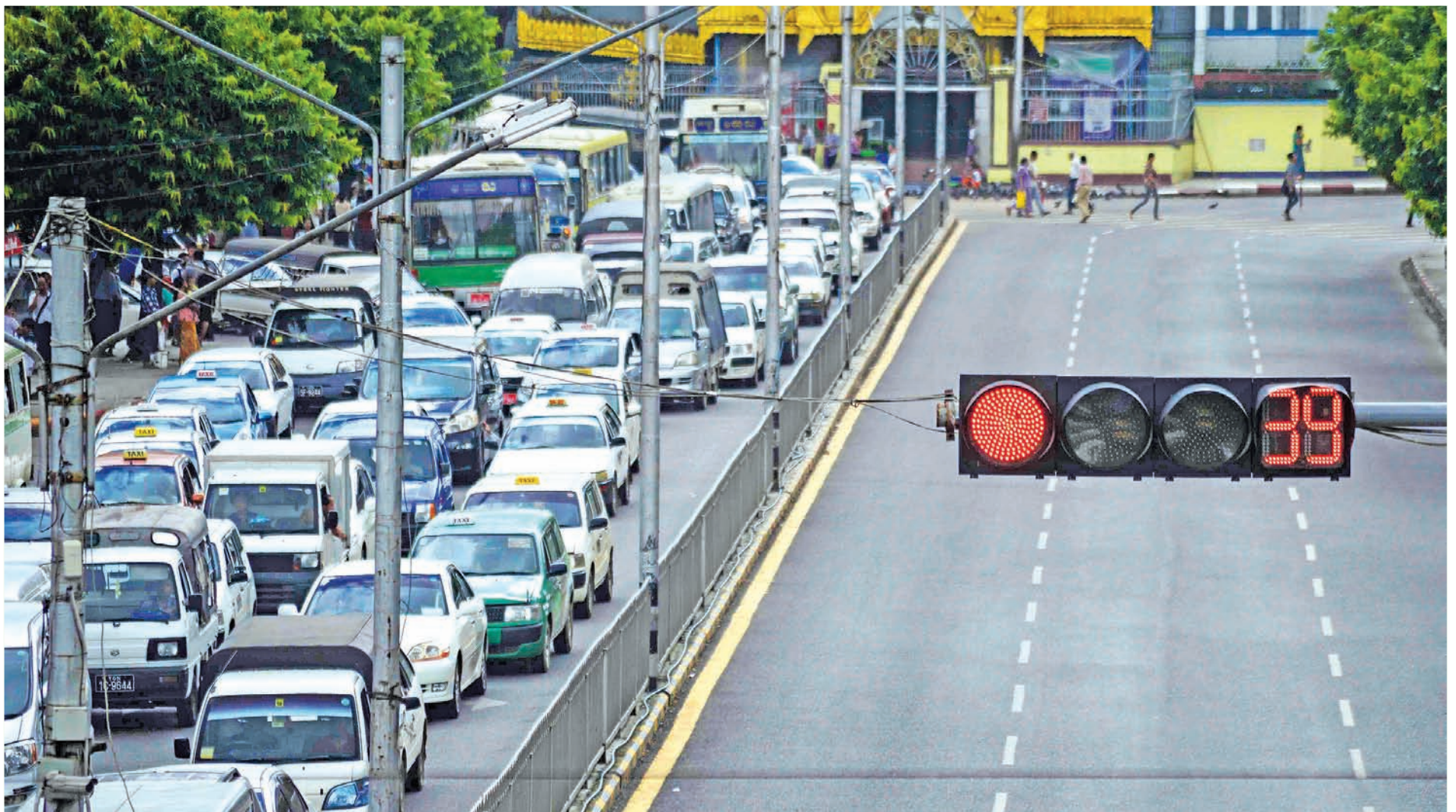
Yangon's traffic lights will be upgraded to ease congestion in the country's commercial capital.