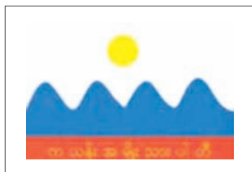
Emblem of Kayan National Party (KNP).

NAY PYI TAW — Campaign speeches from three political parties were broadcast on Thursday.