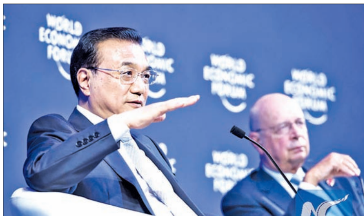
Chinese Premier Li Keqiang exchanges views with Klaus Schwab, founder and executive chairman of the World Economic Forum (WEF).

DALIAN — Chinese Premier Li Keqiang called for stronger international cooperation in production capacity in order to solve structural problems in global growth on Thursday.