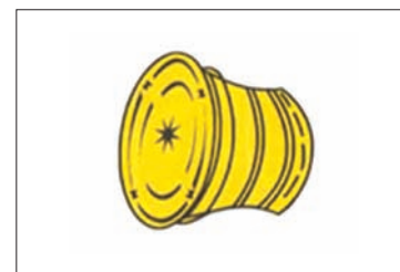
Emblem of Kayin People's Party.