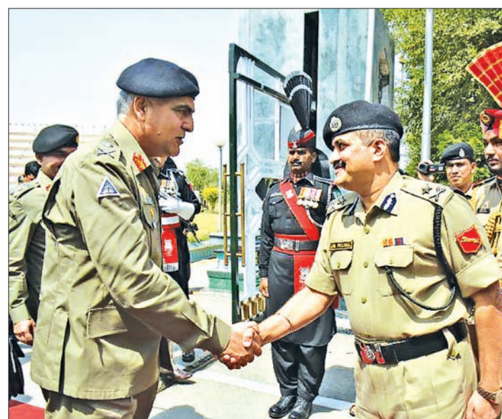
Pakistan Rangers' Director General, Maj. Gen. Umar Farooq Burki (L) shaking hands with Indian Border Security Force (BSF) Inspector General (IG) Anil Paliwal at Pakistan's side of Wagah border.—XINHUA

This is the first security-level meeting between India and Pakistan, a fortnight after the national security advisor-level peace talks between the two countries collapsed following a dispute over the agenda for those talks.—Xinhua