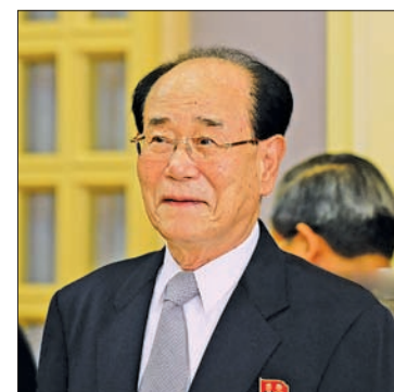
North Korea's ceremonial head of state Kim Yong Nam.

Pyongyang has so far not given it any convincing information on the abduction issue.