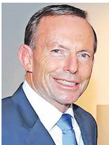
Australian Prime Minister Tony Abbott.

"So, I think I've got a very good story to tell on climate