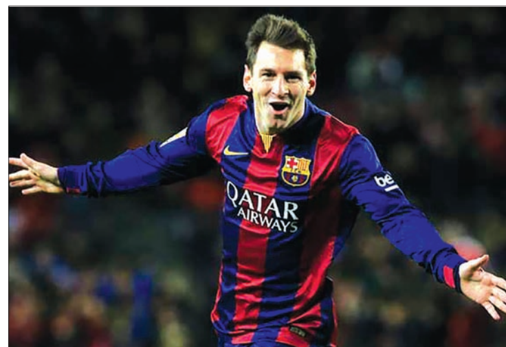
Argentinian soccer star Lionel Messi.

“First are the World Cup 2018 Russia Qualifiers. We need to start well because afterwards