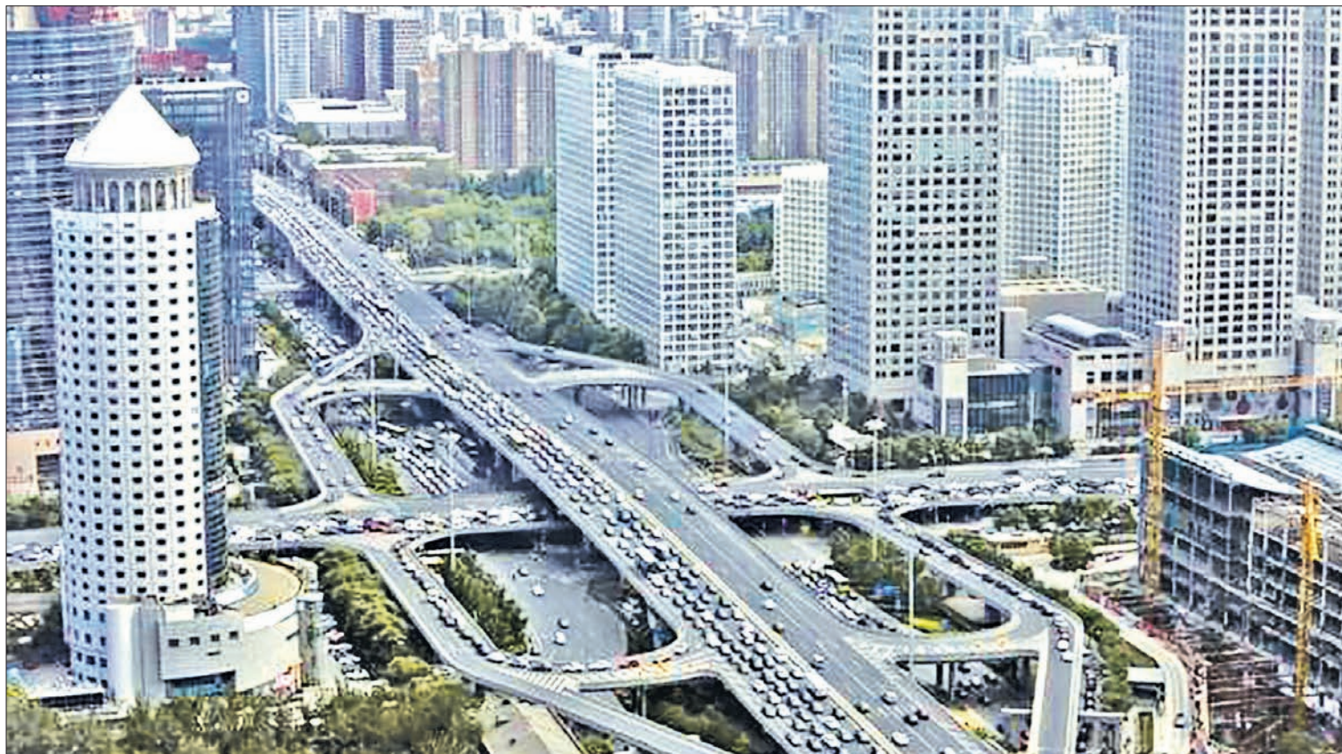
Vehicles drive on the Guomao Bridge through Beijing's central business district.