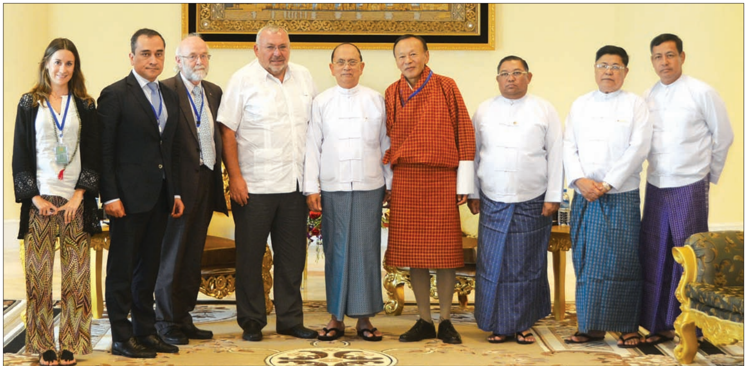
President U Thein Sein poses for documentary photo with former prime minister of Bhutan Jigme Yoser Thinley and the former chancellor of Austria Mr Alfred Gusenbauer and party.

Also present at the meeting were union ministers U Wunna Maung Lwin, U Soe Thane and U Ye Htut.