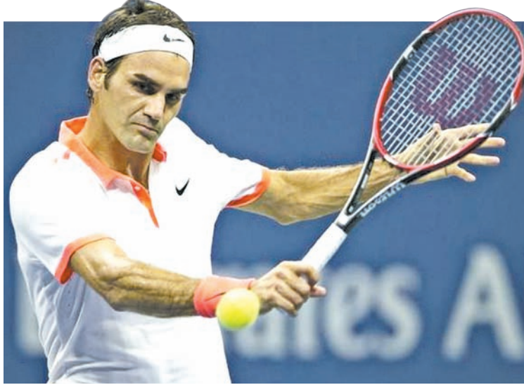
Roger Federer of Switzerland returns a shot to Richard Gasquet of France during their quarterfinals match at the US Open Championships tennis tournament in New York, September 9, 2015.

ROGER FEDERER and Stan Wawrinka shrugged off the threat of rain to storm into the US Open semi-finals on Wednesday, while Simona Halep stood up for the younger generation to complete a women's final four that will feature three thirtysomethings.