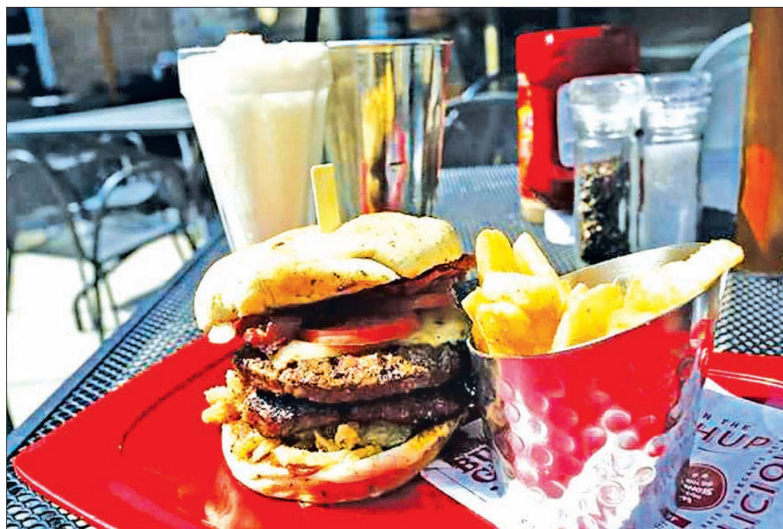
A meal of a “Monster”-sized A.1. Peppercorn burger, Bottomless Steak Fries, and Monster Salted Caramel Milkshake at a Red Robin restaurant.

NEW YORK — New York City health officials unanimously voted on Wednesday to require chain restaurants to add a warning label to menu items that contain more than the daily recommended amount of sodium, making it the first city in the United States to do so.