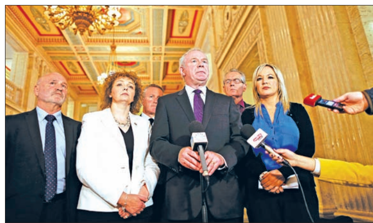
Sinn Féin's Martin McGuinness (C) speaks to the media in Parliament buildings in Belfast Northern Ireland.

DUBLIN — The fate of Northern Ireland's power-sharing government was hanging in the balance on Thursday as the province's second largest Irish nationalist party mulled whether to back a call to adjourn parliament during crisis talks.