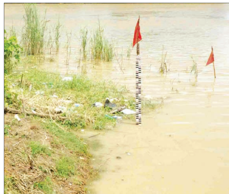
Water level of Ayeyawady River gradually rising at Hinthada Township.