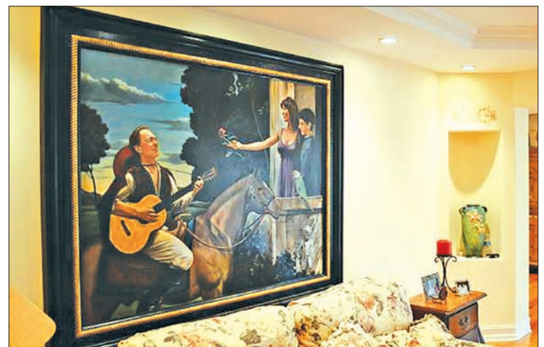
A painting former TV star and teen idol David Cassidy commissioned showing him serenading his young family while on horseback hangs in a living room of the 7,000 square-foot, five-bedroom waterfront house that is up for auction.