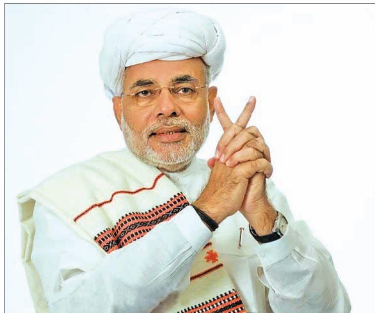
Indian Prime Minister Narendra Modi

NEW DELHI — Indian Prime Minister Narendra Modi on Thursday hit back at the country's main opposition Congress party chief Sonia Gandhi, barely two days after she accused him of making hollow promises.