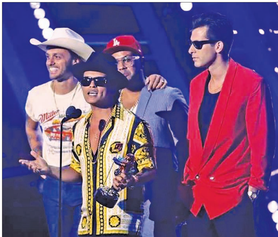
Mark Ronson (R) and Bruno Mars (holding trophy) accept the award for best male video for "Uptown Funk" at the 2015 MTV Video Music Awards.

Mars, whose song "Uptown Funk!" with producer Mark Ronson has been one of the hits of this summer, brought rockers Red Hot Chili Peppers to join