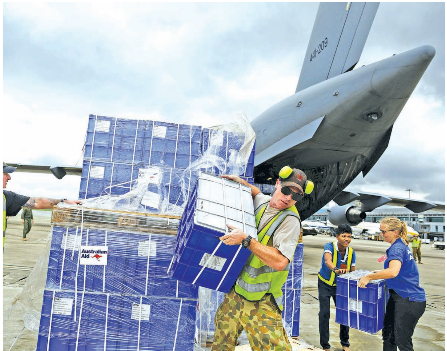
Air crew and volunteers unload aid from a Royal Australian Air Force (RAAF) transport plane carrying donated aid for Myanmar's flood victims at Yangon international airport in Yangon on August 10, 2015.