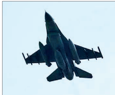
A Turkish F-16 fighter jet takes off from Incirlik airbase in the southern city of Adana, Turkey, in this July 27, 2015 file photo.

DIYARBAKIR (Turkey) — Dozens of Turkish warplanes struck militant Kurdistan Workers Party (PKK) targets in northern Iraq overnight, killing tens of the group's fighters, a security source told Reuters on Tuesday.