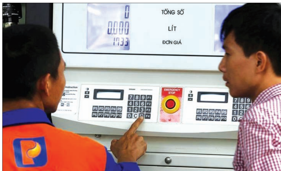
An employee keys in the price of petrol at a pump at a petrol station in Hanoi, Vietnam September 3, 2015.

SINGAPORE — Oil prices stabilized at low levels on Tuesday as strong German economic data countered Asia's darkening outlook that continues to clash with a global supply glut.