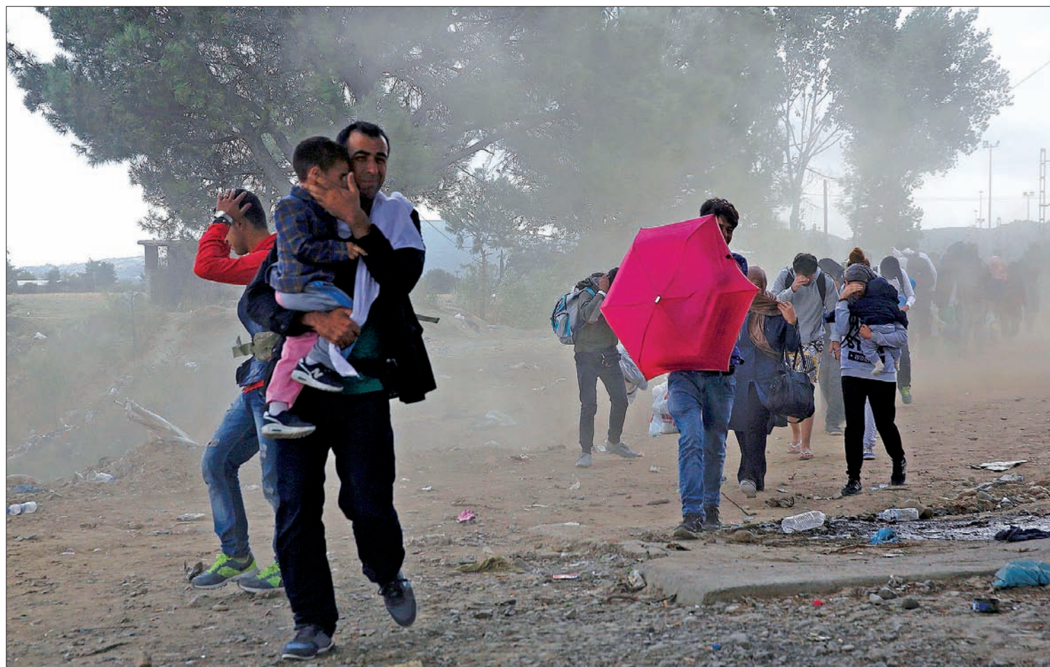
Syrian refugees try to protect themselves from gusts of wind and dust as they cross Greece's border with Macedonia, near the Greek village of Idomeni, September 8, 2015.

Coping with an economy already stretched close to breaking point, Greek authorities on Monday asked the European Union to help tackle the crisis on Lesbos by activating its crisis-response body to provide staff, medical and pharmaceutical supplies, clothes and equipment. Greece has also applied for 9.6 million euros ($10.7 million) in emergency EU funding.—Reuters