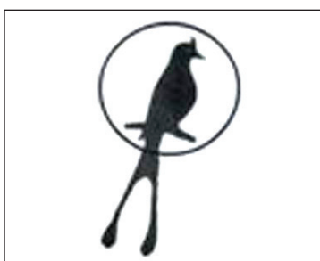
Emblem of Mro Ethnic Development Party.—mna

YANGON—The Mro Ethnic Development Party, National Unity Party and Lahu National Development Party launched television campaigns on Tuesday.