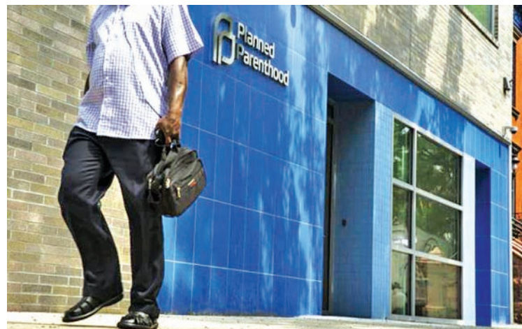
A man walks past the entrance to a Planned Parenthood building in New York August 31, 2015.

NEW YORK — Angered by videos in which Planned Parenthood officials discussed compensation for providing fetal tissue from abortions, Republicans in Congress are again demanding an end to government funding for the nearly 100-year-old provider of women's health services.