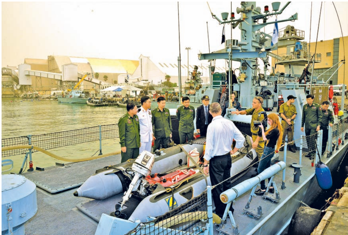
Senior General Min Aung Hlaing visits FAC Super Dovra MK3 vessel.

NAY PYI TAW—Commander-in-Chief of Defence Services Senior General Min Aung Hlaing visited Ashdod Naval Base in Israel on 8 September.