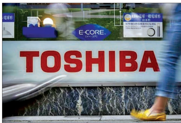
Pedestrians walk past a logo of Toshiba Corp outside an electronics retailer in Tokyo, Japan, June 25, 2015.

The accounting probe found in July that Toshiba suffered from dysfunctions in governance and a culture of discouraging employees from questioning their superiors, prompting previous CEO Hisao Tanaka and sev-