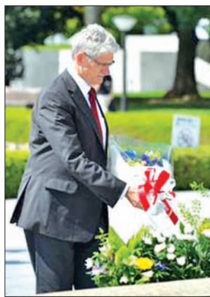
Mogens Lykketoft, president-elect of the UN general assembly, places flowers at the Cenotaph for the A-bomb Victims in the atomic-bombed city of Hiroshima on Sept. 8, 2015.

HIROSHIMA — Mogens Lykketoft, president of the upcoming 70th session of the UN General Assembly, on Tuesday visited the city of Hiroshima, devastated by a US atomic bomb in 1945, before the session begins next week.