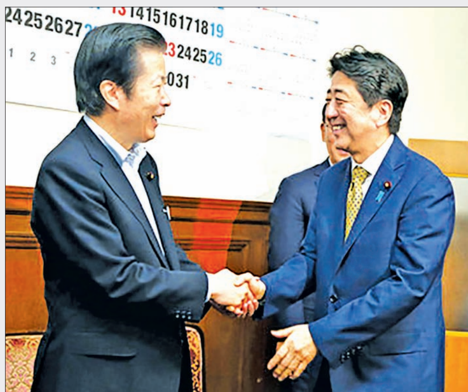
Prime Minister Shinzo Abe (R) shakes hands with Natsuo Yamaguchi, leader of the Komeito party, the junior ruling coalition partner of the Liberal Democratic Party, at the Diet building in Tokyo on Sept. 8, 2015. Abe was re-elected unopposed as president of the LDP earlier in the day.

Ruling and opposition lawmakers said a challenge by Noda could have hampered Diet debate on controversial security bills