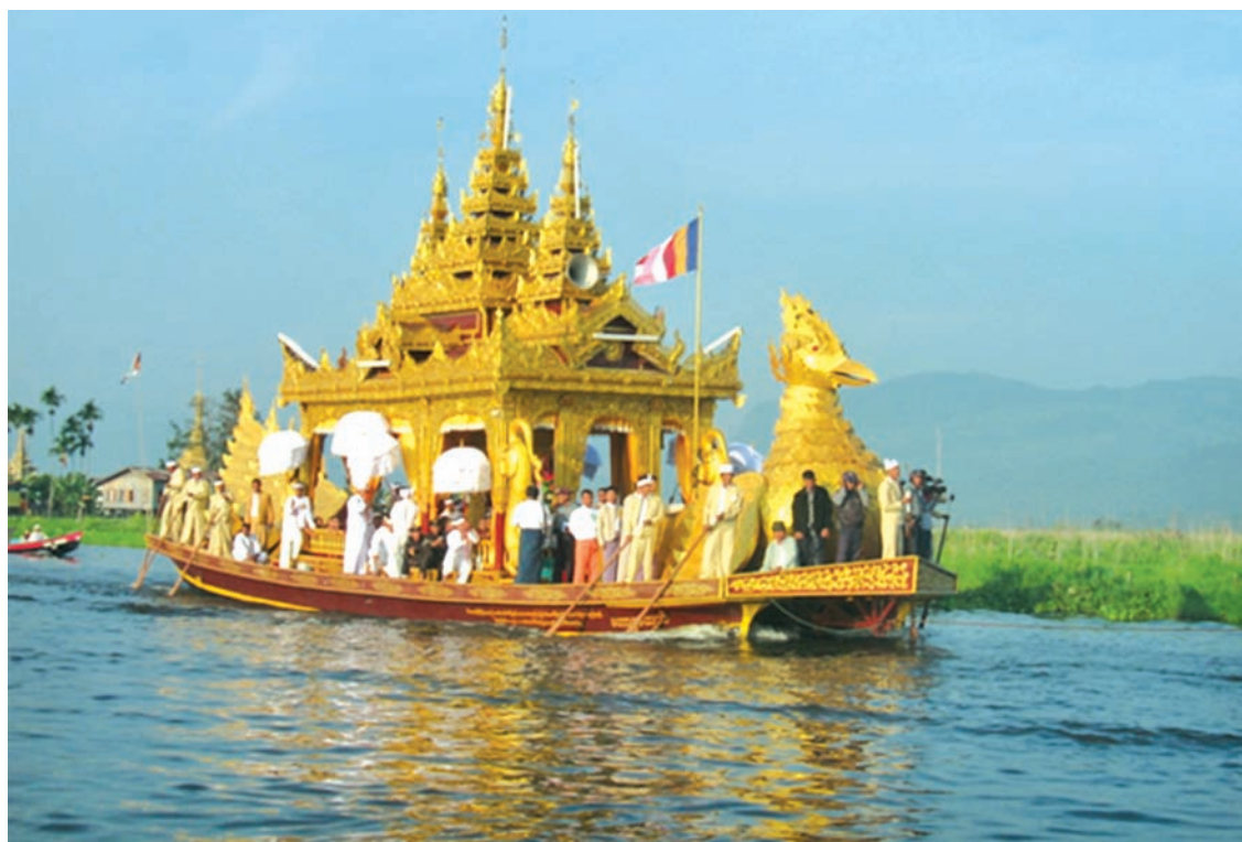
Buddha Images of Phaungdaw-U Pagoda being conveyed on waterway of Inlay Lake.

NYAUNGSHWE— The four sacred Buddhist images from Phaungdaw-U Pagoda in Nyaungshwe, Shan State, will begin their annual tour of the lake from October 14.