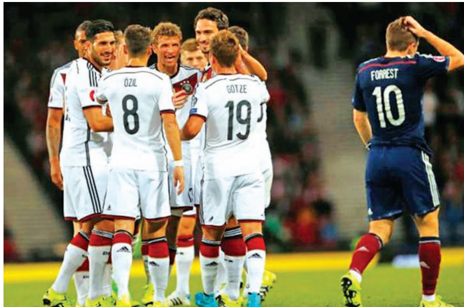
Football - Scotland v Germany - UEFA Euro 2016 Qualifying Group D - Hampden Park, Glasgow, Scotland - 7/9/15 Thomas Muller celebrates with team mates after scoring the first goal for Germany.

The 25-year-old Mueller set up the winner, cutting the ball back for Ilkay Guendogan to fire in off the post in the 54th minute. "Thomas has had a great run and he is always where the striker has to be, in the five-metre area," coach Joachim Loew told reporters. "We gave the same performance as we did against Poland. We wanted the six points from these two games, now we play in Ireland and at home against Georgia."—Reuters