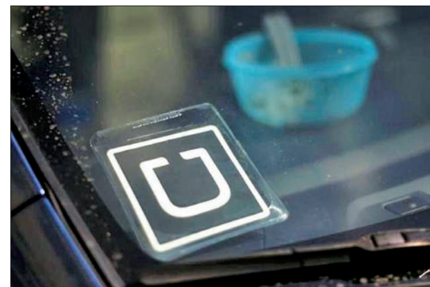
An Uber car is seen parked with the driver's lunch left on the dashboard in Venice, Los Angeles, California, United States July 15, 2015.

BEIJING — US ride-hailing service Uber Technologies Inc [UBER.UL] will enter 100 more Chinese cities over the next year, doubling a previous goal set just three months ago, Chief Executive Travis Kalanick said on Tuesday.