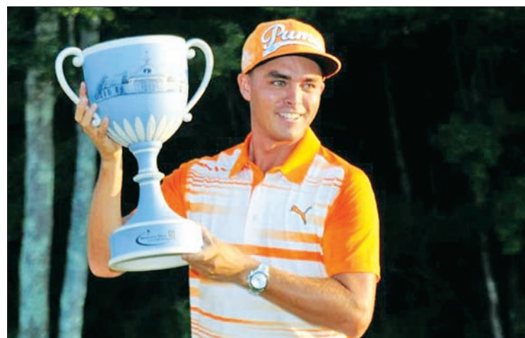
Sep 7, 2015; Norton, MA, USA; Rickie Fowler holds the Deutsche Bank Championship trophy after winning the tournament at TPC of Boston.

Unlike his late-round birdie binges at the Players Championship and Scottish Open, a steady bogey-free back nine got the job