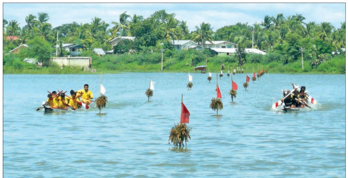
Rowers vigorously competing in boat race in Meiktila Lake.—Chan Thar (Meiktila)

MEIKTILA — Preparations are in full swing for the 10-day Phaungdaw-U Pagoda festival in Meiktila in Mandalay Region, which will take place from September 21-30.