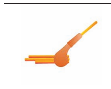
Emblem of Lahu National Development Party.—MNA

The Mro Ethnic Development Party explained that it changed its name from Khami National Organisation (Party),