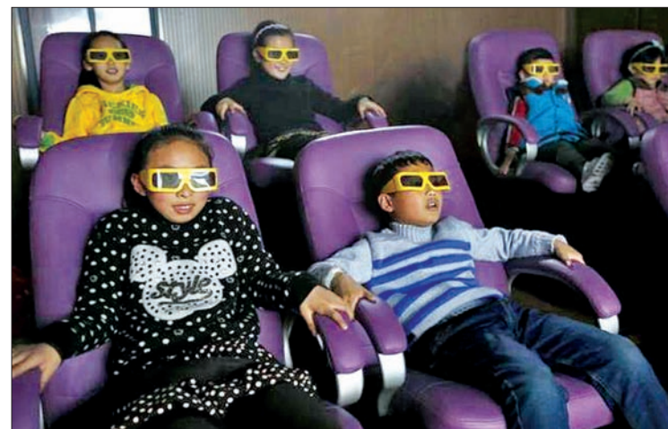
Children watch a 3D war movie at a community theatre in Hefei, Anhui province, March 29, 2015. Picture taken March 29, 2015.

China’s box office lure has also led some studios to remove scenes from their films and add characters to help get past censors and appeal more to a Chinese market, stoking concerns of self-censorship.—Reuters