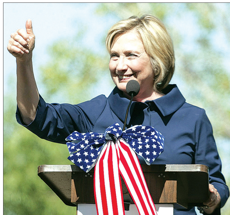
US Democratic presidential candidate Hillary Clinton speaks during a campaign stop at the Quad City Federation of Labor's Salute to Labor Chicken Fry in Hampton, Illinois September 7, 2015.

While Clinton remains the frontrunner for the Democratic nomination, edging out Sanders 46 percent to 24 percent in a five-day rolling poll dated September 4 by Reuters/IPSOS, the progressive senator has been eating away at her lead. In an NBC News/Marist Poll released on Sunday, 41 percent of Democratic voters in New Hampshire would back Sanders while 32 percent would cast a vote for Clinton if the poll were held today and Vice President Joe Biden were on the ballot.—Reuters