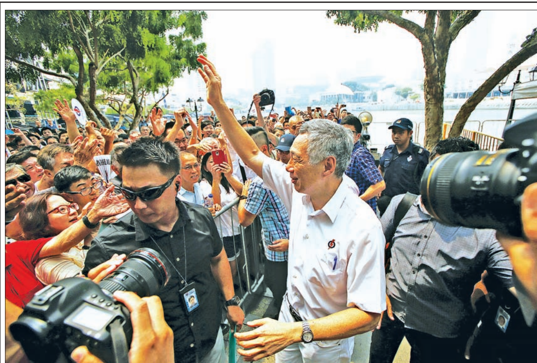
Secretary-General of the ruling People's Action Party (PAP) Lee Hsien Loong greets supporters after a lunchtime rally at the central business district in Singapore September 8, 2015. Singaporeans will go to the polls on September 11.

Printed and published at the Global New Light of Myanmar Printing Factory at No.150, Nga Htat Kyee Pagoda Road, Bahan Township, Yangon, by the Global New Light of Myanmar Daily under Printing Permit No. 00510 and Publishing Permit No. 00629.