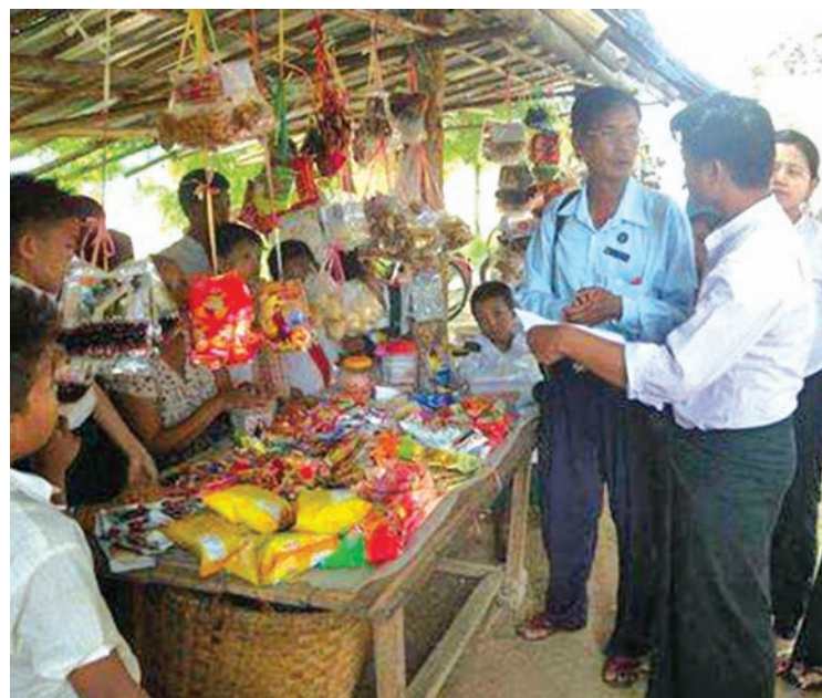
Township officials check shops on sales of inappropriate foods. TOWNSHIP IPRD

Department representatives also warned against eating packaged food that has passed its expiry date and explained the rights and protections afforded by consumer protection laws.—Township IPRD