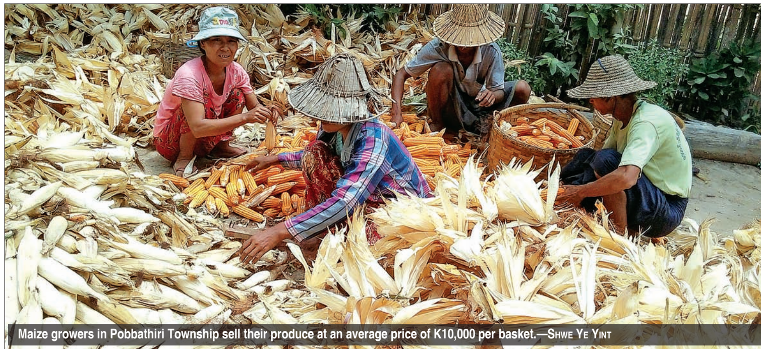
Maize growers in Pobbathiri Township sell their produce at an average price of K10,000 per basket.

POBBATHIRI — Farmers from Phwaotkway Village in Pobbathiri Township are in the process of preparing maize to be sold at upcoming markets in Pyinmana and Tatkon.