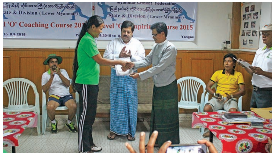
An official of Myanmar Cricket Federation presents completion certificate to a trainee in coaching and umpiring course for cricket sports.—TUN AUNG KYAW

MCF launched the same course in Upper Myanmar in May this year and will continue to provide annual cricket courses for youths.—GNLM