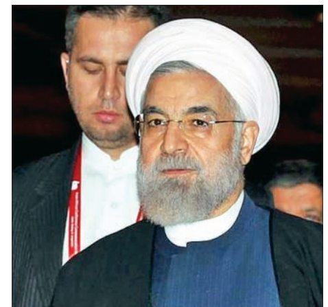
Iran's President Hassan Rouhani

"If one day Syria is more secure, that will be in the interest of the whole region and the world," he said.—Reuters