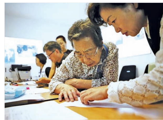
A woman who said she has family members living in North Korea gets help to prepare documents for reunion at the Red Cross building in Seoul, South Korea, September 8, 2015.

Nearly 130,000 South Koreans looking for family