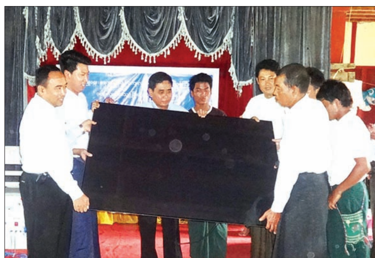
Officials hand over solar panels to local residents for electrification.

The solar panels will be used by communities in Aungmyeya, Lema and Minpyin villages and the panels will be installed by Thado Aung Zeya Company.