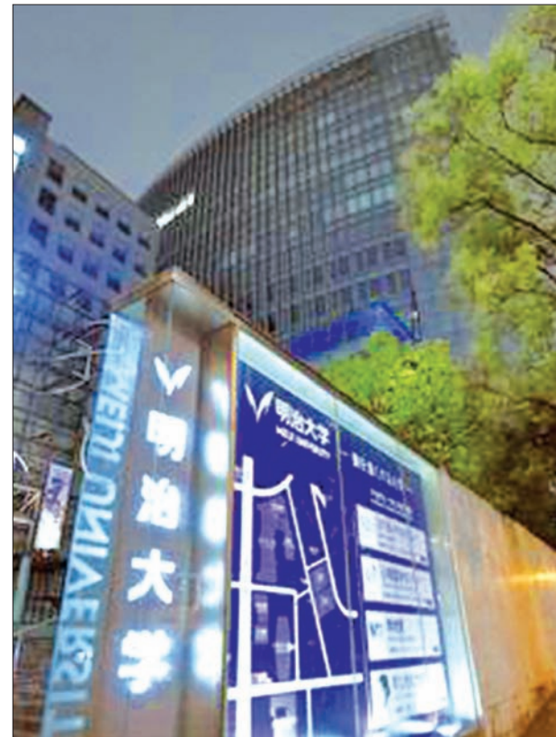
Photo taken in Tokyo on Sept. 7, 2015, shows Meiji University, where a law school professor is suspected of having leaked questions for the 2015 national bar examination to one of his former students.

have lectured to his students on subjects similar to those chosen for the national test. The incident led to reform of the test preparation process, barring question-preparing professors from teaching their students for certain periods.