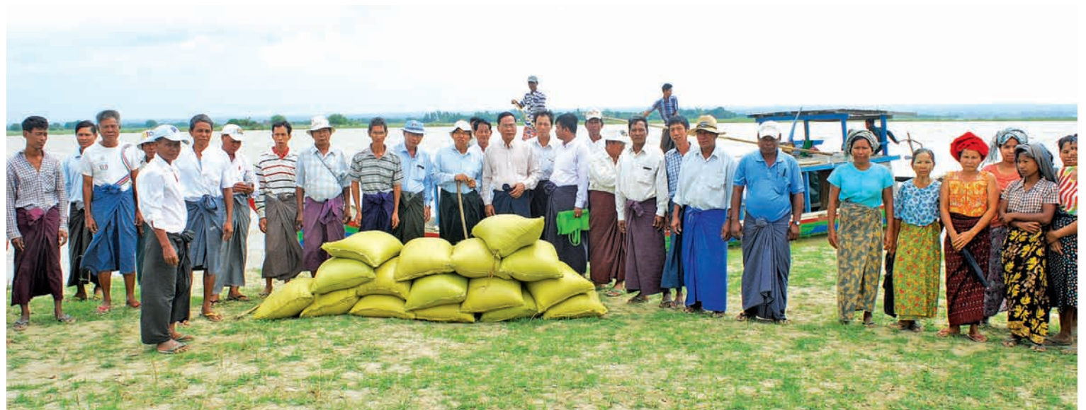
Local residents seen with bags of rice for their rehabilitation in Minbu Township.

MINBU — Well-wishers and officials of Township Development Supporting Committee on 2 September provided 50 bags of rice and clothes to residents from the villages that faced erosion