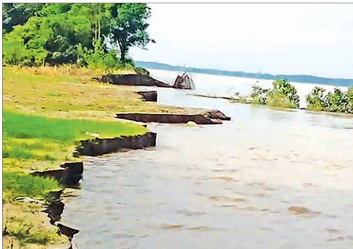
Ayeyawady River eroding bank in Kyangin Township.