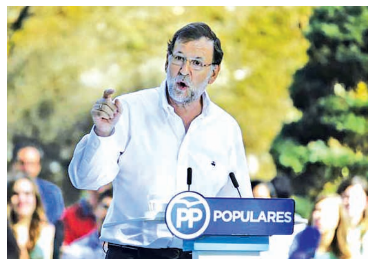
Spain's Prime Minister Mariano Rajoy speaks during the opening of a political event of the ruling Popular Party (PP) at a castle in the Galician village of Soutomaior, northern Spain, August 30, 2015.—REUTERS

Catalan President Arturo Mas has scheduled regional elections for Sept. 27, portraying them as a proxy vote on independence after Rajoy's government went to court last year to block a referendum on the north-eastern region breaking away from Spain.—Reuters