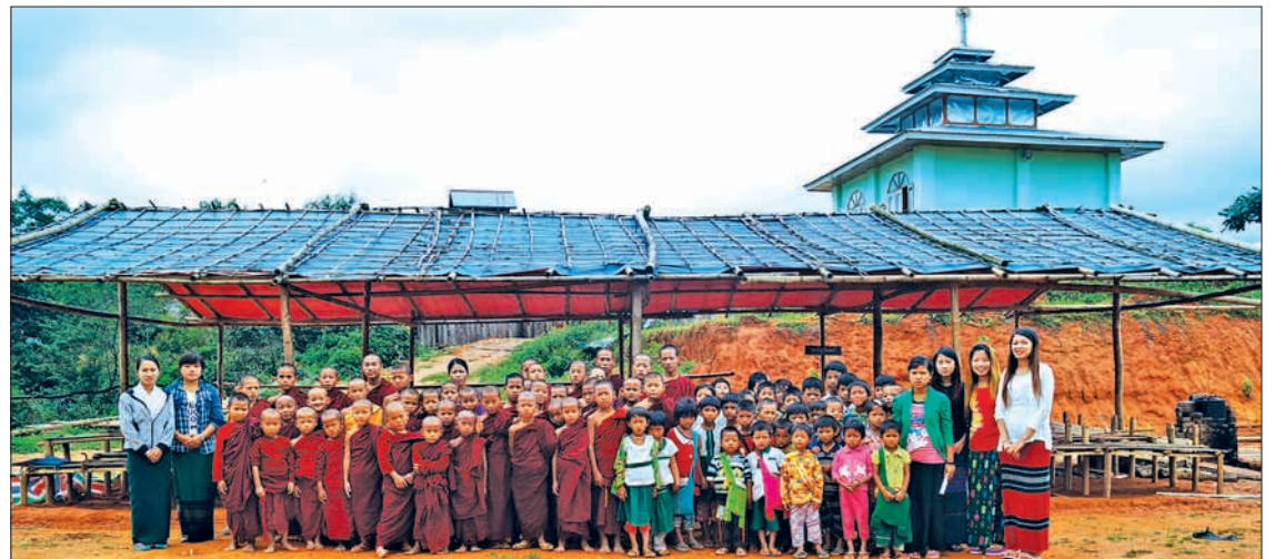
Teachers and students from monastic education school seen in a group photo.

MANTONG — A monastic education school was opened at Aungchantha Mantauk Monastery on 31 August in Mantong Township in the Palaung Self-Administered Zone in Shan