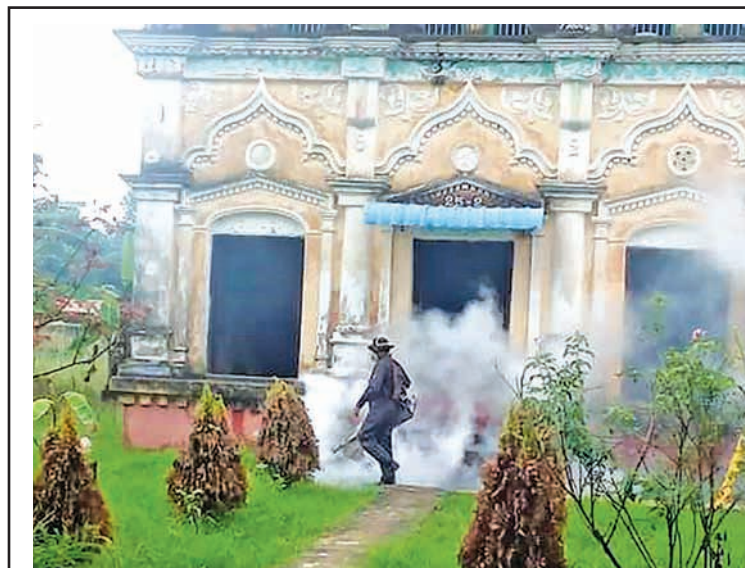
A volunteer of Thai medical team spraying building.— WIN BO

A total of 353 households in low areas of the township were inundated and 1,803 flood victims are sheltering in a camp with assistance of accommodation and foods at the town's Myatheintan Pagoda.— District IPRD