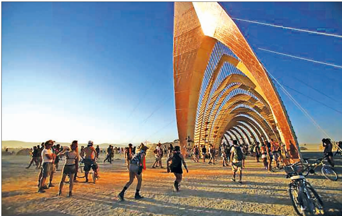
Light is reflected from the Temple of Promise August 31, 2015.

NEVADA — The annual Burning Man counterculture festival now taking place in a Nevada desert is known for attracting scantily clad revelers, bike lovers, artists, musicians and as it turns out, even attention from the FBI.