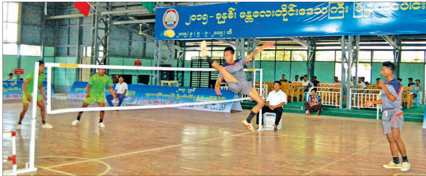
Youth teams attacking each other in double regu event of inter-township Sepak Takraw Tournament.—TIN MAUNG (MANDALAY)

MANDALAY—Youths in Mandalay Region have been taking part in the Inter-Township Sepak Takraw Tournament 2015 at Bahtoo Gymnasium since 1 September.