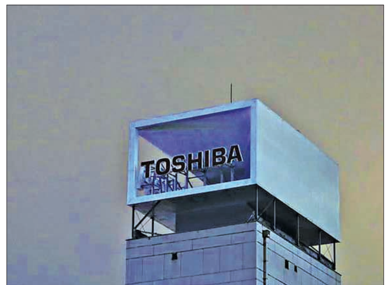
The logo of Toshiba Corp is pictured at its headquarters in Tokyo, Japan, August 31, 2015.—REUTERS

The Yomiuri said there was still a possibility that Toshiba could miss the Sept. 7 deadline if further irregularities are found.—Reuters