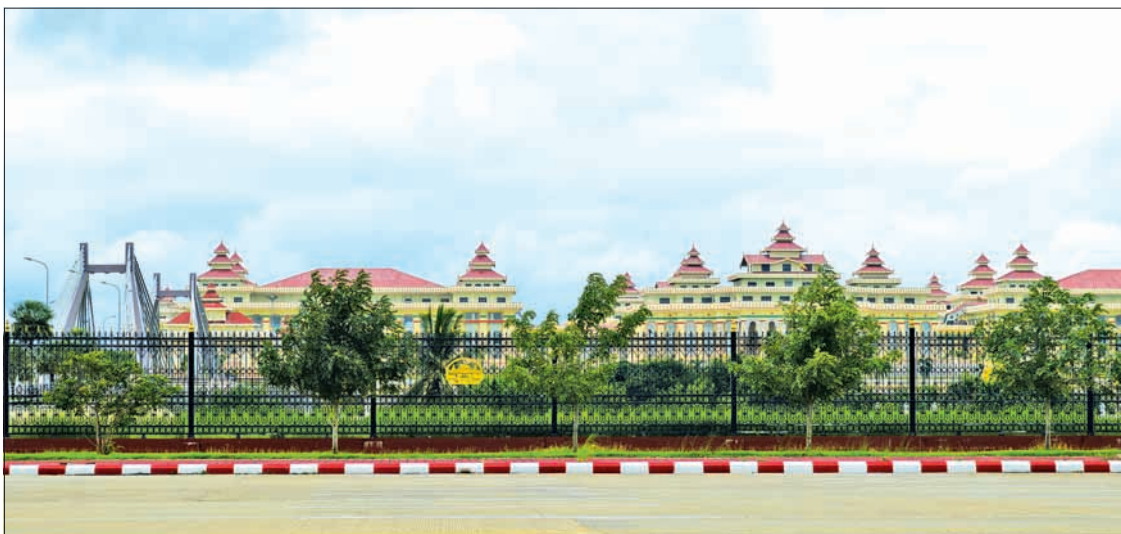
Nay Pyi Taw's parliamentary complex. The Nationalities Brotherhood Federation, an alliance of ethnic minority political parties, will field 710 candidates in the 2015 general elections, with an aim to ensure greater representation in the 2016 Parliament.

According to preliminary candidate lists announced by the Union Election Commission last month, 93 political parties will field 5,866 candidates in 330 constituencies across the country.—GNLM