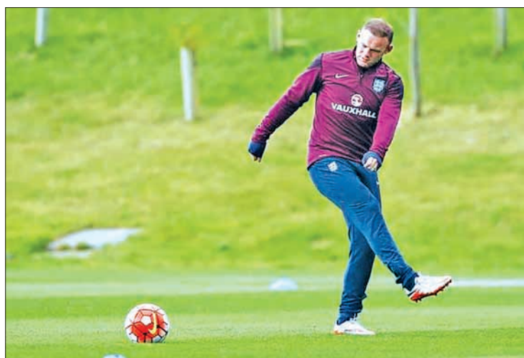
England Training - St. George's Park - 2/9/15 - England's Wayne Rooney during training.

"For me he is the best English player in England," Shelvey told a news conference at England's training base at St George's Park in the Midlands.