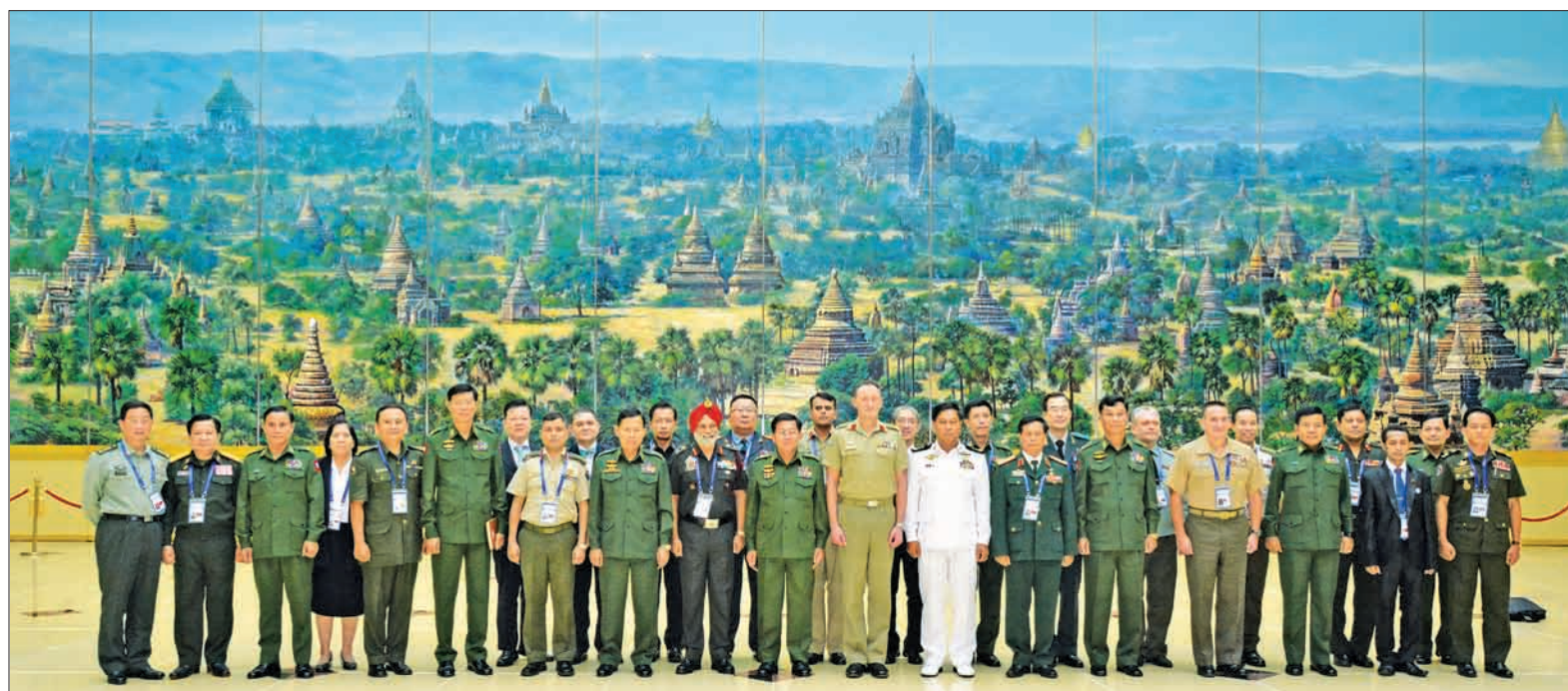
Senior General Min Aung Hlaing poses for documentary photo with heads of Defense Universities, Colleges and Institutions from 21 countries.

NAY PYI TAW—During a meeting with the heads of Defense Universities, Colleges and Institutions from 21 countries in Nay Pyi Taw on Thursday, Commander-in-Chief of Defence Services Senior