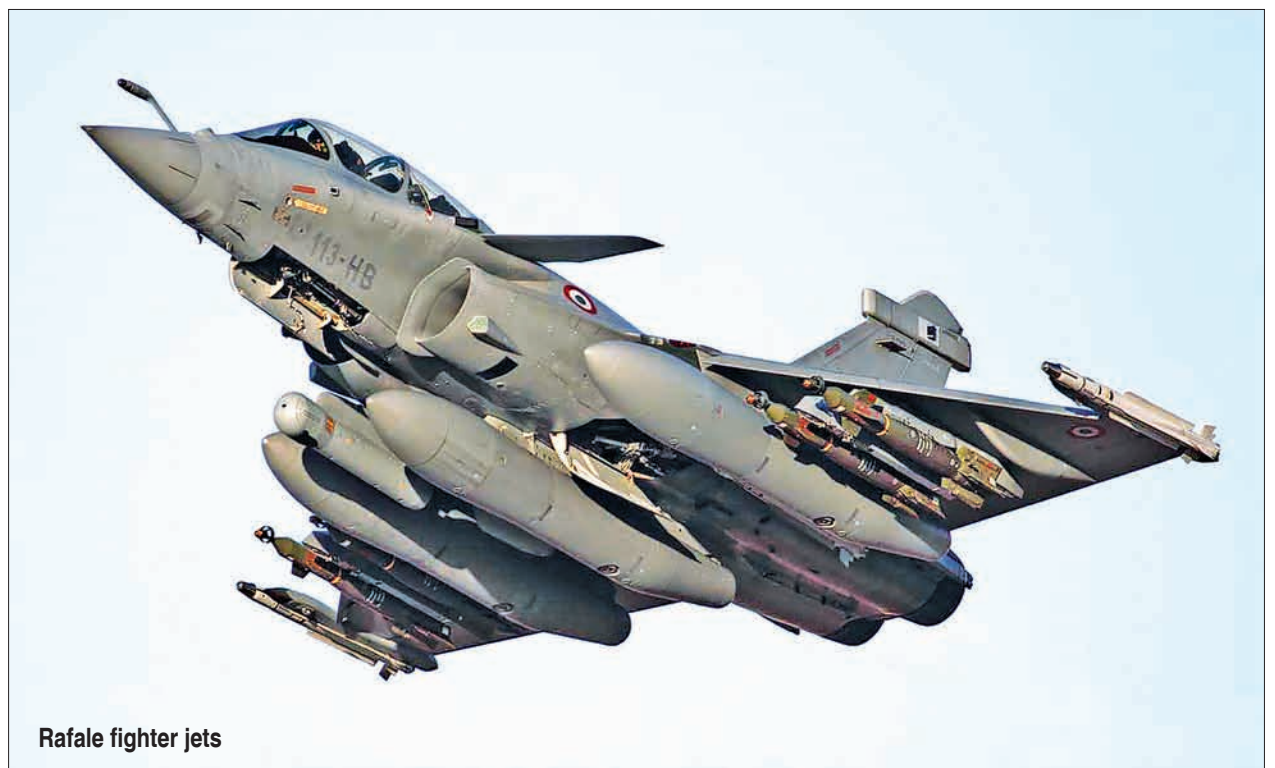
Rafale fighter jets

China claims most of the potentially energy-rich