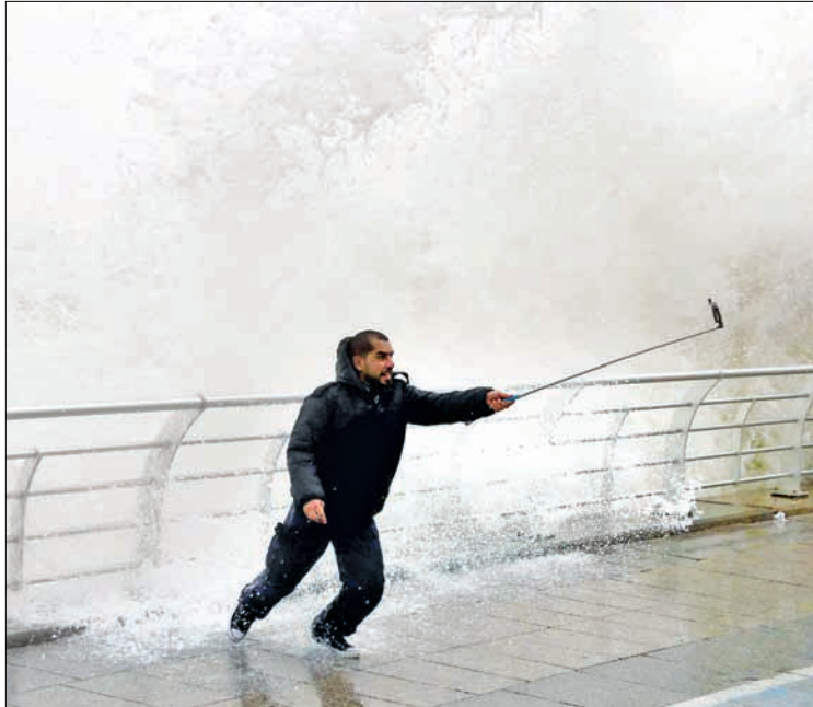
A man takes a selfie by a crashing wave on Beirut's Corniche, a seaside promenade, as high winds sweep through Lebanon during a storm in this February 11, 2015 file photo.

SYDNEY — The rise of selfie photography in some of the world's most beautiful, and dangerous, places is sparking a range of interventions aimed at combating risk-taking that has resulted in a string of gruesome deaths worldwide.