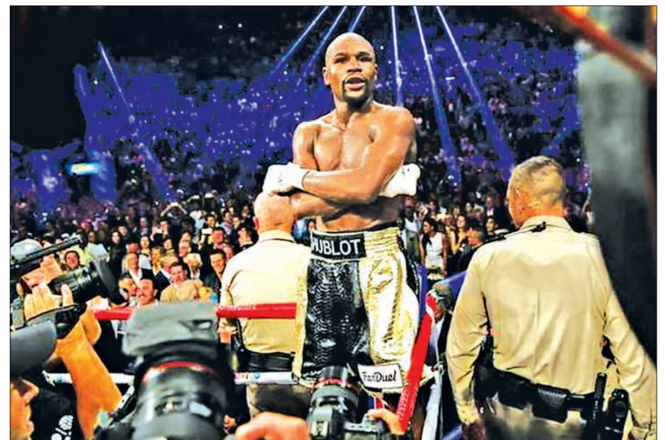
Floyd Mayweather, Jr. of the US stands up on the ropes in his corner after defeating Manny Pacquiao of the Philippines in their welterweight WBO, WBC and WBA (Super) title fight in Las Vegas, Nevada, May 2, 2015.