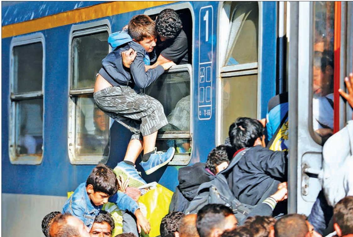
Migrants storm into a train at the Keleti train station in Budapest, Hungary, September 3, 2015 as Hungarian police withdrew from the gates after two days of blocking their entry.

BUDAPEST — Hundreds of migrants left Budapest aboard a packed train bound for a town near the Austrian border on Thursday after two days of chaos symbolic of a European asylum system brought to breaking point.