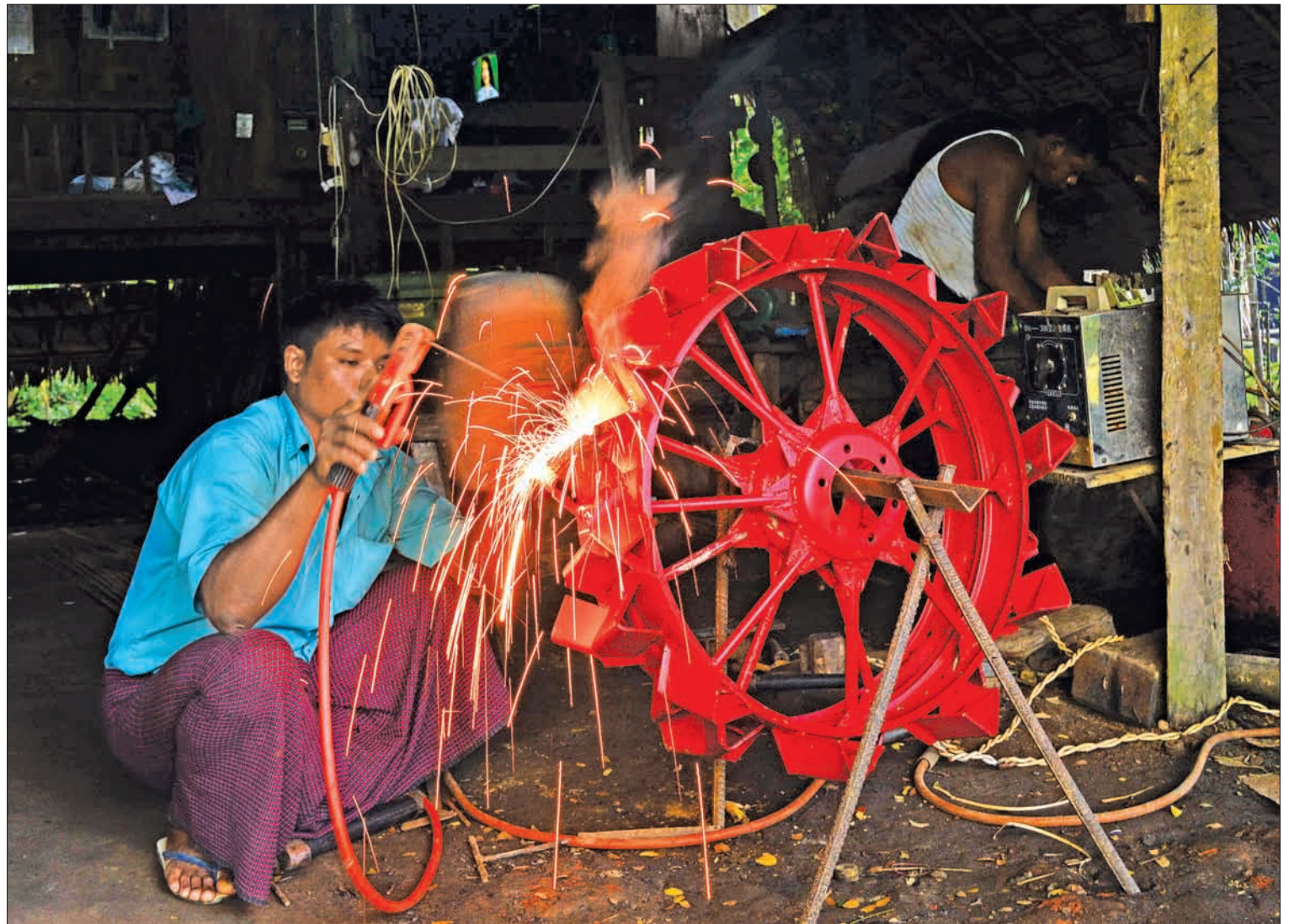
A worker reinforces a ploughing mechanism in Kawa, Bago Region.

According to a new report from Asian Development Bank (ADB), SMEs across the board in