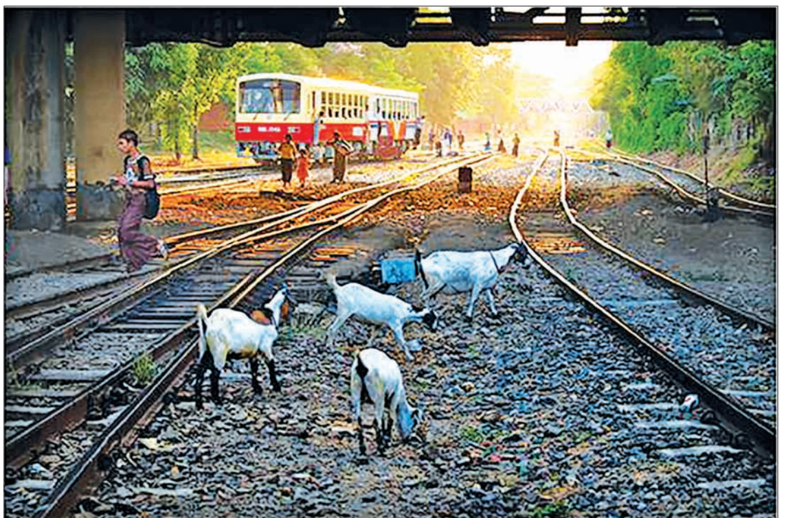
Work by photographer Kyaw Kyaw Winn will be on display at Yangon Gallery.

The Yangon Gallery is located within the compound of People's Park, near the Planetarium Museum on Ahlone Road. It plans to host a wide range of arts events during its second Monsoon Art Festival, which will run from 28 August to 28 October.—GNLM