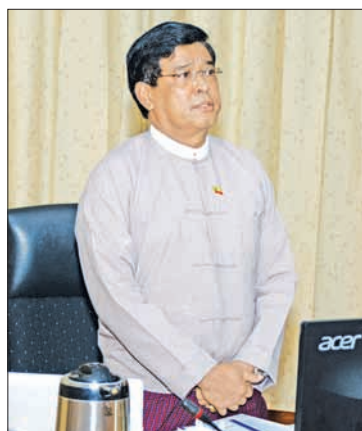
Vice President U Nyan Tun delivers speech at Myanmar's SEZ central committee meeting.

ternational legal norms, 'one-stop service centres' for investors will increase Myanmar's attractiveness, the vice president added.