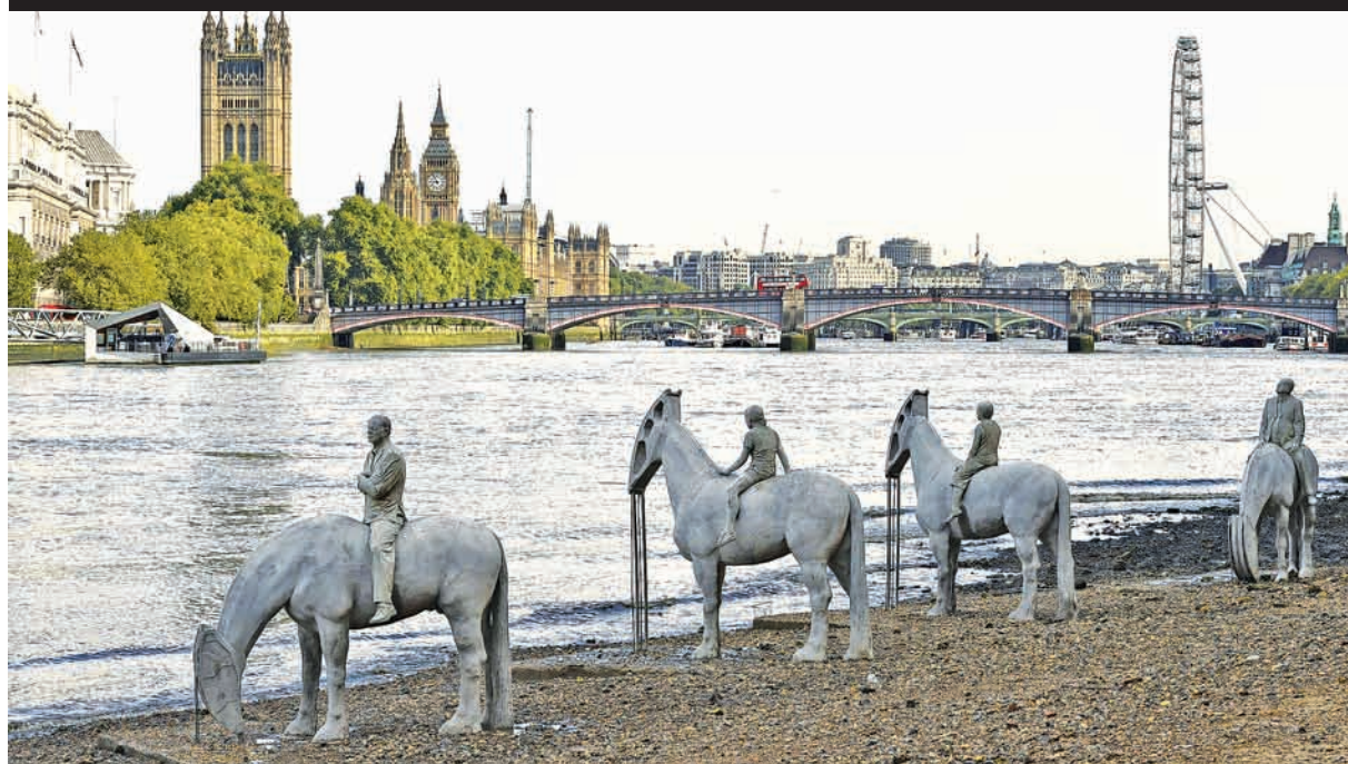
Sculptures entitled "The Rising Tide" by British sculptor Jason deCaires Taylor are seen beside the River Thames in front of the Houses of Parliament and the London Eye ferris wheel in London, September 3, 2015. The representations of four horses and riders are fully visible at low tide but become immersed underwater twice a day as the Thames rises to reach full tide. The installation will be on display throughout September as part of the annual Totally Thames festival.