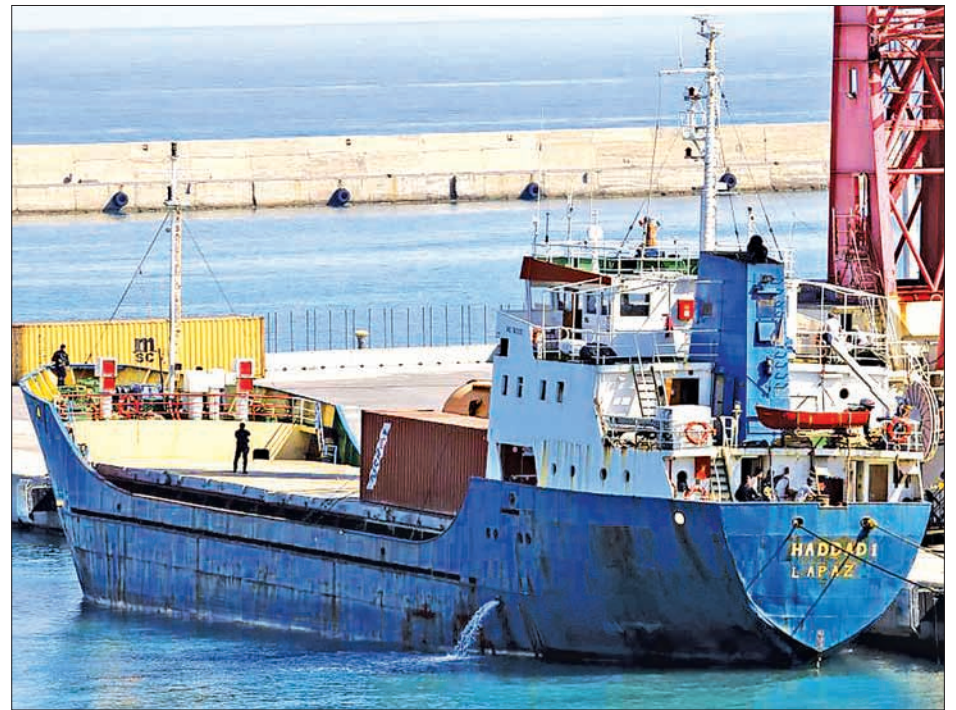
The “Haddad 1” freighter is moored at the port of Heraklion following an operation of the Greek coast guard on the island of Crete, September 2, 2015.—REUTERS

Bilgic said that the company which owned the ship was registered in the Greek port city of Piraeus and that the vessel had begun its journey in Famagusta in northern Cyprus and had also passed through the Egyptian port of Alexandria. It came to Iskenderun on Aug. 25 and left four days later, he said. The vessel’s documentation indicated that it was supposed to travel on to Misrata and Tobruk in Libya, before travelling back to Beirut, Bilgic said.—Reuters