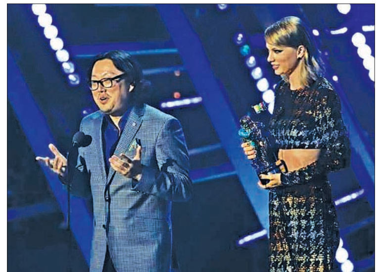
Director Joseph Kahn speaks as Taylor Swift accepts the award for best female video for "Blank Space" at the 2015 MTV Video Music Awards in Los Angeles, California August 30, 2015.

NEW YORK — The director of Taylor Swift's new music video set in Africa struck back on Wednesday at mounting criticism of the scarcity of black people in the mini-film and its romanticized portrayal of the continent.