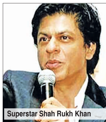
Superstar Shah Rukh Khan

MUMBAI — Superstar Shah Rukh Khan has reached a milestone of 15 million fan following on Twitter, becoming the second Indian actor to have the maximum admirers on the micro-blogging site after megastar Amitabh Bachchan. The 49-year-old "Chennai Express" star lags behind Bachchan by 1.7 million followers. The actor thanked his fans via a sweet message. "Thanks all for following me, not cos I can lead the way but for the reassurance that u all r there in case I lose mine," he wrote. He has left behind his contemporaries Aamir Khan and Salman Khan, who settle with 14.4 million and 13.7 million followers respectively. From posting pictures from shoot and with family to sharing anecdotes about his career and personal life, Shah Rukh keeps his fans informed about himself and often engages with them in brief Q&As. The actor will be next seen in Rohit Shetty's "Dilwale", Excel Entertainment's "Raees" and YRF's "Fan". —PTI