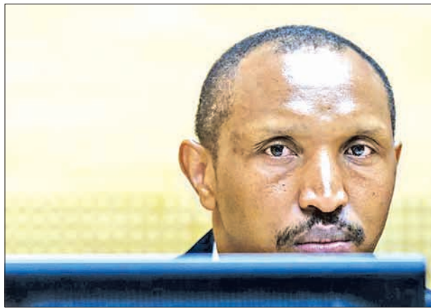
Congolese militia leader Bosco Ntaganda sits in the courtroom of the ICC (International Criminal Court) during the first day of his trial at the Hague in the Netherlands September 2, 2015.

Many of its highest-profile indictees, from Sudanese President Omar al-Bashir to Saif al-Islam, son of late Libyan leader Muammar Gaddafi, remain at large, their governments refusing to hand them over.