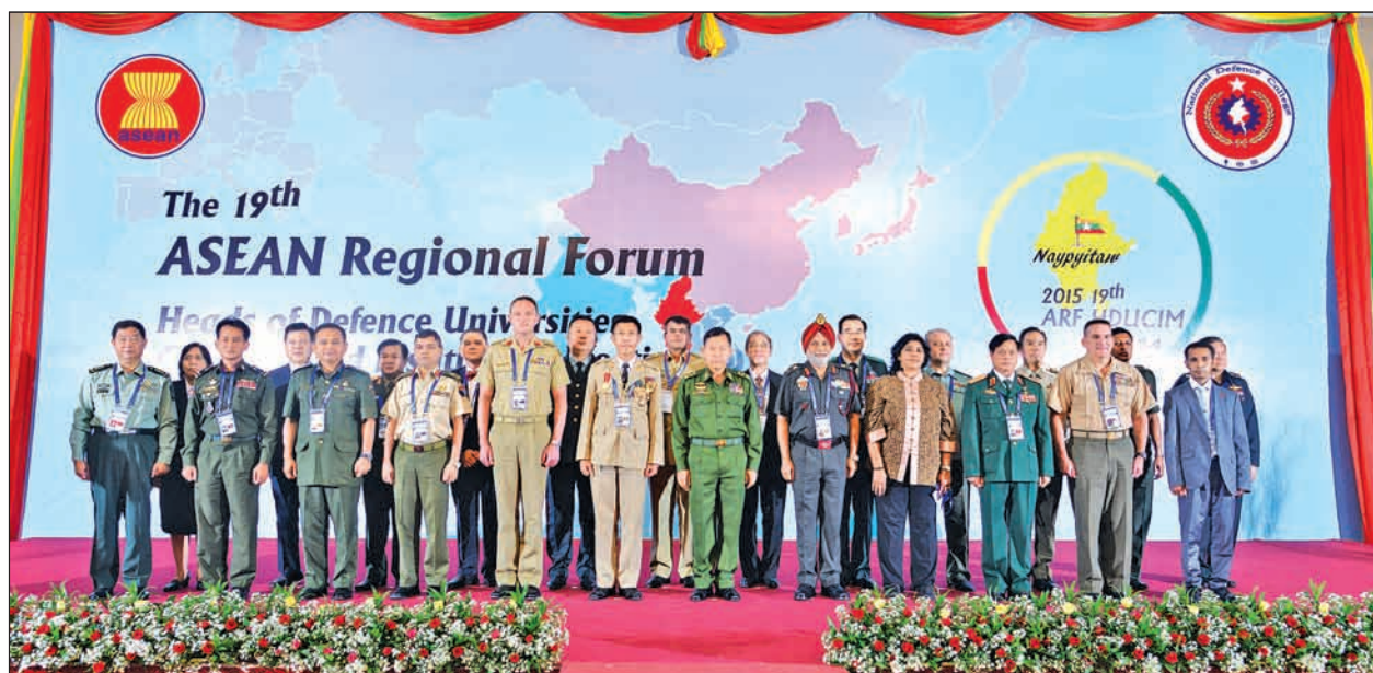
Vice-Senior General Soe Win poses for documentary photo with Heads of Defence Universities, Colleges and Institutions from ASEAN countries.

Topics discussed included enhancing strategic cooperation in the region, enhancing cooperation through military education and building regional security cooperation. The meeting was also attended by senior military officers of Office of the Commander-in-Chief (Army), Commander of Nay Pyi Taw Command Brig-Gen Moe Myint Tun, Commandant of National Defence College Brig-Gen Myo Moe Aung and officials.— Myawady