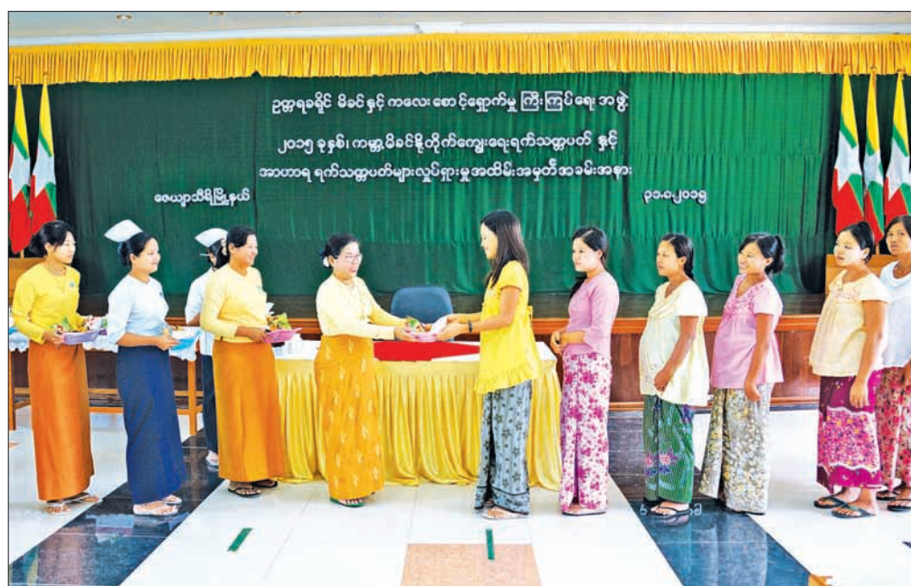
Officials of MMCWA provide nutritious foods and medicines to pregnant women in Zeyathiri Township as part of Nutrition Development Week activities.