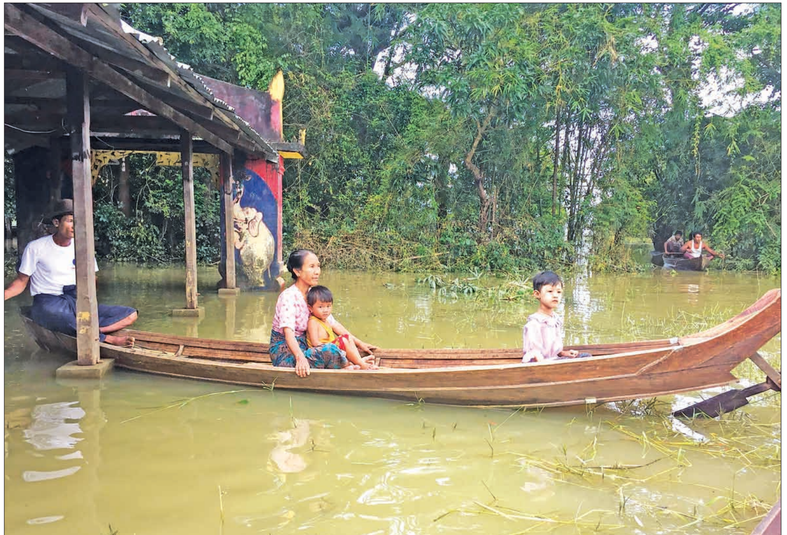
A family uses a boat to pass through Yay Tar Gyi village in Kyaunggon Township in Ayeyarwady Region on 25 August.

The ADB approved the emergency grant to finance flood relief efforts in Myanmar in late August. The grant that will be issued from its Asia Pacific Disaster Response Fund will be used to meet priority needs, restore live-saving services, and support early recovery for affected com-