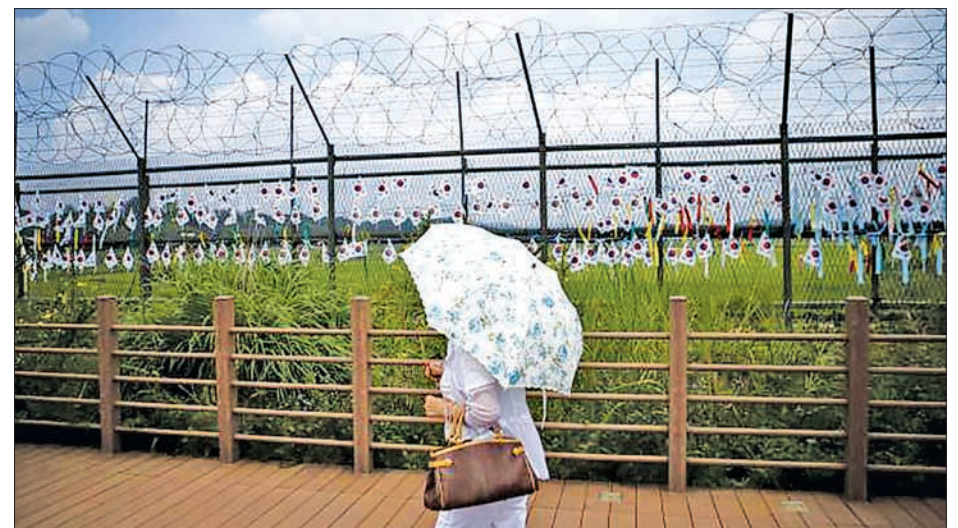
A tourist holding a parasol walks by a barbed-wire fence decorated by South Korean national flags at the Imjingak pavilion near the demilitarized zone separating the two Koreas in Paju, South Korea, August 22, 2015.

South Korea should stop “dishonest demeanors” of ceaselessly floating a story that North Korea is responsible for the crisis, it said. The announcement was made by an unidentified spokesperson of the defense commission ahead of South Korean President Park Geun Hye’s talks with Chinese President Xi Jinping in Beijing, during which North Korea was expected to top the agenda.—Kyodo News