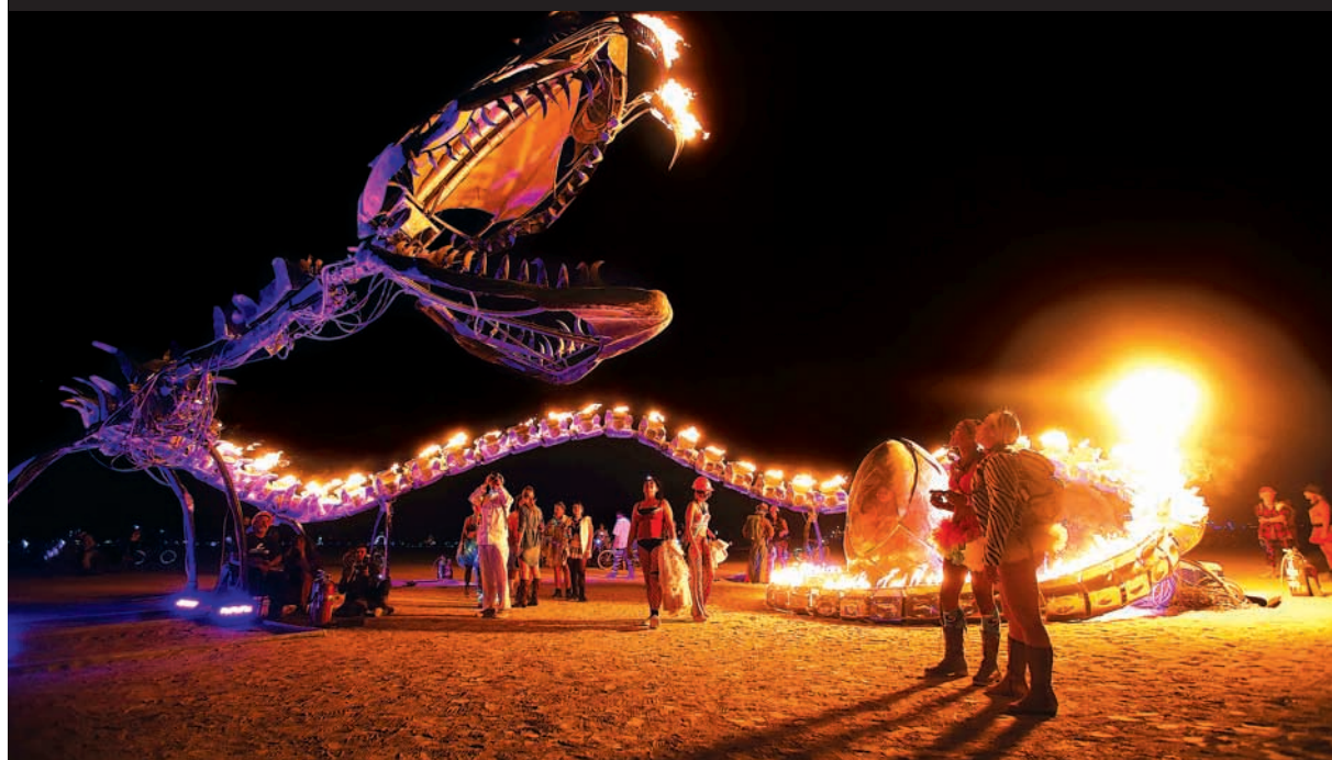
People gather at the art installation Serpent Mother during the Burning Man 2015 "Carnival of Mirrors" arts and music festival in the Black Rock Desert of Nevada, September 1, 2015. Participants are still arriving from all over the world for the sold-out festival to spend a week in the remote desert to experience art, music and the unique community that develops.