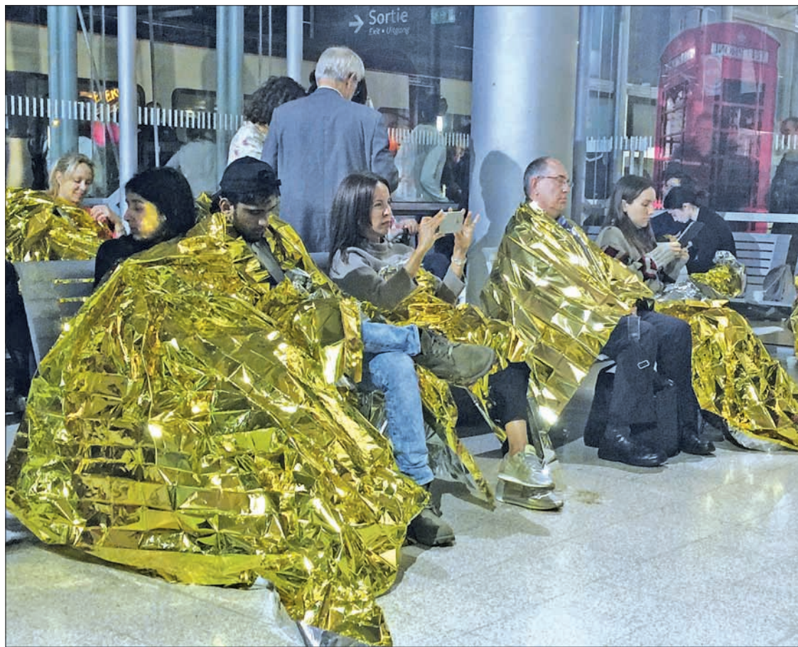
Passengers wrapped in thermal foil blankets given out by emergency services after their Eurostar train was stranded at Calais Station, after intruders were seen near the Eurotunnel, in Calais, France September 2, 2015.

passengers on that train sat in the dark for nearly four hours. The heat and mugginess in the cars rose as conductors walked the aisles with wind-up torches. A woman in business class wept and many passengers said they could not breathe in the stifling air.