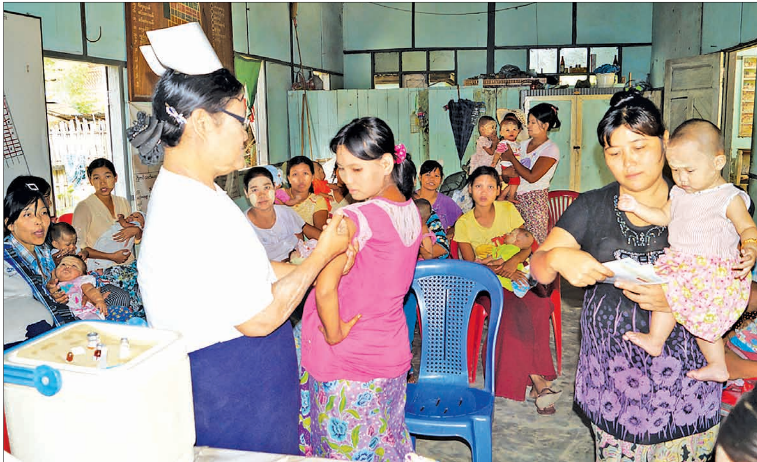
A senior nurse vaccinates a pregnant woman in health care service activity in Tatkon Township.

TATKON— Pregnant women and children under 18 months old received medicines and vaccinations at Tatkon Township’s Saya San general administrative ward office on 2 September. Mothers expressed thanks for the life-saving free medical care provided to their children.