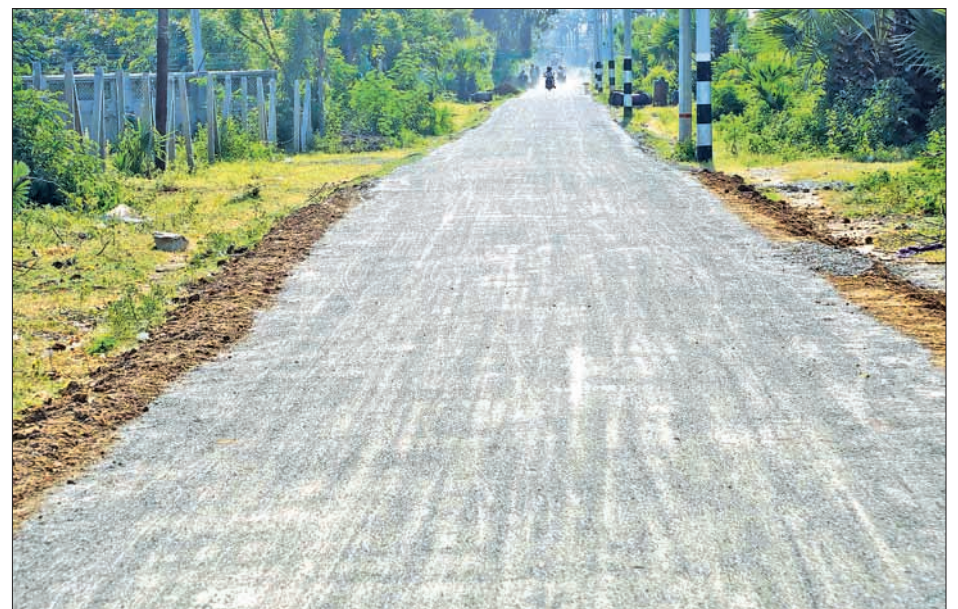
A newly-paved asphalt road stretching in Meiktila Township.

The new road is located on a critical junction to villages in nearby Thazi township and will allow for a smoother transport route for the area's products to reach Meiktila.