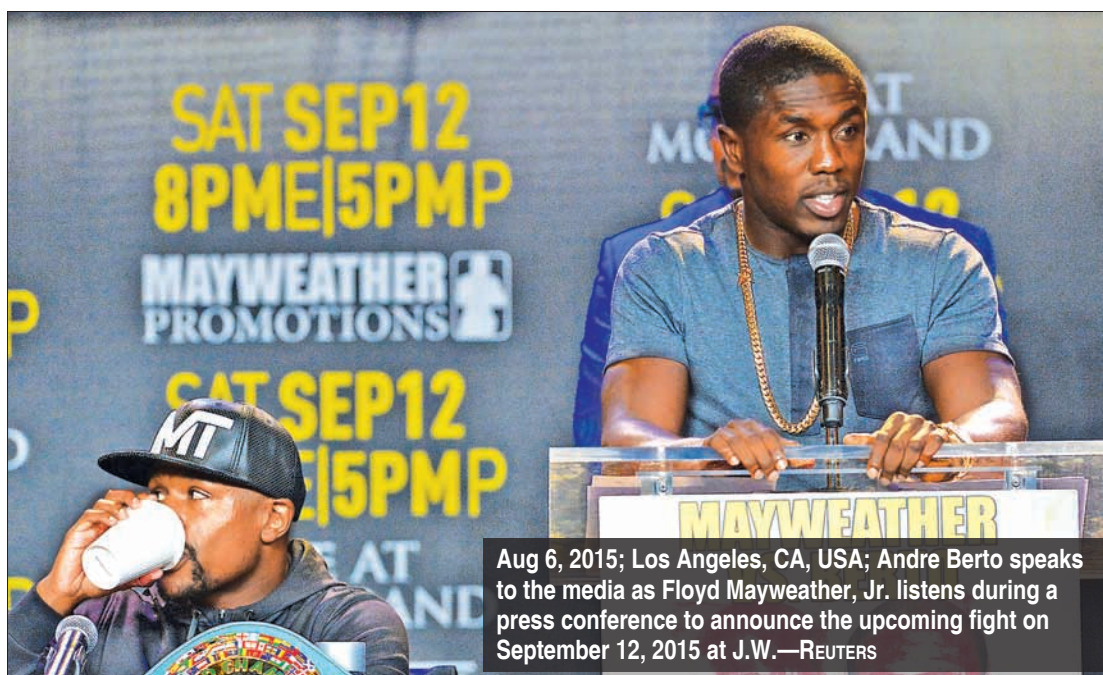
Aug 6, 2015; Los Angeles, CA, USA; Andre Berto speaks to the media as Floyd Mayweather, Jr. listens during a press conference to announce the upcoming fight on September 12, 2015 at J.W.

"I've worked with a lot of different sparring partners. Floyd is a very skilled fighter but I think I bring a combination of speed and power to the table. I think I have a better athletic ability. I can keep up with Floyd." Mayweather, widely regarded as one of the best defensive fighters ever, will put his unbeaten record on the line against Berto, a man who has lost three of his last six fights and is