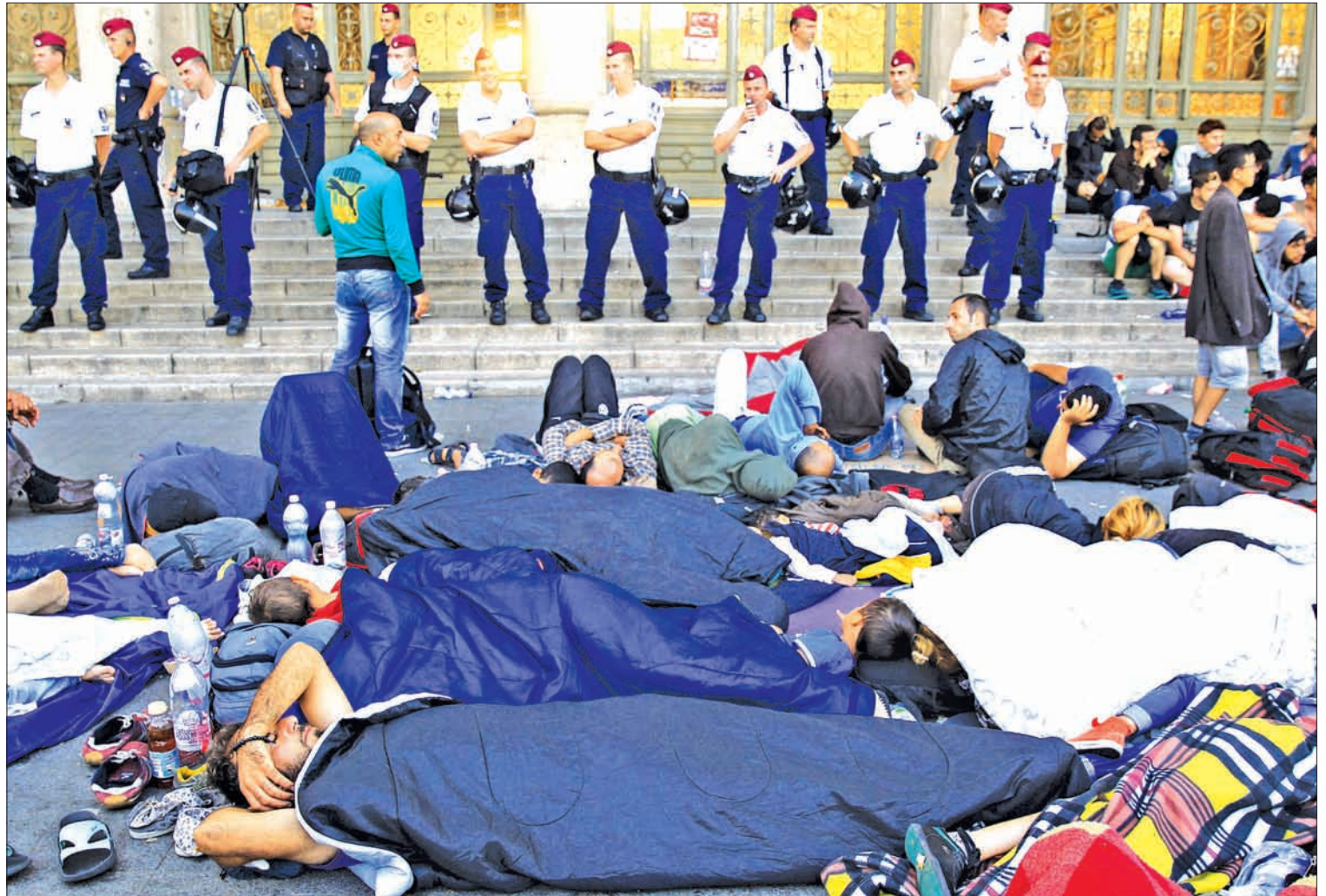
Migrants rest outside the main Eastern Railway station in Budapest, Hungary, September 2, 2015.

"In the territory of the EU, illegal migrants can travel onwards only with valid documents and observing EU rules," he said. "A train ticket does not overwrite EU rules."—Reuters