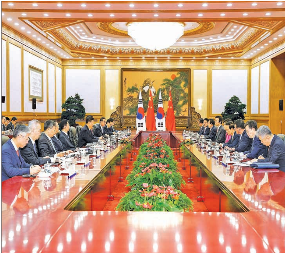
Chinese President Xi Jinping meets with South Korean President Park Geun-hye at The Great Hall Of The People in Beijing, China September 2, 2015.

BEIJING — South Korean President Park Geun-hye on Wednesday thanked China, during a summit meeting with President Xi Jinping, for help in defusing recent tension with North Korea that had pushed the neighbours to the brink of an armed conflict.