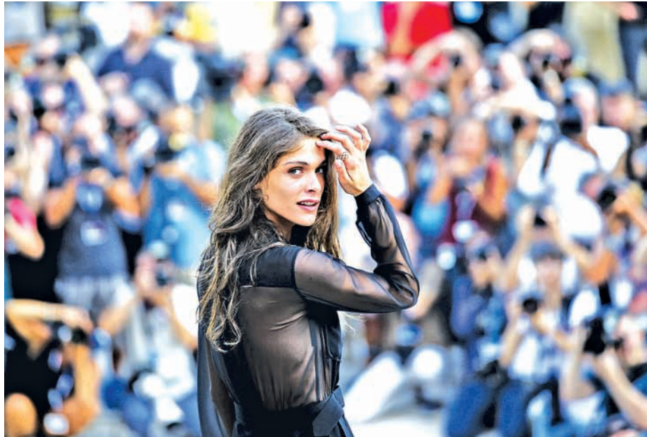
Italian model and actress Elisa Sednaoui poses for photographers a day before the 72nd Venice Film Festival in Venice, Italy, September 1, 2015. Sednaoui will be hosting the opening and closing ceremonies of the film festival.

“It’s made of guests, representatives of the public institutions, authorities,