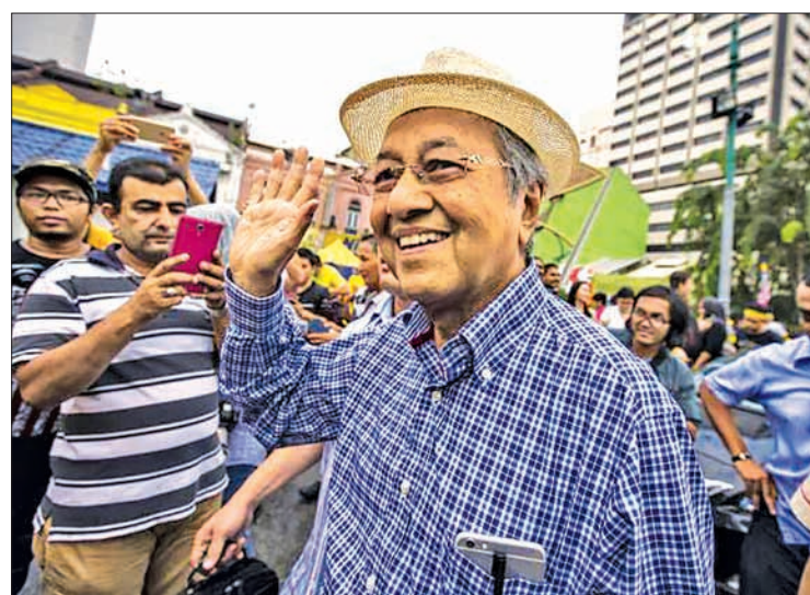
Former Malaysian Prime Minister Mahathir Mohamad (C) waves as he attends a rally organised by pro-democracy group “Bersih” (Clean) near Central Market in Malaysia’s capital city of Kuala Lumpur, August 30, 2015.

Mahathir, 90, was once Najib’s patron but has become his