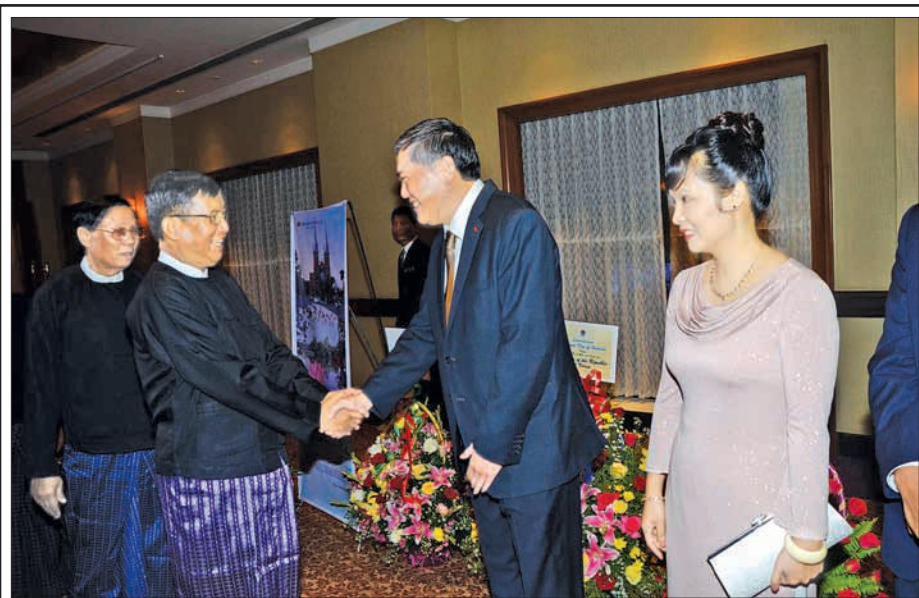
Deputy Minister for Foreign Affairs U Tin Oo Lwin being welcomed by Vietnamese Ambassador Mr Pham Thanh Dung at the reception to mark 70 th Anniversary of National Day of the Socialist Republic of Vietnam at Sule-Shangri-La Hotel in Yangon on 2 September.— MNA

The Ministry of Religious Affairs has also sent donations from the public to monasteries in flood-affected areas in Pwintbyu, Kalay, Sittway and Monywa townships.— MNA