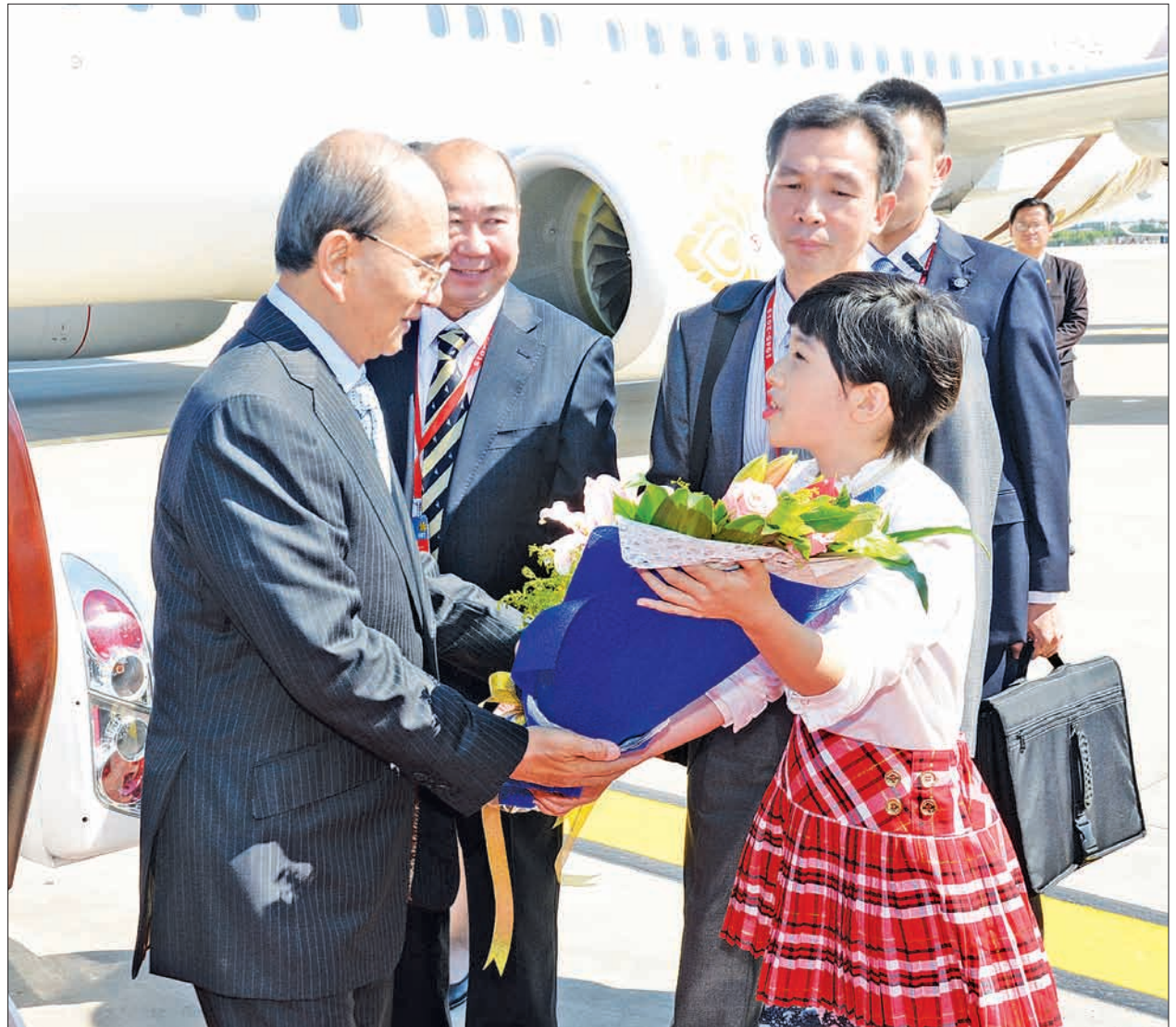
President U Thein Sein being welcomed by officials at Beijing International Airport.

In the evening, the president attended an informal dinner hosted by Chinese President Xi Jinping and his wife.