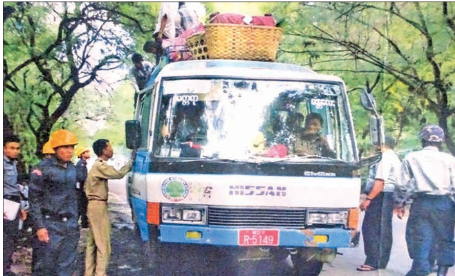
Police and volunteers discharging security duty.

Between January and the end of July this year, 27 cases of robbery were solved in the region, according to the region's police department.