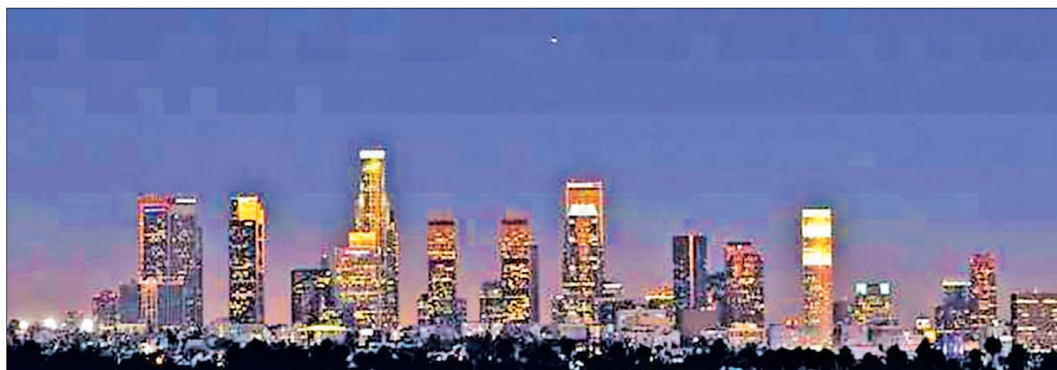
The Los Angeles downtown skyline is pictured August 22, 2011.

LOS ANGELES — Los Angeles was officially selected on Tuesday as the American candidate city that will bid to host the 2024 Summer Olympics after Boston pulled out of the race in July, the US Olympic Committee said.