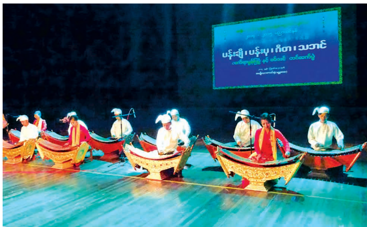
Students of National University of Arts and Culture in Mandalay perform their brilliant skills at graduation concert.

The university in Mandalay opened since 2001, has four-year under graduate courses as well as post graduates courses. The motion picture/play majoring class was opened during 2014-15 academic year. There are also diploma courses, it is learnt.