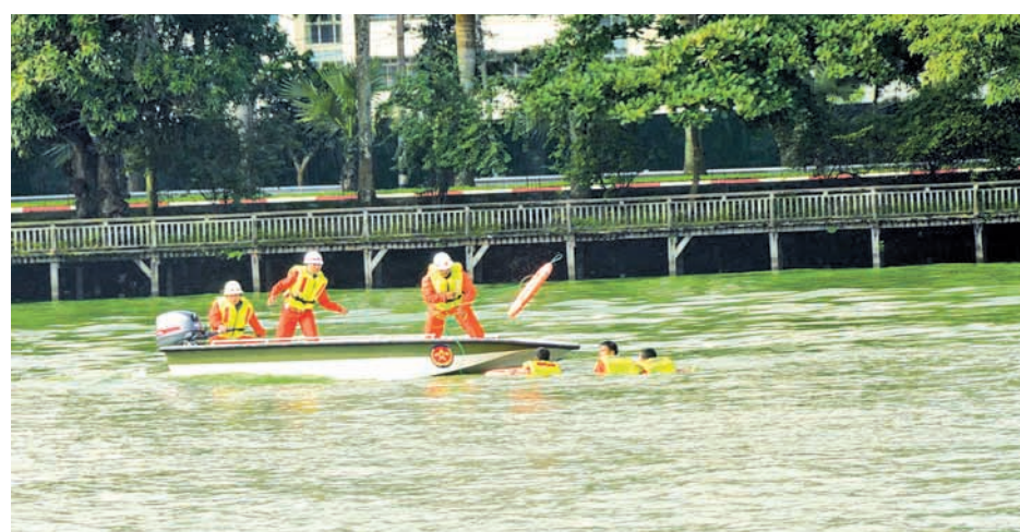
Rescuers demonstrate skills with the use of lifeboat.

The department delivered one life boat to Nay Pyi Taw Council Area, five to Kachin State, one to Kayah State, five to Kayin State, one to Chin State, 11 to Sagaing Region, four to