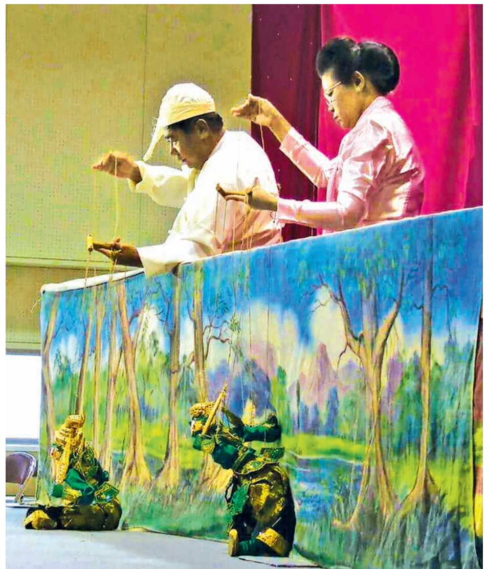
Myanmar puppeteers staging marionette show.

A special rite is necessary to animate [to give life to] the wooden puppet figures. It is called "La-maing Tin. "La-maing" is a guardian nat-spirit to be