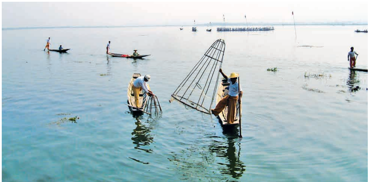
Inn ethnic catching fish in Inlay Lake in their tradition.

Tobacco-free areas already exist at some of Bagan's most famous temples, while the Pindaya caves in Shan State will soon follow suit.