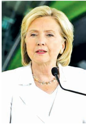
Democratic presidential candidate Hillary Clinton

Clinton, the front-runner to become the Democratic Party's nominee for next year's presiden-