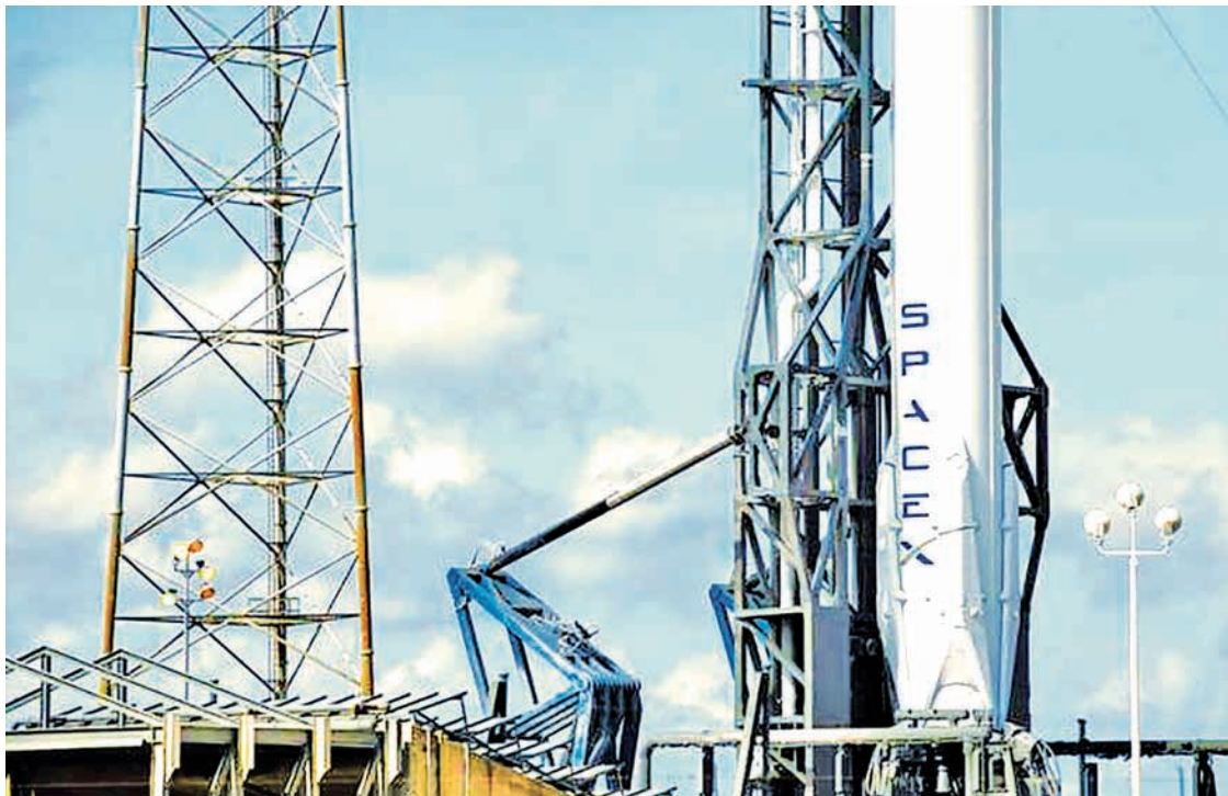
The unmanned SpaceX Falcon 9 rocket with the Dragon capsule waits for its launch to the International Space Station, on Launch Complex 40 at the Cape Canaveral Air Force Station in Cape Canaveral, Florida in this April 13, 2015 file photo.

The metal strut broke about two minutes after the rocket lifted off from Florida, releasing a bottle of helium that caused the second-stage engine to become over-pressurized. Seconds later,