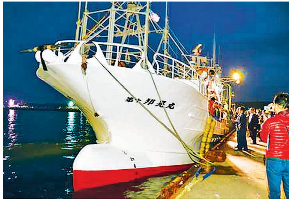
Photo taken Sept. 1, 2015, at a port in Japan's northeastern city of Nemuro shows a Japanese salmon fishing boat, the Hoko Maru No. 10, which was seized by Russian authorities in July for fishing more than its quota.—Kyodo News

A court on Kunashiri ordered captain Ito on Aug. 20 to pay a fine of 200,000 rubles ($3,100) for illegal fishing. The vessel was not confiscated. While the crewmembers were not detained, they had to stay on the boat offshore until the ship was allowed to leave Monday.—Kyodo News