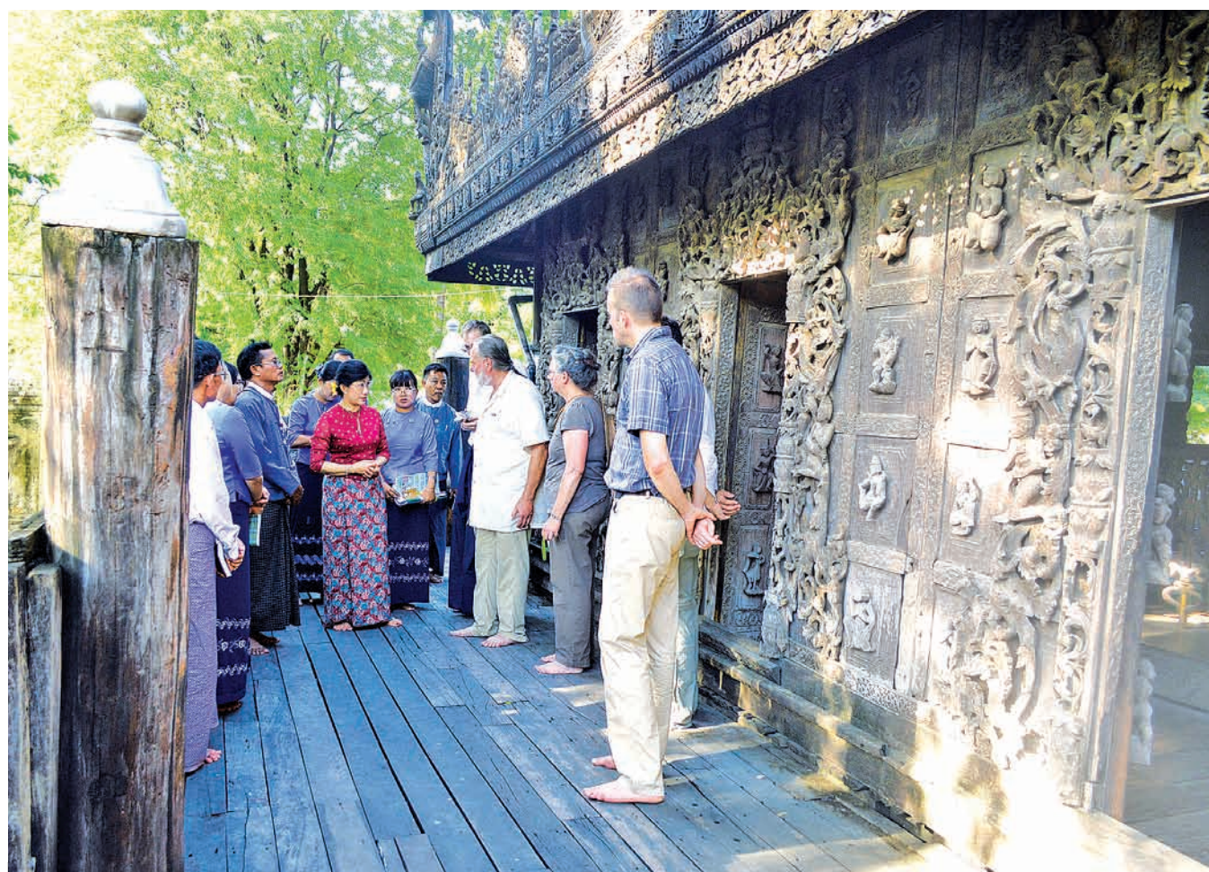
Deputy Minister for Culture Daw Sanda Khin inspects progress in renovation works at Golden Palace Monastery in Mandalay.