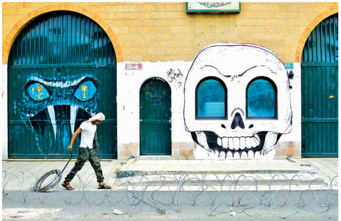
A Houthi militant walks past graffiti painted by pro-Houthi activists on the gate of the Saudi embassy in Yemen’s capital Sanaa August 31, 2015.—REUTERS

Mellitah’s biggest asset, the El Feel oilfield, has been closed for months due to a protest by local security guards. The Wafa oil and gas field and its offshore operations are still working. There was no immediate claim of responsibility for the car bombing. Islamic State has claimed in the past a string of killings of foreigners as well as attacks on embassies and oil fields in Libya.—Reuters