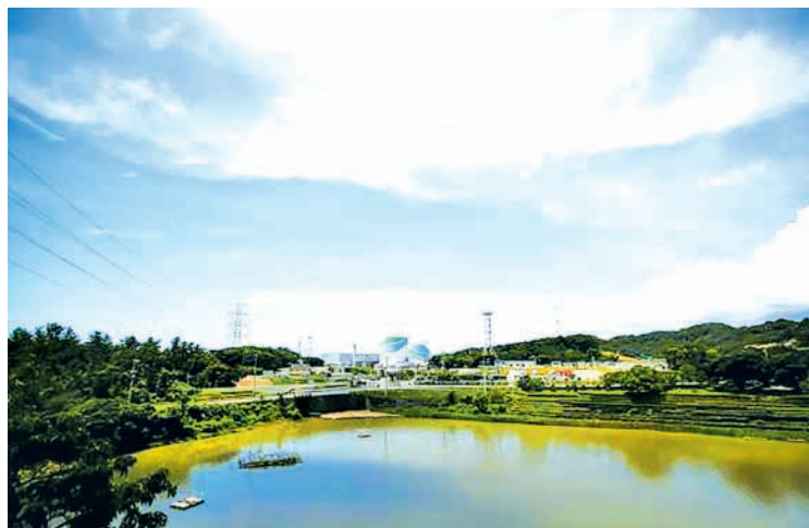
No.1 (L) and No.2 reactor buildings are pictured at Kyushu Electric Power's Sendai nuclear power station in Satsumasendai, Kagoshima prefecture, Japan, July 8, 2015.