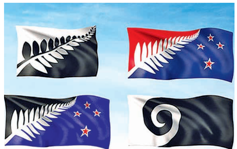
Supplied photo shows a shortlist of four flags unveiled on Sept. 1, 2015, by the New Zealand Flag Consideration Panel. A national referendum to be conducted from Nov. 20 for three weeks will see voters asked to rank their preferred design based on the four flags shortlisted.

A second referendum scheduled for March will see voters choose between the preferred alternative and the current flag, which has represented the country since 1902. The estimated cost of the project is NZ$25.7 million (US$16.4 million), and over 10,000 designs were submitted for consideration.— Kyodo News