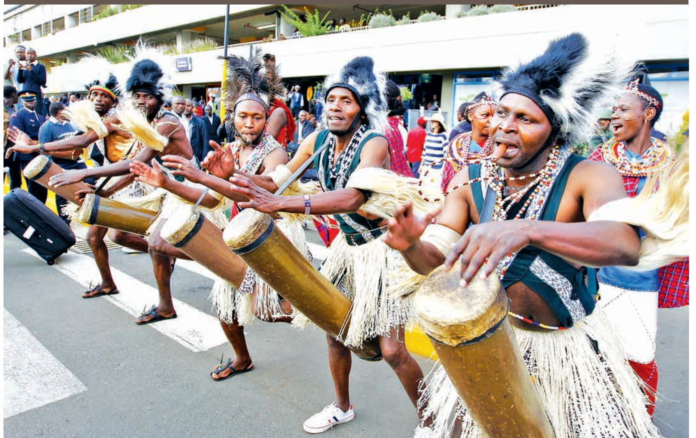
Traditional Chuka drummers celebrate as they welcome the national athletics team at the Jomo Kenyatta airport in Nairobi, Kenya, September 1, 2015, after they topped the medals table at the recently concluded 15th International Association of Athletics Federations (IAAF) World Championships at the National Stadium in Beijing, China.