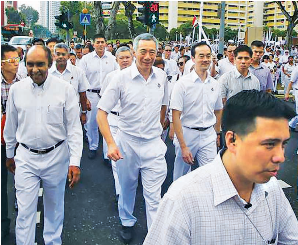
Singapore's People's Action Party (PAP) secretary-general Lee Hsien Loong crosses a street with his supporters to submit his papers during nomination day, ahead of the general elections in Singapore September 1, 2015.

SINGAPORE — Singapore Prime Minister Lee Hsien Loong's ruling People's Action Party will face a fight from opposition candidates in all 89 parliamentary seats for the first time since independence 50 years ago, nominations showed on Tuesday.