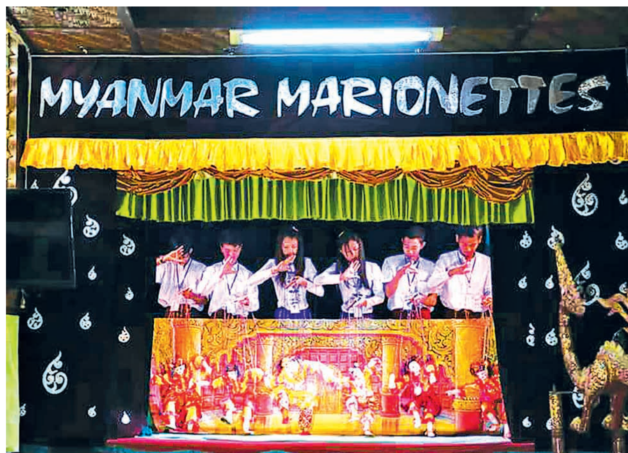
Young puppeteers show their skills.

The music troupe occupies the ground right in front of the stage. It is the same type of music used in drama "zat saing" ဇာတ်ဆိုင်း. The musical ensemble is composed of (1) one pat-waing or a circle of 21 drums in the order of seven tones in three sets – totaling 21 (2) one kyi waing or bronze gongs circle of 18 bronze gongs (3) a big double face drum called Pat magyi (4) a set of six drumlets called Chauk Lone pat (5) one sit-toe drum (6) one sa-kunt (7) one bon-taung (8) one set of six bronze gongs called maung saing (9) none big and one small oboe plus a