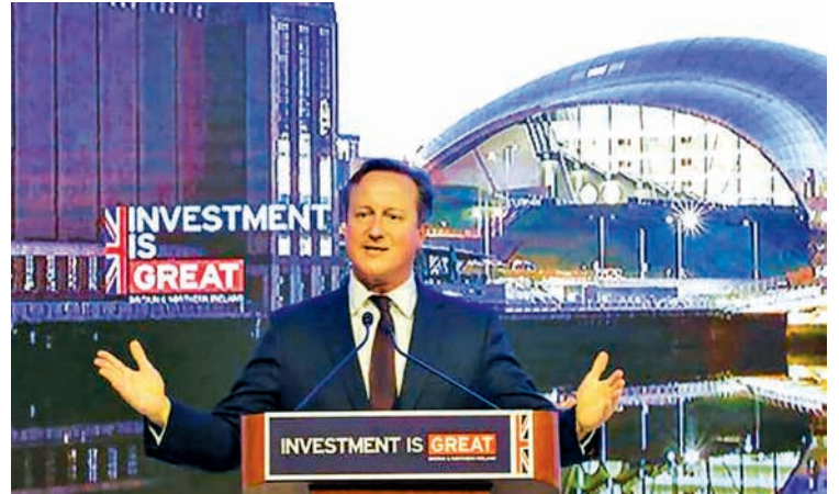
Britain's Prime Minister David Cameron speaks to guests at an event to promote investment in the north of England in Kuala Lumpur, Malaysia, July 30, 2015.

LONDON — British Prime Minister David Cameron said on Tuesday he would introduce tough fines for company bosses who fail to pay the so called 'national living wage' which will hit 9 pounds ($13.86) an hour by the end of the decade.