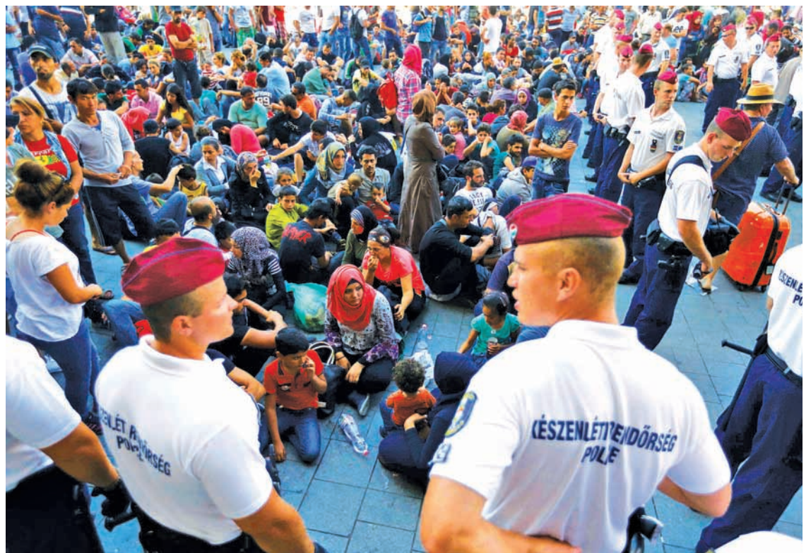
Hungarian police officers watch migrants outside the main Eastern Railway station in Budapest, Hungary, September 1, 2015.—REUTERS

Trainloads of migrants arrived in Austria and Germany from Hungary on Monday as European Union asylum rules collapsed under the strain of a wave of migration unprecedented in the EU.—Reuters