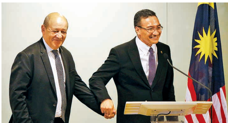
France's Defence Minister Jean-Yves Le Drian (L) and Malaysia's Defence Minister Hishammuddin Hussein leave a news conference about Malaysia's proposed purchase of France's Rafale fighter jets in Kuala Lumpur, Malaysia, September 1, 2015.

KUALA LUMPUR — The Malaysian government discussed Tuesday with France on its interest to purchase Mistral helicopter carriers during French Defense Minister's visit to the country, according to