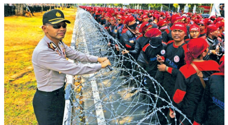
Central Jakarta police chief Hendro Pandowo stands next to razor wire as Indonesian trade union workers hold a protest outside the Presidential Palace in Jakarta September 1, 2015.

Unemployment in Southeast Asia's largest economy stood at