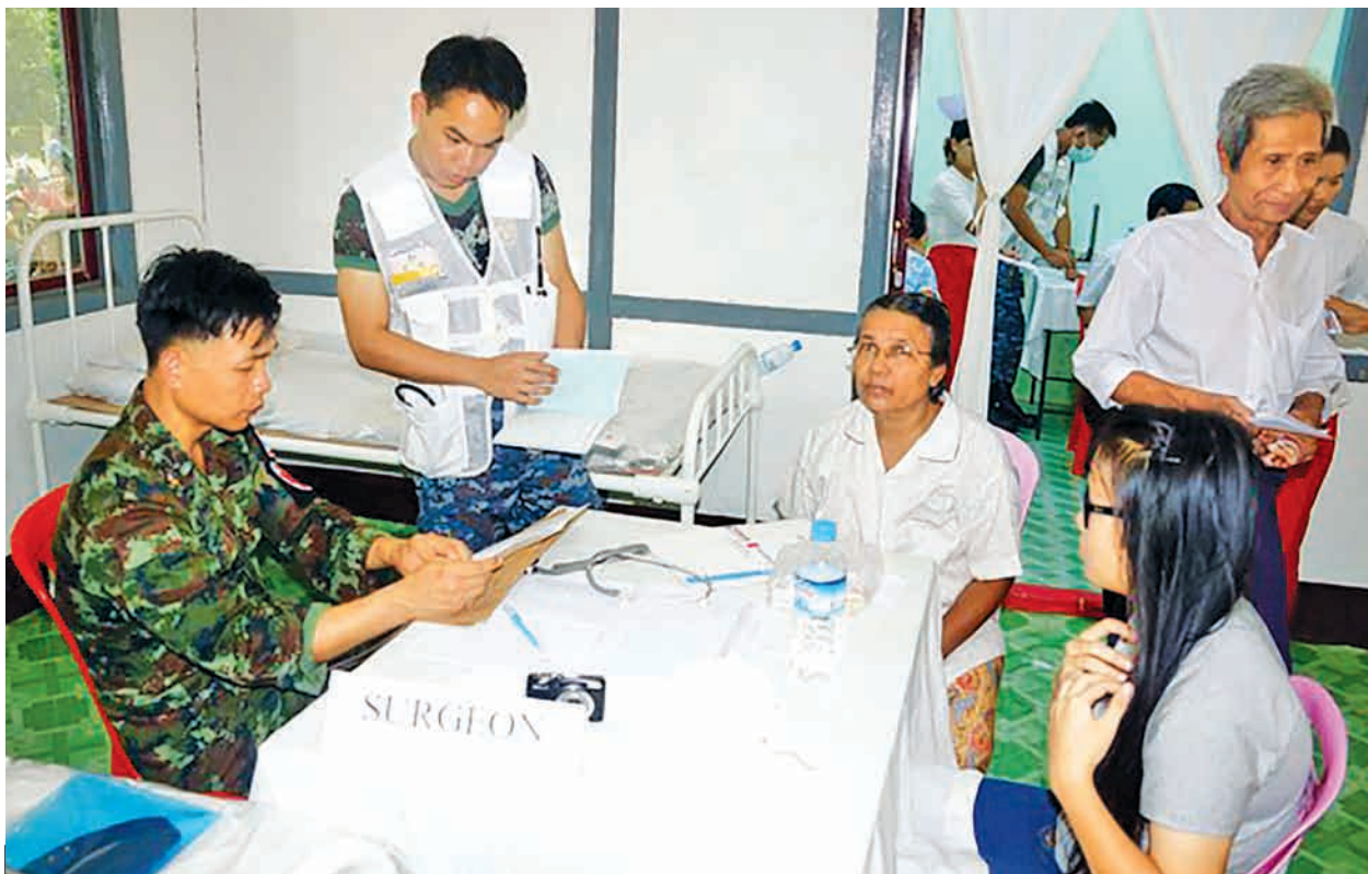
Medical officers from Royal Thai Army providing health care services to local people in Myanaung.