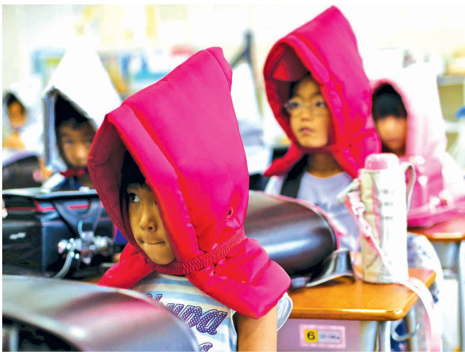
School children wearing padded hoods to protect them from falling debris, prepare to evacuate during an earthquake simulation exercise at an elementary school in Tokyo September 1, 2015.