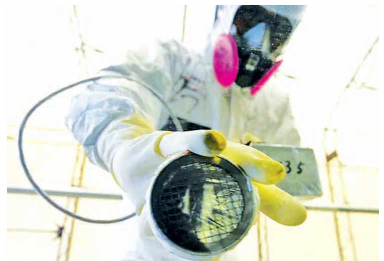
A worker takes radiation readings on the window of a bus at the screening point of the Tokyo Electric Power Company's (TEPCO) tsunami-crippled Fukushima Daiichi nuclear power plant in Fukushima prefecture June 12, 2013.

Japan began encouraging residents to return to homes 12 miles (19 km) from the plant last year, but many residents have mixed feelings about returning to abandoned towns.—Reuters