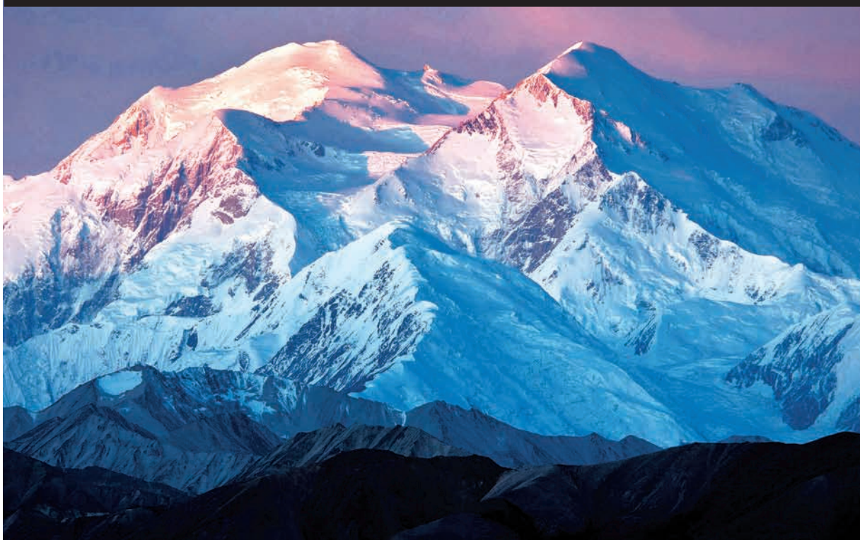
Mount McKinley is shown in this January 11, 2011 handout photo provided by the National Park Service in Alaska. President Barack Obama will officially restore Denali as the name of North America's tallest mountain, ending a 40-year battle over what to call the peak that has been known as Mount McKinley.