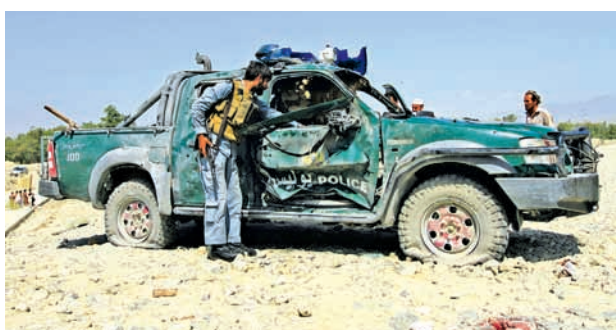
An Afghan policeman inspects the wreckage of a police car which had a magnetic bomb attached, at the site of a bomb explosion in Jalalabad, Afghanistan August 31, 2015.

KABUL, 31 Aug — Some 70 militants and eight soldiers have been killed during military operations and clashes across Afghanistan, the Afghan Defense Ministry said on Monday morning.