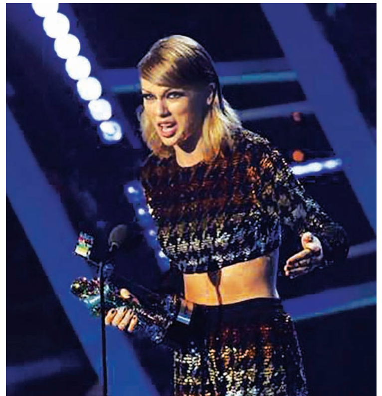
Taylor Swift accepts the award for best female video for 'Blank Space' at the 2015 MTV Video Music Awards in Los Angeles, California August 30, 2015.

Sunday's show was all about the shock factor as a scantily clad Miley Cyrus, 22, cursed her way through her hosting duties, flashed her bare breast accidentally and performed a new song about smoking marijuana.