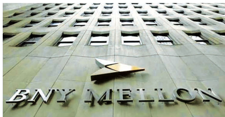
A BNY Mellon sign is seen on their headquarters in New York's financial district, in this January 19, 2011 file photo.