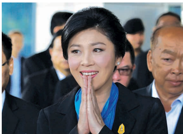
Ousted former Thai Prime Minister Yingluck Shinawatra gestures as she arrives at the Supreme Court in Bangkok, Thailand, August 31, 2015.

"These were not seen or reviewed (by all parties)," Yingluck told reporters. "Today we're going to hear about this and hope that we will get justice."