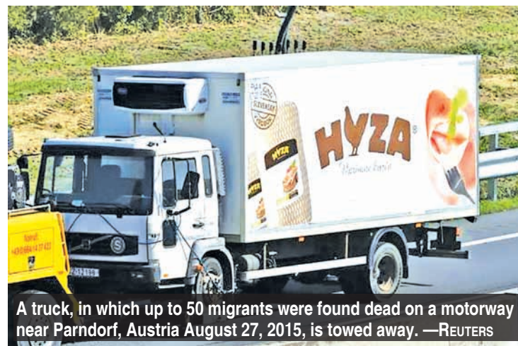
A truck, in which up to 50 migrants were found dead on a motorway near Parndorf, Austria August 27, 2015, is towed away.—REUTERS

"We are not in violation of Schengen," she said.—Reuters