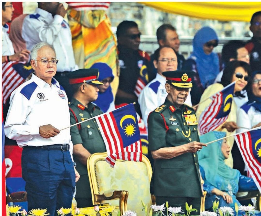
Malaysia's (L-R) Prime Minister Najib Razak and King Abdul Halim Mu'adzam Shah wave Malaysian national flags during National Day celebrations in Kuala Lumpur, August 31, 2015. Malaysia's Independence Day celebrations took place on Monday, a day after thousands of protesters took part in the second day of a rally organised by pro-democracy group Bersih in Kuala Lumpur calling for electoral reform and Razak's resignation over a multi-million-dollar payment into an account under his name.