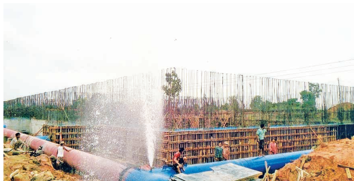
Workers clean water pipeline before supplying water to Shwepyitha Township.

of fire. YCDC is currently supplying 205 million gallons of water sourced from Gyobu, Phugyi, Hlawga dams and Ngamoeyeik water treatment plant.—Yi Yi Myint, Ohmma Thant