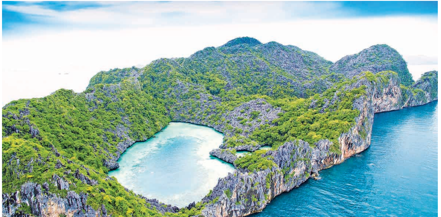
Cocks Comb Island in Myeik Archipelago.

Local and Thai-based travel agencies will begin a tour around Cocks Comb Island and Thahtay Island, as well as the better known destination Kawthoung, which is located at the southern-