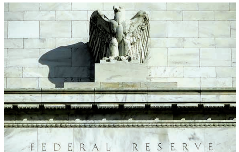
A detail from the front of the United States Federal Reserve Board building is shown in Washington October 28, 2014.

"Latin America has seen a surge of inflation" as countries "internalize" the evolution of Fed policy, Central Bank of Chile Governor Rodrigo Vergara told the conference.—Reuters