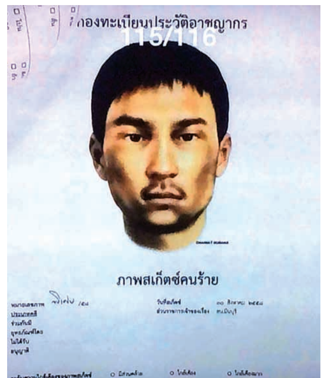
A sketch of an unidentified suspect is shown in this Thai Royal Police handout released August 31, 2015.

Since the bombing, speculation had focused on groups that could have the