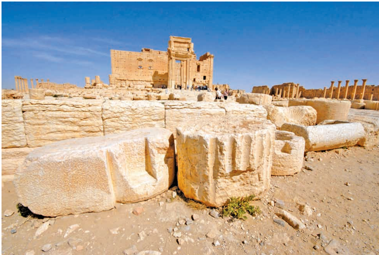
A general view shows the Temple of Bel in the historical city of Palmyra, Syria April 18, 2008.

BEIRUT, 31 Aug — The hardline Islamic State group has destroyed part of an ancient temple in Syria's Palmyra city, a group monitoring the conflict said on Sunday.