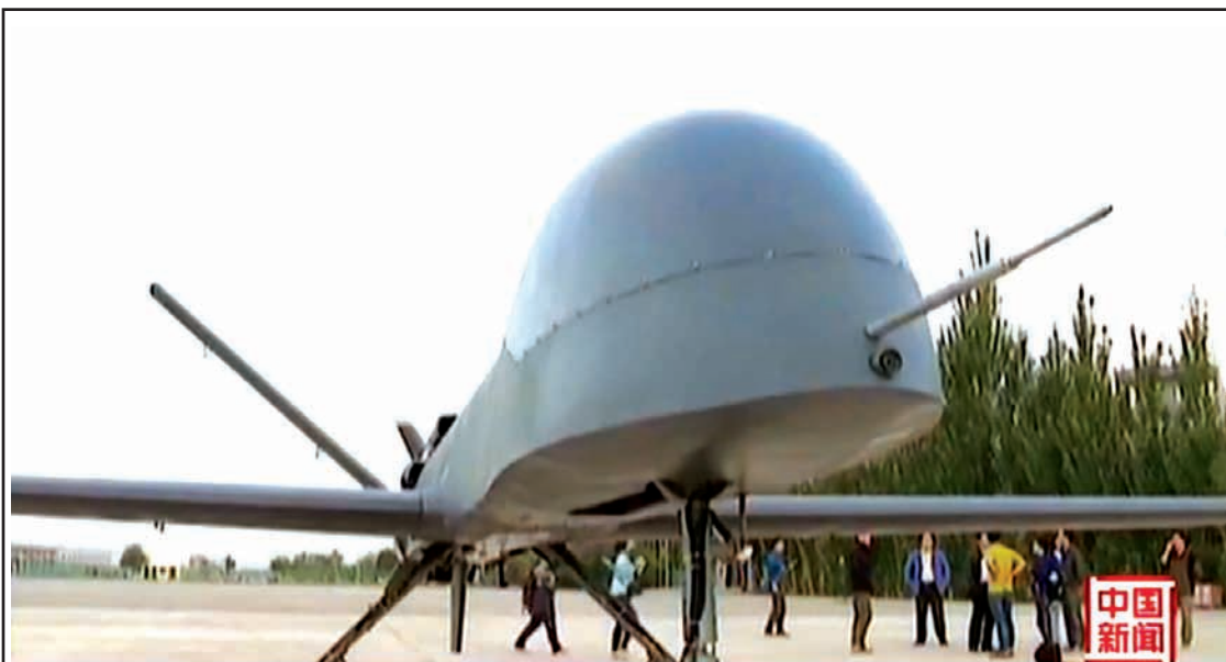
The screen shot of a CNTV video shows that one of China's largest UAV (Unmanned Aerial Vehicle) has completed its maiden flight successfully.