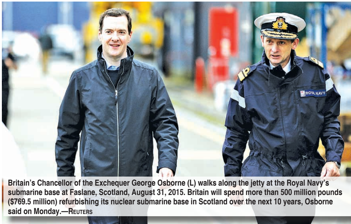
Britain's Chancellor of the Exchequer George Osborne (L) walks along the jetty at the Royal Navy's submarine base at Faslane, Scotland, August 31, 2015. Britain will spend more than 500 million pounds ($769.5 million) refurbishing its nuclear submarine base in Scotland over the next 10 years, Osborne said on Monday.

LONDON, 31 Aug — Britain will spend more than 500 million pounds ($769.5 million) refurbishing its nuclear submarine base in Scotland over the next 10 years, finance minister George Osborne said on Monday.