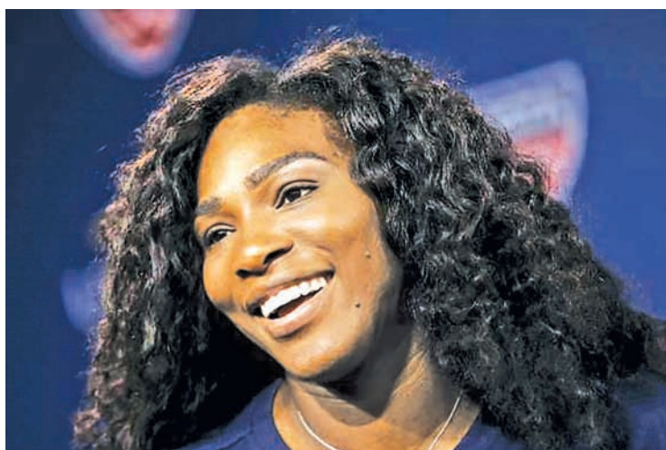
Serena Williams of the US speaks during a news conference at the USTA Billie Jean King National Tennis Center ahead of the 2015 US Open tennis tournament in New York, August 27, 2015. Play begins at the US Open on August 31.

NEW YORK, 31 Aug — Serena Williams is on the brink of the grandest achievement in tennis, the single season Grand Slam, and even the leading men at the US Open championships starting on Monday are cheering her on.