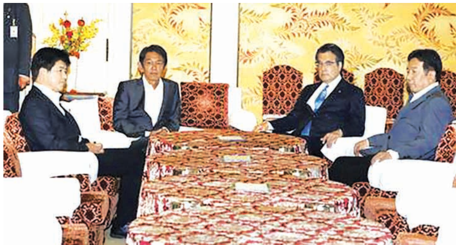
Japan Innovation Party leader Yorihiisa Matsuno (2nd from L) meets with Democratic Party of Japan chief Katsuya Okada (2nd from R), together with other senior lawmakers of the two opposition parties, at the parliament building in Tokyo on Aug. 31, 2015.

TOKYO, 31 Aug — The heads of Japan's two largest opposition parties on Monday confirmed their plan to cooperate in joining forces to challenge the ruling Liberal Democratic Party in future elections.