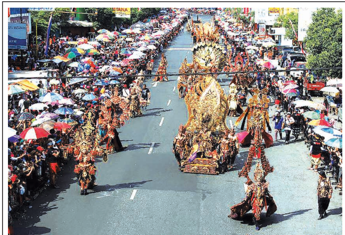
Performers participate in the Jember Fashion Carnival 2015 in Jember of East Java, Indonesia, Aug. 30, 2015.

Bikers who are not from the elite can manage to afford cheaper Japanese sports bikes for use on race tracks.