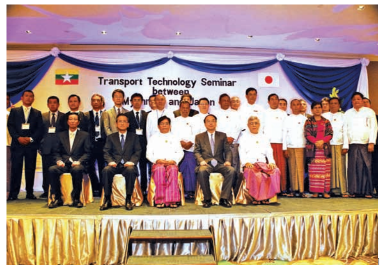
Union Minister U Nyan Tun Aung poses for documentary photo with attendees of transport technology seminar.—TRANSPORT