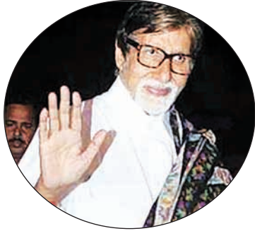
Megastar Amitabh Bachchan

MUMBAI, 31 Aug — Megastar Amitabh Bachchan's Twitter account, which boasts of over 44 thousand followers, has been hacked.