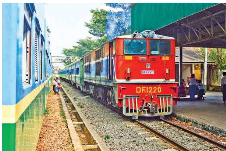
Travel times will halve when the upgrade is completed in 2021.

Small and family-run businesses with a workforce comprising less than 15 workers also need to sign employment contracts in accordance with a wage agreed between them.—GNLM