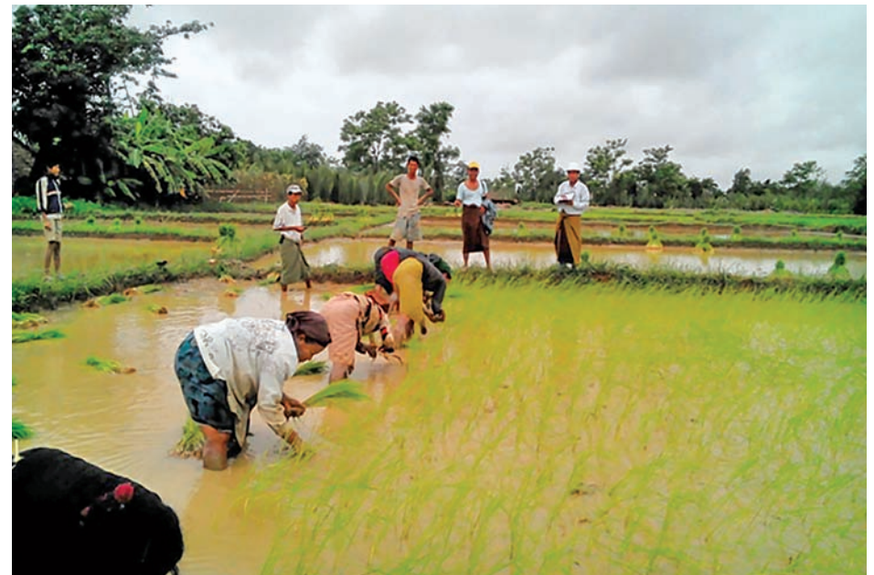
Local farmers replant paddy saplings at flood-hit farmland.