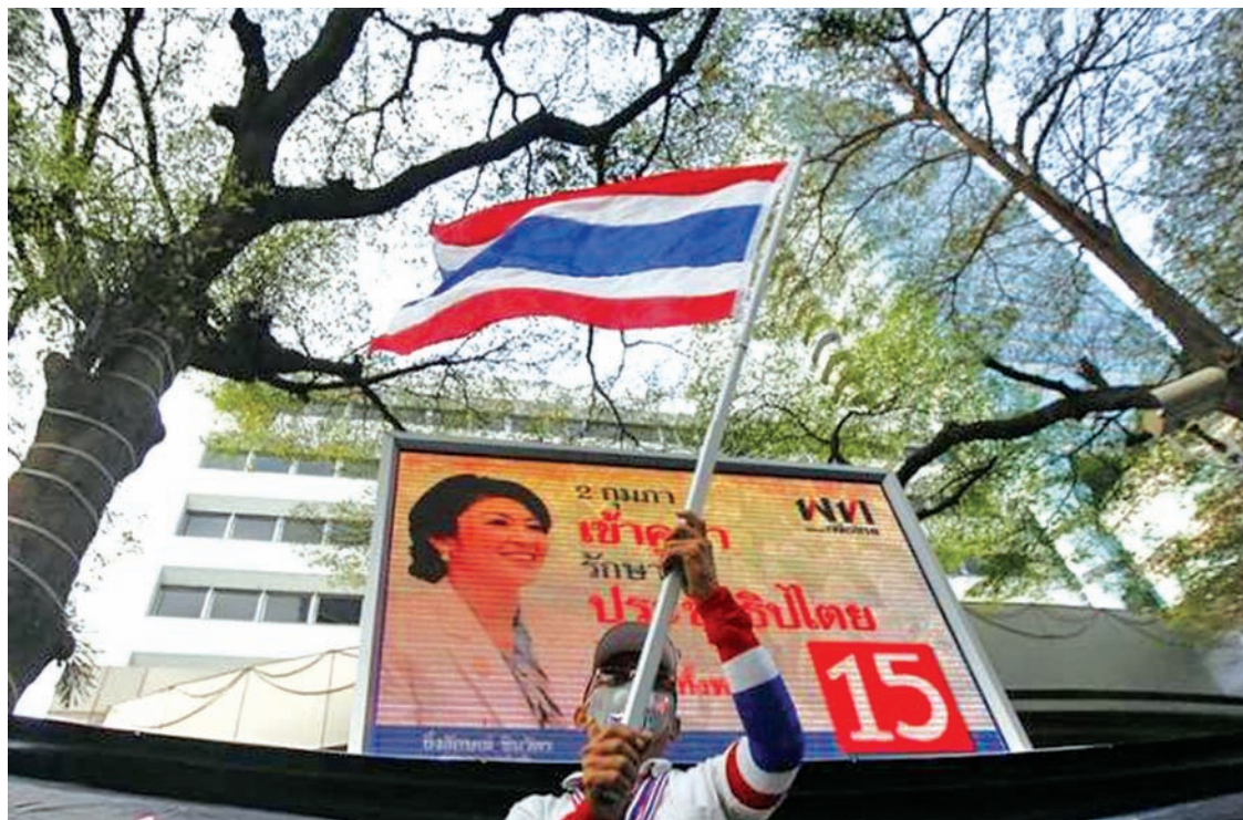
An anti-government protester waves a Thai national flag under a picture of Thailand's Prime Minister Yingluck Shinawatra during a rally outside the Puea Thai party in Bangkok March 5, 2014.

Of particular concern is a proposal for a 23-member National Strategic Reform and Reconciliation committee dominated by the military that allows security to intervene in a time of crisis.