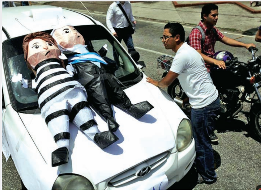
A cab driver looks at pinatas depicting former Vice President Roxana Baldetti (L) and Guatemalan President Otto Perez Molina during a demonstration demanding the resignation of Perez Molina in Guatemala City, Guatemala, August 27, 2015.

GUATEMALA CITY, 28 Aug — Tens of thousands of Guatemalans took to the streets on Thursday to demand the resignation of President Otto Perez, who has refused to quit in the face of accusations by his attorney general that he was involved in a lucrative customs racket.