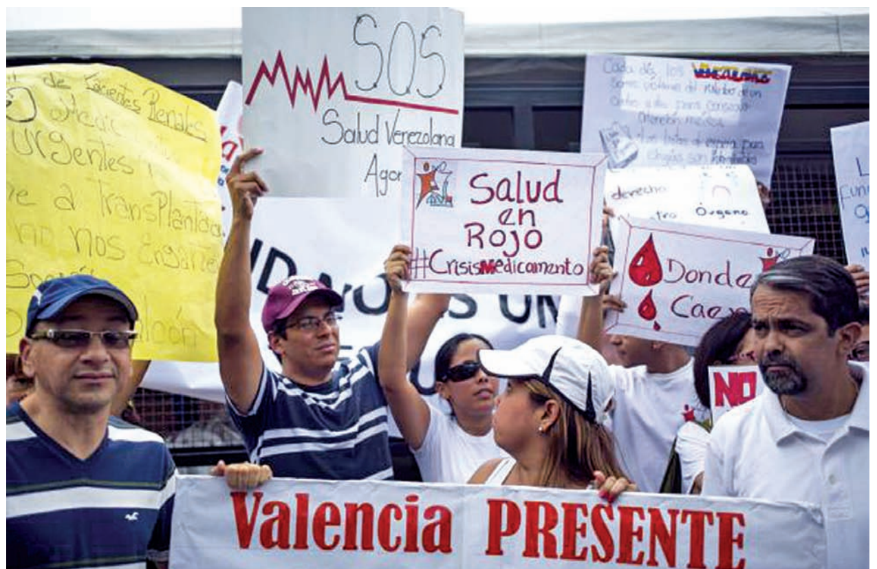
Protesters hold placards during a gathering in demand for medicines in Caracas, Venezuela August 27, 2015.

The government did not reply to requests for comment but Venezuela’s Social Security Institute said in a