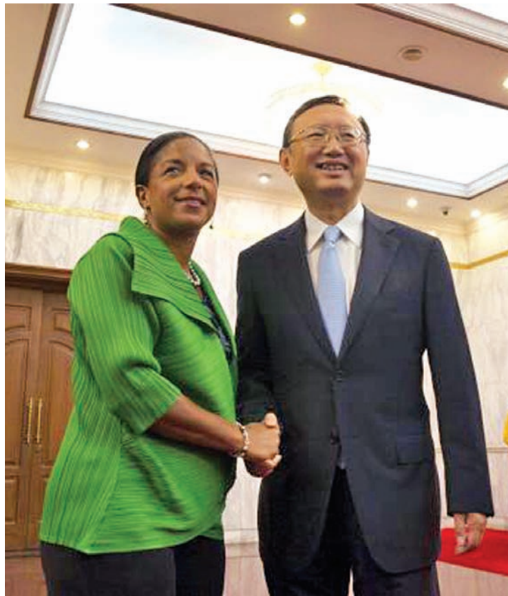
U.S. National Security Advisor Susan Rice (L) shakes hands with Chinese State Councilor Yang Jiechi at the Diaoyutai State Guesthouse in Beijing, China August 28, 2015.

BEIJING, 28 Aug — China and the United States stressed the positives in their complex relationship on Friday during meetings between US National Security Adviser Susan Rice and Chinese officials ahead of a US visit by Chinese President Xi Jinping next month.