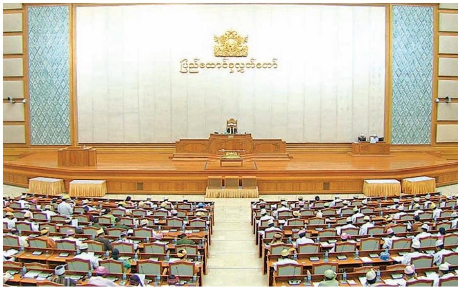
MPs attend final day in 12 th regular session of Pyidaungsu Hluttaw.