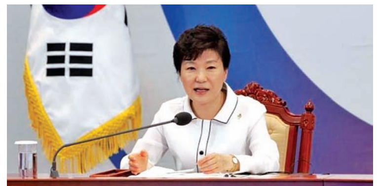
South Korean President Park Geun-hye

military aides, Kim called the accord a landmark that should pave the way for defused tension and improved ties, the North's official media said on Friday.