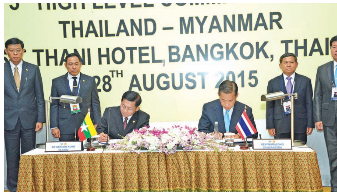
Senior General Min Aung Hlaing and Thai Supreme Commander General Worapong Sanganetra sign agreement of the meeting.—MYAWADY

The three-day talks took place from August 24 to 26 in Bangkok and focused on issues such as drug elimination, exchange visits, joint sporting competitions for Myanmar and Thailand armed forces, counter-terrorism and border security.—Myawady