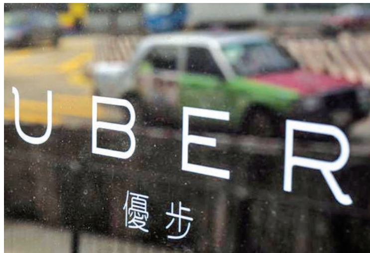
A taxi is reflected in a window at the office of taxi-hailing service Uber Inc in Hong Kong, China August 12, 2015.

BEIJING/SHANGHAI, 28 Aug — Uber Technologies Inc's China arm has closed its $1 billion fundraising round early, according to two people with knowledge of the matter, with investors still hopeful for the US-based ride service despite strong domestic competition.