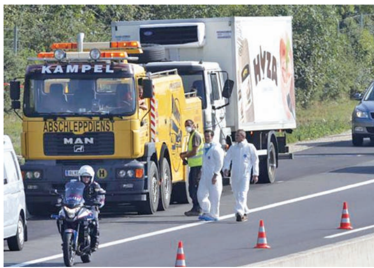
A truck in which up to 50 migrants were found dead, is prepared to be towed away on a motorway near Parndorf, Austria August 27, 2015.

The Libyan coast guard has limited capabilities, relying on