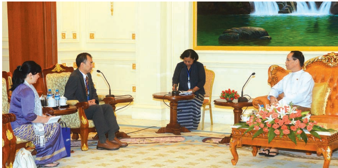
Vice President Dr Sai Mauk Kham receives with Mr Soichi Noguchi, an astronaut and chief of Japan Aerospace Exploration Agency (JAXA).