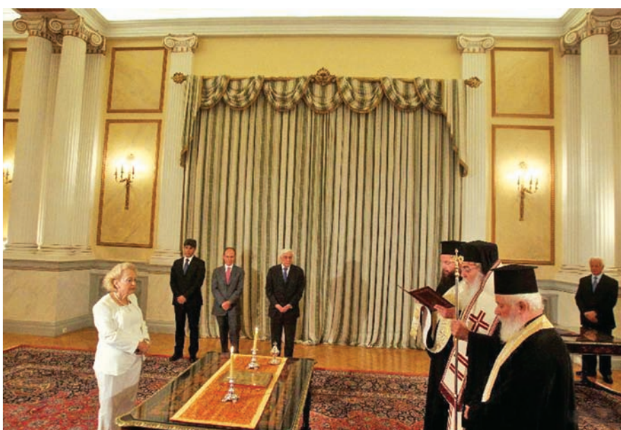
Vassiliki Thanou(L) takes an oath during a swearing in ceremony at the Presidential Palace in Athens, Greece, on Aug. 27, 2015. Greece's Supreme Court chief judge Vassiliki Thanou was appointed on Thursday to head the transitional government that will lead Greece to snap general elections in September, becoming the country's first female prime minister.—XINHUA