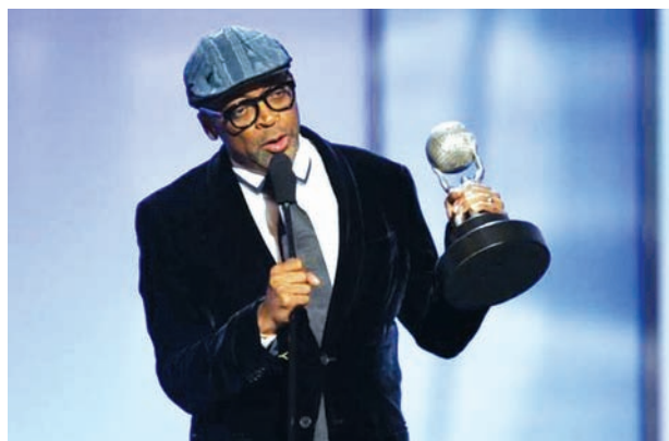
Director Spike Lee accepts the President's Award at the 46th NAACP Image Awards in Pasadena, California February 6, 2015.

LOS ANGELES, 28 Aug — Director Spike Lee and actresses Gena Rowlands and Debbie Reynolds will receive honorary Oscars for their filmmaking legacies, the organizers of the world's most coveted movie awards said Thursday.