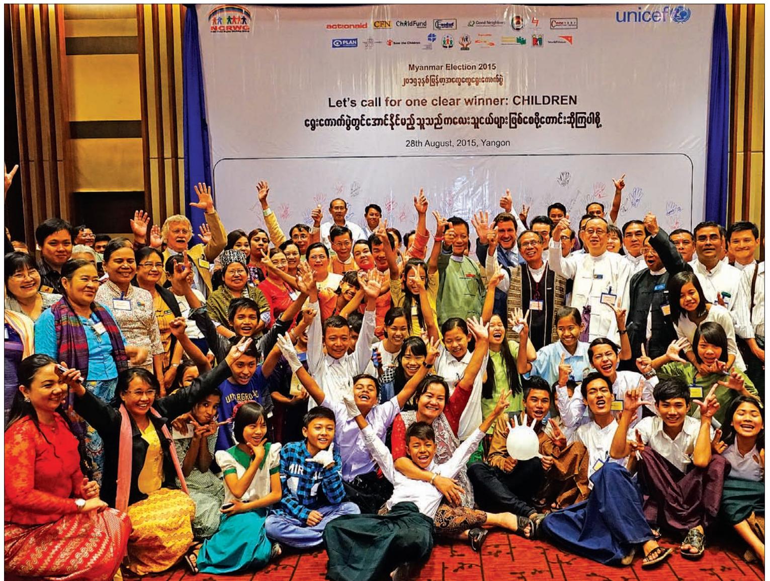
Event attendees raise their hands in support of calling on politicians to put children at the heart of their policies.