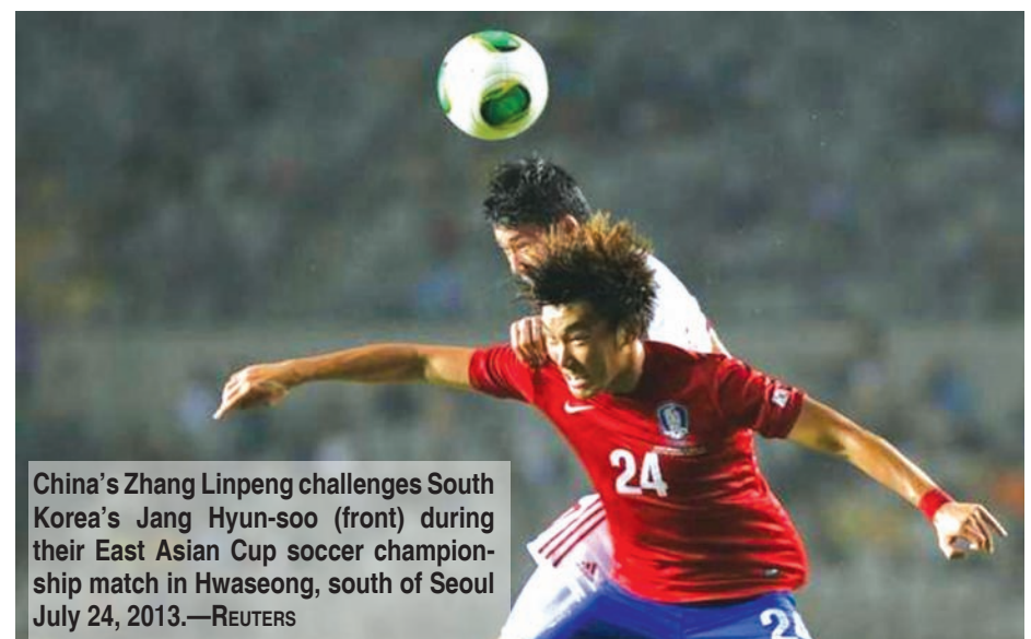
China's Zhang Linpeng challenges South Korea's Jang Hyun-soo (front) during their East Asian Cup soccer championship match in Hwaseong, south of Seoul July 24, 2013.

and their run to the 2013 Asian Champions League title. He carries the nickname 'Zhangmos' in China in a nod to Real Madrid's stalwart defender Sergio Ramos. Chelsea have endured a sketchy start to their English title defence, shipping an unusually high seven goals in their first three matches.—Reuters