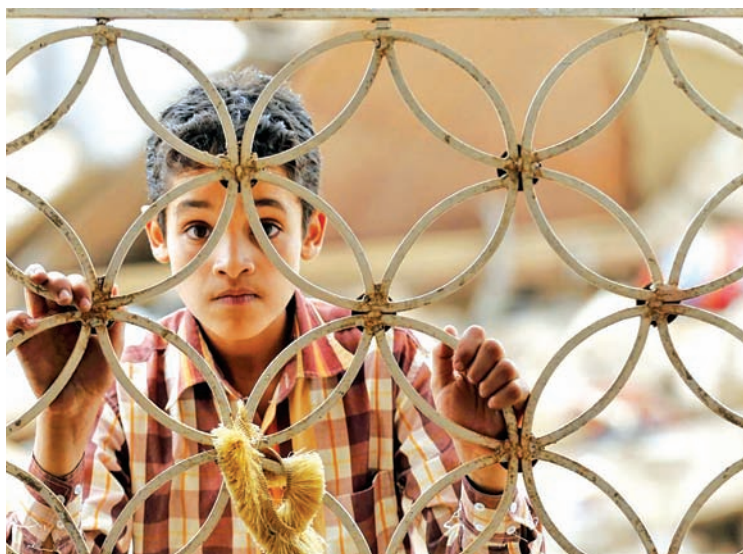
A boy looks through the window grills of a house that was damaged by a Saudi-led air strike in Yemen's capital Sanaa August 26, 2015.

SANAA / RIYADH, 28 Aug — Weeks after seizing Yemen's southern port, Aden, members of a Saudi-led military coalition and the local fighters it supports say they are poised to oust Iranian-allied Houthi forces from the capital Sanaa.