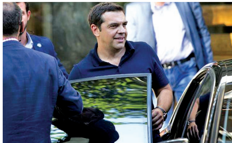
Greek outgoing Prime Minister Alexis Tsipras leaves his party's headquarters in Athens, Greece, August 21, 2015.

ATHENS, 28 Aug — Former Greek Prime Minister Alexis Tsipras’ leftist Syriza will emerge as the biggest party after next month’s election but without the sizeable margin it was hoping for, the first major opinion poll since he resigned last week showed.