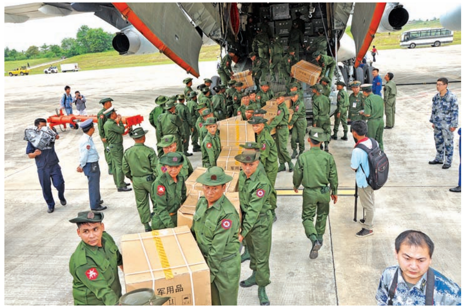
Tatmadawmen unloading relief supplies from aircraft of Chinese People's Liberation Army at Nay Pyi Taw Airport.