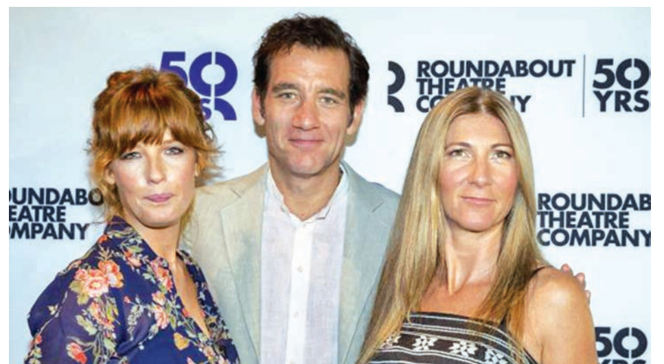
Cast members Kelly Reilly (L), Clive Owen (C) and Eve Best pose together during a photo call for the Broadway revival of 'Old Times' at American Airlines Theater in New York, August 26, 2015.

Radiohead singer and songwriter Thom Yorke has written the music for the play. "Old Times" officially opens on Oct. 6 at the American Airlines Theatre, running until Nov. 29. Previews start on Sept. 17.—Reuters