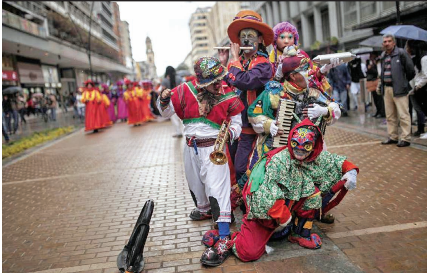
Artists of a theater company take part in the inaugural parade of the 10th International Street Theater Festival "Al Aire Puro" in Bogota, Colombia, on Aug. 27, 2015. The festival is held from Aug. 27 to 30 and about 60 performances will be held in various parts of the city.