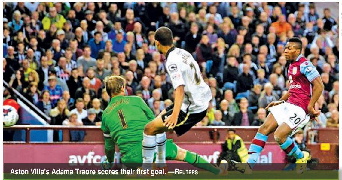
Aston Villa's Adama Traore scores their first goal.