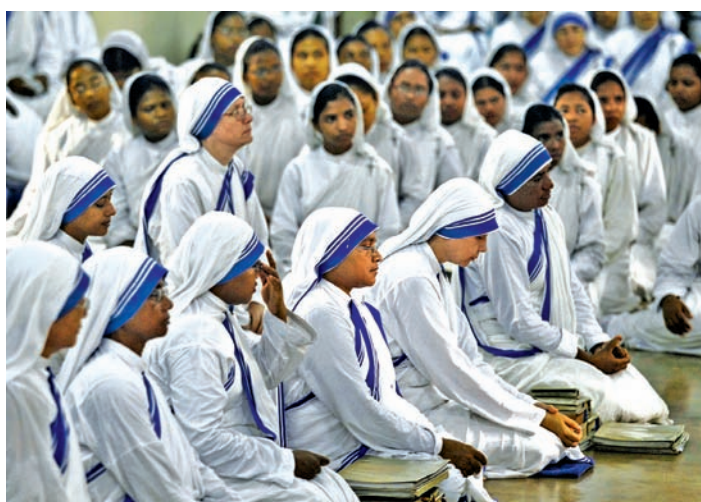
Catholic nuns from the Missionaries of Charity, the global order of nuns founded by Mother Teresa, take part in a mass service to mark the 105th birth anniversary of Mother Teresa in Kolkata, India, August 26, 2015. Teresa, a Nobel Peace Prize winner who died in 1997, was beatified by Pope John Paul II in 2003 at the Vatican.

In their agreement reached just after midnight on Tuesday, the two sides pledged to hold talks to discuss a range of issues on improving ties.—Reuters