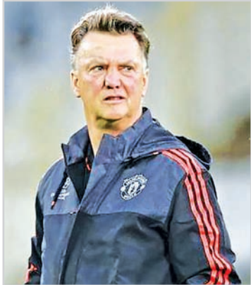
Manchester United's manager Louis van Gaal during training.

LONDON, 26 Aug — Manchester United manager Louis van Gaal hinted he could play Belgium international midfielder Marouane Fellaini, who scored seven goals last season, higher up the field this campaign.