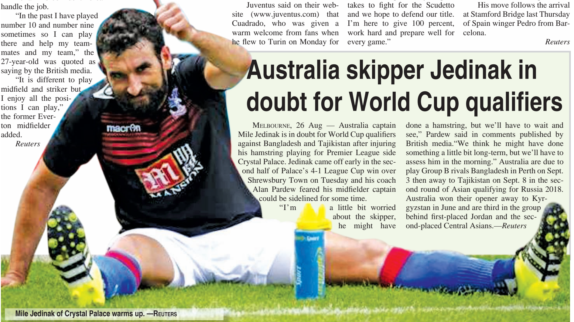
Mile Jedinak of Crystal Palace warms up.

done a hamstring, but we'll have to wait and see," Pardew said in comments published by British media. "We think he might have done something a little bit long-term, but we'll have to assess him in the morning." Australia are due to play Group B rivals Bangladesh in Perth on Sept. 3 then away to Tajikistan on Sept. 8 in the second round of Asian qualifying for Russia 2018. Australia won their opener away to Kyrgyzstan in June and are third in the group behind first-placed Jordan and the second-placed Central Asians.—Reuters