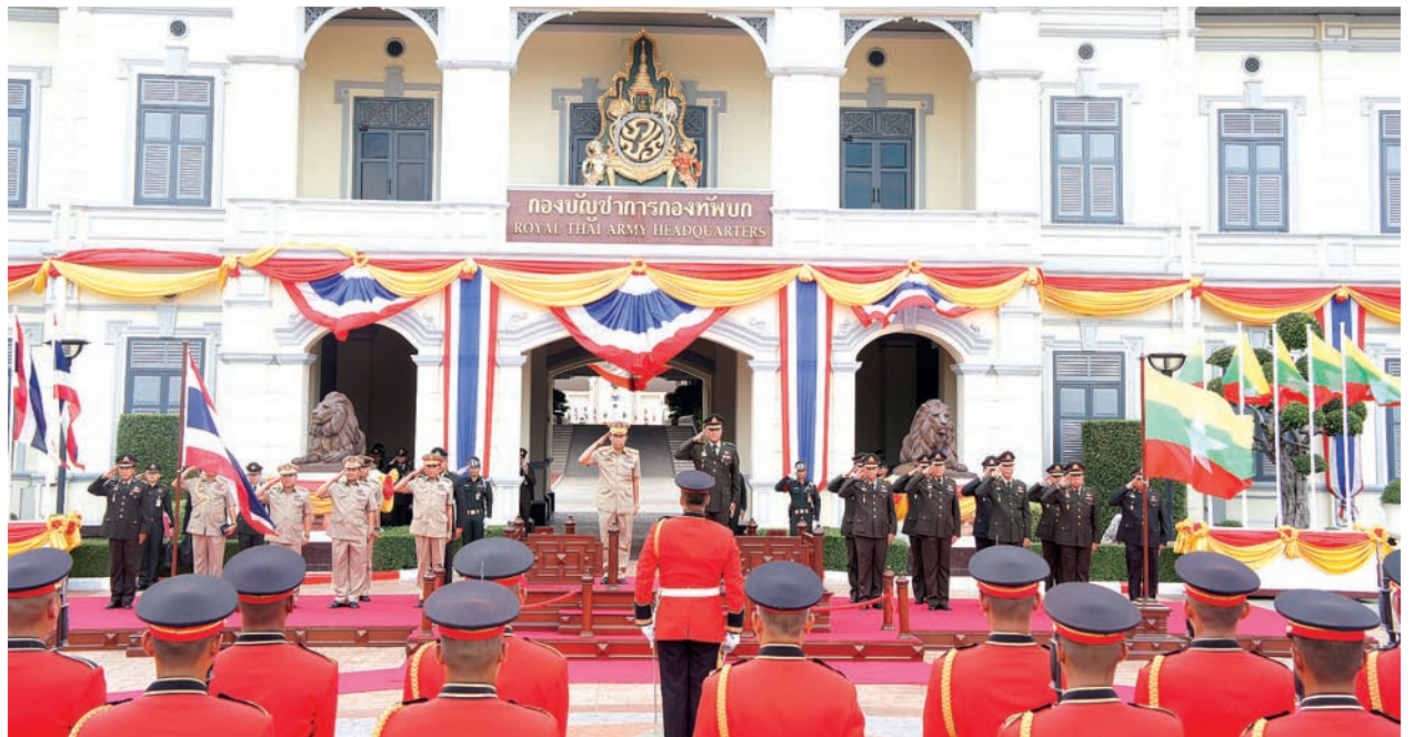
Vice-Senior General Soe Win and Royal Thai Commander-in-Chief (Army) General Udomdej Sitabutr take salute of Guard of Honour at welcoming ceremony.—MYAWADY