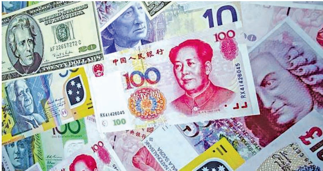
An advertisement poster promoting China's renminbi (RMB) or yuan , U.S. dollar and Euro exchange services is seen outside at foreign exchange store in Hong Kong, China August 13, 2015.

Central banks from South Korea to Thailand have deferred rate cuts, which would put further downward pressure on vulnerable currencies, with the result that growth and stimulus plans are