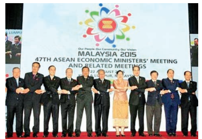
Economic ministers joining hands at 47 th ASEAN Economic Ministers Meeting.