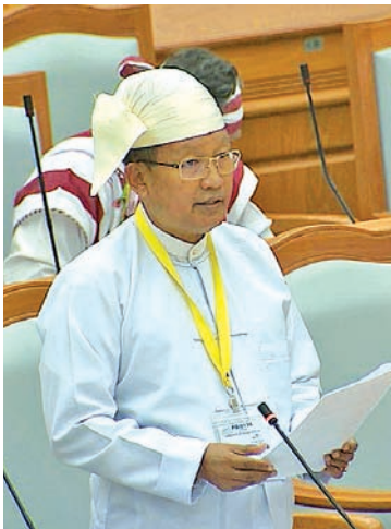
Deputy Minister for Foreign Affairs U Tin Oo Lwin.