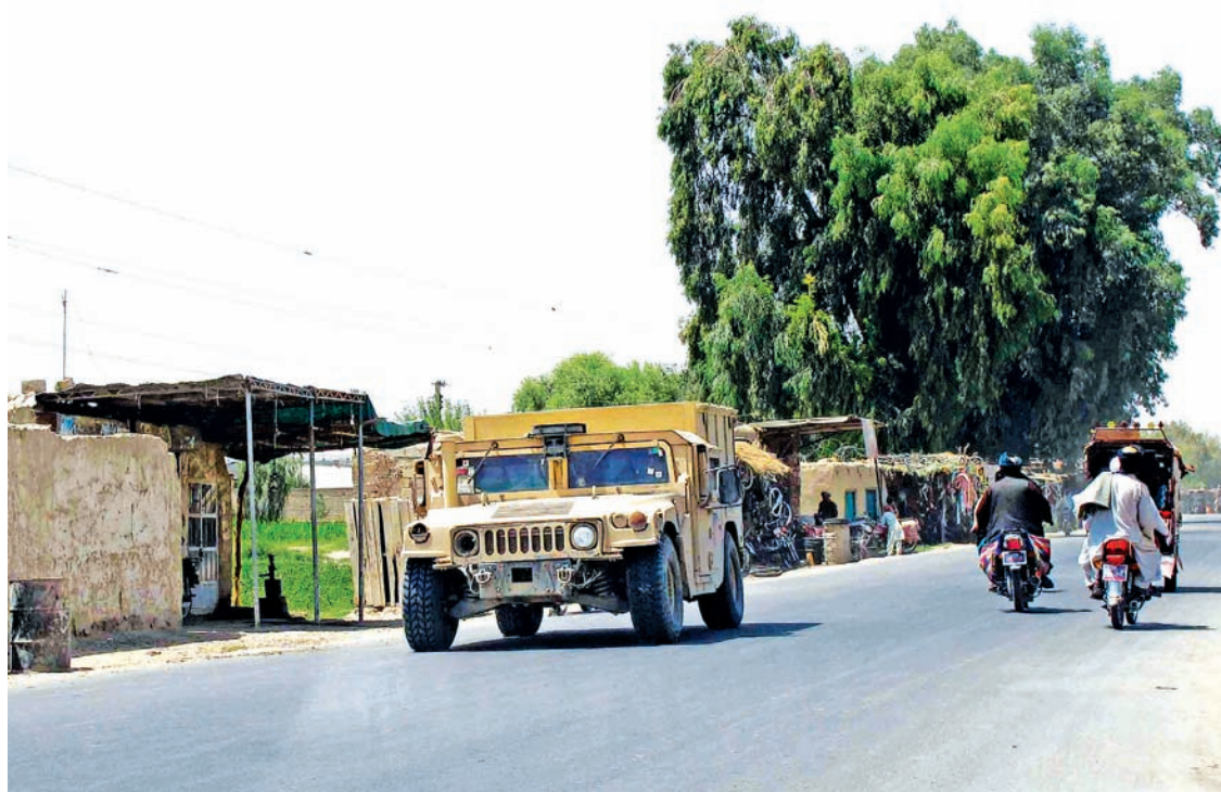
An Afghan National Police armored vehicle patrols on a street in Lashkar Gah capital of Helmand province, Afghanistan August 26, 2015. The Taliban seized a district headquarters in Afghanistan's Helmand province on Monday despite U.S. air strikes to repel them, and two NATO soldiers were shot dead by uniformed men on an army base in the area, a stronghold for militants and opium.

LASHKAR GAH, (Afghanistan), 26 Aug — The Taliban seized a district headquarters in Afghanistan's Helmand province on Monday despite U.S. air strikes to repel them, and two NATO soldiers were shot dead