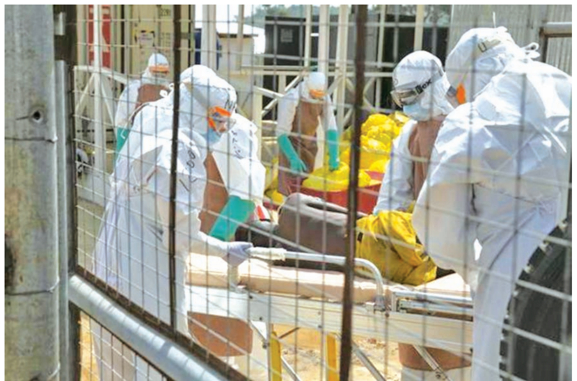
British health workers lift an Ebola patient onto a wheeled stretcher at the Kerry town Ebola treatment centre outside Freetown, Sierra Leone December 22, 2014.