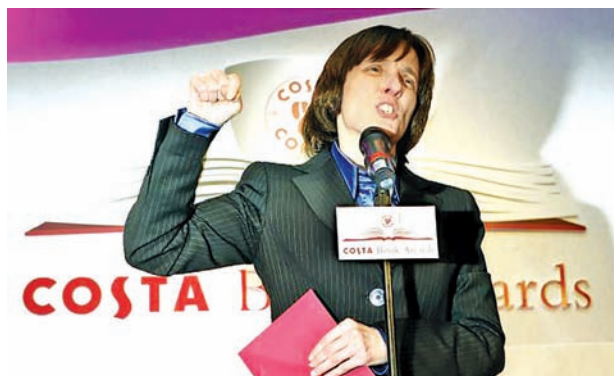
Author A L Kennedy reacts after winning the Costa Book Award with her book "Day" at the Intercontinental Hotel in central London in this file photograph dated January 22, 2008.

Fellow of the Royal Society of Literature and a Costa Book Award winner, has just switched dimensions into sci-fi by publishing "The Drosten's Curse", her first novel starring the face-changing time lord first made famous on BBC TV.