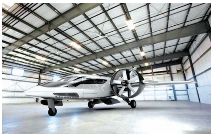
An artist rendering shows a TriFan 600 aircraft with the ability to both takeoff and land vertically, in this image released by XTI Aircraft Company on August 25, 2015.—REUTERS

XTI launched the equity crowdfunding campaign under new rules approved by the U.S. Securities and Exchange Commission in March 2015. Equity crowdfunding is when private in-