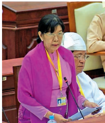
Deputy Minister for Health Dr Daw Thein Thein Htay.—MNA