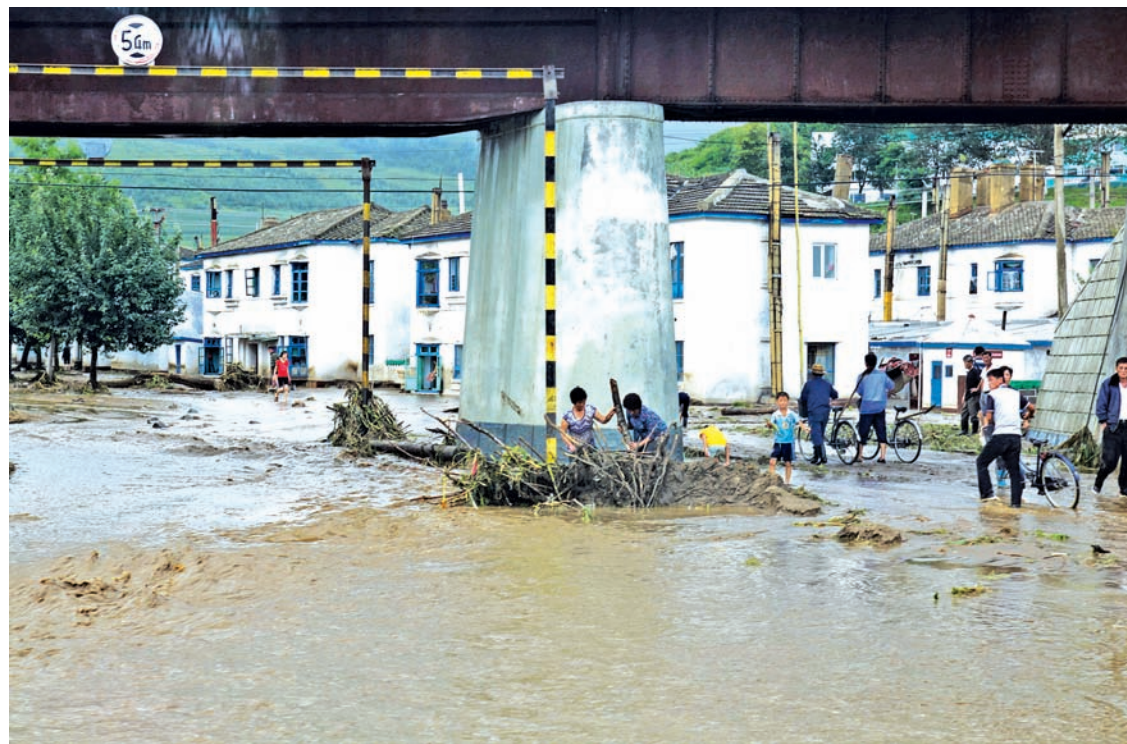
Residents attempt to clear flood debris from under a bridge in the city of Rajin in North Korea in this August 22, 2015 picture taken by a recent visitor.—REUTERS

Following the downpour, authorities in neighbouring Chi-