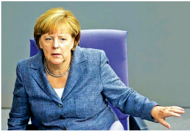
German Chancellor Angela Merkel attends a session of Germany's parliament, the Bundestag, in Berlin, Germany, August 19, 2015.

With refugee shelters in the country being attacked almost daily and politicians warning of a rise in xenophobia, Chancellor Angela Merkel's cabinet agreed a draft law to bring forward the transfer of 500 million euros