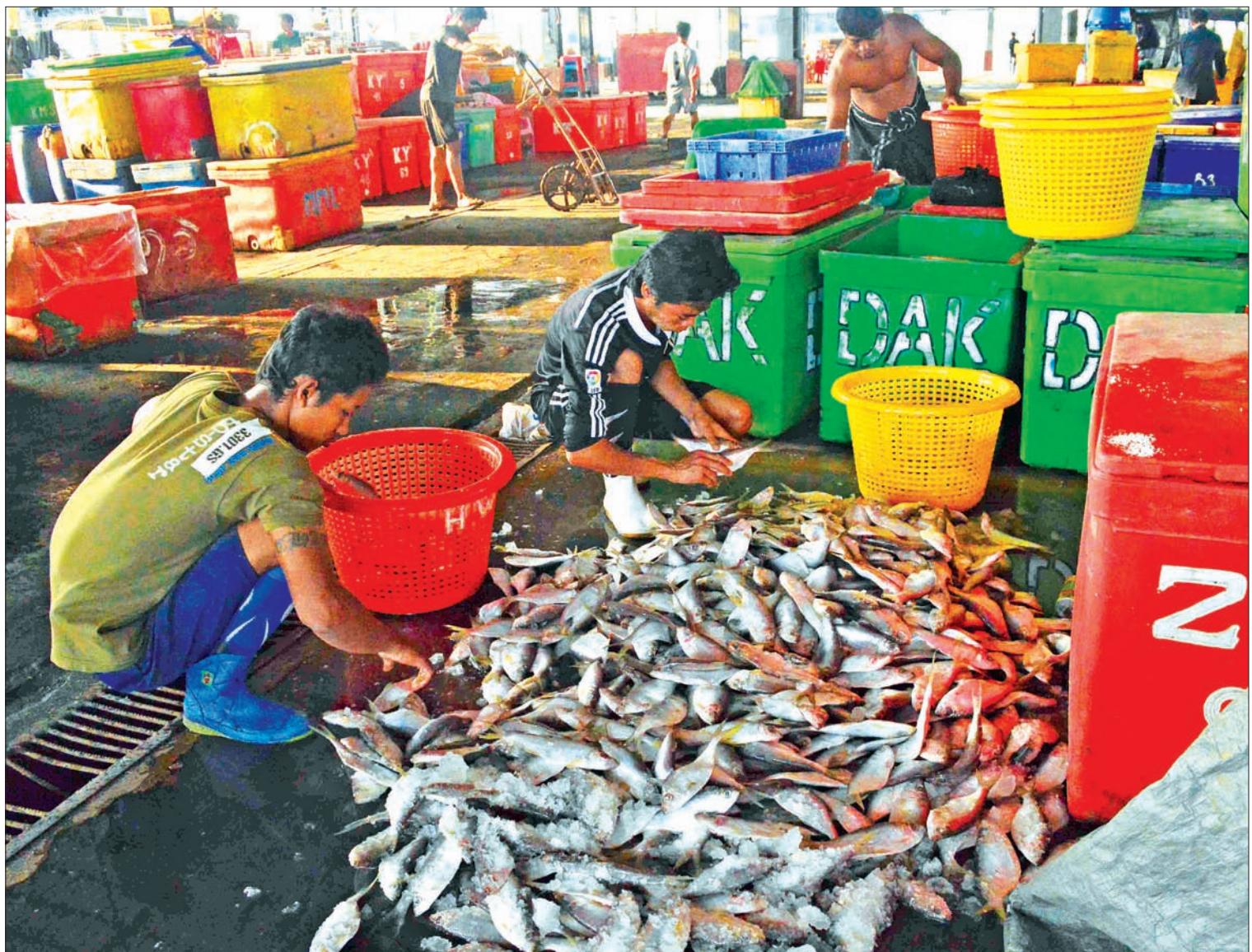
Workers sort through the afternoon catch at a fish market in Kyimyindine Township in Yangon.

The ministry's Rural Development Department also announced that it will cost around K 28 billion to rebuild infrastructure damaged by the floods.—GNLM