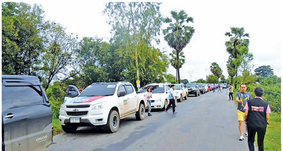
A 26-car motorcade comprised of Thai drivers passes through Myanmar.

The ministry also noted that Myanmar has been selected as 'Destination of the Year' in 2015 by Singapore-based TTG Travel Trade Publishing. The award will be presented to Myanmar during the 26th Annual TTG Travel Awards 2015 in Bangkok on 1 October.