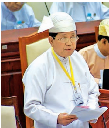
Deputy Minister for LFRD U Tin Ngwe.—MNA