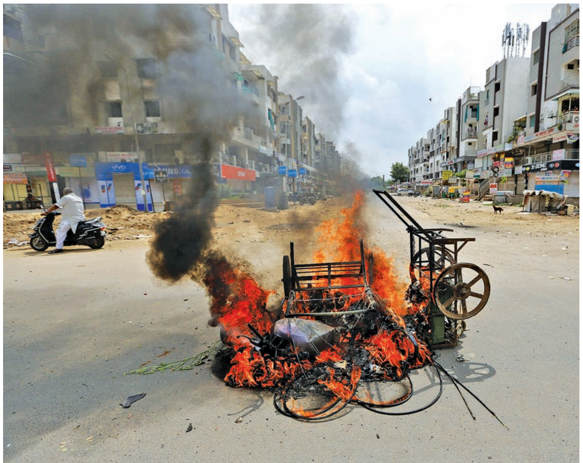
A man on a scooter stands next to burning vehicles after the clashes between the police and protesters in Ahmedabad, India, August 26, 2015. India deployed paramilitary forces and imposed a curfew in the western state of Gujarat on Wednesday after violence broke out at a protest led by a powerful clan to demand more government jobs and college places.—REUTERS

But they say that caste-based reservations deprive them of opportunities. They insist the government should put an end to affirmative action policies that favour Muslims, low-caste Hindus and Other Backward Classes - a collective term covering socially and educationally deprived