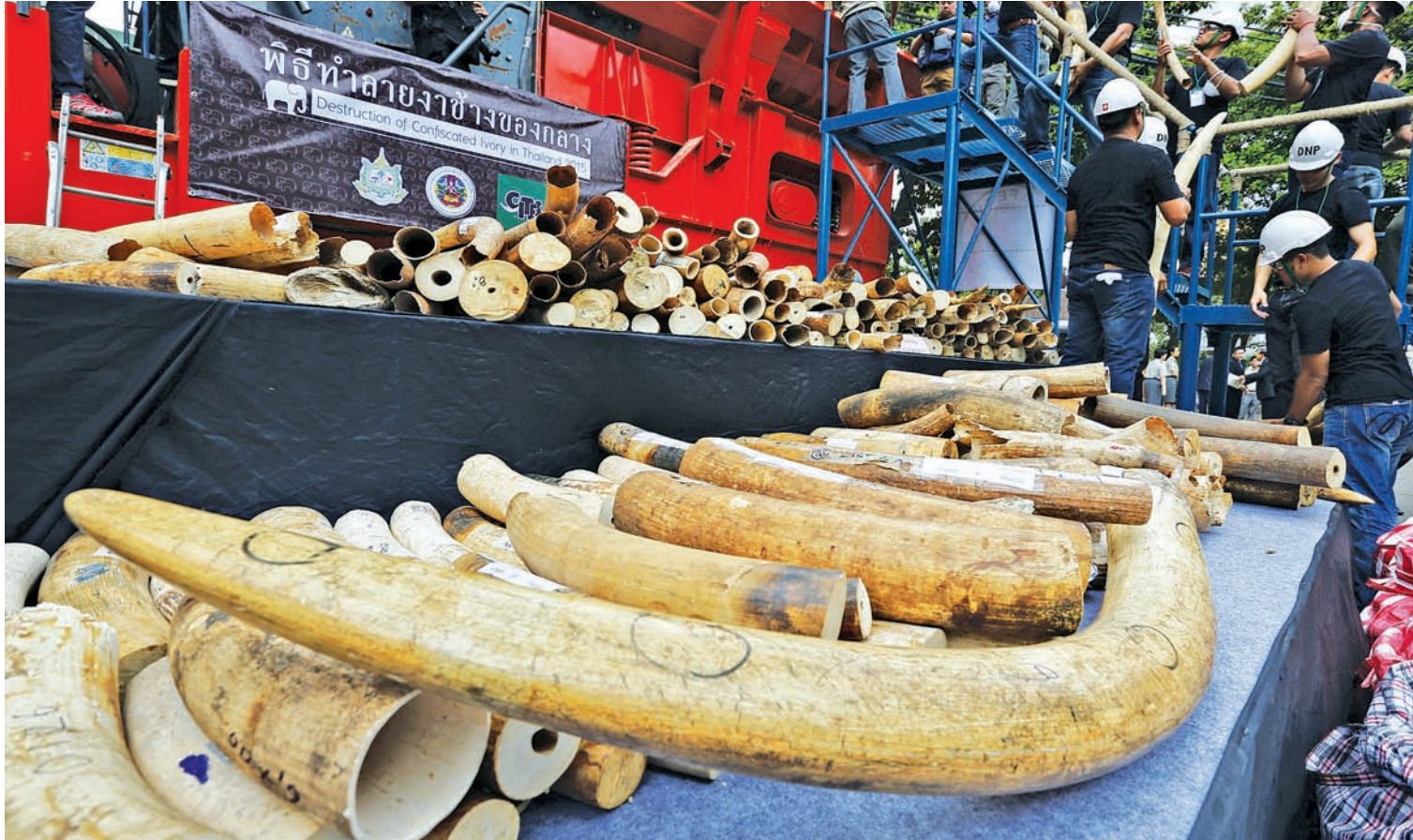
Officials hold confiscated elephant tusks before destroying the ivory at the Department of National Parks, Wildlife and Plant Conservation, in Bangkok, Thailand, August 26, 2015.

BANGKOK, 26 Aug — Wildlife officials in Thailand destroyed more than two tonnes of confiscated ivory worth around $3 million on Wednesday in what one rights group called a milestone in the fight against the illegal trade.