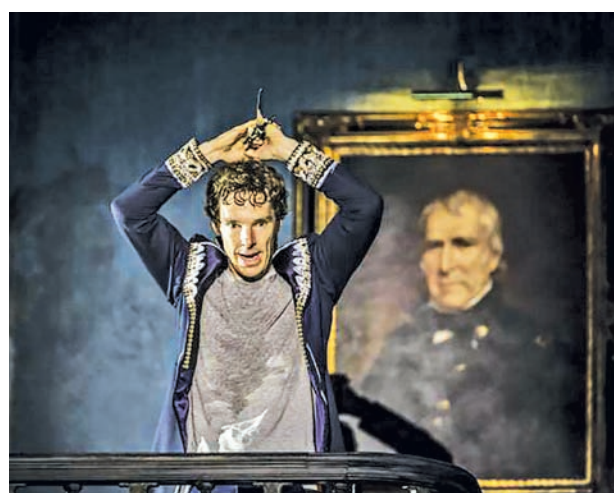
Actor Benedict Cumberbatch performs in Director Lyndsey Turner's production of Hamlet at the Barbican, in London, August 4, 2015, in this handout picture and released August 8, 2015.

Displaying the quick wit and mental acuity of his television detective "Sherlock," Hamlet figures