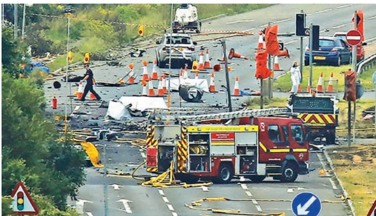
Emergency services and crash investigation officers work at the site where a Hawker Hunter fighter jet crashed onto the A27 road at Shoreham near Brighton, Britain August 23, 2015.

LONDON, 23 Aug — A jet aircraft ploughed into several cars on a busy road near an airshow in southern England on Saturday, killing at least seven people, police said.