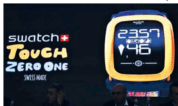
The new 'Swatch Touch Zero One' is seen on a screen during the Swiss watchmaker's annual news conference in Corgemont March 12, 2015.

On top of its Touch Zero One, which can track the distance the wearer travels and help beach volleyball players measure the power of their hits, Swatch is planning to launch watches with an embedded "near field communication" chip this year.—Reuters