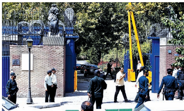
The convoy of British Foreign Secretary Philip Hammond enters the British Embassy in Tehran August 23, 2015.

Philip Hammond declared the embassy open and raised the Union Jack flag in the garden of the nineteenth-century residence in the Iranian capital that was stormed by protesters nearly four years ago.