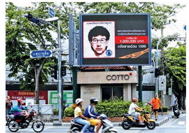
People ride their motorcycles past a digital billboard showing a sketch of the main suspect in Monday's attack on Erawan shrine, in Bangkok, Thailand, August 23, 2015.

Economic woes could undermine the military government as it steers the country towards an election next year under a new constitution critics say will not end a decade of turbulent politics.