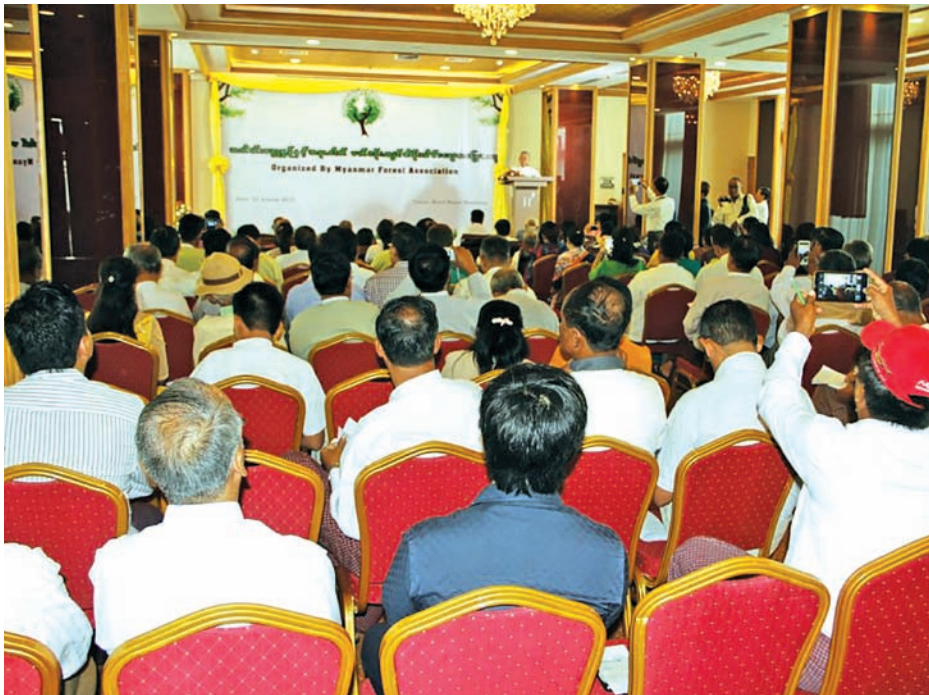
Forestry experts holding talks on environmental conservation in Myanmar with past, present and future prospects.—TIN MAUNG (MANDALAY)

MANDALAY, 23 Aug — A talk entitled “past, present and future environmental conservation in Myanmar” was staged at the hotel in Mahaaungmye Township, here, on 22 August.