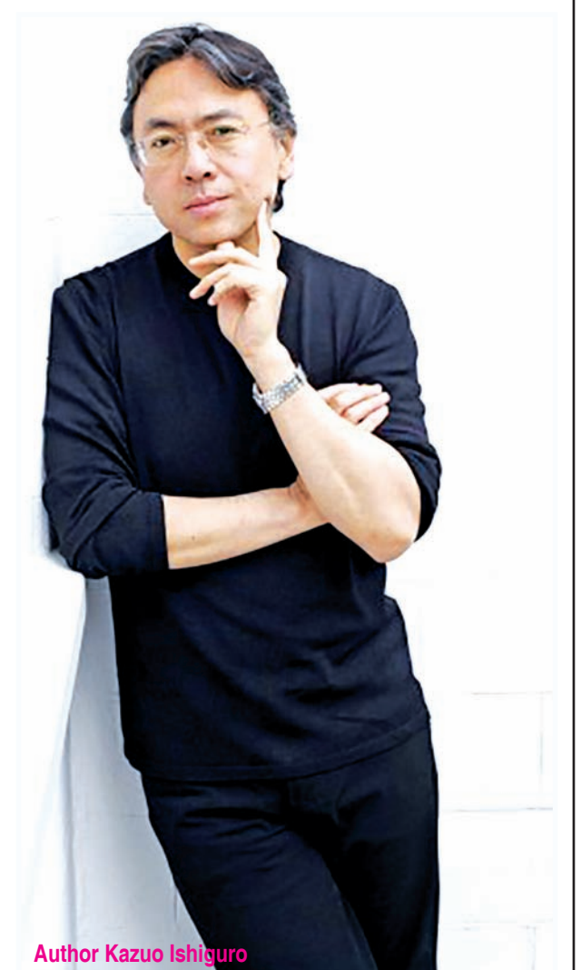
Author Kazuo Ishiguro

There is also a short novel that soon followed, called “To Remember a