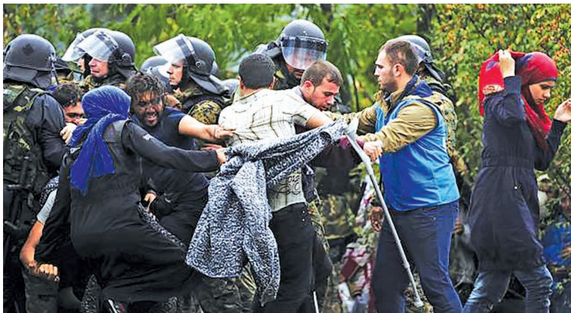
Migrants make their way through a police line to cross Greece's border into Macedonia near Gevgelija, Macedonia, August 22, 2015.

GEVVELIJA, (Macedonia), 23 Aug — Thousands of migrants stormed across Macedonia's border on Saturday, overwhelming security forces who threw stun grenades and lashed out with batons before apparently abandoning a bid to stem their flow through the Balkans to western Europe. Some had spent days in the open with little or no food or water after Macedonia on Thursday