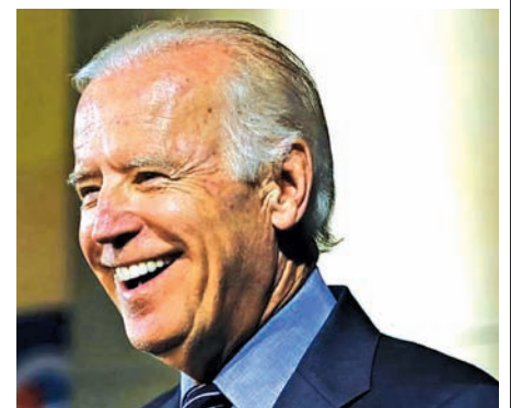
U.S. Vice President Joe Biden smiles as he delivers remarks at the U.S.-Ukraine Business Forum in Washington July 13, 2015.

But his late entry into the race and Clinton's formidable lead in infrastructure and fundraising would put him at a disadvantage.