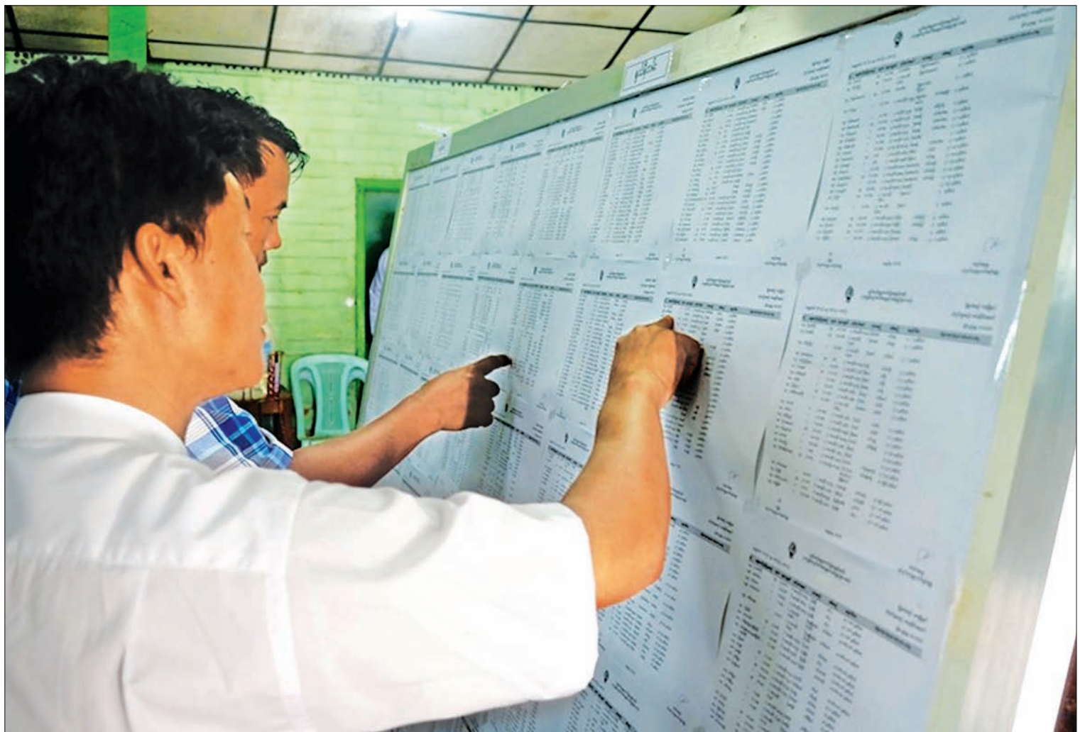
People check voter list at West Sawyanpaing Ward in Ahlon Township.—Po Htaung

The General Election 2015 has been scheduled for 8 November.— Ye Khaung Nyunt