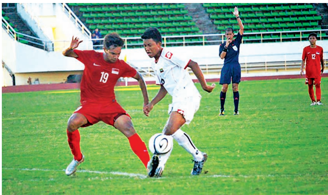
After a quick recharge and some words of wisdom from

At the end of a tough 45 minutes, the score was level as both teams gleefully headed to the dressing rooms for a much deserved break.