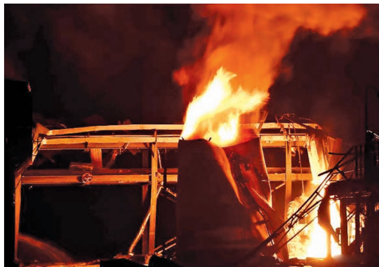
Runxing Chemical Technology Co. Ltd. is on fire due to explosions at Dongfu Village in Huantai County, east China's Shandong Province, Aug. 23, 2015. Nine people were injured in a blast ripping through the chemical plant in Huantai Saturday night.