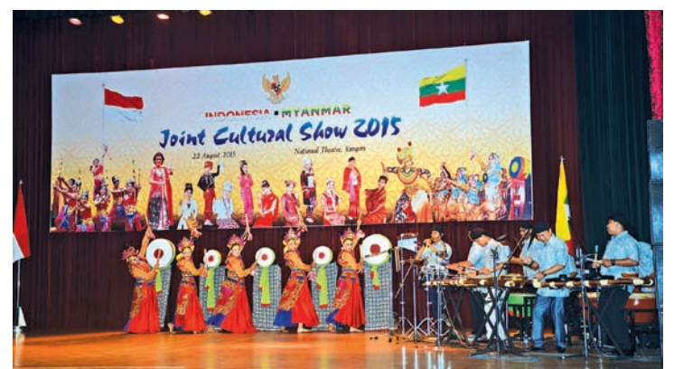
Indonesian artists perform traditional dances at Indonesia-Myanmar Joint Cultural Show 2015.

YANGON, 23 Aug — The Indonesia-Myanmar Joint Cultural Show 2015 was staged at the National Theatre on Myoma Kyaung Street, here, on 22 August.