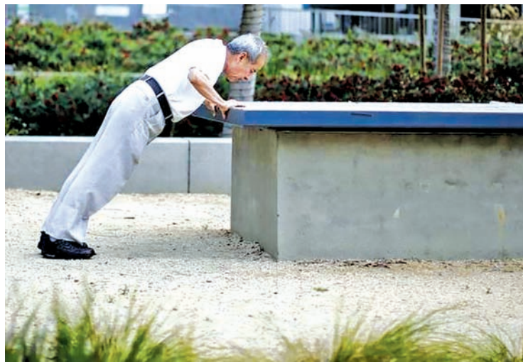
A man exercises in downtown Los Angeles, California, March 9, 2015.

For the new study, Hupin's team looked at whether less exercise could still be beneficial.