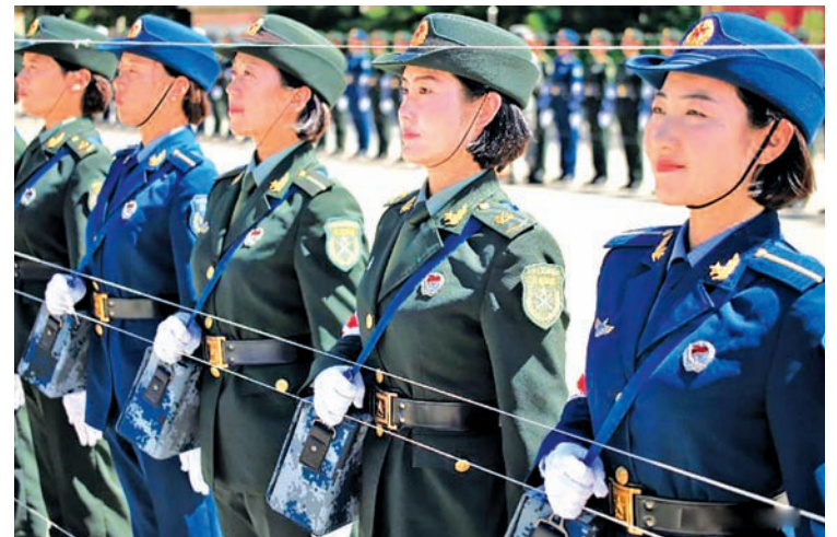
Soldiers take part in a training for a military parade in Beijing, capital of China, Aug. 4, 2015. China will hold a grand military parade on Sept. 3 to mark the 70th anniversary of the victory of the Chinese People's War of Resistance.—XINHUA

For the most formal occasions, such as the visit of a foreign head of the state, there are normally 151 honor guards from the army, navy and air force at the