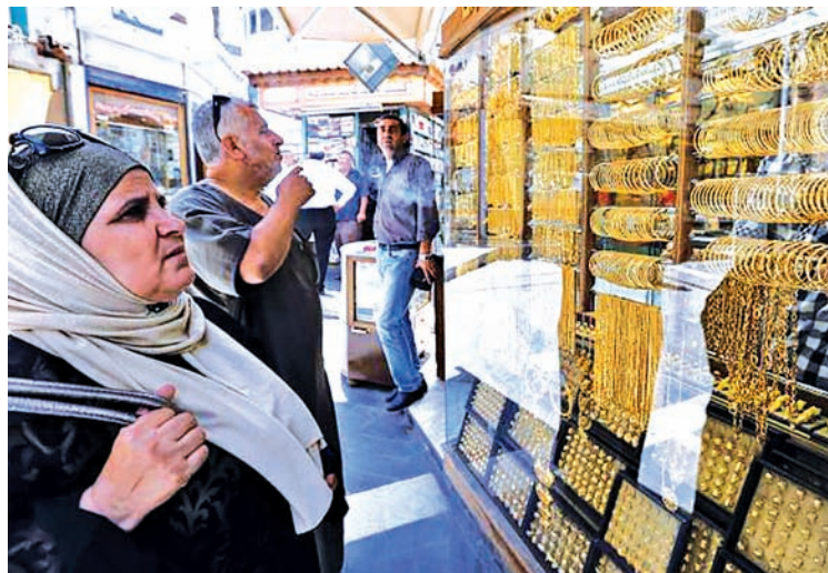
Customers look at gold jewellery displayed at a shop in Amman, Jordan July 27, 2015.

PANAJI, (India), 23 Aug — Gold prices XAU= could rise above $1,200 an ounce in the next few months as fears of a currency war following the devaluation of the yuan make equity markets choppy, boosting physical gold and ETF buying, leading industry analysts said at a conference.