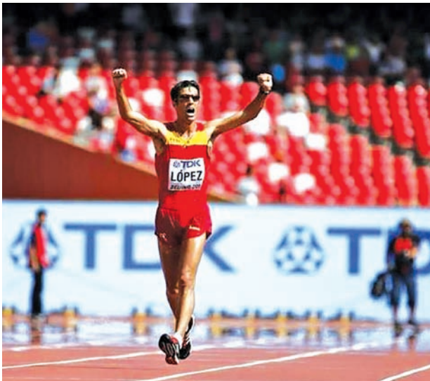
Miguel Angel Lopez of Spain celebrates winning the men's 20 km race walk final at the 15th IAAF World Championships at the National Stadium in Beijing, China August 23, 2015.

BEIJING, 23 Aug — Spain's Miguel Angel Lopez hauled in Wang Zhen to win the men's 20 kilometre race walk on Sunday and deny China their first gold medal of their home world athletics championships. The 27-year-old European champion hung tough as a group of five Chinese