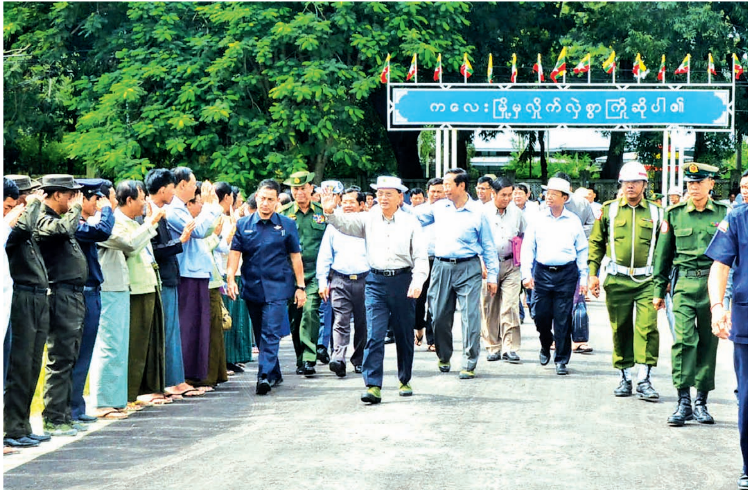
President U Thein Sein waving at departmental officials and local people at entrance to Kalay.

The chief minister accepted JCB heavy machinery, computers, printers, science lab equipment, library materials and band equipment donated by Alliance Star Group Company and MPRL