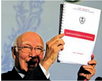
Advisor to Pakistan's Prime Minister on National Security and Foreign Affairs Sartaj Aziz, shows dossiers on Indian intelligence agency's involvement in promoting terrorism in Pakistan, during a news conference at the Foreign Ministry in Islamabad, Pakistan, August 22, 2015.

NEW DELHI / ISLAMABAD, 23 Aug — The collapse of planned peace talks between India and Pakistan hours before they were to start on Sunday has raised questions about the arch-rivals' willingness to overcome mutual mistrust, built since their separation almost seven decades ago.