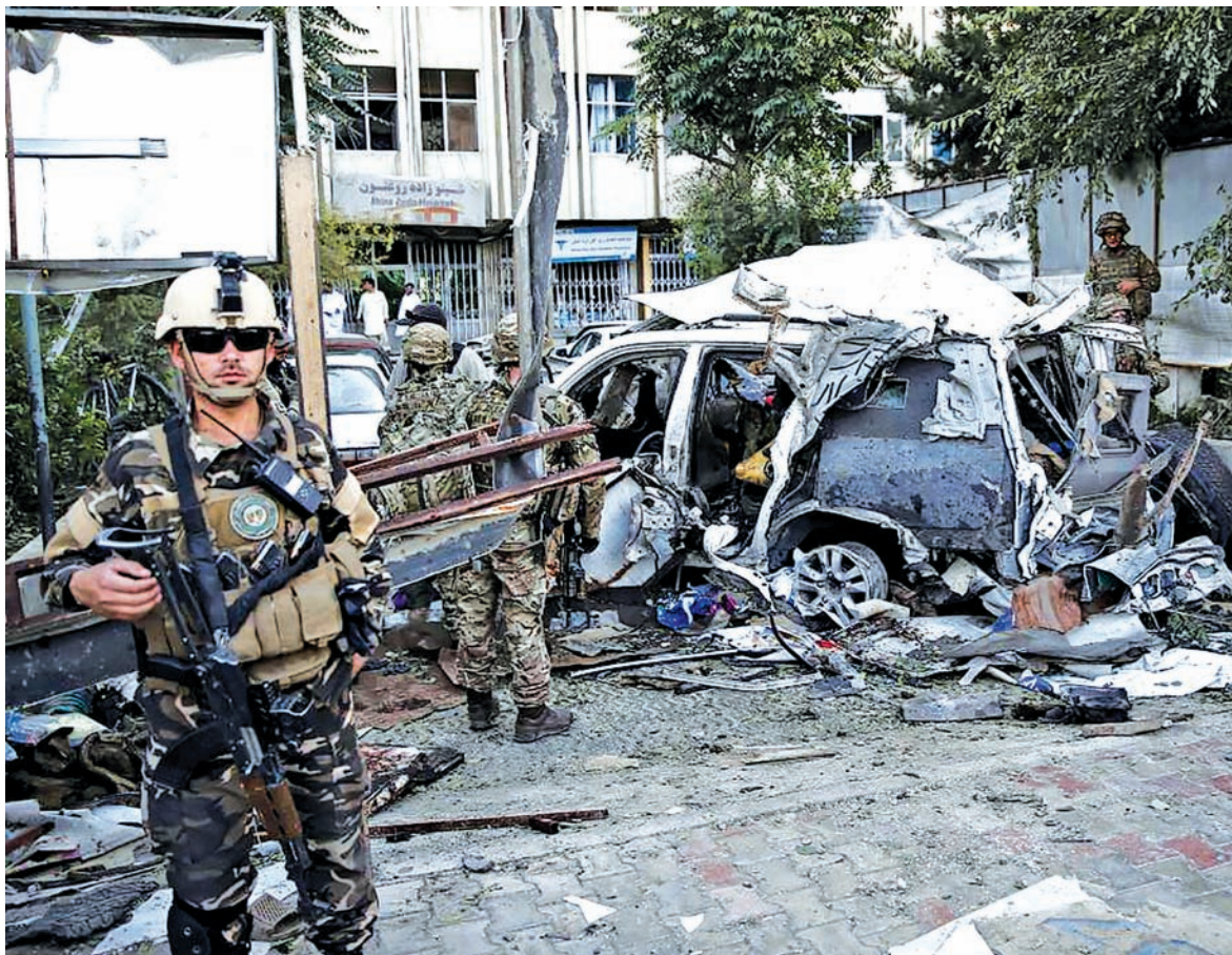
Afghan security personnel (L) keeps watch next to a damaged car belonging to foreigners, after a bomb blast in Kabul, Afghanistan August 22, 2015.

Bombings have increased in Kabul since the government and the Taliban in July confirmed that Taliban leader Mullah