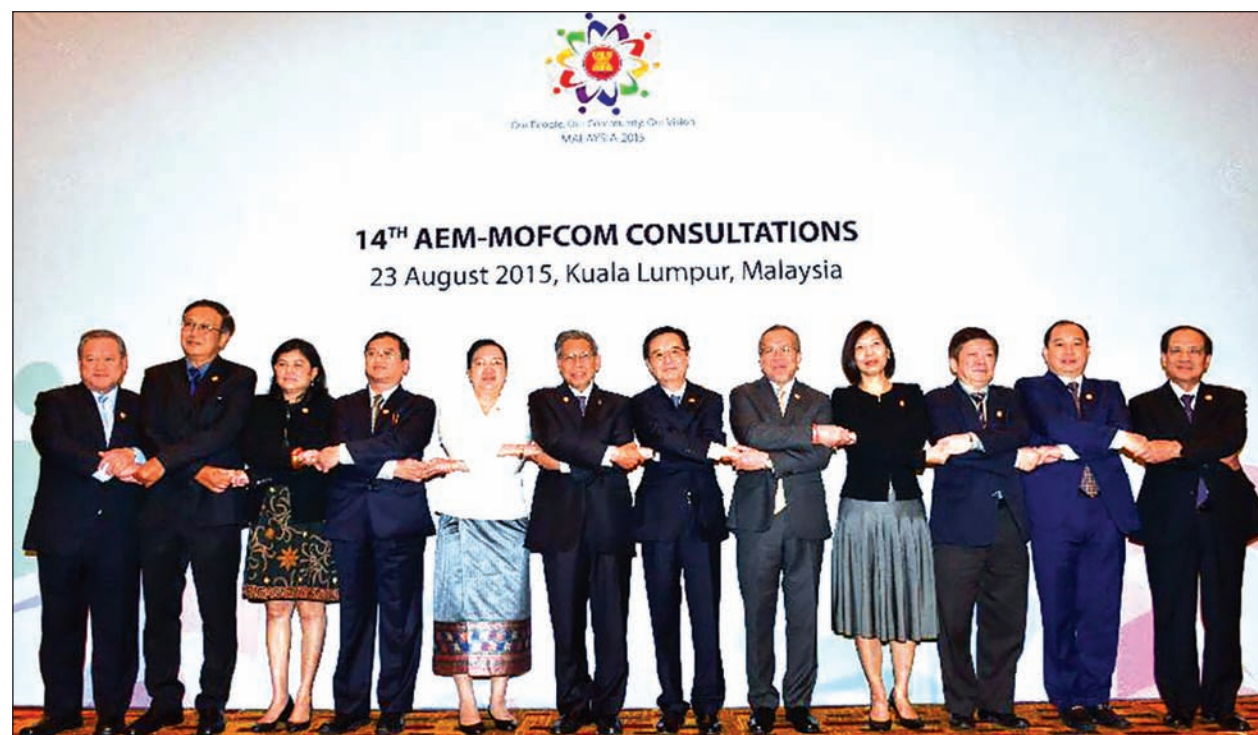
Chinese Commerce Minister Gao Hucheng (6th R) poses for a group photo with his ASEAN counterparts in Kuala Lumpur, Malaysia, on Aug. 23, 2015. The China-ASEAN (10+1) trade ministers' meeting was held in Kuala Lumpur on Sunday.