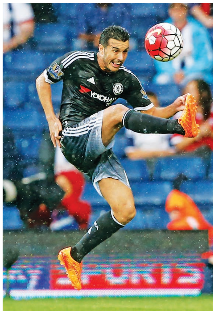
West Bromwich Albion v Chelsea — Barclays Premier League — The Hawthorns — 23/8/15 Chelsea's Pedro.

LONDON, 23 Aug — Pedro scored a debut goal as champions Chelsea got their stuttering Premier League campaign off the ground with an entertaining 3-2 victory against West Bromwich Albion at the Hawthorns on Sunday.