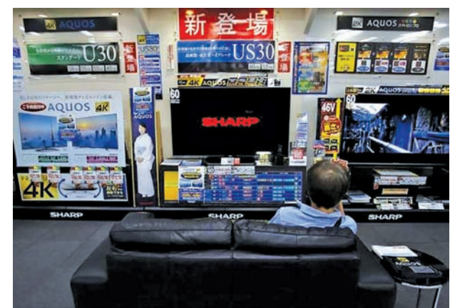
A man sitting on a sofa looks at a Sharp Corp's Aquos TV at an electronics retailer in Tokyo, Japan, June 23, 2015.