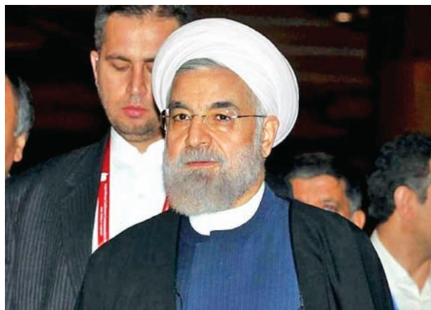
Iran's President Hassan Rouhani arrives for a bilateral meeting with Indonesia's President Joko Widodo on the sideline of the Asian African Conference in Jakarta April 23, 2015.

"In our aerospace industry we have various ballistic missiles with different ranges under production," Defence Minister