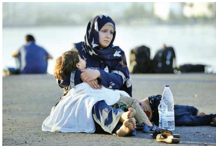
A Syrian refugee holds her child in her arms as she sits in the port of the Greek island of Kos waiting to be registered and move with her family to the 'Eleftherios Venizelos' vessel August 15, 2015.