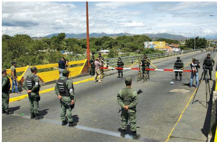
Venezuela’s National Guards (bottom) stand in front of Colombia’s soldiers at Simon Bolivar international bridge, on the border with Colombia, at San Antonio in Tachira state, Venezuela August 20, 2015.—REUTERS

The two countries share a porous 2,219-kilometer (1,379 mile) border that is frequently traversed by smugglers and illegal armed groups.—Reuters