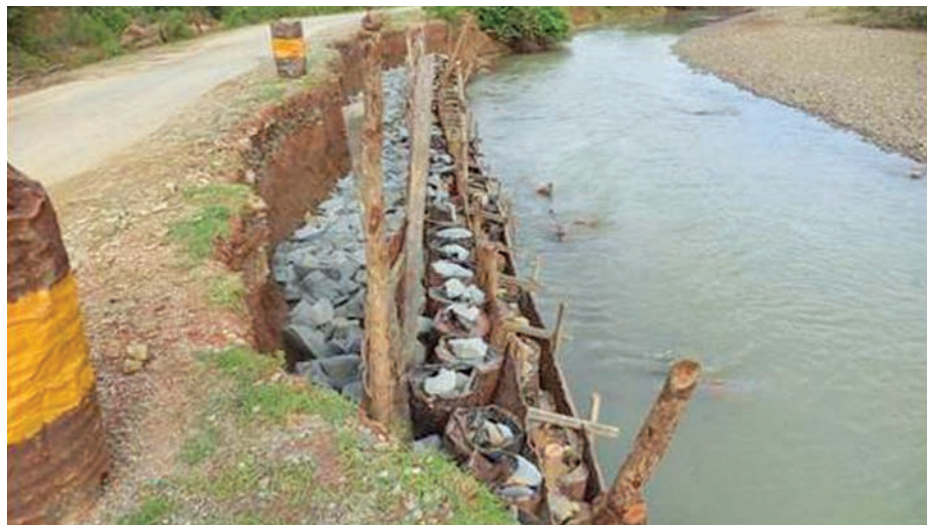
Embankment on Yangon-Sittway Road was collapsed but engineers of the Ministry of Construction has retained it by filling stones.