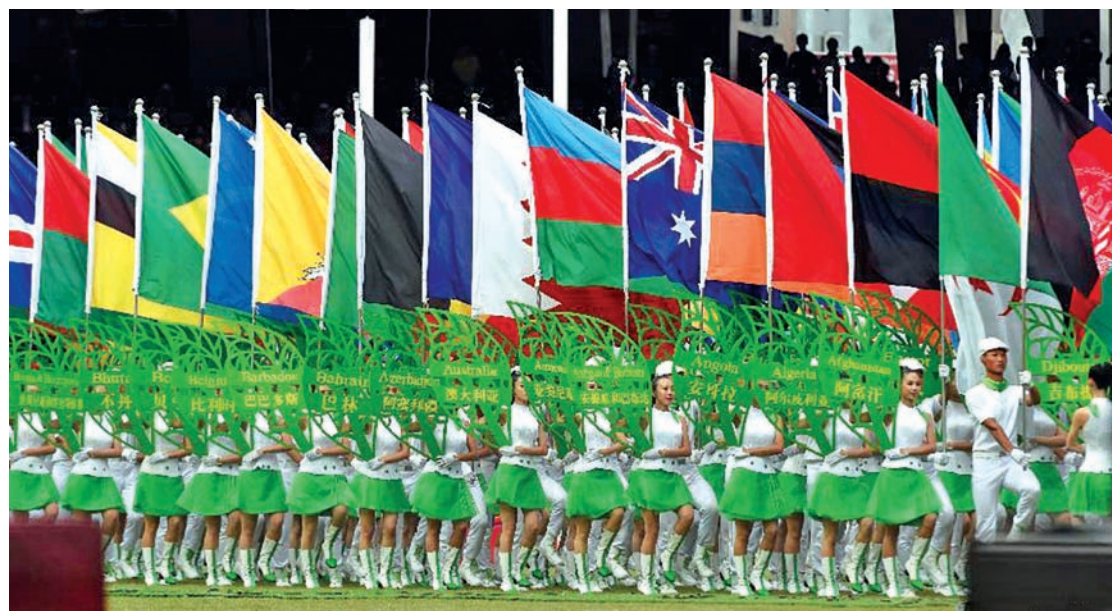
Flag-holders and banner-holders march in with the flags and nameplates of the participating IAAF Member Federations during the opening ceremony for the 15th IAAF World Athletics Championships 2015 in Beijing, capital of China, on Aug. 22, 2015.

BEIJING, 22 Aug — The 15th World Athletics Championships opened here on Saturday with around 2,000 athletes from around