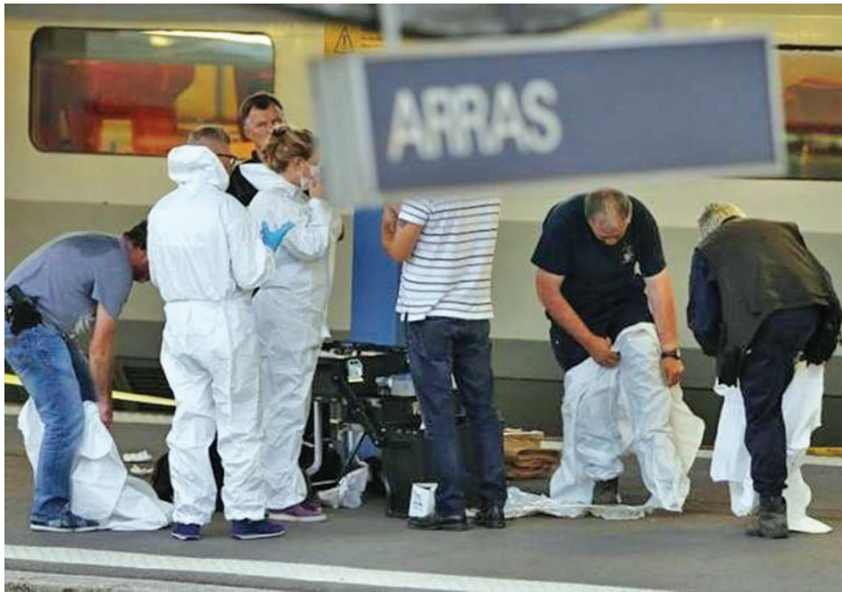
French investigating police in protective clothing prepare to enter the Thalys high-speed train where shots were fired in Arras, France, August 21, 2015.

PARIS / ARRAS, (France), 22 Aug — A gunman overpowered by passengers during a shooting on a train in France on Friday had been identified as dangerous by foreign security services and had been under police surveillance, a French source with knowledge of the case said.