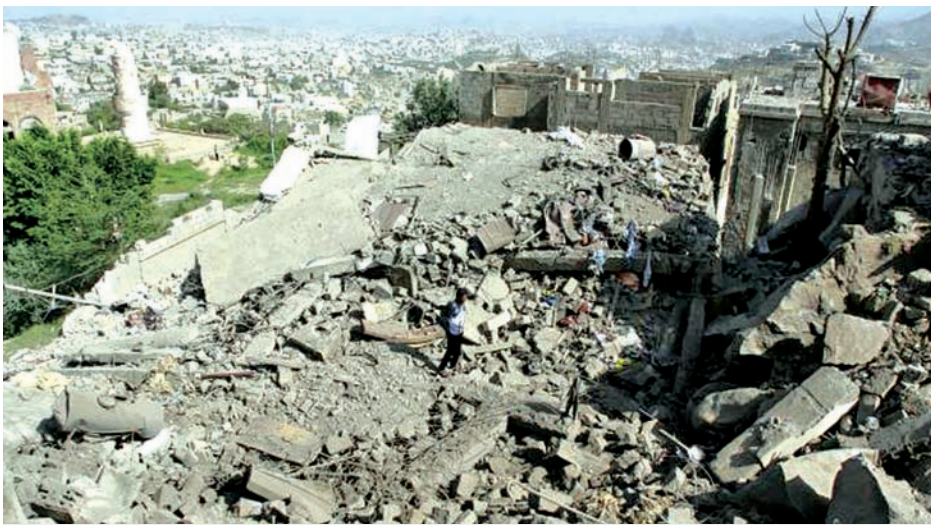
A man walks on the rubble of houses destroyed by Saudi-led air strikes in Yemen's central city of Taiz August 21, 2015.

SANAA, 22 Aug — Dozens of people, many of them civilians, were killed in air strikes by a Saudi-led coalition on the southwestern Yemeni city of Taiz, an aid organisation and Houthi media said on Friday.