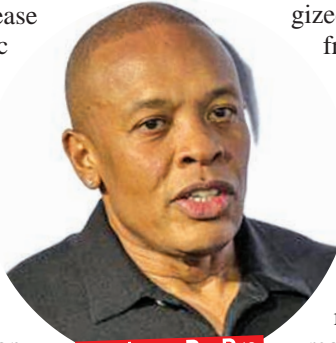
Producer Dr. Dre