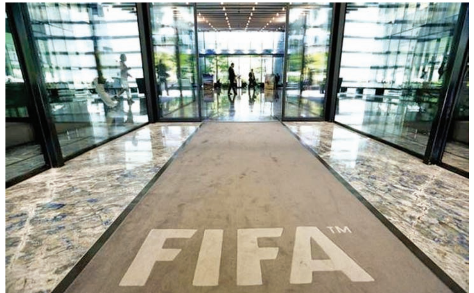
The hall of FIFA headquarters is pictured after the Extraordinary FIFA Executive Committee Meeting in Zurich, Switzerland July 20, 2015.