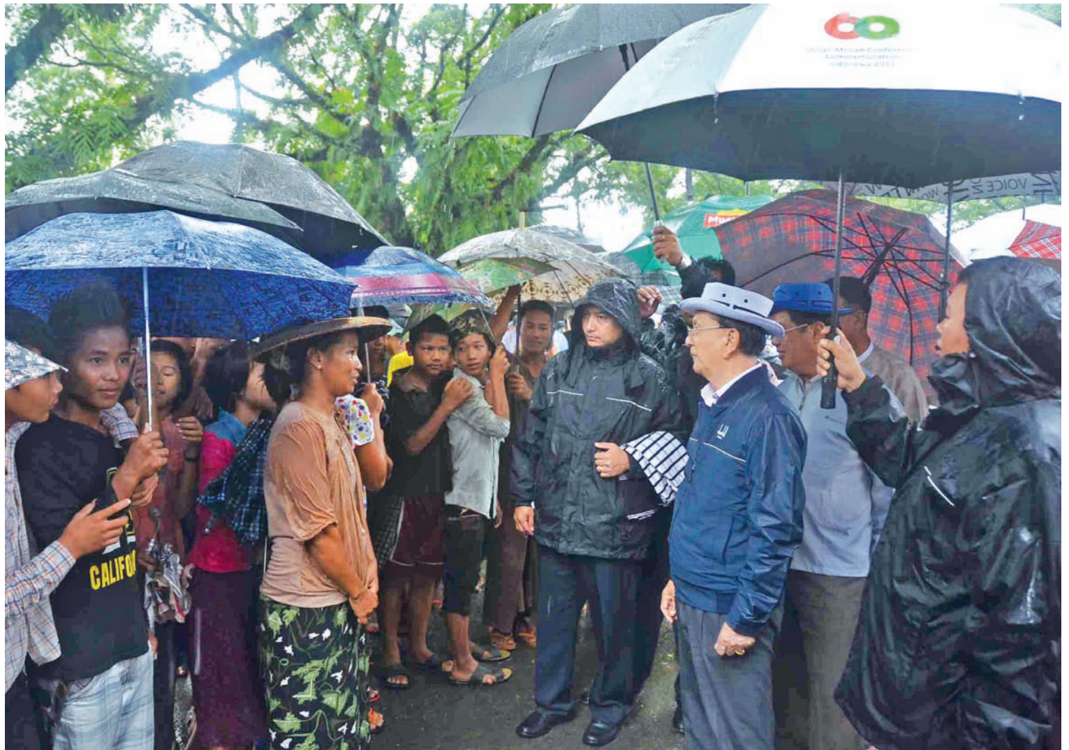
Under the rain, President U Thein Sein meets locals in Bokekan village in Sagaing Region, Northwestern Myanmar.

On the occasion, the president presented Buddha images for two villages, food for three villages, household goods for