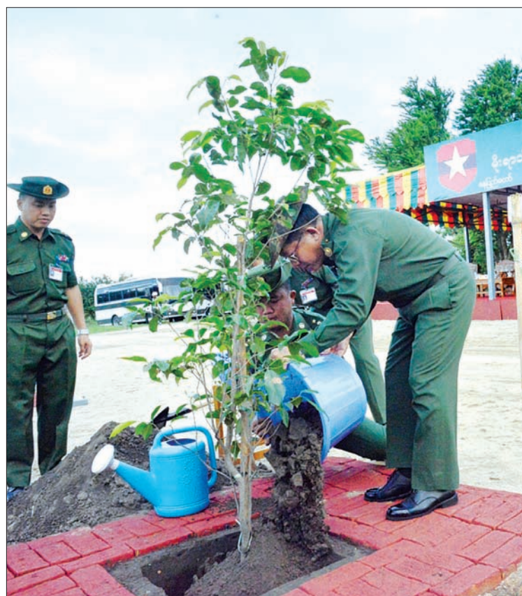
Senior General Min Aung Hlaing plants a tree at the Third Tree Planting Ceremony in 2015.