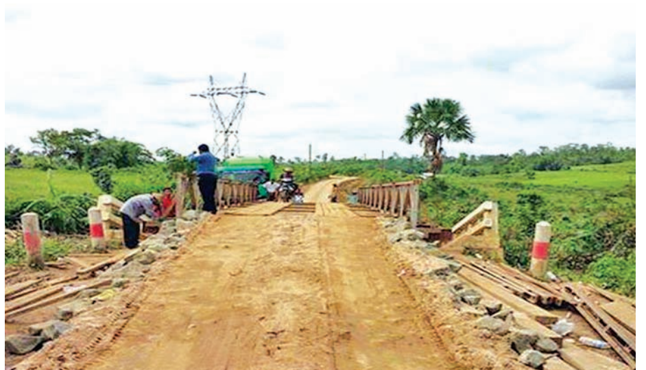
A concrete bridge on a road linking Mandalay and Myitkyina in Kachin State was damaged severely. Myanmar engineers urgently substituted the bridge with the Bailey bridge and now it is serviceable.