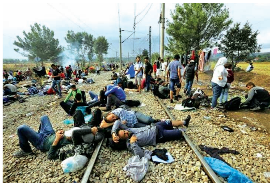
Syrian refugees sleep on rail tracks at the Greek-Macedonian border, near the village of Idomeni, August 22, 2015.