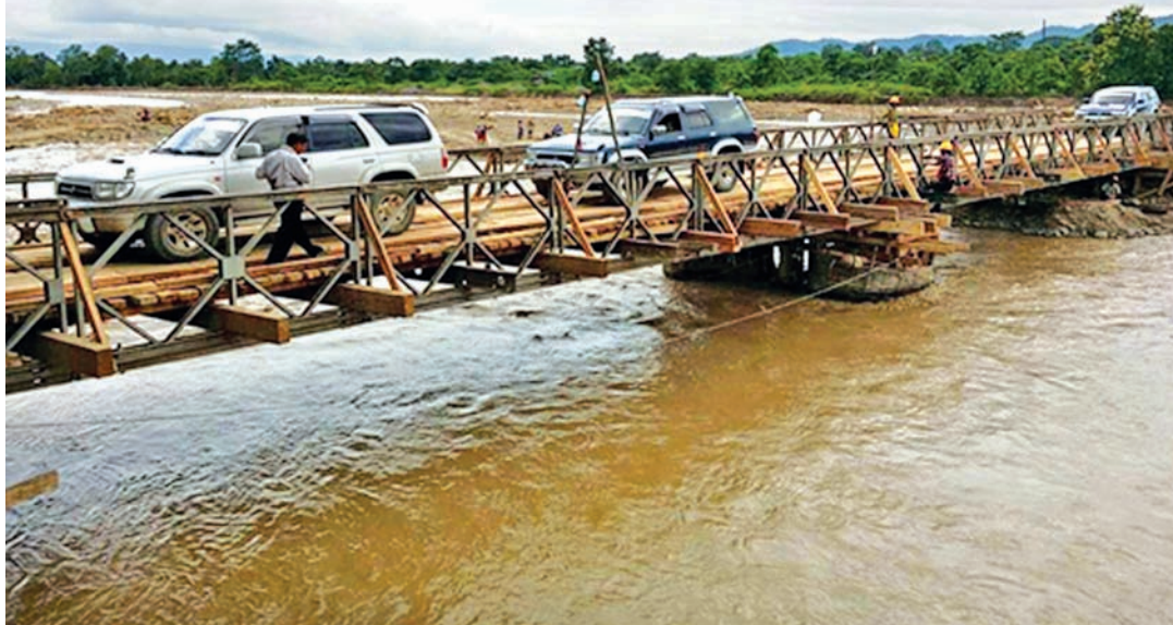
Kanan bridge on Kalewa-Kyikon-Tamu Road in Sagaing Region was destroyed by strong current. It was substituted with Bailey bridge by Ministry of Construction and now is in service for vehicles.— CONSTRUCTION