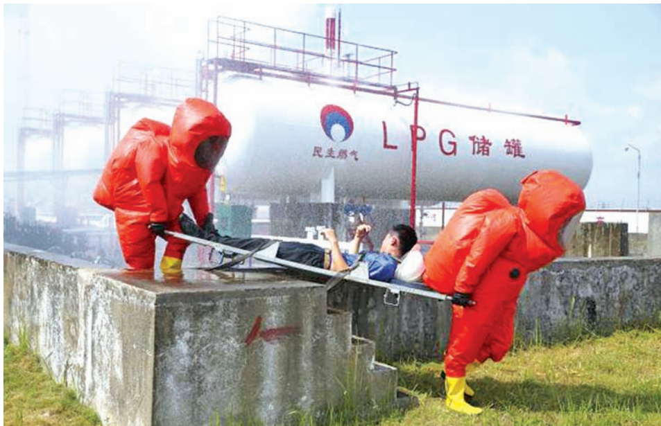
Firefighters in protection suits carry a man playing the role of a victim on a stretcher during an anti-chemical drill next to storage tanks of liquefied petroleum gas, at a factory in Haikou, Hainan province, China, August 21, 2015.

SHANGHAI, 22 Aug — Four new fires have broken out at the site where two huge blasts last week killed 116 people, Chinese state media reported Friday soon after officials said safety hazards were found at almost 70 percent of firms handling dangerous chemicals in Beijing.