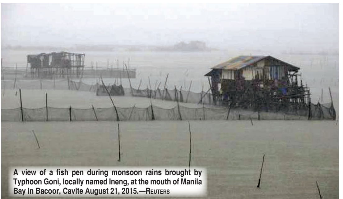
A view of a fish pen during monsoon rains brought by Typhoon Goni, locally named Ineng, at the mouth of Manila Bay in Bacoor, Cavite August 21, 2015.

MANILA, 22 Aug — At least four people died on Friday and more than 700 people have been displaced due to typhoon Goni (local name Ineng), police and civil defense officials said.