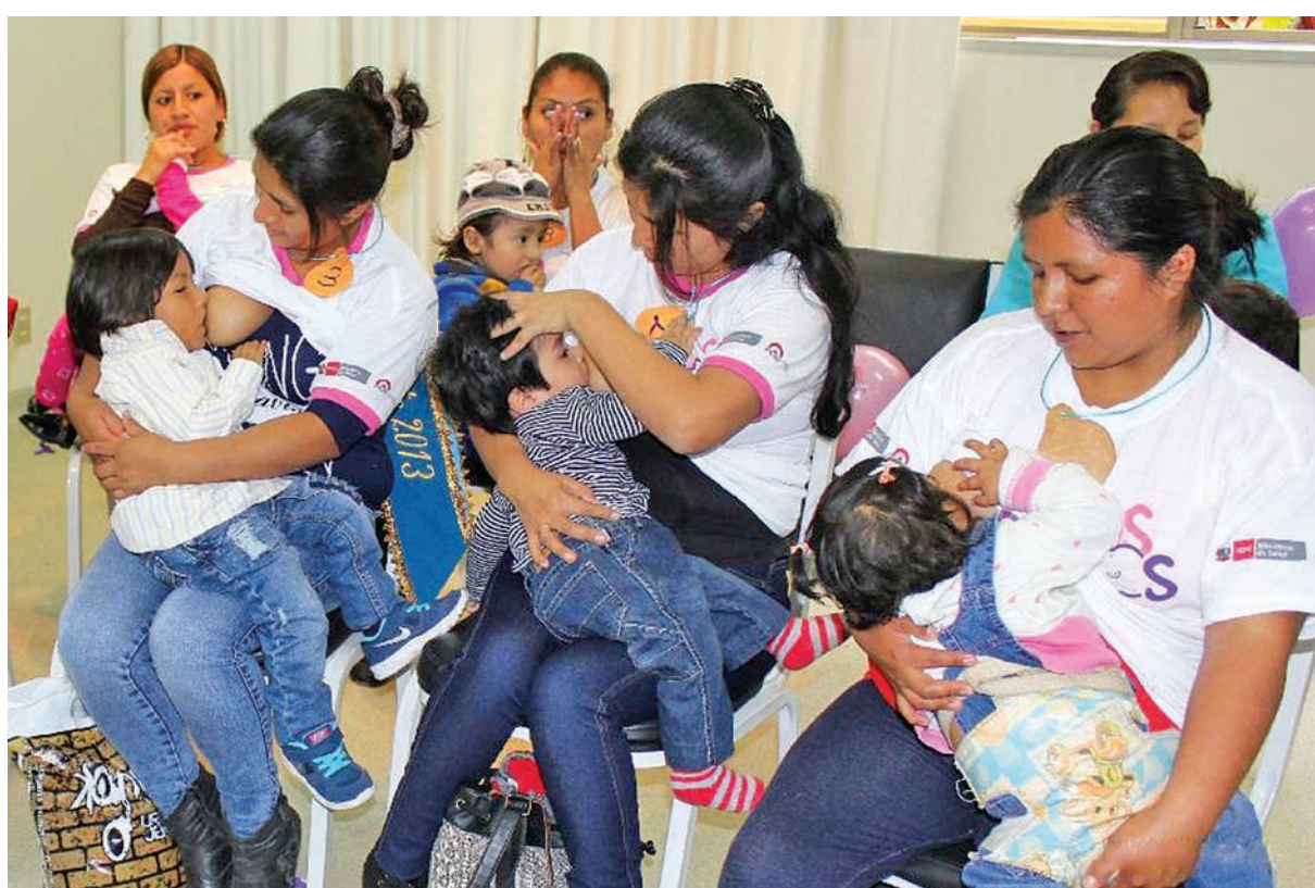
Mothers breastfeed their children during the contest "Baby Mamoncito" in the frame of the Week of Breastfeeding of Peru 2015, in Lima city, Peru, on Aug. 21, 2015. The Week of Breastfeeding of Peru takes place on the fourth week in August every year in order to promote breastfeeding, according to local press information.

FORECAST FOR MANDALAY AND NEIGHBOURING AREA FOR 23 rd August, 2015: Isolated rain or thundershowers. Degree of certainty is (100%)