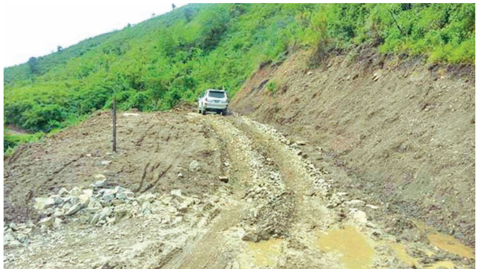
Landslide hit a road section between Kalay, Sagaing Region, and Haka, Chin State. A detour was constructed to ensure smooth transportation.