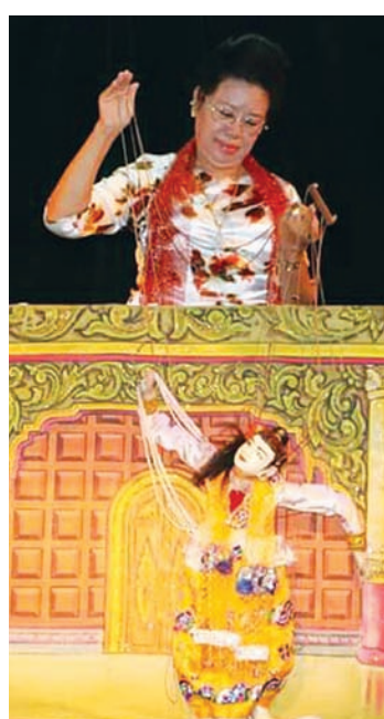
A Myanmar puppeteer stages a puppet show at Mandalay Marionette Theatre.

Sagaing Region. The torrential rains cost an estimate of K 414.22 million in damage.—MNA