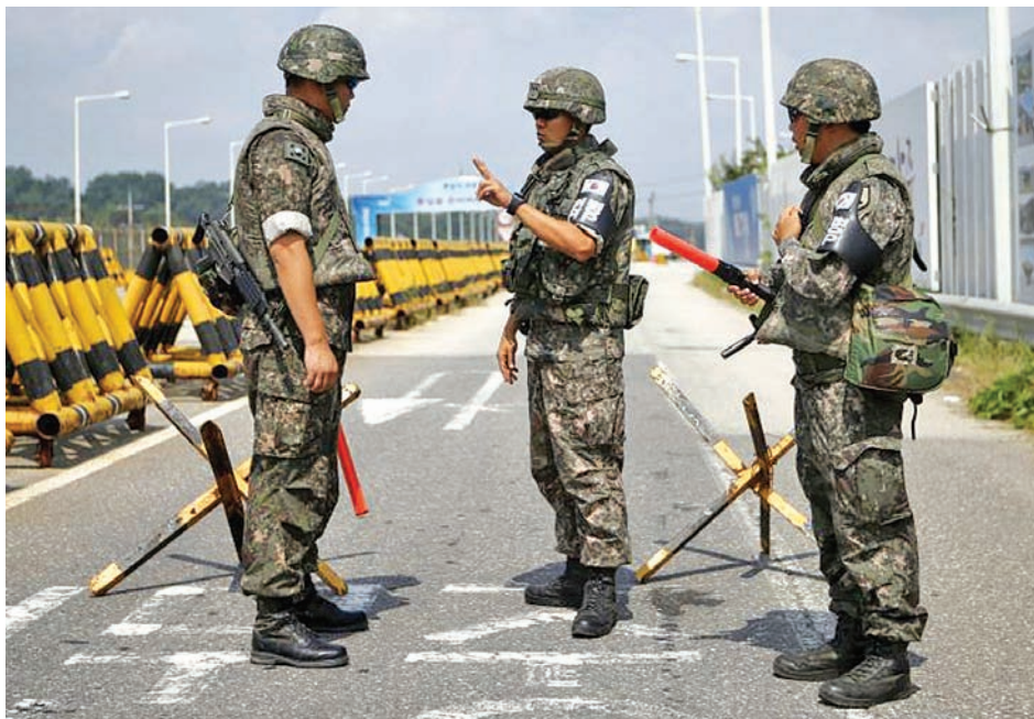
South Korean soldiers talk next to barricades at a checkpoint on the Grand Unification Bridge which leads to the truce village Panmunjom, just south of the demilitarized zone separating the two Koreas, in Paju, South Korea, August 22, 2015.

South Korean President Park Geun-hye's national security adviser and her unification minister met Hwang Pyong So, the top military aide to the North's leader Kim Jong Un, and a senior official who handles inter-Korean affairs at 6 p.m. Seoul time (0900 GMT).