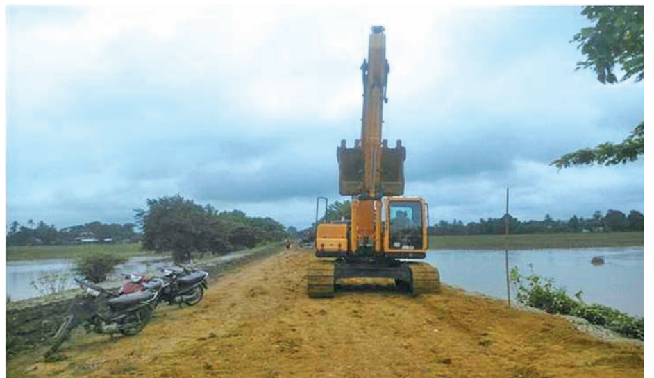
Labourers at the worksite to repair the broken embankment on the approach road to Yenantha bridge in Magway Region. The road was repaired with the use of heavy machinery.