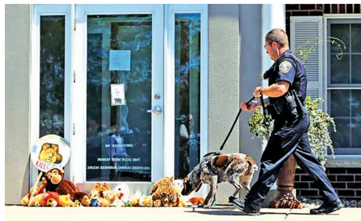
A K-9 Unit Bloomington Police dog sniffs at stuffed animals blocking the doorway of River Bluff Dental clinic in protest against the killing of a famous lion in Zimbabwe, in Bloomington, Minnesota July 29, 2015.

Palmer, a big game bow hunter, killed Cecil in early July while on a hunt in Zimbabwe. He