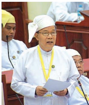
Deputy Minister for Rail Transportation U Chan Maung.—MNA

NAY PYI TAW, 18 Aug — The Pyithu Hluttaw resumed its 12 th session Tuesday, discussing a motion to suspend the current sitting of the Lower House to allow MPs to respond to the flood crisis and prepare for the 8 November