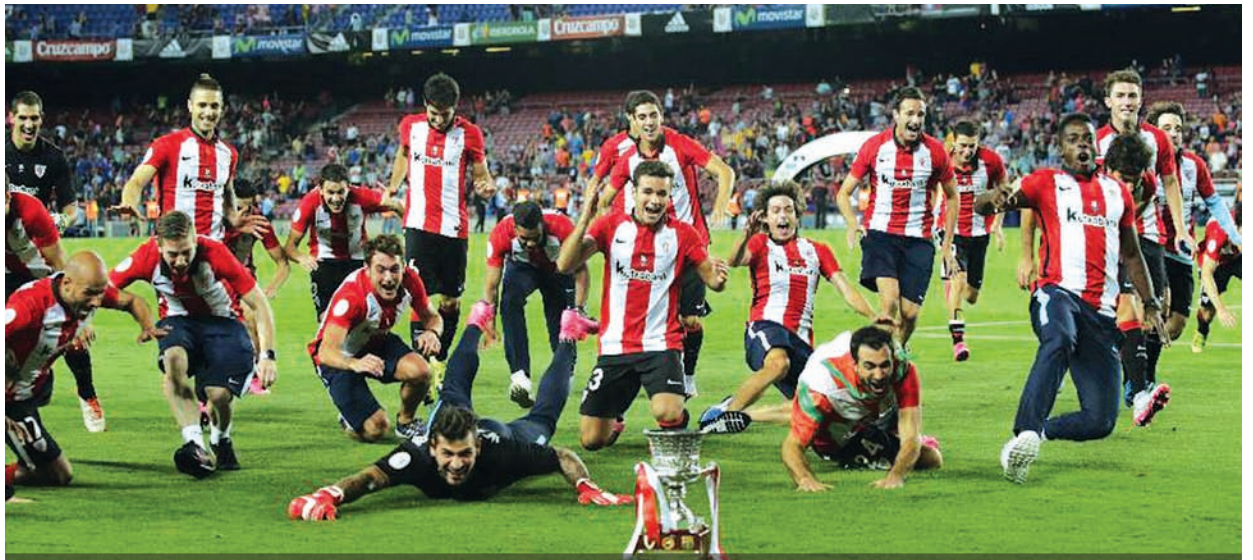
Athletic Bilbao's players celebrate with the cup after their Spanish Super Cup second leg soccer match against Barcelona at Camp Nou stadium in Barcelona, Spain, on Aug. 17, 2015. The match ended with a 1-1 draw and Athletic Bilbao won 5-1 on aggregate.

BARCELONA, 18 Aug — Athletic Bilbao claimed their first silverware in more than three decades when they wrapped up a 5-1 aggregate win over 10-man Barcelona to win the Spanish Super Cup on Monday and unleash ecstatic celebrations in the Basque city.