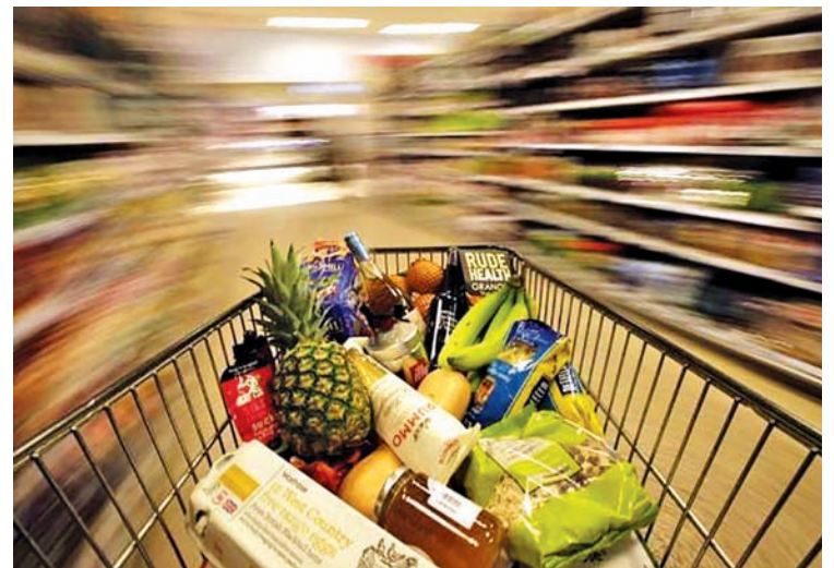
A shopping trolley is pushed around a supermarket in London, Britain May 19, 2015.