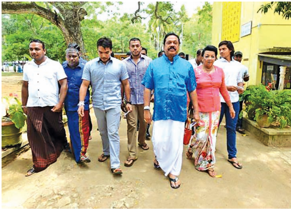
Sri Lanka's former President Mahinda Rajapaksa (3rd R) arrives at a polling station during the general election in Medamulana August 17, 2015.

He stopped short of conceding defeat ahead of full results expected