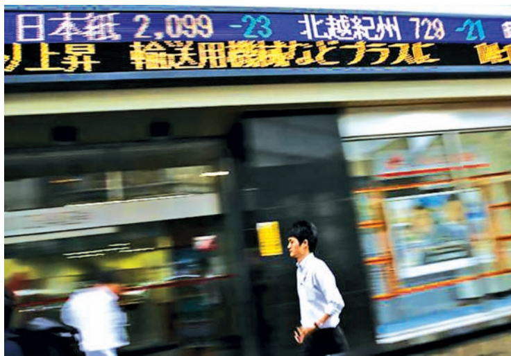
A man walks past a display showing stock prices in Tokyo August 12, 2015.

U.S. interest rate futures <0#FF:><0#ED:> hardly budged, with markets still not fully