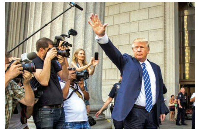
U.S. Republican presidential candidate Donald Trump waves as he arrives for jury duty at Manhattan Supreme Court in New York August 17, 2015.

NEW YORK, 18 Aug — Billionaire Republican presidential candidate Donald Trump completed his jury duty in New York in one day on Monday, signing autographs and giving a fist-bump to a supporter amid a swarm of media.