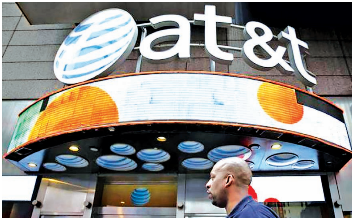
A man walks past the AT&T store in New York's Times Square, June 17, 2015.

"The United States authorities had previously given us assurances as to the fact they are not