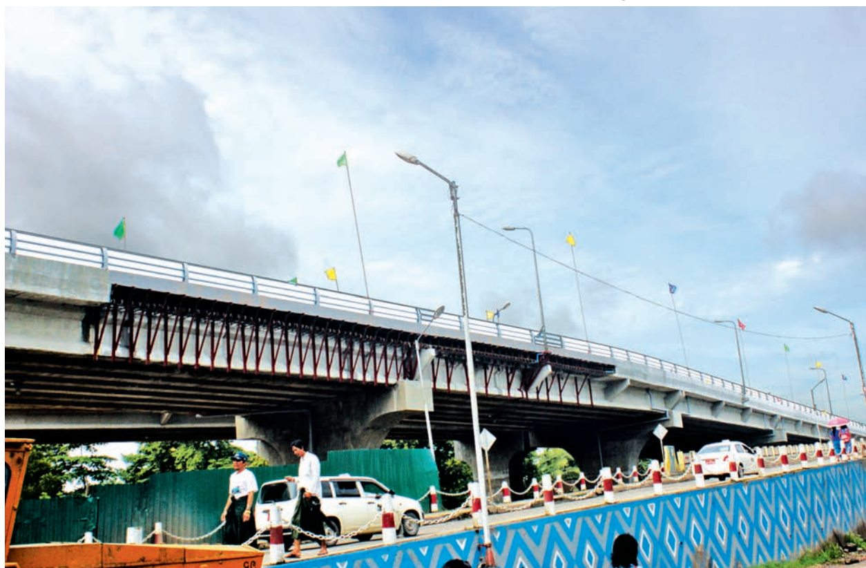
Photo shows a site to build new tributary at recently-opened Insein railway overpass.