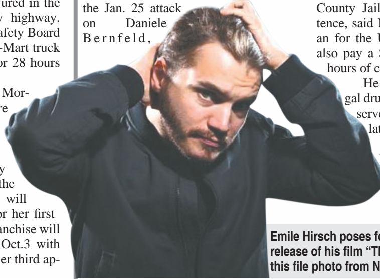
Emile Hirsch poses for a portrait ahead of the release of his film "The Motel Life" in New York, in this file photo from November 5, 2013.

Hirsch apologized to Bernfeld for what he had done, and restitution will be determined later, Volmer said.—Reuters