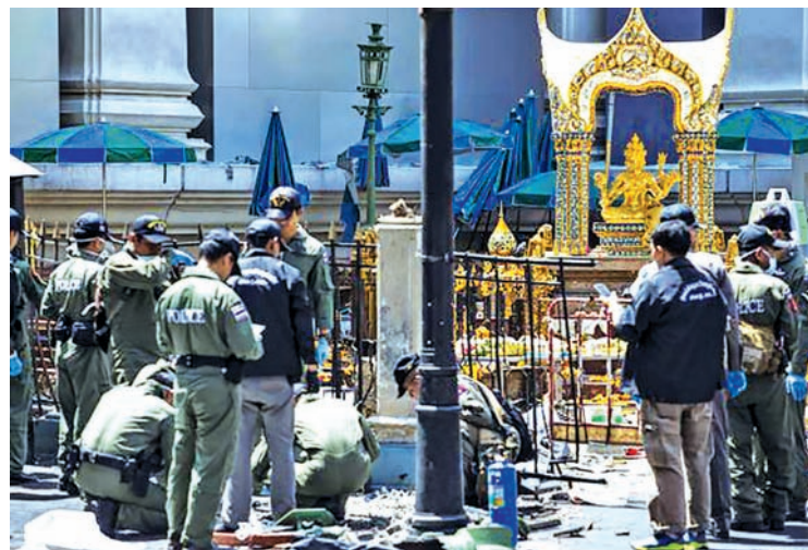
Experts investigate the Erawan shrine at the site of a deadly blast in central Bangkok, Thailand, August 18, 2015.

BANGKOK, 18 Aug — Thai authorities said on Tuesday they were looking for a suspect seen on closed-circuit television (CCTV) footage near a renowned shrine where a bomb blast killed 22 people, including nine foreigners from several Asian countries.