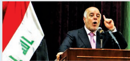
Iraqi Prime Minister Haider al-Abadi speaks during the International Youth Day in Baghdad, August, 12, 2015.

BEIRUT, 18 Aug — Iraqi Prime Minister Haider al-Abadi said on Tuesday he was cancelling the positions of advisers hired as contractors in ministries and limiting the number of advisers for himself, the president, and the parliamentary speaker to five each.