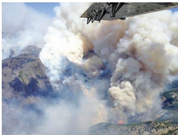
Smoke rising from the TePee Springs fire in the Payette National Forest is seen in an aerial picture taken by the McCall Smokejumpers near Riggins, Idaho August 17, 2015.

SALMON, (Idaho), 18 Aug — The U.S. Army mobilized soldiers on Monday to reinforce civilian firefighters stretched thin by dozens of major wildfires roaring largely unchecked across the West, with more than 100 homes reduced to ruins in several states. The 200 troops deployed from Joint Base Lewis-McChord near Tacoma, Washington,