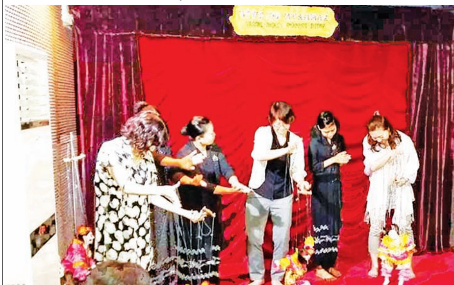
Enthusiasts enjoy control of puppets in dual dances.—HTWE Oo MYANMAR

Bookings for private shows with the troupe can be made by phoning 01 245 676, 09 79 8888 790, 09 7247 2222 or visiting the website http://www.easymyanmartravel.com .—GNLM