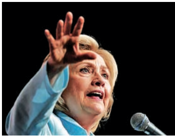
U.S. Democratic presidential candidate Hillary Clinton speaks at the Iowa Democratic Wing Ding dinner in Clear Lake, Iowa, United States, August 14, 2015.

WASHINGTON, 18 Aug — The U.S. State Department has so far identified 305 emails from Hillary Clinton's private server used while she was secretary of state to be reviewed for potentially classified information, the agency said in a court filing on Monday.