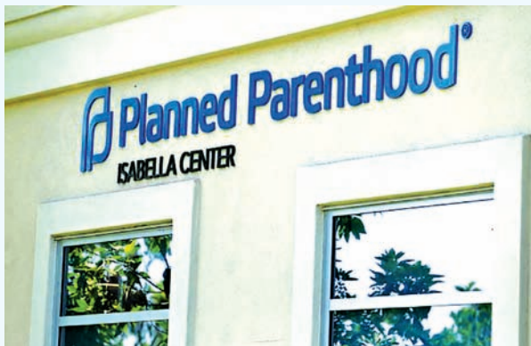
A Planned Parenthood clinic is seen in Vista, California, August 3, 2015.

MIAMI, 18 Aug — Planned Parenthood sought an emergency legal injunction on Monday against Florida health officials to block the use of what it says are new and unpublished standards to define pregnancy gestation periods.