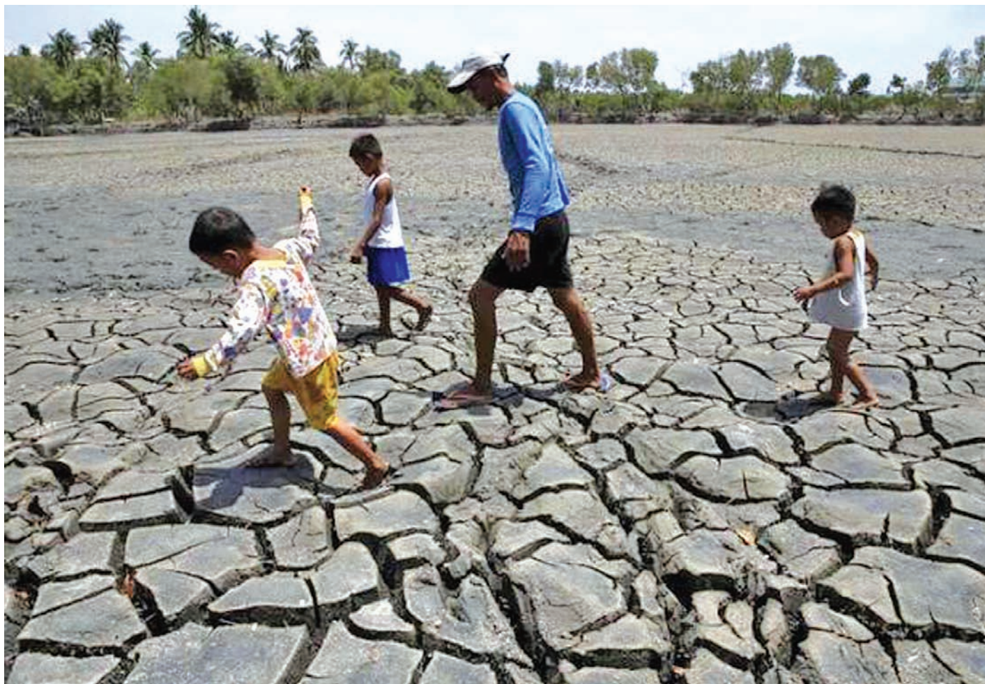
A father with his children walk over the cracked soil of a 1.5 hectare dried up fishery at the Novaleta town in Cavite province, south of Manila May 26, 2015.

SYDNEY, 18 Aug — An El Nino weather pattern has strengthened over the last two weeks, the Australian Bureau of Meteorology (BOM) said on Tuesday, with now only a "small chance" the event will be over by the end of this year.