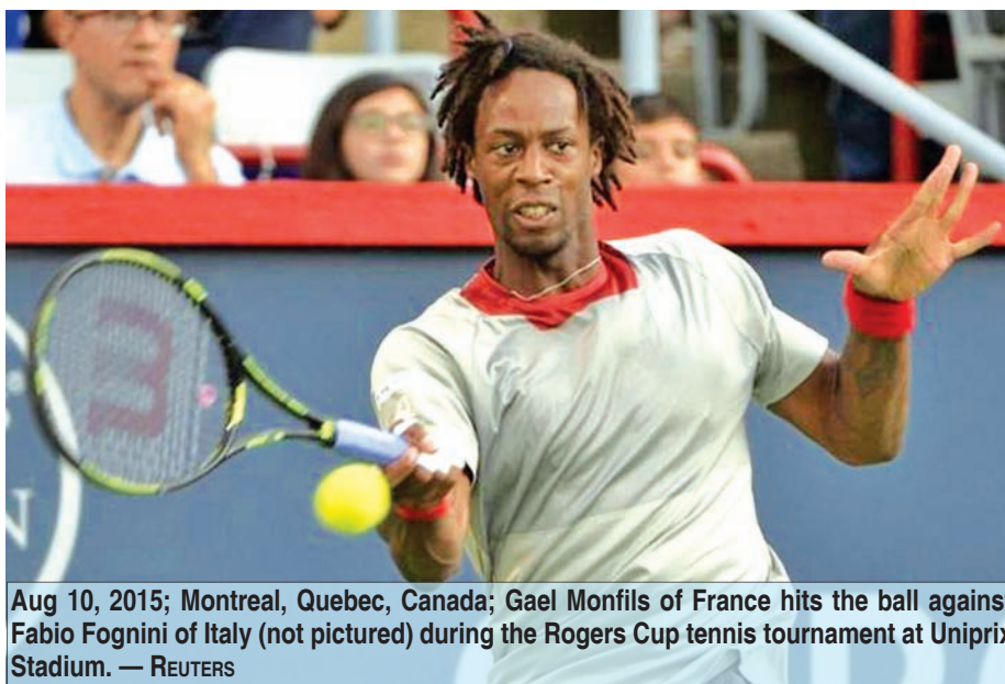
Aug 10, 2015; Montreal, Quebec, Canada; Gael Monfils of France hits the ball against Fabio Fognini of Italy (not pictured) during the Rogers Cup tennis tournament at Uniprix Stadium.

In later action, Thanasi Kokkinakis won a three-set battle against Fabio Fognini 4-6, 6-2, 6-3 as his tennis did the talking after his name made controversial headlines last week.