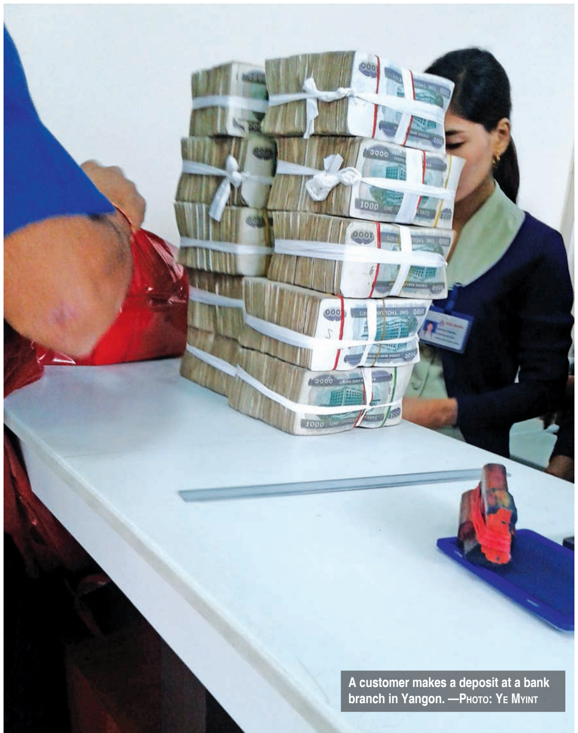
A customer makes a deposit at a bank branch in Yangon.