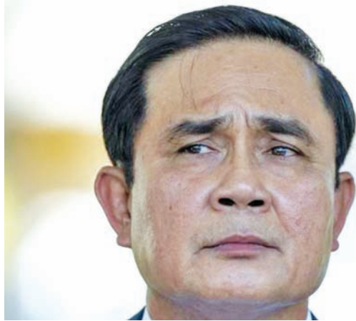
Thailand's Prime Minister Prayuth Chan-ocha

BANGKOK, 18 Aug — Thai Prime Minister Prayuth Chan-ocha said on Tuesday he had chosen new cabinet members and submitted the names to the country's king for approval. "I have submitted the names and am waiting for royal approval," Prayuth told reporters without giving precise details on the date of the imminent reshuffle. He did not give any names of new cabinet members on Tuesday.