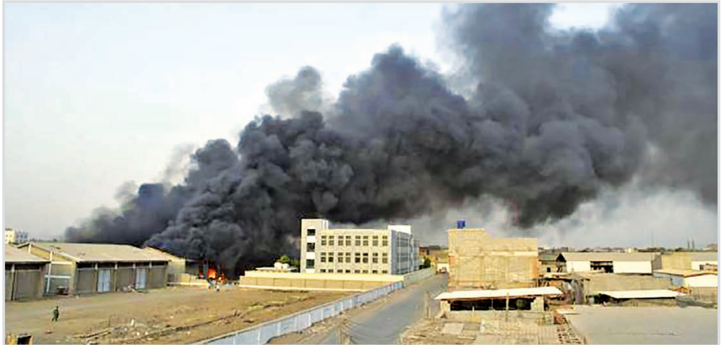
Smoke billows from the site of a Saudi-led air strike in Yemen's western port city of Hodeida August 16, 2015.

Ibb is around 50 kilometers (30 miles) north of Taiz and 200 kilometers southeast