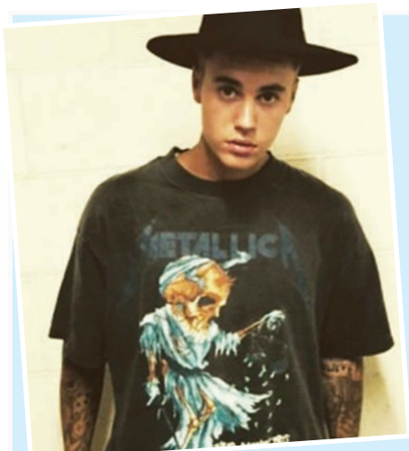
'Future' came less than two weeks before Justin Bieber releases his highly-anticipated new single "What Do You Mean".