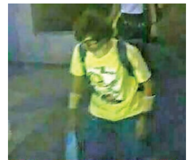
A man wearing a yellow T-shirt and carrying a backpack is seen walking near the Erawan shrine, where a bomb blast killed 22 people on Monday, in Bangkok, Thailand in this handout still image taken from closed-circuit television (CCTV) footage, released by the Thai Police on August 18, 2015.

Thailand forcibly returned 109 Uighurs to China last month.