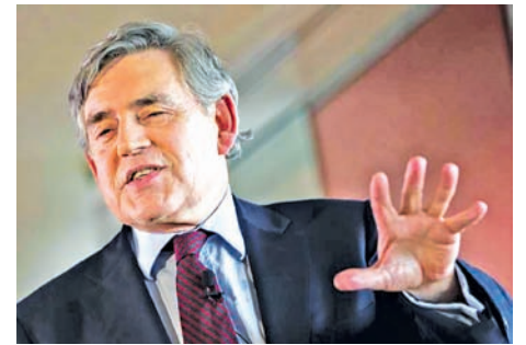
Britain’s former Prime Minister Gordon Brown delivers a speech on the Labour Party’s leadership election in London, Britain August 16, 2015.

Russia over its actions in Ukraine and described members of the Palestinian group Hamas and Lebanon’s Hezbollah as “friends”. Britain has officially designated Hamas and the military wing of Hezbollah as terrorist organisations.