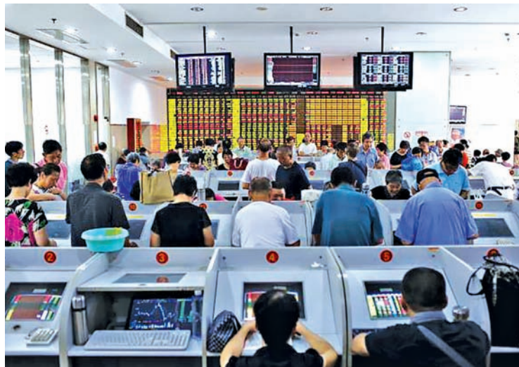
Investors look at computer screens showing stock information at a brokerage in Shanghai, China, August 13, 2015.

But Leung said downside risks were believed to be limited, with investors expecting the government and its agents will step in