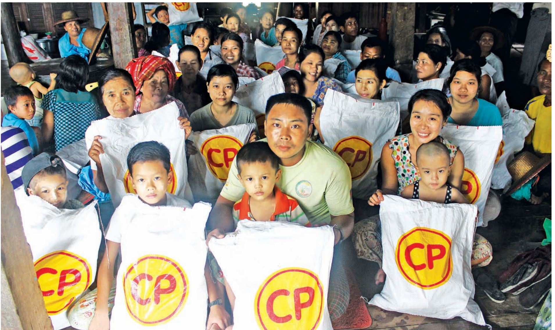
Thar Paung Villagers ( Pathein ) received rescue bags.