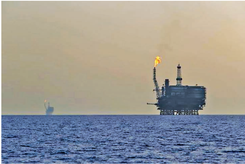
Offshore oil platforms are seen at the Bouri Oil Field off the coast of Libya August 3, 2015.

SINGAPORE, 17 Aug — Oil prices fell to near six-year lows on Monday as Japan's economy contracted and producers in the United States added drilling rigs for a fourth straight week despite a recent rout