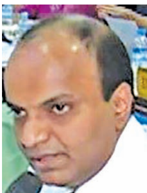
Representation from Indian embassy