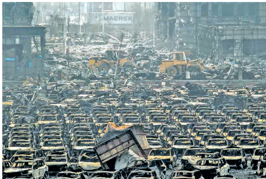
Bulldozers clear off wreckage at the warehouse explosion site in Tianjin, north China, Aug. 17, 2015. Death toll of the massive Tianjin blasts rose to 114 after rescuers found two more bodies in the debris, a municipal publicity official said on Monday.

TIANJIN, 17 Aug — Most of the sodium cyanide surrounding the Tianjin blast area will be collected and cleared by Monday evening, He Shushan, deputy mayor of Tianjin, said at a press conference