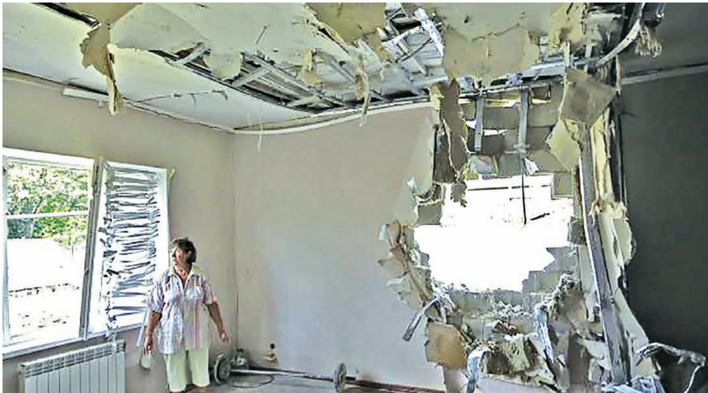
A local resident stands in a flat that, according to locals, was damaged by recent shelling, on the outskirts of Donetsk, Ukraine, August 16, 2015.

KIEV, 17 Aug—Fighting flared between Ukrainian government forces and Russian-backed separatists in two separate parts of eastern Ukraine overnight with several civilians killed by shelling, Ukrainian police and separatist sources said on Monday.