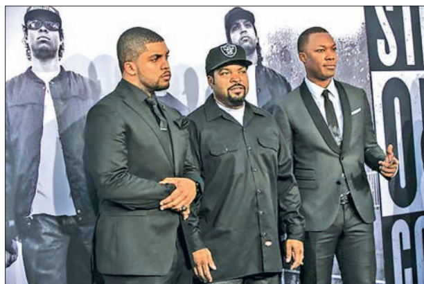
Cast members Corey Hawkins (R), who portrays Dr. Dre, and O'Shea Jackson Jr. (L), who portrays Ice Cube, pose with producer Ice Cube at the premiere of "Straight Outta Compton" in Los Angeles, California August 10, 2015.

most profitable releases of the summer. N.W.A members Ice Cube and Dr. Dre helped produce the film about the early days of gangsta rap and were integral to its marketing campaign.