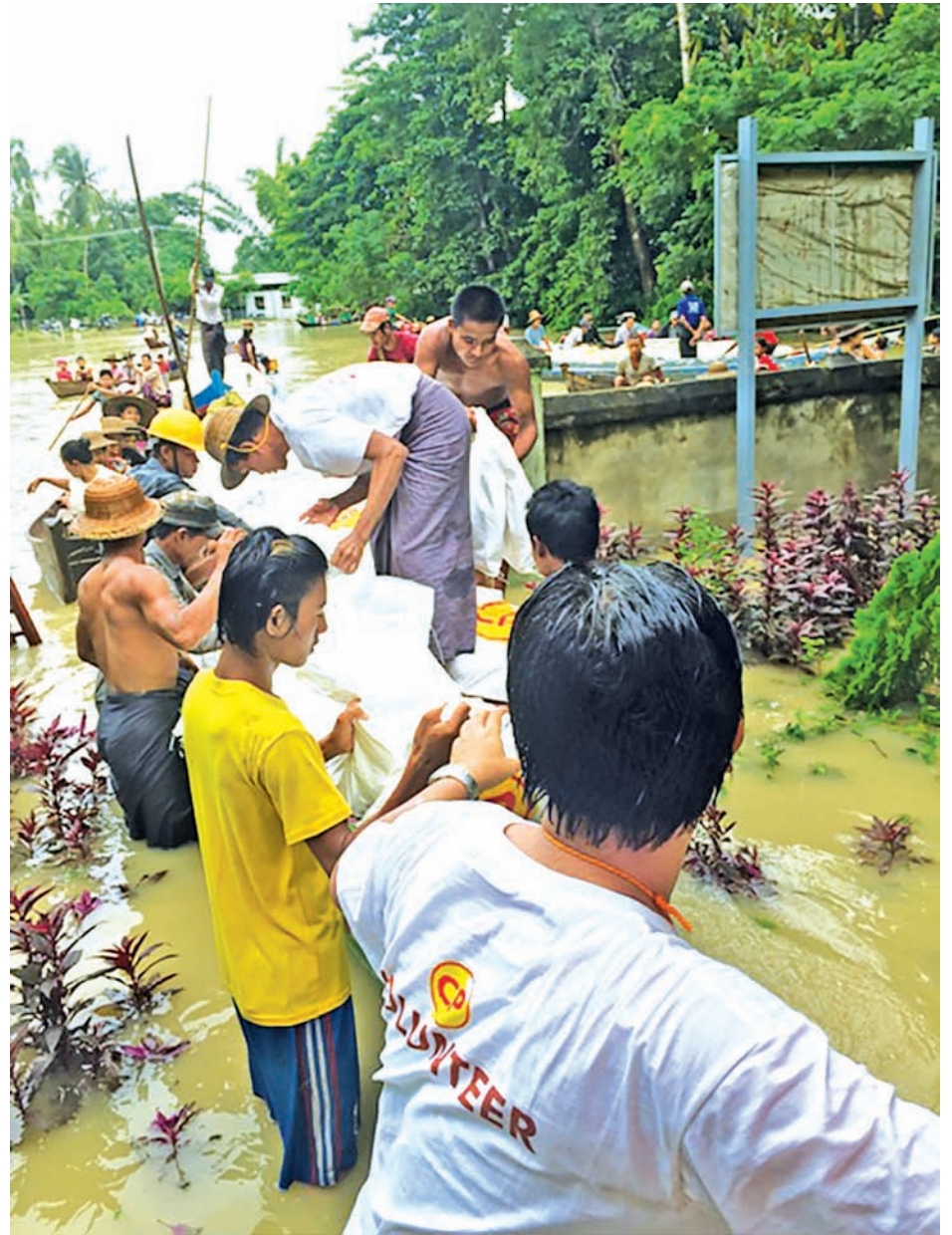
Deliver rescue bags to flooding area at Nyaungdon (Ayeyarwaddy).