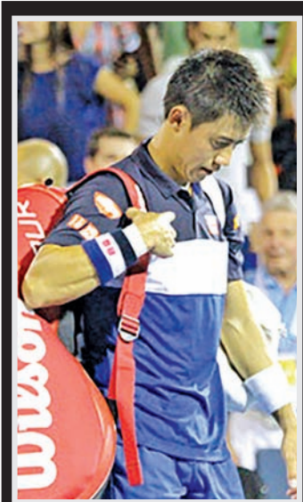
Kei Nishikori leaves the court after losing his semifinal match against Andy Murray at the Rogers Cup in Montreal, Canada, on Aug. 15, 2015. Nishikori has pulled out of the Western & Southern Open in the U.S. city of Cincinnati because of a left hip injury, organizers said the following day.

Nishikori reached the U.S. Open final last year. “I’ve never injured that part of the body but I expect to get better in a week,” Nishikori said in a statement. “I think I’ll be able to play well at the U.S. Open.”