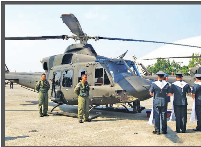
Military chaplains bless a newly-acquired Bell-412EP helicopter during a turnover ceremony at Villamor Air Base in Pasay City, the Philippines, Aug. 17, 2015. The PAF acquired eight Bell-412EP helicopters from Canada and two brand-new AW-109E helicopters that can perform close air support and air reconnaissance as well as air lift operations in different parts of the country.