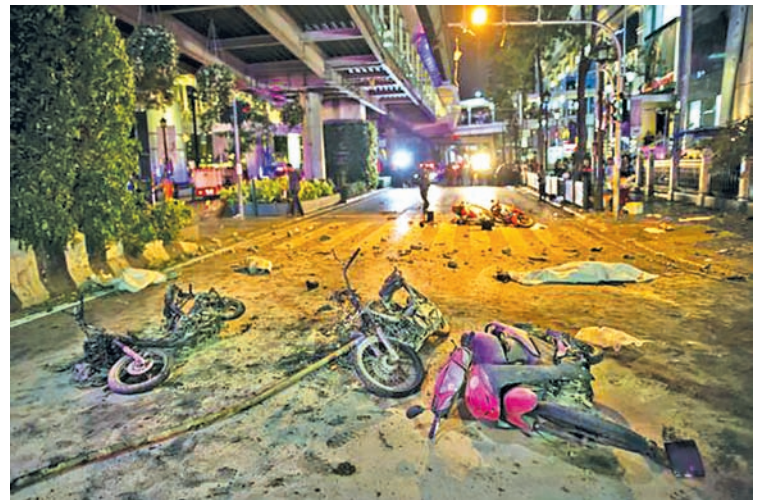
Wreckage of motorcycles are seen as security forces and emergency workers gather at the scene of a blast in central Bangkok August 17, 2015.

BANGKOK, 17 Aug — A bomb planted at one of the Thai capital’s most renowned shrines on Monday killed 16 people, including three foreign tourists, and wounded scores in an attack the government called a bid to destroy the economy.