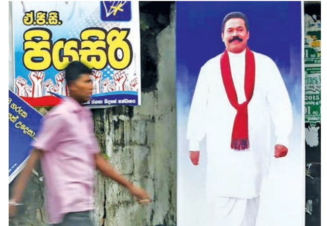
A man walks past a poster of Sri Lanka's former president Mahinda Rajapaksa ahead of a general election, in Galle August 14, 2015.

COLOMBO, 17 Aug — Sri Lankan Prime Minister Ranil Wickremesinghe on Monday expressed confidence of winning a parliamentary election and forming a government as he arrived in capital Colombo to cast vote.