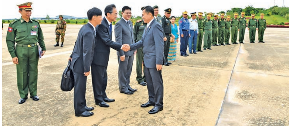
Vice-Senior General Soe Win being seen off at Nay Pyi Taw Airport by diplomats.

NAY PYI TAW, 17 Aug — Deputy Commander-in-Chief of Defence Services Commander-in-Chief