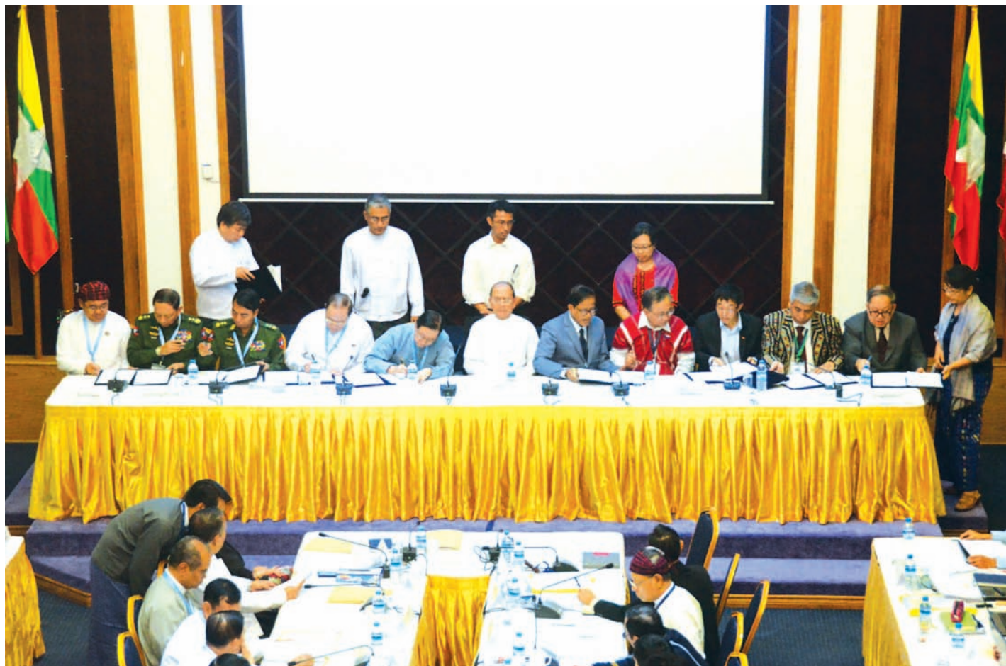
President U Thein Sein attends signing ceremony of draft nationwide ceasefire agreement between Union Peace-making Working Committee and Nationwide Ceasefire Coordination Team on 31 March 2015.

For the first time in Myanmar's history, the Union Government, Hluttaw, Tatmadaw, and Ethnic Armed Organizations