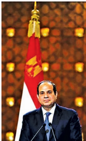
Egypt's President Abdel Fattah el-Sisi

CAIRO, 17 Aug — Egyptian President Abdel Fattah al-Sisi on Sunday approved an anti-terrorism law that sets up special courts and provides protections to its enforcers in the face of a two-year-long insurgency that aims to topple his government.