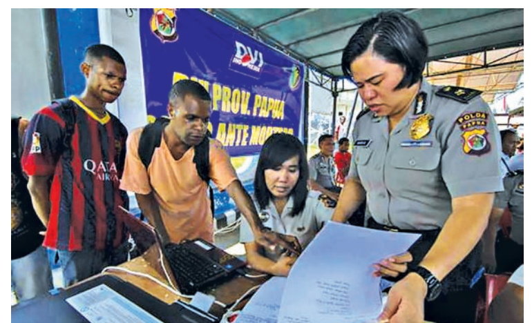
Family members of a passenger on board a crashed Trigana Air flight provide information to a police identification team at Sentani Airport near Jayapura, Papua province, Indonesia August 17, 2015 in this photo taken by Antara Foto.—REUTERS

Trigana has been on the European Union’s list of banned carriers since 2007 due to safety