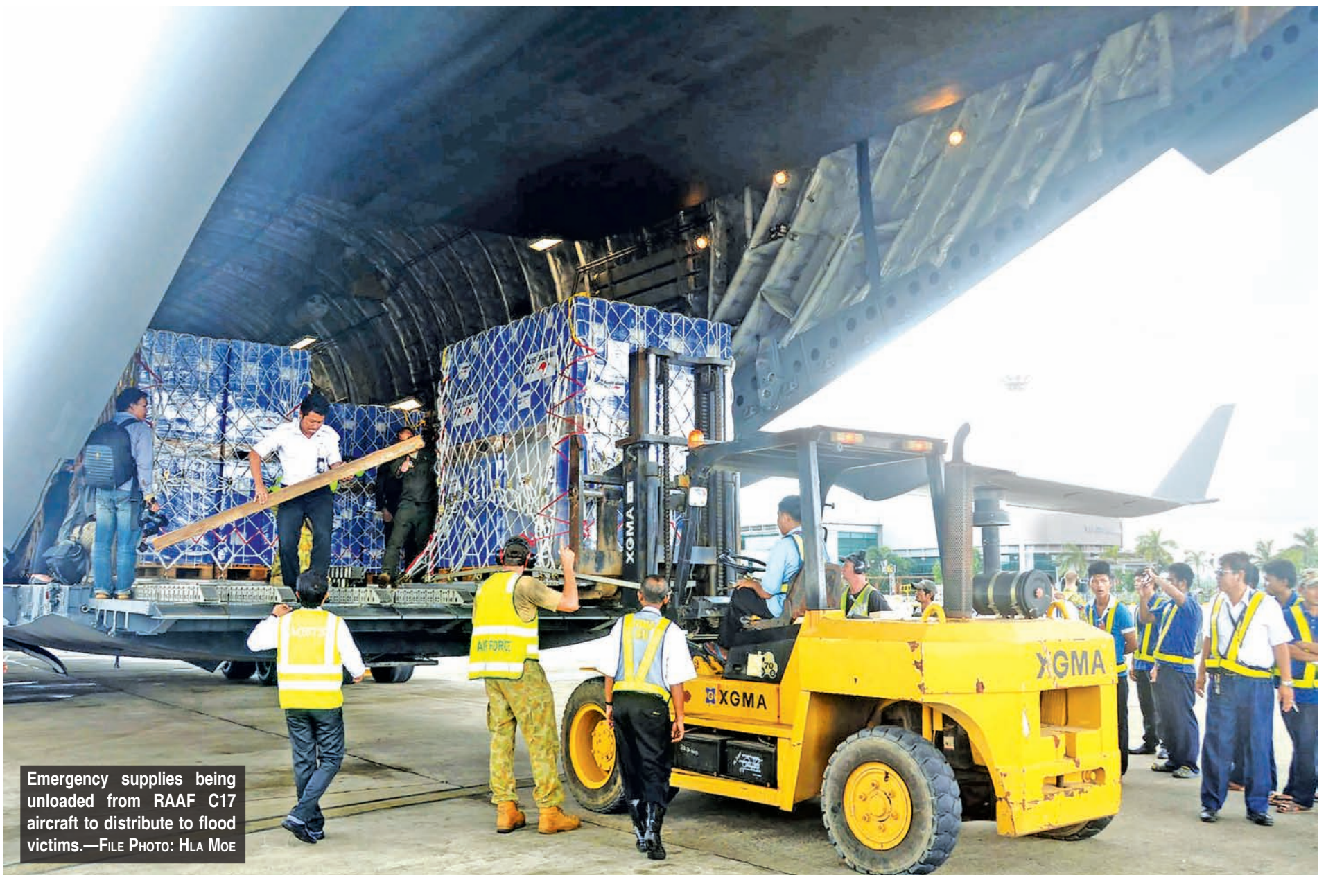
Emergency supplies being unloaded from RAAF C17 aircraft to distribute to flood victims.