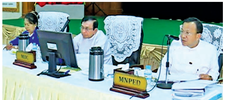
Union Ministers Dr. Daw Myat Myat Ohn Khin, U Kyaw Lwin and Dr. U Kan Zaw hold talks at the meeting and share progress of relief and recovery efforts for flood victims.