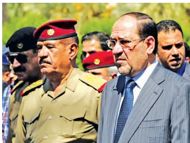
Then Iraqi Prime Minister Nuri al-Maliki (2nd R) at the defence ministry in Baghdad in this August 13, 2014 file photo.

Islamic State's seizure of Mosul, Iraq's second city, in June 2014 as it swept across the Syrian border and declared a modern "caliphate", exposed once and for all the