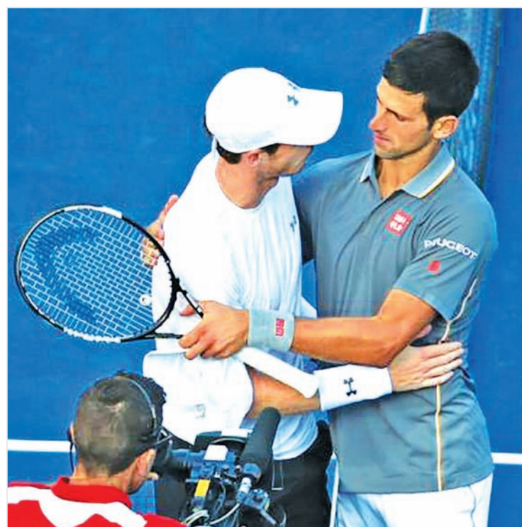
Aug 15, 2015; Montreal, Quebec, Canada; Andy Murray of Great Britain (L) and Novak Djokovic of Serbia (R) congratulate each other during the Rogers Cup tennis tournament at Uniprix Stadium.

MONTREAL, 17 Aug — Andy Murray recorded his first win over Novak Djokovic in more than two years on Sunday, beating the world number one 6-4, 4-6, 6-3 in the final of the Rogers Cup.