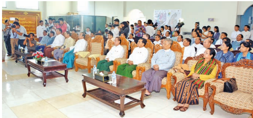
Speaker Thura U Shwe Mann addresses speech at donation ceremony for flood victims.

NAY PYI TAW, 17 Aug —Pyithu Hluttaw parliamentarians donated cash and goods for flood victims Monday at the Ministry of Social Welfare, Relief and