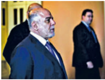
Iraqi Prime Minister Haider al-Abadi walks to a meeting with the Senate leadership at the U.S. Capitol in Washington April 15, 2015.

BAGHDAD, 16 Aug — Iraqi Prime Minister Haider al-Abadi approved on Sunday an investigative council's decision to refer military commanders to a court martial for abandoning their positions in the battle against Islamic State militants in Ramadi.