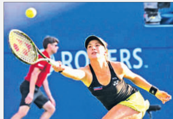
Aug 15, 2015; Toronto, Ontario, Canada; Belinda Bencic of Switzerland attempts to return a ball to Serena Williams of the USA (not pictured) in her semi final match during the Rogers Cup tennis tournament at the Aviva Centre. Belinda Bencic won 3-6, 7-5, 6-4.