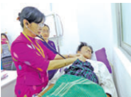
Patient with colon cancer receives treatment at day care chemotherapy center established by Golden Rose Cancer Foundation.

Myanma Railways of the Ministry of Rail Transportation bought 32 air-conditioned RBE coaches from Japan.