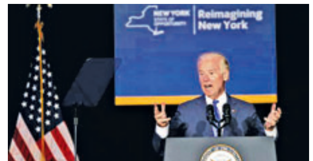
U.S. Vice President Joe Biden

CHATTANOOGA, (Tennessee), 16 Aug — Vice President Joe Biden on Saturday called the man who fatally shot four U.S. Marines and a Navy sailor a "perverted jihadist" during a eulogy for the servicemen at a memorial in Chattanooga, Tennessee.