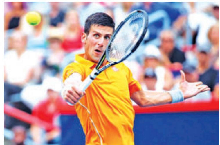
Aug 15, 2015; Montreal, Quebec, Canada; Novak Djokovic of Serbia hits a shot against Jeremy Chardy of France (not pictured) during the Rogers Cup tennis tournament at Uniprix Stadium.

Djokovic got the only break of the second set in the fifth game and then held serve as Chardy again left the court without taking a set from the Serb. It was a welcome low-stress match for the Serbian, who was pushed the brink of elimination in his Friday quarter-final, during which he survived two match points to beat 87th-ranked Latvian Ernests Gulbis. In the late semi-final, Nishikori appeared to be fatigued in the second set as Murray won 12 of the final 13 points.—Reuters