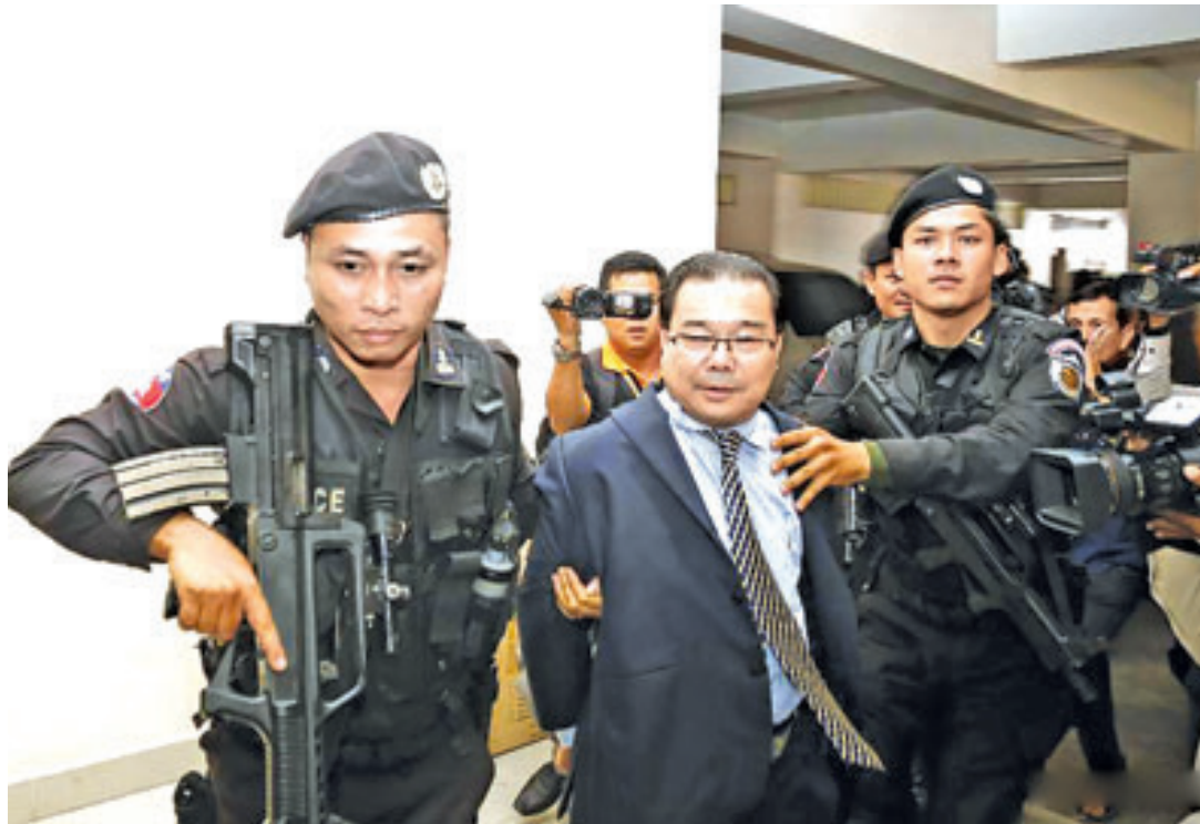
Fugitive Cambodian opposition senator Hong Sok Hour (C, front) is brought to Phnom Penh Municipal Court in Phnom Penh, Cambodia, Aug. 15, 2015. Fugitive Cambodian opposition senator Hong Sok Hour, who is wanted for allegations of treason, was arrested on Saturday, three days after Prime Minister Hun Sen ordered the arrest, an opposition spokesman confirmed.—XINHUA