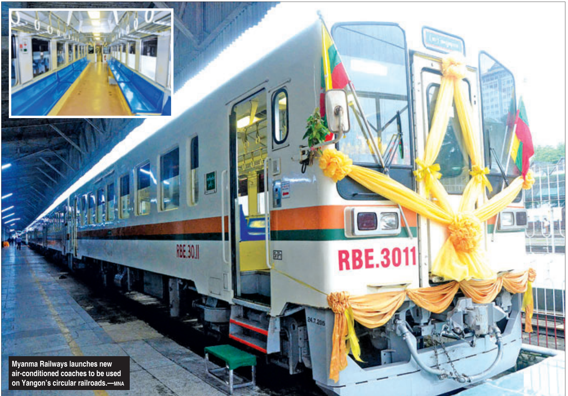
Myanma Railways launches new air-conditioned coaches to be used on Yangon's circular railroads.—MNA

NAY PYI TAW, 17 Aug — U Thein Sein, President of the Republic of the Union of Myanmar, has sent a message of felicitations to His Excellency Mr. Joko Widodo, President of the Republic of Indonesia, on the occasion of the 70 th Anniversary of the Independence Day of the Republic of Indonesia, which falls on 17 August 2015.—MNA