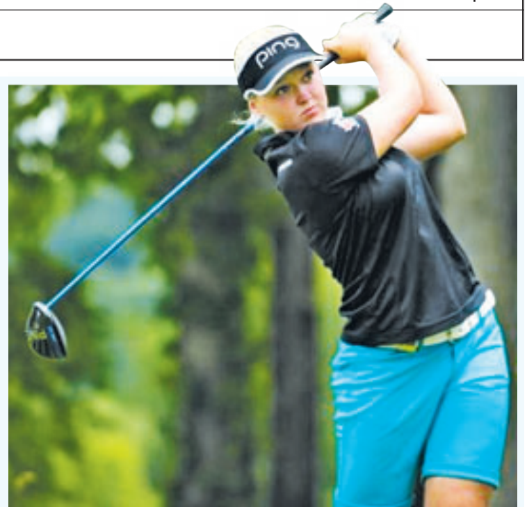
Jul 12, 2015; Lancaster, PA, USA; Brooke Henderson tees off the second hole during the final round of the U.S. Women’s Open at Lancaster Country Club. —REUTERS