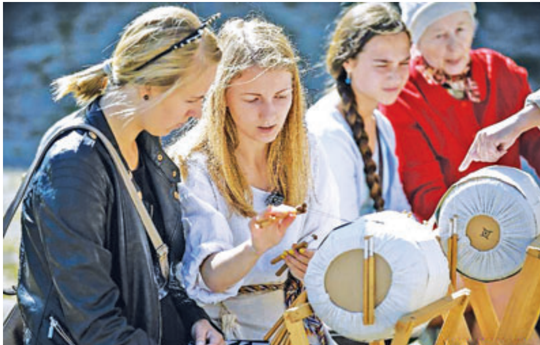
Estonian lacemakers show their works at Narva Castle’s Northern Yard on Aug. 15, 2015. Estonian famous lacemakers gathered in Narva to show their works and held master classes of bobbin lace making.