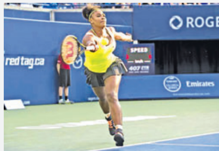
Aug 15, 2015; Toronto, Ontario, Canada; Serena Williams of the USA returns a ball to Belinda Bencic of Switzerland (not pictured) in her semi final match during the Rogers Cup tennis tournament at the Aviva Centre. Belinda Bencic won 3-6 7-5 6-4.

"I did everything I could to finish in two sets because in the third one I don't know what would happen."—Reuters