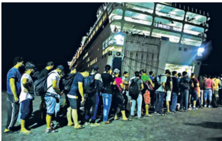
Syrian refugees line up before boarding the passenger ship 'Eleftherios Venizelos' at the port on the Greek island of Kos, August 15, 2015.—REUTERS

According to a statement by the Turkish prime minister's office, Turkish security forces have detained over 1,300 individuals with suspected ties to IS, PKK and leftist groups, whilst the military unleashed several rounds of air strikes on PKK posts in northern Iraq.—Reuters