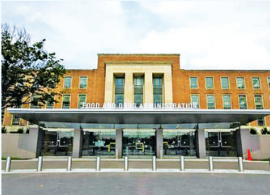
A view shows the U.S. Food and Drug Administration (FDA) headquarters in Silver Spring, Maryland August 14, 2012.

WASHINGTON, 16 Aug — The U.S. Food and Drug Administration has approved the use of opioid painkiller OxyContin in patients aged 11 to 16