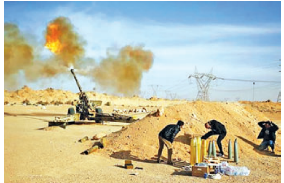
Libya Dawn fighters fire an artillery cannon at IS militants near Sirte March 19, 2015.

It was not clear how Arab states would respond. An Arab coalition led by Saudi Arabia launched air strikes in Yemen in late March in an effort to stop the Iran-allied Houth movement spreading across the country from the north.—Reuters