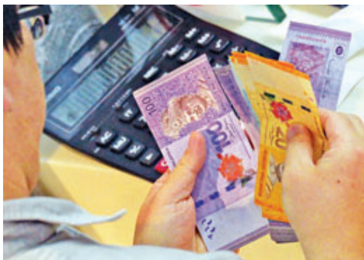
A man exchanges Malaysian Ringgit at a money changer in Singapore's Raffles Place on Aug 14, 2015. Singapore dollar hits a new height at an exchange rate of 1 Singapore Dollar for 2.9 Malaysian Ringgit on Friday.

BEIJING, 16 Aug — Malaysian government has no intention to adopt a fixed exchange rate though ringgit has reached a historically low against the U.S. dollar, according to Malaysia's Second Finance Minister Ahmad Husni