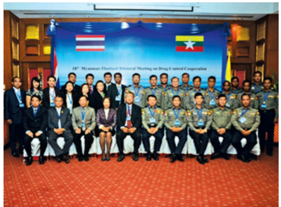
Senior police officers of Myanmar pose for documentary photo with Thai delegation members at 18 th Bilateral Meeting on Drug Control Cooperation.—MNA

The Myanmar delegation led by Secretary of Central Committee for Drug Abuse Control