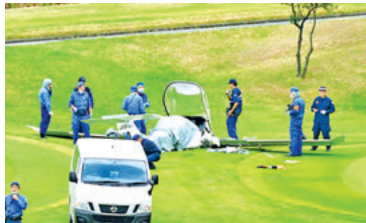
Police examine the wreckage of an ultra light plane that crashed at a golf course in Tsukuba city, about 50 kilometers northeast of Tokyo, on Aug. 16, 2015, killing the two men inside it.

Mito, (Japan), 16 Aug — Two men were confirmed dead Sunday after an ultra light plane crashed into a golf course in a Tokyo suburb, police said.