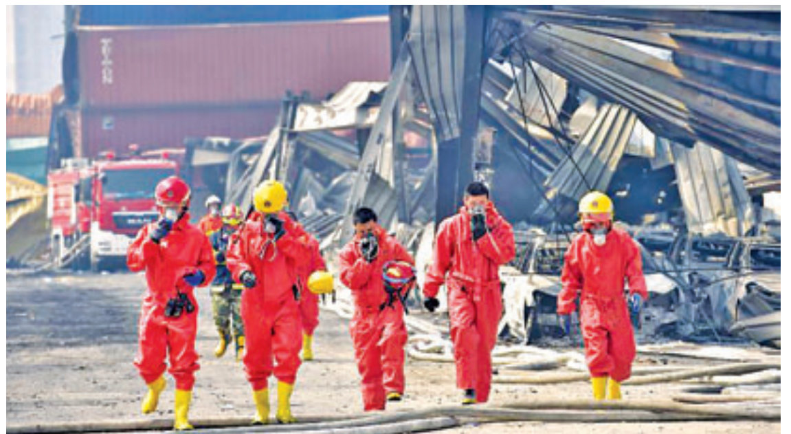
Rescuers work at the explosion site in north China's Tianjin Municipality, Aug. 16, 2015. A total of 112 bodies have been found, and 95 people remained missing, including 85 firefighters, after massive warehouse explosions rocked north China's Tianjin city Wednesday night, officials said at a press conference Sunday morning.—XINHUA

A total of 722 people remained hospitalized, including 58 in critical or serious conditions, the rescue headquarters said on Saturday night.—Xinhua