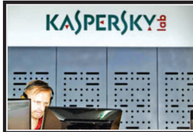
An employee works near screens in the virus lab at the headquarters of Russian cyber security company Kaspersky Labs in Moscow July 29, 2013.

"It was decided to provide some problems" for rivals, said one ex-employee. "It is not only damaging for a competing com-