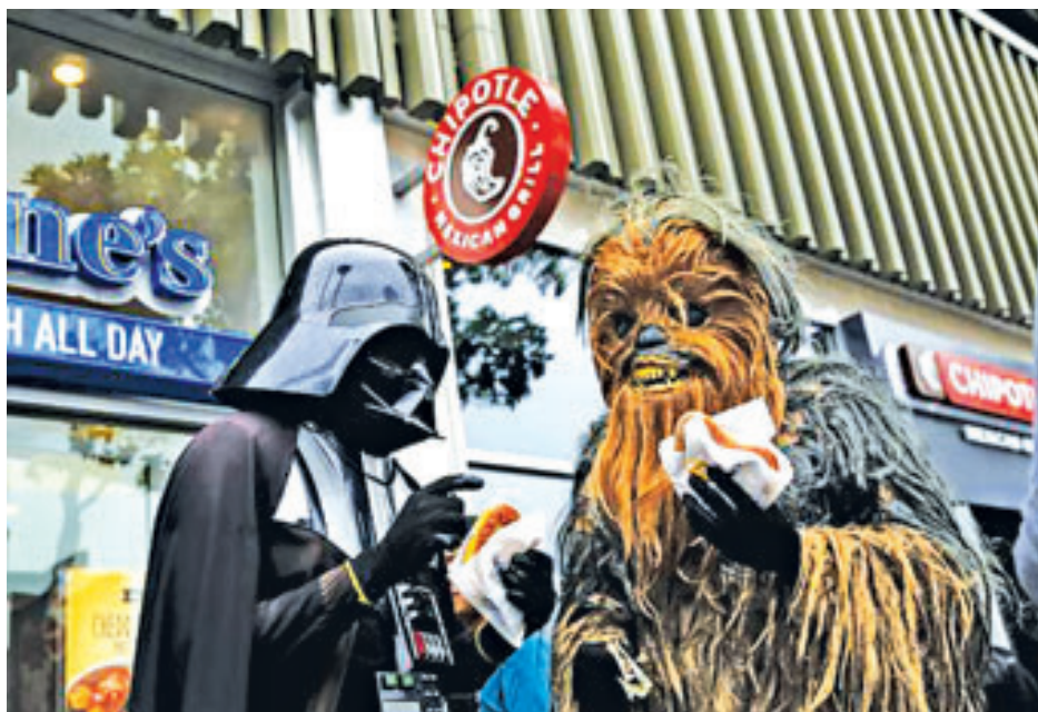
People wearing Star Wars-themed costumes eat pretzels in San Francisco, California July 21, 2015.

Disney did not comment on costs. The company spent $1 billion to build