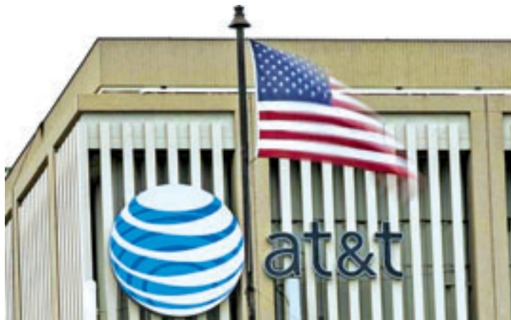
An AT&T Logo is pictured as a U.S. flag flutters in the foreground in Pasadena, California, January 26, 2015.

The company helped the spy agency in a broad range of classified activities, the newspaper reported. The documents describe how the NSA's working relationship with AT&T has been particularly important, enabling the agency to conduct surveillance,