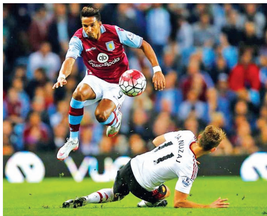
Aston Villa v Manchester United - Barclays Premier League - Villa Park - 14/8/15. Manchester United's Adnan Januzaj in action with Aston Villa's Scott Sinclair.

One fine team move, though, was enough to be decisive. Juan Mata slid a delightful probing ball into the box and Januzaj ghosted away from his marker and turned Micah Richards neatly before