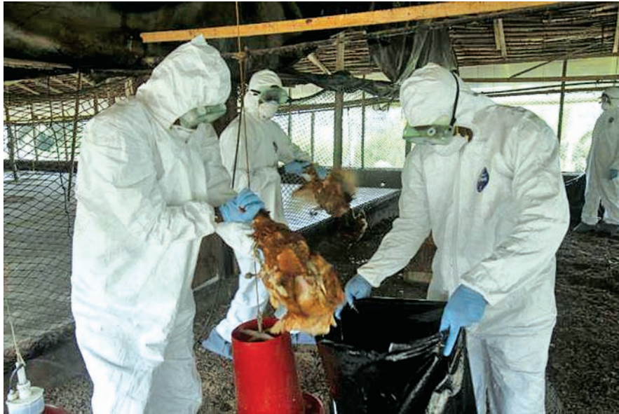
Workers from the Animal Protection Ministry cull chickens to contain an outbreak of bird flu, at a farm in the village of Modeste, Ivory Coast, August 14, 2015.

ABIDJAN, 15 Aug — Ivory Coast said on Friday that H5N1 bird flu had spread to a third location in the country, in the latest in a series of outbreaks in West Africa.