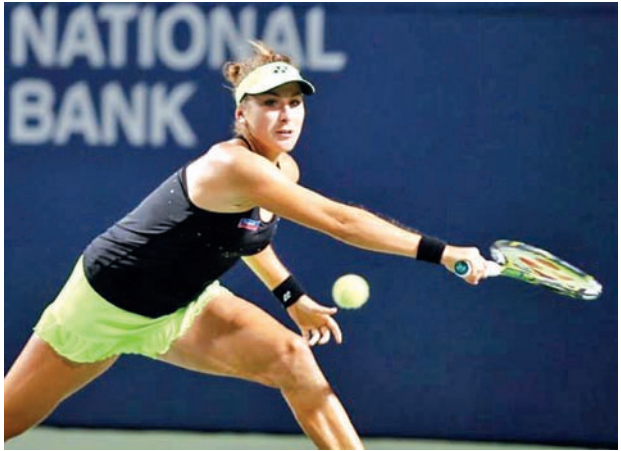
Aug 14, 2015; Toronto, Ontario, Canada; Belinda Bencic (SUI) goes to return a ball against Ana Ivanovic (not pictured) during the quarter finals of the Rogers Cup tennis tournament at Aviva Centre.

"At the beginning I could not move my legs. I felt very tired," said Halep. "I just kept focused on what I had to do and just tried to keep the ball in the court to make some longer rallies."—Reuters