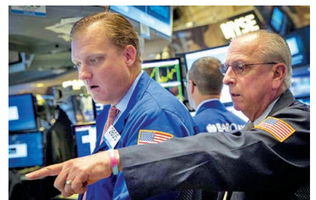
Traders work on the floor of the New York Stock Exchange August 13, 2015.

Economic growth in the euro zone slowed in the second quarter as France stagnated and Italy lost momentum, held back by an uncertain global outlook that is weakening investment even in powerhouse Germany. Crude oil futures fell to levels not seen since early 2009 before recovering slightly. U.S. crude oil settled up 27 cents at $42.50 a barrel after hitting a 6-1/2-year low of $41.35 a barrel due to a big increase in U.S. inventories. Brent was down 0.5 percent at $49.00. The U.S. dollar fell 0.1