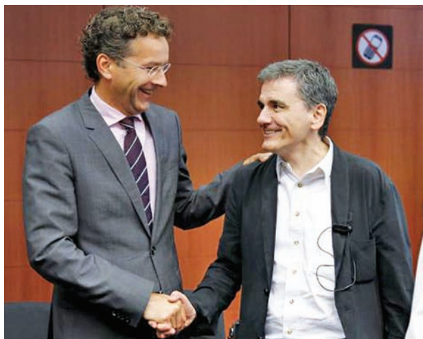
Dutch Finance Minister and Eurogroup President Jeroen Dijsselbloem shakes hands with Greek Finance Minister Euclid Tsakalotos (R) at the start of a euro zone finance ministers meeting in Brussels, Belgium, August 14, 2015.

uncertainty — aside from Tsipras' ability to deliver sweeping budget cuts and privatisations opposed by many of his own party — is the role of the Interna-