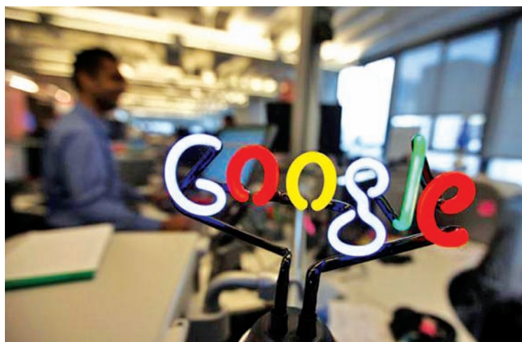
A neon Google logo is seen as employees work at the new Google office in Toronto, November 13, 2012.

BRUSSELS, 15 Aug — Google Inc, the world's most popular Internet search engine, has been given an extra two weeks to counter European Union charges of abusing its market power in a dozen EU countries and stave off a possible billion-euro fine.