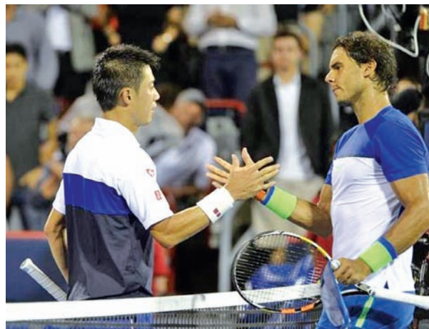
Aug 14, 2015; Montreal, Quebec, Canada; Kei Nishikori of Japan and Rafael Nadal of Spain shake hands after their match during the Rogers Cup tennis tournament at Uniprix Stadium.

Djokovic's Master Series streak to 29 victories. He has not lost since Roger Federer beat him in Shanghai last year.