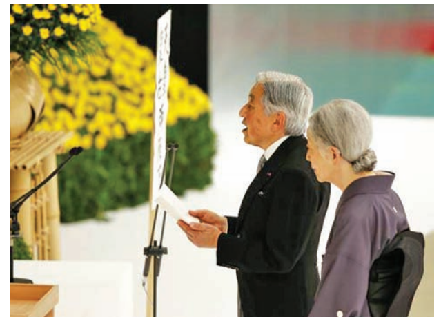
Japan’s Emperor Akihito (L) delivers a speech next to Empress Michiko after they offer a moment of silence to the war dead during a memorial service ceremony marking the 70th anniversary of Japan’s surrender in World War Two at Budokan Hall in Tokyo August 15, 2015.—REUTERS

Following Abe’s speech, participants observed a moment of silence at noon for the 2.3 million Japanese military personnel and 800,000 civilians killed in the war, including in the U.S. atomic bombings and air raids on Japanese cities.—Kyodo News