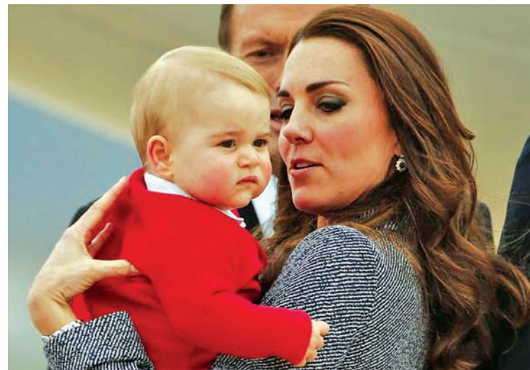
Britain's Catherine, the Duchess of Cambridge, holds her son Prince George as they prepare to board a plane with her husband Prince William (not pictured) to depart Canberra April 25, 2014.

The royals also complained about harassment of Kate Middleton before the couple married in 2011. A year after their wedding, European magazines printed topless pictures of her taken while she was on holiday in France.