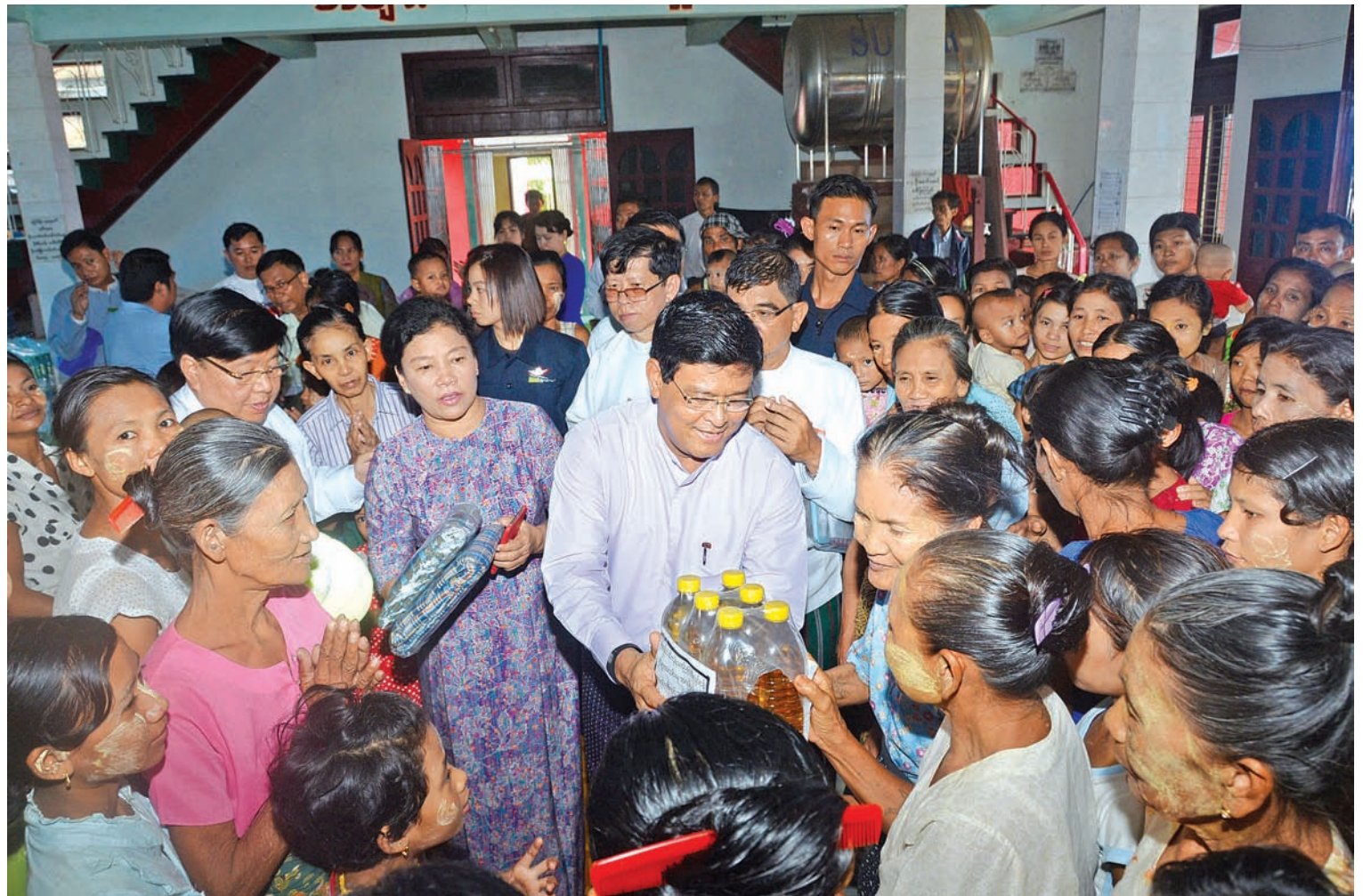
Vice President U Nyan Tun presents relief aids to flood victims sheltered at Mingalar Brick Monastery relief camp in Thayawady, Bago Region.

The vice president also inspected the general hospital in the township of Zeegone and comforted patients there.