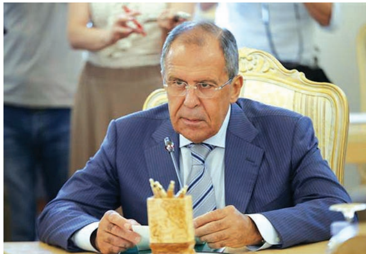
Russia's Foreign Minister Sergei Lavrov attends a meeting with Saudi Foreign Minister Adel al-Jubeir in Moscow, Russia, August 11, 2015.

will take place about key problems on the global and regional agenda, including overcoming the crisis in Syria."