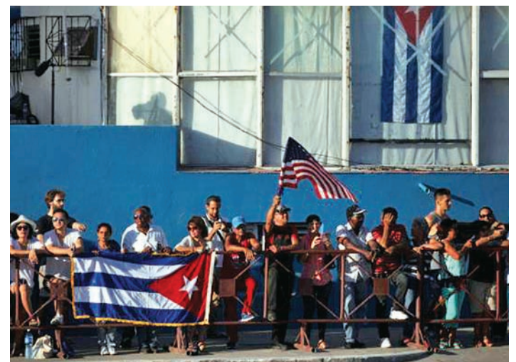
People stand on a sidewalk near the U.S. embassy in Havana, Cuba, August 14, 2015.

While the tone in U.S.-Cuban relations has improved greatly since detente was announced in December, the blunt statements and rebukes underscored how far the two countries are from normal relations after decades of hostilities that outlived the Cold War. Both sides stressed Friday that the path towards normalization of overall relations would be