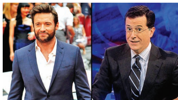
Hugh Jackman & Stephen Colbert

Pearl Jam, Beyonce, Coldplay and Ed Sheeran are slated to perform at the festival where Colbert and Jackman, along with the rest of the hosts, will encourage