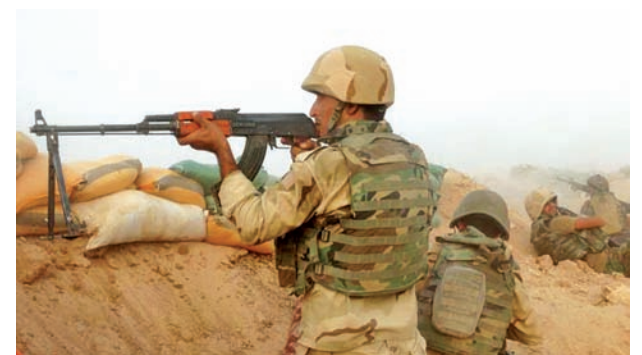
Iraqi security forces fire warning shots to discourage Islamic State militants from approaching their position on the outskirts of Ramadi August 6, 2015.