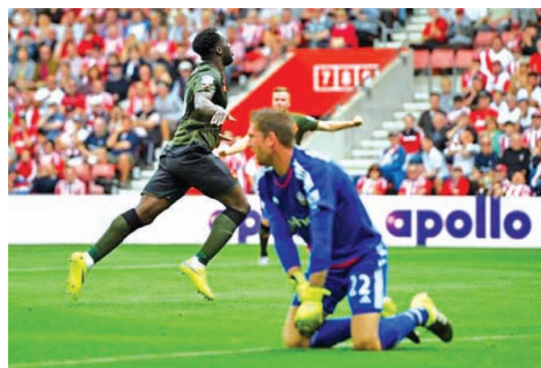
Romelu Lukaku celebrates scoring the second goal for Everton.

LONDON, 15 Aug — Two excellent first-half goals by Romelu Lukaku inspired Everton to an emphatic 3-0 victory at Southampton in the Premier League on Saturday.