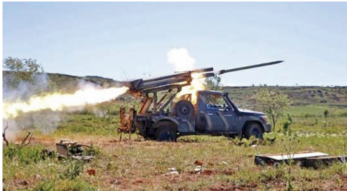
Rebel fighters from the Ahrar al-Sham Islamic Movement fire grad rockets from Idlib countryside towards forces loyal to Syria's President Bashar al-Assad, who are stationed at Jureen town in al-Ghab plain in the Hama countryside April 24, 2015.

BEIRUT, 15 Aug — A Syrian rebel group said on Saturday a ceasefire was over between insurgents and the Syrian army and its Lebanese ally Hezbollah in a town near the Lebanese border and two villages in the northwest.