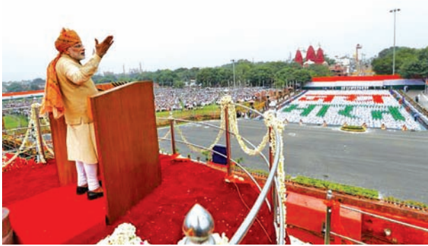
Prime Minister Narendra Modi addresses the nation from the historic Red Fort during Independence Day celebrations in Delhi, India, August 15, 2015.

NEW DELHI, 15 Aug — Indian Prime Minister Narendra Modi on Saturday sought to shed an image that he governs for big business, vowing to help the poor and create jobs in a speech aimed at bolstering