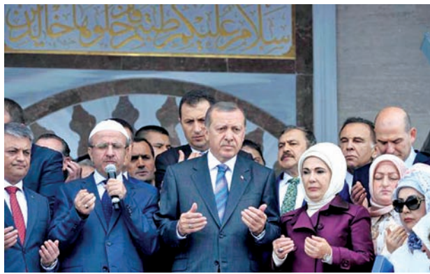
Turkish President Tayyip Erdogan (C), accompanied by his wife Emine Erdogan (3rd R), prays during the opening ceremony of Kibledagi mosque in Rize, Turkey, August 14, 2015.

The uncertainty comes as the NATO member