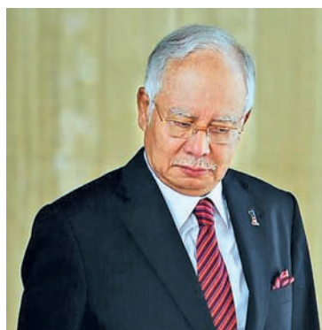
Malaysia's Prime Minister Najib Razak is pictured during the 19th Annual Leaders Consultation at Nurul Iman Palace in Bandar Seri Begawan, Brunei, August 11, 2015.