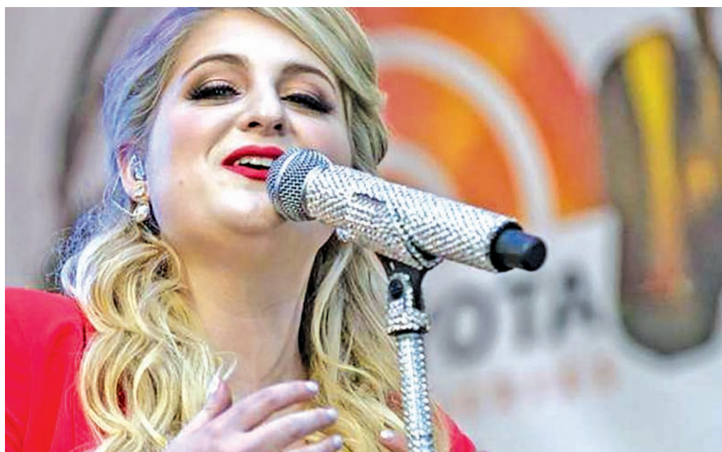
Singer Meghan Trainor performs on NBC's "Today" show in New York May 22, 2015.

LOS ANGELES, 12 Aug — U.S. singer Meghan Trainor canceled the remainder of her "MTrain Tour" on Tuesday after suffering a hemorrhaged vocal cord.