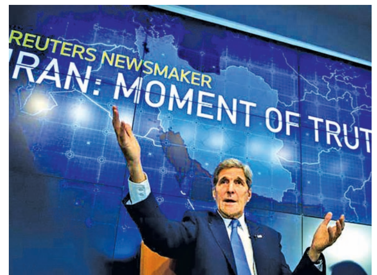
U.S. Secretary of State John Kerry speaks during a Reuters Newsmaker event on the nuclear agreement with Iran, in New York August 11, 2015.