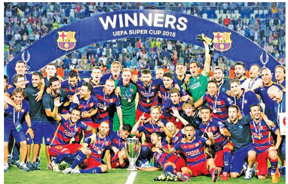
Barcelona’s players, coaches and officials celebrate their victory over Sevilla in the UEFA Super Cup soccer match at Boris Paichadze Dinamo Arena in Tbilisi, Georgia, August 12, 2015.