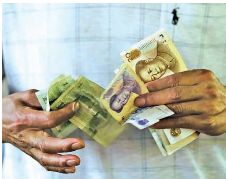
A customer counts Chinese Yuan notes at a market in Beijing, August 12, 2015.

"Many people were expecting an improvement and there is no improvement. Things are getting worse rather than getting better. This kind of data makes it really challenging to achieve the official 7 percent growth (target)