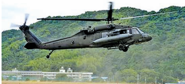
Photo taken June 7, 2015, shows a U.S. Army UH-60 helicopter. A helicopter believed to be the same model crashed off Okinawa's main island on Aug. 12, 2015, injuring 7 crew members, but all 17 on board were rescued, Japanese authorities said.— Kyodo News

The helicopter is believed to be a U.S. Army UH-60, a government source said.— Kyodo News