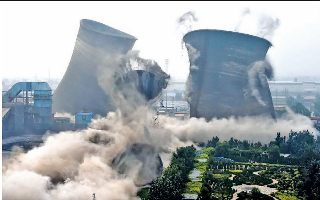
Photo taken on Aug. 11, 2015 shows the demolition of seven coal-fired units with a total capacity of 680,000 kilowatts in Chiping County, east China's Shandong Province. The local government has issued a project of cleaning up illegal constructions since last October. Some 7,019 construction projects which are of environmental violations have been cleared so far.