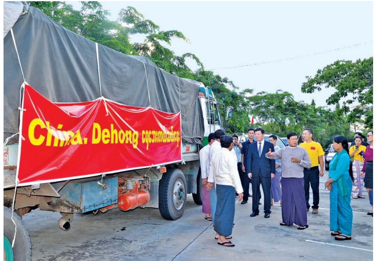
Vice President U Nyan Tun views relief aid donated by Dehong Prefecture of China for flood victims in Myanmar.—MNA

The Chinese contributions included K40 million plus mosquito nets, groundsheets, oil, rice, detergent, clothes, canned fish, tents, medicines and kitchen utensils.—MNA