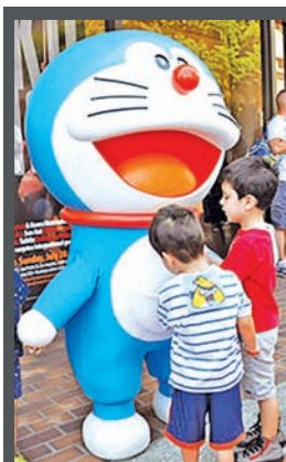
Undated photo shows children looking at a Doraemon statue. Japanese broadcaster TV Asahi Corp. said on Aug. 11, 2015, that the popular cartoon program will be shown in Britain from Aug. 17, making it the 38th country or region to run the series.

Doraemon, a robotic cat who travels from the 22nd century to the present day to help elementary school boy Nobita, first appeared in manga in 1969 and has been spun off into movies and video games as well as the animated series. Boomerang describes Nobita on its website as "10-year-old Noby, a lazy uncoordinated terrible student who needs all the help he can get."—Kyodo News