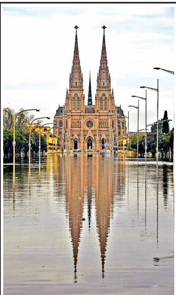
Photo taken on Aug. 11, 2015 shows the view of a flooded road in Lujan city, Buenos Aires province, Argentina. According to local press, the heavy rains in the province of Buenos Aires have left 3 people dead and thousands of people affected.