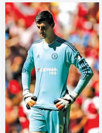
Chelsea v Arsenal - FA Community Shield - Wembley Stadium - 2/8/15 Chelsea's Thibaut Courtois looks dejected.

LONDON, 12 Aug — Chelsea goalkeeper Thibaut Courtois will miss the champions' visit to Manchester City on Sunday after an appeal against a red card for the Belgian international was rejected by the Football Association.