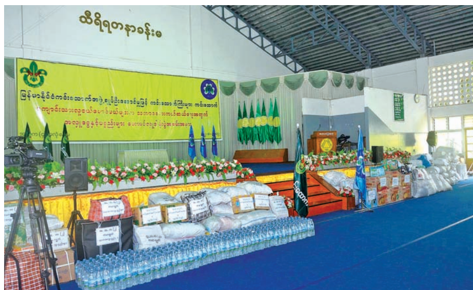
Photo shows foods and personal goods donated by Myanmar Scouts Federation. ZAW MIN LATT