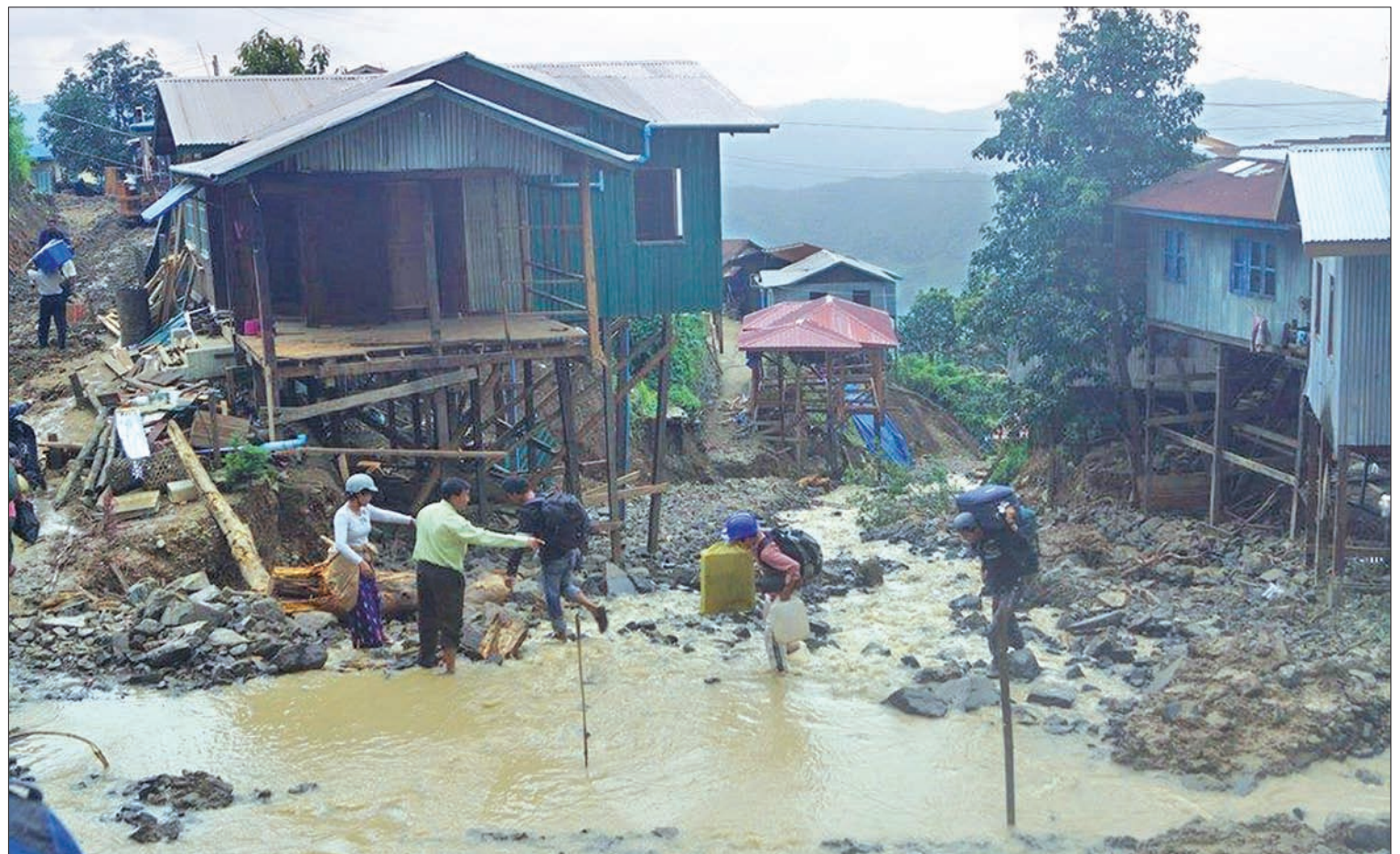
Residents leave their homes as they are in danger of landslides.

The Chin State government has distributed emergency aid to residents, giving priority to those in urgent need, a government official said.—GNLM