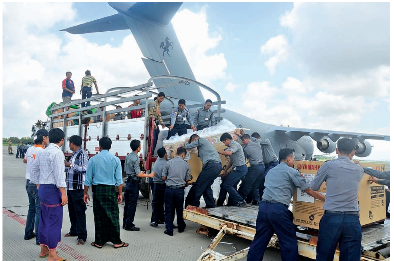
Members of Myanmar Aviation Police Corps (Yangon) unloading relief aid from aircraft of RAAF onto trucks.—HLa Moe

YANGON, 12 Aug—A Royal Australian Air Force aircraft carrying family kits donated by Australia and relief supplies from the ASEAN Coordination Centre for flood victims arrived at Yangon International Airport, here, Wednesday.