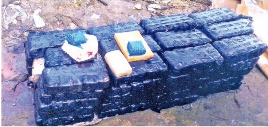
Photo shows packets of narcotic drugs seized in Thakayta Township.

YANGON, 12 Aug — Drug search operations have led to seizures of heroin and stimulant tablets in four Yangon Region townships, police said Wednesday.