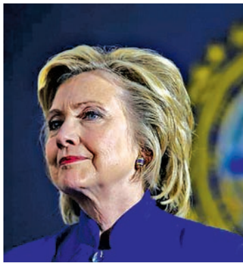
U.S. Democratic presidential candidate Hillary Clinton listens to a question from the audience during a community forum about substance abuse in Keene, New Hampshire August 11, 2015.