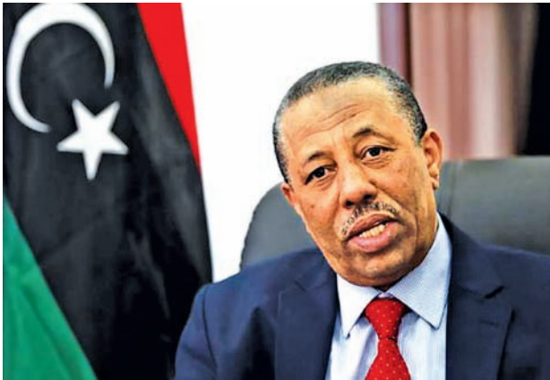
Libya's internationally recognized Prime Minister Abdullah al-Thinni speaks during an interview with Reuters in Bayda February 15, 2015.

TRIPOLI / BENGHAZI, (Libya), 12 Aug — Libya's internationally recognized Prime Minister Abdullah al-Thinni said in a television interview that he would resign, after the station's host confronted him with questions from angry citizens who criticized his cabinet as ineffective.