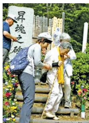
Mourners visit the cenotaph on Osutaka Ridge, the accident site of the 1985 Japan Airlines jumbo jet crash, on Aug. 12, 2015, the 30 th anniversary of the tragedy, in the central Japan prefecture of Gunma. The world's deadliest single-carrier aircraft tragedy killed all but four of the 524 passengers and crew on board.

The center, open to the public, displays the wreckage of the crashed jumbo jet and items including the collapsed pressure bulkhead, damaged passenger seats and passengers' notes addressed to their families.