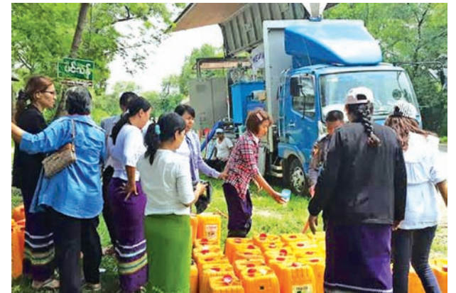
Well-wishers donate aid to flood victims.

NAY PYI TAW, 12 Aug — More than 22,800 litres of purified drinking water was delivered to flood victims in 24 villages in Monywa District, Sagaing Region, according to Ministry of Livestock, Fisheries and Rural Development.