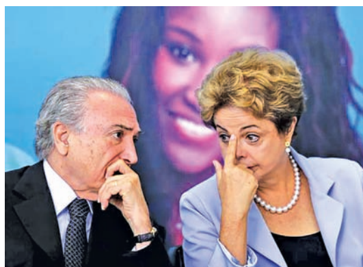
Brazil's Vice President Michel Temer talks with Brazil's President Dilma Rousseff during a ceremony for the Investment Program in Electricity at the Planalto Palace in Brasilia, August 11, 2015.

BRASILIA, 12 Aug — Brazilian President Dilma Rousseff and leading senators plan to introduce an agenda of market-friendly proposals this week, in a move one senior official said was aimed at countering a revolt by lower chamber lawmakers.