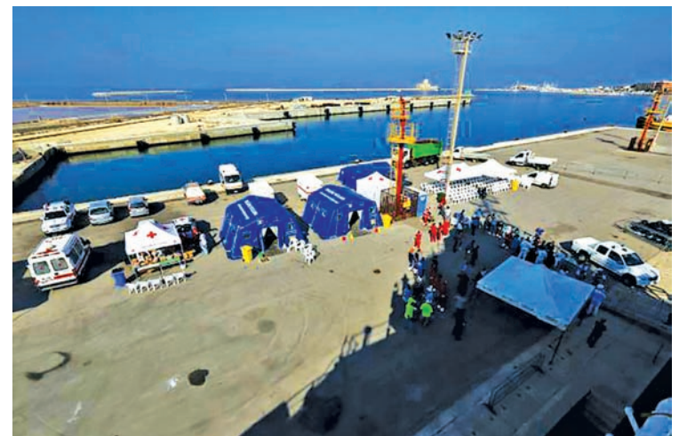
Italian authorities and the Red Cross wait for migrants as they disembark from the Medecins Sans Frontiere (MSF) rescue ship Bourbon Argos in Trapani, on the island of Sicily, Italy, August 9, 2015. —REUTERS

Some 200 migrants were presumed killed earlier this month off the coast of Libya when their boat capsized. More than 400 were rescued from that shipwreck.—Reuters