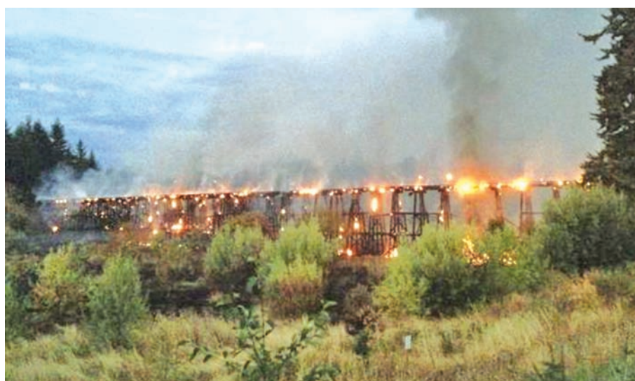
A historic Portland and Western Railroad trestle is seen on fire near Sherwood, Oregon, in this handout photo from the Tualatin Valley Fire and Rescue Department released to Reuters August 11, 2015.

Wallenda is part of the seventh generation of the famed Flying Wallenda family of acrobats. His great-grandfather, Karl Wallenda, slipped and fell to his death from a high wire in Puerto Rico in 1978.—Reuters