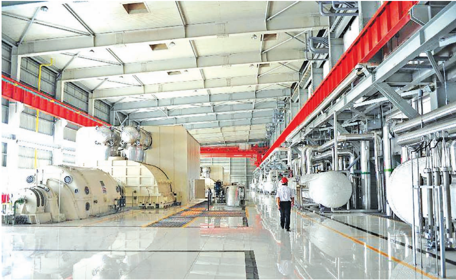
During its completion ceremony, a staff member walks in the coal-fired power plant in Celukan Bawang, Bali, Indonesia, Aug. 11, 2015. The plant, invested by China Huadian Engineering Co., Ltd, is a result of the two countries' energy cooperation.