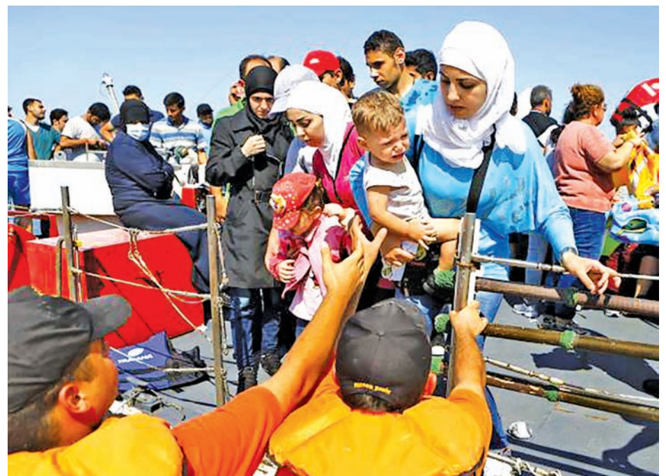
Members of the Turkish coast guards help a Syrian migrant family to disembark on the shore in Cesme, near the Aegean port city of Izmir, Turkey, August 11, 2015.