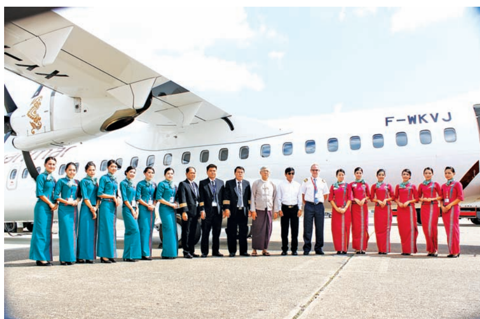
New ATR-72-XY-AJY of Myanmar National Airlines seen with crew members.—MNA

The aircraft can give 70 seats to the passengers.—MNA