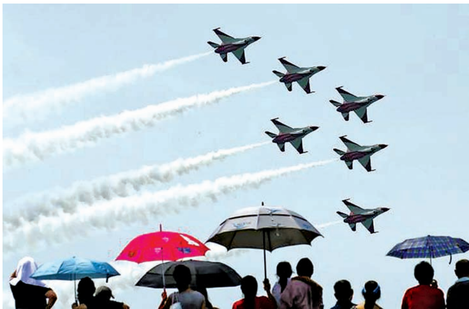
The Republic of Singapore Air Force Black Knights aerobatics team performs a manoeuvre during an aerial display ahead of Singapore's Golden Jubilee celebrations along the southern coast of Singapore August 8, 2015.

The government intends to showcase its success in an elaborate parade that will include a flypast by fighter jets and fire-