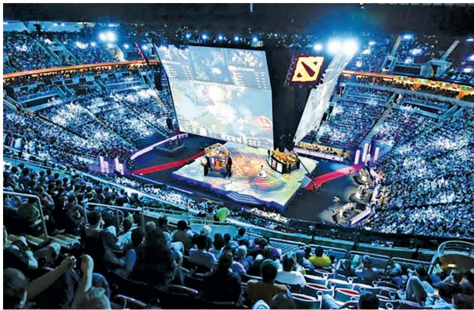
Fans watch a competition during The International Dota 2 Championships at Key Arena in Seattle, Washington August 8, 2015.

Players and teams came to the United States from China, South Korea, Ukraine, Russia and elsewhere to compete for a