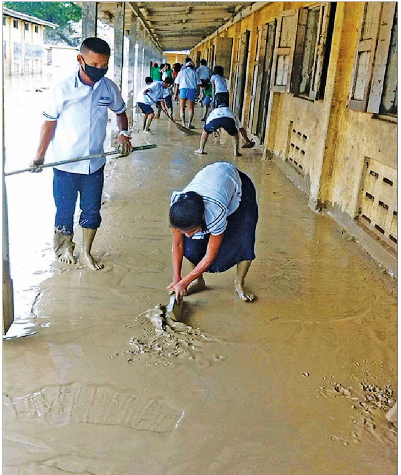
Flood- and landslide-damaged schools in worst-hit areas in Sagaing Region struggle to reopen.—MNA

The floods inundated more than 1.2 million acres of rice fields, destroying more than 439,400 acres, according to the Ministry of Agriculture and Irrigation.