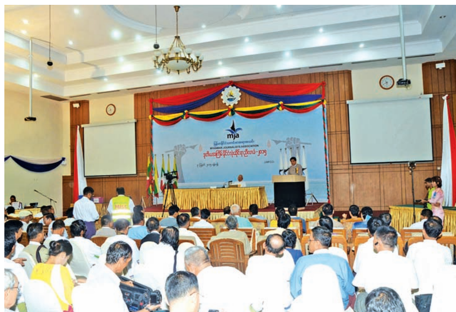
The 2 nd conference of Myanmar Journalists Association in progress at UMFCCI Office Tower in Yangon.