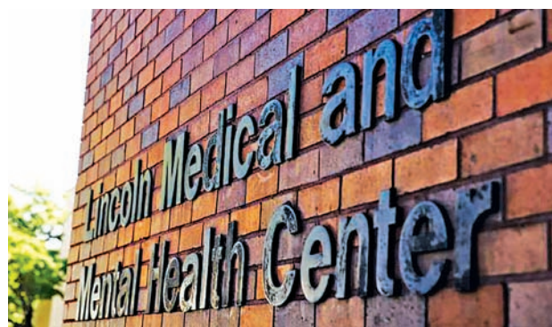
A sign hangs outside Lincoln Medical Center where a cooling tower has been tested and disinfected following a deadly outbreak of Legionnaires' disease in the South Bronx region, New York August 7, 2015.

A cooling housing market, uneven exports and weak investment have cooled annual economic growth, which will be slowest in a quarter of a century even if it hits Beijing's target this year.