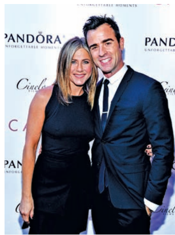
Jennifer Aniston & Justin Theroux

LOS ANGELES, 9 Aug — "Friends" actress Jennifer Aniston reportedly ditched the typical white gown for her wedding to Justin Theroux and opted for a dress in "off-white, cream" shade.