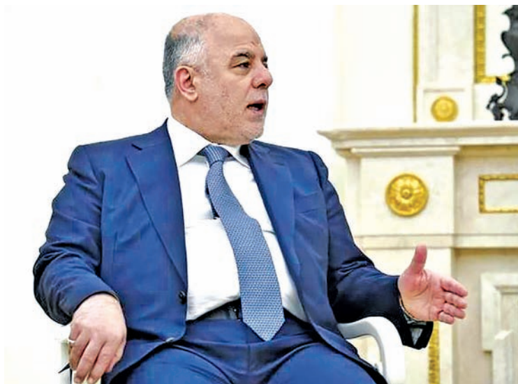
Iraqi Prime Minister Haider al-Abadi talks to Russian President Vladimir Putin (not pictured) during their meeting at the Kremlin in Moscow, Russia, May 21, 2015.

In July, the Afghan government and the Taliban held talks, raising hopes for peace through dialogue. But following the revelation of the death of Taliban leader Mullah Mohammad Omar, the Taliban released a message Aug. 1 by his successor Akhtar Mohammad Mansoor calling for continued jihad against the Afghan government.