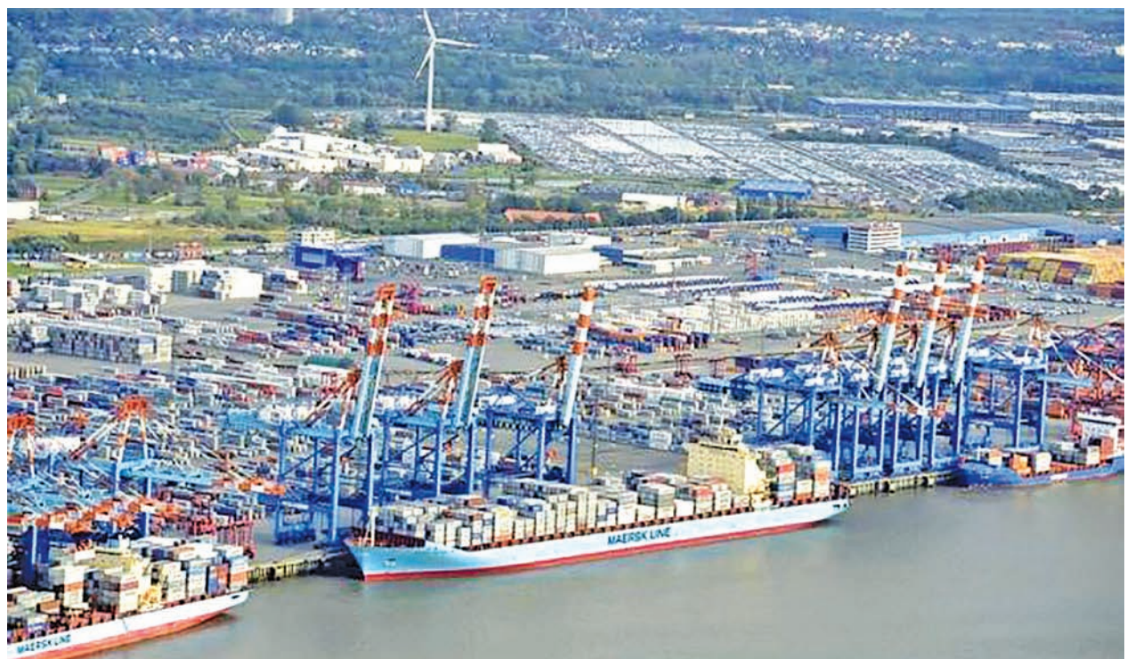
Shipping terminals and containers are pictured in the harbour of the northern German of Bremerhaven on the banks of the river Elbe, late October 8, 2012.

Despite a fall in exports in June, the larger net balance between exports and imports meant that the trade surplus widened to a record 24.0 billion euros ($26.19 billion), data published on Friday showed.— Reuters