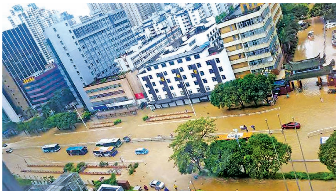
Vehicles run on waterlogged roads in downtown Fuzhou, southeast China's Fujian Province, Aug. 9, 2015. Typhoon Soudelor stormed through Fujian after it landed in the province on Saturday night, causing urban waterlogging in the capital city of Fuzhou.