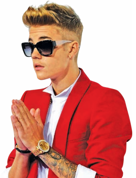
Pop sensation Justin Bieber

LOS ANGELES, 9 Aug — Pop sensation Justin Bieber has revealed that his highly-anticipated LP would come out in September.