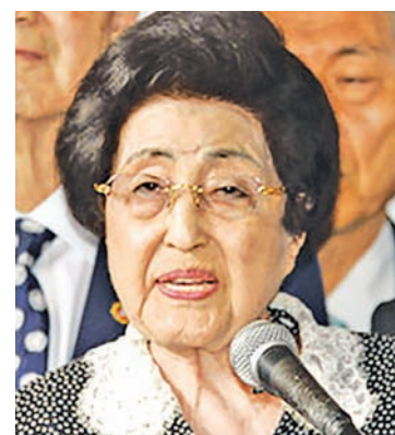
Lee Hee-ho, 92, the widow of former South Korean President Kim Dae-jung, speaks at Seoul's Gimpo airport on Aug. 8, 2015, after returning from North Korea.

"I held hands with children at a kindergarten in Pyongyang and felt that we should not hand down