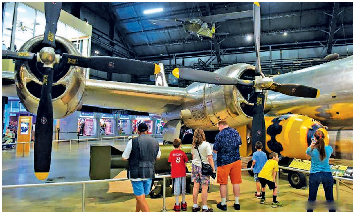
Visitors look at demilitarized atom bombs, nicknamed "Little Boy" (L) and "Fat Man" (R), and the Bockscar B-29 bomber at the National Museum of the United States Air Force in Dayton, Ohio, Aug. 6, 2015. To accelerate Japan's surrender in World War II, the U.S. army dropped atom bombs "Little Boy" and "Fat Man" respectively to the Japanese cities of Hiroshima and Nagasaki in August 1945.