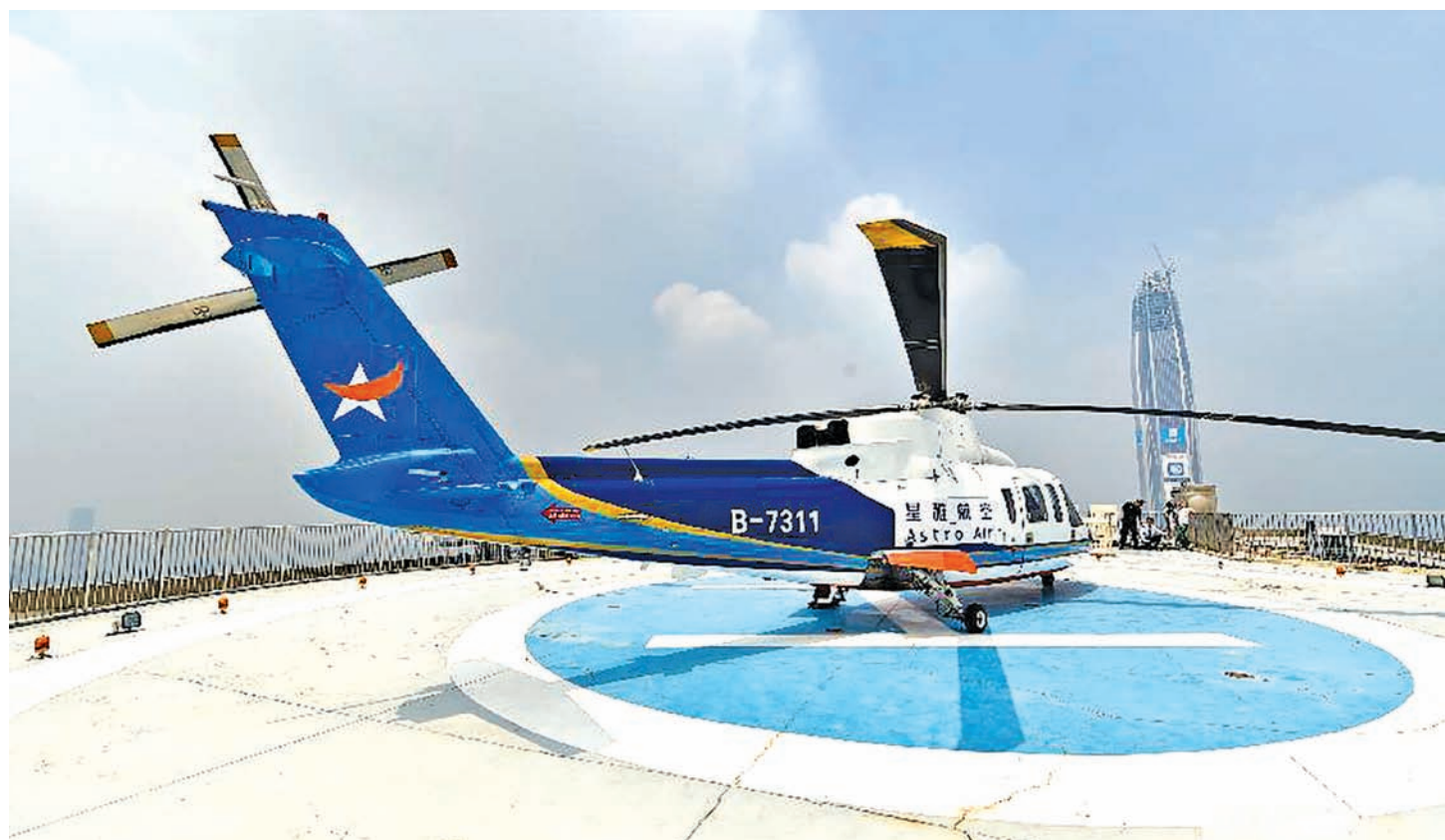
Photo taken on Aug. 7, 2015 shows a helicopter of Astro Air sitting parked on the top of an office building in downtown Shenzhen, south China's Guangdong Province. Astro Air Co. Ltd. Company in Shenzhen on Aug. 7 launched helicopter tours over a scenic part of the city, while saying it also plans to start an intercity "flying taxi" service. The tour over Nanshan District offers tourists a 25-minute ride for 2,598 yuan (about 418.78 U.S.dollars) per person.