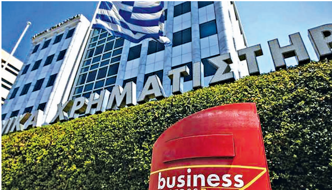
A Greek flag flutters outside the Athens stock exchange, Greece, July 27, 2015.

ATHENS, 9 Aug — Greek government officials discussed a draft of the country's third bailout agreement drawn up on the basis of discussions with EU/IMF lenders, a government official said on Saturday, boosting hopes a deal could be wrapped up in days.