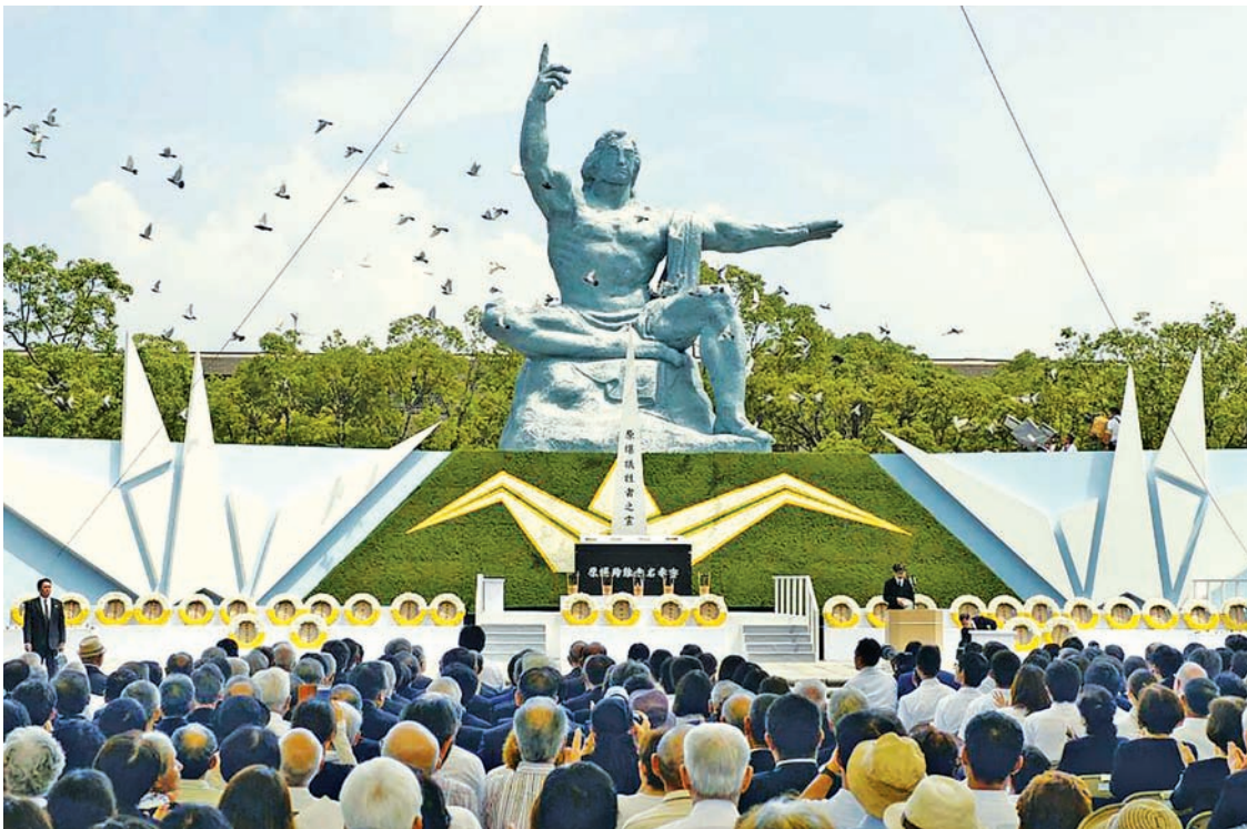
Doves fly over the Statue of Peace during a ceremony at Nagasaki Peace Park in Nagasaki, southern Japan Sunday, Aug. 9, 2015 to mark the 70th anniversary of the world's second atomic bomb attack. The atomic bomb attack on this city that left more than 70,000 dead and hastened the end of World War II exactly 70 years ago.

NAGASAKI, 9 Aug — The following is the text of a speech delivered by Prime Minister Shinzo Abe at a memorial ceremony in Nagasaki on Sunday marking the 70th anniversary of the U.S. atomic bombing of the city.