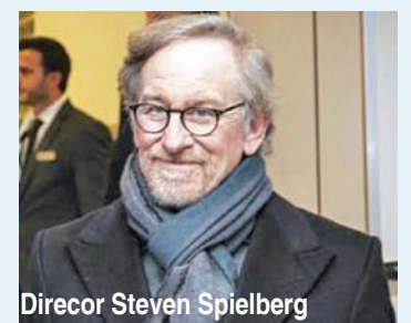
Director Steven Spielberg