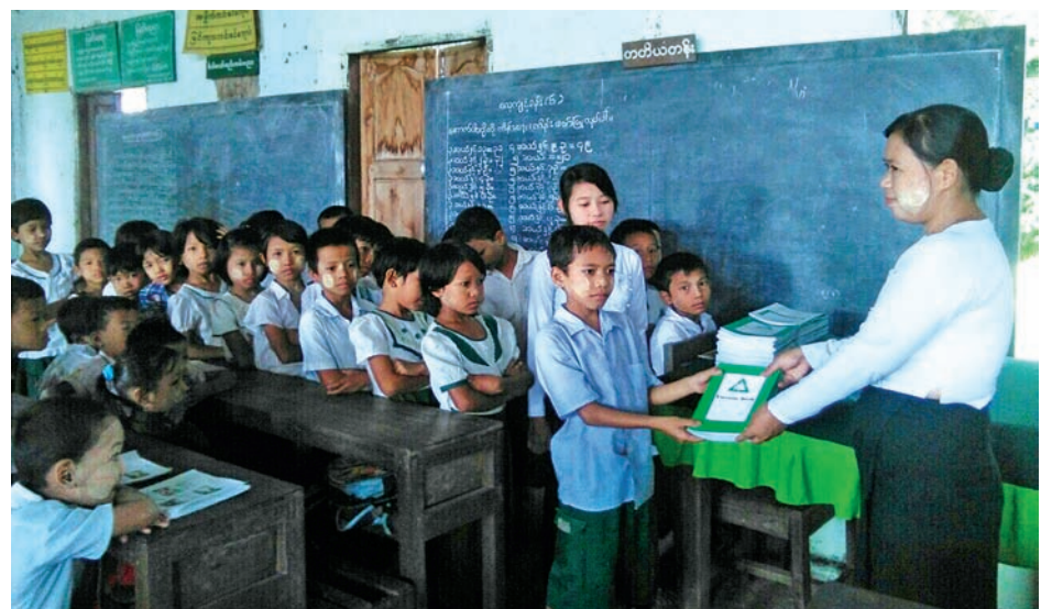
Teacher presents notebooks to students at Kwetanshay BEMS Branch in Bago.

NAY PYI TAW, 7 Aug — According to the rehabilitation plans by the Ministry of Education, the ministry supports school stationary