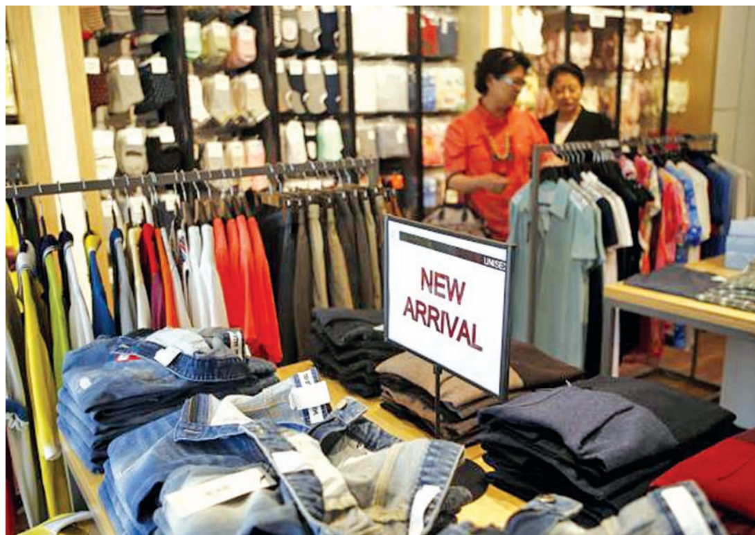
Women shop at a store selling goods from the inter-Korean Kaesong Industrial Complex in North Korea, in Seoul, South Korea, August 6, 2015. Picture taken on August 6, 2015.