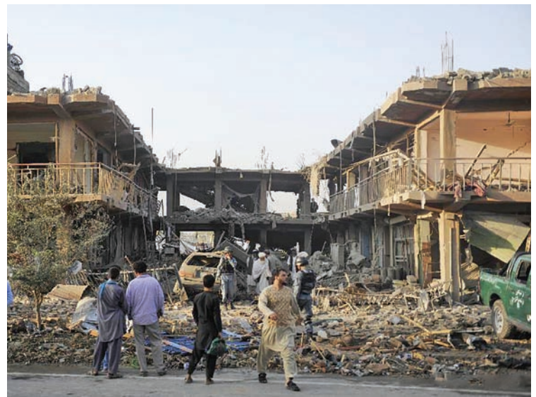
People gather at the site of a blast in Kabul, capital of Afghanistan, Aug. 7, 2015. At least eight civilians were killed while nearly 400 others wounded in a truck bomb attack in Afghan capital Kabul at wee hours of Friday, sources said.