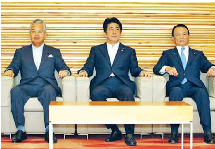
Akira Amari (L), Japan's minister in charge of Pacific free trade talks, Prime Minister Shinzo Abe (C) and Finance Minister Taro Aso attend a regular Cabinet meeting in Tokyo on Aug. 7, 2015. Aso told reporters later in the day that the Group of Seven finance ministers' meeting planned in the Japanese city of Sendai in 2016 will be held on May 20 and 21.