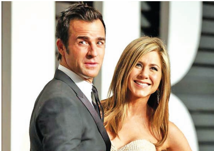
Actress Jennifer Aniston and fiance Justin Theroux arrive at the 2015 Vanity Fair Oscar Party in Beverly Hills, California, in this file photo taken February 22, 2015.

LOS ANGELES, 7 Aug — Former “Friends” star Jennifer Aniston has married her longtime boyfriend Justin Theroux at their Los Angeles-area home in a secret ceremony that took the media and many of the couple’s guests by surprise, celebrity media reported on Thursday.