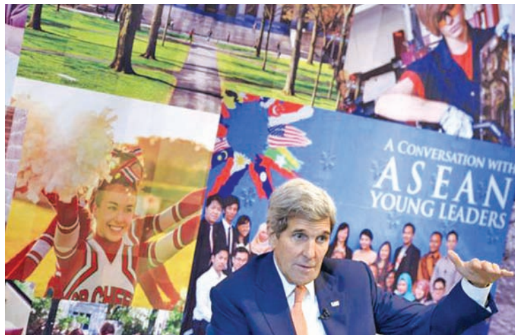
U.S. Secretary of State John Kerry talks about Fulbright University during an event at the American Center at the U.S. Embassy in Hanoi, Vietnam, August 7, 2015.

HANOI, 7 Aug — U.S. Secretary of State John Kerry on Friday lauded the warming of ties with former war enemy Vietnam but