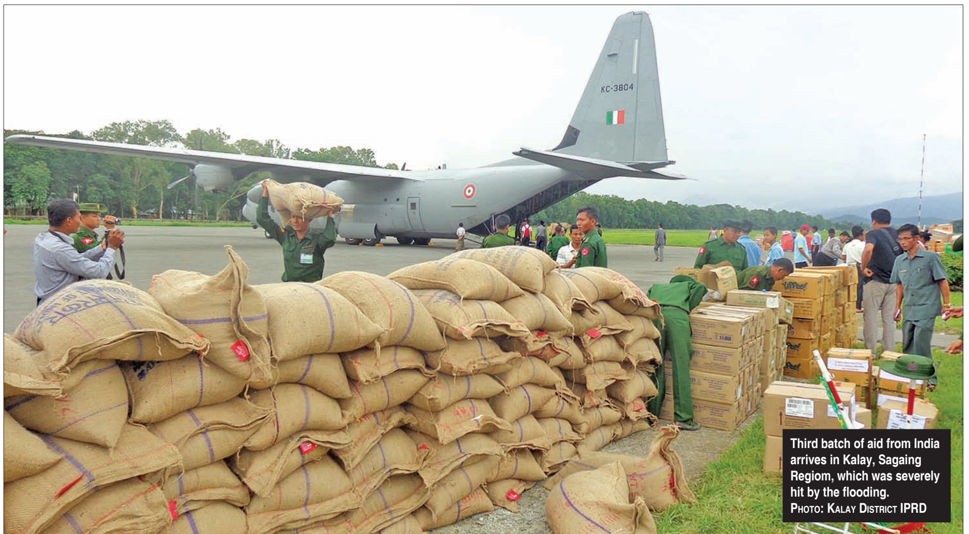
Third batch of aid from India arrives in Kalay, Sagaing Region, which was severely hit by the flooding.