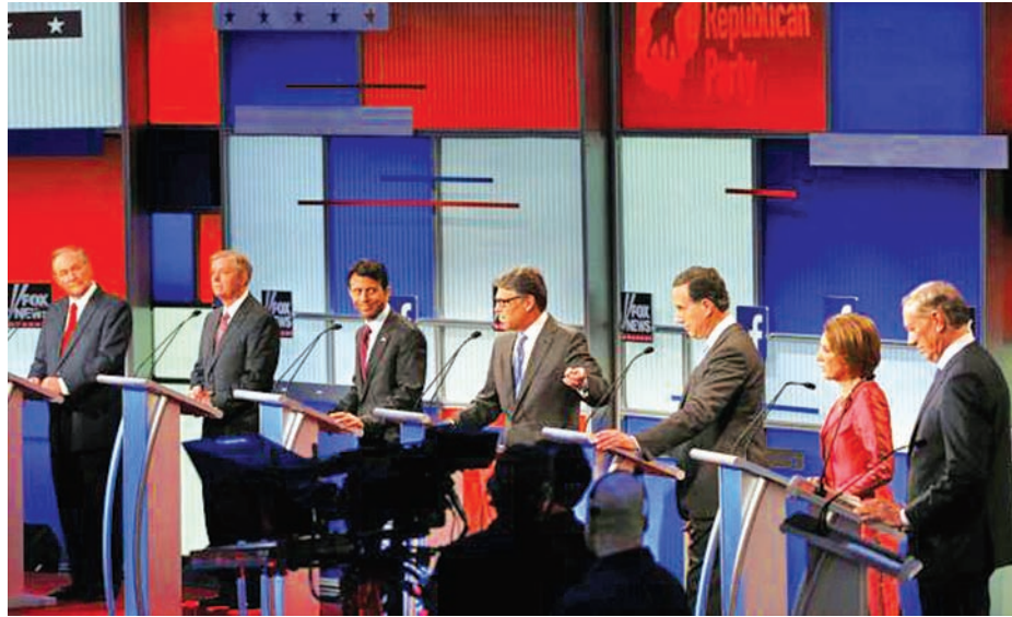
Republican presidential candidates (L-R), former Virginia Governor Jim Gilmore, U.S. Senator Lindsey Graham, Louisiana Governor Bobby Jindal, former Texas Governor Rick Perry, former U.S. Senator Rick Santorum, former HP CEO Carly Fiorina and former New York Governor George Pataki, debate at a Fox-sponsored forum for lower polling candidates held before the first official Republican presidential candidates debate of the 2016 U.S. presidential campaign in Cleveland, Ohio, August 6, 2015.

Perry, who has tangled with Trump over how to