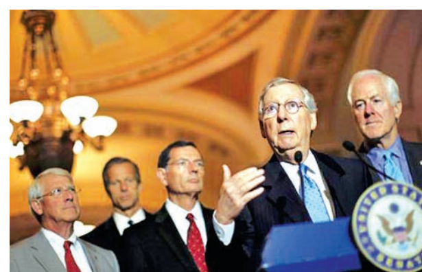
Senate Majority Leader Senator Mitch McConnell (R-KY) (C) speaks during a news conference accompanied by (L-R) Senator Roger Wicker (R-MS), Senator John Thune (R-SD), Senator John Barrasso (R-WY) and Senator John Cornyn (R-TX), following party policy lunch meeting at the U.S. Capitol in Washington August 4, 2015.

Obama urgently needs his fellow Democrats’ sup-