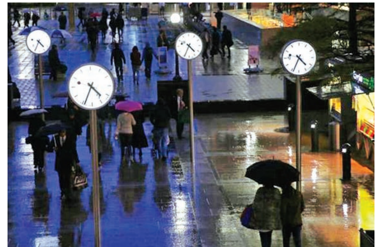
Workers walk in the rain at the Canary Wharf business district in London in this file photo taken on November 11, 2013.—REUTERS

“If construction companies don’t have the people they need, both infrastructure projects and housebuilding will be constrained, and this will have an impact on wider economic growth,” he said.—Reuters