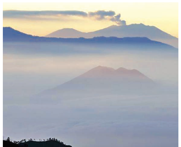
Mount Raung (top) spews ash into the air, as seen from Mount Bromo in Indonesia's East Java province, July 31, 2015.—REUTERS

"We have been advised that Mt Raung continues to erupt and winds are blowing in an unfavourable direction, and are forecast to continue to do so for the rest of the day," Virgin said in a statement, cancelling a dozen flights to and from Denpasar Airport.—Reuters