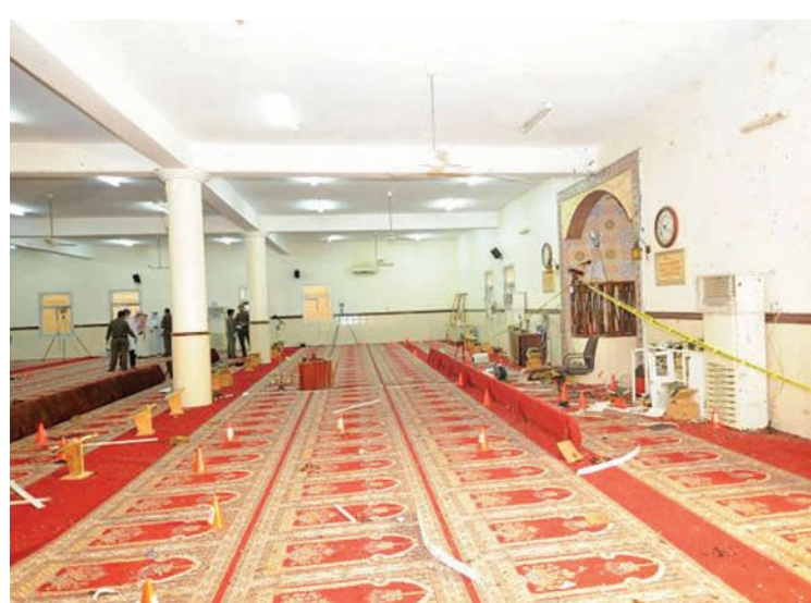
Damage inside a mosque used by members of a local security force is pictured in Abha, southwest Saudi Arabia August 6, 2015.

inside a training camp in Abha City in the Asir area where the force of the explosion led to the death and injury of dozens,” the statement, purporting to come from Islamic