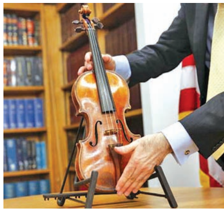
The Ames Stradivarius violin is placed for viewing during a news conference in New York August 6, 2015.

The Ames violin was stolen in 1980 after Totenberg delivered a performance in Cambridge, Massachusetts.