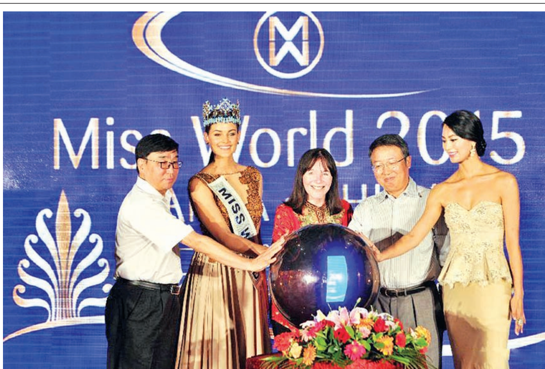
The guests launch the 65 th Miss World Final in Sanya, south China’s Hainan Province, Aug. 6, 2015. Miss World Organization announced at a press conference that the 65 th Miss World Final would be held on December 19 in Sanya.