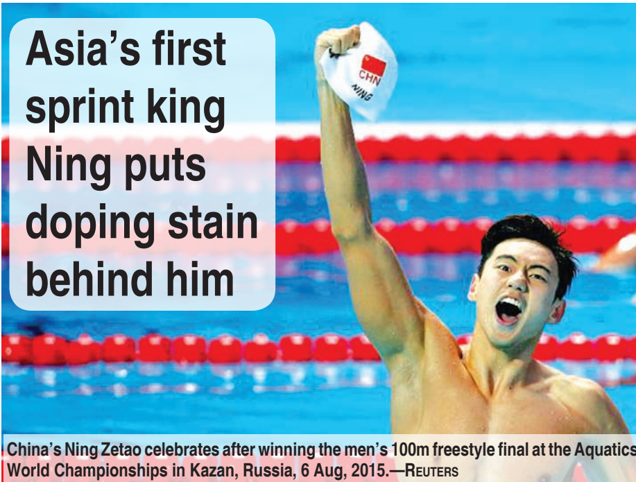
China's Ning Zetao celebrates after winning the men's 100m freestyle final at the Aquatics World Championships in Kazan, Russia, 6 Aug, 2015.

KAZAN, (Russia) 7 Aug — Ning Zetao's stunning 100 metres freestyle win at the world championships was an unexpected triumph for a swimmer determined to put a troubled past and the smear of a doping ban behind him.