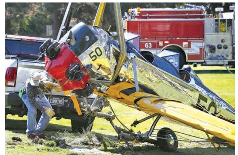
Actor Harrison Ford's damaged airplane is taken away after its crash landing at Penmar Golf Course in Venice, Los Angeles California March 6, 2015.