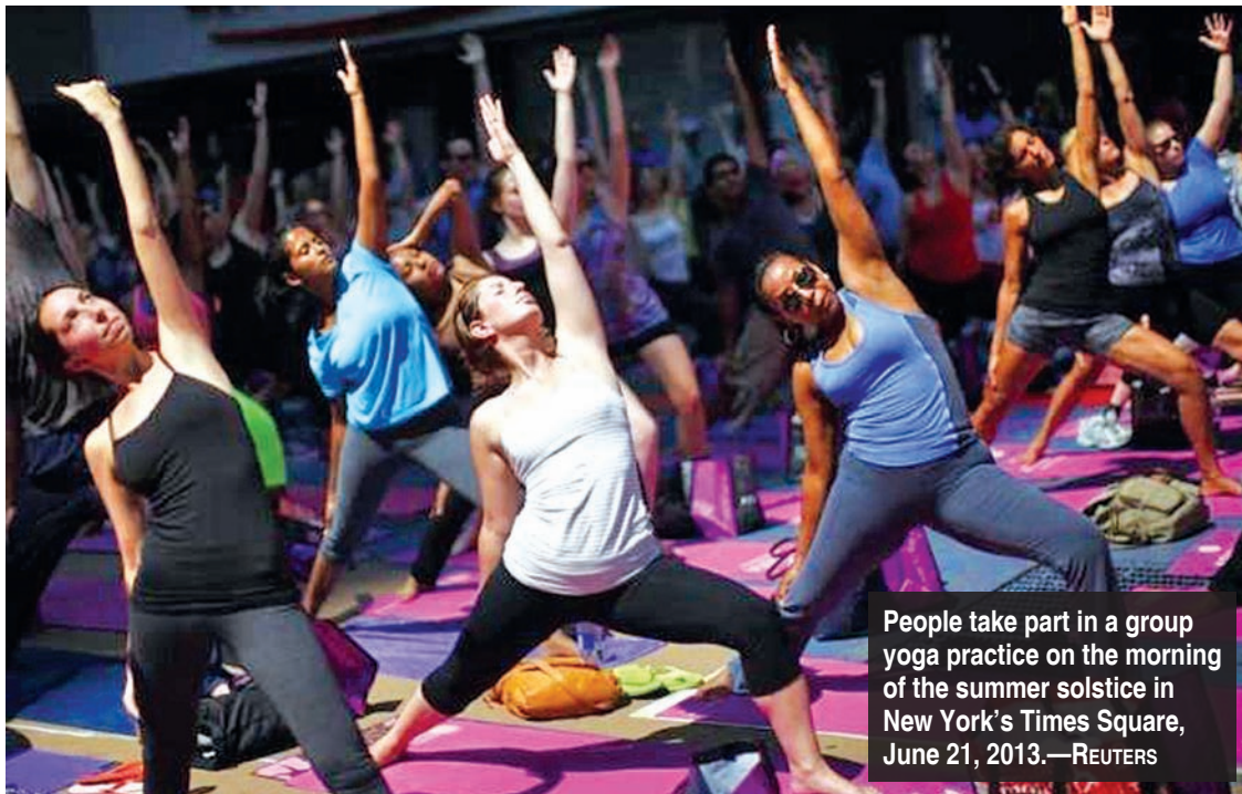
People take part in a group yoga practice on the morning of the summer solstice in New York's Times Square, June 21, 2013.