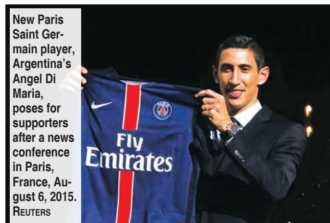
New Paris Saint Germain player, Argentina's Angel Di Maria, poses for supporters after a news conference in Paris, France, August 6, 2015.

PARIS, 7 Aug — Angel Di Maria apologised to Manchester United fans for his underwhelming stint at Old Trafford but insisted it was not due to a lack of effort.