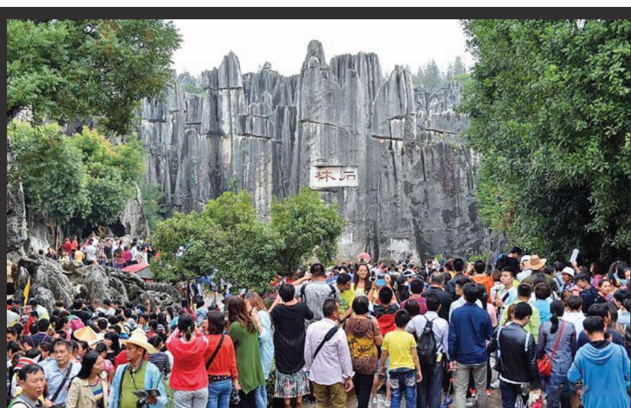
Tourists visit Shilin (The Stone Forest), in Shilin county, southwest China's Yunnan Province, Aug. 6, 2015.