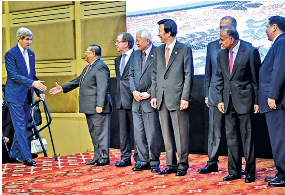
Myanmar's Foreign Minister U Wunna Maung Lwin (2nd L) greets US Secretary of State John Kerry (L) for a group photo during the 5th East Asia Summit Foreign Ministers Meeting August 6, 2015 in Kuala Lumpur, Malaysia.

China claims most of the waterway, through which $5 trillion in ship-borne