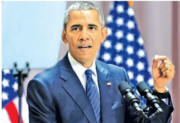
U.S. President Barack Obama delivers remarks on a nuclear deal with Iran at American University in Washington 5 Aug, 2015.

pressured Congress to support the deal as they return home for an August recess. To counter an opposition effort that has spent millions on advertisements, Obama asked the audience to contact their representatives and ask them to support the pact. Congress has until Sept. 17 to vote on the deal. If it passes and survives a presidential veto, a resolution rejecting it would cripple the agreement by eliminating Obama's ability to waive many sanctions.