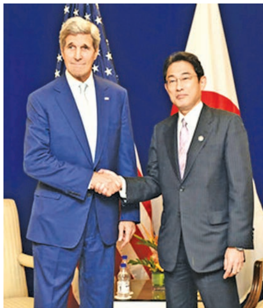
U.S. Secretary of State John Kerry (L) and Japanese Foreign Minister Fumio Kishida shake hands before their talks in Kuala Lumpur on Aug. 6, 2015, on the sidelines of a series of regional meetings in the Malaysian capital involving the 10-member Association of Southeast Asian Nations and its dialogue partners.