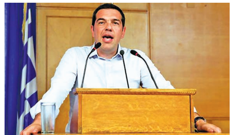
Prime Minister Alexis Tsipras

"We will not accept new prior actions (reform conditions in place) in order to have a small bridge