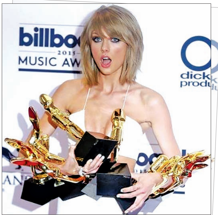
Singer Taylor Swift poses backstage with her awards for Top Artist, Billboard Chart Achievement Award, Top Female Artist, Top Hot 100 Artist, Top Digital Songs Artist, Top Streaming Song (Video) for "Shake it Off" and Top Billboard 200 Album for "1989" during the 2015 Billboard Music Awards in Las Vegas, Nevada May 17, 2015.