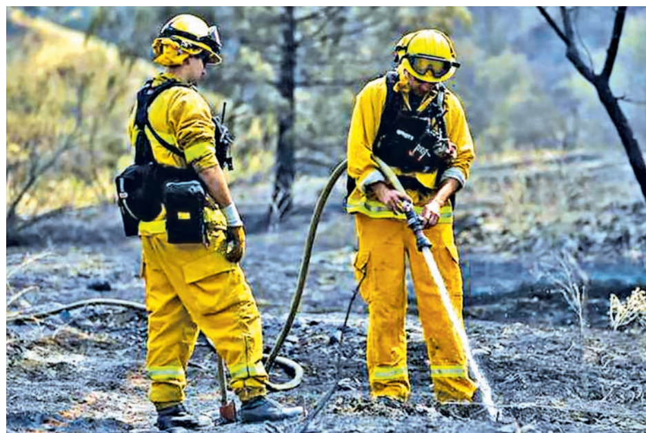
Firefighters from the Sonoma Valley Fire & Rescue Authority mop up a hotspot during the Rocky Fire near Clearlake, California August 5, 2015.

CLEARLAKE, (California), 6 Aug — The tally of property losses from California's largest and most destructive wildfire this year nearly doubled on Wednesday as the week-old blaze raged through dry scrubland north of Napa Valley wine country.