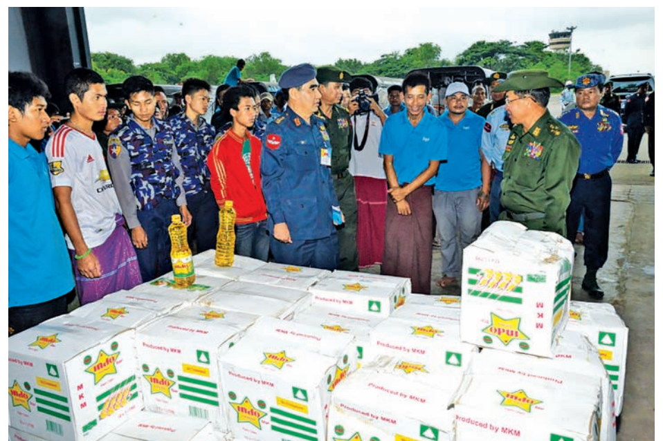
Senior General Min Aung Hlaing meets volunteers at Mingaladon Airbase.

In Ayeyawady Region, about 170 relief camps have been set up for 34,257 victims.—Myawady