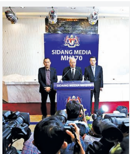
Malaysia's Prime Minister Najib Razak (C) with Minister for Transport Liow Tiong Lai (R) confirms the debris found on Reunion Island is from missing Malaysia Airlines flight MH370 in Kuala Lumpur, Malaysia, August 6, 2015.

KUALA LUMPUR, 6 Aug — A piece of plane wreckage, believed to be part of a wing, found on Reunion Island off the east coast of Africa, is from Malaysia Airline flight MH370 that went missing over a year ago, Malaysian Prime Minister Najib Abdul Razak said Thursday.