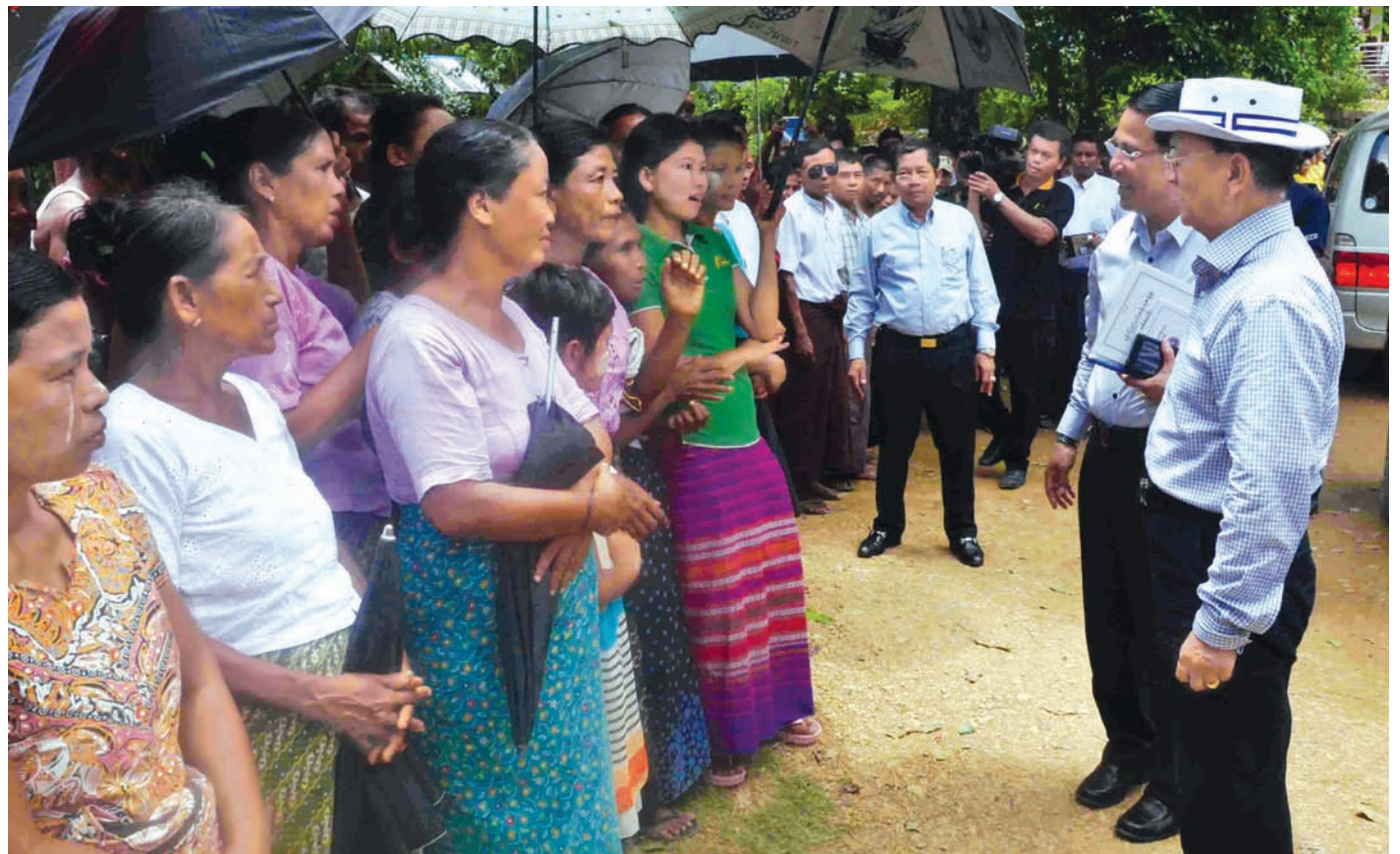
President U Thein Sein meets flood victims in MraukU.