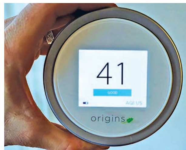
Laser egg showing air pollution levels using the US air quality index.

BEIJING, 6 Aug — Japanese distillery Suntory is sending variety of whisky samples to the International Space Station for getting a flavor liftoff, according to media reports Wednesday.