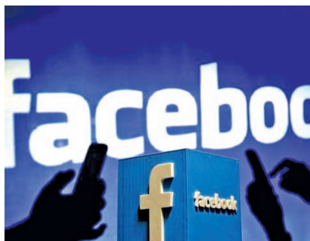
A 3D plastic representation of the Facebook logo is seen in this illustration in Zenica, Bosnia and Herzegovina, May 13, 2015.—REUTERS

Facebook hosts more than 40 million active small and medium business pages, it said, with more than 1 billion page visits each month.—Reuters