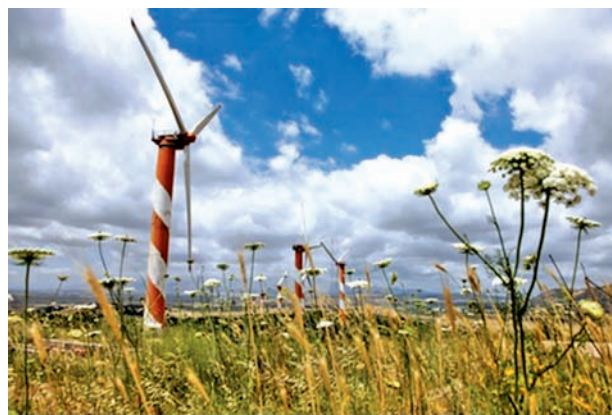
Wind turbines in the Golan Heights.

"The more power we need to generate, the larger a place we need to store our gas, and there are many ways to do this. We can run our power back to a hydrogen-oxygen battery or through a generator. It's faster in and faster out."