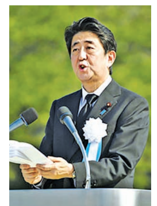
Japanese Prime Minister Shinzo Abe addresses a memorial ceremony in Hiroshima on Aug. 6, 2015, the 70th anniversary of the U.S. atomic bombing of the city. Abe did not touch on the ongoing defense policy shift that has drawn criticism from A-bomb survivors as eroding Japan's pacifism.

From the early morning, atomic bomb survivors and other citizens visited the park near the