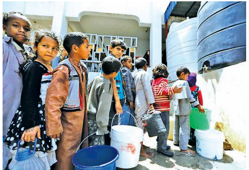
Children queue for water at a school in Yemen's capital Sanaa sheltering them and their families after the conflict forced them to flee their areas from the Houthi-controlled northern province of Saada August 4, 2015.

Southern forces loyal to the exiled government have been on the defensive in four months of fighting and bombing that have