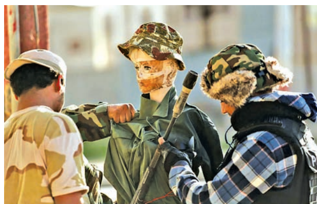
Pro-government Libyan forces, who are backed by locals, arrange a mannequin as a decoy against snipers during clashes in the streets with the Shura Council of Libyan Revolutionaries, an alliance of former anti-Gaddafi rebels, who have joined forces with the Islamist group Ansar al-Sharia, in Benghazi in this December 28, 2014 file photo.