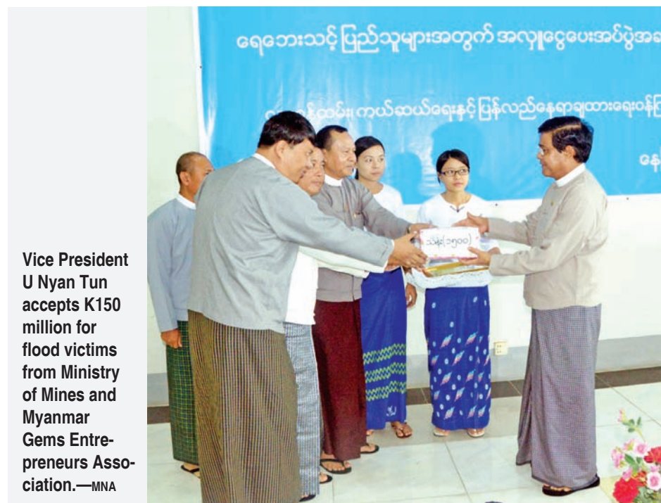
Vice President U Nyan Tun accepts K150 million for flood victims from Ministry of Mines and Myanmar Gems Entrepreneurs Association.

NAY PYI TAW, 6 Aug — Vice President U Nyan Tun received an international delegation of disaster management specialists Thursday at the emergency operation centre of the Ministry of Social Welfare, Relief and Resettlement.