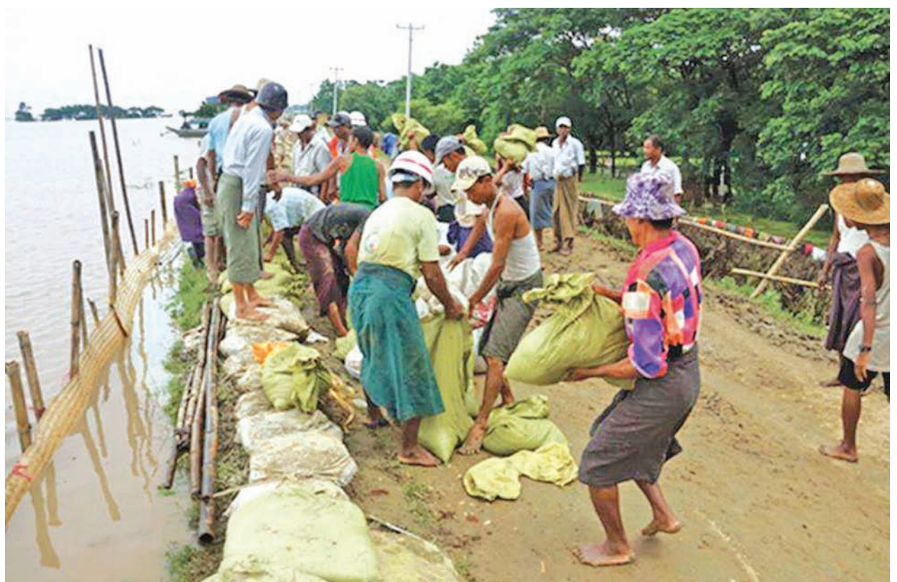
Volunteers lay sandbags on the bank of the Ayeyawady River in Myanaung to hold back rising waters.

In his speech, the president warned of flooding in Hinthada and Nyaungdon in Ayeyawady Region, urging residents to move to shelters as the Ngawun and Ayeyawady rivers had exceeded their designated danger levels.