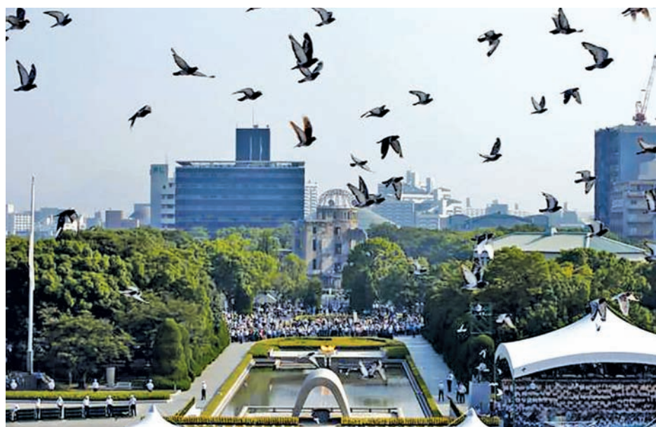
Doves fly over Peace Memorial Park with Atomic Bomb Dome in the background, at a ceremony in Hiroshima, western Japan, August 6, 2015, on the 70th anniversary of the atomic bombing of the city.

hypocenter to mourn the people who perished in the bombing and hope for peace.