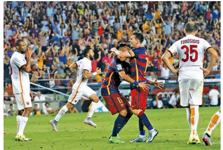
Barcelona's Lionel Messi and Neymar (L) celebrate a goal against AS Roma during a friendly match at Camp Nou stadium in Barcelona, Spain, August 5, 2015.—REUTERS

Following the clash with Sevilla, Barca play Athletic Bilbao home and away in the Spanish Super Cup before they meet Bilbao in their first La Liga game on Aug. 23.—Reuters