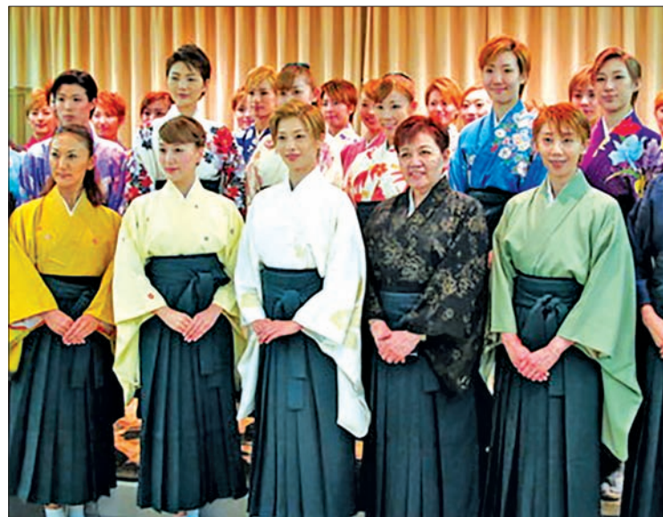
Members of the Flower Troupe of the Japanese all-woman Takarazuka Revue pose for a photo in Taipei on Aug. 5, 2015. The troupe will stage a total of 14 shows from Aug. 8 to 16 at the National Theater in Taipei.