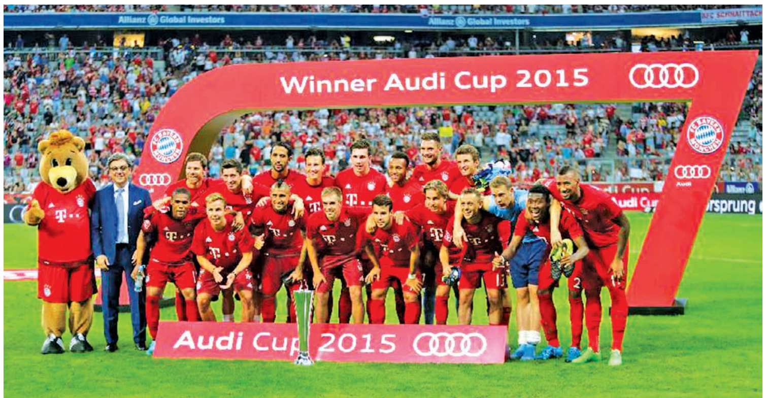
Bayern Munich's players pose with the trophy after winning the Audi Cup 2015 final between Bayern Munich and Real Madrid in Munich, Germany, on Aug. 5, 2015. Bayern Munich claimed the title with 1-0.

As the match progressed, the "Bavarians" pressed Real Madrid into the defence to open the