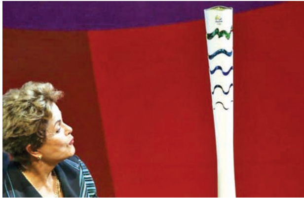
Brazil's President Dilma Rousseff looks at an Olympic Torch model during a ceremony where the Rio Organizing Committee presented the torch and relay route for the Rio 2016 Games in Brasilia, Brazil, July 3, 2015.

KUALA LUMPUR, 1 Aug — The Rio de Janeiro Olympics torch will be lit in Greece's ancient Olympia on April 21 next year before leaving for the South American country 12 days later, organizers said on Saturday.