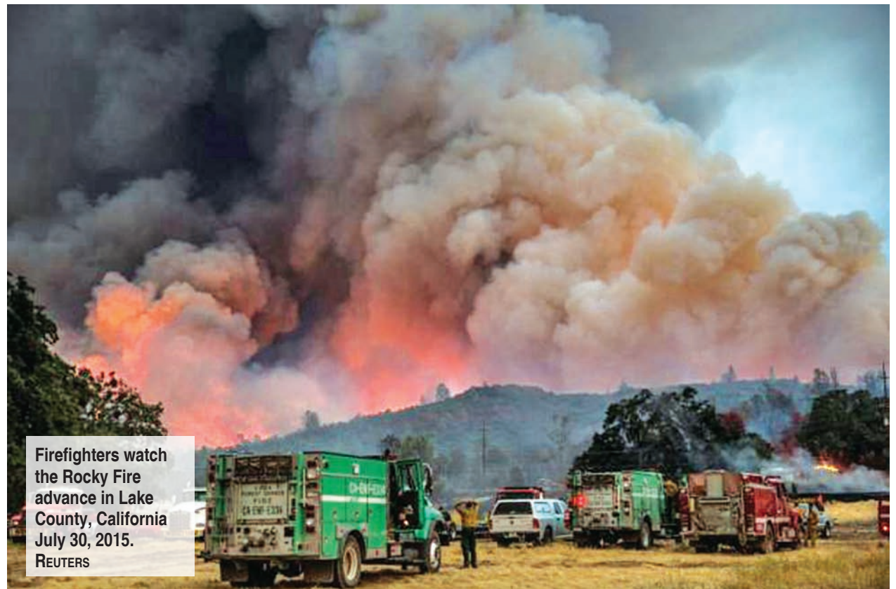
Firefighters watch the Rocky Fire advance in Lake County, California July 30, 2015.

The Labor Department records don't specify the nationality of the foreign workers sought by companies. But Trump could be bringing many Mexican workers into the United States.—Reuters