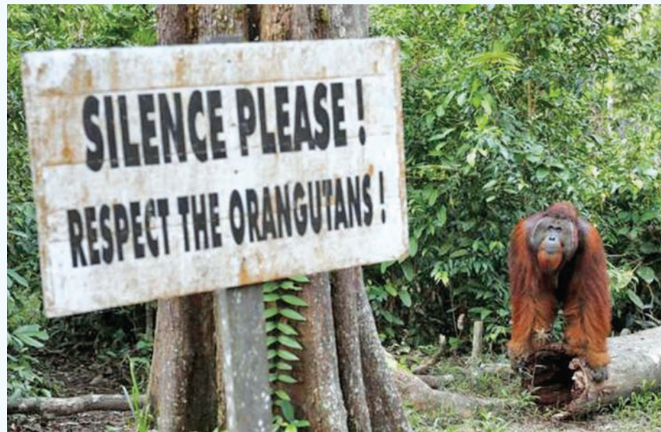
A male orangutan waits near a feeding station at Camp Leakey in Tanjung Puting National Park in Central Kalimantan province, Indonesia in this June 15, 2015 file photo.

Protecting the forest habitat of the orangutan has become as important as rescuing the great apes if the species is to survive, says Galdikas, who came to the Tanjung forest when she was 25 years old and has spent 44 years trekking through forests and wading