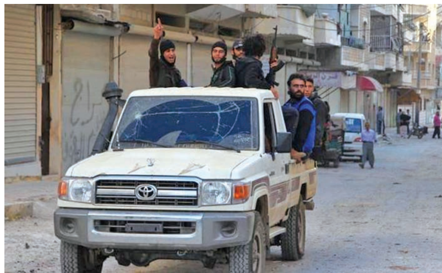
Members of al Qaeda's Nusra Front gesture as they travel through the town of Ariha, after a coalition of insurgent groups seized the area in Idlib province May 29, 2015.