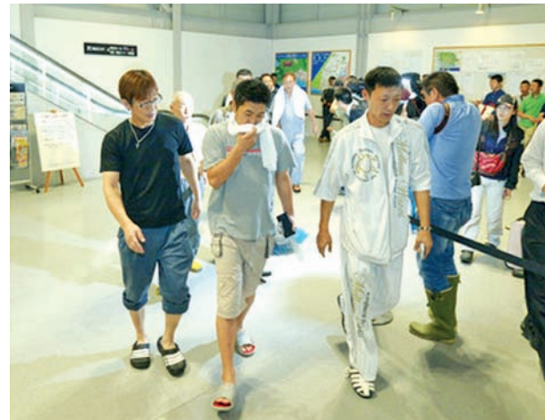
Passengers of a car ferry arrive at the ferry terminal of Tomakomai port after the 11,400-ton Sunflower Daisetsu caught fire off Japan's northernmost main island of Hokkaido on July 31, 2015.

The accident prompted the transport ministry to initiate an extraordinary audit of MOL Ferry's offices. The Transport Safety Board decided to send five accident investigators on Saturday.