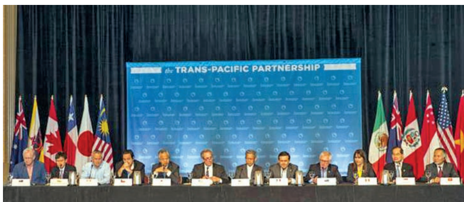
The twelve Trans-Pacific Partnership (TPP) Ministers hold a press conference to discuss progress in the negotiations in Lahaina, Maui, Hawaii July 31, 2015.

“The undergrowth has been cleared away in a manner that I would say is streets ahead of any of the other ministerial meetings that we have had,” New Zealand Trade Minister