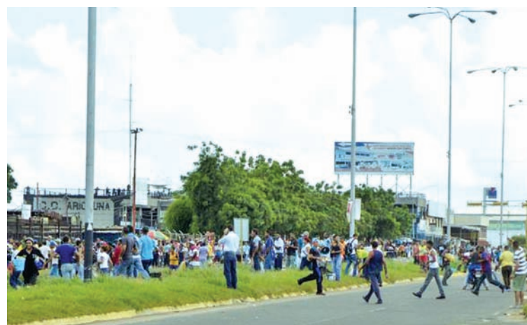
People carry goods looted from a supermarket in San Felix in the state of Bolivar, Venezuela July 31, 2015.