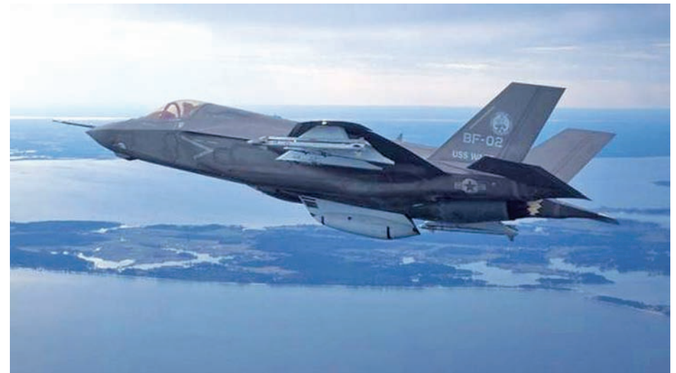
The U.S. Marine Corps version of Lockheed Martin’s F35 Joint Strike Fighter, F-35B test aircraft BF-2 flies with external weapons for the first time over the Atlantic test range at Patuxent River Naval Air Systems Command in Maryland in a February 22, 2012 file photo.

The meeting at the Japanese Foreign Ministry in Tokyo came after an Iranian nuclear deal was reached this month between Tehran and six major powers including the United States. The accord