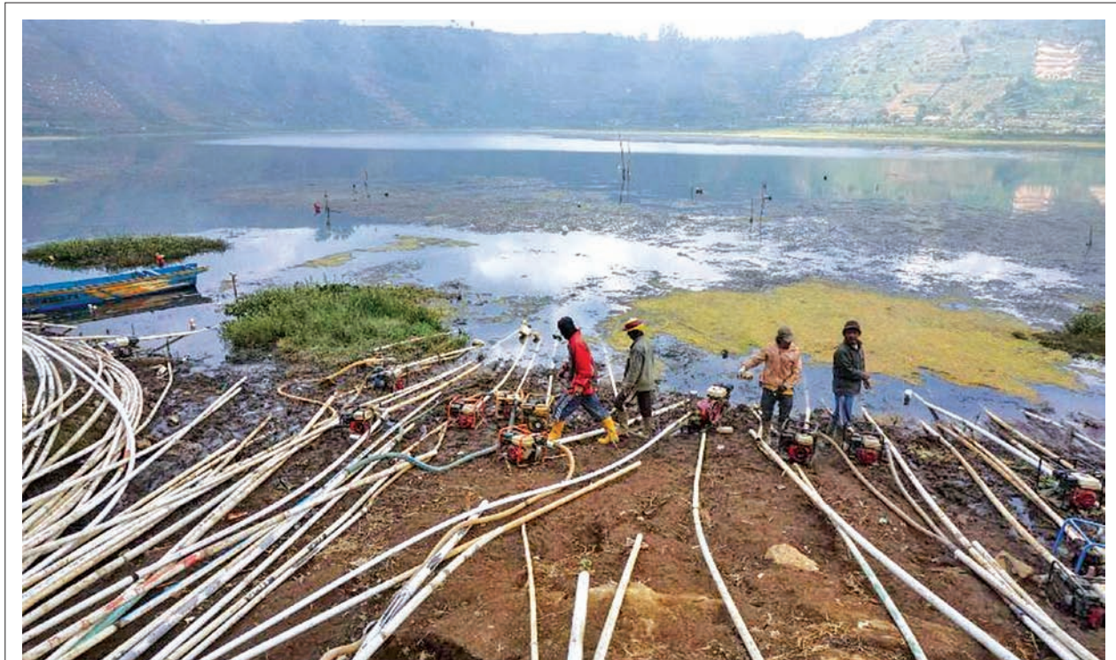
People set water pumps to irrigate their field from Lake Merdada during dry season in Banjarnegara, Indonesia, July 31, 2015. The Meteorology, Climatology and Geophysics Agency (BMKG) predicted on Thursday that the intensity of El Nino could strengthen in the next four months and is likely to give rise to a prolonged dry season.