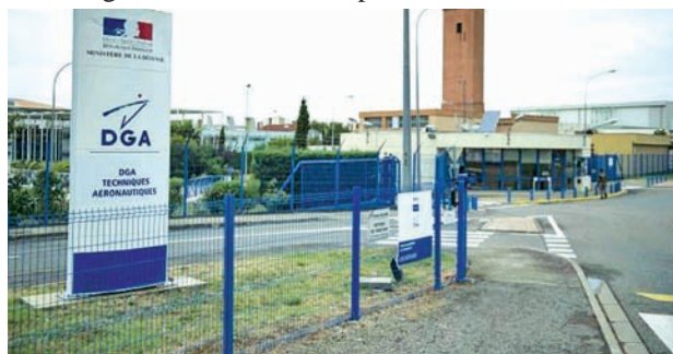
A view shows the Direction generale de l'armement (DGA) offices, where the France's BEA crash investigation agency will verify the plane debris found on Reunion Island, in Balma near Toulouse, France, July 30, 2015.

A fragment of luggage that was also found in the area is being flown into France with the aircraft debris and will be sent to a unit outside Paris that specialises in DNA tests.