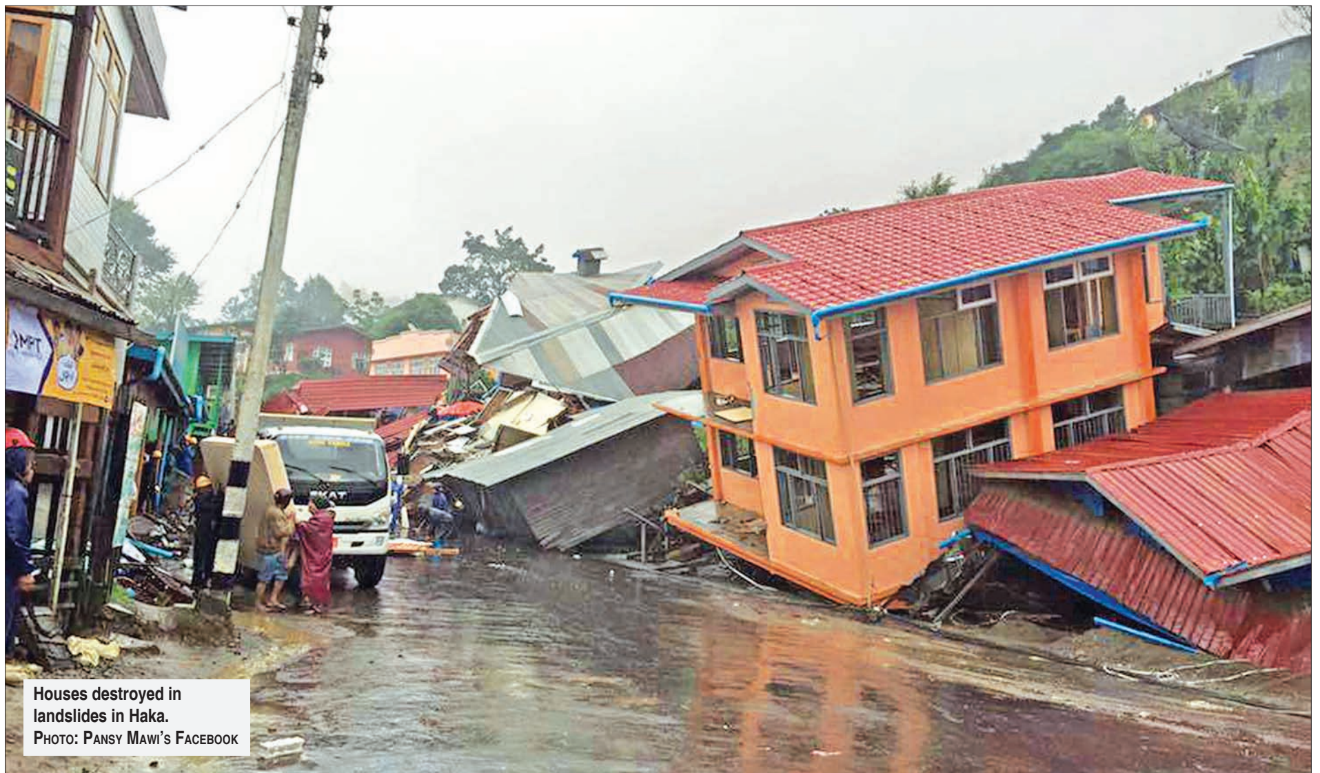
Houses destroyed in landslides in Haka.