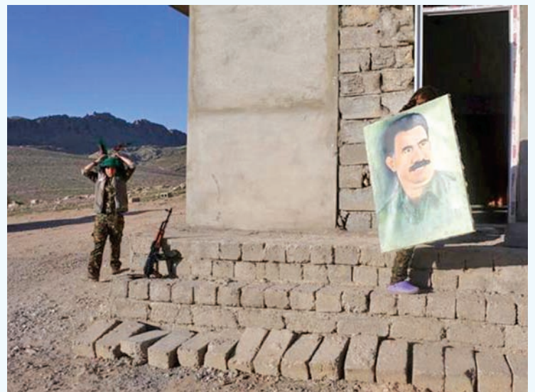
A female Kurdistan Workers Party (PKK) fighter adjusts her scarf while another carries a picture of jailed Kurdish militant leader Abdullah Ocalan at their base in Sinjar March 11, 2015.