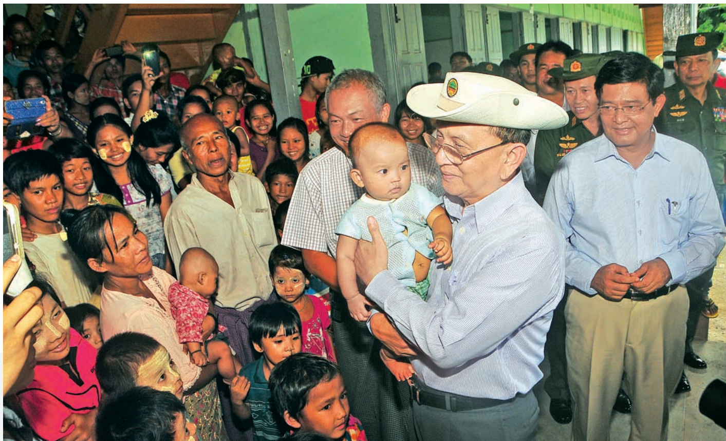
President U Thein Sein cordially meets flood victims at relief camp opened at Kalay Basic Education High School No 3.