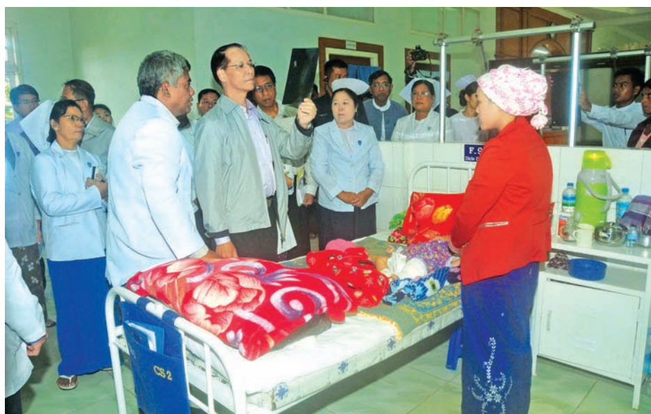
Vice President Dr Sai Mauk Kham meets patients at maternity ward of PyinOoLwin People's Hospital.

NAY PYI TAW, 1 Aug — Vice President Dr Sai Mauk Kham visited hospitals in Mandalay and Sagaing Region on Saturday to discuss improvements to