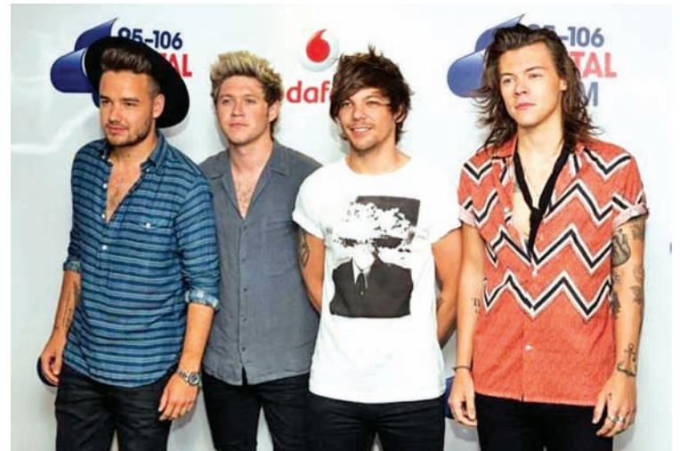
Members of the pop group One Direction pose for photographers at the Capital Summertime Ball at Wembley Stadium in London, Britain June 06, 2015.

LONDON, 1 Aug — Best-selling boy band One Direction released a surprise first single as a foursome on Friday, two days after former member Zayn Malik announced a new record deal as solo artist.