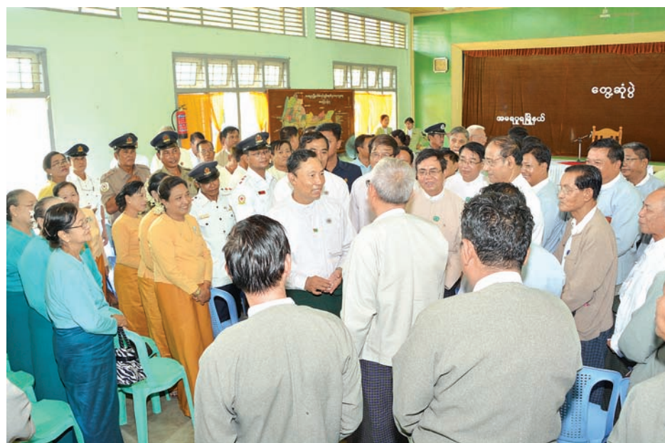
Speaker Thura U Shwe Mann meets local residents in Amarapura Township.—MNA

Prevention of flood, rescue programme and providing supplies to victims were the main topic of discussion at the meeting.—MNA