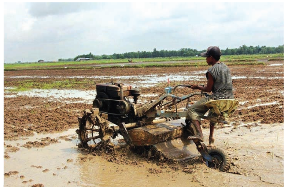
A farmer works in a field with a power tiller. Some 500,000 acres of farmland were affected in recent flooding.