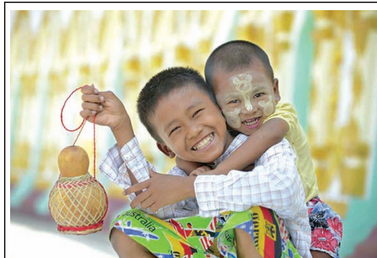
UNICEF Myanmar is urging political parties to put children at the forefront of their policies, saying more than a quarter of people recently polled rated national development as their major concern for the upcoming general election.