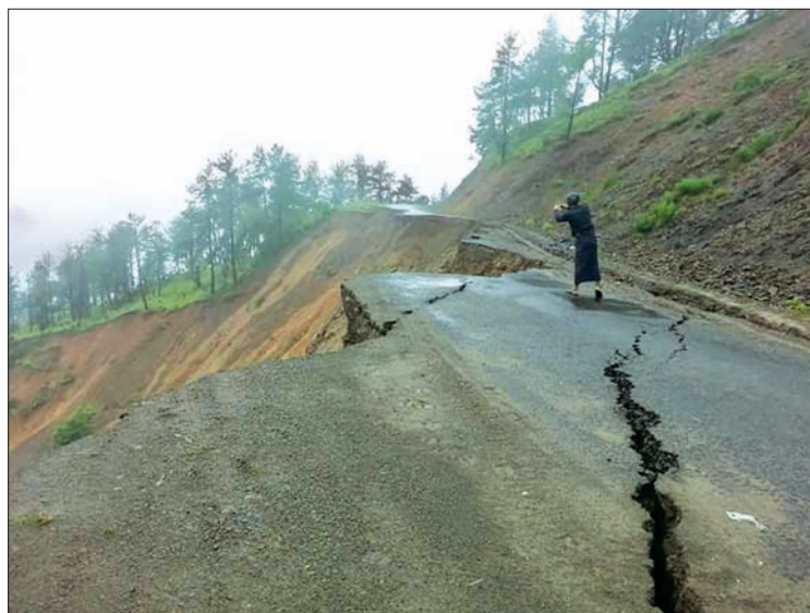
Landslides occurred on the Haka-Gangaw Road.