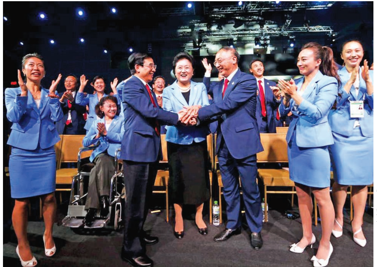
(Centre L to R) Beijing’s Mayor and President of the Beijing 2022 delegation Wang Anshun, China’s Vice-Premier of State Council and Head of the Beijing 2022 delegation Liu Yandong, and President of the Olympic Committee Liu Peng celebrate after Beijing was awarded the 2022 Winter Olympic Games, defeating Almaty in the final round of voting, during the 128 th IOC session in Kuala Lumpur, Malaysia, July 31, 2015.

“Some of them are just following the voices of