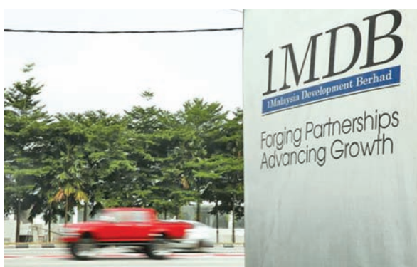
Traffic passes a 1Malaysia Development Berhad (1MDB) billboard at the Tun Razak Exchange development in Kuala Lumpur, Malaysia, July 6, 2015.