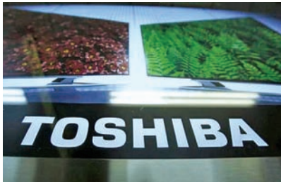
A logo of Toshiba Corp is seen next to an advertisement board for its Regza television in Tokyo, Japan, June 25, 2015.

TOKYO, 1 Aug — The Japanese affiliate of Ernst & Young LLC has launched an in-house investigation into its audit of Toshiba Corp (6502.T) in the wake of the electronics maker's $1.2 billion accounting scandal, a person with knowledge of the matter said.