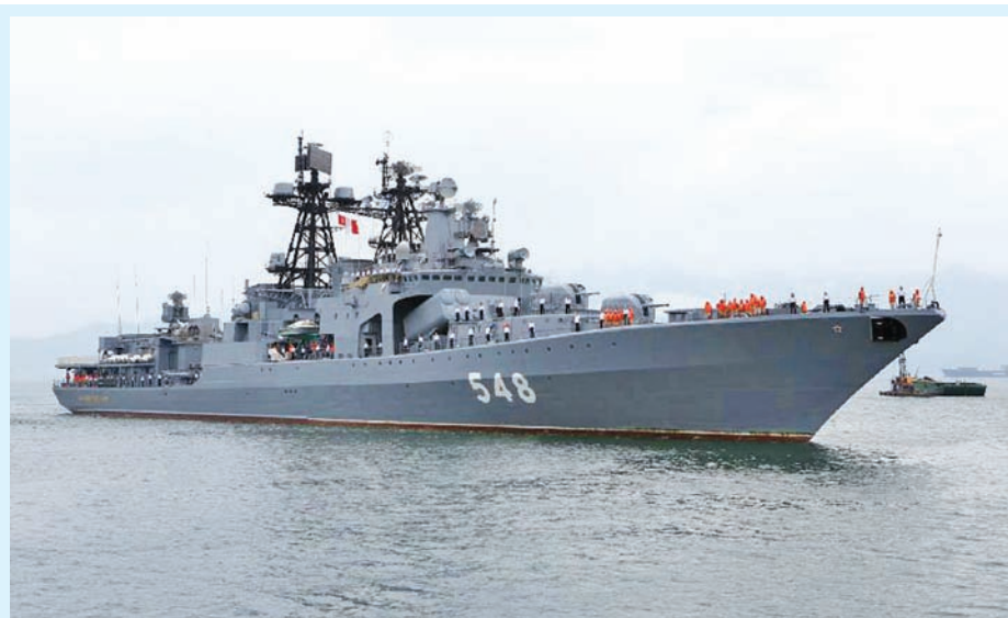
Photo taken on July 31, 2015 shows the anti-submarine ship "Admiral Panteleyev" of the Pacific Fleet of the Russian Navy anchoring at Tien Sa port in Vietnam's central Da Nang city. Ships of the Pacific Fleet of the Russian Navy, including anti-submarine ship "Admiral Panteleyev", the tanker "Pechenga" and the tug "SB-522", anchored at Tien Sa port in Vietnam's central Da Nang city on Friday.

In its defense, the institute said the donations were legal and widely known, as the company had publicly declared their donations to the institute in the past.