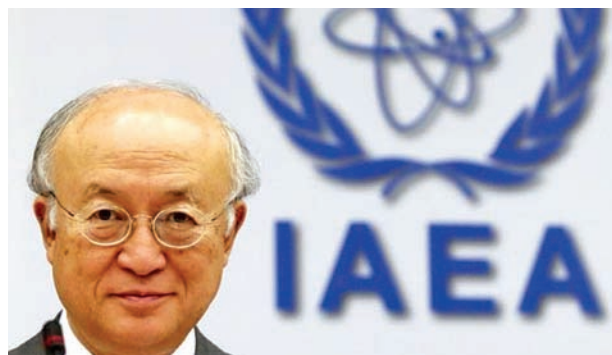
International Atomic Energy Agency (IAEA) Director General Yukiya Amano

normal practice for it not to publish safeguards arrangements with countries and that Iran is no exception, adding that the arrangement it reached with Iran on July 14 meets its requirements to clarify outstanding issues.