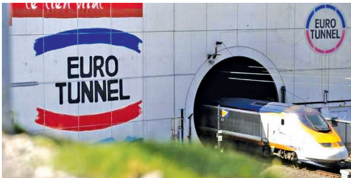
A high-speed Eurostar train enters the Channel tunnel in Coquelles, near Calais, northern France on 24 June, 2015.