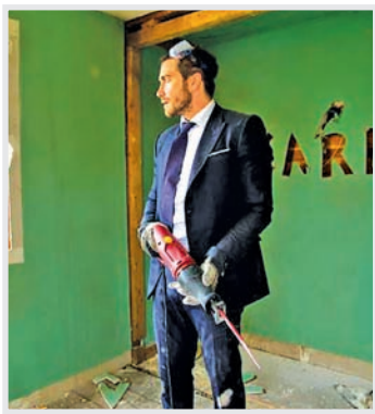
Jake Gyllenhaal in a scene from "Demolition".

TORONTO, 29 July — The Toronto International Film Festival will kick off its 40 th year with the world premiere of Canadian director Jean-Marc Vallée's "Demolition", starring Jake Gyllenhaal and Naomi Watts, organizers said on Tuesday.