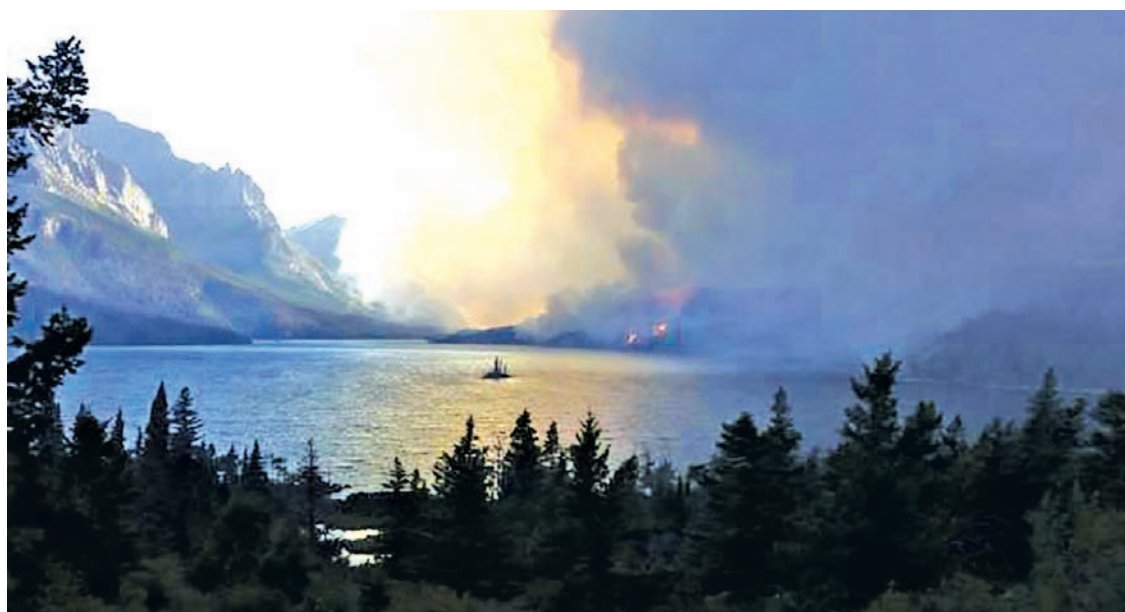
Smoke plumes are seen along St. Mary’s Lake from the Reynolds Fire in Glacier National Park in Montana in this photo taken on 21 July, 2015 and released to Reuters 27 July, 2015.

A 6,591-acre fire, dubbed the Wragg Fire, burning near Lake Berryessa outside of San Francisco prompted mandatory evacuations for some 200 residents on Tuesday afternoon after flames jumped across a containment line, CalFire said. Several nearby roads were also closed. To the south, a 1,739-acre fire forced the evacuation of campgrounds in the Sier-