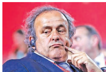
UEFA President Michel Platini

South Korea's Chung Mong-joon, a former FIFA