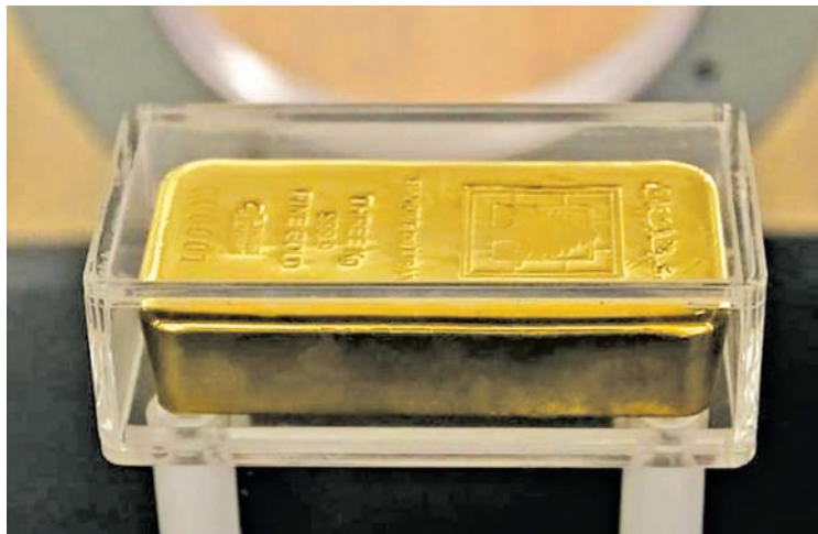
A gold bar is displayed at the currency museum of Lebanon's Central Bank in Beirut on 6 Nov, 2014.

MANILA, 29 July — Gold steadied at just below $1,100 an ounce on Wednesday, trading not far from a 5-1/2-year low, as investors awaited the outcome of the US Federal Reserve's meeting for more clues on the timing of this year's interest rate increase.