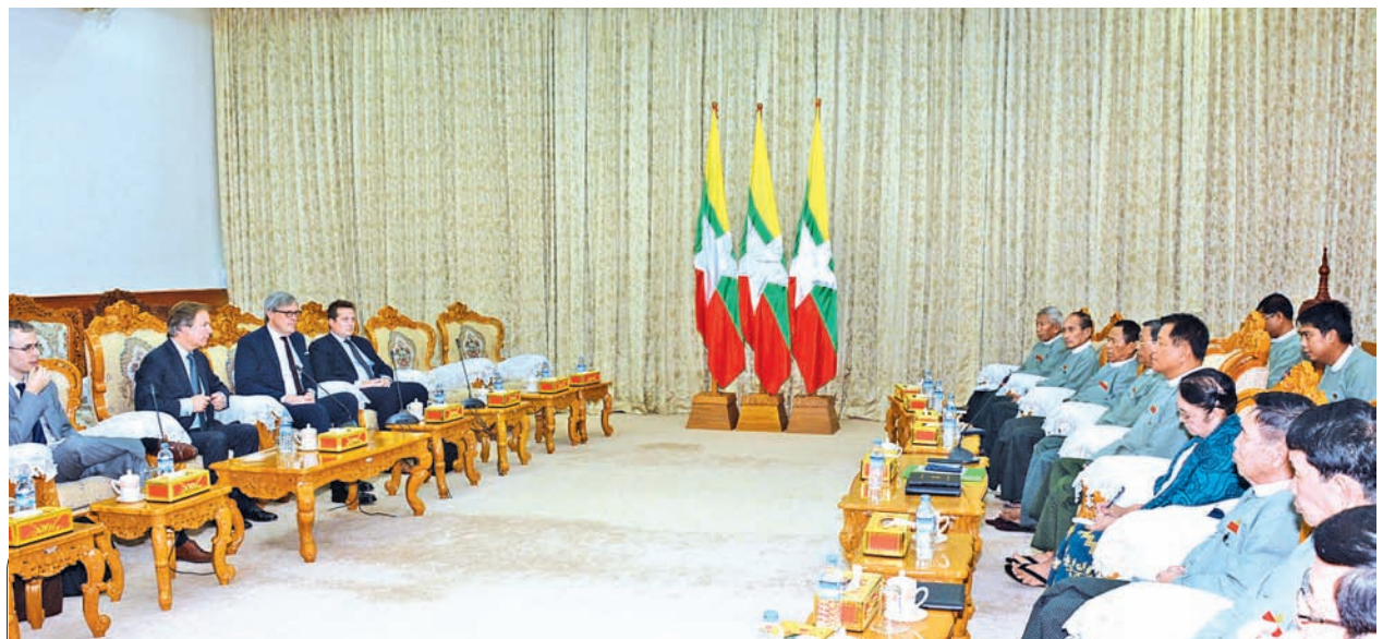
UEC Chairman U Tin Aye receives Minister of State for Foreign and Commonwealth Affairs Mr Hugo Swire and party of United Kingdom.—MNA

U Tin Aye explained voter education programmes were being launched through media, that election monitoring groups would be allowed at voting stations, and military members would cast votes at their bases, except advanced voters. The chairman said the Ministry of Home Affairs was preparing security measures for the election.—MNA