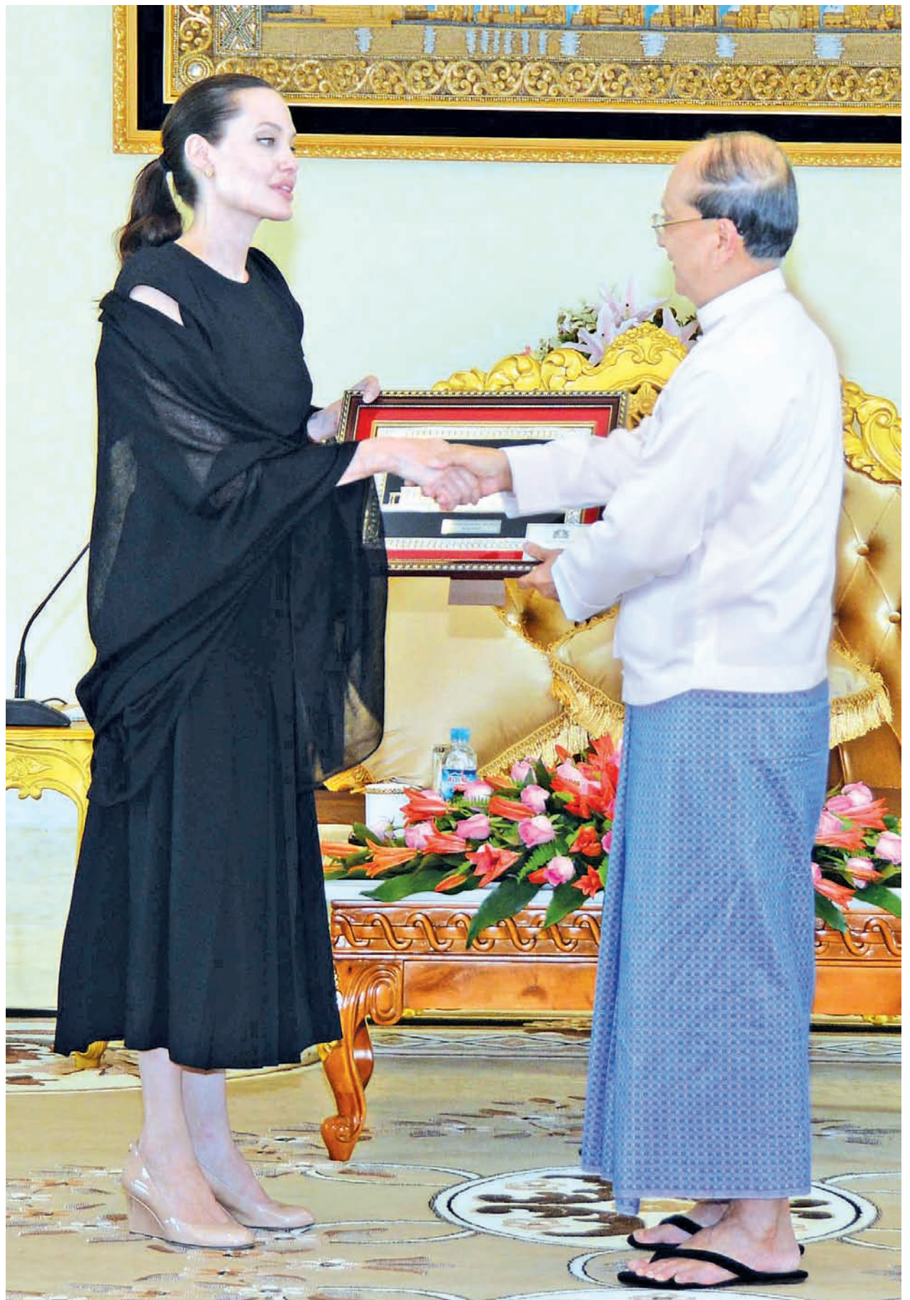
President U Thein Sein welcomes United Nations' goodwill ambassador Angelina Jolie.