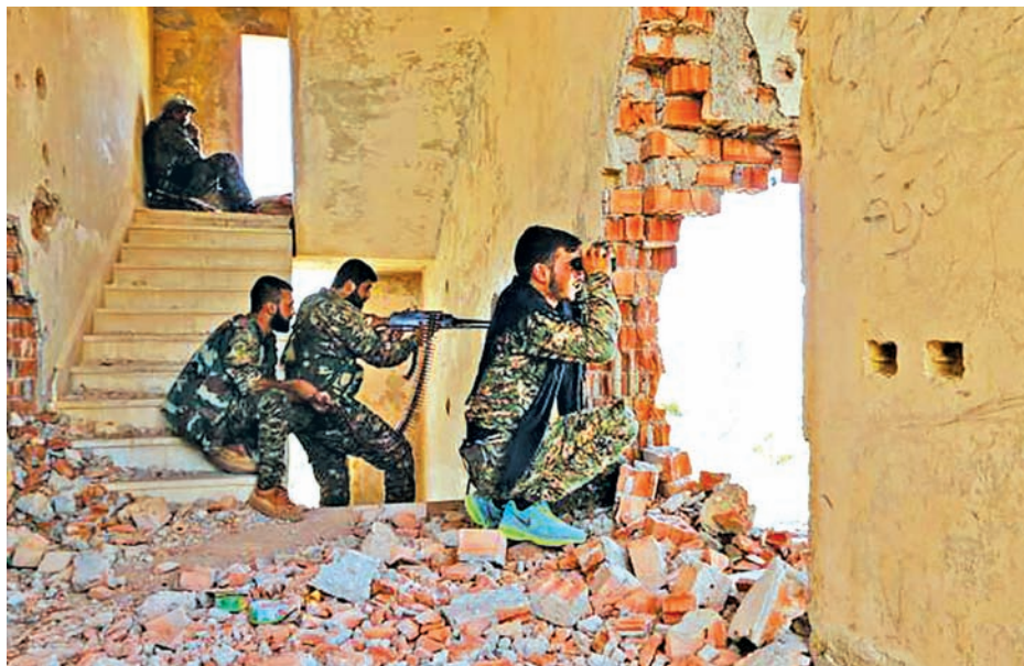
Kurdish People's Protection Units (YPG) fighters take up positions inside a damaged building in al-Vilat al-Homor neighbourhood in Hasaka city, as they monitor the movements of Islamic State fighters who are stationed in Ghwayran neighbourhood in Hasaka city, Syria on 22 July, 2015.

But planning appears to be just getting under way and resolving crucial details, like which opposition groups will be supported on the ground, could stoke longstanding tensions between the United