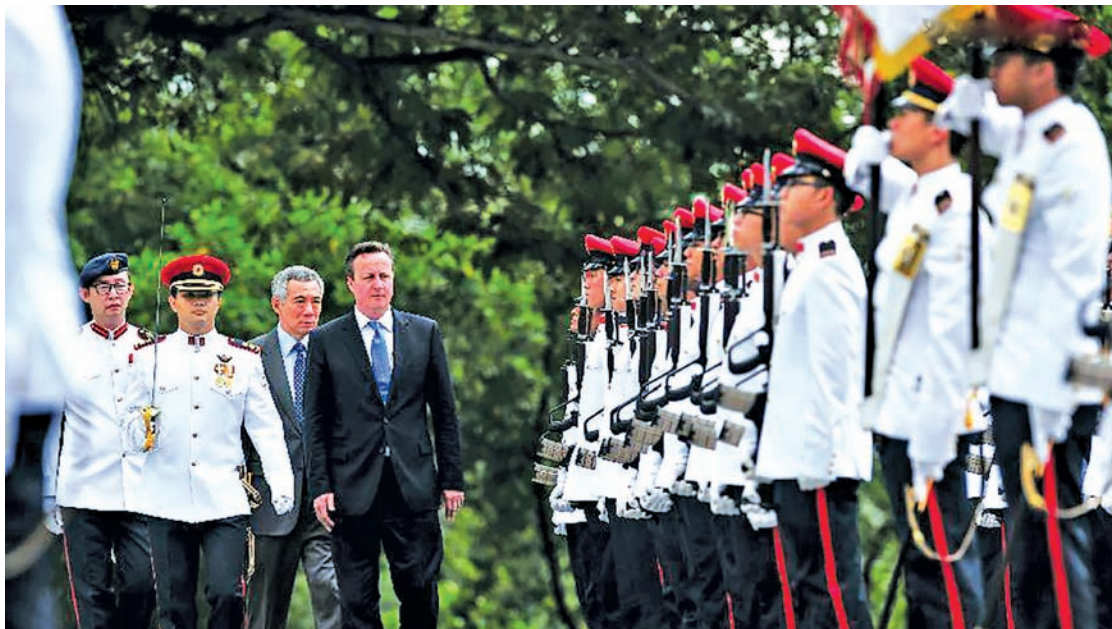
Singapore's Prime Minister Lee Hsien Loong (3 rd L) and British Prime Minister David Cameron (4 th L) inspect the guard of honor during a welcoming ceremony at the Istana in Singapore, on 29 July, 2015. David Cameron is on the second day of a two-day official visit to Singapore.