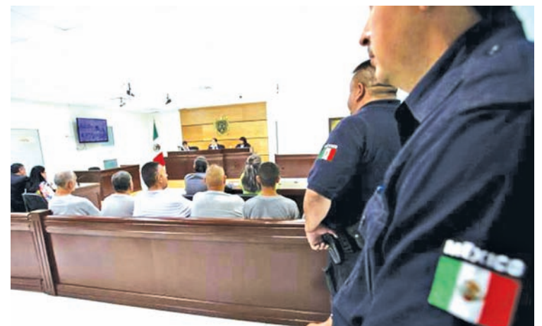
Police officers stand guard as the six men accused of the kidnapping and killing of 11 women listen to the verdict at a courtroom in the Mexican border city of Ciudad Juarez, Mexico on 27 July, 2015.

The National Citizen Femicide Observatory, a coalition of human rights groups, believes that some 3,892 women were murdered in Mexico between 2012 and 2013, but only 16 percent of cases were investigated as femicides.—Reuters