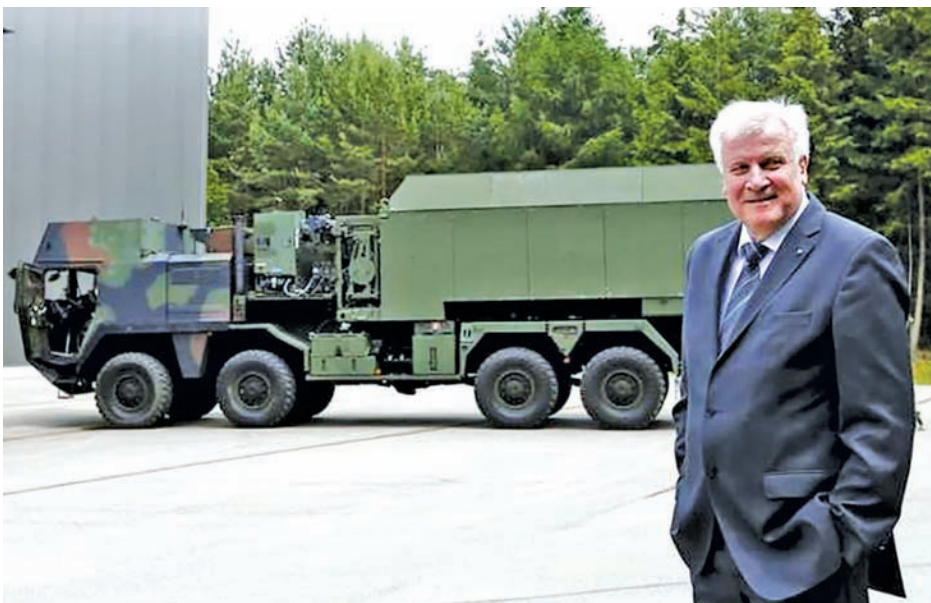
Bavarian State Premier Horst Seehofer looks on in front of the Medium Extended Air Defence System (MEADS) during a dynamical presentation at European Defence Group MBDA in Schrobenhausen near Ingolstadt, Germany on 25 June, 2015.

BERLIN, 29 July — A Greek exit from the euro zone would cause “utter chaos” but would have to be accepted if Athens was not willing to implement reforms, Chancellor Angela Merkel’s Bavarian ally Horst Seehofer told German newspaper Die Welt on Wednesday.