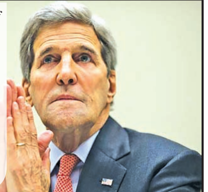
US Secretary of State John Kerry testifies before a House Foreign Affairs Committee hearing on the Iran nuclear agreement in Washington on 28 July, 2015.