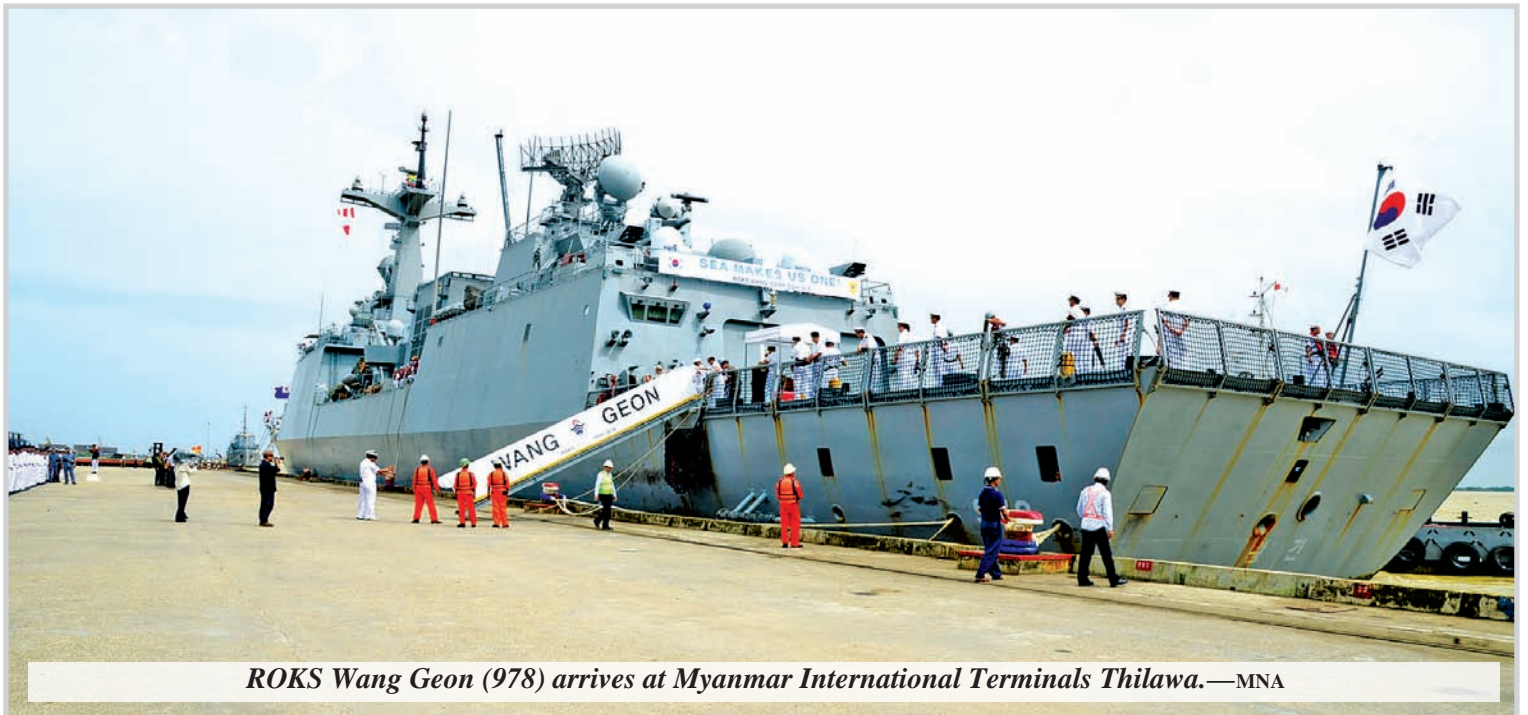
ROKS Wang Geon (978) arrives at Myanmar International Terminals Thilawa.