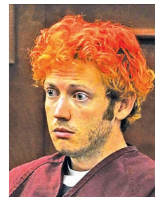
Colorado shooting suspect James Eagan Holmes

On Monday, the gunman's younger sister broke