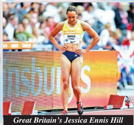
Great Britain's Jessica Ennis Hill

LONDON, 29 July — Olympic heptathlon gold medallist Jessica Ennis-Hill has announced that she is to compete in the world athletics championships in Beijing next month. “My coach and I have made the decision that I’m going to make myself available ... for the world champs,” she said on her Twitter account on Tuesday. Ennis-Hill returned to the sport in May following the birth of her son. The 29-year-old produced her three best displays since the London Olympics when she featured at the Anniversary Games in the capital at the weekend. Ennis-Hill takes her place in a 62-strong British squad for the Aug. 22-30 event in China alongside the likes of fellow Olympic champions Mo Farah and Greg Rutherford.