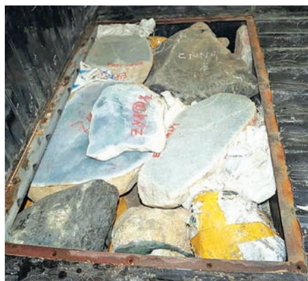
Photo shows seized jade stones.

MUSE, 29 July — Jades supposed to be trafficked were seized at a toll gate near Muse in Shan State on 22 and 23 July, officials said.