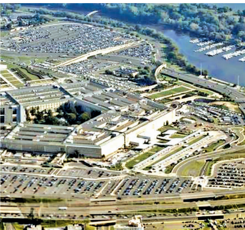
An aerial view of the Pentagon in Washington on 31 Aug, 2010.

Part of Pentagon email network taken down over suspicious activity