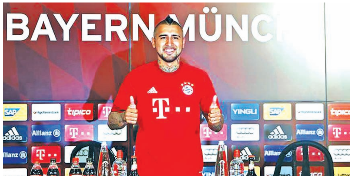
Chile's Arturo Vidal, Bayern Munich's new signing, gives thumbs up as he tries out his new jersey at the Allianz Arena in Munich, Germany 28 July, 2015. Vidal has completed his transfer from Juventus to Bayern Munich by signing a four-year contract with the Bundesliga champions.

BERLIN, 29 July — Chile midfielder Arturo Vidal has completed his transfer from Juventus to Bayern Munich by signing a four-year contract with the Bundesliga champions.