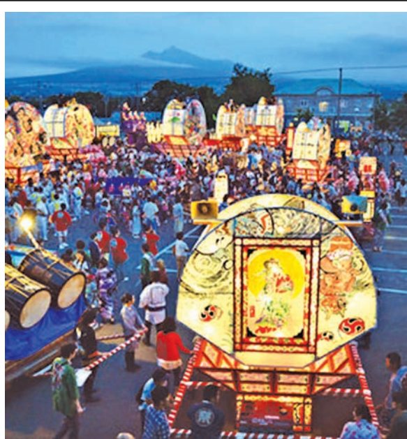
Floats with giant paper lanterns parade on July 24, 2015, on a street in Shari on the Shiretoko Peninsula jutting into the Sea of Okhotsk off Japan's northernmost main island of Hokkaido. The Shiretoko Shari Neputa festival took place amid a festive mood, celebrating the 10 th anniversary of the peninsula's designation as a UNESCO World Heritage site. —KYODO NEWS