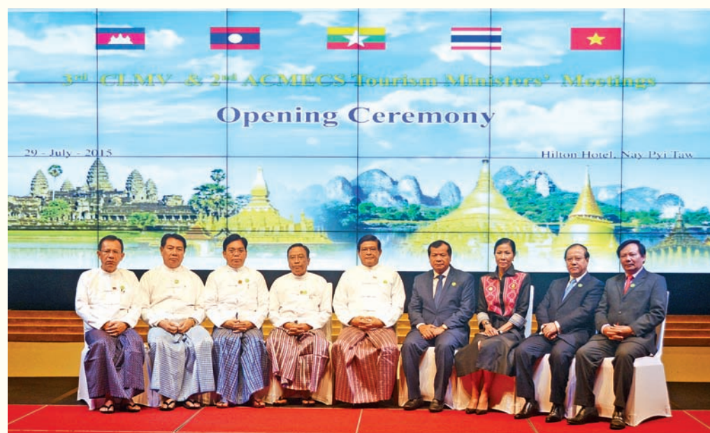
Vice President U Nyan Tun poses for documentary photo together with ministers of CLMV and ACMECS tourism ministers.

Also present at the meetings were members of the Pyithu Hluttaw Legal Affairs and Special Cases Assessment Commission and officials of Pyidaungsu Hluttaw and Pyithu Hluttaw offices.—MNA