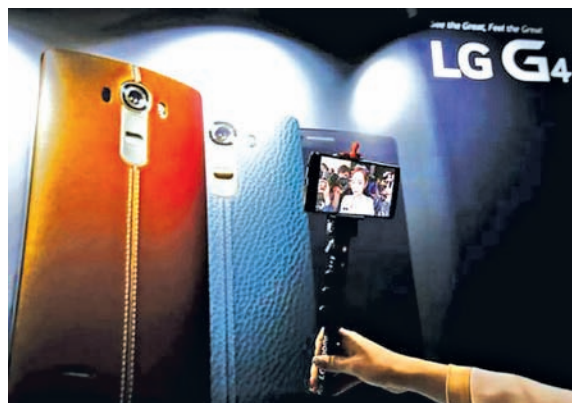
A model demonstrates LG Electronics' new smartphone G4 during its unveiling ceremony in Seoul, South Korea, on 29 April, 2015.

SEOUL, 29 July — South Korea's LG Electronics Inc (066570.KS) said on Wednesday its quarterly profit skidded 60 percent, plummeting below estimates, as sales of televisions and smartphones buckled under weaker demand and intense competition from rivals.