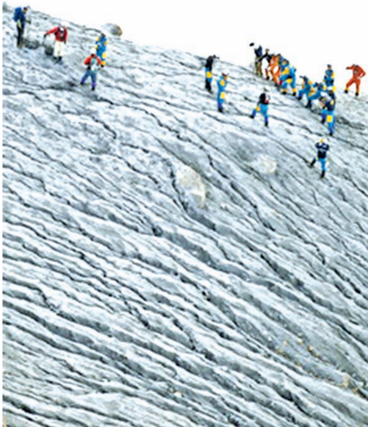
Photo taken from a Kyodo News helicopter shows search operations near the top of Mt Ontake in central Japan on 29 July, 2015, for six people who remain missing and are presumed dead after the volcano's eruption on 27 September, 2014. Aside from the six, the eruption killed 57 people.

NAGANO, (Japan), 29 July— The search resumed Wednesday in central Japan for the six people still missing on Mt Ontake, which erupted in September last year, after search operations were suspended for about nine months due to snow.